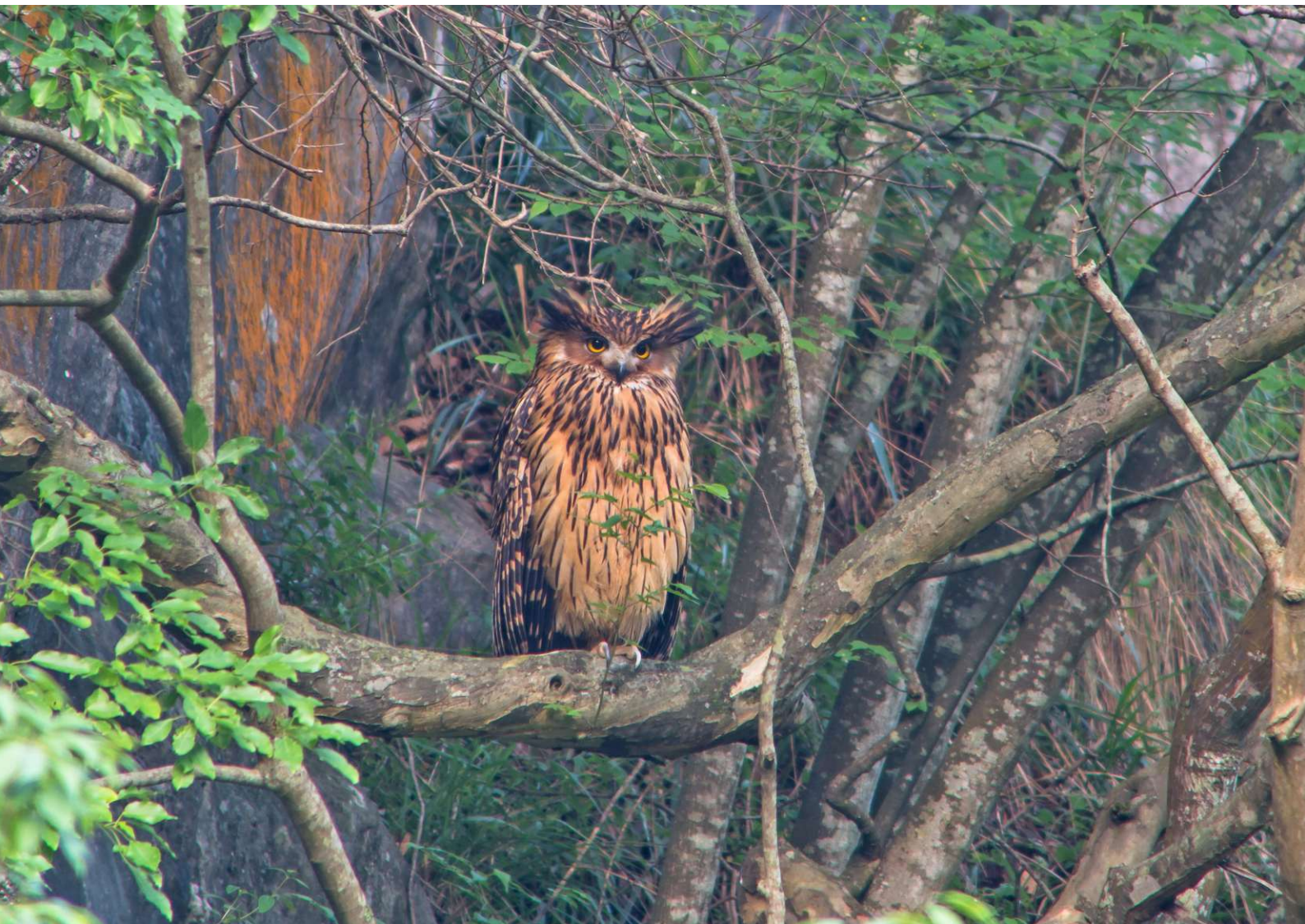
The wonderful Tawny Fish Owls at Tangjiahe ended up as our 'Bird of the Trip'