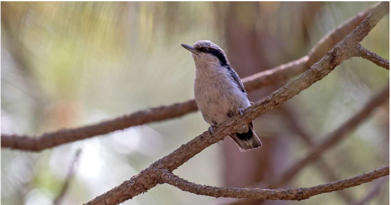
Yunnan Nuthatch near to Lijiang.

The following two mornings we made our way into some low forested hills to the east of Lijiang, where unfortunately the rare White-speckled Laughingthrush refused to appear. This rare species is severely threatened by the cagebird industry, and is becoming increasingly difficult to find sadly. That said, we did find a number of other special birds, pride of place going to a stunning male Lady Amherst's Pheasant that paraded back and forth in front of us. Other localized species included busy flocks of Black-browed Bushtits, Davison's Leaf Warblers, vocal Black-headed Sibias, smart Chinese Babaxes and skulking Rusty-capped Fulvettas and Black-streaked Scimitar-Babblers, as well as a variety of more widespread species such as a displaying Besra, a showy Large Hawk Cuckoo, Grey-backed Shrikes, Blyth's Shrike-Babbler, Bar-throated Minlas, White-browed Fulvettas, White-collared Yuhinas and colourful Mrs Gould's Sunbirds.