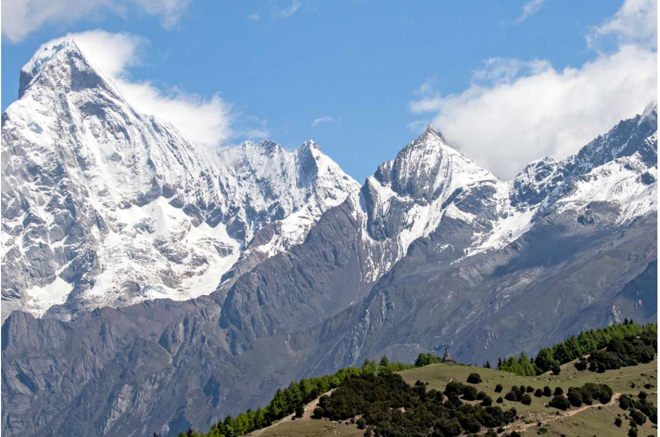
The fantastic mountains at Balangshan are home to species such as Red-fronted Rosefinch.

After our fine stay at Longcanggou, we then made our way to our final major birding destination – the wonderful Wolong and Balangshan. We had a few hitches along the way thanks to some incomprehensible Chinese bureaucracy, and ended up arriving at our hotel rather later than planned, and in three 4-WD vehicles rather than a bus!