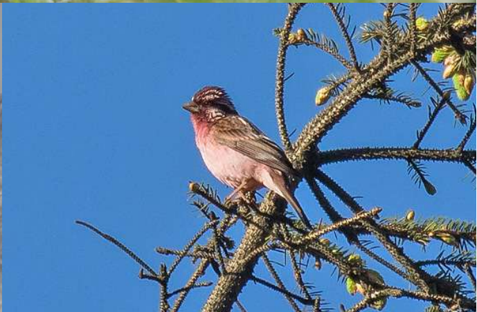
Grey-headed Bullfinch, Dark-breasted Rosefinch (above left) and the rare and endemic Sharpe's Rosefinch.