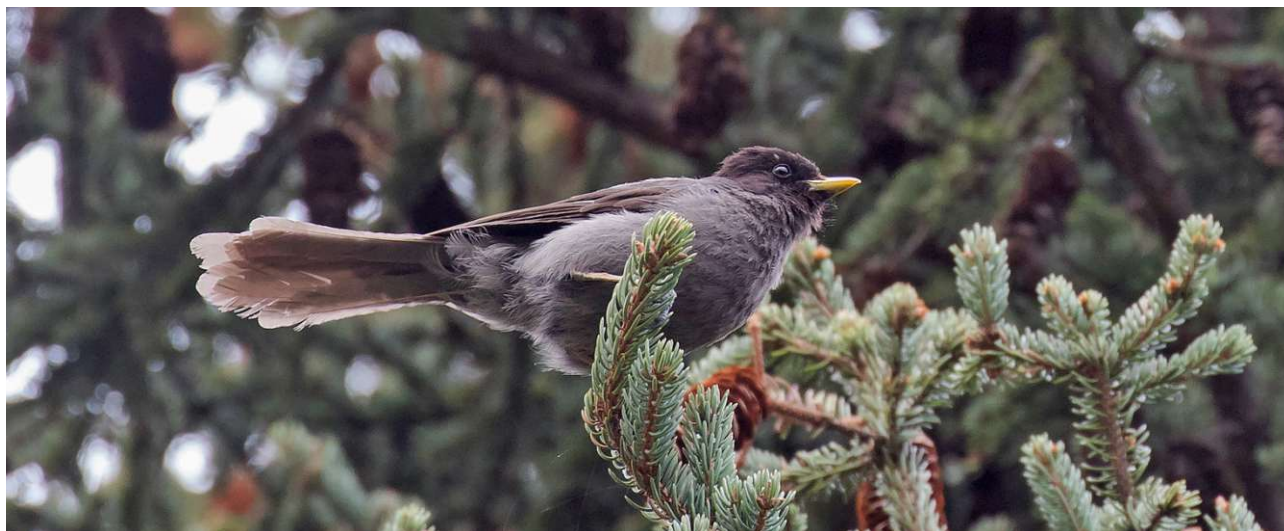
The endemic Sichuan Jay did not prove too tricky to pin down this year.

Sichuan Jay ◊ Perisoreus internigrans (VU) Great views of a flock of 4 close to Baxi.