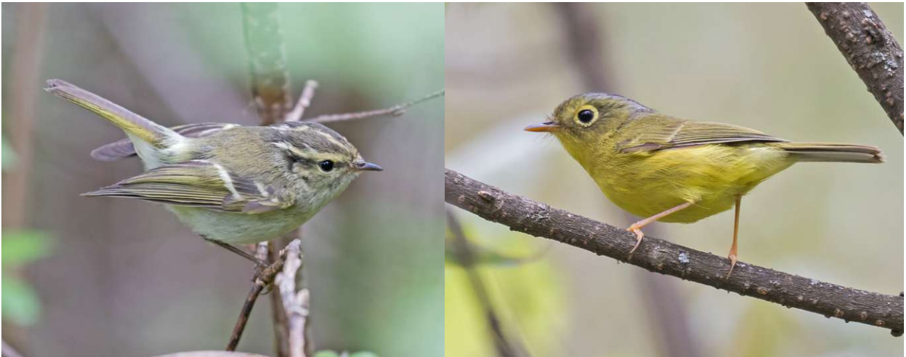
Sichuan Leaf Warbler and Bianchi's Warbler: representatives from two confusing genera!

Oriental Reed Warbler Acrocephalus orientalis One seen at Lashi Lake, Lijiang. Sichuan Bush Warbler ◇ Locustella chengi See note. Spotted Bush Warbler ◇ Locustella thoracica Excellent views of one at Jiuzhaigou; others heard there and at Balangshan. Baikal Bush Warbler ◇ Locustella davidi Brilliant views at Tangjiahe, and again at Jiuzhaigou (next to Spotted!!) [n nominate]. Brown Bush Warbler ◇ Locustella luteoventris Just one seen well at Longcanggou. Plain Prinia Prinia inornata A few seen at Lashi Lake, Lijiang [ extensicauda ]. Black-streaked Scimitar Babbler ◇ Pomatorhinus gravivox See note. Streak-breasted Scimitar Babbler Pomatorhinus ruficollis Great views at Longcanggou, and near Ya'an [ reconditus-group ]. Rufous-capped Babbler Stachyridopsis ruficeps First seen at Tangjiahe. Particularly common around Ya'an [ davidi ]. Golden-fronted Fulvetta ◇ Alcippe variegaticeps (VU) Absolutely stunning views of a superb pair near to Longcanggou. Rusty-capped Fulvetta ◇ Alcippe dubia Generally elusive but reasonably good views of one near Lijiang [ genestieri ]. Dusky Fulvetta ◇ Alcippe brunnea Excellent views of a few at Bifeng, north of Ya'an [ weigoldi ]. David's Fulvetta ◇ Alcippe davidi Seen well near to Longcanggou, and also common around Ya'an [n nominate].