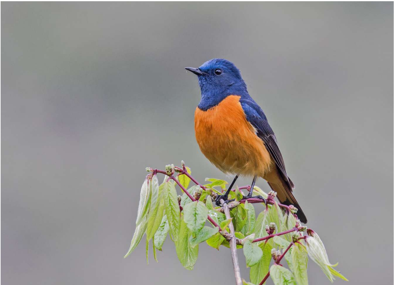
Blue-fronted Redstarts were delightfully common at some sites.