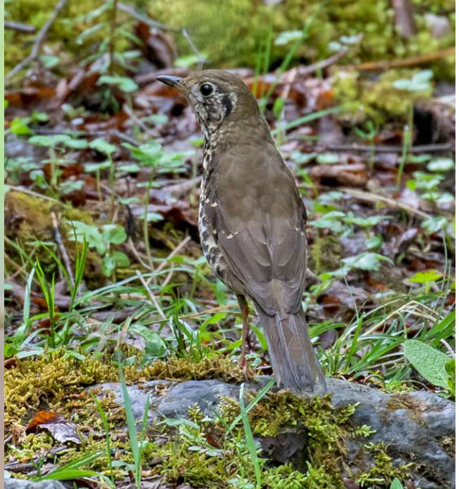
Other goodies at Jiuzhaigou included (clockwise from top) Snowy-cheeked Laughingthrush, Chinese Thrush and Spectacled Parrotbill

Leaving Jiuzhaigou behind, we made several stops as we made our way towards the Tibetan Plateau. Some sneaky Barred Laughingthrushes delayed us somewhat, but ultimately showed well to all, and other species included a fine Rufous-gorgeted Flycatcher, an impressive Northern Goshawk and a family of Chinese Nut-hatches. Heading on our next stop was fairly quiet though did yield colourful Chinese White-browed Rosefinches and Blue-fronted and White-throated Redstarts, whilst up on the plateau we enjoyed some fabulous views of Siberian Rubythroats. After another lazy-Susan lunch, we made our way through the endless open space of the Tibetan Plateau, passing numerous yak herds and camps as we went. We made an extended stop in a scrubby valley where we were entertained by species such as cracking Kessler's Thrushes, subtle White-bellied Redstarts and beautiful White-browed Tit-Warblers. By the time we made it to the County Town of Ruergai we were ready for dinner and a rest.