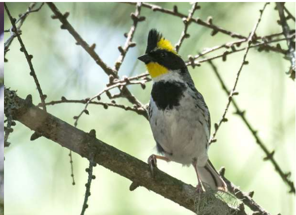
Three-banded Rosefinch, a scarce but great bird, and the amazing Yellow-throated Bunting.