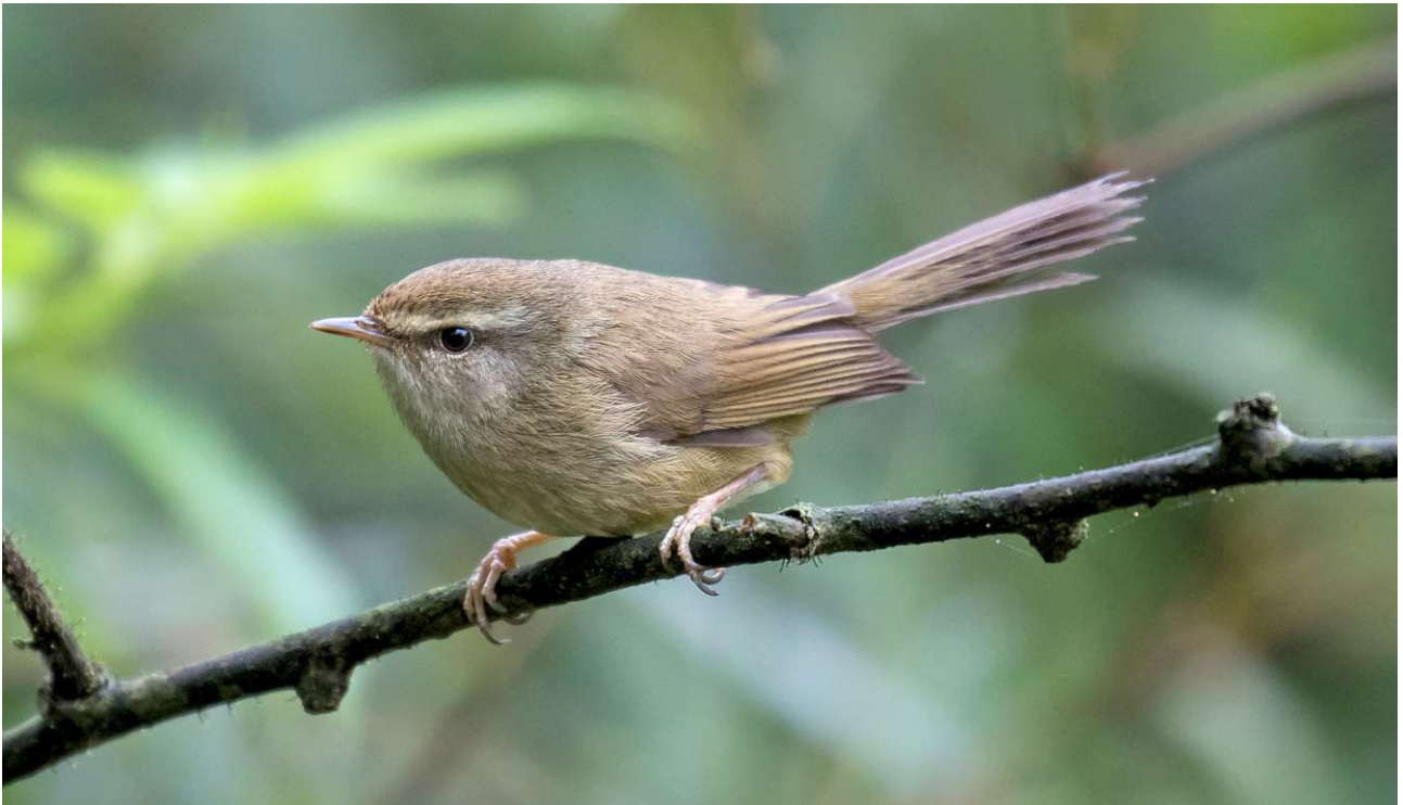
Aberrant Bush Warbler showing unusually well!!

Pygmy Wren-Babbler Pnoepyga pusilla One seen at Erlangshan. Several others heard at various sites [ pusilla ]. Rufous-faced Warbler ◇ Abroscopus albogularis First seen at Du Fu's Cottage. Several others noted [ fulvifacies ]. Brown-flanked Bush Warbler Horornis fortipes First seen near Tangjiahe. Many others heard and a few seen [ davidianus ]. Yellow-bellied Bush Warbler ◇ Horornis acanthizoides Fairly common in bamboo; first at Tangjiahe [nominate]. Aberrant Bush Warbler ◇ Horornis flavolivaceus Fairly common (by voice especially). First at Tangjiahe [ intricatus ].