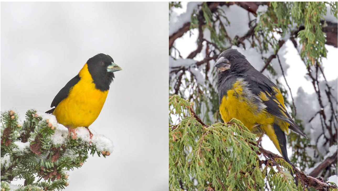
Collared Grosbeak (left) and White-winged Grosbeak both showed well at Mengbishan.