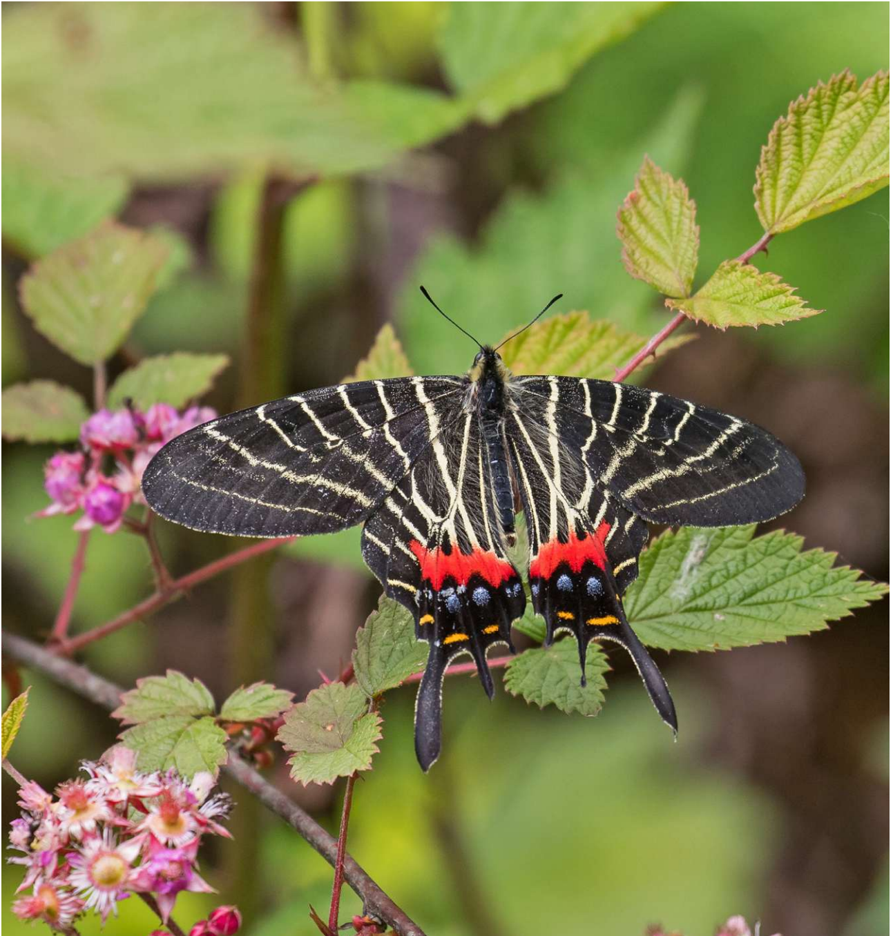
On the rare occasions there were no birds to look at, there were usually some wonderful butterflies such as this Chinese Three-tailed Swallowtail!