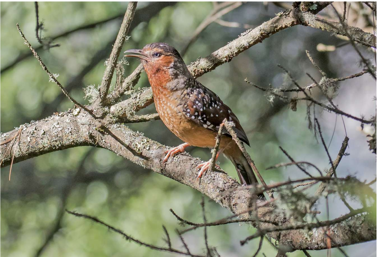
Giant Laughingthrushes were common, but always impressive!

Giant Laughingthrush ◇ Garrulax maximus Seen a number of times. First seen well in the Baxi area.