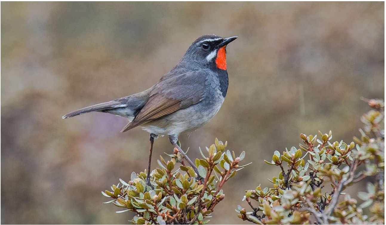
There are not too many better sights in birding than a male White-tailed Rubythroat!

find a fine male Golden Bush Robin, smart Crimson-browed Finches, Dark-breasted, Himalayan Beautiful and more Sharpe's Rosefinches, and a showy Chestnut-crowned Bush Warbler.