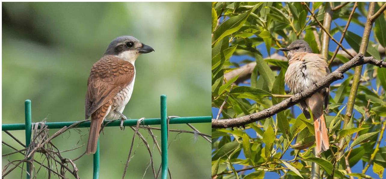
Tiger Shrike and Rosy Minivet. Two scarce and localized species.

Tiger Shrike ◊ Lanius tigrinus Great views of an assumed female at Du Fu's Cottage, and one briefly the following day.