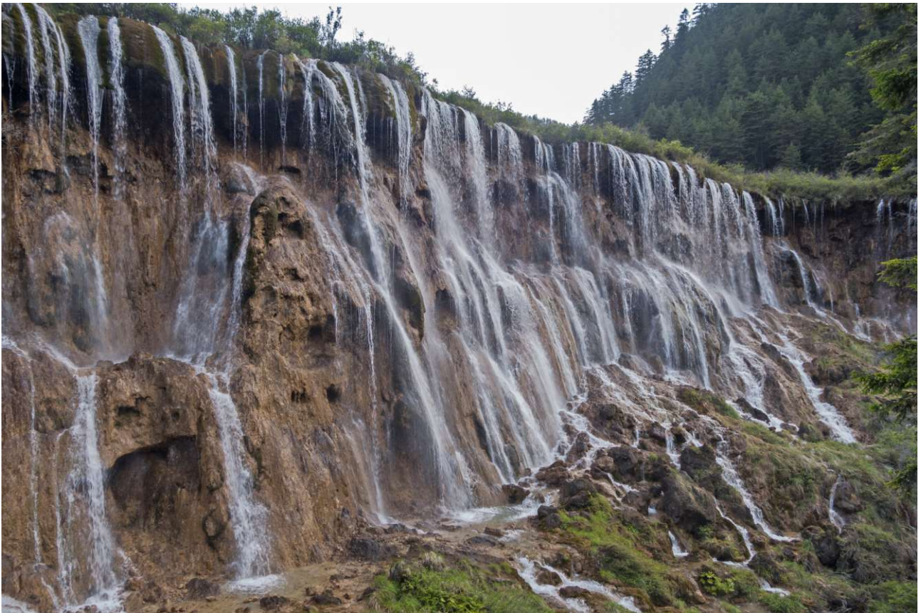
One of the many waterfalls at Jiuzhaigou!

The Jiuzhaigou Natural Reserve is understandably well known for its stunning scenery, and we were as impressed as the several thousand Chinese visitors, complete with selfie sticks, that we shared the park with. Fortunately we had our own private bus and found plenty of places to escape the crowds! Sadly, the rare Rufous-headed Robin seemed to have been late back this year, and as a result our many hours of hunting for this speciality went unrewarded. However, whilst looking we did see a number of other great birds. In the highest elevation forests we found the endemic Snowy-cheeked Laughingthrush, the attractive Three-banded Rosefinch, a showy Chinese Thrush and a cheeky couple of Yellow-throated Martens. Also here we found some Blue Eared Pheasants sharing a scrubby hillside with some Chinese Goral. Lower down, colourful Slaty-backed Flycatchers and Himalayan Bluetails were relatively common, the much-wanted Père David's Tits put