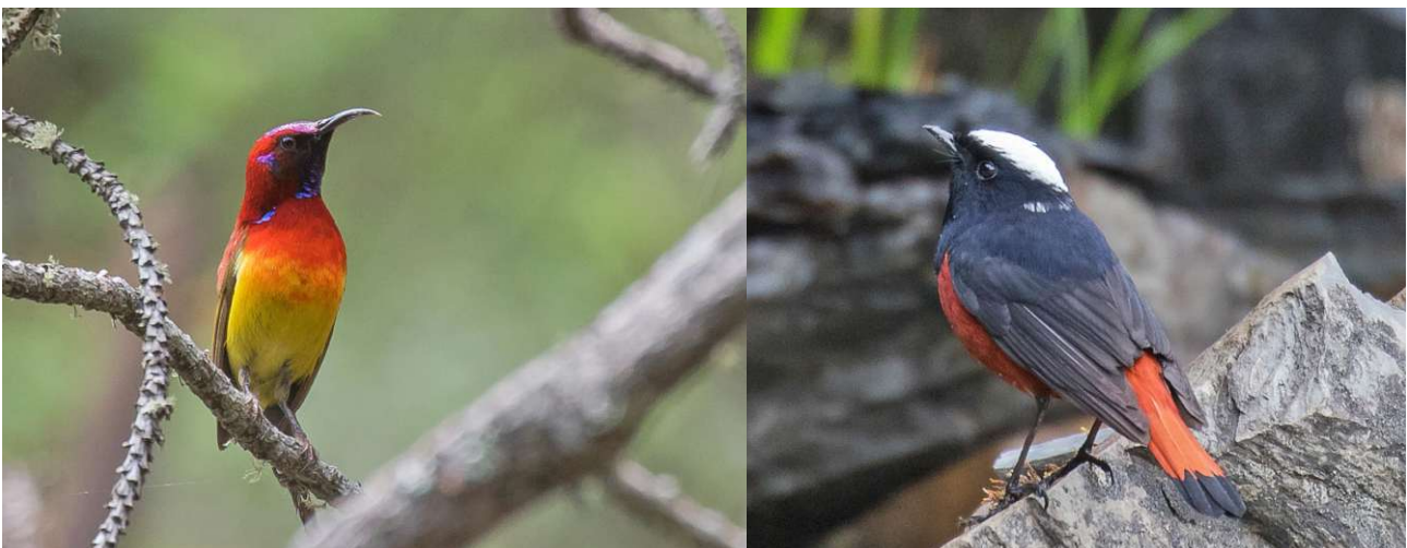
Mrs Gould's Sunbird and White-capped Redstart provided a splash of colour!

One seen at Shuguncun (First bend of the Yangtze) was not identified to form. In Sichuan, first seen at Jiuzhaigou, and seen elsewhere, especially around the Balangshan tunnel where quite common. The form involved is obscuratus which is quite grey-crowned.