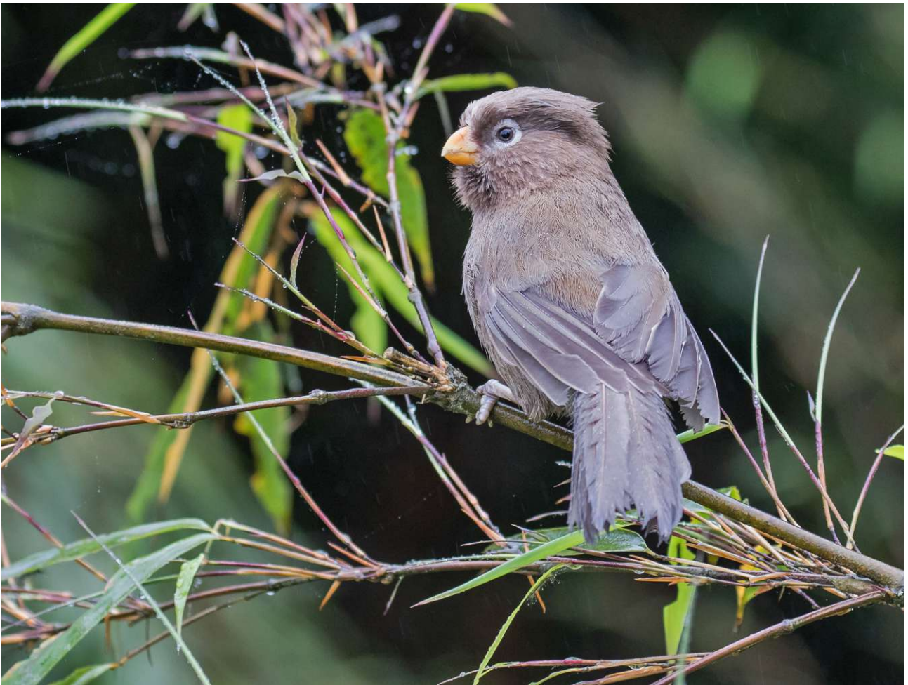
Three-toed Parrotbill (above) and Grey-hooded Parrotbill were two of the stars at Longcangou.