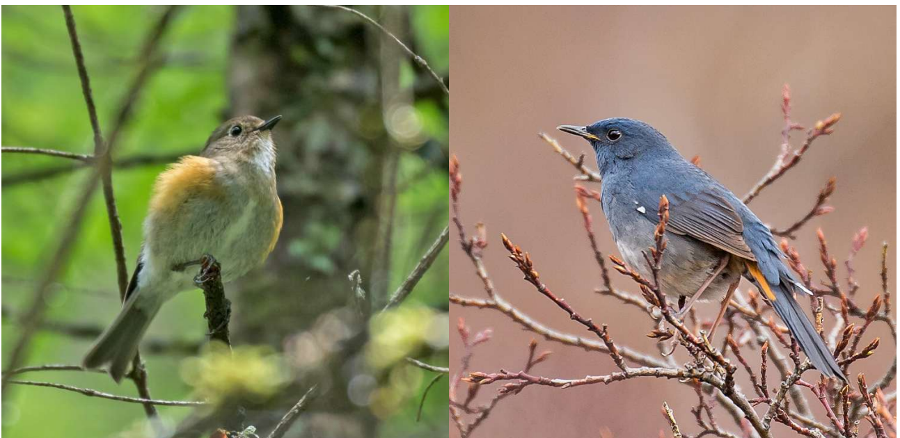
There were plenty of good 'chats' on show, including Himalayan Bluetail and White-bellied Redstart.