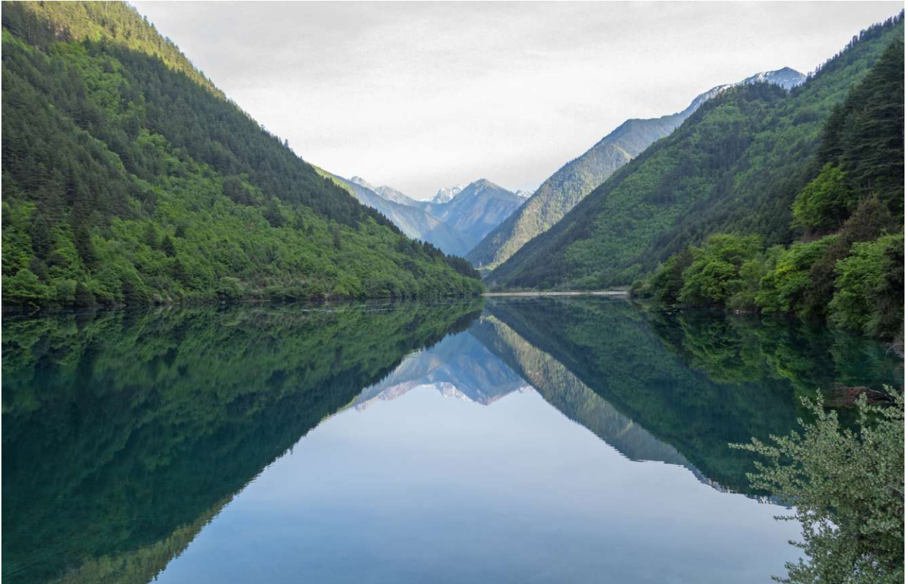
The scenery at Jiuzhaigou really is quite magnificent!

After our productive stay at Tangjiahe, we made our way over impressive mountain passes to the tourist haven of Jiuzhaigou, our base for the next three nights. Stops en route produced little other than our first Chestnut Thrushes and Yellow-streaked Warblers.