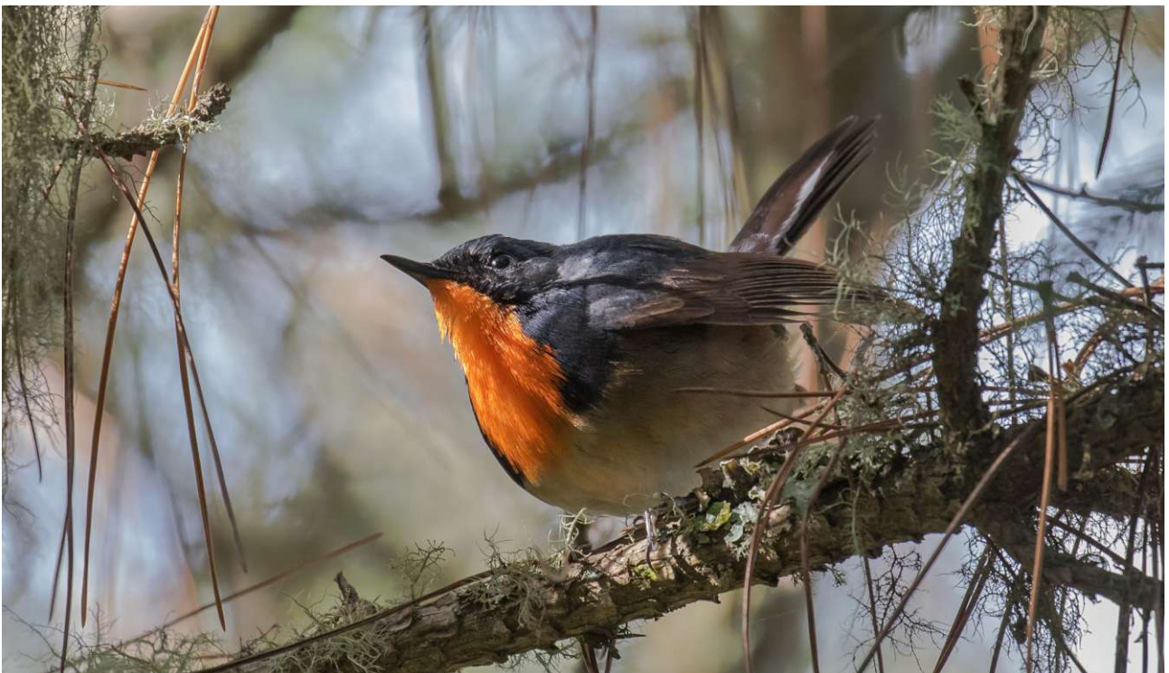
Firethroats did not disappoint!

The following day and a half was spent exploring the lower slopes of Erlangshan. Here, abundant Spotted Nutcrackers seemed to be everywhere, and several Lady Amherst's Pheasants plodded along the roadside like skinny chickens! Our first real stop almost immediately yielded one of our targets as smart Sharpe's Rosefinches showed very well alongside numerous Vinaceous Rosefinches and a singing Chinese Babax. A little lower and a tell-tale song alerted us to our next target. An orange throat glowed in the undergrowth, and we stood in awe as a gorgeous male Firethroat enthralled us all. Giant Laughingthrushes entertained at the same spot and a little lower we found another male Firethroat, several Yellow-throated Buntings, Chestnut-flanked White-eyes, a flock of Black-browed Bushtits and a surprise in the form of a Black-bibbed Tit, a rarely recorded species in Sichuan. We were also pleased to see more Rufous-tailed Babblers and a male White-tailed Robin. In an area of wetter forest, we were delighted to find an obliging Chinese Wren-Babbler, a species that can be tough to see well, as well as Himalayan Cuckoo, delightful Little Forktails and showy Emei Leaf Warblers.