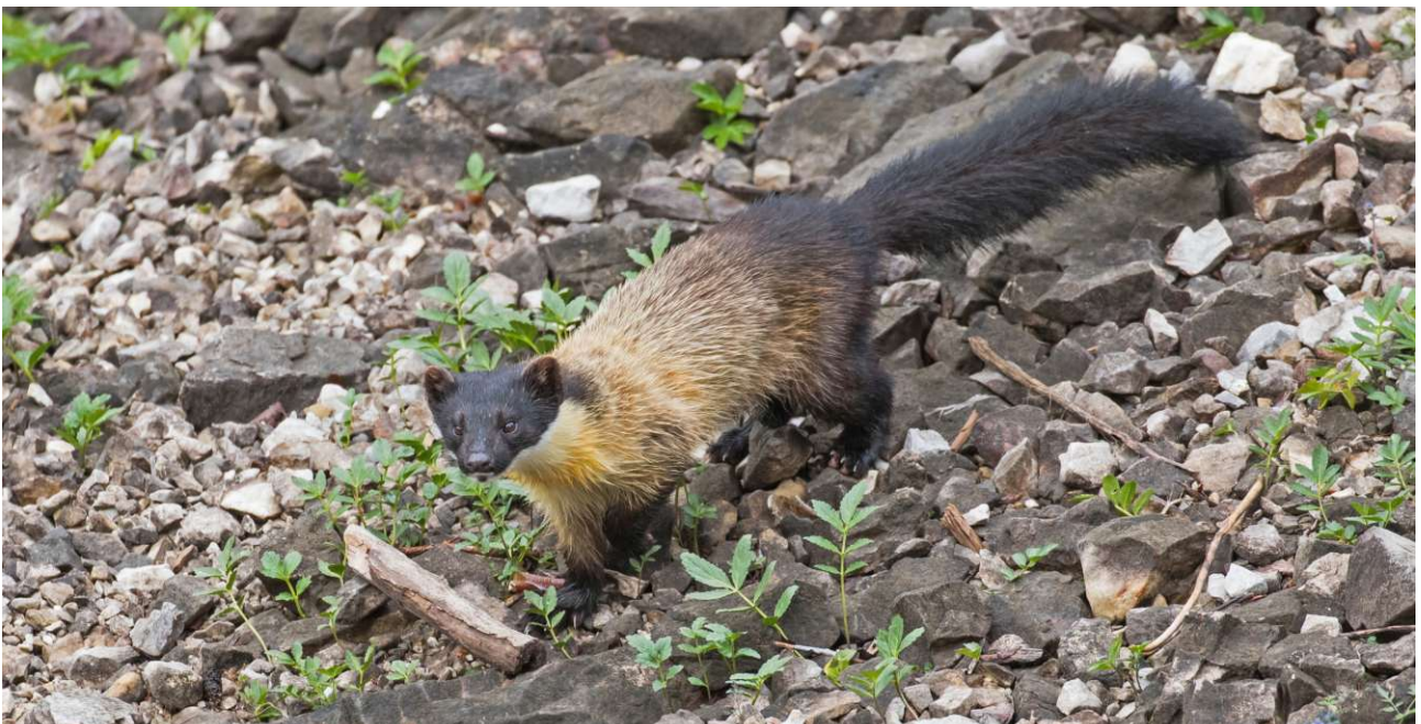
A couple of cheeky Yellow-throated Martens were much appreciated at Jiuzhaigou!

The Jiuzhaigou Natural Reserve is understandably well known for its stunning scenery, and we were as impressed as the several thousand Chinese visitors, complete with selfie sticks, that we shared the park with. Fortunately we had our own private bus and found plenty of places to escape the crowds! Sadly, the rare Rufous-headed Robin seemed to have been late back this year, and as a result our many hours of hunting for this speciality went unrewarded. However, whilst looking we did see a number of other great birds. In the highest elevation forests we found the endemic Snowy-cheeked Laughingthrush, the attractive Three-banded Rosefinch, a showy Chinese Thrush and a cheeky couple of Yellow-throated Martens. Also here we found some Blue Eared Pheasants sharing a scrubby hillside with some Chinese Goral. Lower down, colourful Slaty-backed Flycatchers and Himalayan Bluetails were relatively common, the much-wanted Père David's Tits put