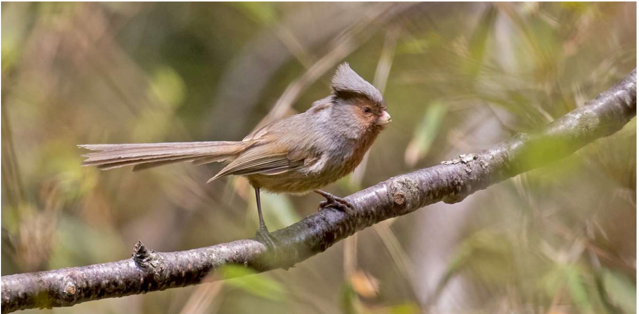
Rusty-throated (or Przevalski's) Parrotbill required a bit of a hike!

Those that could face it also had the opportunity to climb higher to look for the rare Rusty-throated (or Przevalski's) Parrotbill. This proved to be a tough walk, though we were successful, bagging great views of a pair of this attractive rarity. Also at higher altitude we noted our first Temminck's Tragopan (a colourful but brief male), the localized Sichuan Treecreeper and a number of other goodies such as confiding Chestnut-headed Tesias,