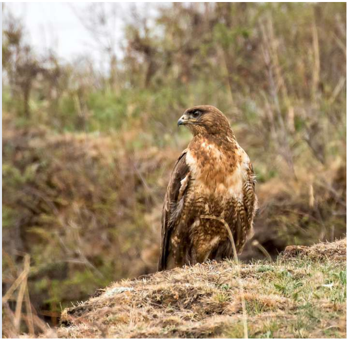
Lammergeier and Upland Buzzard were both seen very well.