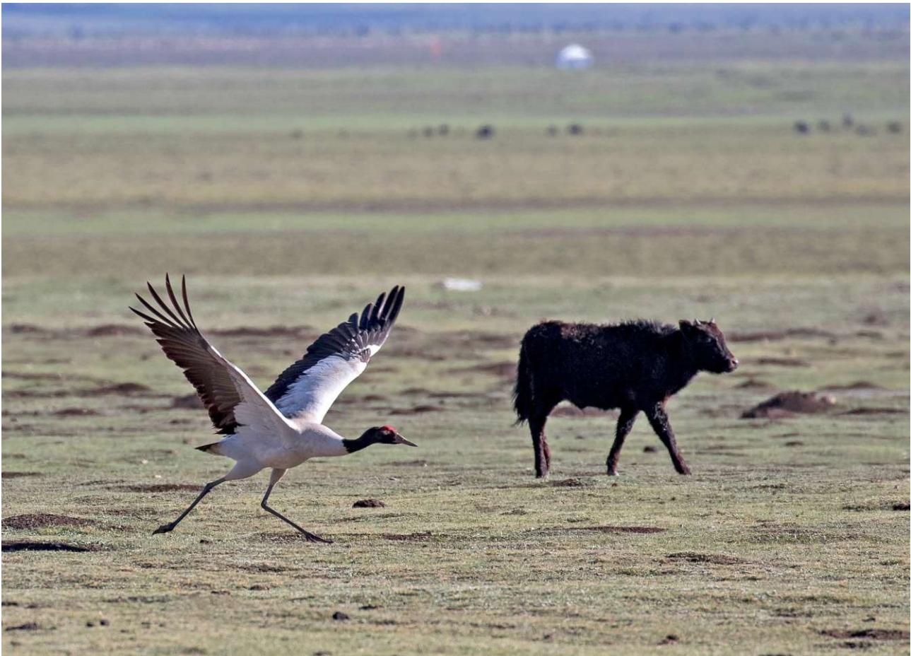
Black-necked Crane and Yak at Ruergai.

heavily on these much desired families. Other special mentions should go to rarities such as Père David's Owl, Streaked Barwing and Golden-fronted Fulvetta, all of which showed well, and we were also delighted to find the spectacular Przevalski's Finch and even an unexpected Ibisbill! Old favourites such as Black-necked Crane, Chinese Grouse and Firethroat all performed well, and we were also fortunate to spend some quality time with a stunning pair of Tawny Fish Owls, our eventual bird of the trip. We also gazed at the wondrous scenery around Lijiang, Balangshan and the incredible Jiuzhaigou, enjoyed the wide-open space of the Tibetan Plateau and saw a number of interesting mammals including the impressive Tarkin, Chinese Serow, cheeky Yellow-throated Martens and even a Leopard Cat. All in all, it was a pretty amazing adventure!