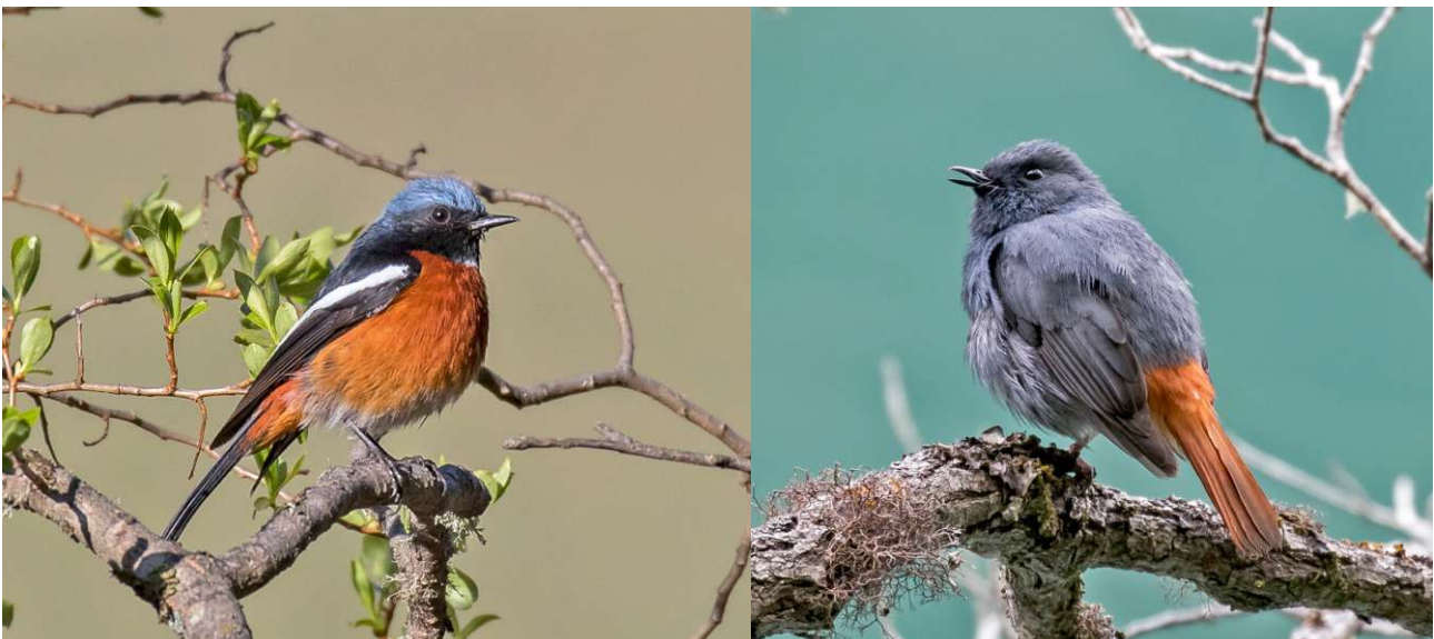
Two more delightful redstarts: White-throated Redstart and Plumbeous Redstart.

White-capped Redstart (River Chat) Phoenicurus leucocephalus Common and widespread. First seen at Tangjiahe. Blue Rock Thrush Monticola solitarius Just a couple seen on journeys, the first on the way to Tangjiahe [ pandoo ]. Siberian Stonechat Saxicola maurus Seen at a few upland sites and around Lijiang [ przewalskii ]. Pied Bush Chat Saxicola caprata (NL) One identified during a journey in Yunnan. Grey Bush Chat Saxicola ferreus A few seen, the first on the way in to Tangjiahe. White-throated Dipper Cinclus cinclus A few seen, best views in Jiuzhaigou [ przewalskii ]. Brown Dipper Cinclus pallasii First seen on the way to Tangjiahe and very common there [ przewalskii ]. Yellow-bellied Flowerpecker ◊ Dicaeum melanoxanthum A male seen well at the 'First bend of the Yangtze'. A write-in! Fire-breasted Flowerpecker Dicaeum ignipectus Common at sites around Lijiang [nominate]. Mrs. Gould's Sunbird Aethopyga gouldiae Common at several sites. An attractive species, first seen in Yunnan [ dabryii ]. Russet Sparrow Passer rutilans Common. First seen at Shuguncun (First bend of the Yangtze) [ intensior ]. Eurasian Tree Sparrow Passer montanus Common and widespread [ tibetanus ]. Rock Sparrow Petronia petronia Common at several spots between Ruoergai and Hongyuan [ brevirostris ]. Tibetan Snowfinch ◊ (Adam's/Black-winged S) Montifringilla adamsi (NL) Seen by some near Ruoergai. White-rumped Snowfinch ◊ Onychostruthus taczanowskii Plenty seen well around Zoer Daba, north of Ruoergai.