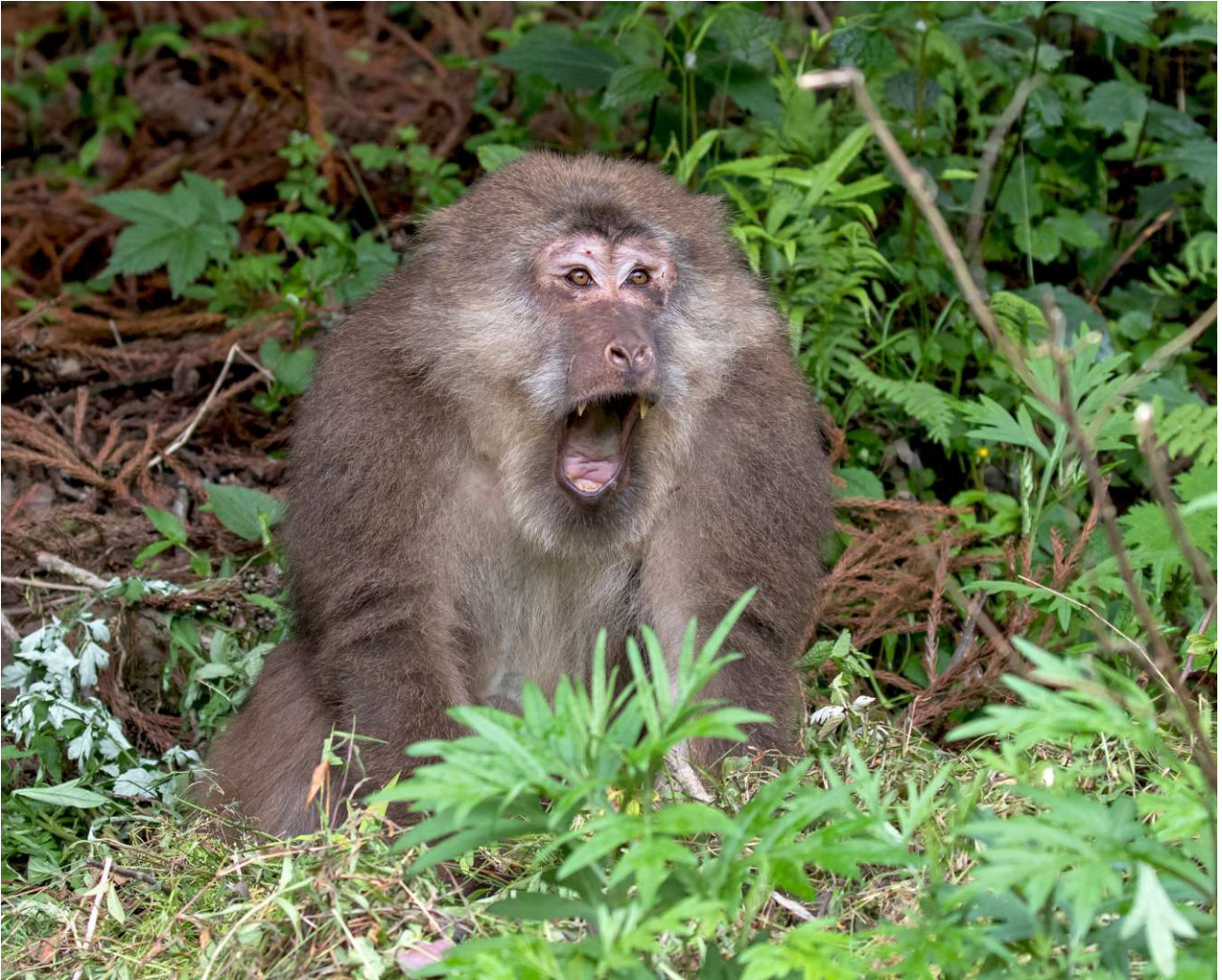
Best not to get too close to the Père David's Macaques at Tangjiahe!!