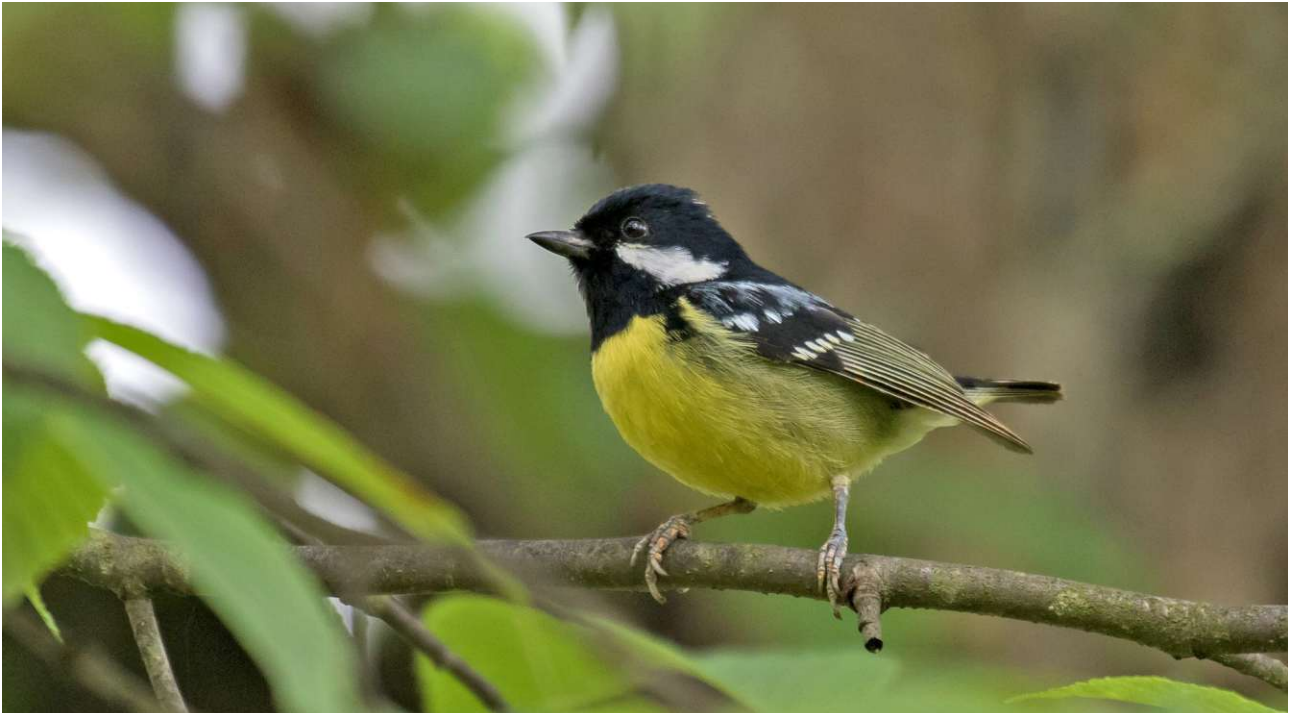
The lovely Yellow-bellied Tit - always great to see!

Oriental Crow ◇ Corvus [corone] orientalis First seen at Jiuzhaigou and several at higher altitudes further north. Large-billed Crow Corvus macrorhynchos Common, first seen near Lijiang [ tibetosinensis ]. Northern Raven Corvus corax A few on the Tibetan Plateau where first seen near to Ruorgai [ tibetanus ]. Grey-headed Canary-Flycatcher Culicicapa ceylonensis Fairly common - first seen at Black Dragon Park [ calochrysea ]. Fire-capped Tit ◇ Cephalopyrus flammiceps Seen very well at Tangjiahe, Erlangshan and Longcanggou [ olivaceus ]. Yellow-browed Tit ◇ Sylviparus modestus Also seen very well at Tangjiahe, Erlangshan and Longcanggou [nominated]. Rufous-vented Tit Periparus rubidiventris Seen at several sites, first at Jiuzhaigou [ whistleri ]. Coal Tit Periparus ater First seen at Tangjiahe and common at a few sites. Crested here [ eckodedicatus ]. Yellow-bellied Tit ◇ Pardaliparus venustulus First seen at Tangjiahe; a lovely little bird.