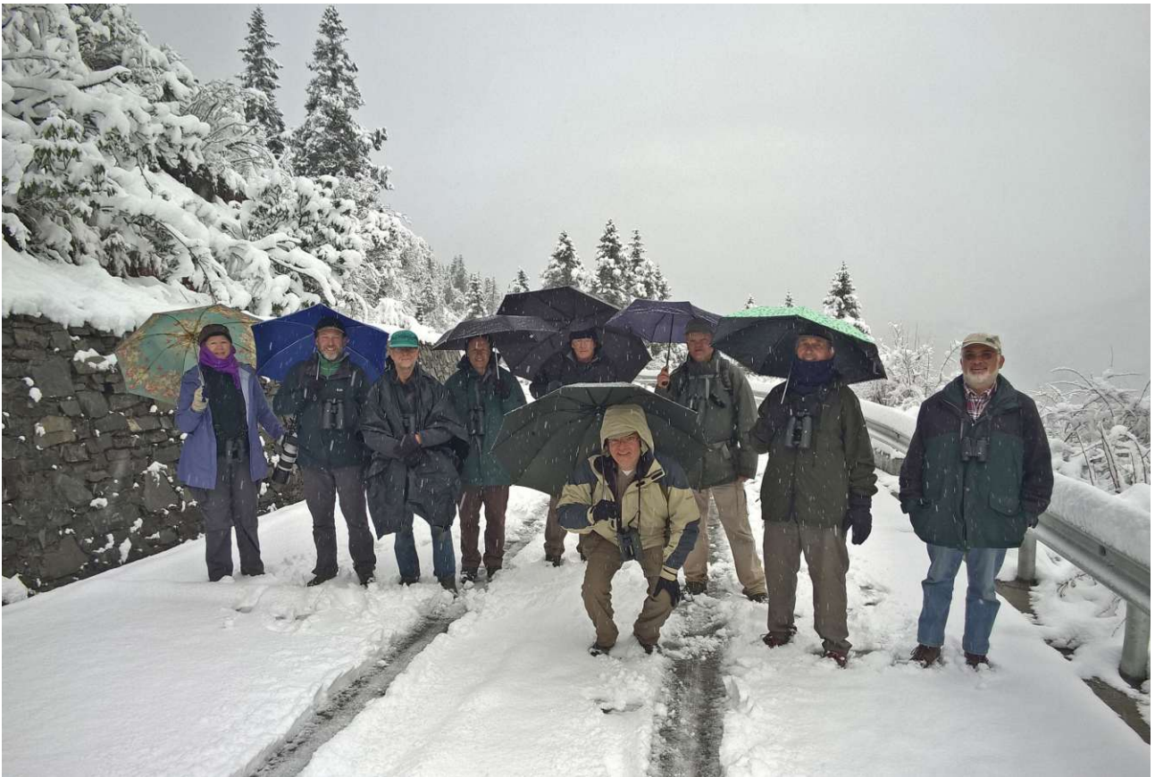
The group enjoying the snow on Mengbisha!

transported into a winter wonderland! As cars skidded and slid, our bus ground to a halt and we could go no further. Fortunately this was no life-threatening situation! There was a mildness to the air, and it was clear the snow would soon melt, so we set off birding along the road. It was strangely quiet though, and I think many of the birds must have been forced down slope by the snow. We did enjoy a fine variety of rosetinches including more Three-banded Rosefinches and our first Pink-rumped and Streaked Rosefinches, and found a couple of smart Collared Grosbeaks. It was pretty quiet generally though, and once the roads became clear again, we set off on our way. The rest of the day is best forgotten, as it ended up being a long and rather tedious drive to Luding County thanks to the ongoing road construction.