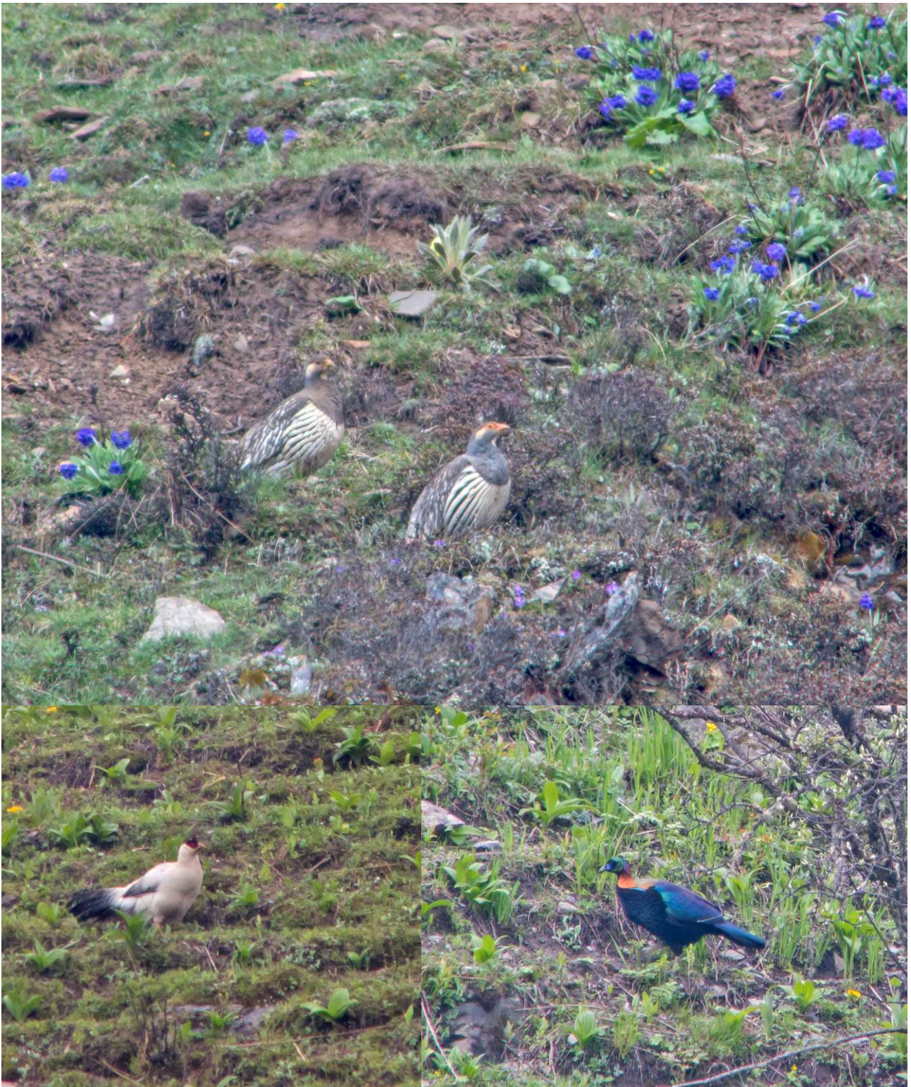
Gamebirds at Balangshan included Tibetan Snowcock, Chinese Monal and White Eared Pheasant.

For the next three days, we largely concentrated on the higher zones. Here one is surrounded by some of the most amazing mountain scenery one will see anywhere. Gamebirds were high on our target list, and we were not disappointed. Great views of simply stunning Chinese Monals was perhaps the highlight, but the supporting cast wasn't bad! White-eared Pheasants were scoped from the same spot, as was an entertaining Hog Badger, both Snow Partridge and Tibetan Snowcock were scoped on the high peaks, Koklass Pheasants called and were flushed out of cover, and both Blood Pheasant and Lady Amherst's Pheasant were seen again. On the highest slopes, Alpine and Red-billed Choughs mixed with dazzling Grandalas, stunning Red-fronted Rosefinches, Alpine Accentors, and Plain and Brandt's Mountain Finches. Lammergeiers, drifted overhead, Snow Pigeons circled the valleys and we got some more amazing views of Wallcreepers. In the low scrub, stunning White-tailed Rubythroats sang their hearts out, and in forested areas we were delighted to