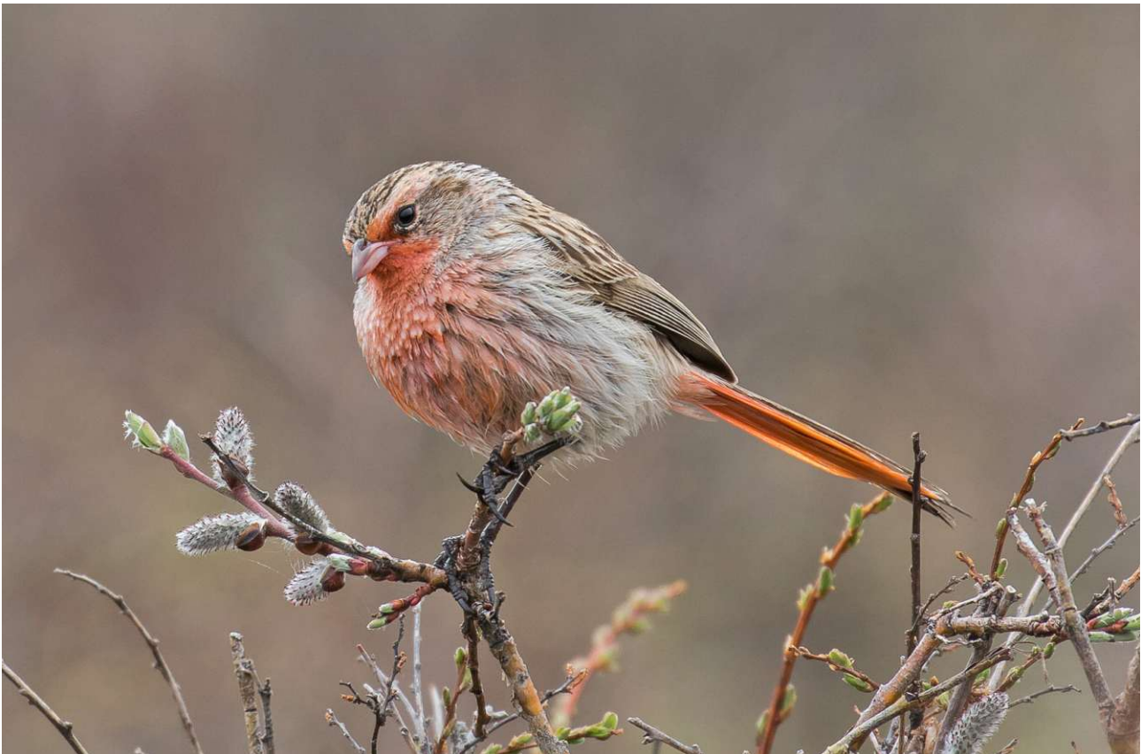
Przevalski's Finch, now in a family of its own, and an undoubted highlight of the tour!