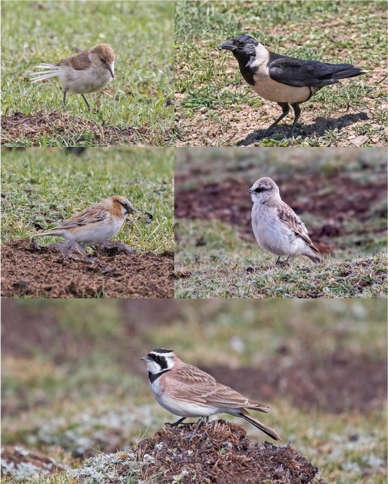
Birds of the Plateau, clockwise from top left: Ground Tit; Daurian Jackdaw; White-rumped Snowfinch; Horned Lark and Rufous-necked Snowfinch.

Daurian Jackdaw ◊ Coloeus dauuricus Several seen well in the Ruoergai area.