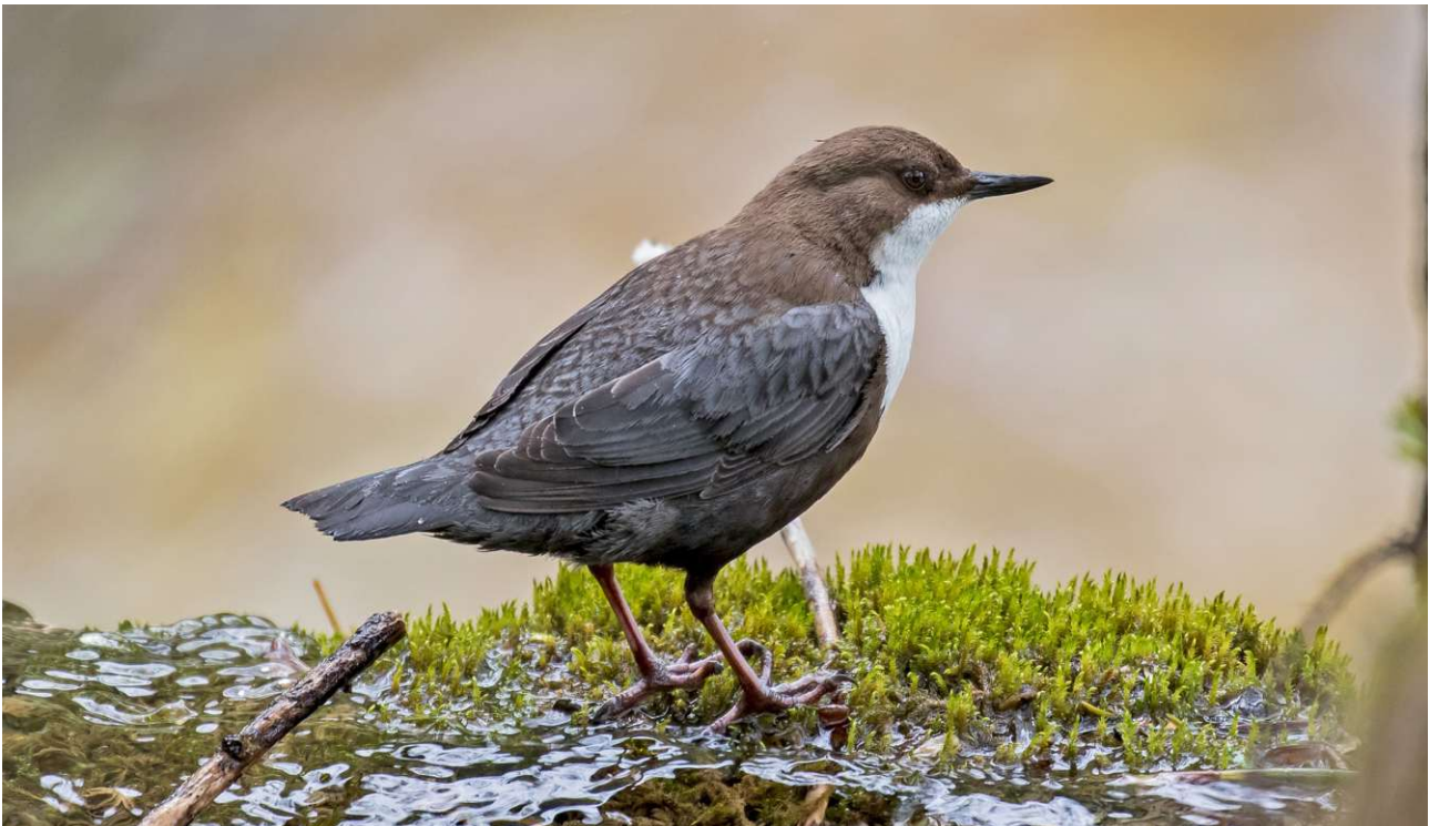
White-throated Dippers were extremely confiding at Jiuzhaigou Nature Reserve.