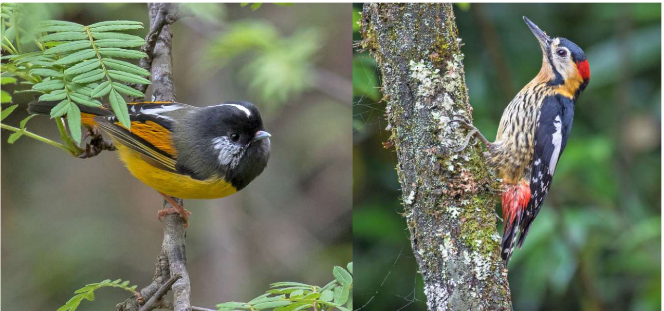
Golden-breasted Fulvetta and Darjeeling Woodpecker were both much-appreciated at Longcanggou.

a half days spent in the area proved extremely productive. We had a number of tricky targets, most of which obliged. Grey-hooded (or Zappey's), Three-toed and Golden Parrotbills were three of the undoubted favourites, not least because they showed so well in their dense bamboo habitats! The recently described Sichuan Bush Warbler, Brown Bush Warbler, Emei Shan Liocichlas and a gorgeous Red-winged Laughingthrush were teased into view, a Plain-backed Thrush sang its heart out in the scope, and other interesting species included Grey-faced Buzzard, smart Darjeeling Woodpeckers, the local form of White-browed Shortwing, Aberrant and Yellow-bellied Bush Warblers, Ferruginous Flycatchers, and smart Red-tailed Minlas. At a nearby forest patch Temminck's Tragopans and a pair of Silver Pheasants tantalized us along the road, a Great Barbet and White-backed Woodpeckers posed, a Chinese Blue Flycatcher delighted us with its song and gaudy plumage, and an amazing and rare Golden-fronted Fulvetta showed brilliantly at close range. By the accommodation, a flock of