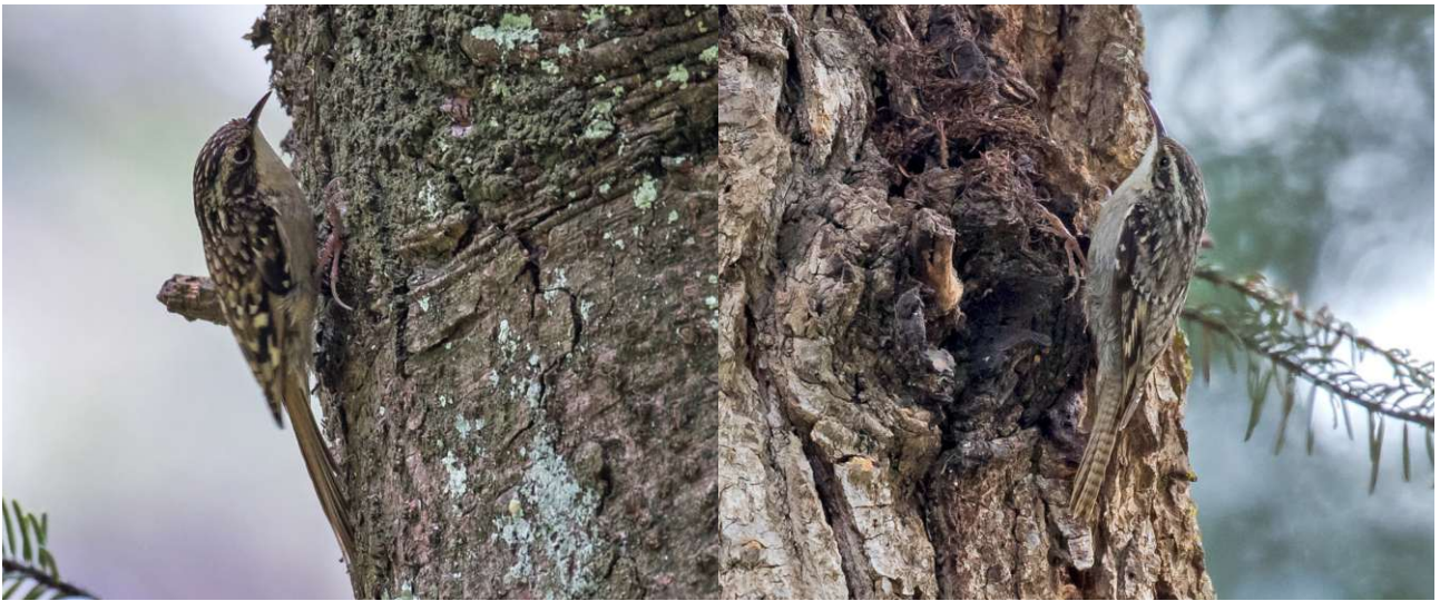
The subtlety of treecreepers! Sichuan Treecreeper (left) and Bar-tailed Treecreeper.