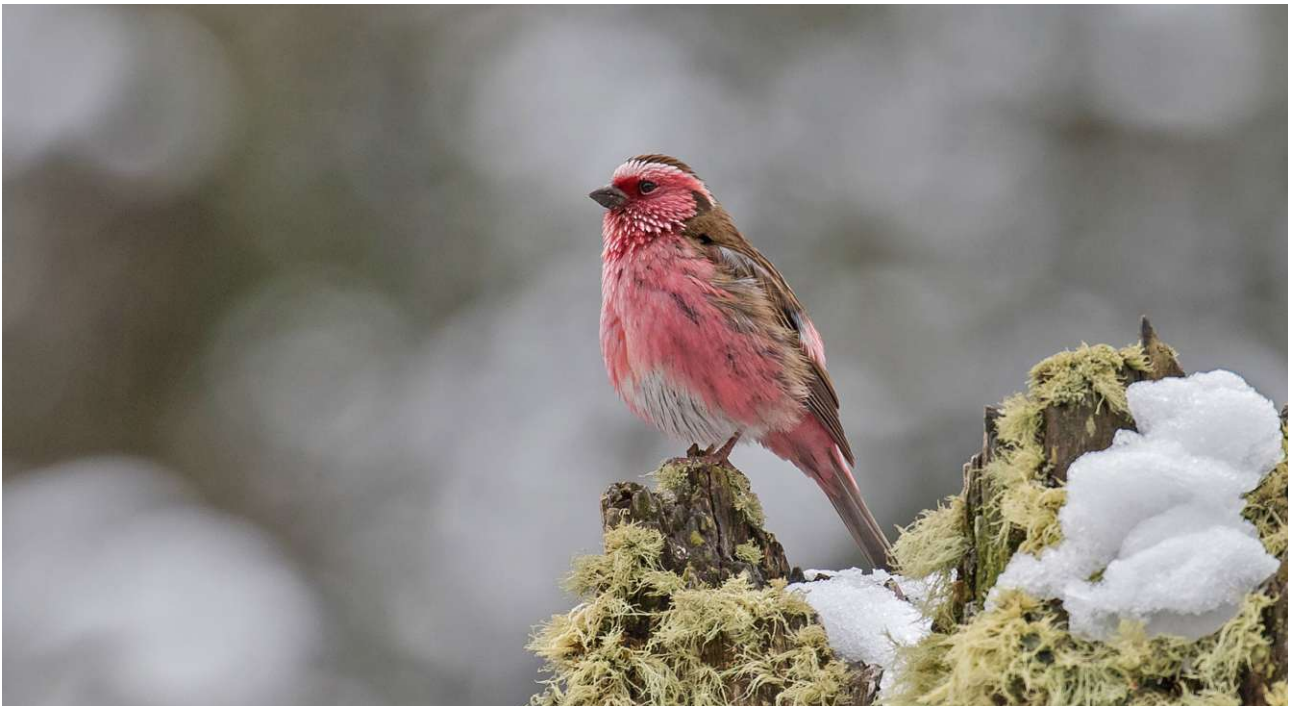
Chinese White-browed Rosefinch - a common but attractive species.

The following day and a half was spent exploring the lower slopes of Erlangshan. Here, abundant Spotted Nutcrackers seemed to be everywhere, and several Lady Amherst's Pheasants plodded along the roadside like skinny chickens! Our first real stop almost immediately yielded one of our targets as smart Sharpe's Rosefinches showed very well alongside numerous Vinaceous Rosefinches and a singing Chinese Babax. A little lower and a tell-tale song alerted us to our next target. An orange throat glowed in the undergrowth, and we stood in awe as a gorgeous male Firethroat enthralled us all. Giant Laughingthrushes entertained at the same spot and a little lower we found another male Firethroat, several Yellow-throated Buntings, Chestnut-flanked White-eyes, a flock of Black-browed Bushtits and a surprise in the form of a Black-bibbed Tit, a rarely recorded species in Sichuan. We were also pleased to see more Rufous-tailed Babblers and a male White-tailed Robin. In an area of wetter forest, we were delighted to find an obliging Chinese Wren-Babbler, a species that can be tough to see well, as well as Himalayan Cuckoo, delightful Little Forktails and showy Emei Leaf Warblers.