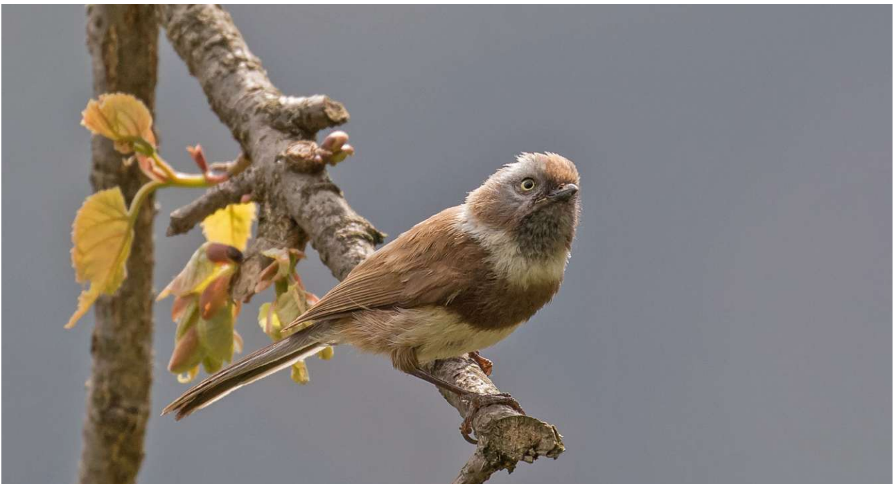
Sooty Bushtit was seen very well on several occasions.

Chestnut-crowned Bush Warbler ◇ Cettia major Excellent views of at Balangshan. Smart [ intricatus ]. Chestnut-headed Tesia ◇ Cettia castaneocoronata First seen very well at Tangjiahe. Also seen at Longcanggou [nominate]. Black-throated Bushtit Aegithalos concinnus First seen in Yunnan and then many more seen [ talifuensis ]. Black-browed Bushtit ◇ Aegithalos bonvaloti A few smart flocks seen very well near Lijiang and at Erlangshan [nominate]. Sooty Bushtit ◇ Aegithalos fuliginosus Only seen at Tangjiahe where seen very well and in good numbers.