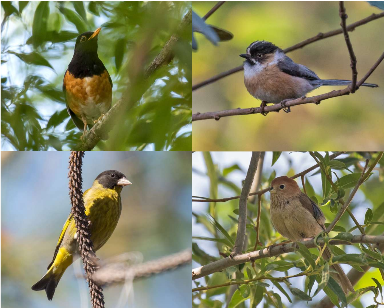
Other highlights around Lijiang included (clockwise from top left) Black-breasted Thrush , Black-browed Bushtit , Brown-winged Parrotbill and Black-headed Greenfinch .

We also made a visit to a lake just outside Lijiang. Here, a variety of common waterfowl were joined by an unexpected Pheasant-tailed Jacana and a pair of lovely nominate Citrine Wagtails. Nearby Black-faced Buntings entertained, Pale Martins hawked for insects and a smart Black-winged Kite hunted the adjacent fields.