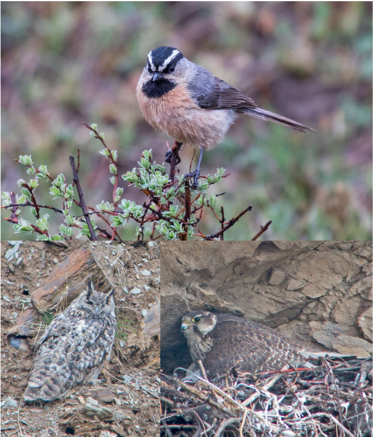
The Tibetan Plateau hosted some great birds including White-browed Tit, Eurasian Eagle Owl and Saker Falcon

got better as at the next stop we were able to study the simply superb Przevalski's Finch as well as Tibetan (Chinese) Grey Shrike and Robin Accentor, and an intricately marked Tibetan Partridge showed wonderfully in the scope. Along the roadside we admired boldly marked Twite, Rock Sparrows, Azure-winged Magpies and black-backed calcarata Citrine Wagtails, and also stopped to admire several Saker Falcons (including one on a nest) and a cryptic Eurasian Eagle Owl at its day time roost. Further on, we scoured a river where we were delighted to find an Ibisbill, poking around a dead Yak, and our final stop of the day again proved successful as we found a fine Przevalski's Nuthatch and enjoyed more good views of Chinese Grouse!