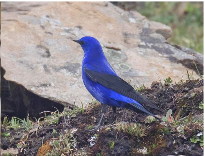
Two more stunners! Golden Bush Robin and the unique Grandala!