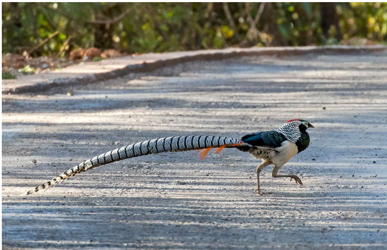
The spectacular Lady Amherst's Pheasant first showed well near to Lijiang.

Snow Partridge ◇ Lerwa lerwa Good scope views of 3 just below Balangshan Pass. Verreaux's Monal-Partridge ◇ Tetraophasis obscurus Great views of a pair in the forest near to Baxi. Heard elsewhere. Tibetan Snowcock ◇ Tetraogallus tibetanus Great scope views of a pair below Balangshan Pass [ henrici ]. Tibetan Partridge ◇ Perdix hodgsoniae 3 west of Ruergai, including great scope views. Also a pair at Balangshan [ sifanica ]. Chinese Bamboo Partridge ◇ Bambusicola thoracicus Heard at a few sites, and seen by some at Longcanggou. Blood Pheasant ◇ Ithaginis cruentus First seen near to Baxi. A few others seen with best views at Balangshan [ berezowskii ]. Temminck's Tragopan ◇ Tragopan temminckii See note. Koklass Pheasant ◇ Pucrasia macrolopha Two seen near the tunnel at Balangshan and others heard there [ ruficollis ]. Chinese Monal ◇ Lophophorus lhuysii (VU) Several seen very well near the tunnel at Balangshan. Silver Pheasant ◇ Lophura nycthemera A pair and then a male on the track near Longcanggou [ omeiensis ]. White Eared Pheasant ◇ Crossoptilon crossoptilon (NT) Great scope views of 5+ below Balangshan. Blue Eared Pheasant Crossoptilon auritum Good scope views of 4 at Jiuzhaigou and another near to Baxi. Common Pheasant (Ring-necked P) Phasianus colchicus See note. Golden Pheasant ◇ Chrysolophus pictus Great views of this stunner at Tangjiahe, and a few others heard. Lady Amherst's Pheasant ◇ Chrysolophus amherstiae Stunner! See note.