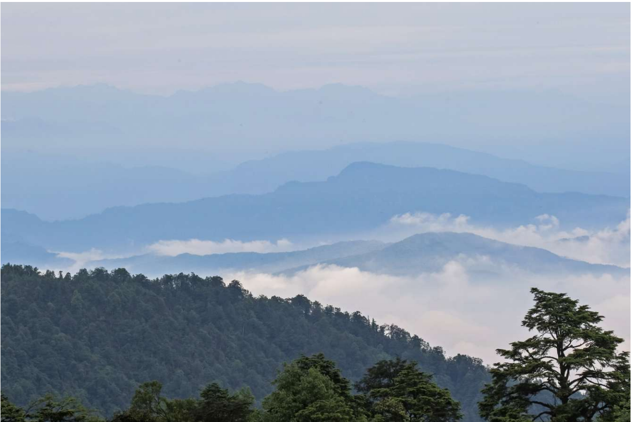
Early morning looking over the rolling hills from Longcanggou.

a half days spent in the area proved extremely productive. We had a number of tricky targets, most of which obliged. Grey-hooded (or Zappey's), Three-toed and Golden Parrotbills were three of the undoubted favourites, not least because they showed so well in their dense bamboo habitats! The recently described Sichuan Bush Warbler, Brown Bush Warbler, Emei Shan Liocichlas and a gorgeous Red-winged Laughingthrush were teased into view, a Plain-backed Thrush sang its heart out in the scope, and other interesting species included Grey-faced Buzzard, smart Darjeeling Woodpeckers, the local form of White-browed Shortwing, Aberrant and Yellow-bellied Bush Warblers, Ferruginous Flycatchers, and smart Red-tailed Minlas. At a nearby forest patch Temminck's Tragopans and a pair of Silver Pheasants tantalized us along the road, a Great Barbet and White-backed Woodpeckers posed, a Chinese Blue Flycatcher delighted us with its song and gaudy plumage, and an amazing and rare Golden-fronted Fulvetta showed brilliantly at close range. By the accommodation, a flock of