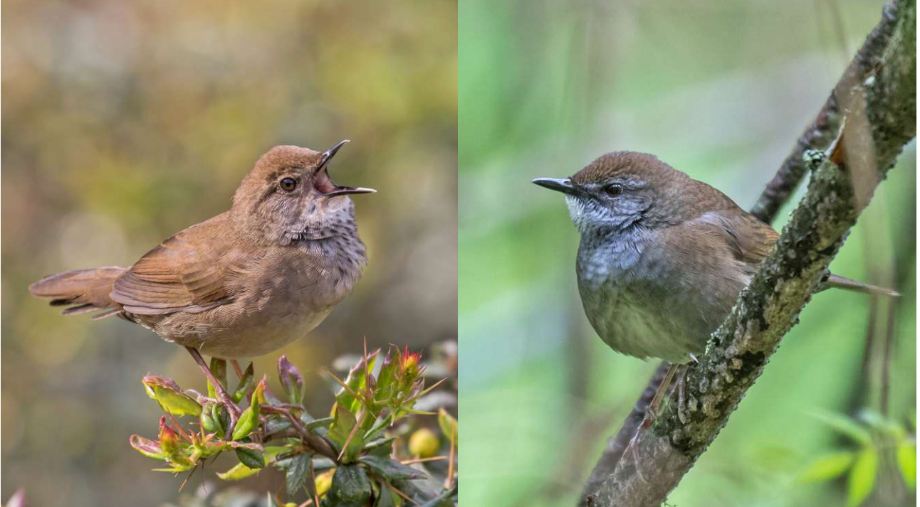
Baikal (above left) and Spotted Bush Warblers were found side-by-side at Jiuzhaigou, where Père David's Tit was another favourite.

in several appearances as did Tibetan Siskins, and the mixed flocks included other goodies such as Crimson-breasted Woodpecker, Grey-crested and Rufous-vented Tits and Bar-tailed and Hodgson's Treecreepers. We also noted our first Slaty-blue Flycatchers, White-throated Dippers and Grey-headed Bullfinches. At the lowest elevations we were delighted to find a flock of confiding Spectacled Parrotbills and an Indian Blue Robin which finally showed well, whilst flocks of Salim Ali's Swifts wheeled over the lakes and a migrant Blyth's Pipit entertained. Also in the park were a bewildering variety of Phylloscopus warblers, and we found time to get to grips with Alpine Leaf, Buff-barred, Chinese Leaf, Hume's Leaf, Greenish, Large-billed Leaf, and Sichuan Leaf Warblers as well as numerous Bianchi's Warblers. Without their distinctive vocalizations, this group really would be tough!! Also of interest was seeing the recently recognized Baikal Bush Warbler belting out its song a mere few yards from the near-identical Spotted Bush Warbler. Quite an experience!