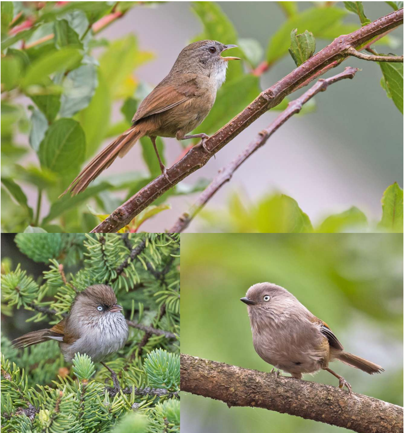
Rufous-tailed Babbler (or Moupinia) showed well on two occasions. Chinese (left) and Grey-hooded Fulvettas were also much admired!

Rufous-tailed Babbler ◇ (R-t Moupinia) Moupinia poecilotis See note.