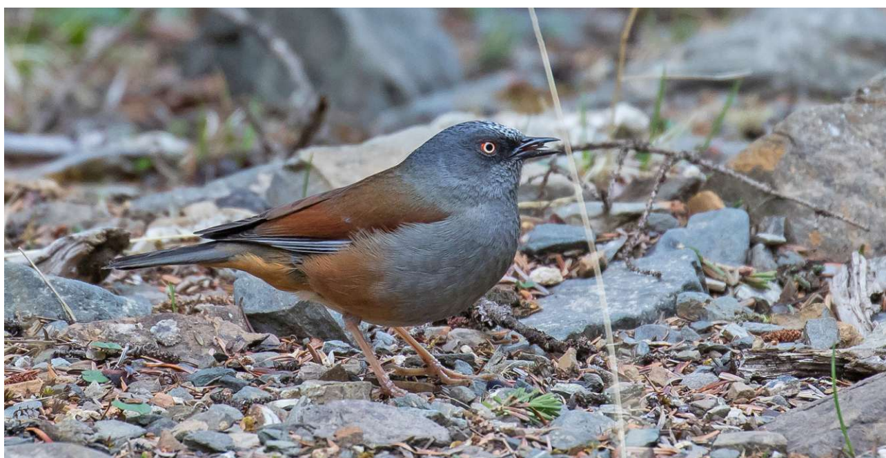
Maroon-backed Accentor was another crowd pleaser.

We enjoyed great views of a pair of the nominate subspecies (grey-backed) at Lashi Lake, Lijiang. On the Tibetan Plateau we saw several black-backed birds. The form concerned, calcarata , is sometimes referred to as Tibetan Wagtail.