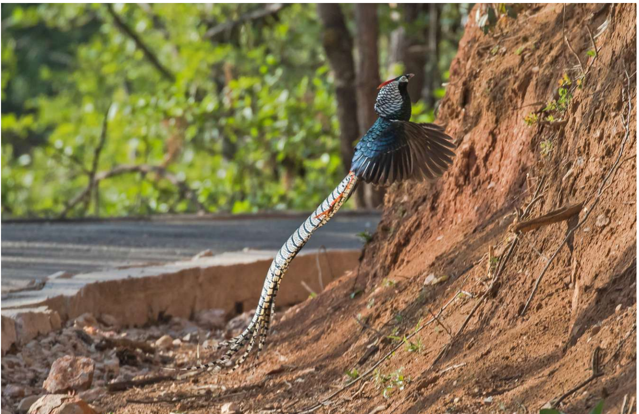
A fine male Lady Amherst's Pheasant near to Lijiang

The following two mornings we made our way into some low forested hills to the east of Lijiang, where unfortunately the rare White-speckled Laughingthrush refused to appear. This rare species is severely threatened by the cagebird industry, and is becoming increasingly difficult to find sadly. That said, we did find a number of other special birds, pride of place going to a stunning male Lady Amherst's Pheasant that paraded back and forth in front of us. Other localized species included busy flocks of Black-browed Bushtits, Davison's Leaf Warblers, vocal Black-headed Sibias, smart Chinese Babaxes and skulking Rusty-capped Fulvettas and Black-streaked Scimitar-Babblers, as well as a variety of more widespread species such as a displaying Besra, a showy Large Hawk Cuckoo, Grey-backed Shrikes, Blyth's Shrike-Babbler, Bar-throated Minlas, White-browed Fulvettas, White-collared Yuhinas and colourful Mrs Gould's Sunbirds.