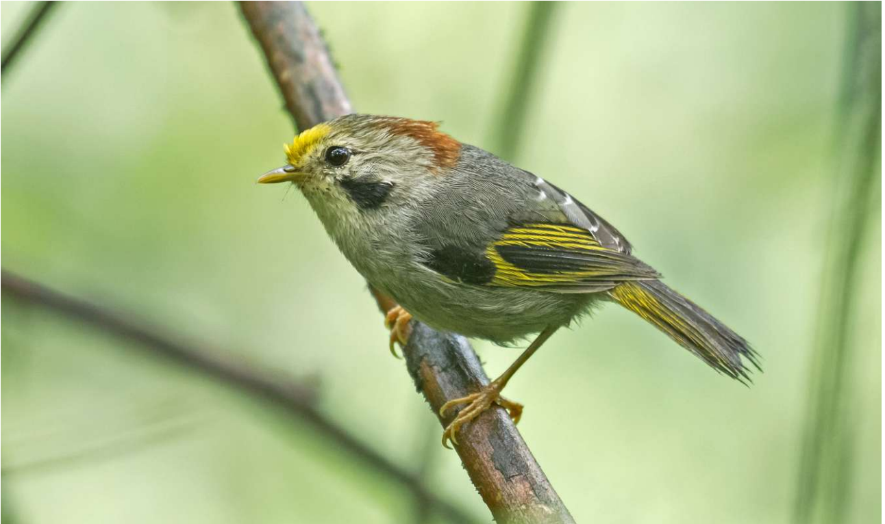
Golden-fronted Fulvetta: another stunner that has seldom been seen on previous tours!

Chinese Babax ◇ Babax lanceolatus Two forms noted: nominate near Lijiang; bonvaloti seen well at Erlangshan.