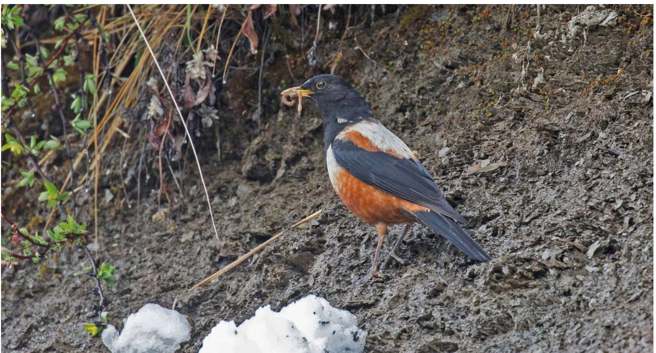
Kessler's Thrush: a common but eye-catching species of the highlands.

transported into a winter wonderland! As cars skidded and slid, our bus ground to a halt and we could go no further. Fortunately this was no life-threatening situation! There was a mildness to the air, and it was clear the snow would soon melt, so we set off birding along the road. It was strangely quiet though, and I think many of the birds must have been forced down slope by the snow. We did enjoy a fine variety of rosetinches including more Three-banded Rosefinches and our first Pink-rumped and Streaked Rosefinches, and found a couple of smart Collared Grosbeaks. It was pretty quiet generally though, and once the roads became clear again, we set off on our way. The rest of the day is best forgotten, as it ended up being a long and rather tedious drive to Luding County thanks to the ongoing road construction.