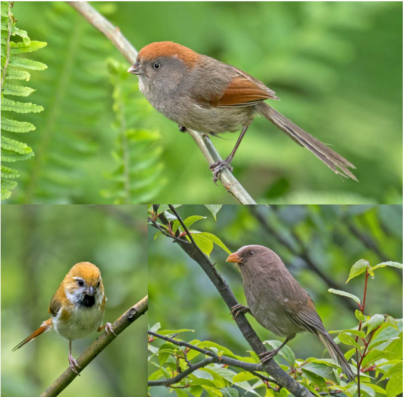
Parrotbills always excite: Pictured here, clockwise from top: Ashy-throated, Great and Golden Parrotbills.