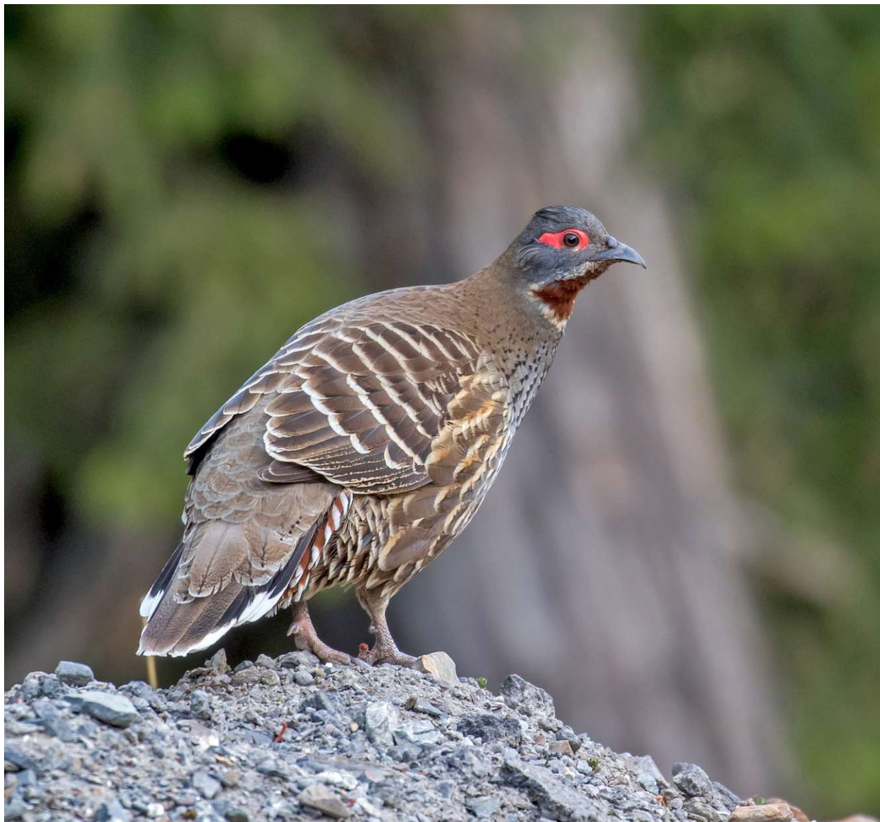
Verreaux's Monal Partridges showed exceptionally well this year...

pair of Verreaux's Monal Partridges parading in front of us, but things then got tough. A calling Père David's Owl led us a merry dance for some time, but eventually we tracked down this shy individual, which then allowed great scope views for a prolonged period. Also here were our first good views of Blood Pheasants, smart Maroon-backed Accentors, a surprise pair of Blanford's Rosefinches feeding along a stream, perky Chinese Fulvettas, White-winged Grosbeaks, Crested Tit-Warblers for some, and the usual array of Phylloscopus warblers. We also saw more fine Blue Eared Pheasants. Nearby, we also managed to add a hulking Black Woodpecker, a neat flock of Sichuan Jays, a very obliging Chinese Grouse, Sichuan Tits, Red Crossbills, our first Plain Laughingthrushes and some impressive Giant Laughingthrushes.