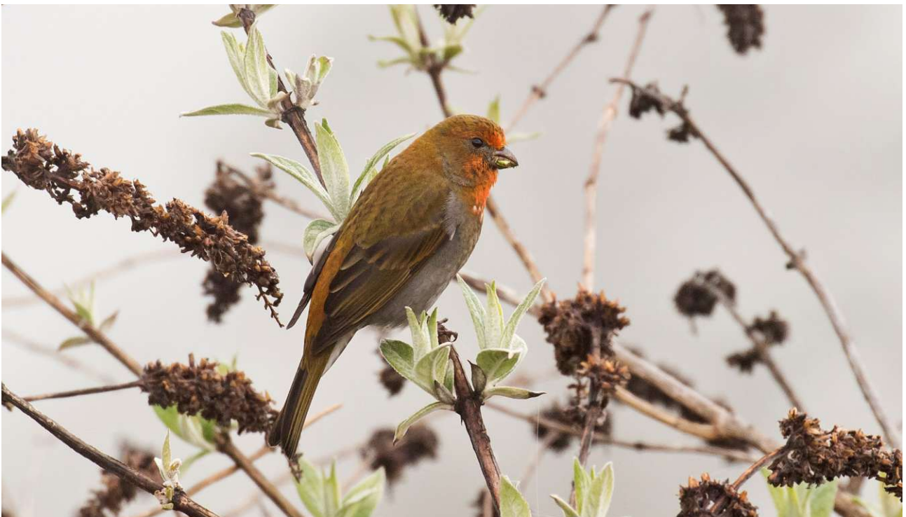
Crimson-browed Finch was an excellent bonus at Balangshan!

With potential travel/traffic problems afoot, we decided to head down from the mountains and spend our last night at Ya'an to ensure that we had no problems getting to the airport and our flights on time. This allowed us to spend a few hours on our last morning in the lowlands. Here, we reacquainted ourselves with a number of species such as David's Fulvetta and Rufous-capped Babbler and added a few new ones including sneaky, but ultimately showy, Dusky Fulvettas, a pair of Black-faced Laughingthrushes and some smart Streak-breasted Scimitar Babblers. The transfer back to the airport was indeed trouble free, and we now had time to sit back and reflect on all that we'd achieved in just a few weeks of magical birding. Cheers and roll on the next one!