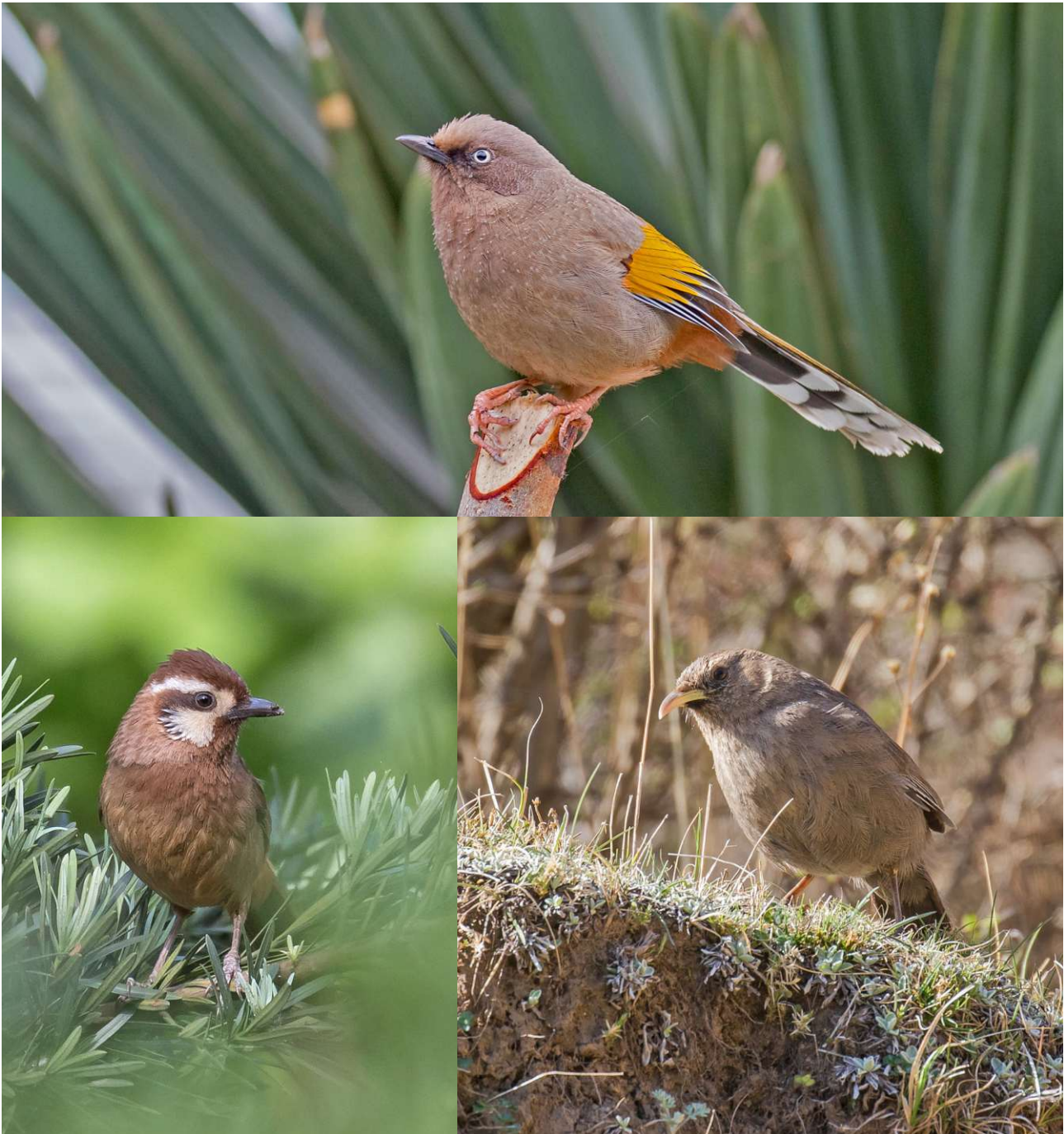
We saw a number of excellent laughingthrushes: clockwise from top: Elliot's, Plain and White-browed Laughingthrushes.

Elliot's Laughingthrush ◇ Trochalopteron elliotii Common and widespread, often heard! First seen well in Yunnan.