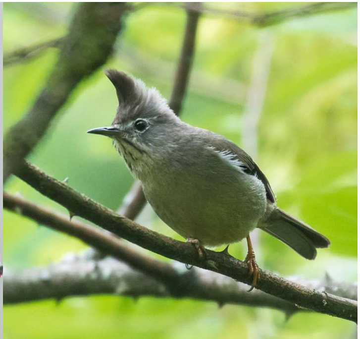
Erlangshan also brought us great views of delightful Fire-capped Tits and Stripe-throated Yuhinas

The Longcanggou area has come on to the birding scene in recent years, rather by default, as other reserves have been closed for 'redevelopment'. Sadly this redevelopment is now commencing at Longcanggou, and the heavy machinery along the road had turned the road into a bit of a mud bath – made even worse when trucks became stuck in the road, blocking the road, a situation that happened twice to us!! That said, the two and