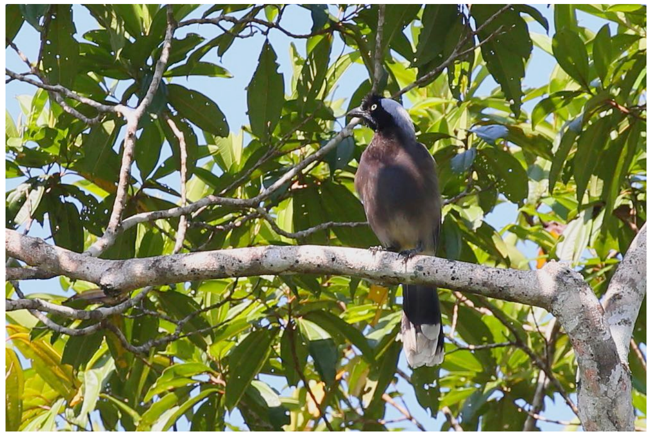
Azure-naped Jay was one of the highlights on our extension in the Mitu area.

Brown-headed Greenlet ◊ (E) Hylophilus brunneiceps Seen well in the Mitu area. Best looks at the Bocatoma trail. Rufous-naped Greenlet ◊ Hylophilus semibrunneus Seen well at several sites; first at the Cerulean Warbler Reserve. Dusky-capped Greenlet (E) Hylophilus hypoxanthus Just one was seen near Mitu. Scrub Greenlet Hylophilus flavipes A couple seen in the coffee below the Cerulean Warbler Reserve. Others heard. Lesser Greenlet Hylophilus decurtatus Seen at El Paujil [darienensis] and in the El Valle area [minor]. Violaceous Jay Cyanocorax violaceus A group of five were seen near Viallavicencio airport. Black-chested Jay Cyanocorax affinis Quite common. Best looks at El Paujil [affinis]. Azure-naped Jay ◊ (E) Cyanocorax heilprini Three sightings near Mitu [nominate].