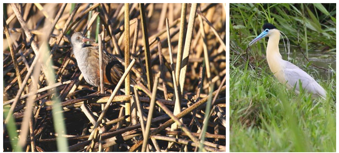
The endemic Bogota Rail at Parque La Florida (left) and Capped Heron near El Paujil.

Black Skimmer Rynchops niger About 15 were seen well on the River Magdalena near Puerto Boyaca [cinerascens]. Laughing Gull Leucophaeus atricilla It was common around El Valle.