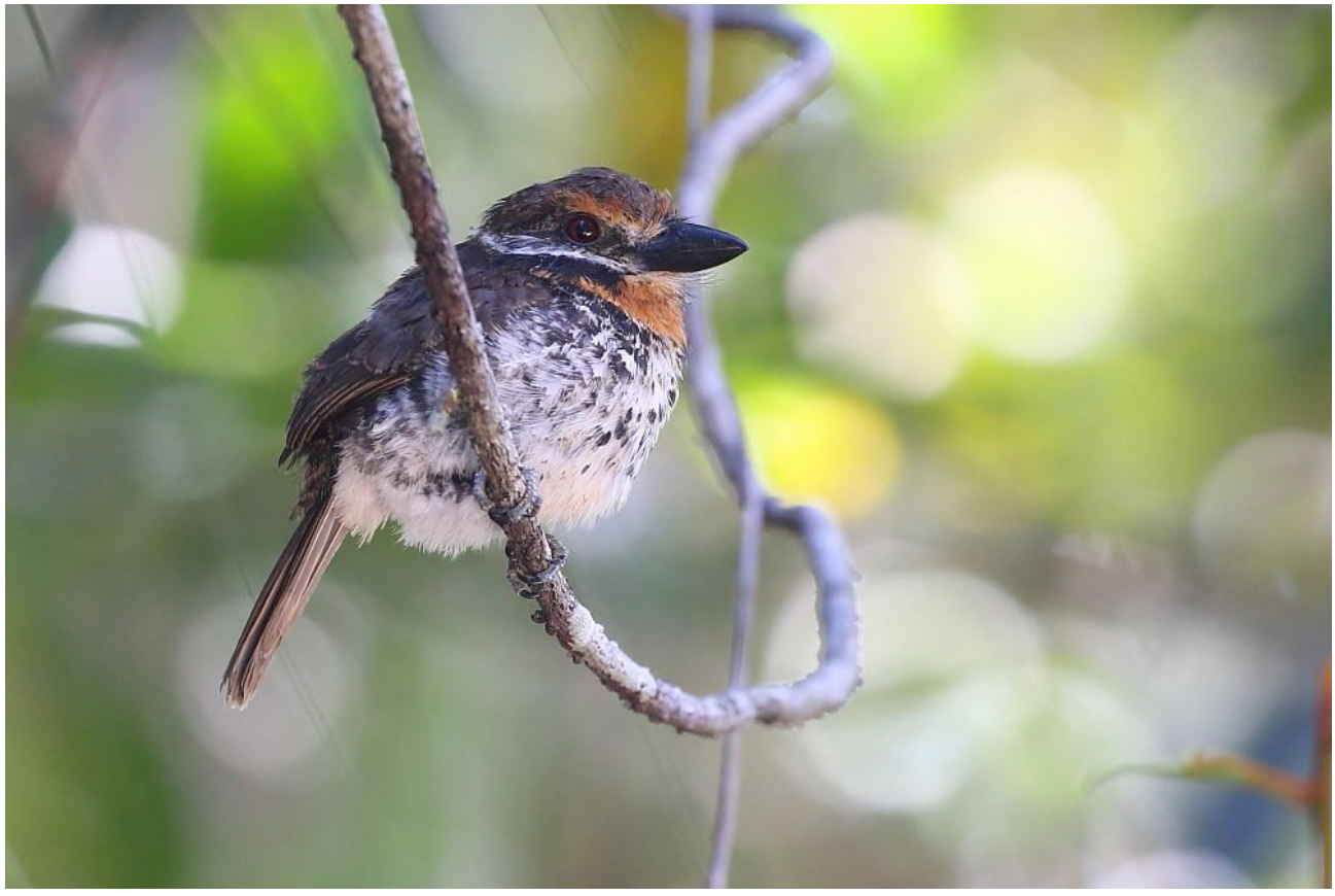
Spotted Puffbird near Mitu (János Oláh)!

Rufous-tailed Jacamar Galbula ruficauda A few, mostly heard but first seen at Laguna del Ato [nominate]. Bronzy Jacamar ◊ (E) Galbula leucogastra Several great looks on the extension near Mitu. Paradise Jacamar (E) Galbula dea A few seen at Mitu. First seen at Pueblo Nuevo [brunneiceps]. Great Jacamar Jacamerops aureus Excellent looks of a pair in the Utria NP [penardi]. White-necked Puffbird Notharchus hyperrhynchus One was seen near El Valle and another near Mitu [nominate]. Black-breasted Puffbird ◊ Notharchus pectoralis Great views of one along the El Valle trail. Brown-banded Puffbird ◊ (E) Notharchus ordii (H) Depsite much effort in remained heard only on the extension. Pied Puffbird Notharchus tectus Several seen well in the El Valle area and seen around Mitu too [subtectus]. Spotted Puffbird ◊ (E) Bucco tamatia Great views of one along the Bocatoma trail near Mitu [pulmentum].