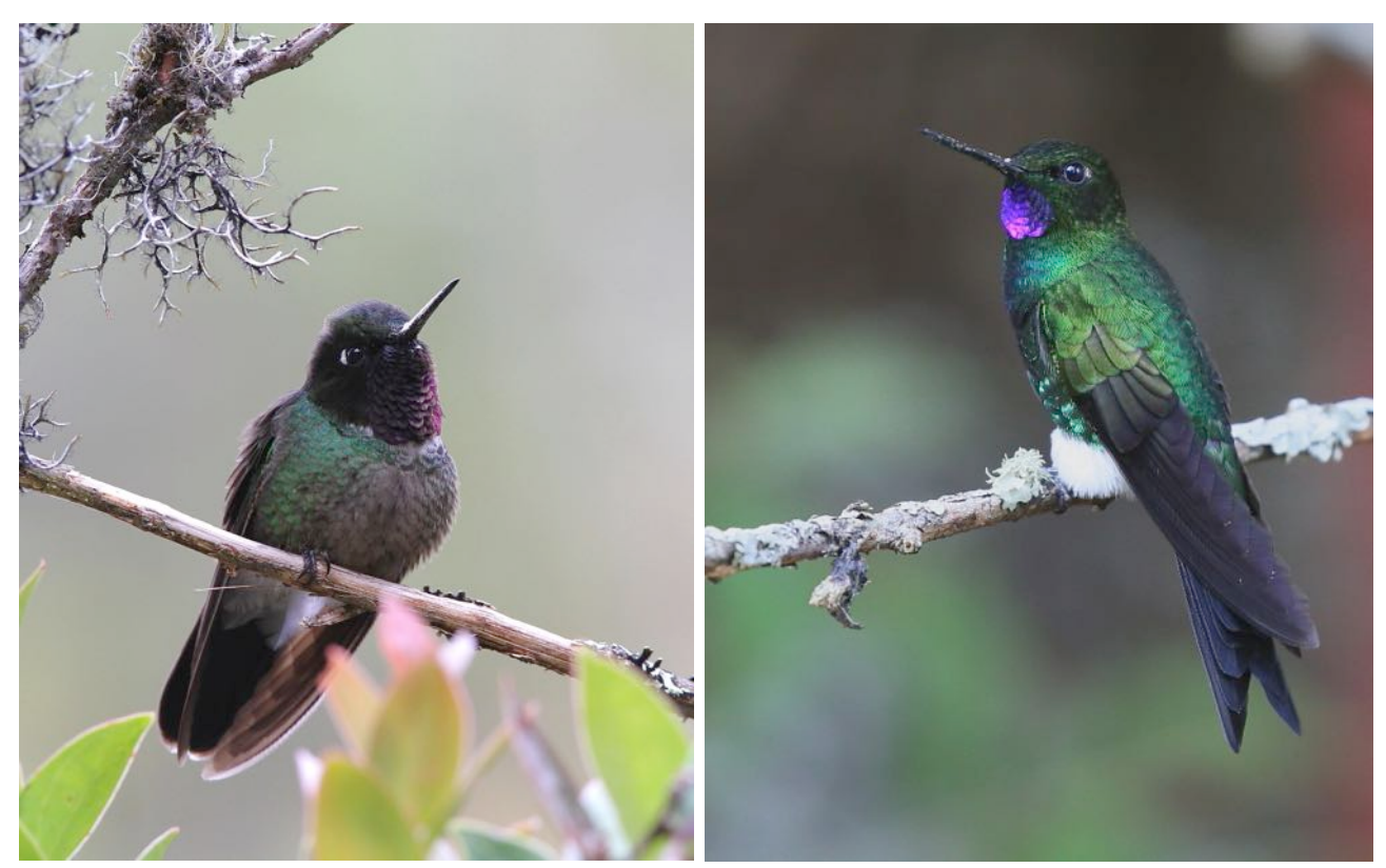
Loungemare's Sunangel (left) near Soata and nominate Glowing Puffleg at Observatorio Colibres.

It was common along the Ongaza Road, above Soata. It has been suggested that the form concerned, clarisse, may represent a separate species: Longuemare's Sunangel.