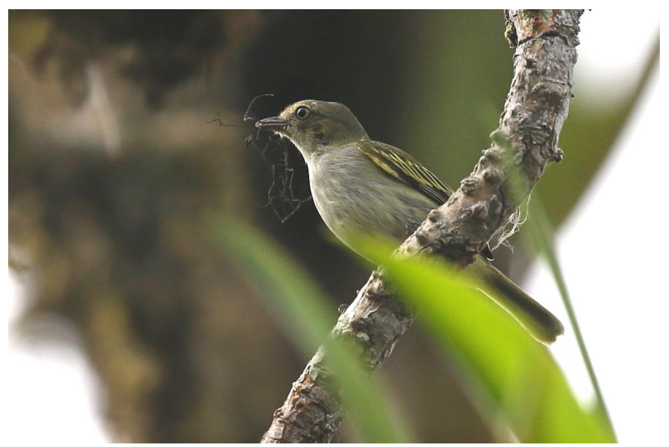
Persumed Choco Tyrannulet nest building in the Utria National Park (János Oláh).

One male was seen near El Valle. The birds here were formerly known as rufiventris, though this subspecies is now merged with the nominate. We also saw a pair near Mitu. Not sure which subspecies is involved.