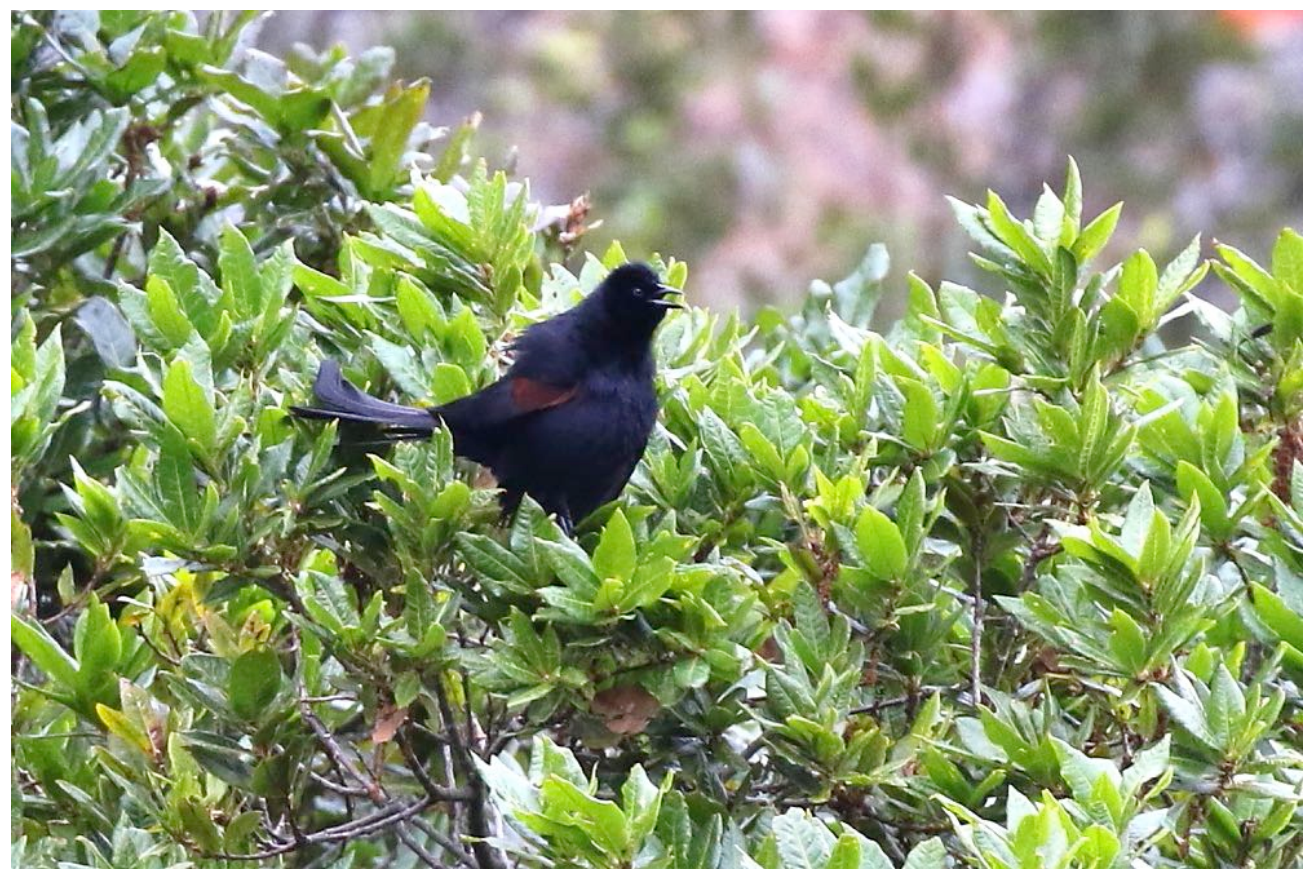
The rare endemic Colombian Mountain Grackle in display near Soata (János Oláh).

As we rolled in very late to the ProAves lodge we decided to spend the morning around the lodge area where we had great looks of the endemic Turquoise Dacnis which was one of our endemic target for this area. Feeders around the lodge hosted dazzling Lemon-rumped Tanagers as well as confiding Streaked Saltators and Swainson's Thrushes while in the trees and bushes around the lodge we found Ruddy Pigeon, Striped Cuckoo, Olivaceous Piculet, Great and Bar-crested Antshirkes, Fork-tailed Flycatcher, yet another