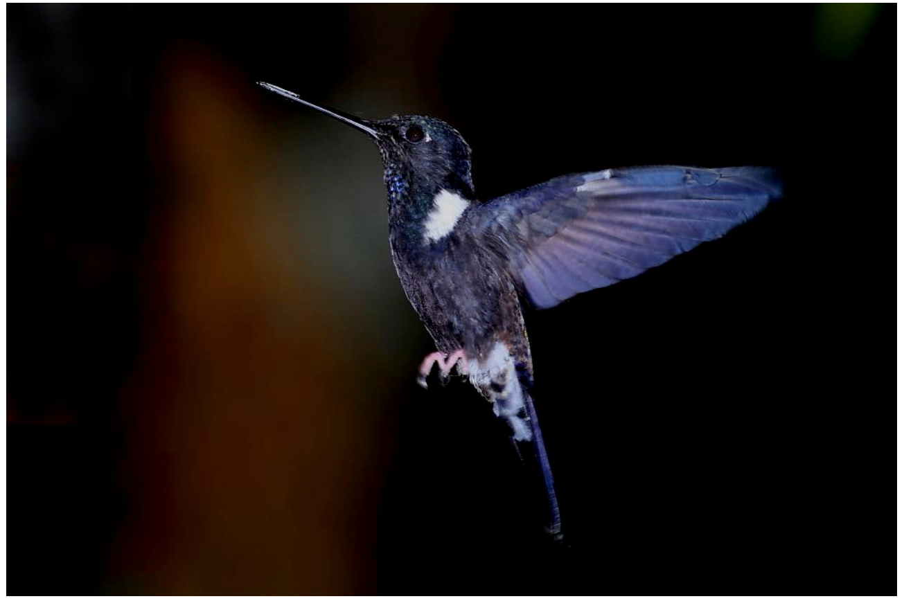
The fantastic endemic Black Inca is not just black!