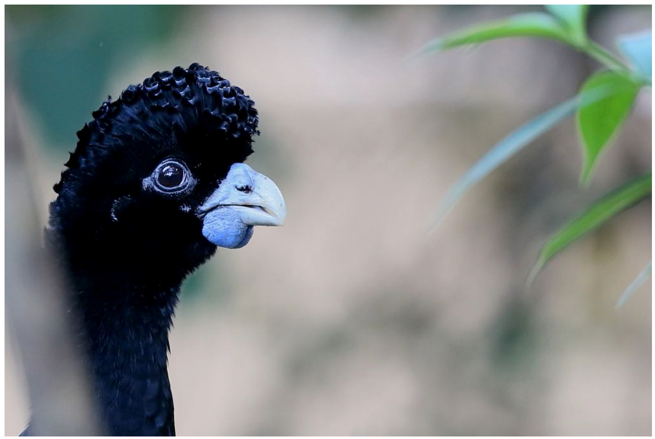
One of the star birds of this exciting tour was the critically endangered Blue-billed Curassow (János Oláh).

Cinnamon and Choco Screech Owls, White-tipped Sicklebill, Blue-throated and Dusky Starfrontlets, Shorttailed Emerald, the endemic Black Inca, Chestnut-bellied and Indigo-capped Hummingbirds, the rare Humboldt's Sapphire, White-mantled Barbet, Greyish Piculet, Beautiful Woodpecker, Black-billed Mountain-Toucan, the subtle but unique Sapayoa, the endangered Recurve-billed Bushbird, Cundinamarca and Urrao Antpittas, Bare-crowned Antbird, Niceforo's and Antioquia Wrens, the amazing Baudo Oropendola, superb Crested and Sooty Ant Tanagers and the very rare Colombian Mountain Grackle. And that really is just the tip of the iceberg! On the Mitu Extension in Amazonia the Orinoco Piculet was a Birdquest lifer while other highlights included Tawny-tufted Toucanet, Yellow-throated Antwren, the rare Grey-bellied Antbird, the superb Chestnut- crested Antbird, Azure-naped Jay, Fiery Topaz, Collared Gnatwren and Plumbeous Euphonia.