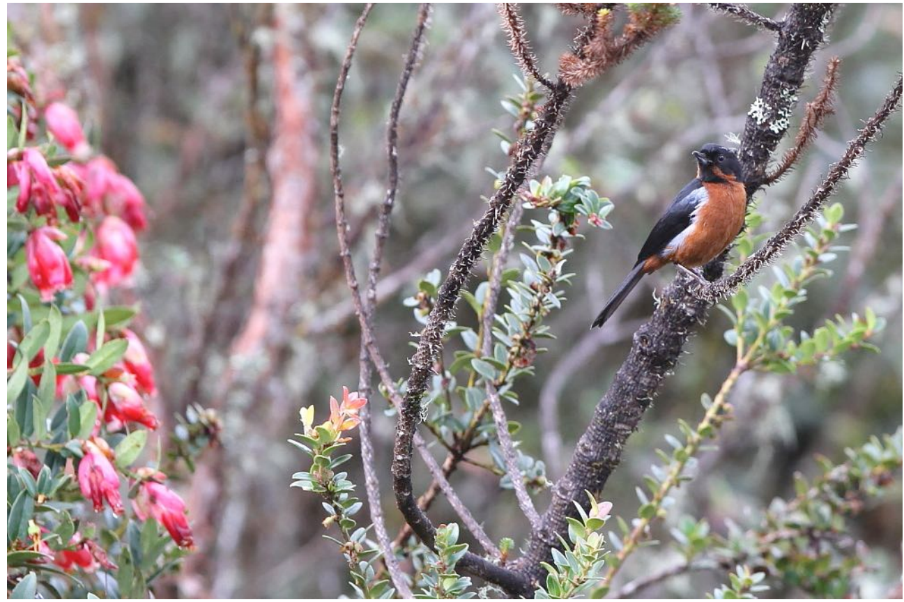
Black-throated Flowerpiercer in the Colibri del Sol Reserve.