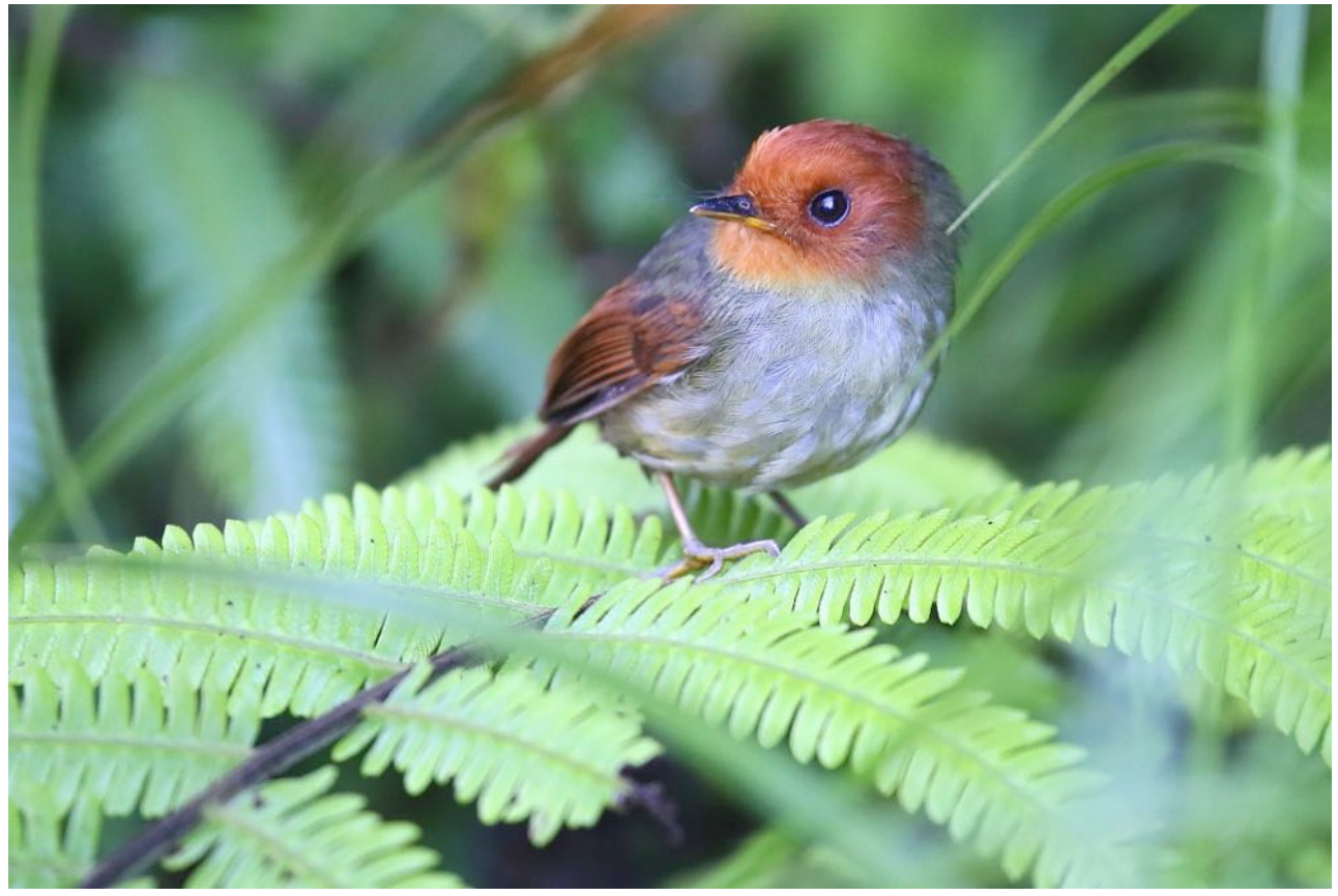
Rufous-headed Pygmy Tyrant at Monterredondo (János Oláh).

Ringed Antpipit (E) Corythopis torquatus Great view of this smart bird around Mitu.