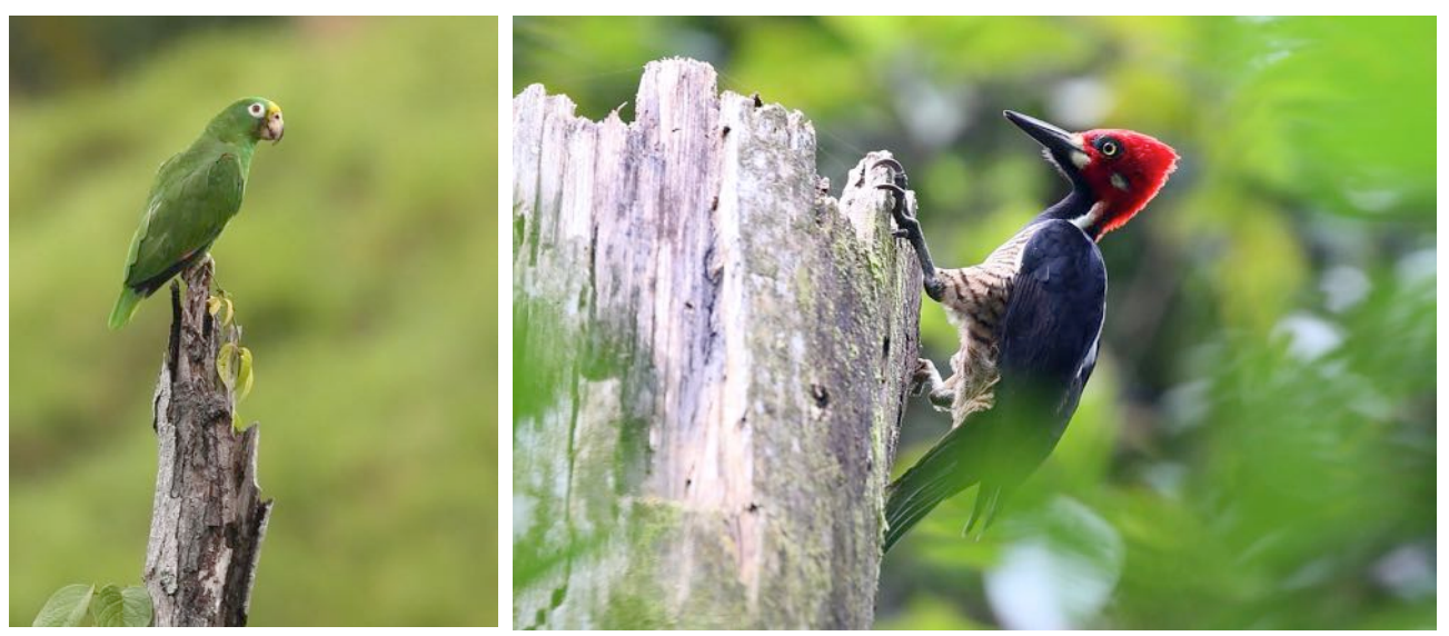
Yellow-crowned Amazon near El Paujil and Crimson-crested Woodpecker in the Utria NP (János Oláh)!

Scaly-naped Amazon Amazona mercenarius Four were seen at Mundo Nuevo on our first day. Southern Mealy Amazon Amazona farinosa Seen well at El Paujil, around El Valle and near Mitu. NT Orange-winged Amazon Amazona amazonica It was commonly seen at El Paujil. Spectacled Parrotlet ◊ Forpus conspicillatus Quite a few seen - first below the Cerulean Warbler Reserve. Black-headed Parrot (E) Pionites melanocephalus Excellent looks along the Bocatoma trail near Mitu [pallidus]. Red-fan Parrot ◊ (E) Deroptyus accipitrinus One seen at Mitu Cachivera and others at Pueblo Nuevo [nominate]. Maroon-tailed Parakeet (E) Pyrrhura melanura Quite common at Mitu. First seen at Pueblo Nuevo [nominate]. Brown-breasted Parakeet ◊ Pyrrhura calliptera Seen well above Mundo Nuevo and in flight at Monterredondo. VU Blue-and-yellow Macaw Ara ararauna Just a few sightings in the Magdalena Valley and El Valle. Scarlet Macaw (E) Ara macao Several seen in the Mitu area [nominate]. Chestnut-fronted Macaw Ara severus It was common Ein the El Paujil area. Sapayoa ◊ Sapayoa aenigma Fantastic views along the Cocalito Trail in Utria NP. Stripe-breasted Spinetail ◊ Synallaxis cinnamomea Four were seen at the Bushbird Reserve [nominate]. Silvery-throated Spinetail ◊ Synallaxis subpudica (H) Heard above Soata but not seen.