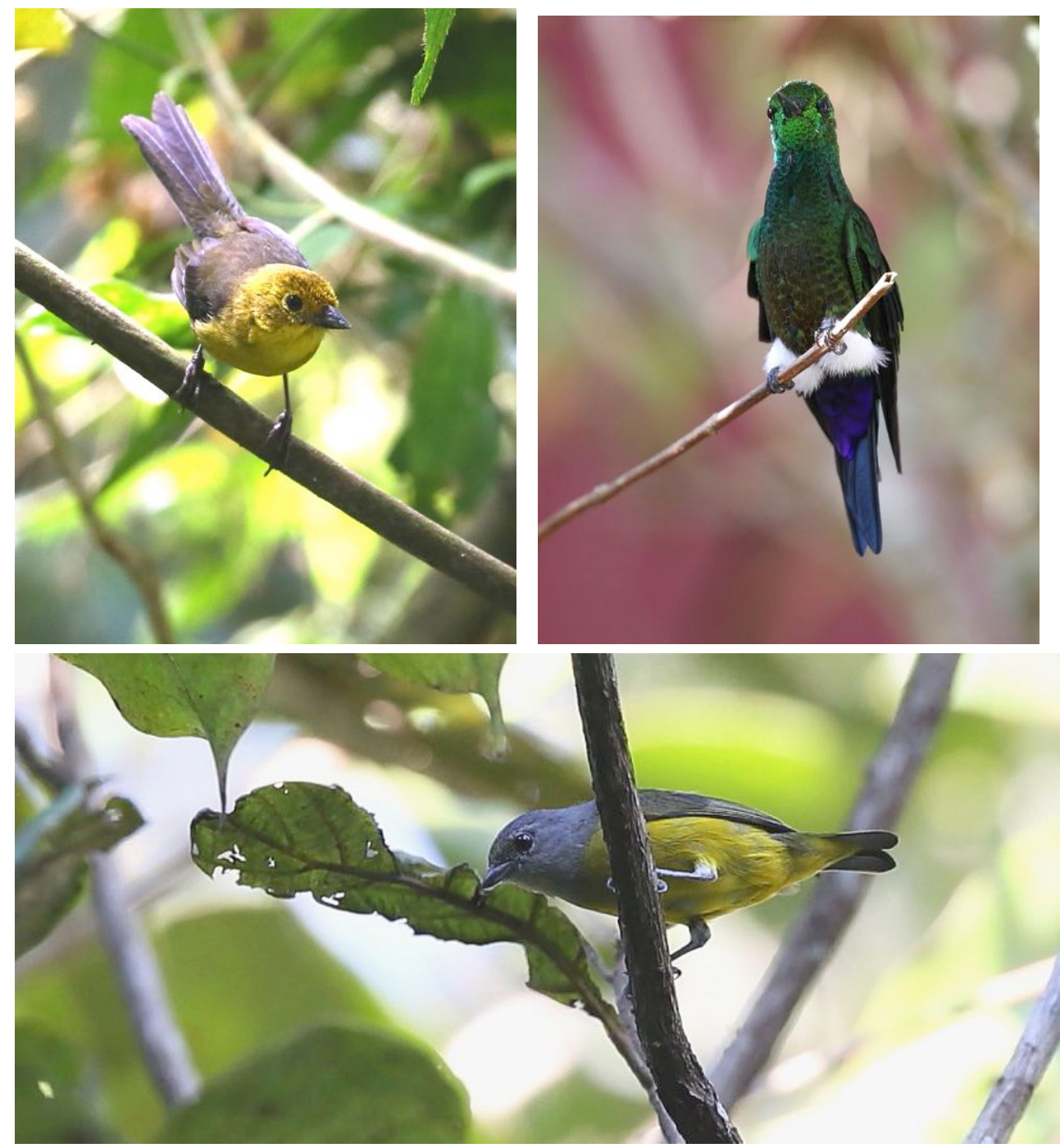
Endemic Yellow-headed Brush Finch at Libano (left), the near endemic Coppery-bellied Puffleg (right) near Bogota and the localised Plumbeous Euphonia near Mitu.