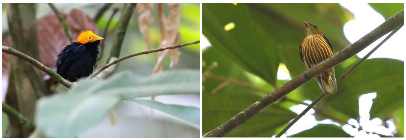
Golden-headed Manakin (left) at the Bellavista Reserve and Western Striped Manakin along the Bocatoma trail near Mitu.

Two forms of this cracking species noted. We had a male of the form antioquiae at El Paujil, and a female at the Bellavista Reserve, La Victoria. A few of the nominate form were also seen in the Mitu area. Stunner!