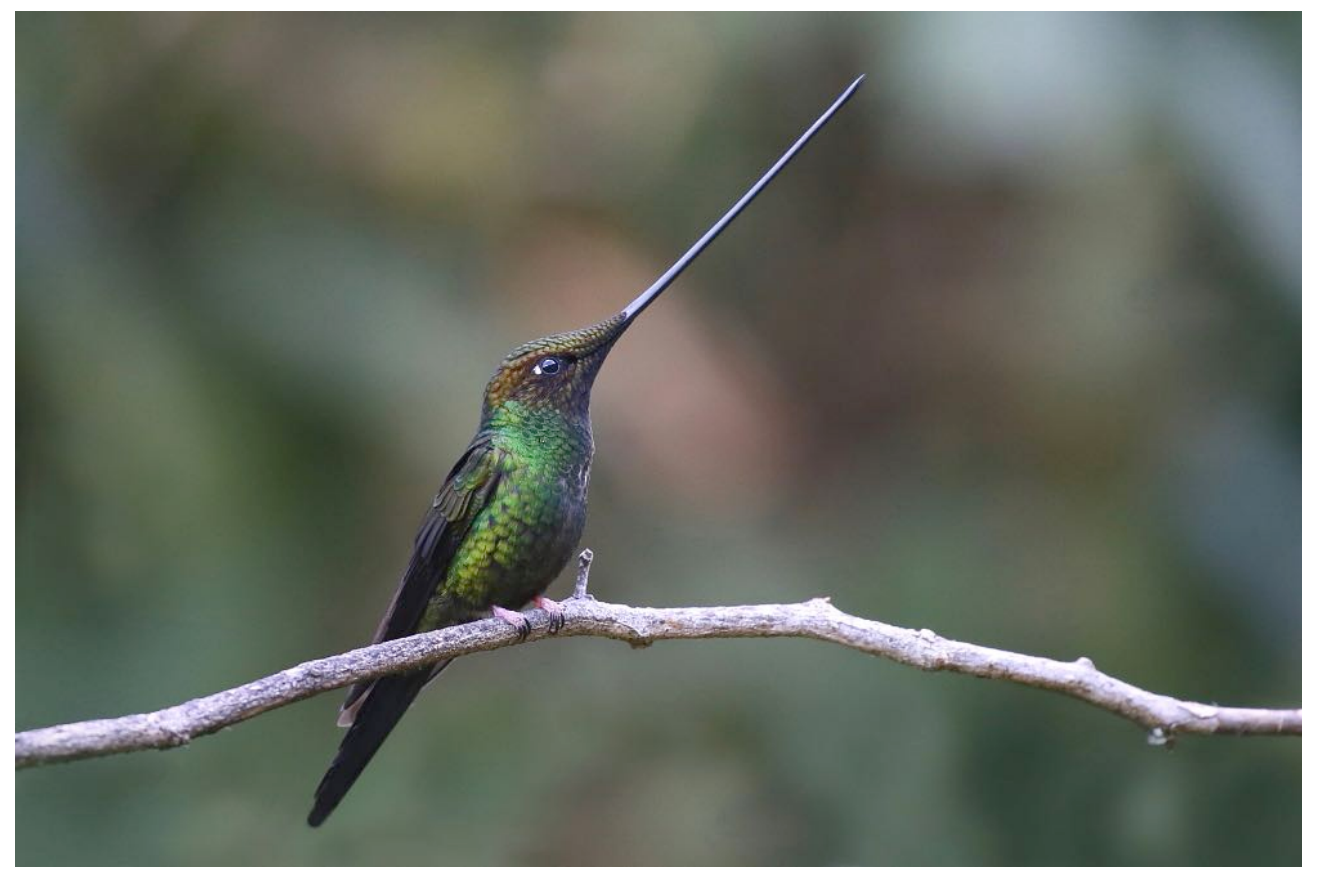
Sword-billed Hummingbird was also seen on our first day (János Oláh)!