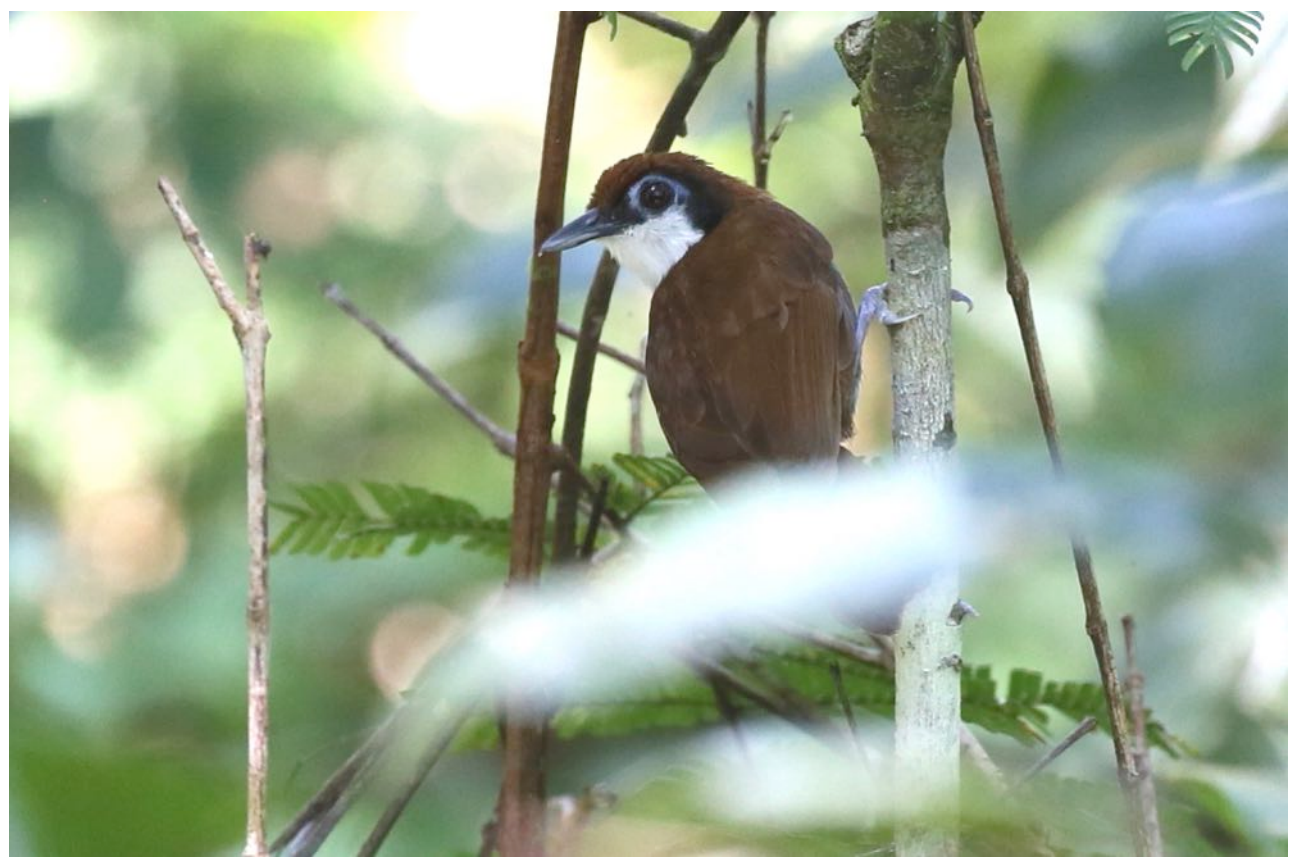
White-cheeked Antbird near Mitu.