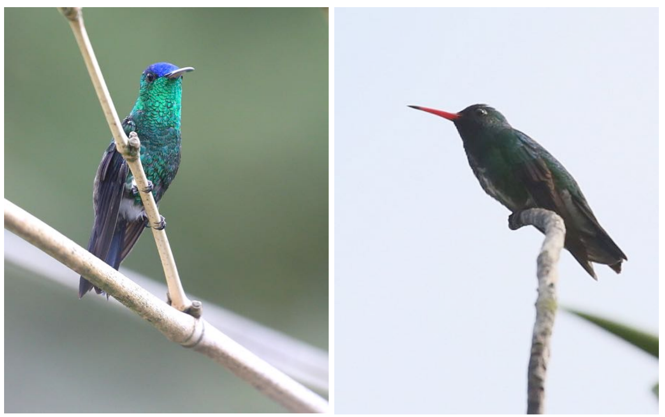
Indigo-capped Hummingbird (left) in the Cerulean Warbler Reserve and the rare Humboldt's Sapphire at Utria NP.