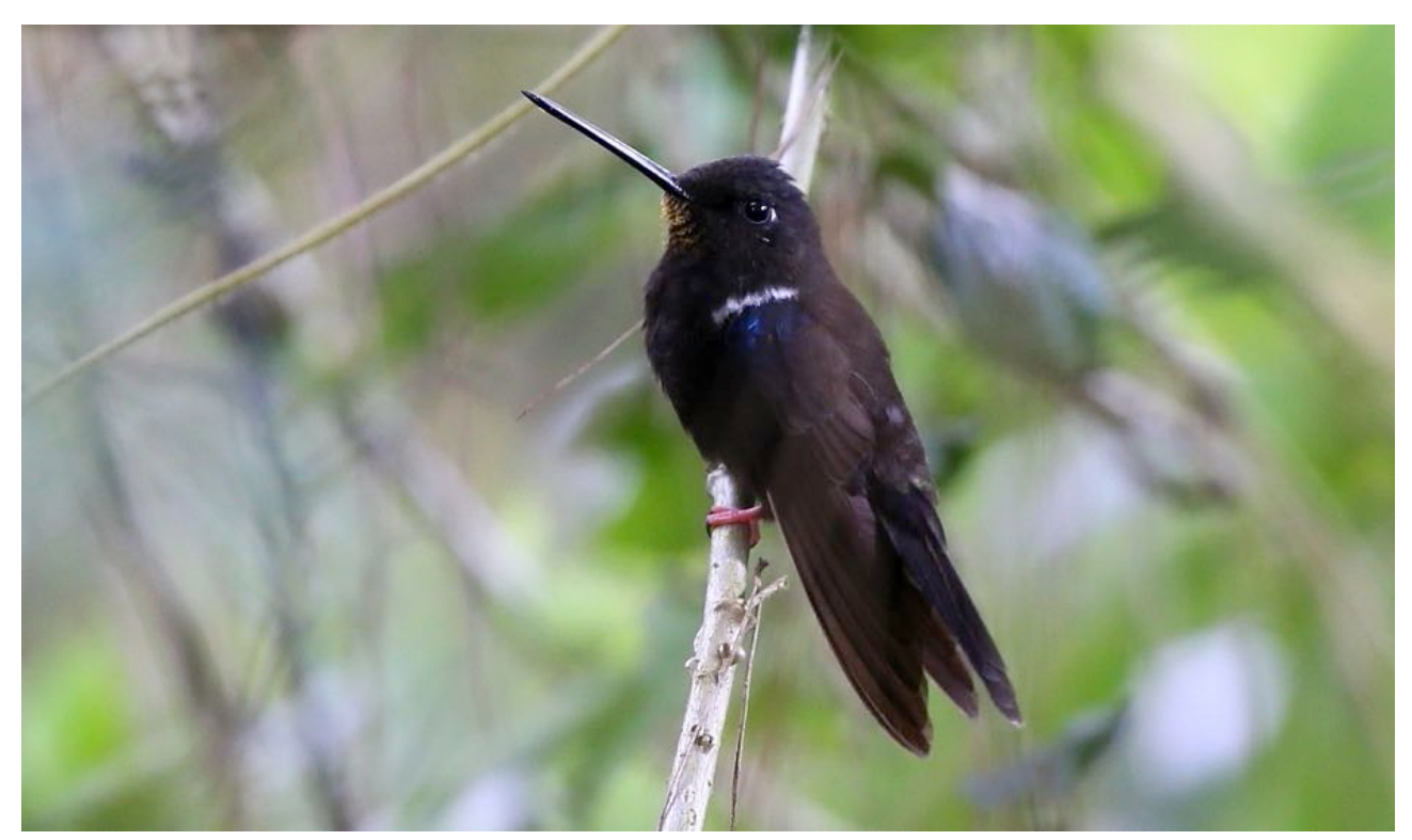
Black Inca alias Príncipe de Arcabuco is one of the star hummingbirds on this tour (János Oláh).