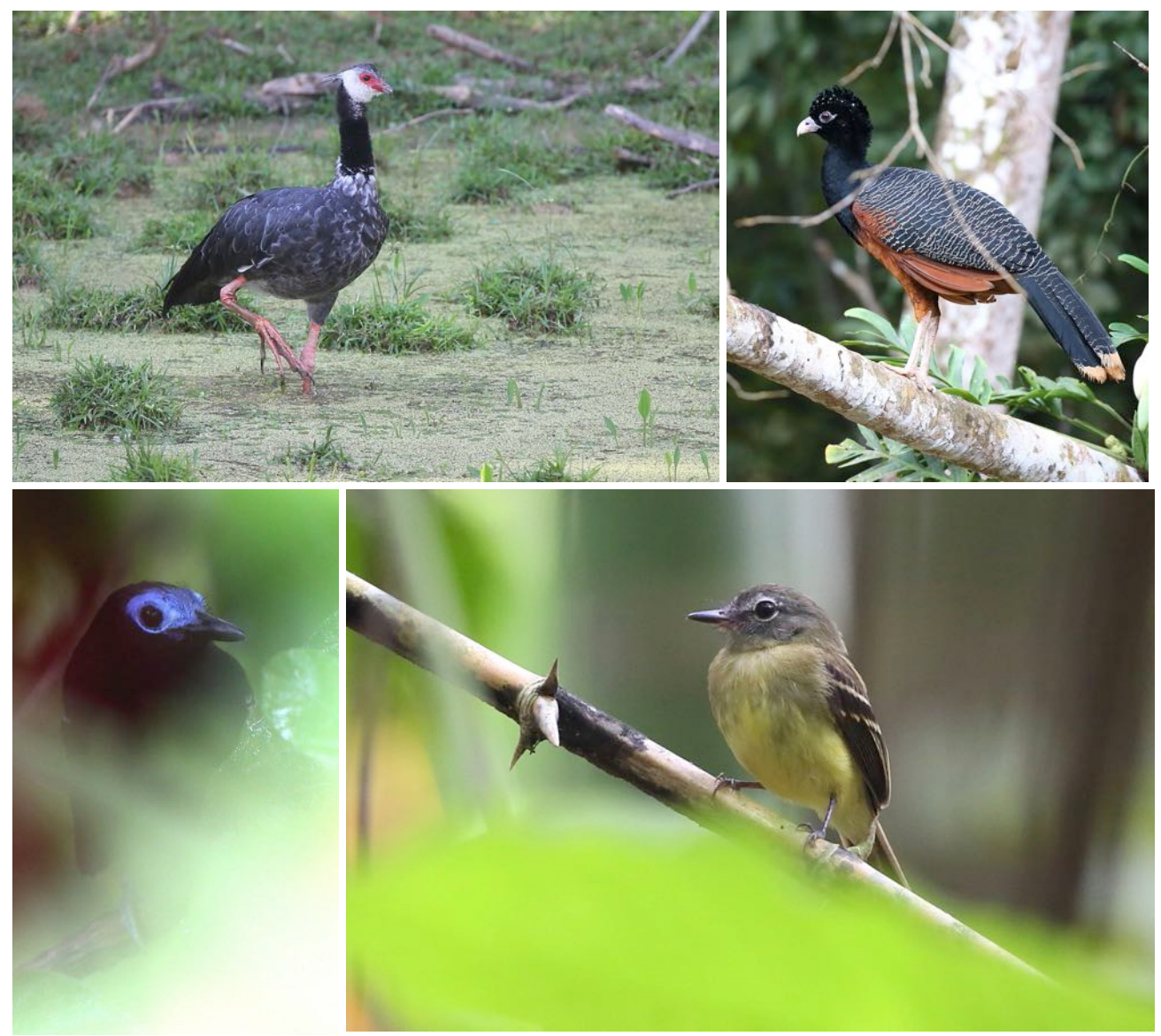
Northern Screamer (top left), female Blue-billed Curssow (top right), a male Bare-crowned Antbird (left) and the bamboo-loving Blackbilled Flycatcher in the El Paujil Reserve.