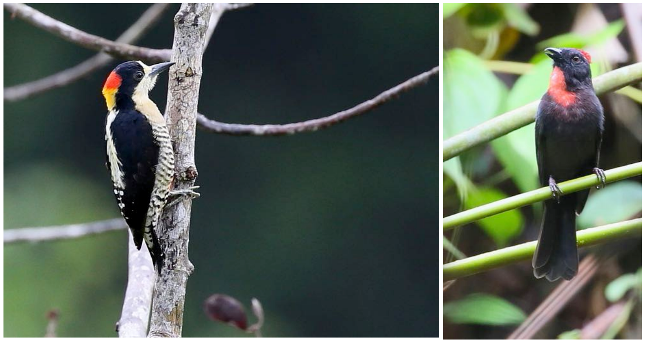
Beautiful Woodpecker (left) and a male Sooty Ant Tanager were top birds at El Paujil (János Oláh)!

Tanagers whilst colour was added by White-tailed and Gartered Trogons. At night the reserve was rather unusually quiet but with hard work we finally managed to see Choco Screech Owl.