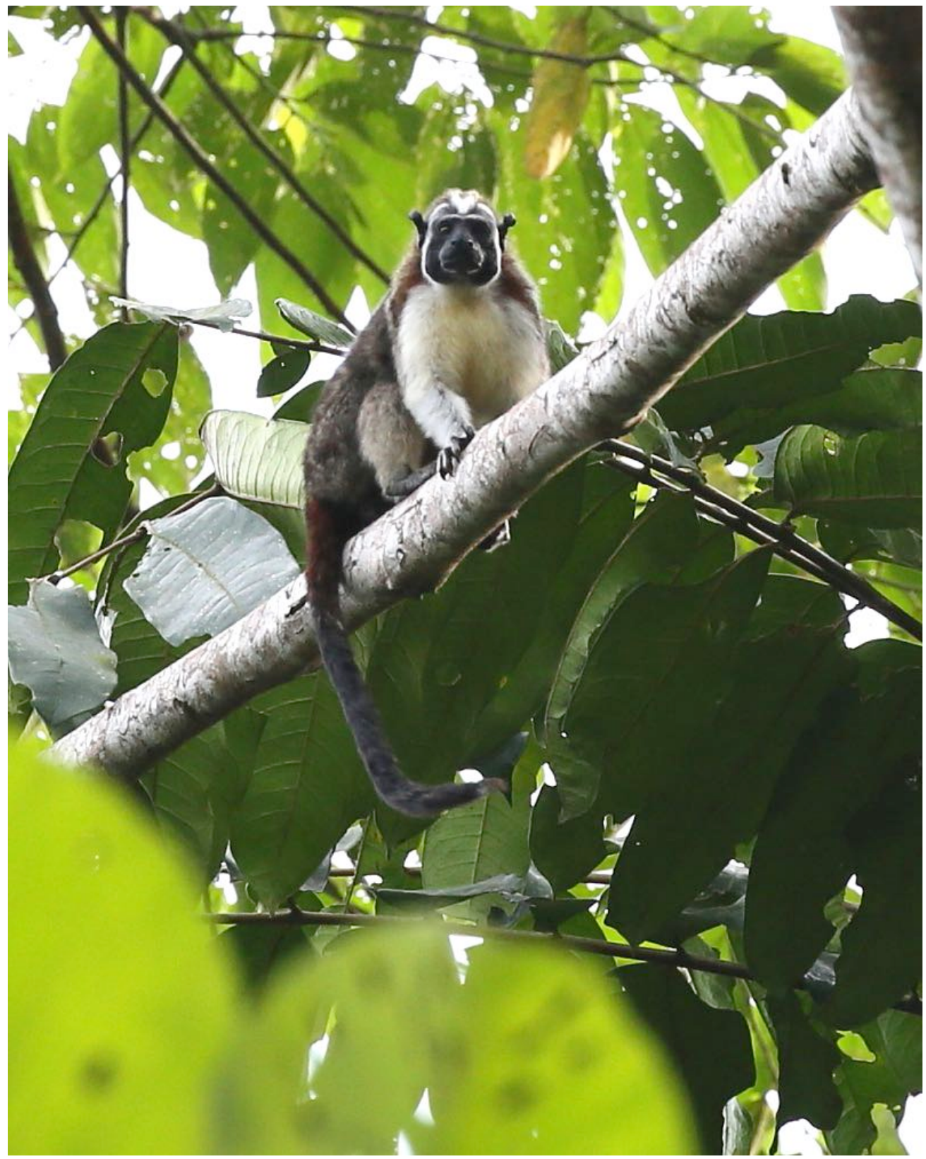
Geoffroy's Tamarin at El Valle (János Oláh).