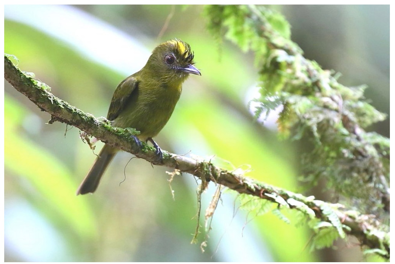
One of the many highlights of this specialist tour was the enigmatic Sapayoa in the Choco.