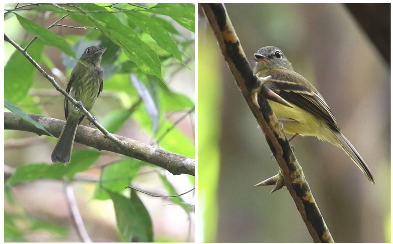
Pacific Flatbill (left) in Utria NP and Black-billed Flycatcher at El Paujil are two special flycatchers on this tour (János Oláh).