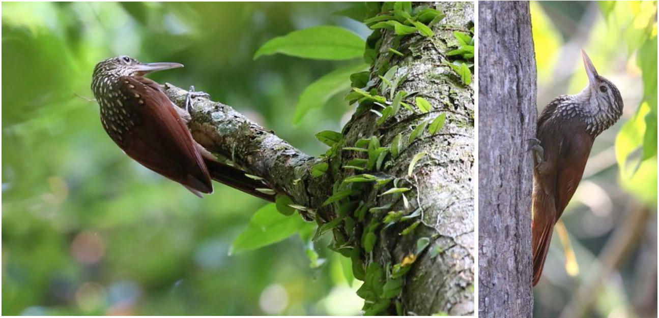
Black-striped (left) and Straight-billed Woodcreepers at El Paujil (János Oláh)!

Amazonian Barred Woodcreeper (E) Dendrocolaptes certhia Great looks at Ceima Chachivera near Mitu [nominate]. Straight-billed Woodcreeper Dendroplex picus Excellent looks of a breeding pair at El Paujil [dugandi]. Striped Woodcreeper (E) Xiphorhynchus obsoletus One seen in a mixed flock at Ceima Cachivera [palliatus]. Elegant Woodcreeper (E) Xiphorhynchus elegans Two sightings on the extension near Mitu [buenavistae]. Buff-throated Woodcreeper (E) Xiphorhynchus guttatus A few seen at Pueblo Nuevo, Mitu [guttatoides]. Cocoa Woodcreeper Xiphorhynchus susurrans One was seen at El Paujil and others heard there [nana]. Black-striped Woodcreeper Xiphorhynchus lachrymosus Excellent looks at El Paujil [alarum].