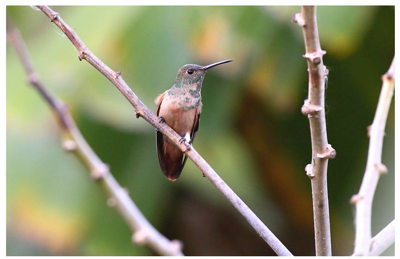
The rare endemic Chestnut-bellied Hummingbird near Soata (János Oláh).