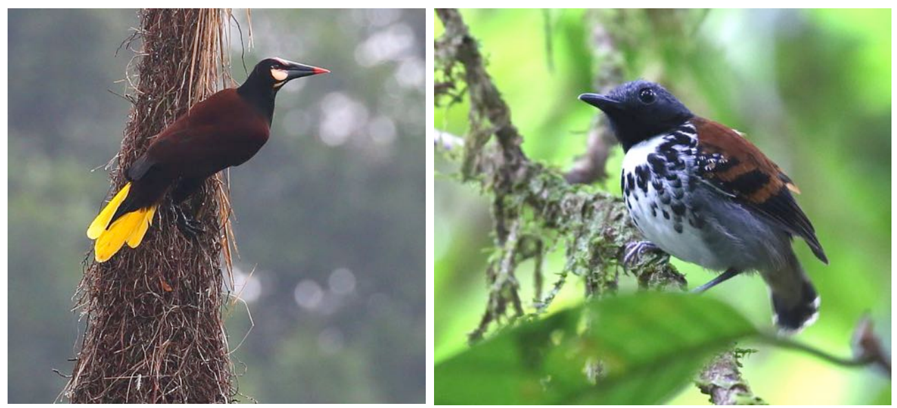
Male Baudo Oropendola (left) and male Spotted Antbird on the access trail to the Utria National Park (János Oláh).

goodies including Laughing Falcon, impressive Black-breasted Puffbird, Checker-throated Antwrens and Spotted Antbird. When we got to a good-looking clearing it started to rain. We sheltered in a little hut and as soon as the rain stopped the activity was really good and did not take long to locate an amazing male Baudo Oropendola which even displayed and sung for us! We laso had two more very good birds in this clearing, a Plumbeous Hawk as it was drying its wings after the rain and a pair of Western or Choco Sirystes. In the late afternoon we have visited the Bahia Solano and El Valle road again where we got to see a Crested Guan which caused an initial excitement until the identification was confirmed not to be the rare Baudo Guan. Highlights this afternoon included Cinnamon Woodpecker, more Spot-crowned Barbets, Black-capped Pygmy Tyrant and a female Black-tipped Cotinga and a stunning male Blue Cotinga. Before our flight back to Medellin and to Bogota we had another morning birding along this road and we still picked up some new birds like a Tiny Hawk, a male Purple-chested Hummingbird, White-tipped Sicklebill and a pair of Rufous-winged Tanagers. Some of us even managed to see a Jaguarundi crossing the road in full sunlight! In the Medellin airport we said cheerio to one of our group members, whilst the rest of us continued to Bogota for a little sleep before we drove to Villavicencio early next morning to catch our flight for the Amazon!