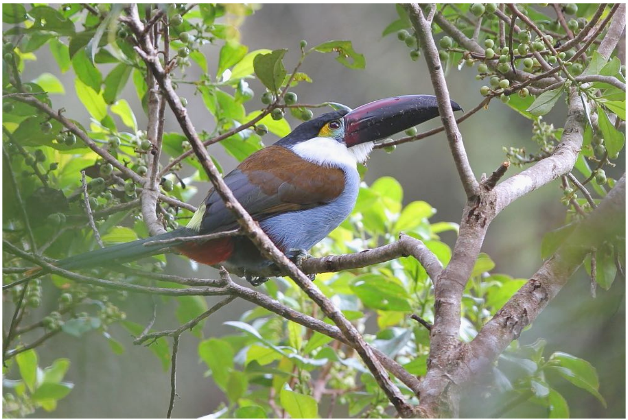
Black-billed Mountain Toucan in the Colibri del Sol Reserve !

Stripe-billed Aracari & Pteroglossus sanguineus Common in the El Valle area. Tawny-tufted Toucanet & (E) Selenidera nattereri A shy pair and a male was seen well near Mitu. Black-billed Mountain Toucan & Andigena nigrirostris Heard at Mundo Nuevo and seen at Colibri de Sol [nominate]. Channel-billed Toucan (E) Ramphastos vitellinus (H) Several heard at Mitu [culminatus]. VU Citron-throated Toucan & Ramphastos citreolaemus Several seen at El Paujil.