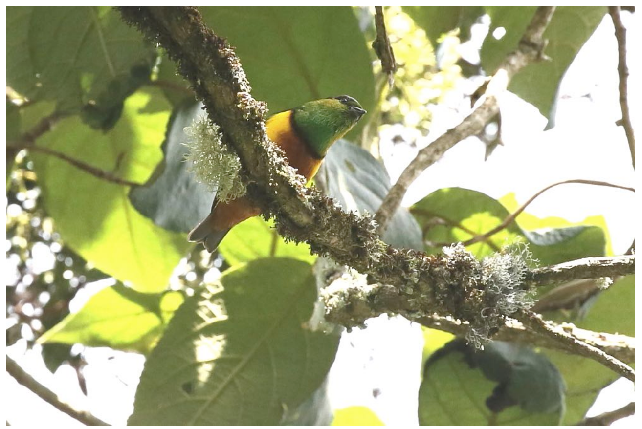
Male Chestnut-breasted Chlorophonia in the Colibri del Sol Reserve (János Oláh).

Chestnut-breasted Chlorophonia Chlorophonia pyrrhophrys A pair was seen in the Colibri del Sol Reserve [intensa].