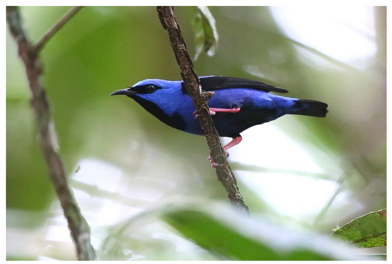
Short-billed Honeycreeper at Pueblo Nuevo near Mitu (János Oláh).

Blue Dachis Dachis cayana Three forms noted: caerebicolor at El Paujil; napaea at El Valle and nominate around Mitu. Short-billed Honeycreeper (E) Cyanerpes nitidus Excellent looks of this smart bird in the Mitu area.