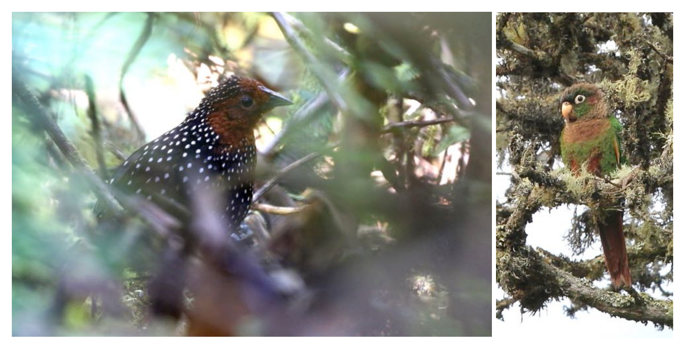
Ocellated Tapaculo (left), Brown-breasted Parakeet (right) and Sword-billed Hummingbird was seen on our first day (János Oláh)!

We had an unusually early start as we headed to the southeast of the capital the following morning, our destination the remnant forests above Monterredondo. This amazing cloud forest is the only accessible site for the endemic and rather elusive Cundinamarca Antpitta. We had to work hard as usual and only heard one distantly for most of the morning. However when a little Slaty-crowned Antpitta showed well our luck has turned! A Cundinamarca Antpitta started calling nearby and first we had fleeting views of the endemic ground-dweller but with persistence we got superb looks of this rather dull but very prized bird! Whilst looking we did find some other goodies including Speckled Hummingbird and Collared Inca, Masked Trogon, the localized White-throated Toucanet, some more Brown-breasted Parakeets in flight, Mountane Foliage-gleaner, smart Rufous-headed Pygmy Tyrant and Rufous-crowned Tody-Flycatchers, many Green-and-black Fruiteaters, Black-crested Warbler, and colourful Grass-green, Beryl-spangled and Blue-and-black Tanagers. A singing Buff-breasted Mountain Tanager and some foraging Mountain Coatis were extra bonuses. After the great success we spent some time to track down the localised Green-bellied Hummingbird at a flowering tree where we had about five of these little-known hummers as well as Northern Mountain Cacique, Crested Oropendola and a pair of Burnished-buff Tanagers for some before we returned to the capital.