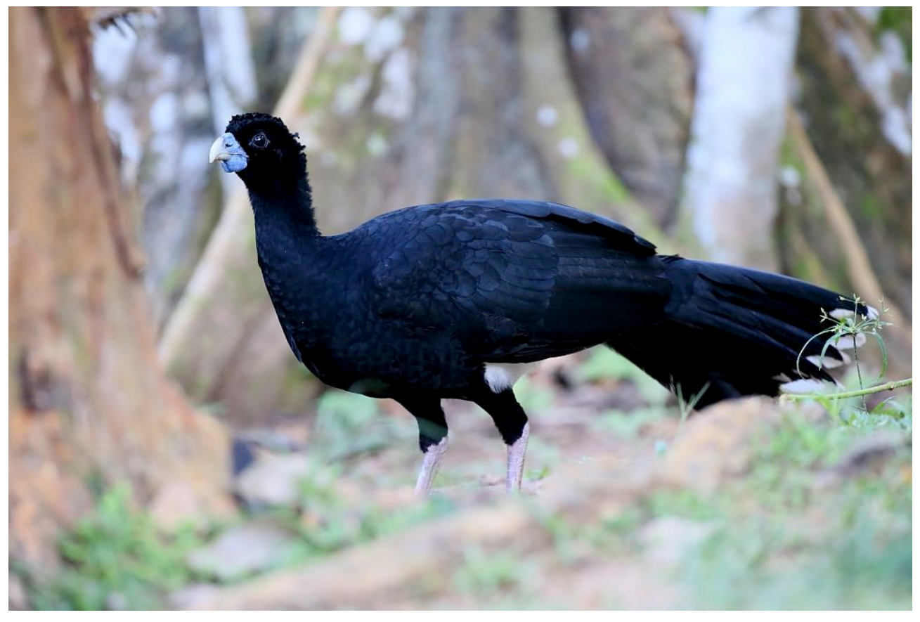
The endemic Blue-billed Curassow at El Paujil (János Oláh).

Blue-billed Curassow & Crax alberti Excellent looks of a fine male in the last minute at El Paujil. CR