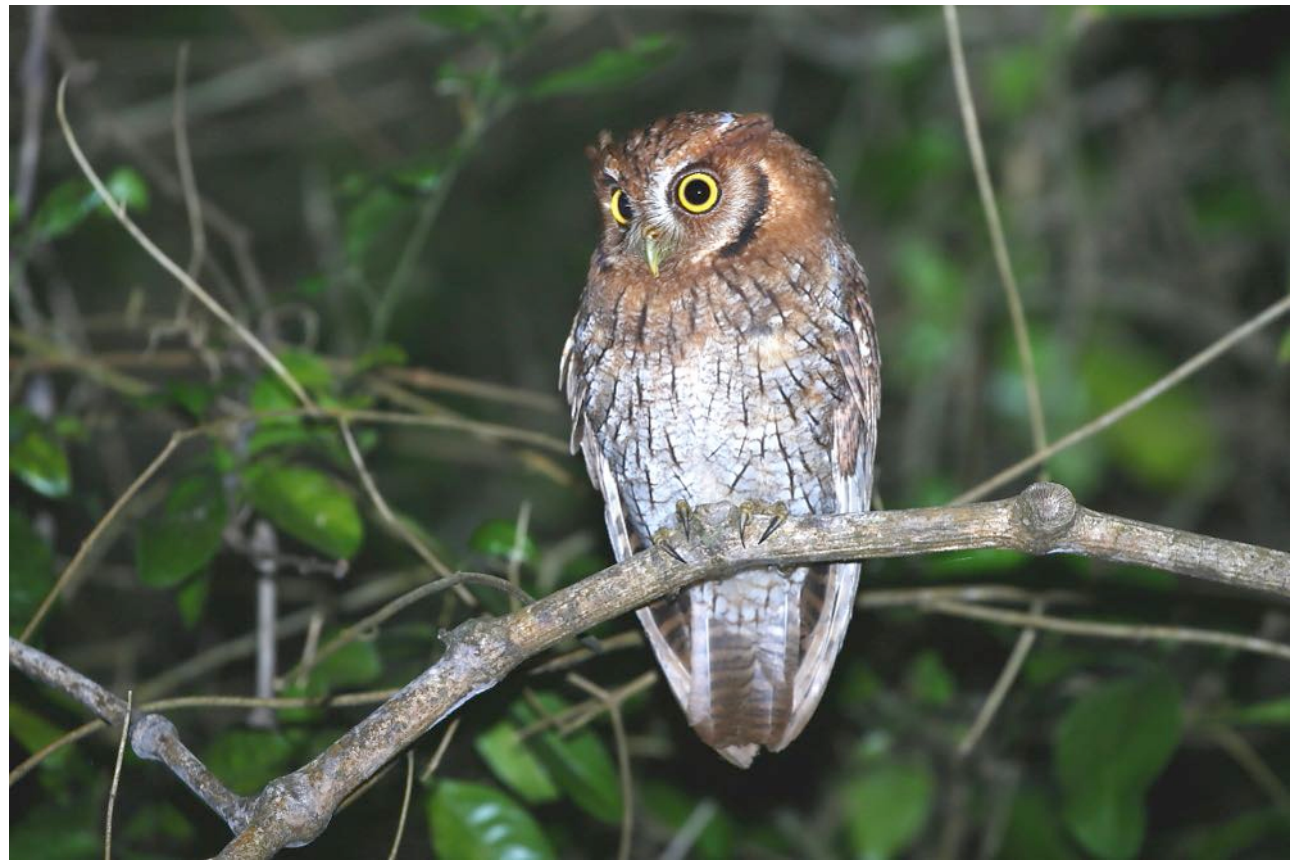
Tropical Screech Owl at the Cerulean Warbler Reserve (János Oláh).