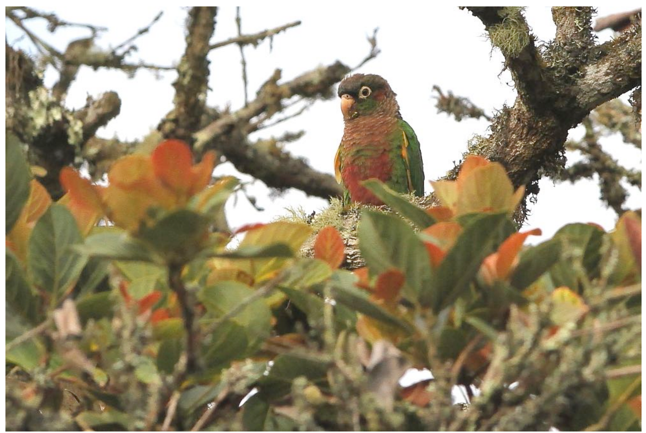
The endemic Brown-breasted or 'Flame-winged' Parakeet in the Chingaza National Park (János Oláh).