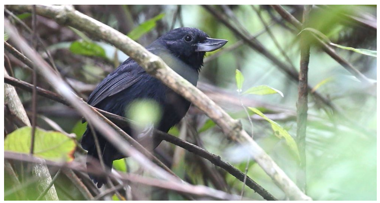
Recurve-billed Bushbird male near Ocaña (János Oláh).

Ocaña is famous for another ProAves protected area: the Recurve-billed Bushbird Reserve. Of course we were on a mission the following morning, it was to find this much localised antbird! In the bamboo understorey dominated forest soon after dawn we heard the distant song of a bushbird but it was very far. For the next two hours we concentrated in the best spots for the bird but we have not had a sniff. We located the recently-split Klages's Antbird, some sneaky Stripe-breasted Spinetails, stolid Moustached Puffbird and in the thick bamboo patches the uncommon Grey-throated Warbler. The morning was coming to an end when we finally heard the song of the bushbird again in a thick, inpenetrable bushy area on a steep hillside. This time however luck was on our side and with a bit of cautious coaxing we managed to get a fine male coming closer and finally we got excellent looks of this much sought-after bird! This remarkable species was only rediscovered in 2004.