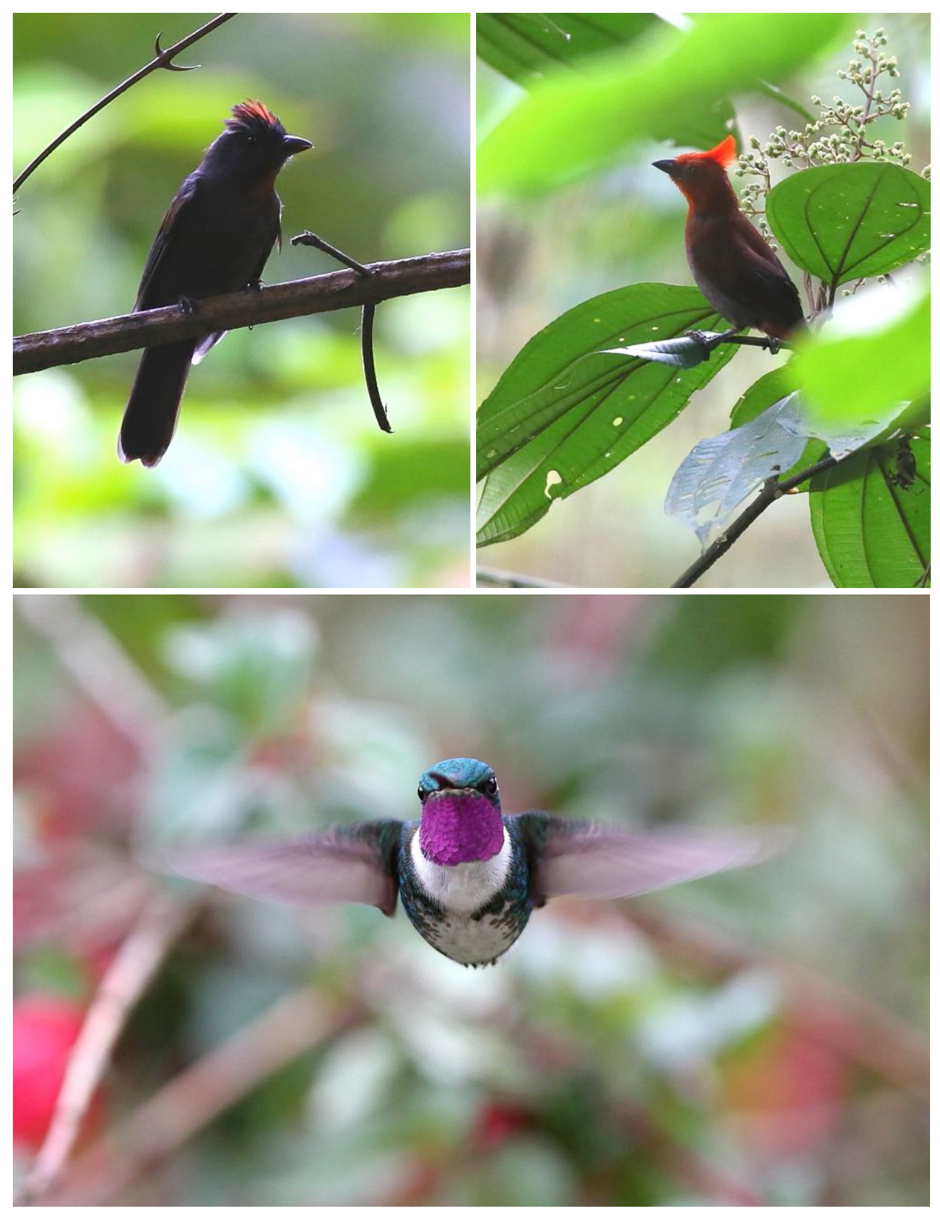
Sooty Ant Tanager male (left) at El Paujil Reserve, Crested Ant Tanager male (right) at Líbano and White-bellied Woodstar at Colibri del Sol Reserve near Urrao (János Oláh).