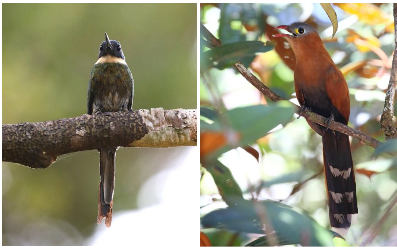
Bronzy Jacamar (left) and Black-bellied Cuckoo near Mitu.