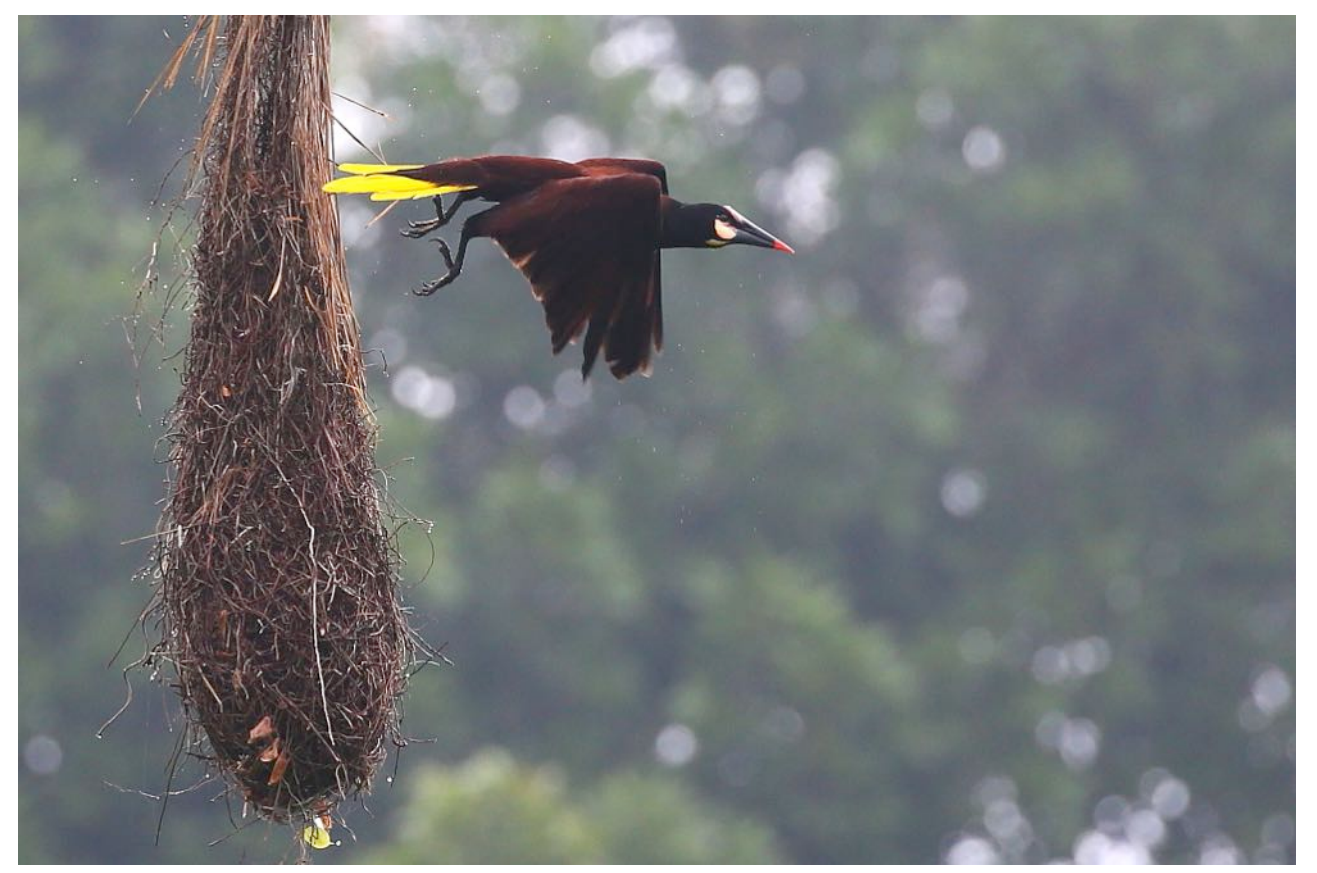
Baudo Oropendola is one of the main target in the Utria NP on the cost - not an easy bird to see!

Crested Oropendola Psarocolius decumanus Two forms: melanterus at the Cerulean WR; nominate at Guyabetal.