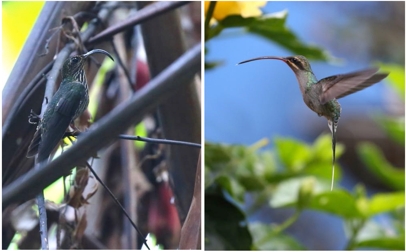
White-tipped Sicklebill (left) near El Valle and Green Hermit at the Cerulean Warbler Reserve (János Oláh).