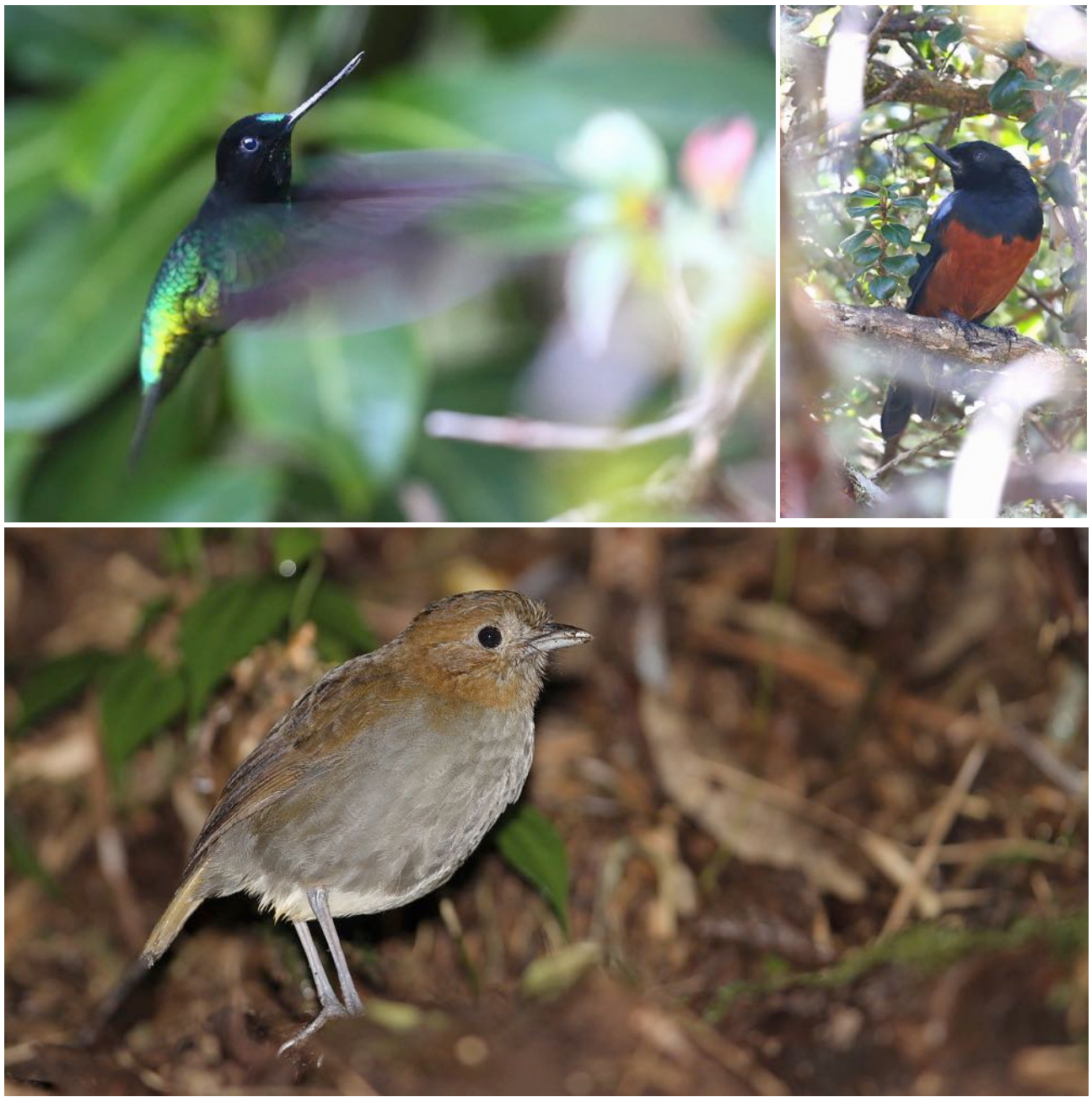
Dusky Starfrontlet (left), Chestnut-bellied Flowerpiercer (right) and Urrao Antpitta at the Colibri del Sol Reserve (János Oláh).

We were off early the following day in order to get all the way up to the paramo in the fantastically scenic Colibri del Sol Reserve. Just after we have returned from Colombia we heard the sad news that the reserve was closed down for unlimited time and perhaps we were the last birding group who entered this amazing area for some time! Getting there was a bit of challenge however! We had to take horses to be able to reach the paramo habitat in time as we had to ascend well over 800 meters of elevation. Not all of us considered ourselves great jockeys, but somehow got to the paramo! Suffice to say, we used the horses only for limited sections and mostly walked down the following day! At the Colibri del Sol Reserve once again we were driven on by rare endemic targets. Pride of place went to the amazing Dusky Starfrontlet which literally glowed from the undergrowth, but the Chestnut-bellied Flowerpiercers were nearly as good, though the Paramillo Tapaculo did not show to everybody all that well. The recently described endemic Urrao Antpittas were much appreciated the following morning. In amongst these goodies, we enjoyed a number of other high altitude species. The hummingbird feeders held a lovely selection including amazing Sword-billed Hummingbirds, Collared Inca, colourful Tourmaline Sunangels, Mountain Velvetbreast, stunning Long-tailed Sylphs, and numerous White-bellied Mountain Toucan, Streaked Tuftedcheek, a lovely Striped Treehunter,