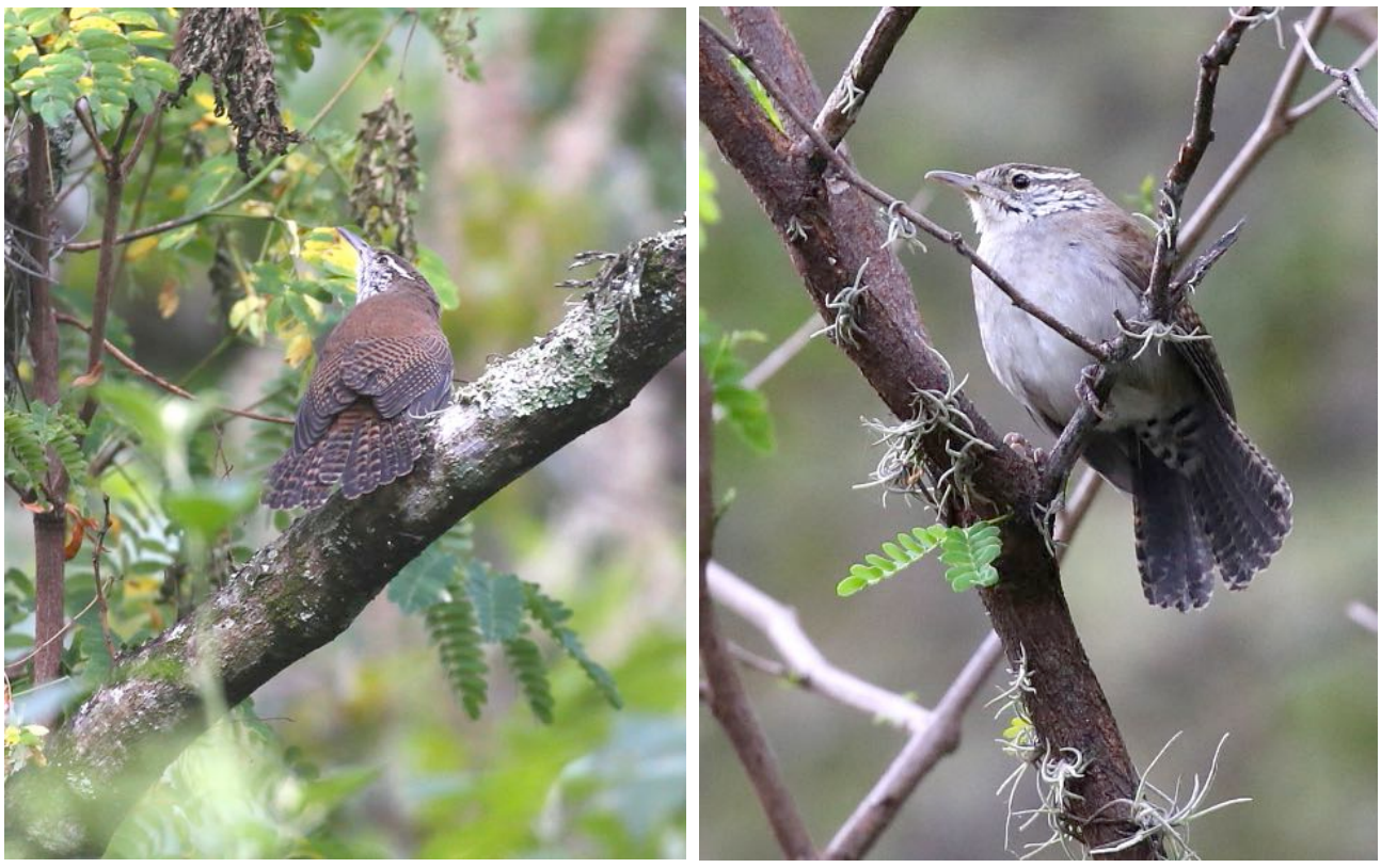
The rare endemic Niceforo's Wren near Soata.

Niceforo's Wren, Yellow-legged and Spectacled Thrushes, Cerulean and Mourning Warblers as well as Yellow-backed and Yellow-tailed Orioles. The various hummingbird feeders housed the endemic Indigocapped Hummingbirds as well as Green Hermits, Brown Violetear, (Violet) Crowned Woodnymphs, Andean Emeralds, Fawn-breasted and Green-crowned Brilliants and Buff-tailed Coronets. Later in the day we have visited the higher parts of the reserve where we spent some time around the wood quail feeders. Unfortunately no Gorgeted Wood Quails has been seen on the feeders for several month so our chances were slim. We had great looks of Lined Quail-Dove and Grey-cheeked Thrush as well as many Black Incas on the forest feeders but not a sniff of the wood quails. The forest was very quiet in the afternoon but at dusk we managed to see a fine male Lyre-tailed Nightjar and had absolutely amazing views of Cinnamon Screech-Owl. Stunning!