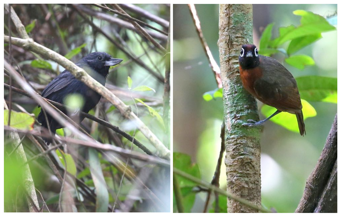
Male Recurve-billed Bushbird (left) and Chestnut-crested Antbird were highlights of the tour (János Oláh)!

Jet Antbird Cercomacra nigricans Good views of several birds at Laguna del Ato, en route to Libano.