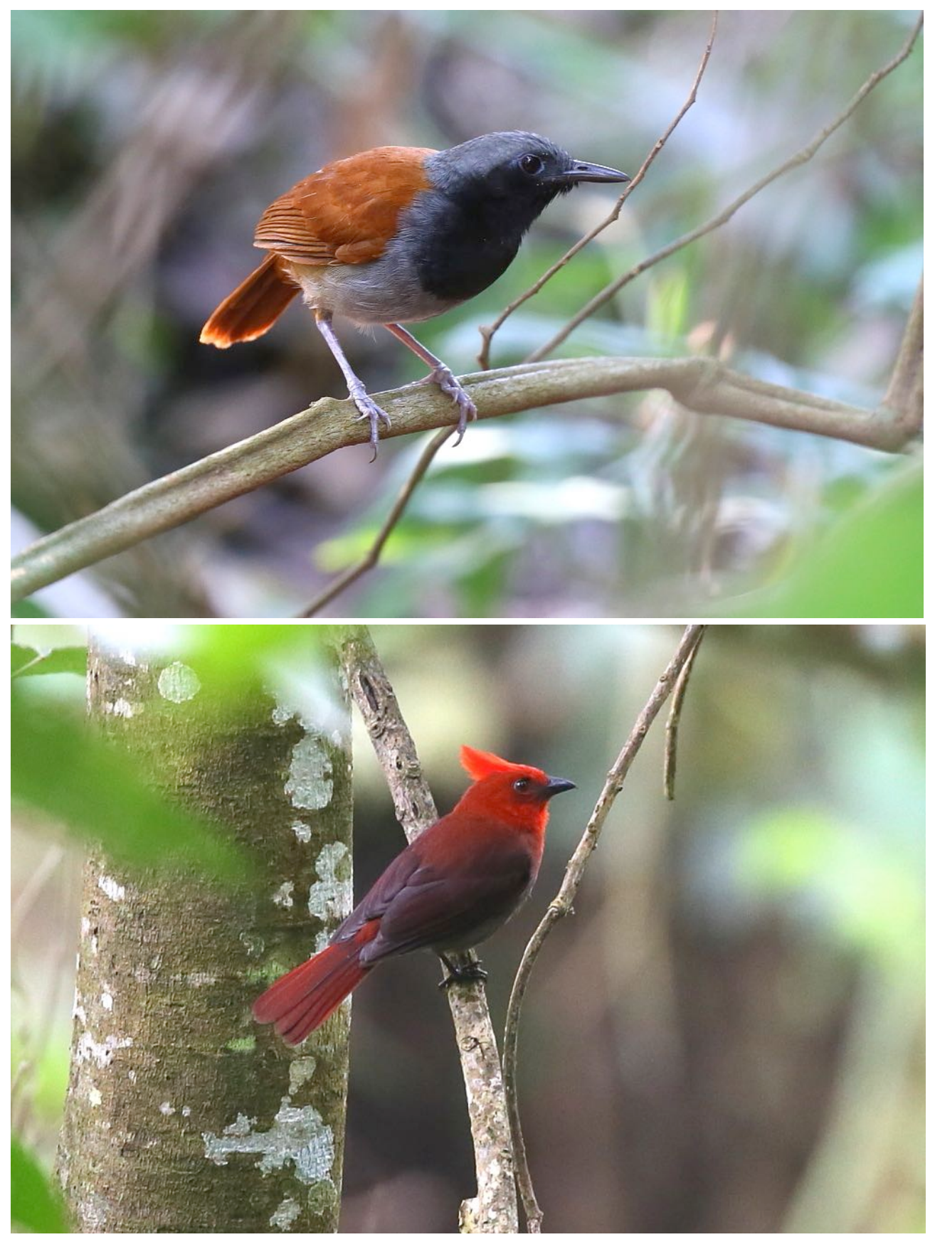
White-bellied Antbird (top) at Laguna del Ato and a male Crested Ant Tanager near Libano.