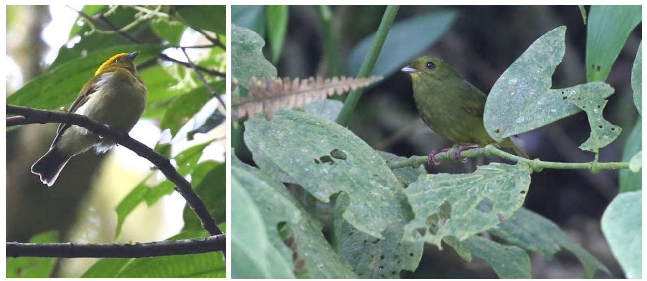
Yellow-headed Manakin (left) is a scarce specialty of Colombia; Golden-winged Manakin female.

Brown-headed Greenlet ◊ (E) Hylophilus brunneiceps Seen well in the Mitu area. Best looks at the Bocatoma trail. Rufous-naped Greenlet ◊ Hylophilus semibrunneus Seen well at several sites; first at the Cerulean Warbler Reserve. Dusky-capped Greenlet (E) Hylophilus hypoxanthus Just one was seen near Mitu. Scrub Greenlet Hylophilus flavipes A couple seen in the coffee below the Cerulean Warbler Reserve. Others heard. Lesser Greenlet Hylophilus decurtatus Seen at El Paujil [darienensis] and in the El Valle area [minor]. Violaceous Jay Cyanocorax violaceus A group of five were seen near Viallavicencio airport. Black-chested Jay Cyanocorax affinis Quite common. Best looks at El Paujil [affinis]. Azure-naped Jay ◊ (E) Cyanocorax heilprini Three sightings near Mitu [nominate].