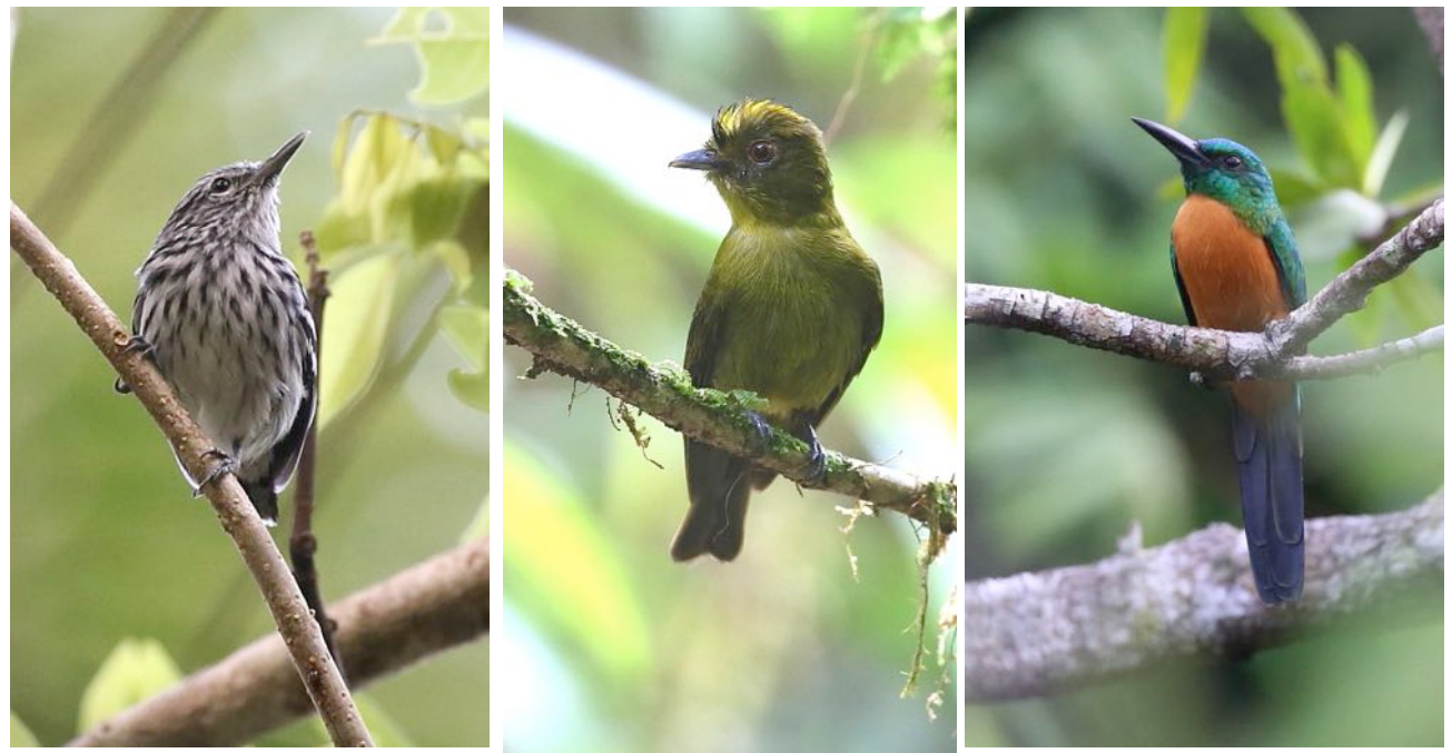
Pacific Streaked Antwren (left), Sapayoa (center) and Great Jacamar in the Utria National Park (János Oláh).

The following day we birded the access trail from El Valle to Utria National Park. Our number one primary target was to try and locate the endemic Baudo Oropendola. It is not a very common bird and it does need clearings in forested habitat. We began with a party of Grey-headed Chachalacas at dawn and more Grey-chested Doves on the path. Birding along the trail wasn't the easiest one, but we managed a number of