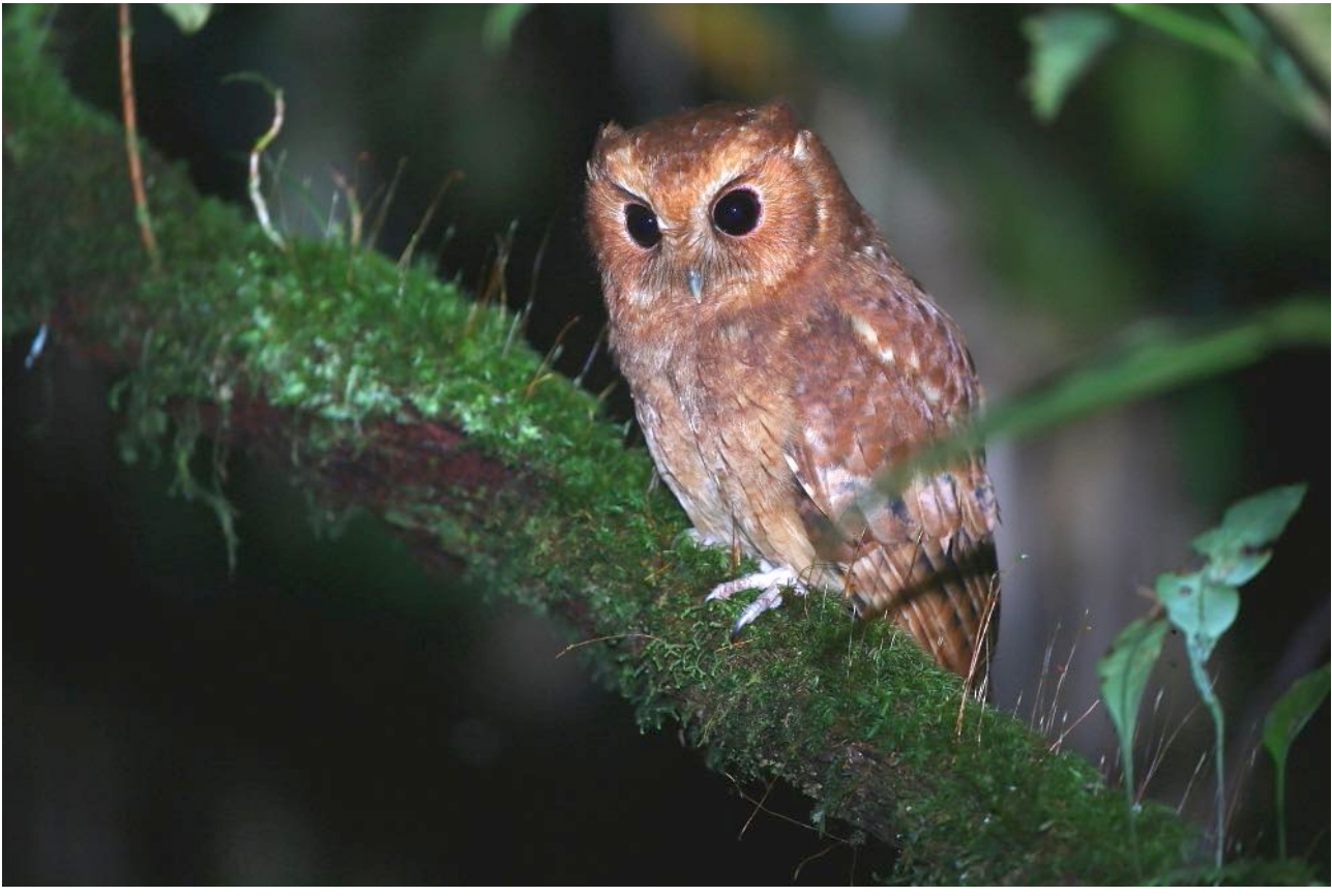
Cinnamon Screech-Owl in the Cerulean Warbler Reserve (János Oláh).

long journey towards Ocaña in the north. We made a short stop in some marshes where Northern Screamers were the highlights but we also had a Northern Scrub Flycatcher and various waterbirds.