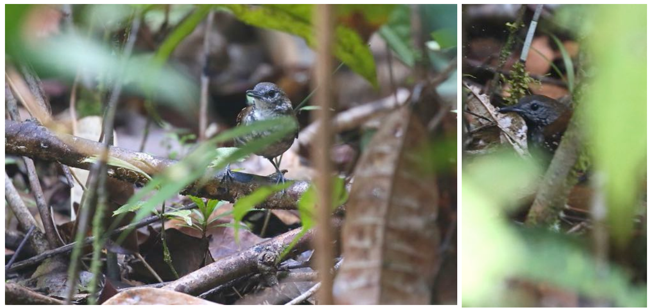
The rare Grey-bellied Antbird near Mitu. Female on the left and male on the right (János Oláh).

Black-faced Antbird (E) Myrmoborus myotherinus Two sightings around Mitu, a few others heard [elegans]. Imeri Warbling Antbird ◊ (E) Hypocnemis flavescens Good looks on the extension near Mitu [nominate]. Yellow-browed Antbird (E) Hypocnemis hypoxantha Great views of this smart one near Mitu [nominate]. Black-chinned Antbird (E) Hypocnemoides melanopogon A pair was seen well at Urania near Mitu [occidentalis]. Bare-crowned Antbird ◊ Gymnocichla nudiceps Great views at El Paujil. Superb! [sanctamartae]. Silvered Antbird (E) Sclateria naevia A male seen at Pueblo Nuevo, Mitu [argentata]. Black-headed Antbird (E) Percnostola rufifrons A pair showed very well at Pueblo Nuevo near Mitu. White-bellied Antbird Myrmeciza longipes Excellent views of a male at Laguna del Ato, en route to Libano [boucardi]. Chestnut-backed Antbird Myrmeciza exsul Seen well at El Paujil and heard in the El Valle area [cassini]. Magdalena Antbird ◊ Myrmeciza palliata (H) Just heard below the Bellavista Reserve, La Victoria. NT Grey-bellied Antbird ◊ (E) Myrmeciza pelzelni Brilliant views of a terrestrial pair near Mitu.