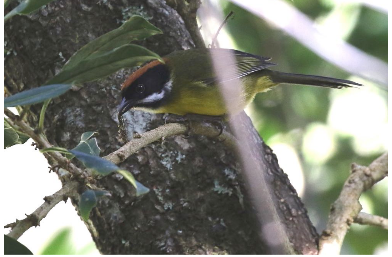
Moustached Brush Finch above Soata (János Oláh).

Slaty Brush Finch Atlapetes schistaceus A family party were seen at Colibri del Sol [nominate].