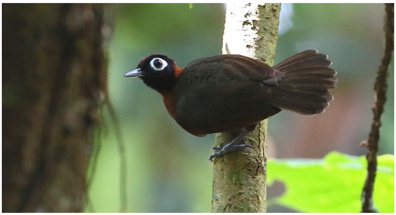
Female Chestnut-crested Antbird was one of the highlights of the extension to Mitu (János Oláh).

chinned, Imeri Warbling, Yellow-browed, Silvered, Black-headed, Black-throated, Spot-backed and Common Scale-backed Antbirds. We came across two tiny antswarms where we saw White-cheekd Antbird and some of us also had the gorgeous White-plumed Antbird. Elsewhere in the mixed flocks we found Lemon-throated Barbet, Scaly-breasted, Woodpecker, Cinnamon-rumped and Olive-backed Foliage-gleaners, Slender-billed Xenops, Amazonian Barred and Elegant Woodcreepers, Grey Elaenia, Double-banded Pygmy Tyrant, Yellow-throated and palm-loving Sulphury Flycatchers as well as Fulvous Shrike-Tanager.