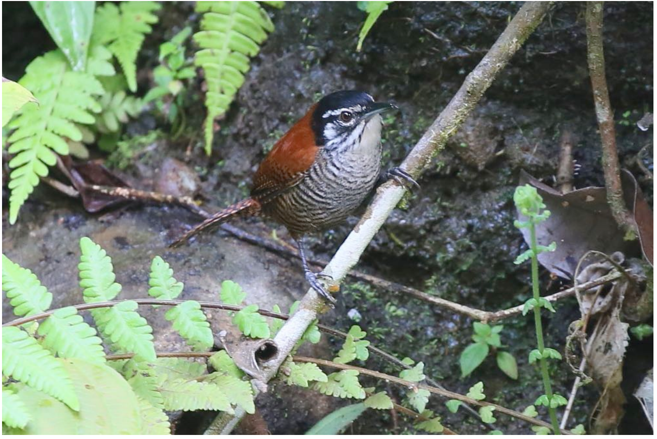
Bay Wren showed very wellnear Victoria (János Oláh)!

Bay Wren Cantorchilus nigricapillus Common (by voice at least), Seen near Victoria and in the El Valle area [schottii].