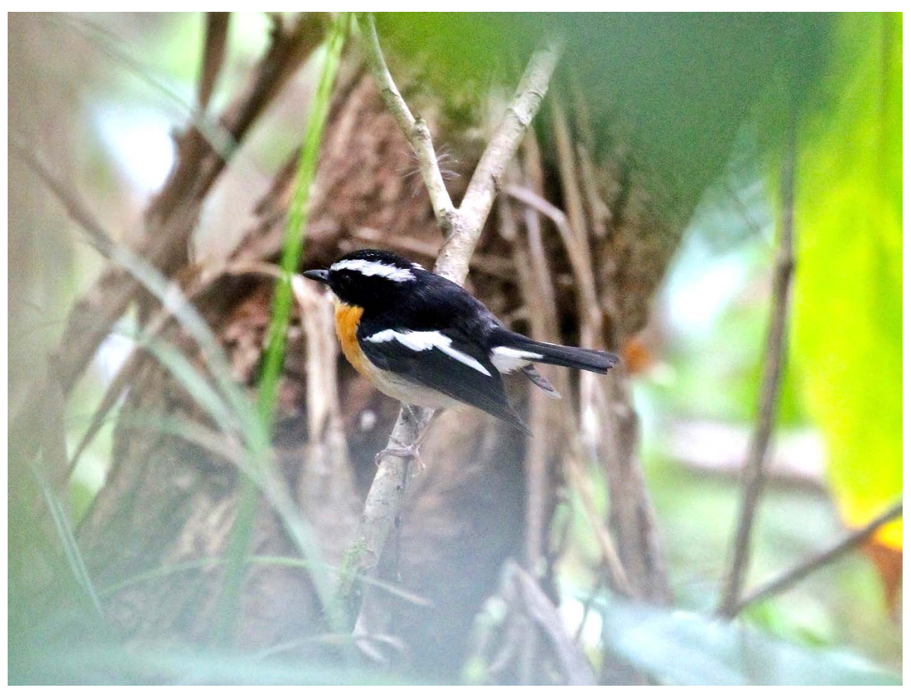
Tanimbar Flycatcher

further potential split, with the three forms seen on this tour constituting a different species: Clementia's Sunbird, which would retain the scientific name C. clementiae .