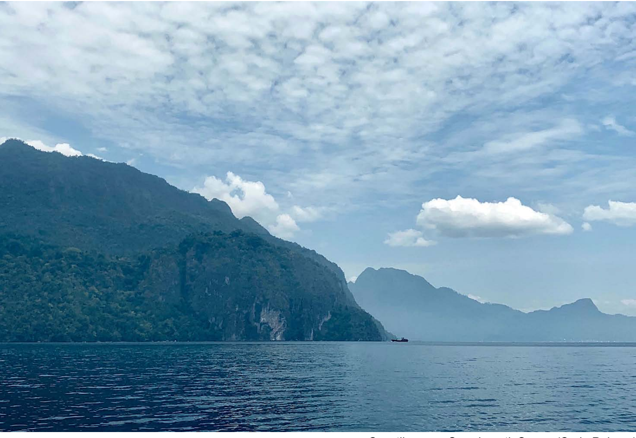
Coastline near Sawai, north Seram (Craig Robson)

Eastern Yellow Wagtail (Alaska W) Motacilla [tschutschensis] tschutschensis Small numbers at Ewang Suli.