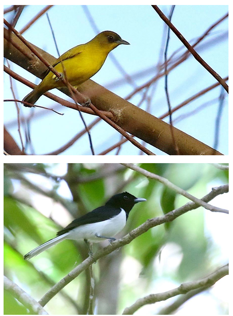
Golden-bellied White-eye and White-tailed Monarch on Kai Kecil

Due to relatively rough seas, our visit to Kai Besar was made on the scheduled passenger ferry this year. It was a very comfortable trip but it did restrict our time on the island somewhat. It was not to be a problem however, as we easily located the endemic Pearl-bellied (or Great Kai or Kai Besar) White-eye, which is common and easily seen, and made a record-breaking ascent of the trail behind Bukit Indah Mission in order to see Kai Leaf Warbler, a very distinctive split from Island Leaf Warbler.