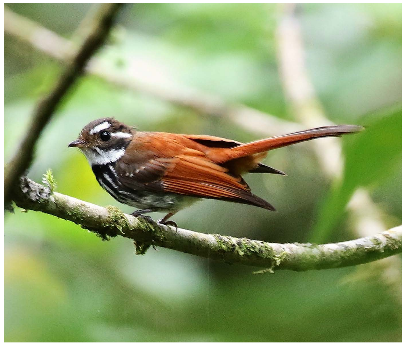
Streak-breasted Fantail (Craig Robson)