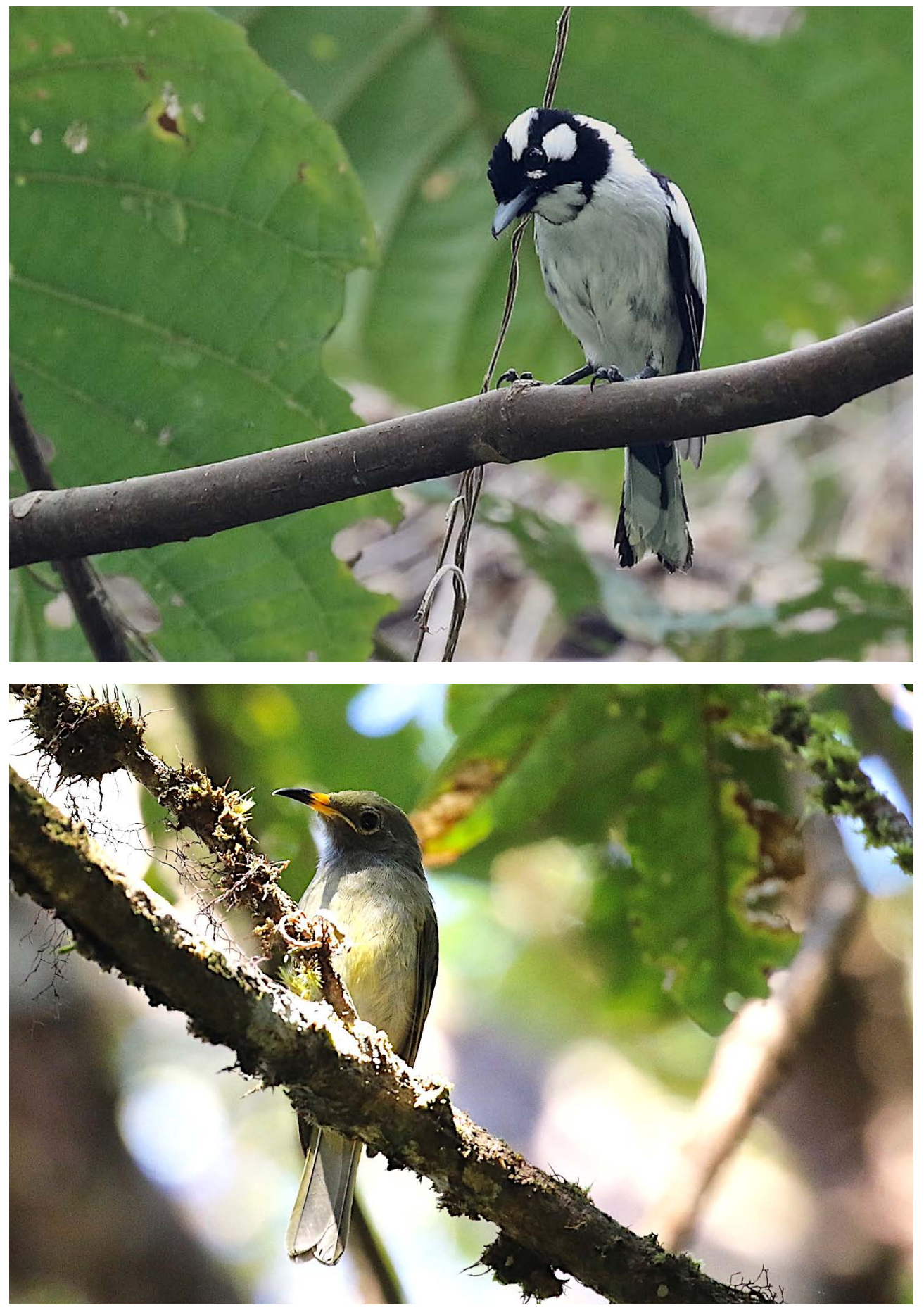
White-naped Monarch and Buru Honeyeater (Craig Robson)