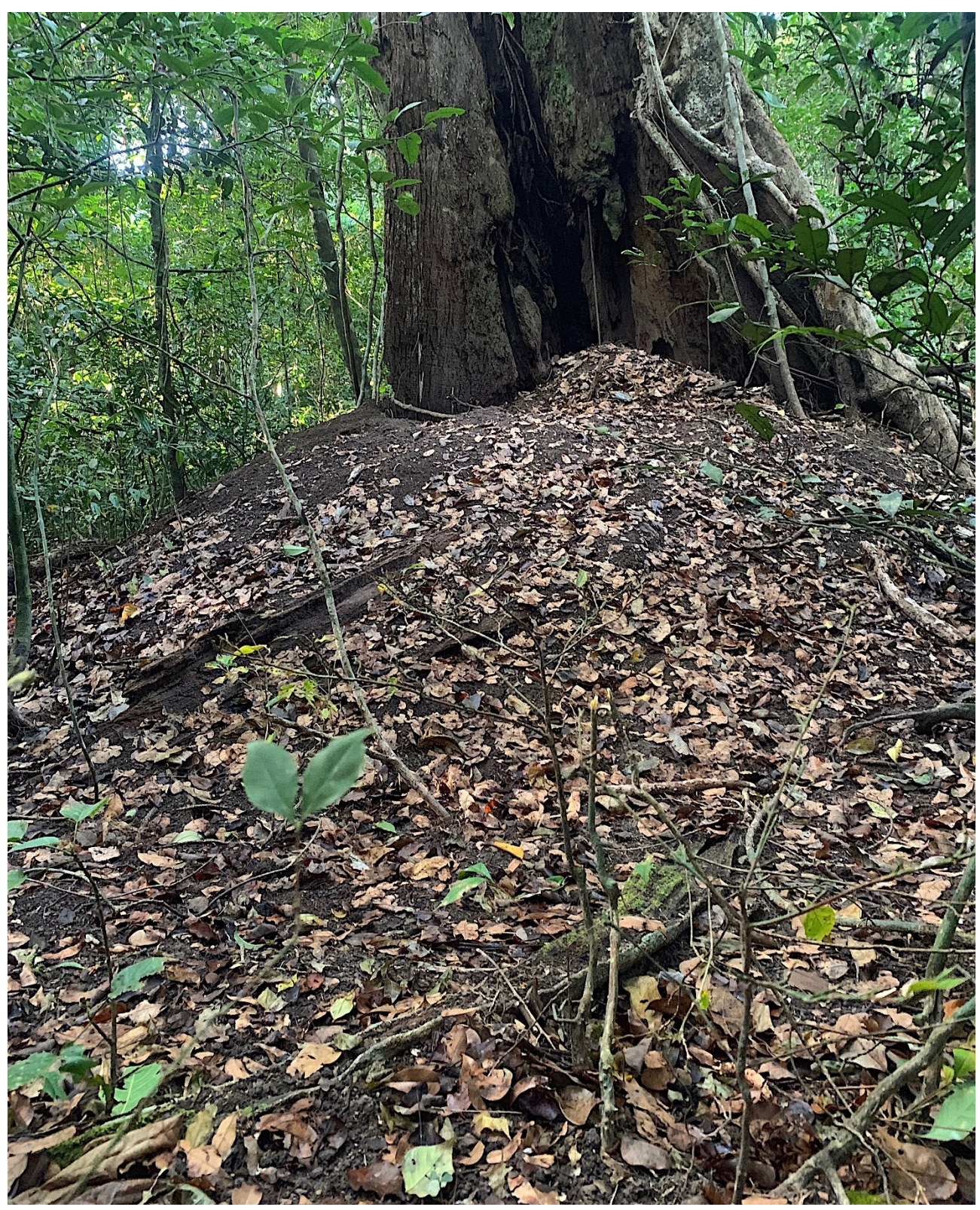
Tanimbar Megapode nest-mound

Mistletoebird. Along the Airport road and it's side-trails (one of the island's best birding areas now), we added the very pale local form of Variable Goshawk, Yellow-capped Pygmy Parrot, Elegant Pitta, Greyheaded Whistler (split from Grey), the unique local race of Drab Whistler, and the rather secretive White-tailed (or Kai) Monarch. Conditions were very dry once more, so it was a moister site that produced our only Papuan Pittas of the tour.