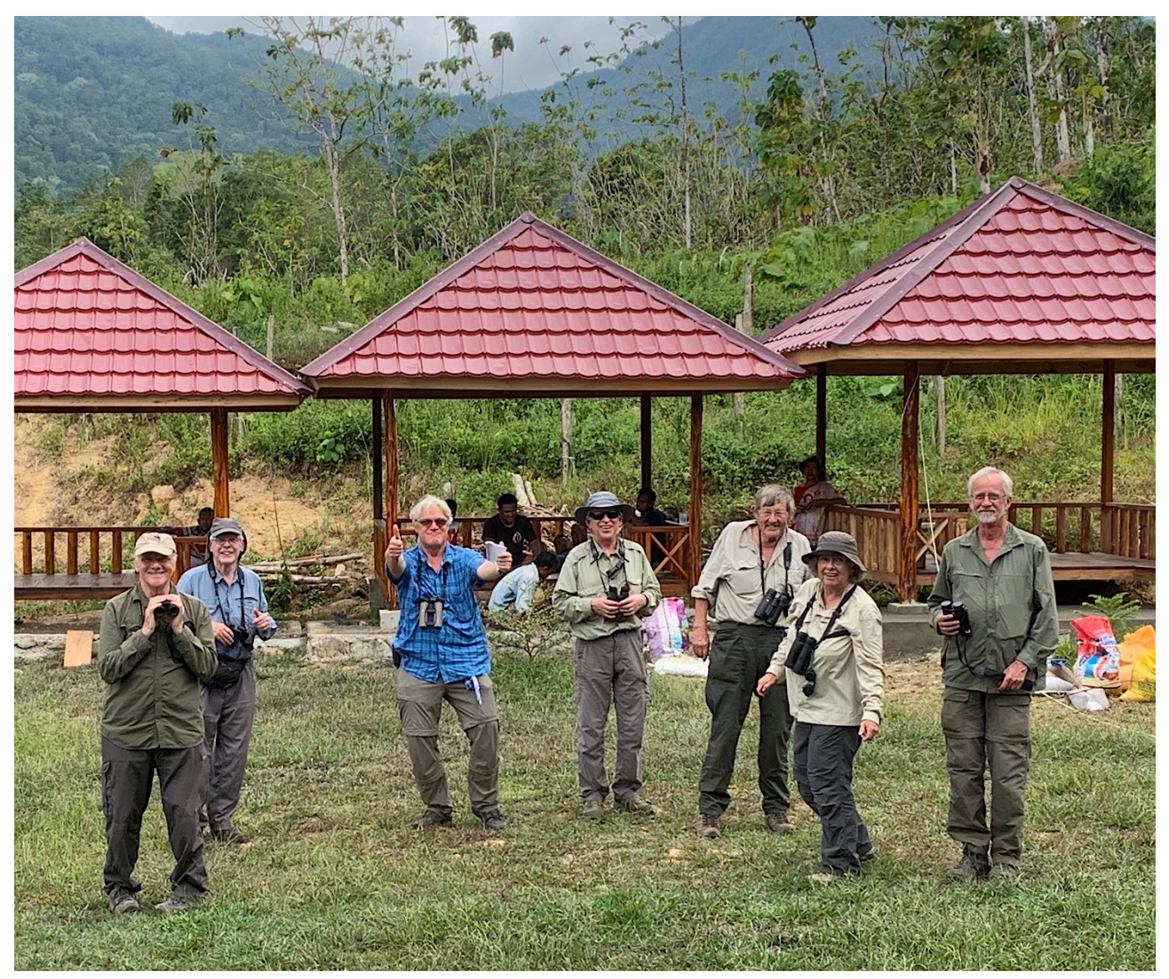
Lunch break on Seram

Grey Duskhawker Gynacantha rosenbergi Several on Kai Kecil, including a mating pair. Common Blue Skimmer Orthetrum glaucumi Seram. Green Skimmer Orthetrum serapia Widespread. Ramburi Red Parasol (Red Pondhawk) Neurothemis ramburii Widespread. Potbellied Elf Risiophlebia dohrni Seram.