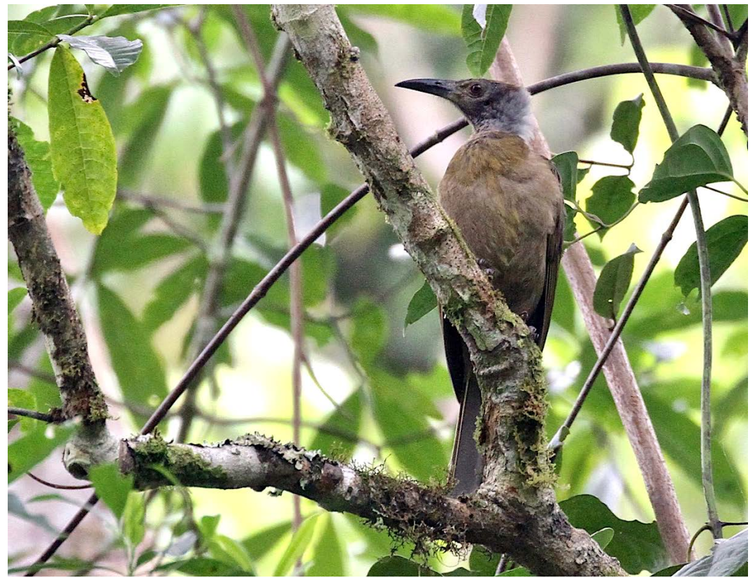
Seram Friarbird

it's choice of a densely vegetated steep ravine left us little hope of seeing it. There was some consolation in the form of good views of Seram Bush Warbler (a split from Chestnut-backed). Multiple night-time forays brought some great views of Seram Boobook (split from Hantu), as well as Moluccan Scops Owl, but the local form of Moluccan Masked Owl was a heard-only again.