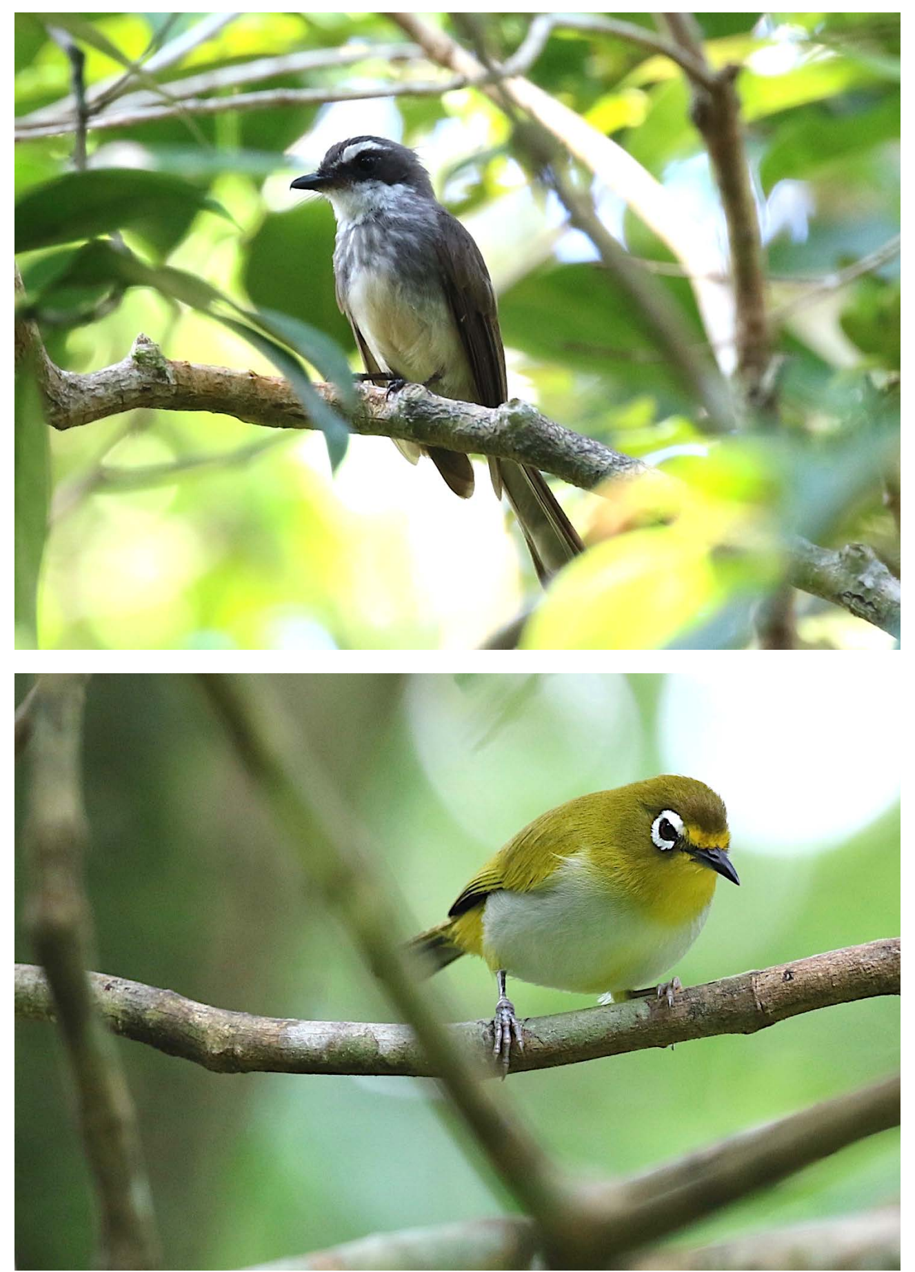
Kai Fantail (potential split from Northern) and Pearl-bellied White-eye (Craig Robson)