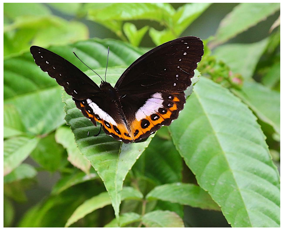
Eight-spot Diadem Hypolimnas pandarus on Seram (Craig Robson)

Common Green Birdwing Ornithoptera priamus Superb female on Kai Kecil. Probably elsewhere too. Grass yellow sp. Eurema candida Ambon. Vibrant Sulpher Hebomoia leucippe Ambon. Psyche Leptosia nina Yamdena and Kai. Orange Bush-brown Mycalesis terminus Common. Buru (wakolo), Ambon & Seram (remulia). Urania Owl Taenaris urania Seram (urania). Eastern Red Lacewing Cethosia cydippe Seram. Blue-banded Eggfly Hypolimnas alimena Kai Kecil. Great Eggfly Hypolimnas bolina Yamdena. Eight-spot Diadem Hypolimnas pandarus A real beauty: Buru (pandora); Seram (nominate). Tailed Emperor Polyura pyrrhus Buru. 'Cramer's Rustic' Cupha crameri Kai Kecil. Malay Cruiser Vindula dejone Buru (buruana). Lurcher Yoma sabina Common on Kai Kecil. Clipper Parthenos sylvia Seram. Chocolate Argus (C Soldier, Brown S) Junonia hedonia Ambon (nominate) and Kai (zelima). Orange Plane Pantoporia consimilis Kai Kecil. Cairns Hamadryad Tellervo zoilus Kai Kecil. Eastern Yellow Glassy Tiger Parantica cleona Seram at least. Striped Tiger (Orange Tiger) Danaus genutia Ambon (? ssp.), Yamdena (laratensis) at least. Climena Crow Euploea climena Widespread. Rice Paper Butterfly ('Moluccan' Tree Nymph) Idea idea This beauty was seen on Ambon and Seram (nominate). Transparent 6-Lineblue Nacaduba kurava Kai Kecil (cerbara).