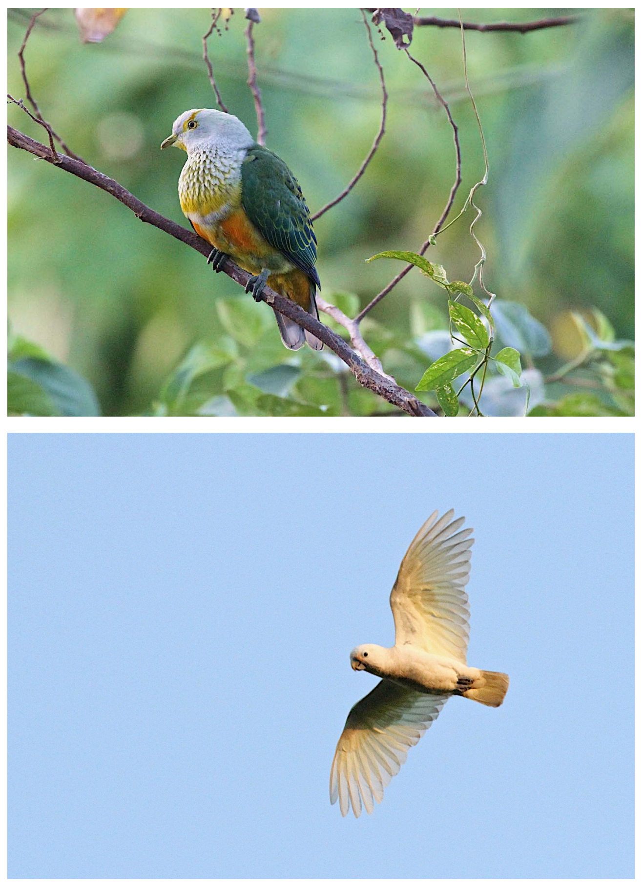
Rose-crowned Fruit Dove (subspecies xanthogaster) and Tanimbar Corella on Yamdena