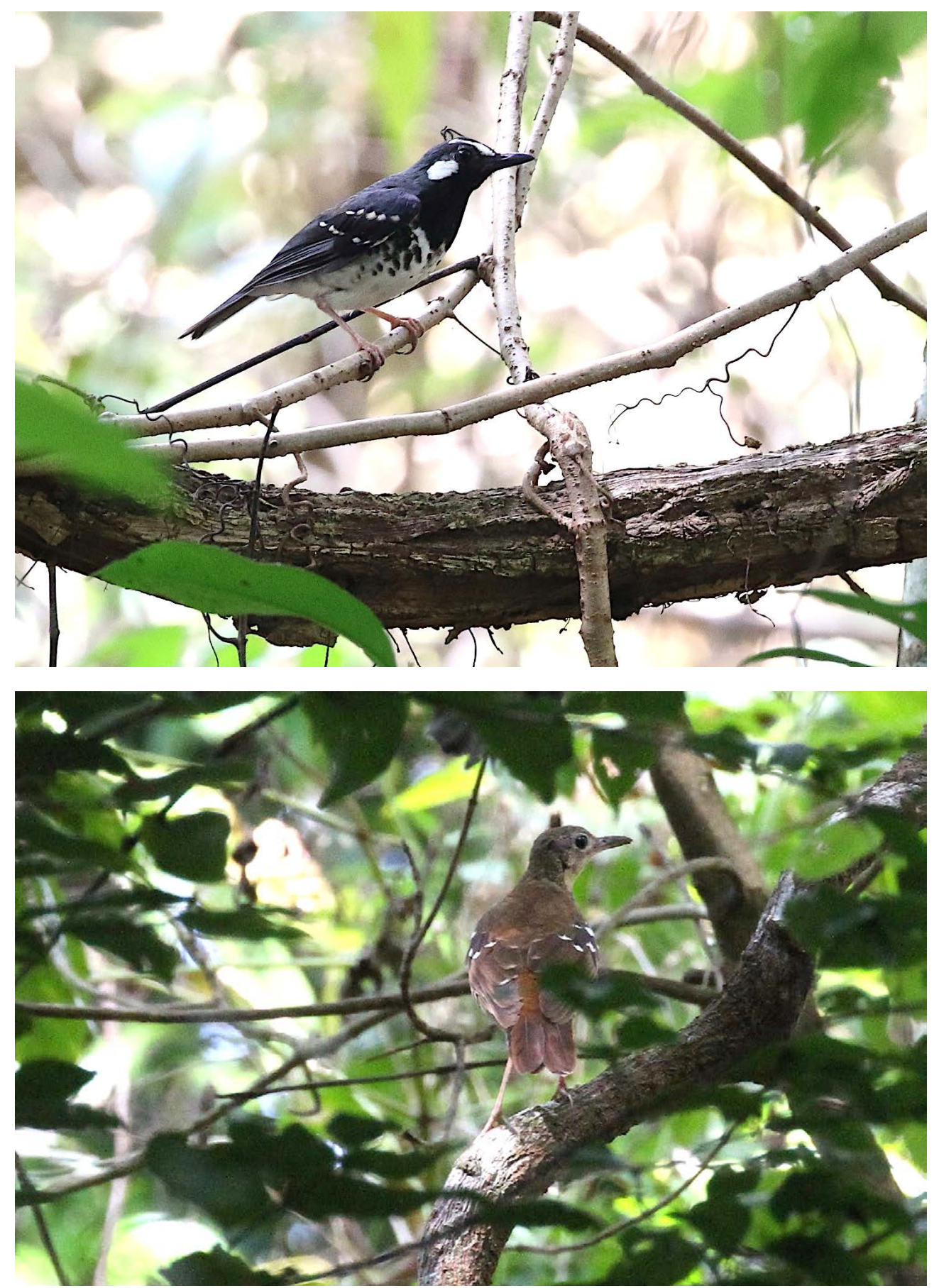
Slaty-backed Thrush (Craig Robson) and Fawn-breasted Thrush (Rainer Seifert) on Yamdena