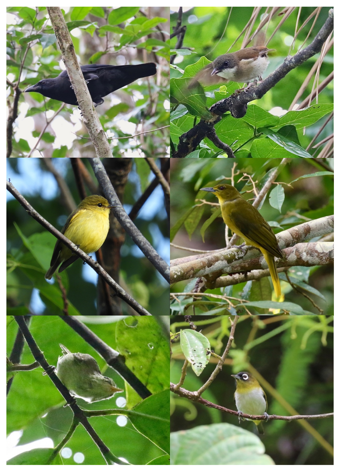
Clockwise from top left: Violet Crow, Island Whistler, 'Ambon' Golden Bulbul, Seram White-eye. 'Kai' Leaf Warbler (all Craig Robson), and Golden-bellied Flyrobin (Ian Lewis)