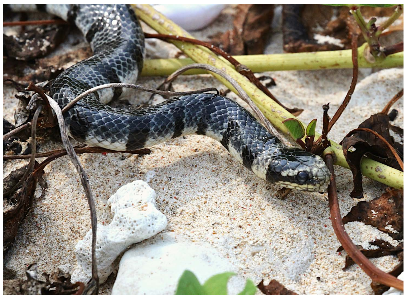
Yellow-lipped Sea Krait (Rainer Seifert)

Hawksbill Sea Turtle Eretmochelys imbricata One off Pulau Lusaolate. Apparently the only sea turtle off Seram. Yellow-lipped Sea Krait (Banded S K) Laticauda colubrina One slithered down to the shore on Pulau Lusaolate. Seram Scrub Python (Southern Moluccan P) Simalia clastolepis 1 on road Sawai foothills, Seram; c.3.5m long.