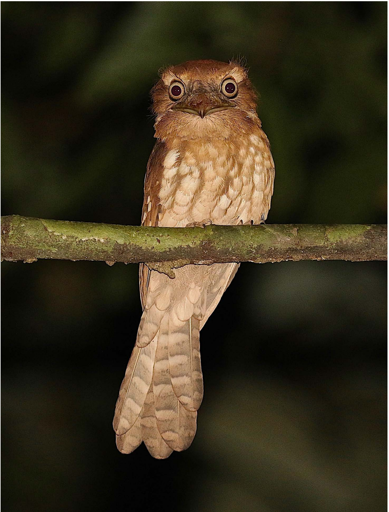
Gould's Frogmouth at Taman Negara

Our accommodation this year was right next to the western boundary of the forest and, as dusk approached, we had great views of a Malaysian Eared Nightjar close overhead.