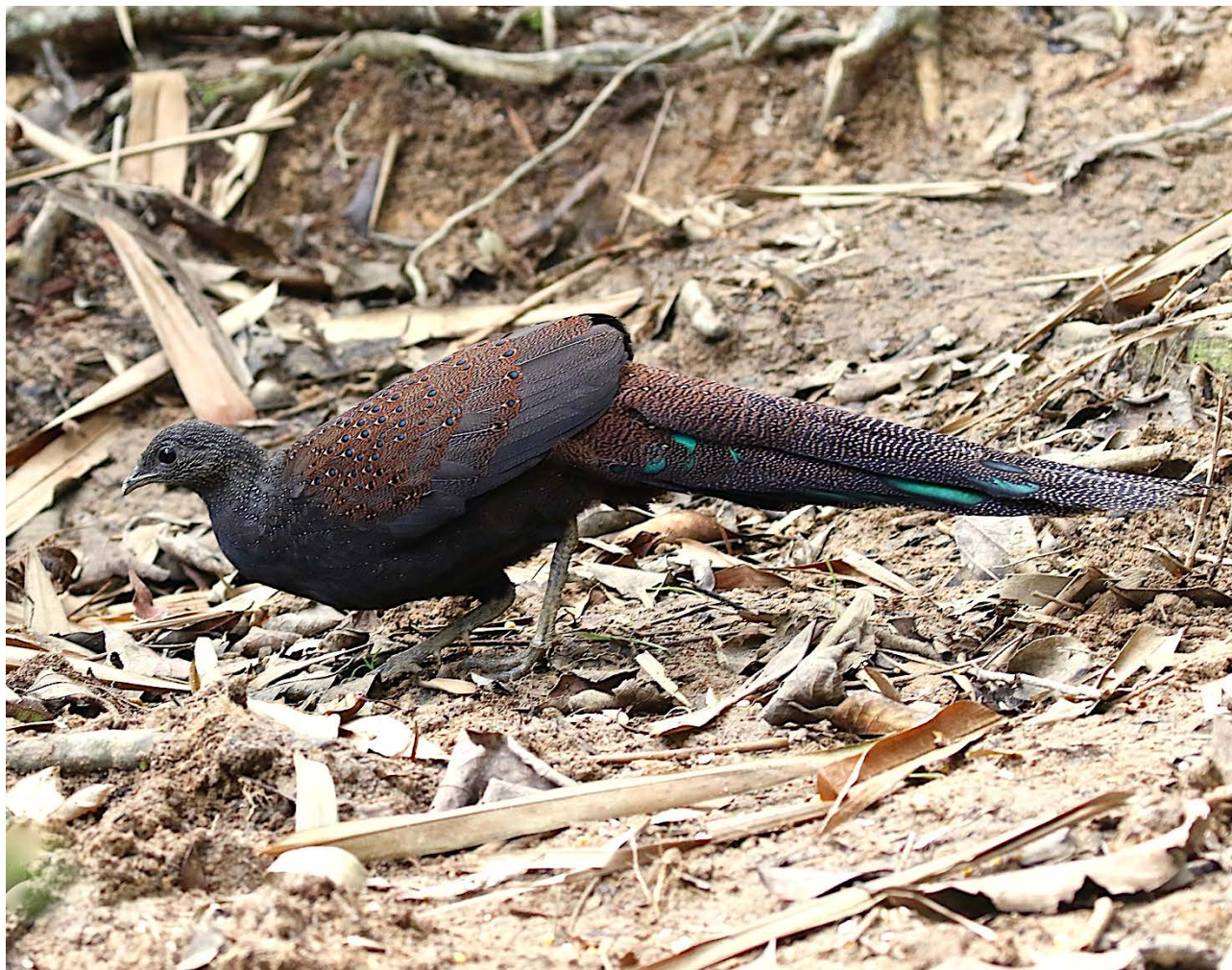
Mountain Peacock-Pheasant (Craig Robson)

Mountain Peacock-Pheasant Polyplectron inopinatum Incredible views of two at Bukit Tinggi.