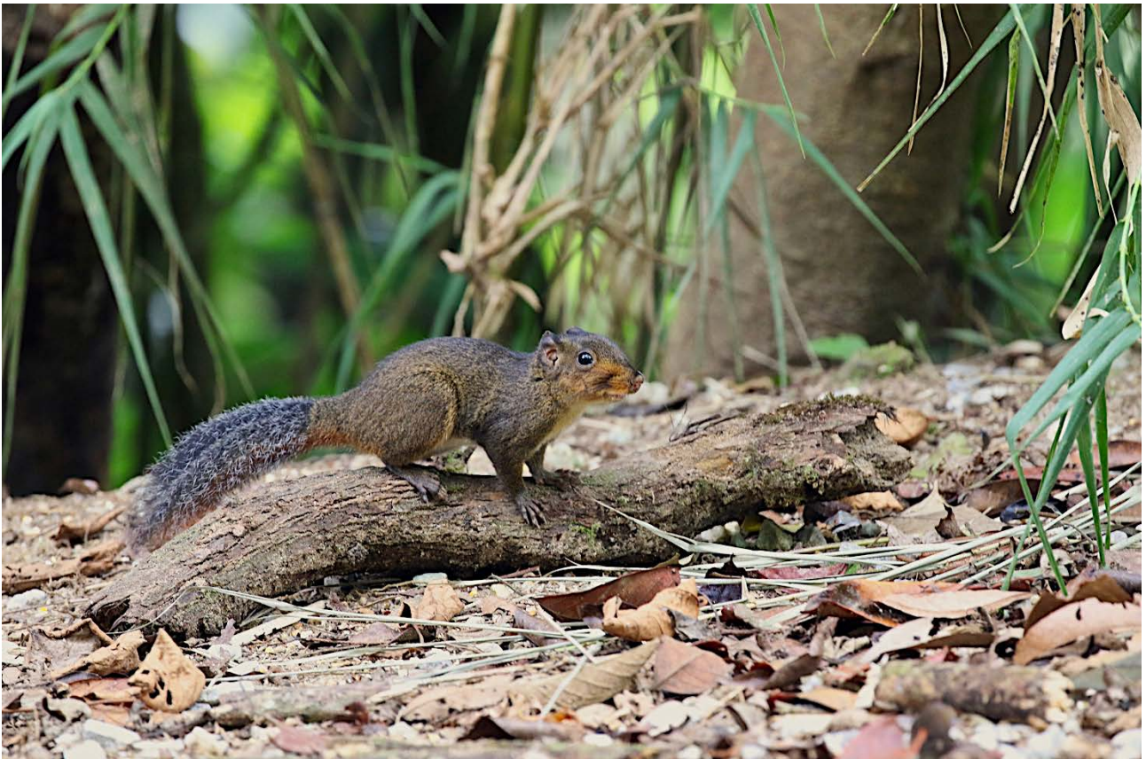
Asian Red-cheeked Squirrel (Craig Robson)

Lesser Sheath-tailed Bat Emballonura monticola Small roosting colony at Pantii Forest; c.30.