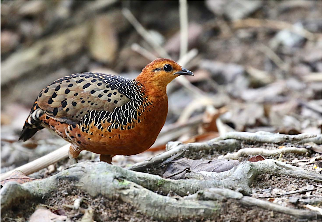
Ferruginous Partridge (Craig Robson)

to nearby hill forest in search of our main target birds here: the endemic Mountain Peacock-Pheasant and equally lovely, though more widespread Ferruginous Partridge. With an afternoon and morning at our disposal, we were able to sit in wait and obtain superb prolonged close views of both species, a real treat. There were many other interesting species here too. Predawn, we soon spotlighted a calling Blyth's Frogmouth and, later in the morning, we added Red-billed Malkoha, a noisy flock of Bushy-crested Hornbills, Orange-breasted Trogon, Grey-and-buff and Buff-rumped Woodpeckers, a small flock of Silver-breasted Broadbills, Scaly-breasted, Grey-bellied, and Ochraceous Bulbuls, Brown Fulvetta, and more Hume's White-eyes.