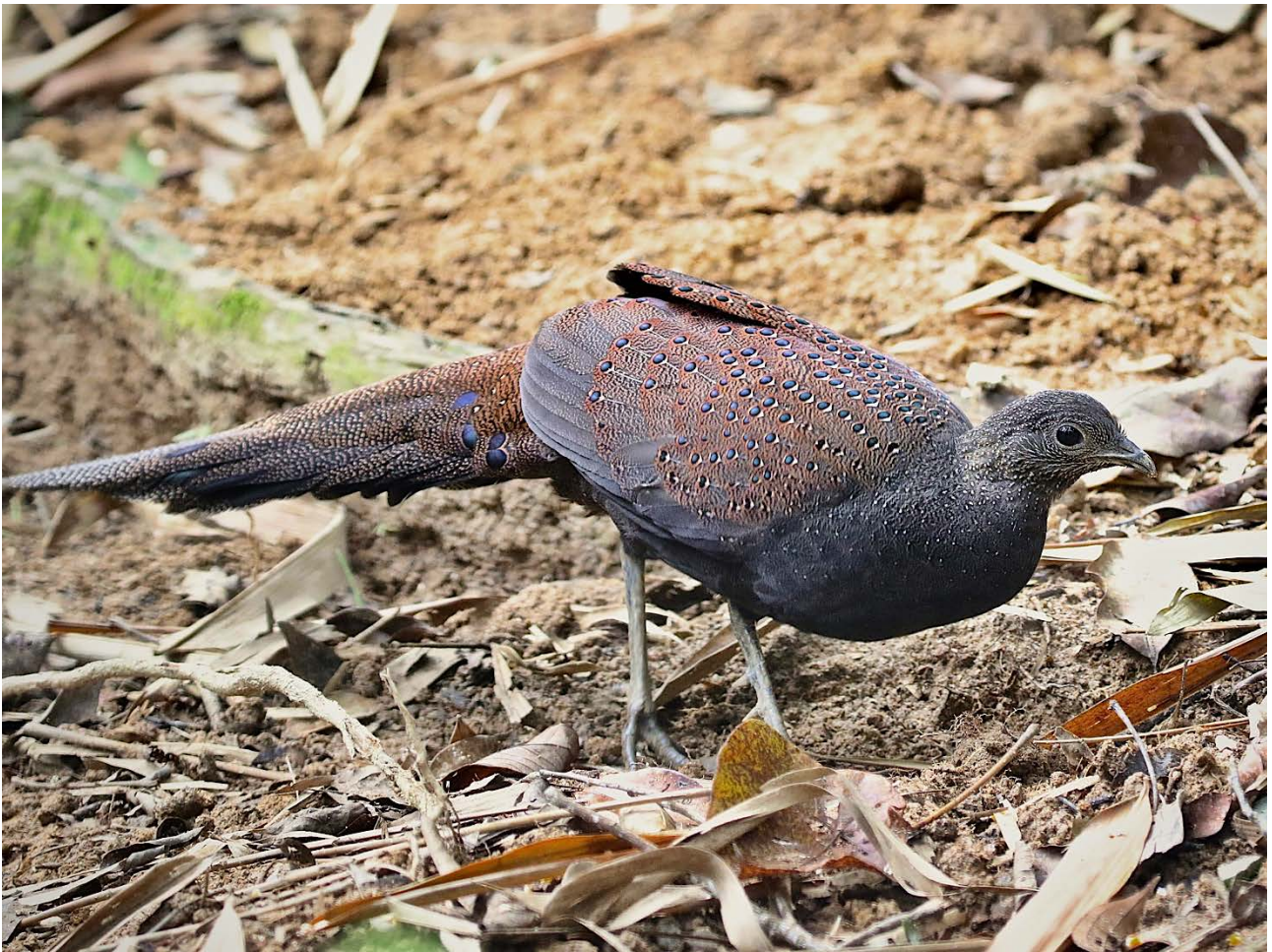
Mountain Peacock-Pheasant (Craig Robson)