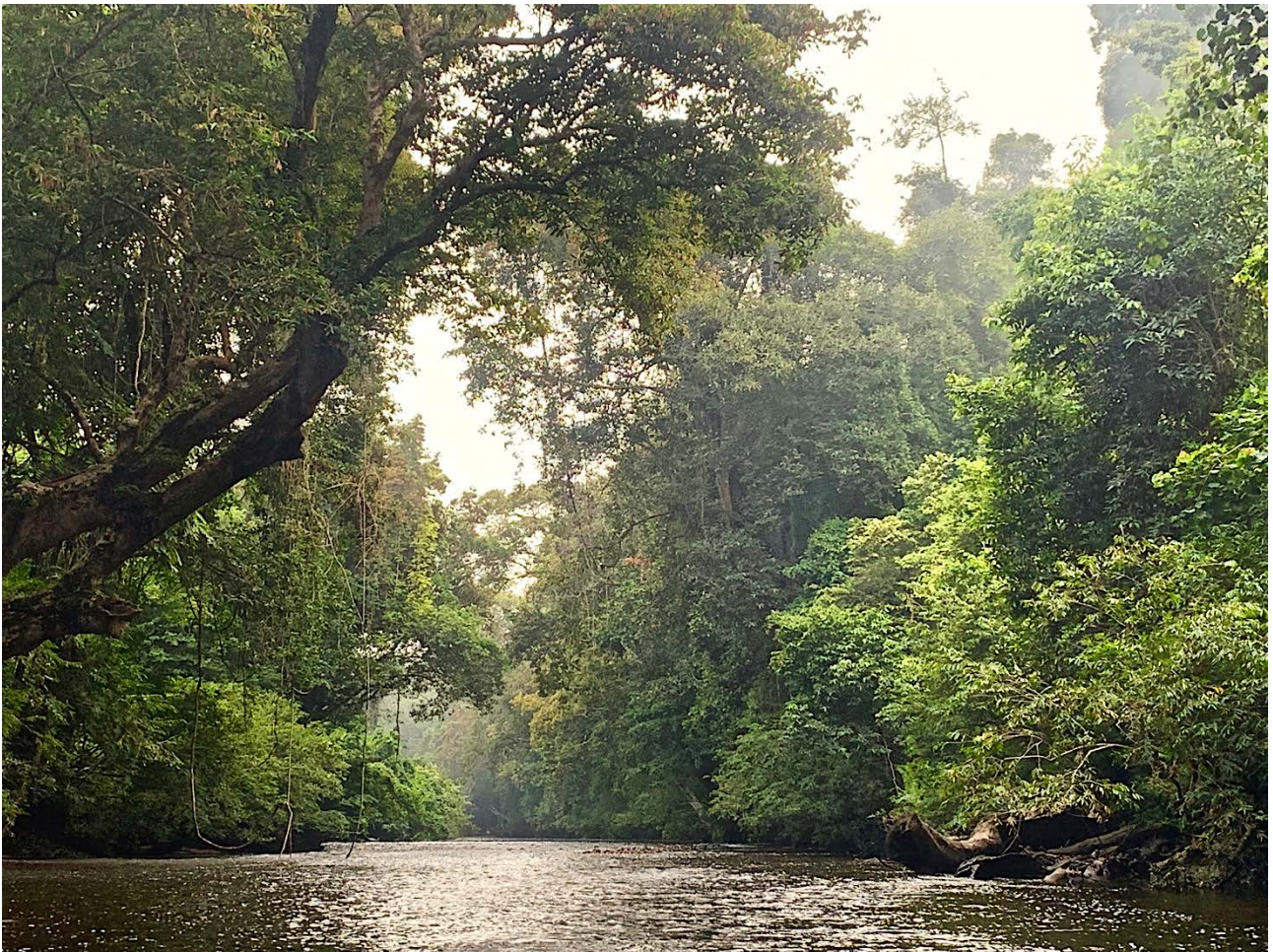
The Sungei Tahan, at Taman Negara

Leaving Taman Negara behind, we made our longest drive of the tour, which took us south to the state of Johor and the renowned Panti Forest, for the post-tour extension. Passing the entrance to the famous Bunker Trail on our way to the hotel near Kota Tinggi, excitement mounted in anticipation of the next days' birding.