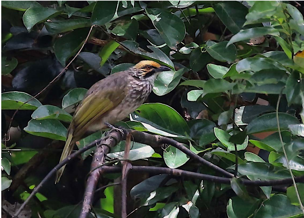
Straw-headed Bulbul at Taman Negara (Craig Robson)

Grey-cheeked Bulbul Alophoixus bres Three at Taman Negara, but tricky to get onto ( tephrogenys ). Yellow-bellied Bulbul Alophoixus phaeocephalus Small numbers at Taman Negara and Panti Forest. Hairy-backed Bulbul Tricholestes criniger Not uncommon at Taman Negara and Panti Forest. Buff-vented Bulbul Iole crypta One of the commonest bulbuls in lowland forests ( crypta ).