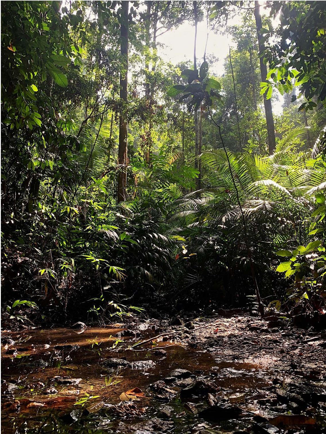
Forest stream at Taman Negara

Our time was soon up on this relatively short tour, and we headed back to Kuala Lumpur to catch our respective flights home or relax overnight before a flight the following day.