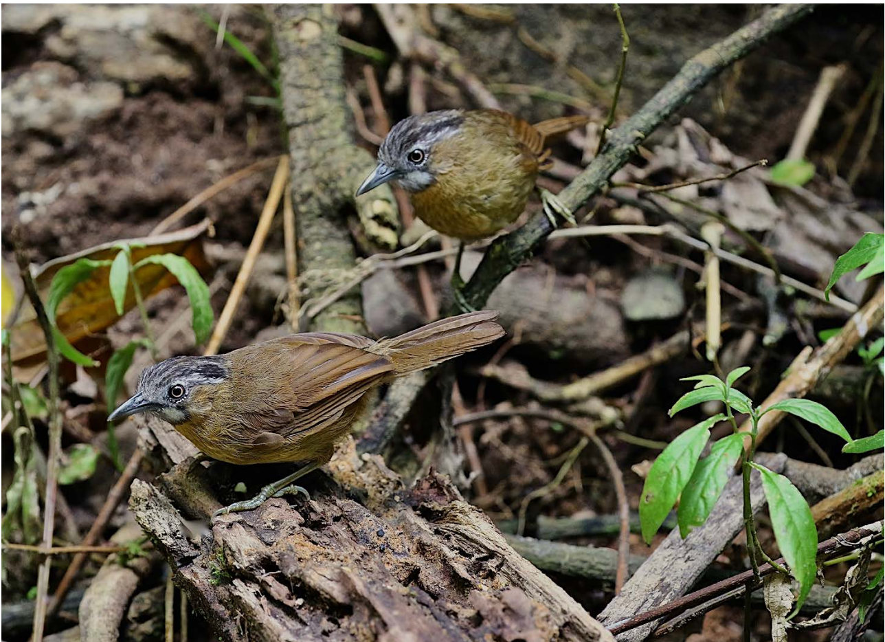
'Southern' Grey-throated Babblers (Craig Robson)

It was a relatively short and easy drive to our next birding location at Bukit Tinggi. Based at the astonishing if not bizarre Colmar Tropicale resort, a mock medieval French village, we only had to travel a short distance