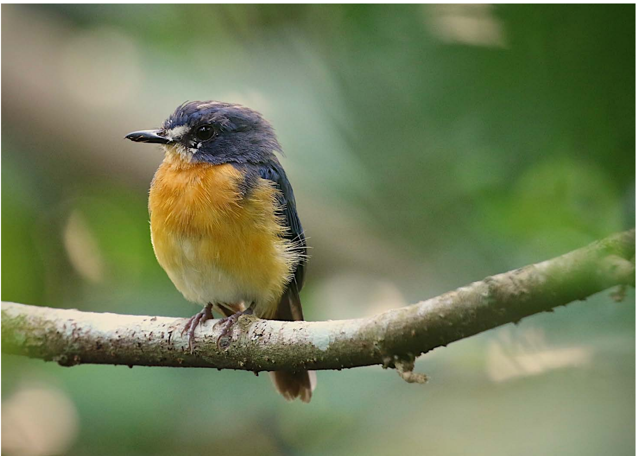
Mangrove Blue Flycatcher (Craig Robson)

After meeting up and then departing from Kuala Lumpur airport, it was only a fairly short drive to our first birding location at Kuala Selangor. Exploring the site either side of lunch at our nearby hotel, and also on the following morning, we birded a network of trails through the recovering mangrove ecosystem. Here we notched-up the usually scarce and retiring Chestnut-bellied Malkoha, Swinhoe's White-eye (split from Oriental/Japanese), and some smart Mangrove Blue Flycatchers, as well as Changeable Hawk-Eagle, lots of Pink-necked Green Pigeons and Olive-winged Bulbuls, Mangrove Whistler, Golden-bellied Gerygone, Cinereous Tit, and Ashy Tailorbird. Laced Woodpecker and Common Flameback were both very showy, while the attractive Silvered Langur was as confiding as ever, and we were also lucky enough to see Smooth-coated Otter. After a barbeque dinner at our hotel, a Sunda Scops Owl (or Collared, taxonomy-dependant) was seen really well by our cabins.