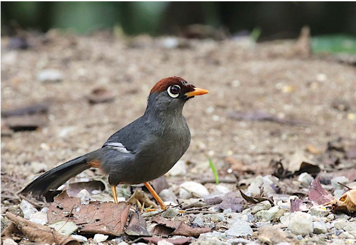
Pygmy Cupwing and Chestnut-capped Laughingthrush at Fraser's Hill (Craig Robson)