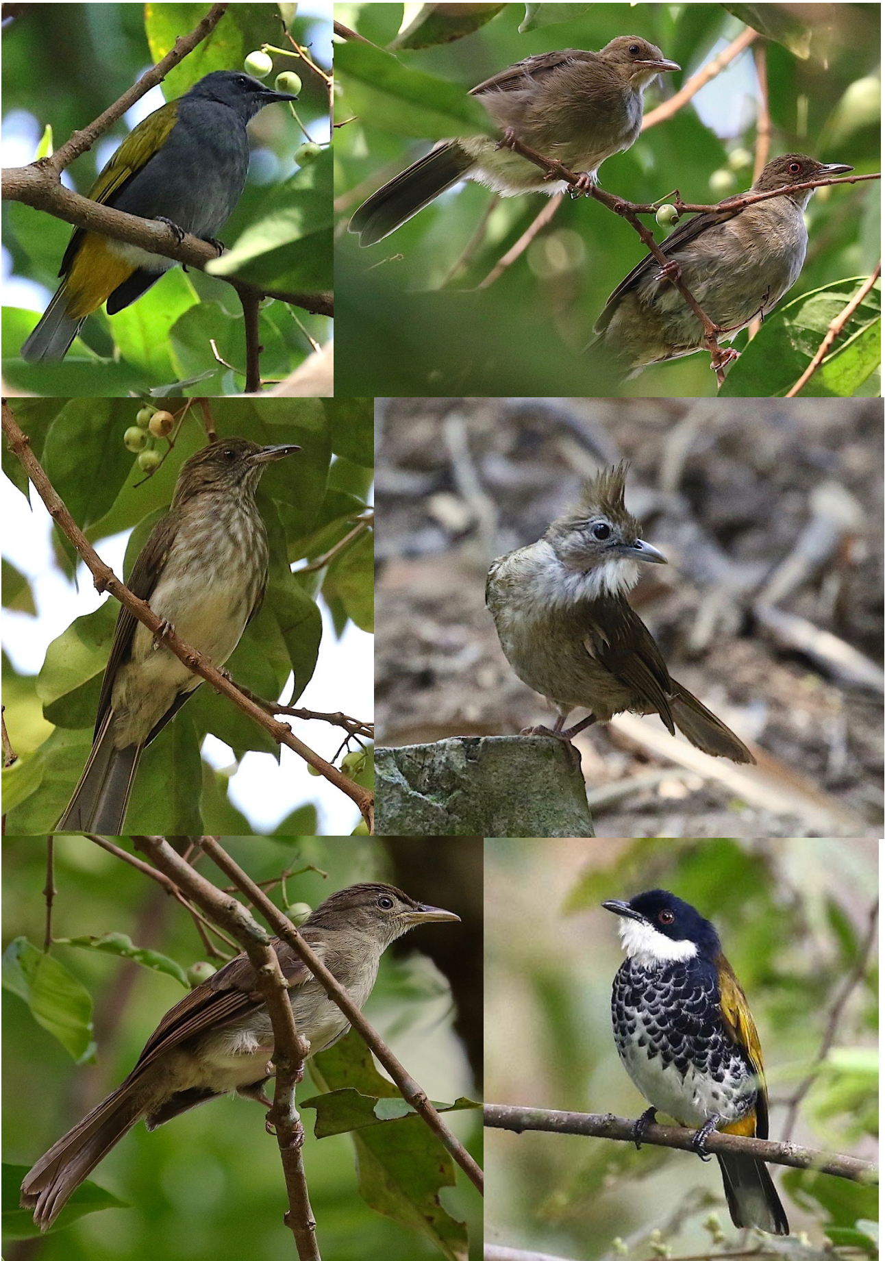
Bulbuls (clockwise): Grey-bellied, Asian Red-eyed, Ochraceous, Scaly-breasted, Buff-vented, Streaked (Craig Robson)