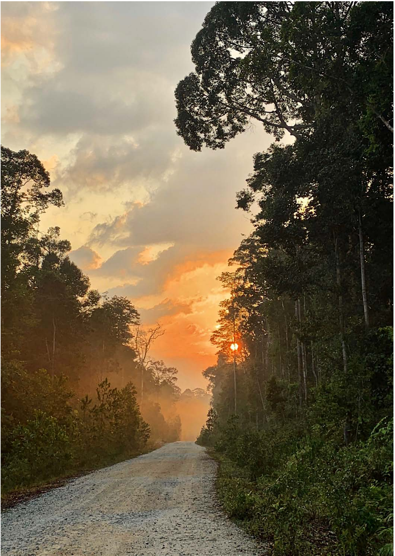
Sunrise at Panti Forest (Craig Robson)