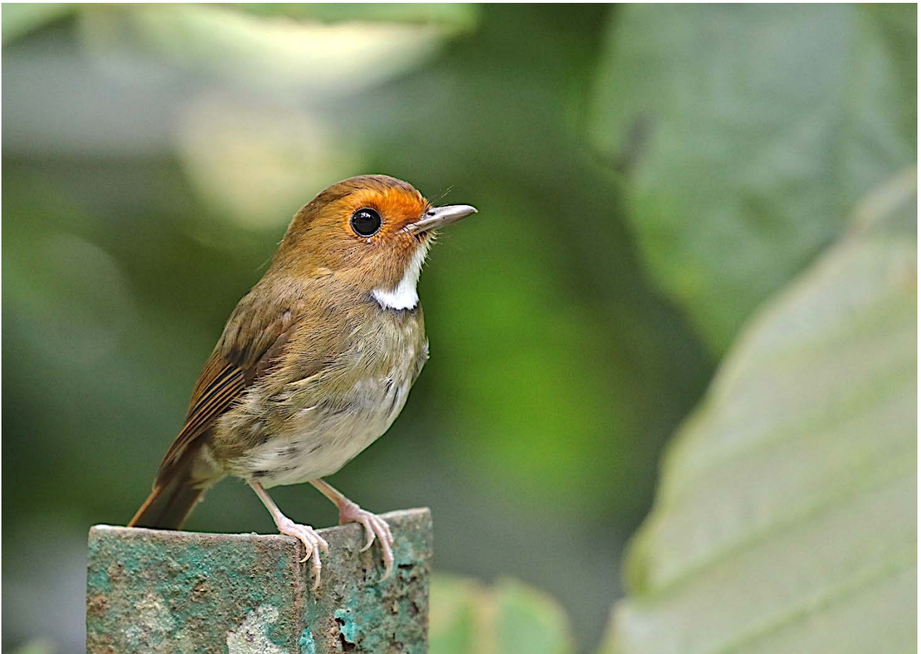
Malaysian Partridge and Rufous-browed Flycatcher at Fraser's Hill