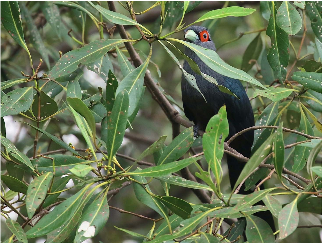
Chestnut-bellied Malkoha at Kuala Selangor