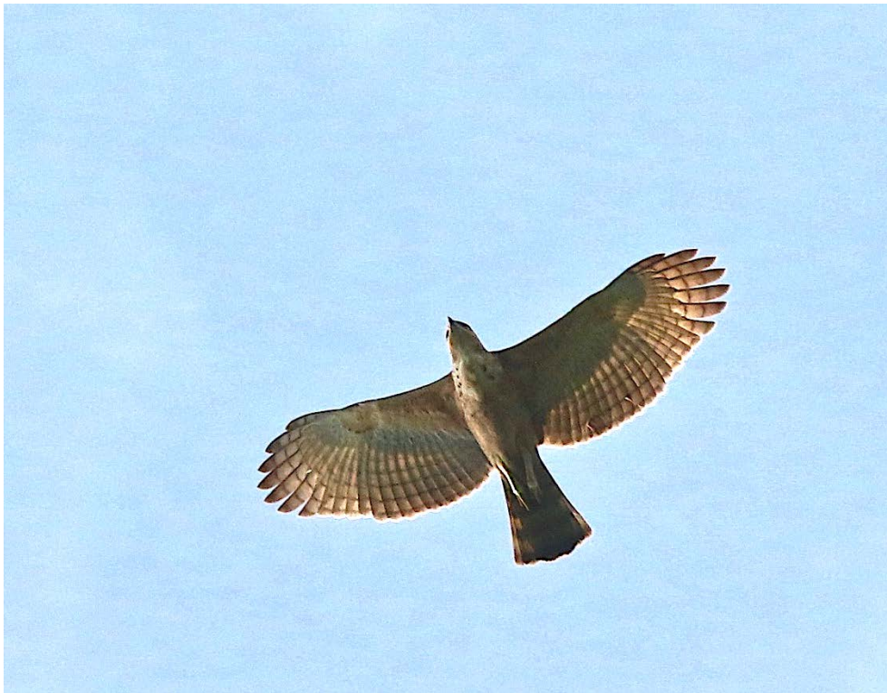
Wallace's Hawk-Eagle along the Gap Road from Fraser's Hill (Craig Robson)

Black Eagle Ictinaetus malaiensis Two at Fraser's Hill.