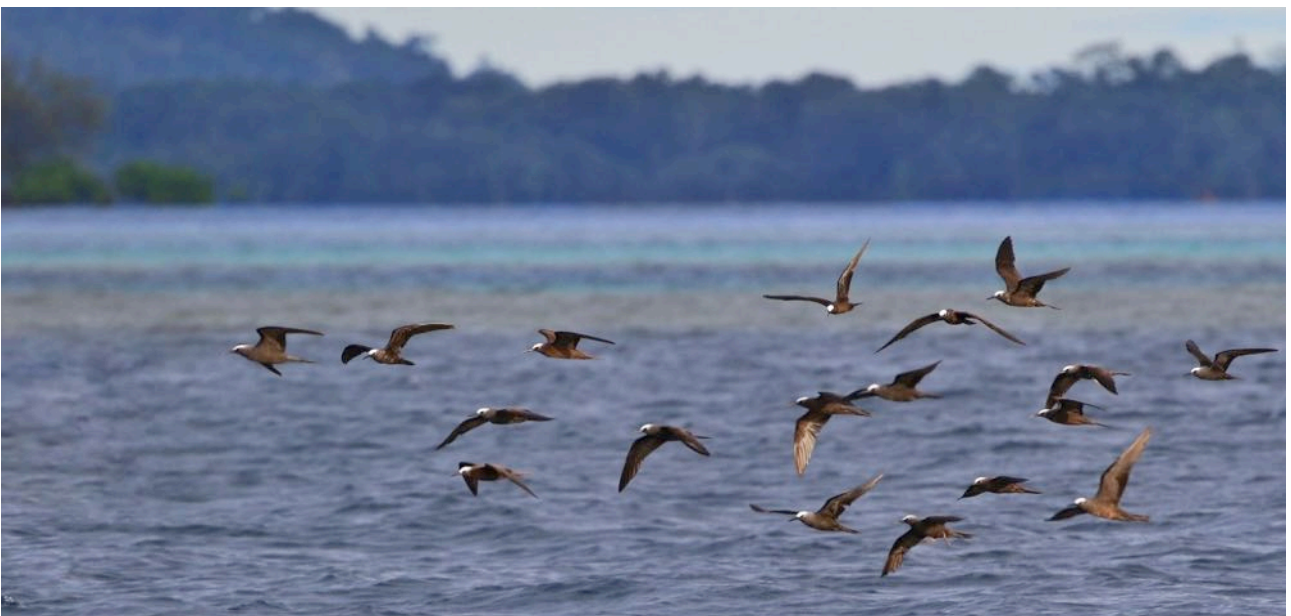
A flock of Black Noddy pass by offshore from Walindi during our pelagic.