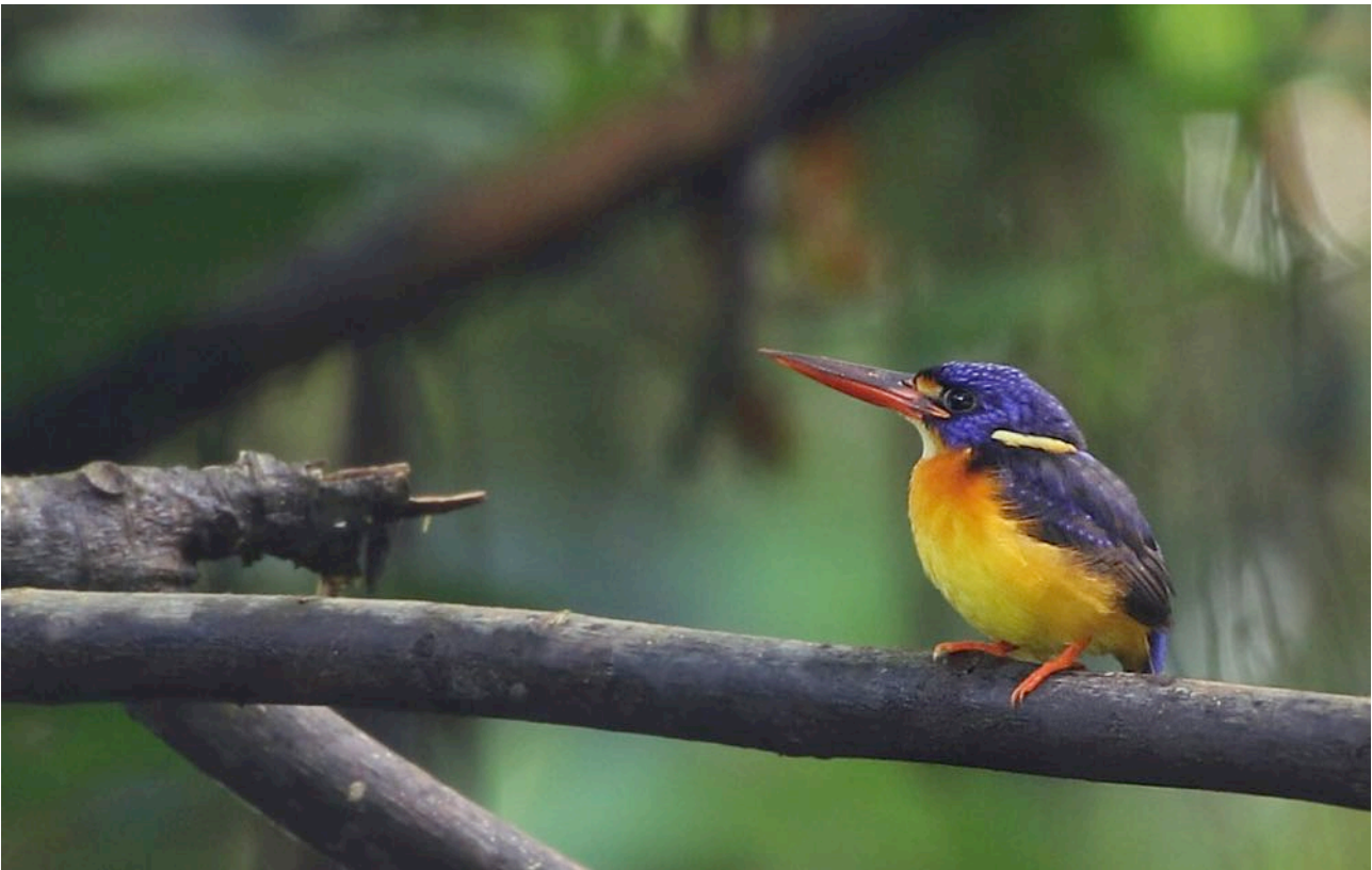
The tiny New Britain Dwarf Kingfisher showed well at Garu!