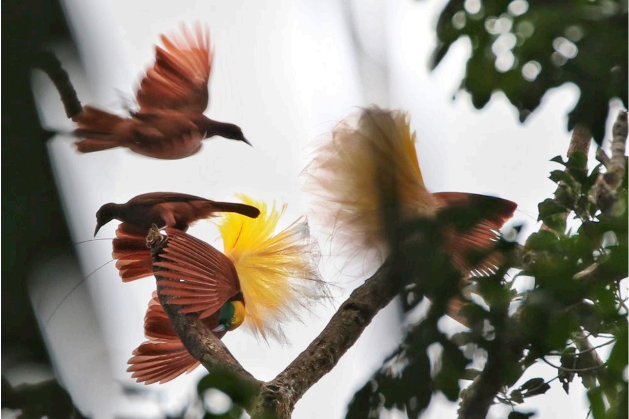
Witnessing the spectacular display of Greater Bird-of-paradise is one of the main reasons to visit PNG!

Returning the next morning, a date with one of the performing stars of New Guinea was on the agenda. We were not disappointed as when we arrived at the Greater Bird-of-paradise tree, at least a dozen females were in attendance, causing the attending males to go bonkers. We had a fantastic time watching them pose dramatically upside-down, then dancing, shuffling and mating with much vigor! All too soon we had to head back to town to prepare for our excursion up the mighty Fly River, but before leaving we added our first Yellowish-streaked Lory and Pinon's Imperial Pigeon.