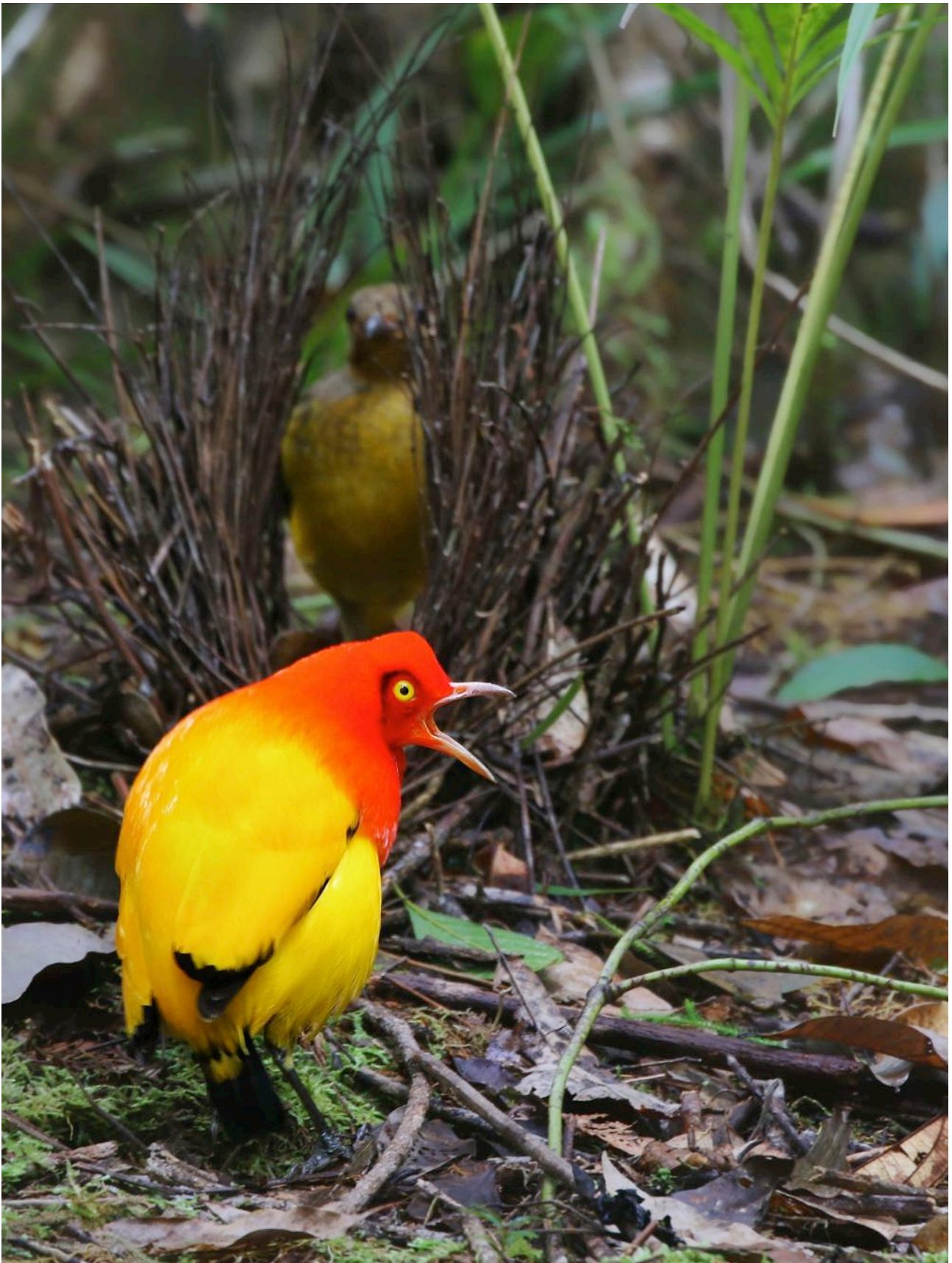
The gloriously incandescent Flame Bowerbird. There is nothing more to say!

One final push the next morning added a few great species to our tally. First up, everybody finally connected with Black-sided Robin, which had been proving diabolically difficult up until now. Some noisy Papuan Babblers, three Hooded Monarch, and some recently-split Arafura Shrikethrush appeared in our binoculars,