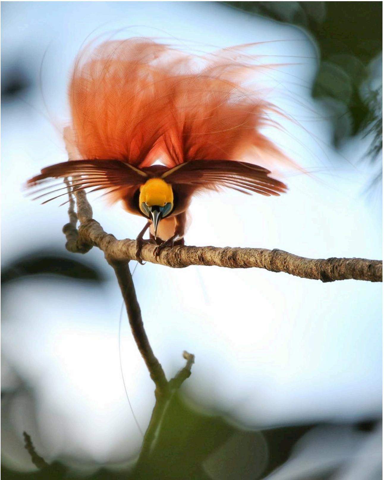
Watching the cacophony of male Raggiana Bird-of-paradise at their lek in Varirata is never to be forgotten!

Our third and final day in Varirata continued to pile on new species to our list. Most of the morning on trails got us face-to-face with the strange Drongo Fantail (now considered closely related to the Silktails of Fiji) and some confiding Yellow-legged Flyrobin. The attractive Goldenface and a Black-winged Monarch stayed higher in the trees but still gave good views, while Red Myzomela, Pale-billed Scrubwren and Green-backed Gerygone (finally!!!) also appeared in view nearby. Revisiting the excellent flowering tree around lunchtime was a good decision, as the rare Spotted Honeyeater came in a few times, along with a Ruby-throated