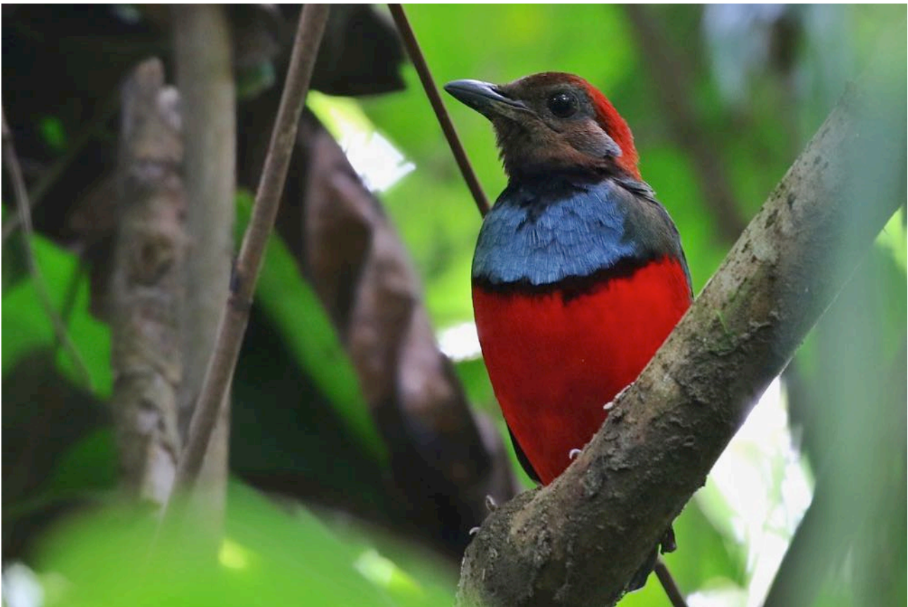
The New Britain form of Bismarck Pitta took some tracking down, but the wait was worth it!

No trip to PNG is complete without a sortie to New Britain, where our selection of endemics and near-endemics included the amazing and now very un-mythical Golden Masked Owl, Bismarck Pitta, Yellowish Imperial Pigeon, Finsch's Imperial Pigeon, Sclater's Myzomela, Black-bellied Myzomela, Ashy Myzomela, Black-tailed Monarch, and no less than three endemic kingfishers - New Britain Dwarf Kingfisher, White-mantled Kingfisher, and Black-capped Paradise Kingfisher. A roosting New Britain Boobook, Blue-eyed Cockatoos, some wet Violaceous Coucal, White-necked Coucal, Red-banded Flowerpecker, Melanesian Megapode, fabulous perched views of Nicobar Pigeon, and a restricted Heinroth's Shearwater were all highlights, but the more widespread Beach Kingfisher, Melanesian Kingfisher, Purple-bellied Lory, and the plentiful Eclectus Parrots were of course appreciated too. In all the tour recorded 381 species of birds, which included some big numbers! 36 honeyeaters; 34 pigeons; 25 parrots; 19 kingfishers; 18 birds-of-paradise; 17 cuckoos; 15 nightbirds; 13