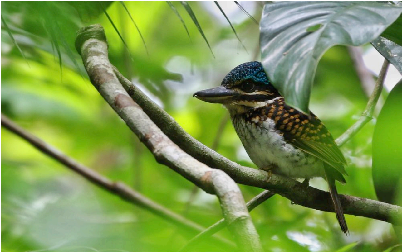
The crepuscular Hook-billed Kingfisher is often hard to see in daylight hours, but this one didn't mind!

but a flyby Purple-tailed Imperial Pigeon was only glimpsed by some. Trying another spot we struck gold with a perched Hook-billed Kingfisher allowing close studies, while Frilled Monarch and Yellow-bellied Longbill flitted about. Trumpet Manucode was briefly seen too, but a calling Little Paradise Kingfisher would not come closer. We tried some more birding after lunch where only a male Golden Monarch was of note, but the return journey to Kiunga provided us with an overdue Orange-bellied Fruit-Dove, one somewhat distant Lowland Peltops, and many flocks of Metallic Starlings which we scoured in vain for the uncommon Yellow-eyed Starling. A short dusk vigil at the airport turned up Crimson Finch, but nothing else of particular note.