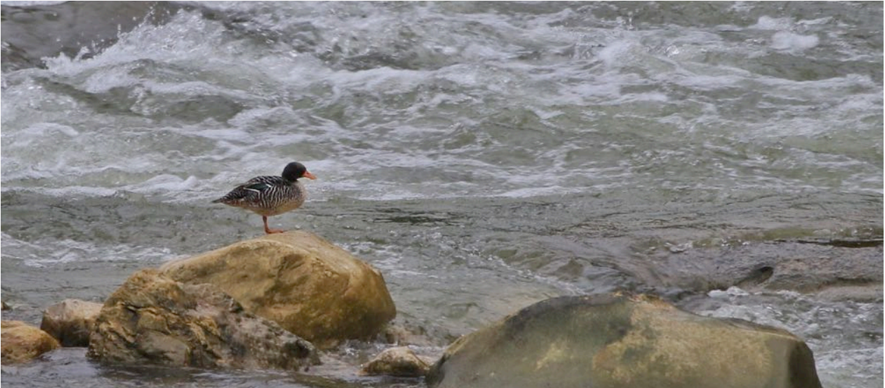
It took us a few tries, but we eventually located a Salvadori's Teal in one of the rapids near Tabubil!

With a few hours in the morning available for birding, we spent time searching for one of the least known birds in New Guinea. To our delight, we succeeded in locating a calling Greater Melampitta which flew straight in! Although we never did see it perched, a number of good flight views of this strange limestone-loving species were had as it crossed a small stream multiple times. Nearby we had even better Torrent-lark views, while a male Superb Fruit-Dove, Black-billed Coucal, Slaty-chinned Longbill and White-shouldered Fairywren made up the other additions. Heading back to the lowlands we stopped once to admire a circling Papuan Spine-tailed Swift, and later at the famous KM17 a jewel-like King Bird-of-paradise performed marvellously on his chosen vine, showing off his ruby-red plumage and bouncing tail shafts. Towards dusk we had brief views of both Blue Jewel Babbler and Hooded Pitta as they were enticed across the track, but the Wallace's Owlet-nightjar found after dark was definitely a favourite for all!