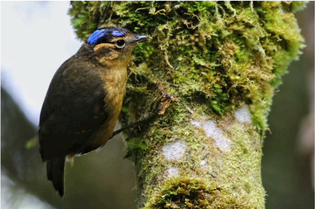
The poisonous Blue-capped Ifrit delighted us at Kumul! When handled, batrachotoxin in the feathers causes numbness in your hands!

At dawn we headed to Murmur Pass where we spent the whole morning staking out a very birdy clearing. A large flowering tree held multiple Orange-billed Lorikeets, Papuan Lorikeets, and the uncommon Goldie's Lorikeet - all gave excellent perched views in the scope. We were periodically distracted by poisonous Blue-capped Ifrit squeaking above us, two male Loria's Satinbird chasing each other through the trees, and Black-breasted Boatbills flitting about. A trio of Rufous-throated Bronze Cuckoos performed exceptionally, and one Fan-tailed Cuckoo was around nearby. Rufous-backed Honeyeater, Red-collared Myzomela and Black-bellied Cuckooshrike foraged above us, but Regent Whistler and Brown-backed Whistler came down to eye-level. Periodic stops on the return drive yielded Long-tailed Shrike, Pied Bush Chat, the endemic Hooded Mannikin, and later in the day also a Papuan Grassbird. Midday around Kumul saw us enjoying a fabulous pair of "Eastern" Crested Berrypecker, and a confiding Island Thrush on the lawn.