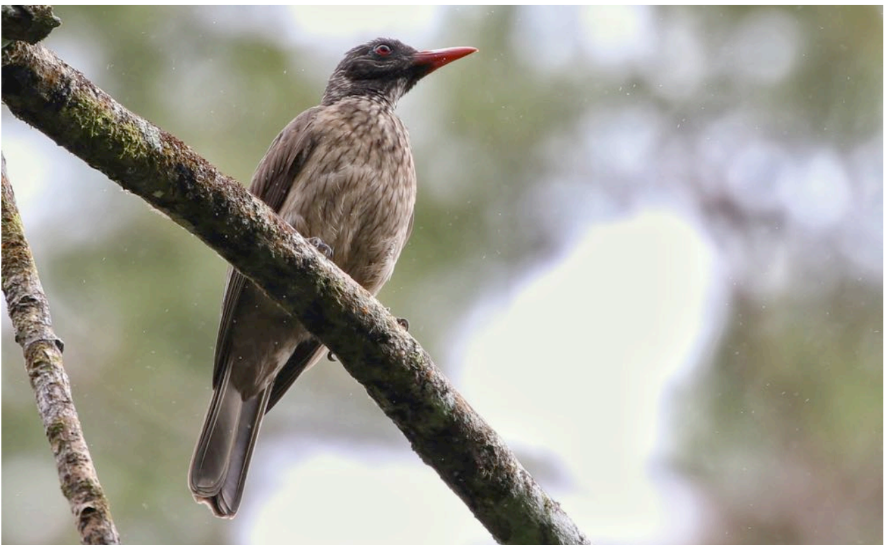
The voice of Brown Oriole is commonly heard in New Guinea – we had excellent views in Varirata!

Stout-billed Cuckooshrike ◊ Coracina caeruleogrisea A pair showed well at Varirata. Barred Cuckooshrike ◊ (Yellow-eyed C) Coracina lineata Some at Varirata. Black-faced Cuckooshrike Coracina novaehollandiae Some near Varirata. Boyer's Cuckooshrike ◊ Coracina boyeri Common in the lowlands. White-bellied Cuckooshrike Coracina papuensis Common around Port Moresby. Golden Cuckooshrike ◊ Campochaera sloetii Some really excellent views at Tabubil. Black-bellied Cuckooshrike ◊ (B-b Cicadabird) Edolisoma montanum Some around Mount Hagen. Grey-headed Cuckooshrike ◊ (G-h Cicadabird) Edolisoma schisticeps Noted at Dablin Creek. Black-shouldered Cicadabird ◊ Edolisoma incertum Noted at Dablin Creek. Black Cicadabird ◊ (B Cuckooshrike, New Guinea C) Edolisoma melas One male showed well in Varirata. Varied Triller Lalage leucomela Noted regularly in the lowlands. Wattled Ploughbill ◊ Eulacestoma nigropectus A superb male showed beautifully at Rondon. Rufous-naped Bellbird ◊ (R-n Whistler) Aleadryas rufinucha Common and showy at Kumul. Piping Bellbird ◊ (Crested Pitohui) Ornorectes cristatus Heard often, some brief views at Varirata. Black Pitohui ◊ Melanorectes nigrescens Nice looks at Rondon of a pair.