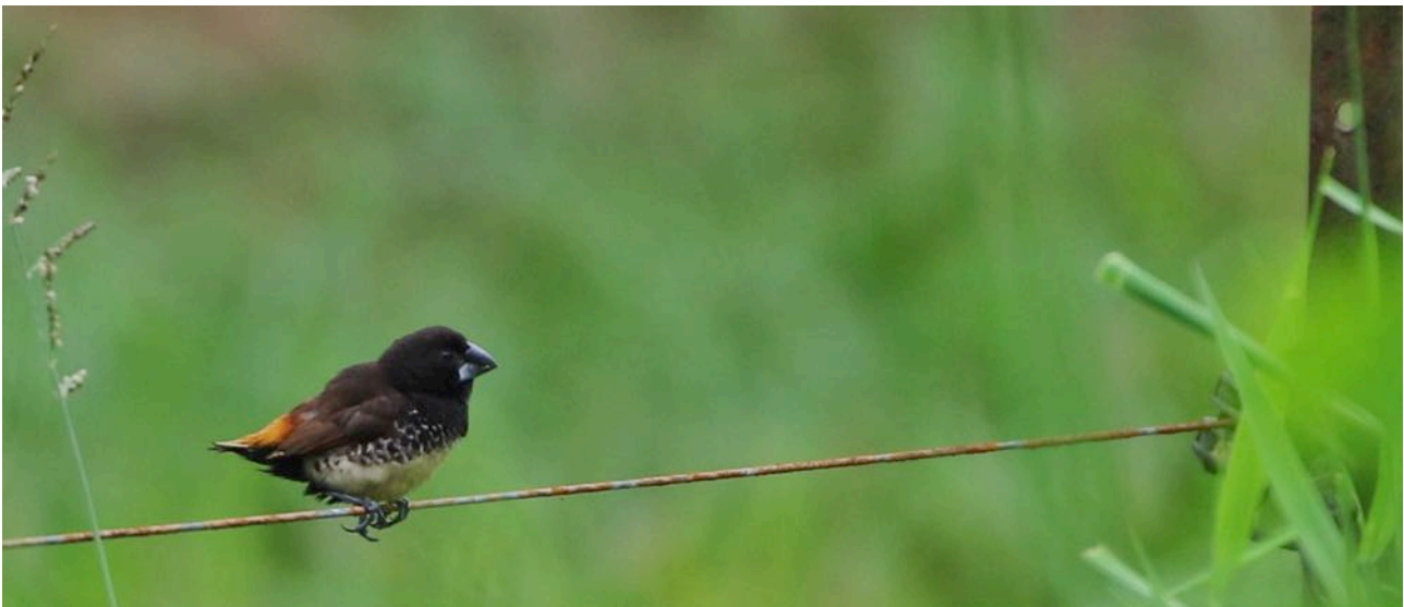
Buff-bellied Mannikin is endemic to the Bismarck Archipelago – a lovely finch!

Island Thrush Turdus poliocephalus Common around Kumul, and on the feeder. Pied Bush Chat (P Chat) Saxicola caprata Regular roadside birds in the highlands. Red-capped Flowerpecker ◊ Dicaeum geelvinkianum Common throughout. Red-banded Flowerpecker ◊ (Bismarck F) Dicaeum eximium Eventually seen well on New Britain. Black Sunbird ◊ Leptocoma aspasia A few around Kiunga, more common on New Britain. Olive-backed Sunbird Cinnyris jugularis A few around our rooms at Walindi. House Sparrow (introduced) Passer domesticus Noted in Port Moresby. Eurasian Tree Sparrow (introduced) Passer montanus Common in most towns. Mountain Firetail ◊ Oreostruthus fuliginosus Very nice views around Kumul. Crimson Finch ◊ Neochmia phaeton A few at Kiunga airstrip. Blue-faced Parrotfinch Erythrura trichroa Parrotfinches heard at Rondon were presumably this species. (H) Grey-headed Mannikin ◊ Lonchura caniceps One big flock in the grass at PAU. Hooded Mannikin ◊ Lonchura spectabilis Quite common in the highlands. Buff-bellied Mannikin ◊ (Bismarck M) Lonchura melaena Some lovely looks on New Britain.