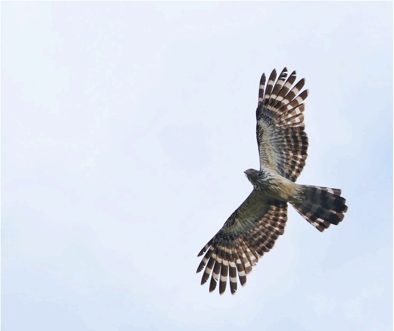
This delightful Long-tailed Honey Buzzard circled low down over us at Varirata!

crested Jacana were particular favourites, while fruiting trees were full of Torresian Imperial Pigeon, Australasian Figbird and Yellow-faced Myna. Some drier woodland allowed us to see a nice active Fawn-breasted Bowerbird bower hidden under a dense bush, with Bar-shouldered Dove, Peaceful Dove, Yellow-tinted Honeyeater and White-bellied Cuckooshrike nearby.