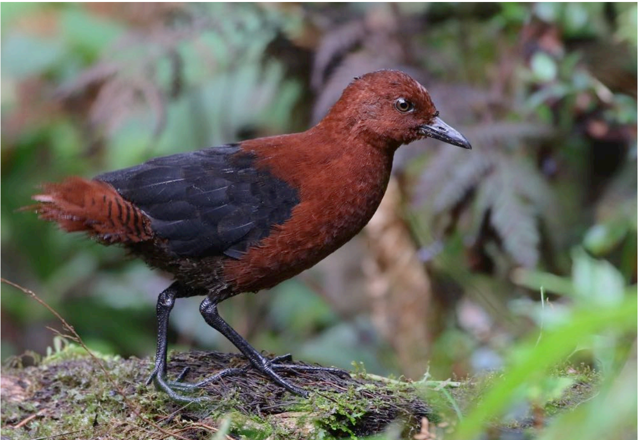
One rarely has an encounter with Forbes's Forest Rail quite like this!