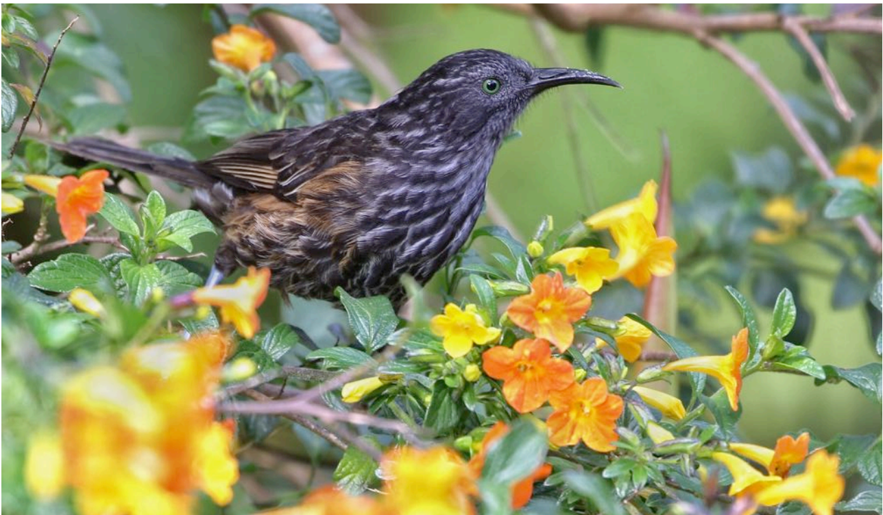
Grey-streaked Honeyeaters are regular visitors to the gardens of Kumul Lodge!

Plain Honeyeater ◇ Pycnopygius ixoides Common in Varirata. Marbled Honeyeater ◇ Pycnopygius cinereus Some seen along the Tonga Trail. Streak-headed Honeyeater ◇ Pycnopygius stictocephalus Encountered in the lowlands near Kiunga. Spotted Honeyeater ◇ Xanthotis polygrammus Excellent views of one returning the flowers at Varirata. Tawny-breasted Honeyeater ◇ Xanthotis flaviventer Common throughout the lowlands. Meyer's Friarbird ◇ Philemon meyeri Some at Boystown Road. New Guinea Friarbird ◇ (Helmeted F) Philemon novaeguineae Common in the lowlands.