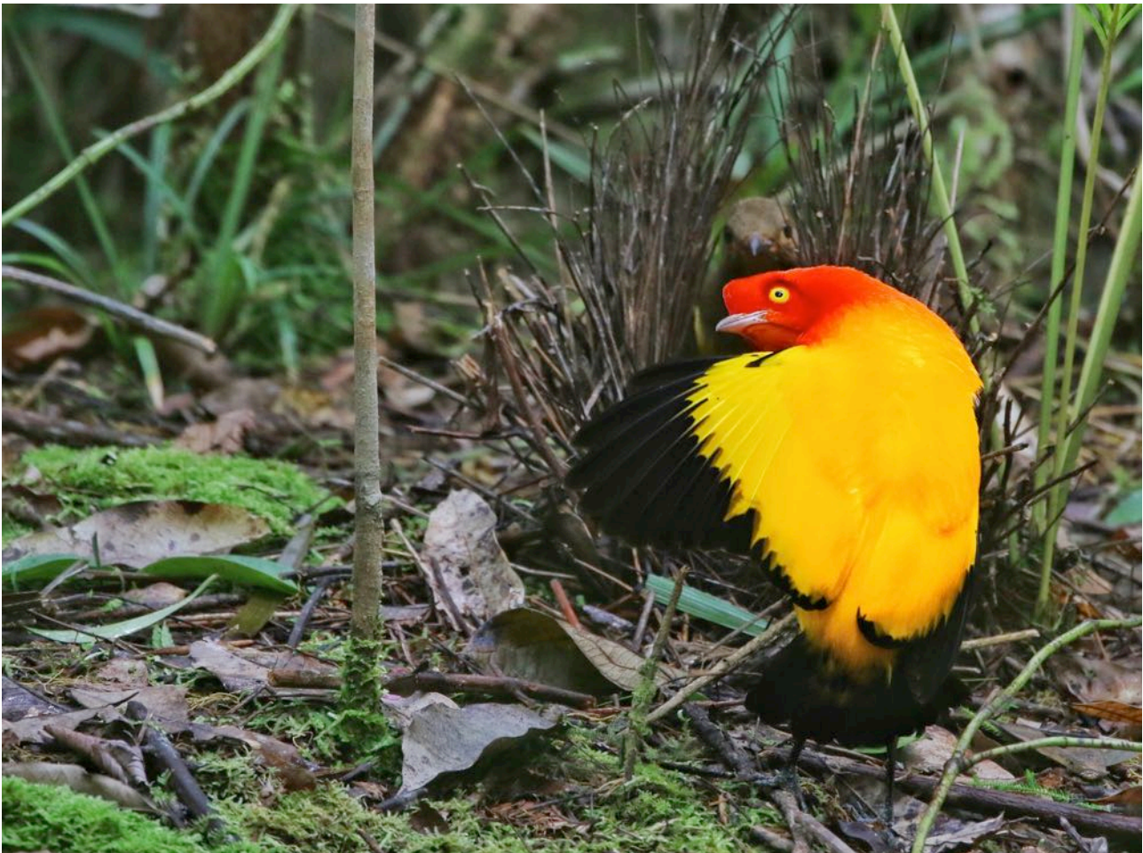
This male Flame Bowerbird put on such an exquisite show to his attending female (you can see her head in the bower)!

For a video of this astounding display put on for us, see: https://www.youtube.com/watch?v=e8tYTAIXKhA