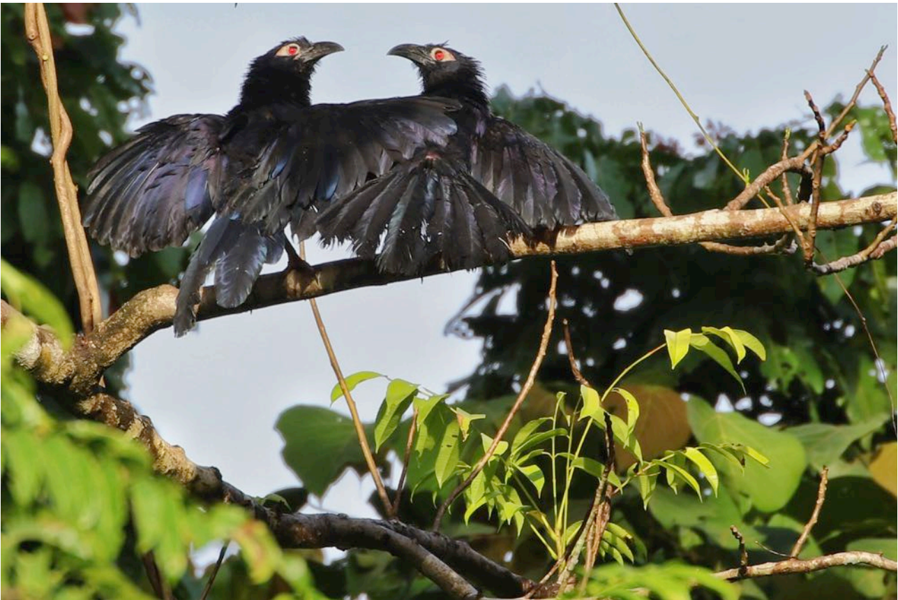
The Violaceous Coucal of New Britain is easiest to see after a heavy downpour when they come up to dry themselves!