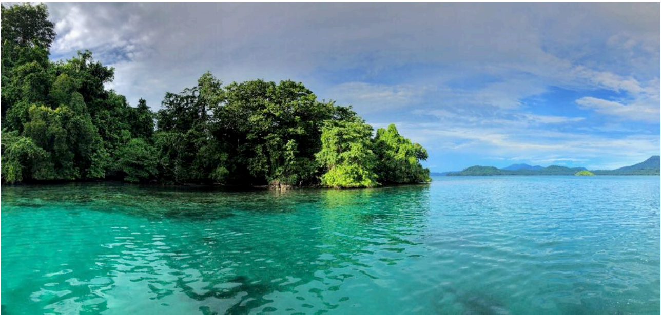
New Britain is an idyllic tropical paradise – make sure to bring your swimmers!

With a beautiful sunrise we were off on a boat into Kimbe Bay. After seeing a few feeding flocks with Black Noddy, Black-naped Tern and Common Tern, we arrived at the lovely little Restorff Island. Drifting over the turquoise blue shallows we enjoyed watching the range-restricted island tramp Sclater's Myzomela, abundant on this island. A Mangrove Golden Whistler dropped in, while Island Imperial Pigeons and two MacKinlay's Cuckoo-Dove showed nicely. Moving over to the Malumalu Islands, a lovely Beach Kingfisher was sat out in the sun calling away, and a pair of Island Monarchs fed unobtrusively near the shoreline. The boatman deemed that conditions were calm enough for us to venture further, and in keeping our good track record for the third year running we found a Heinroth's Shearwater out past the edge of the bay! Pleased, we returned to Restorff for a nice lunch, with some opting to have a snorkel along the pristine reef. The afternoon saw us venturing up the flank of the volcano behind Walindi, where a grove of flowering trees connected us with the uncommon endemic Black-bellied Myzomela, and some more Ashy Myzomela. A few Pacific Koel and a Shining Bronze Cuckoo were seen nearby and a Pacific Baza perched up nicely, before some Red-banded Flowerpeckers finally showed very well a little before sunset.