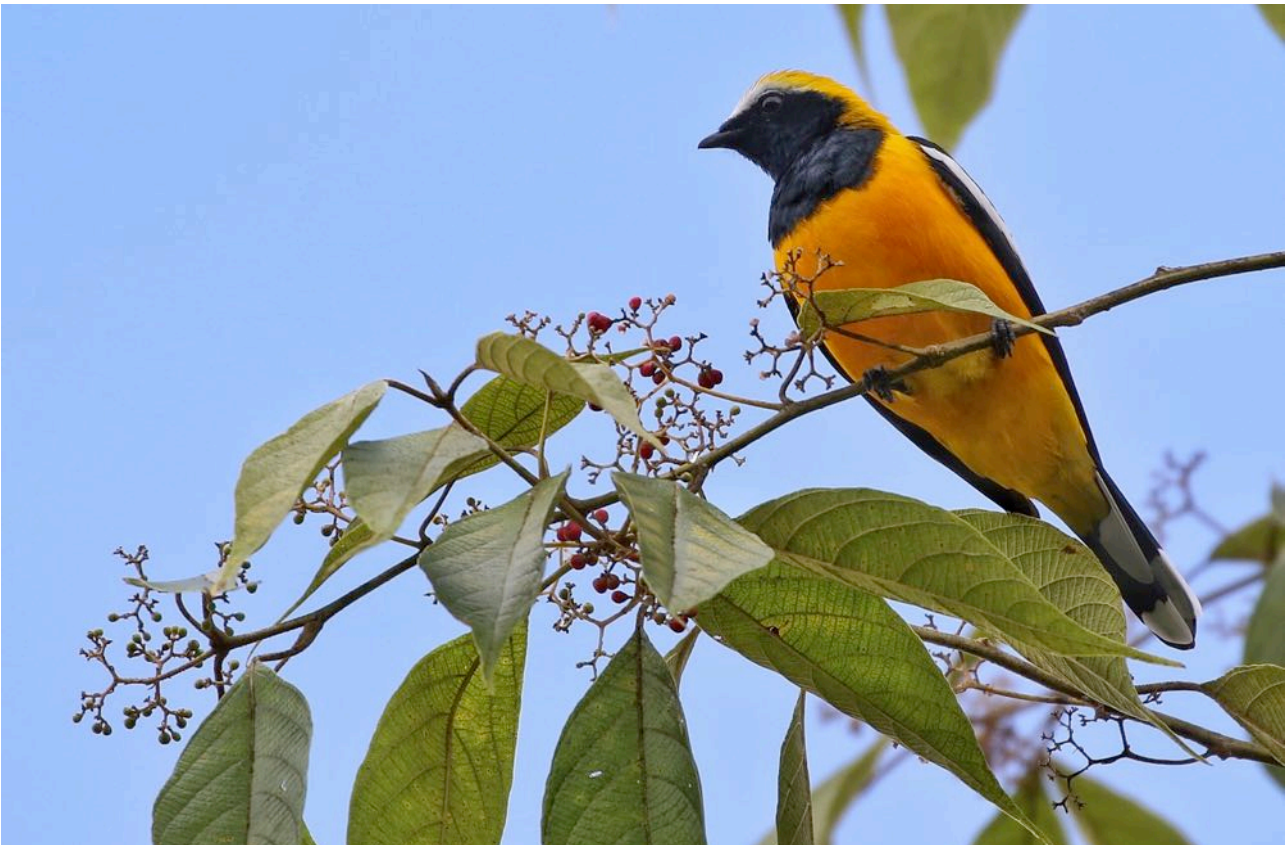
This male Golden Cuckooshrike is certainly very dressed up compared to the usually grey and white colouration of the family!

With a few hours in the morning available for birding, we spent time searching for one of the least known birds in New Guinea. To our delight, we succeeded in locating a calling Greater Melampitta which flew straight in! Although we never did see it perched, a number of good flight views of this strange limestone-loving species were had as it crossed a small stream multiple times. Nearby we had even better Torrent-lark views, while a male Superb Fruit-Dove, Black-billed Coucal, Slaty-chinned Longbill and White-shouldered Fairywren made up the other additions. Heading back to the lowlands we stopped once to admire a circling Papuan Spine-tailed Swift, and later at the famous KM17 a jewel-like King Bird-of-paradise performed marvellously on his chosen vine, showing off his ruby-red plumage and bouncing tail shafts. Towards dusk we had brief views of both Blue Jewel Babbler and Hooded Pitta as they were enticed across the track, but the Wallace's Owlet-nightjar found after dark was definitely a favourite for all!