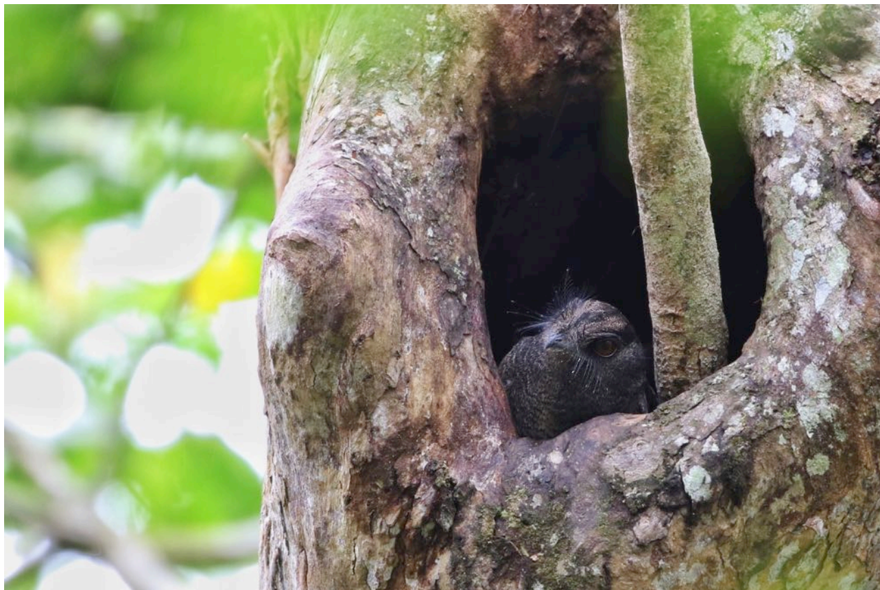
The regular Barred Owlet-nightjar was yet again easy to find in his favourite hollow at Varirata!

robins; 11 cuckooshrikes; 9 fantails; 8 whistlers, 5 scrubwrens; 4 bowerbirds; 3 longbills; 2 mouse-warblers; and 1 brushturkey in a dead tree! The mammal list was typically short, but a nice Pygmy Ringtail showed well at Kumul, and the huge Bismarck Flying Foxes awed us on New Britain.