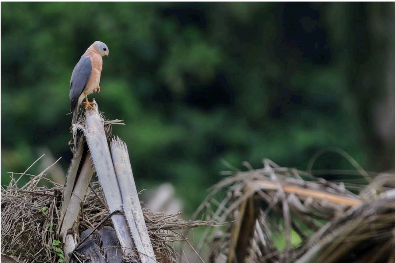
Variable Goshawk is a regular sight throughout New Guinea.

Forest Bittern ◊ ( New Guinea Tiger-heron ) Zonerodius heliosylus Fantastic looks at a young bird in Varirata! Black Bittern Dupetor flavicollis Abundant in the palm oil plantations of New Britain. Nankeen Night Heron (Rufous N H) Nycticorax caledonicus One roosting in a large tree at PAU. Striated Heron (Green-backed H) Butorides striata One at Walindi on New Britain during our extension-extension. Eastern Cattle Egret Bubulcus coromandus Common around PAU. Great Egret (Eastern G E) Ardea [alba] modesta Some at PAU. Intermediate Egret ◊ Ardea intermedia Some at PAU. Pied Heron ◊ Egretta picata A nice flock of these pretty herons at PAU. Little Egret Egretta garzetta One on New Britain. Pacific Reef Heron (Eastern R Egret) Egretta sacra Two birds noted on New Britain. Lesser Frigatebird Fregata ariel Several off New Britain. Brown Booby Sula leucogaster Some on our pelagic off New Britain. Little Pied Cormorant Microcarbo melanoleucos A few at PAU. Little Black Cormorant Phalacrocorax sulcirostris A few at PAU.