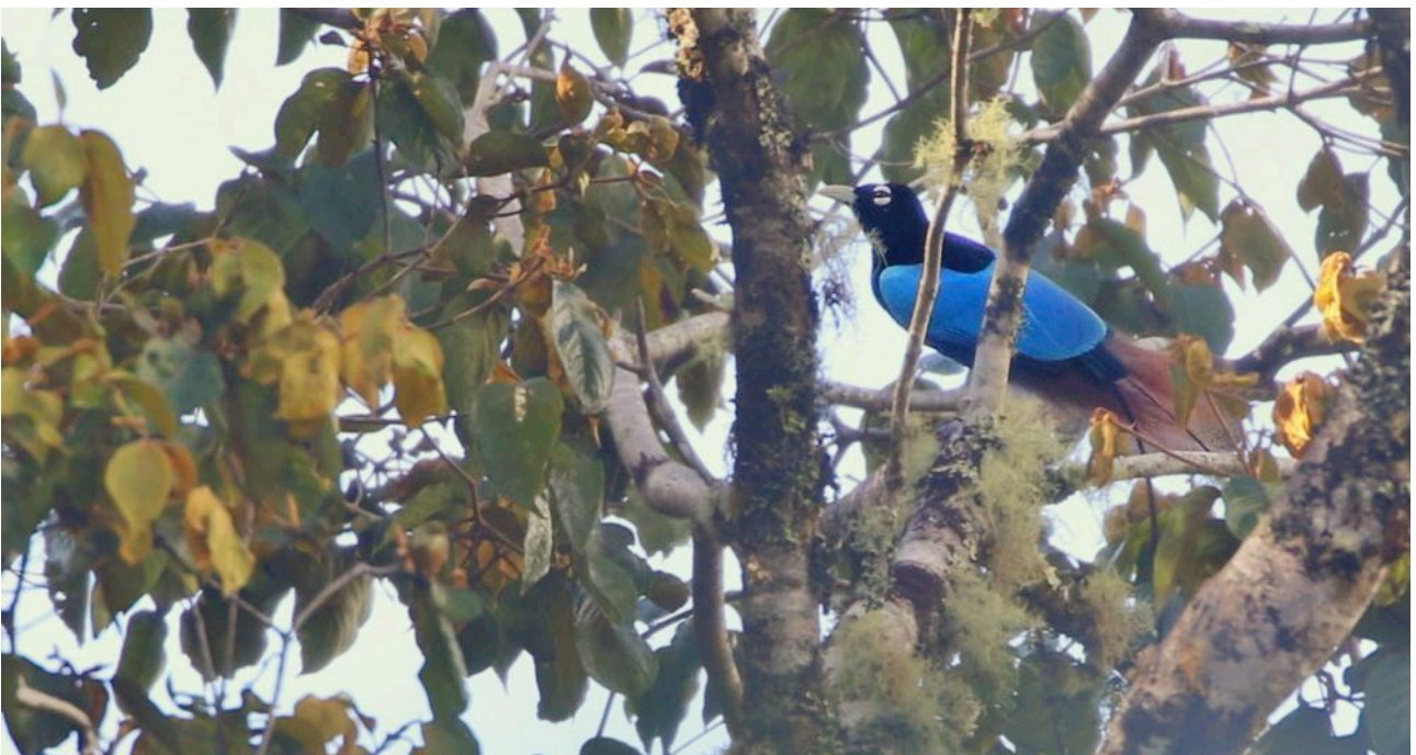
The stunning male Blue Bird-of-paradise is always a highlight in PNG!

Next day we found ourselves listening to the loud ringing call of a Blue Bird-of-paradise in anticipation as the sun was peeking over the hills. It was not long before he appeared, giving us multiple excellent and extended scopes views during the morning of his vibrant blue and black plumage with subtle pink plumes and feathered highlights. As always, we accepted it to be one of the best birds in the world! Nearby plenty of Greater Lophorina (ex Superb BoP) were present, and eventually an advertising male was scoped up in good light allowing us to examine exactly where the various feather extensions were attached! Other birds hanging around included Marbled Honeyeater, Mountain Myzomela, Buff-faced Scrubwren, Island Leaf Warbler, another Slaty-chinned Longbill, a Sepik-Ramu Shrikethrush, and two heavily scrutinised Papuan White-eyes (it is well known that the birds here do not follow the rules in current field guides, but theoretically this identification is correct). As it got hotter we spent some time in the dry hills above the Lai River adding both Black-headed Whistler and Yellow-breasted Bowerbird fairly quickly.