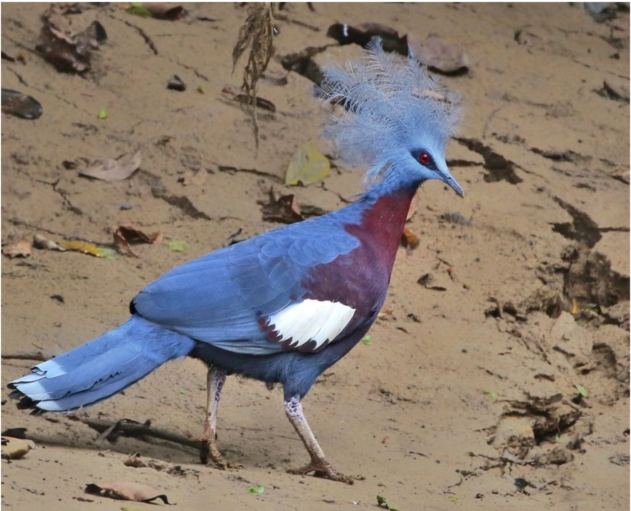
Who could not be impressed by the marvelous Sclater's Crowned Pigeons of PNG?!