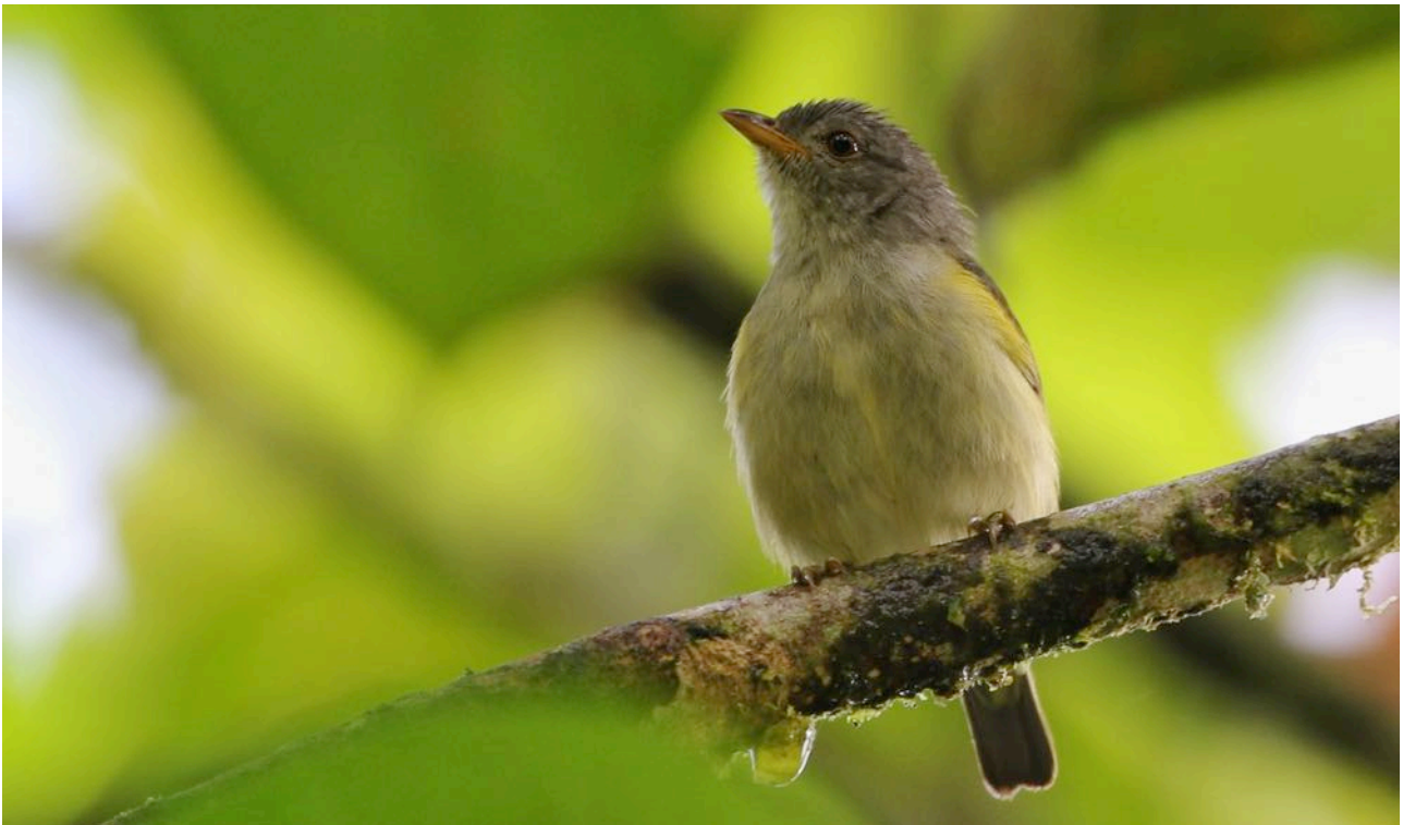
The interestingly named Obscure Berrypecker is known only from a few sites in New Guinea, the most reliable being Dablin Creek!

Visiting Kivitembip Forest the next morning was somewhat disheartening - a lot had been cut down since last year, including the best flowering trees! Nevertheless birding here was still excellent, with a pair of Wallace's Fairywren chortling away in full view and some fantastic perched Pesquet's Parrots being the highlights. Otherwise, we added many new birds at the clearing which included White-crowned Cuckoo, Golden Cuckooshrike, Streak-headed Honeyeater, Rufous-backed Fantail, Northern Fantail, the uncommon Ornate Fruit-Dove, Beautiful Fruit-Dove, and perched Papuan Mountain Pigeon. A White-rumped Robin taped across the track, but it was so quick that most hardly saw it. Returning after lunch, at long last we laid eyes on a specky Torrent-lark in one of the many bouldery rapids we had been checking, but aside from a trio of Great Woodswallows not much else was in evidence until dusk when finally the hoped-for Salvadori's Teal appeared right in front of us! There was still time for a Variable Goshawk to fly over, two Golden Mynas to perch up, and a whole family of Pesquet's Parrots to show well as they noisily chased Sulphur-crested Cockatoos around the ridge. A great end to the day!