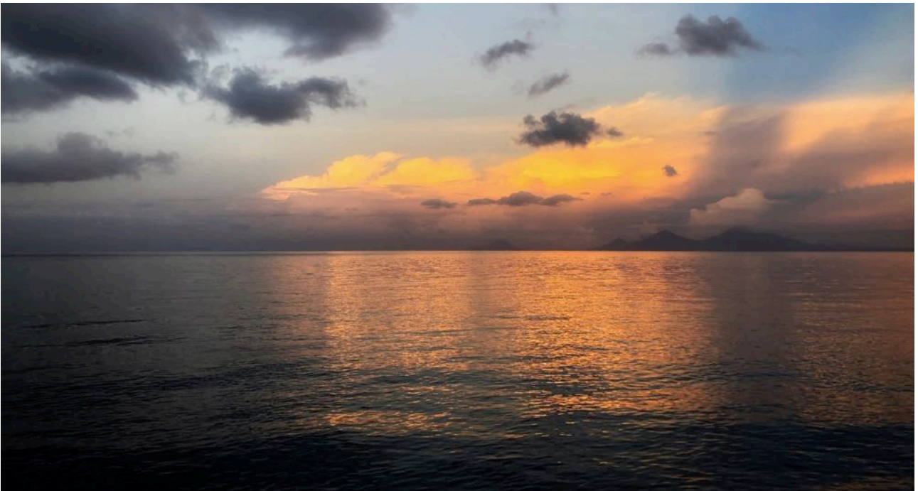
An orange sunset on our New Britain extension-extension! You can see a thin layer of ash stretching across the horizon.!