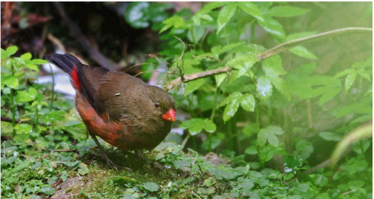
Plucky little Mountain Firetails feed on the lawns at Kumul!