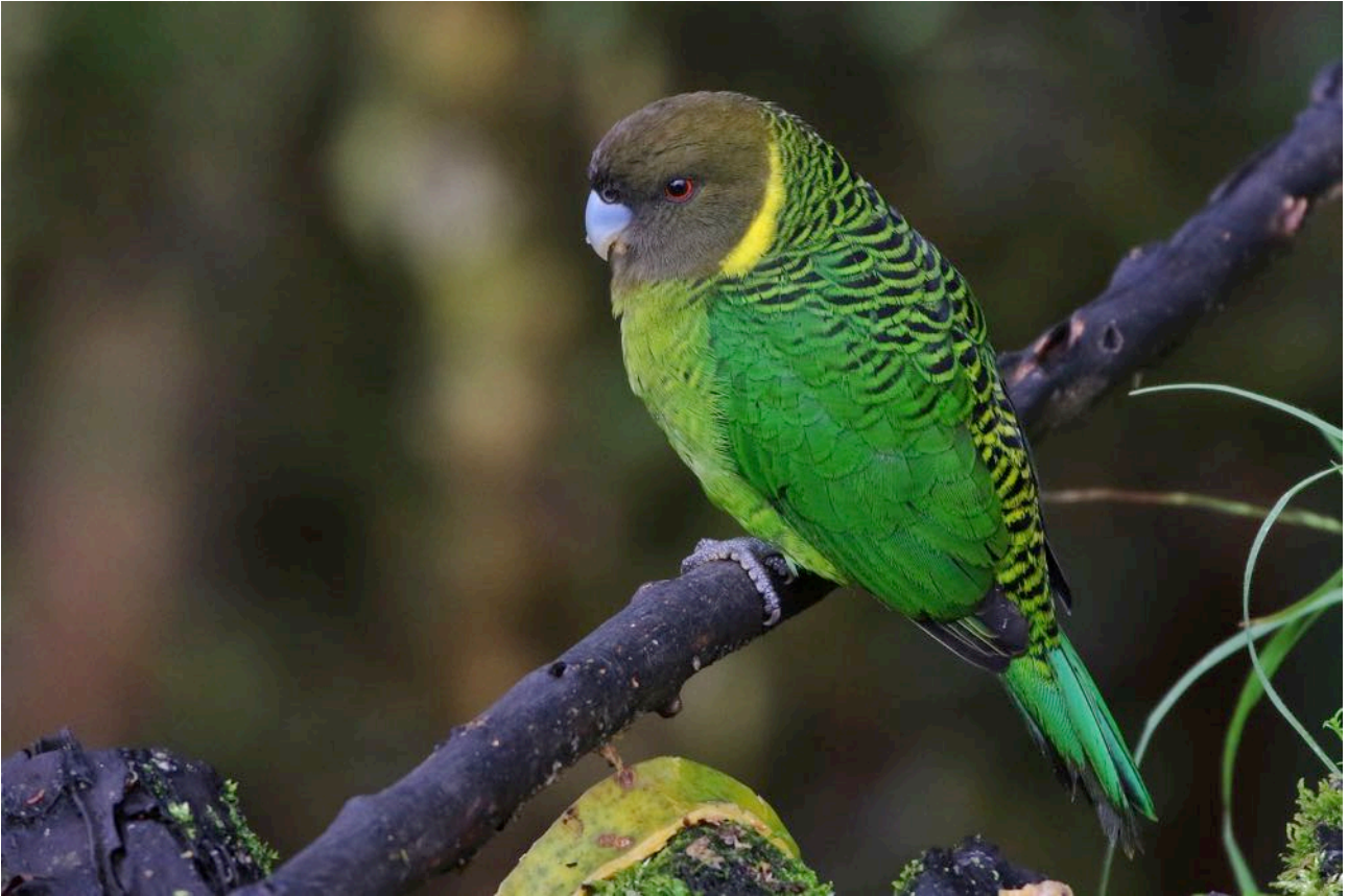
Pretty Brehm's Tiger Parrot are one of the common feeder birds at Kumul Lodge! This is a male.