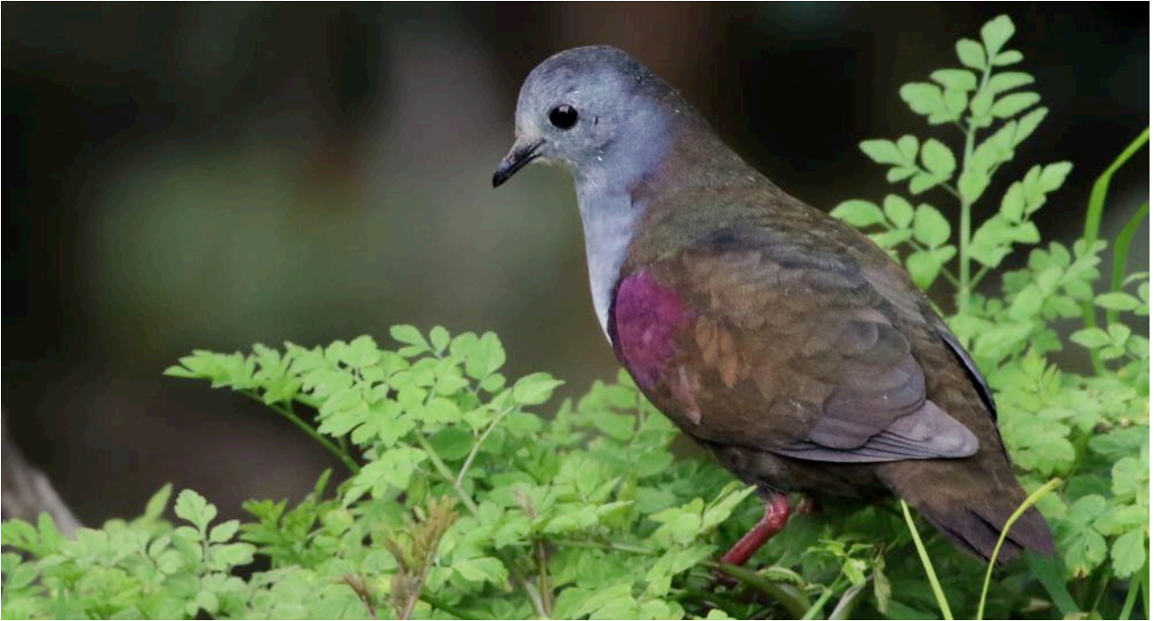
A male Bronze Ground Dove was frequenting the feeder at Kumul on dusk, giving great looks!

Next day we found ourselves listening to the loud ringing call of a Blue Bird-of-paradise in anticipation as the sun was peeking over the hills. It was not long before he appeared, giving us multiple excellent and extended scopes views during the morning of his vibrant blue and black plumage with subtle pink plumes and feathered highlights. As always, we accepted it to be one of the best birds in the world! Nearby plenty of Greater Lophorina (ex Superb BoP) were present, and eventually an advertising male was scoped up in good light allowing us to examine exactly where the various feather extensions were attached! Other birds hanging around included Marbled Honeyeater, Mountain Myzomela, Buff-faced Scrubwren, Island Leaf Warbler, another Slaty-chinned Longbill, a Sepik-Ramu Shrikethrush, and two heavily scrutinised Papuan White-eyes (it is well known that the birds here do not follow the rules in current field guides, but theoretically this identification is correct). As it got hotter we spent some time in the dry hills above the Lai River adding both Black-headed Whistler and Yellow-breasted Bowerbird fairly quickly.