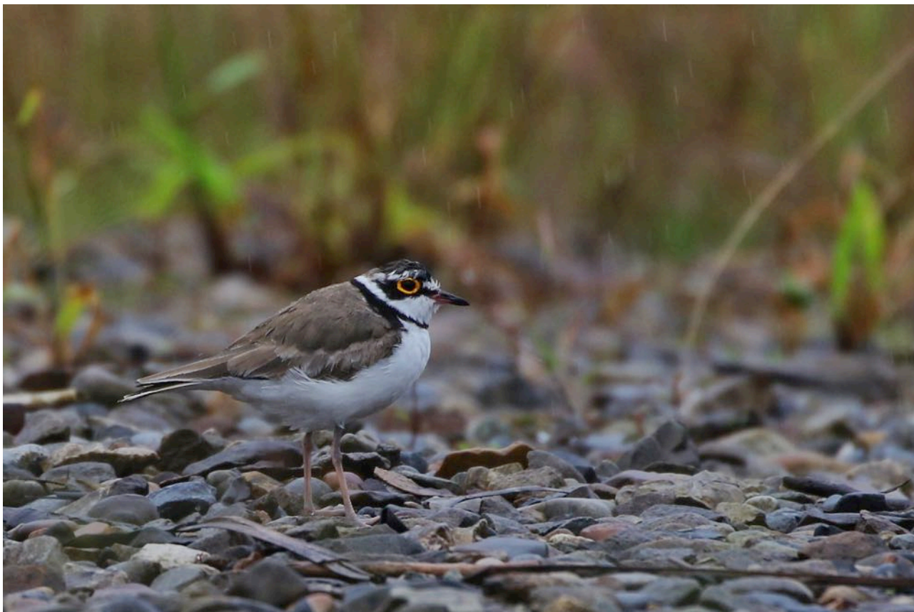
The endemic resident form of Little Ringed Plover may be a distinct species.

Pale-vented Bush-hen ◊ Amaurornis moluccana Heard on New Britain. (H) White-browed Crake Porzana cinerea Brief views in a muddy pond on New Britain. New Guinea Flightless Rail ◊ Megacrex inepta Superb views of this cryptic species along the Fly River. Australasian Swamphen Porphyrio melanotus Several at PAU. Dusky Moorhen Gallinula tenebrosa Several at PAU. Masked Lapwing Vanellus miles Common around PAU. Little Ringed Plover Charadrius dubius One of the resident endemic subspecies seen below Tabubil.