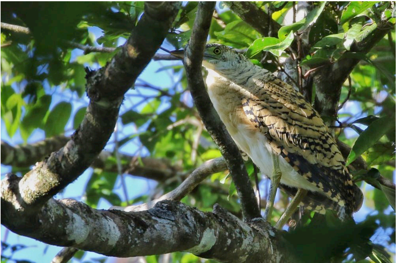
The elusive Forest Bittern is a strange creature, and one rarely seen on bird tours! We saw this young bird very well at Varirata.

Brown Quail Coturnix ypsilophora A small covey as we were leaving Rondon Ridge.