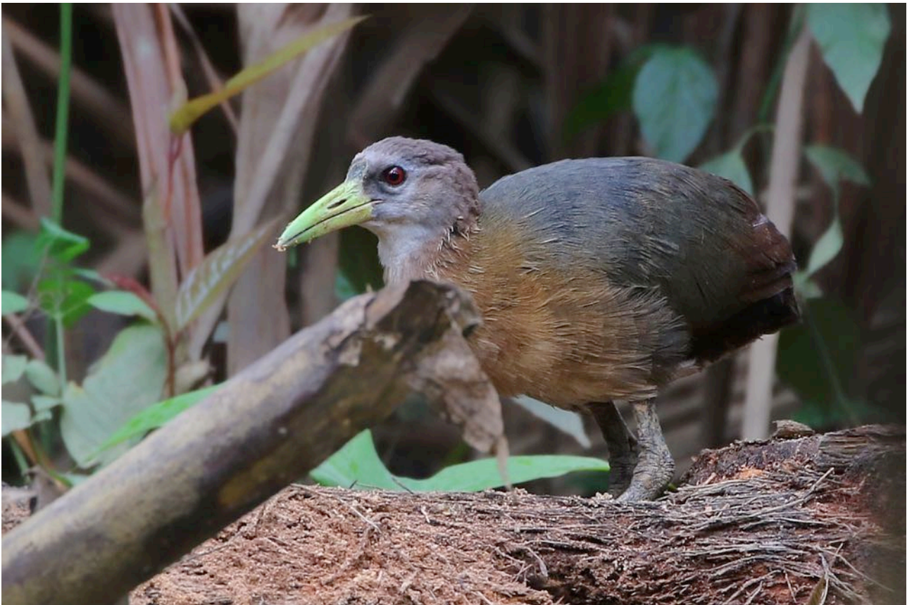
The cryptic New Guinea Flightless Rail was reliably staked out this year - hopefully this continues into the future!

Our first morning in this fantastic riverine forest was excellent as usual. Soon after dawn we were admiring a male Twelve-wired Bird-of-paradise, marvelling as he went through his entire routine to impress a visiting female. He worked up and down the stick to entice her closer, then she perched below him as he tickled her with his wires. He then raised his frilly cape in a grand finale - clearly this was enough, and after a bit of pecking behind the neck they copulated before she promptly flew away to do the rest herself. Not long after we had the best possible views of four different Sclater's Crowned Pigeon by the side of the river - one even strutted along beside the boat before opening his spectacular wings and whooshing across in front of us. Red-flanked Lorikeets and Large Fig Parrots performed brief flybys, and the strange Long-billed Cuckoo was tempted to perch on a dead stick over a clearing. Working forest trails for the remainder of the morning yielded great views of Blue Jewel Babbler for the whole group as a male wandered slowly across an open area, and subsequently a Black-billed Brushturkey flushed up to perch in a tree and was enjoyed through the scope. Papuan Pitta and Hooded Pitta played hard to get, although everybody at least saw both species in flight. Obscure Honeyeater was unobscured for a lucky few, and Wompoo Fruit-Dove was seen well behind Kwatu during lunch.