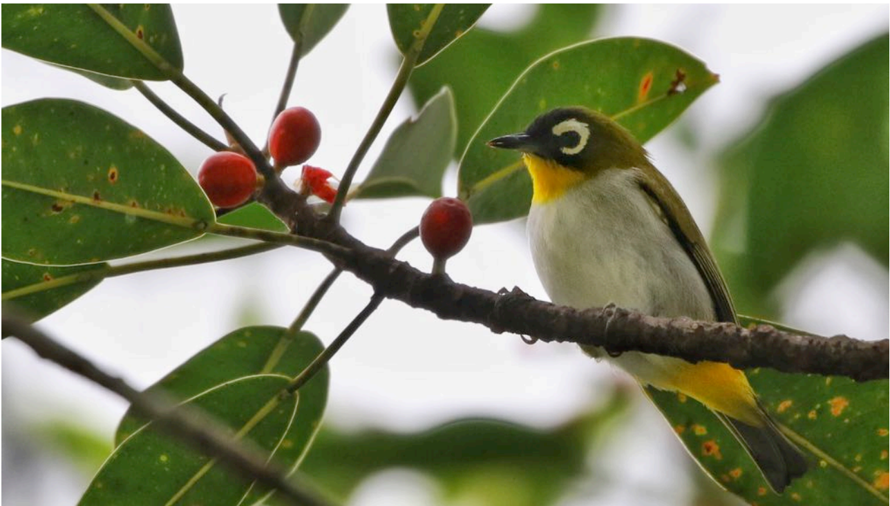
Black-fronted White-eyes are striking birds indeed!

Ashy Robin ◊ (Black-capped R) Heteromyias albispecularis A few seen at Murrumbidgee Pass. Black-sided Robin ◊ (B-bibbed R) Poecilodryas hypoleuca Eventually seen by all on the Fly River. Black-throated Robin ◊ Poecilodryas albonotata Two on the ridge behind Rondon. White-winged Robin ◊ Peneothello sigillata Common in the garden at Kumul. Slaty Robin ◊ (Blue-grey R) Peneothello cyanus Some good looks at Rondon. White-rumped Robin ◊ Peneothello bimaculata One flew across the trail at Tabubil, others remained invisible. White-faced Robin ◊ Tregellasia leucops Really great views at Varirata of these retiring robins.