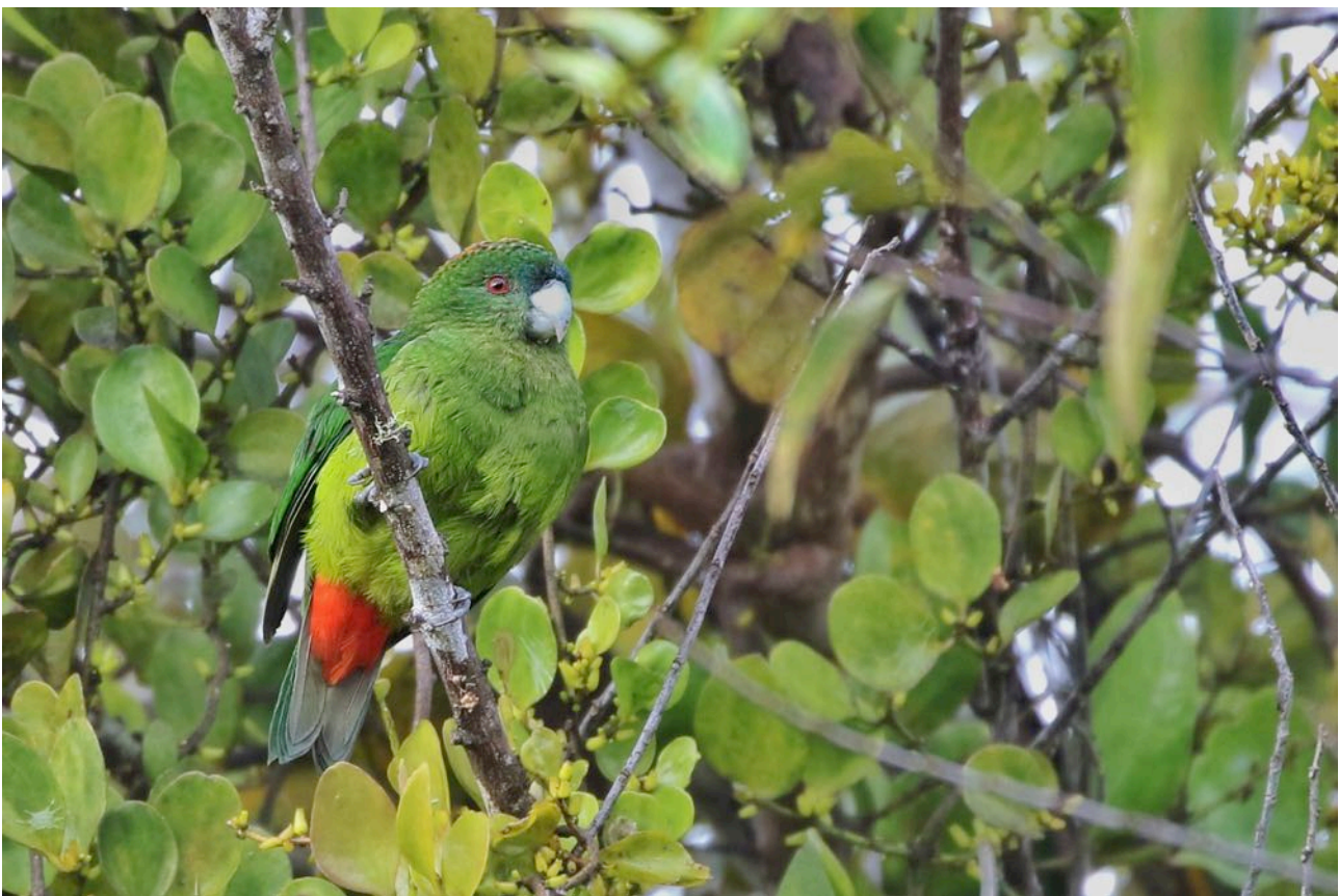
The typically uncommon Madarasz's Tiger Parrot is easy to find at Rondon Ridge!

Due to some unavoidable flight schedule changes, we only had a rushed hour available for birding in the morning. Macgregor's Bowerbird was seen a few times briefly coming in and out of a fruiting tree, and a scarce Yellowish-streaked Honeyeater was enjoyed feeding at eye-level in front of us! The latter species has not been seen on a Birdquest tour for many years, but Rondon is the most reliable site for it. Back in Port Moresby we spent the whole afternoon birding in the Pacific Adventist University grounds, where birds were positively abundant! In a nice change from the shy and skulking forest birds of New Guinea, point blank views of Orange-fronted Fruit-Dove, Grey-headed Mannikin, Black-backed Butcherbird, Fawn-breasted Bowerbird and Papuan Frogmouth were well-received, these species rounding out our list of key targets here. The ponds held a good selection of waterfowl including both Plumed Whistling Duck and Wandering Whistling Duck, Raja Shelduck, Pacific Black Duck, Grey Teal, Australasian Swamphen, Dusky Moorhen, Great Egret, Intermediate Egret, Little Black Cormorant and Little Pied Cormorant. Nankeen Night Heron, Pied Heron and the lovely Comb-