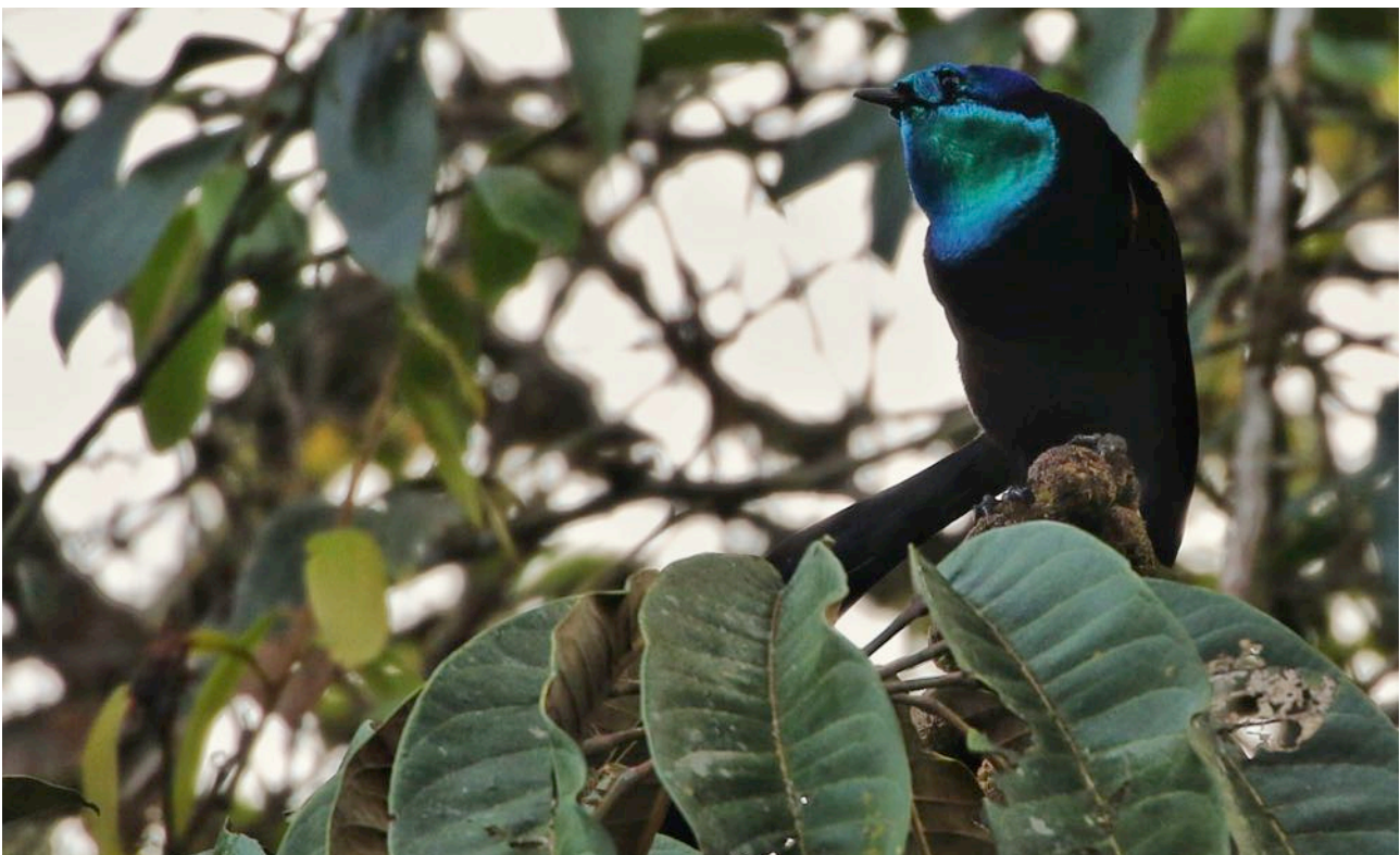
This male Princess Stephanie's Astrapia had an enormously long tail which wowed us as he flew overhead!

Australasian Figbird Sphecotheres vieilloti Many at PAU. Southern Variable Pitohui ◇ Pitohui uropygialis Seen at Tabubil, and around Kiunga. Hooded Pitohui ◇ Pitohui dichrous Common in Varirata. Brown Oriole ◇ Oriolus szalayi A common voice of the lowlands, seen well a few times. Spangled Drongo Dicrurus bracteatus Common in Varirata in particular. Willie Wagtail Rhipidura leucophrys Noted regularly. Northern Fantail ◇ Rhipidura rufiventris One at Tabubil, another on New Britain. Potential splits. Sooty Thicket Fantail ◇ Rhipidura threnothorax One at Varirata. White-bellied Thicket Fantail ◇ Rhipidura leucothorax A pair on the Fly River performed eventually. Black Fantail ◇ Rhipidura atra Singles noted multiple times in the mountains. Chestnut-bellied Fantail ◇ Rhipidura hyperythra Common at Varirata. Friendly Fantail ◇ Rhipidura albolimbata Most common at Kumul. Dimorphic Fantail ◇ Rhipidura brachyrhyncha A few encounters in the highlands. Rufous-backed Fantail ◇ Rhipidura rufidorsa One very showy bird at Tabubil. Drongo Fantail ◇ (Pygmy Drongo, Mountain D) Chaetorhynchus papuensis Nice looks at Varirata.