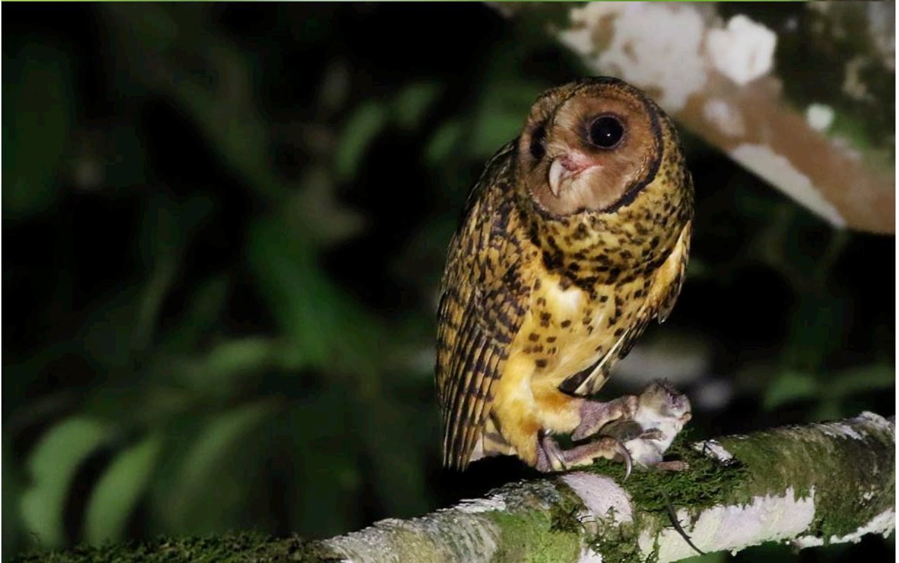
Two magnificent owls of the Bismarck Archipelago – New Britain Boobook (top) and the once-mythical Golden Masked Owl (bottom)!