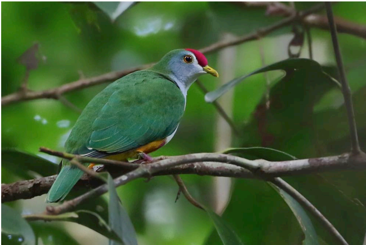
An abundance of fruit-doves cover New Guinea -this is a Beautiful Fruit-Dove.

Pink-spotted Fruit Dove ◊ Ptilinopus perlatus One of the more common fruit-doves, seen a few times. Ornate Fruit Dove ◊ Ptilinopus ornatus One perched by the clearing at Tabubil for a brief period. Orange-fronted Fruit Dove ◊ Ptilinopus aurantiifrons Several at PAU in their usual trees! Superb Fruit Dove Ptilinopus superbus Some seen around Tabubil and Kiunga. Beautiful Fruit Dove ◊ Ptilinopus pulchellus Several seen, one very low down in a tree when up the Fly River. White-bibbed Fruit Dove ◊ (Mountain FD) Ptilinopus rivoli Males and females at Rondon Ridge. Orange-bellied Fruit Dove ◊ Ptilinopus iozonus First seen on the Fly River, more at Varirata. Knob-billed Fruit Dove ◊ Ptilinopus insolitus Pleasantly common on New Britain. Dwarf Fruit Dove ◊ Ptilinopus nainus Several at Varirata.