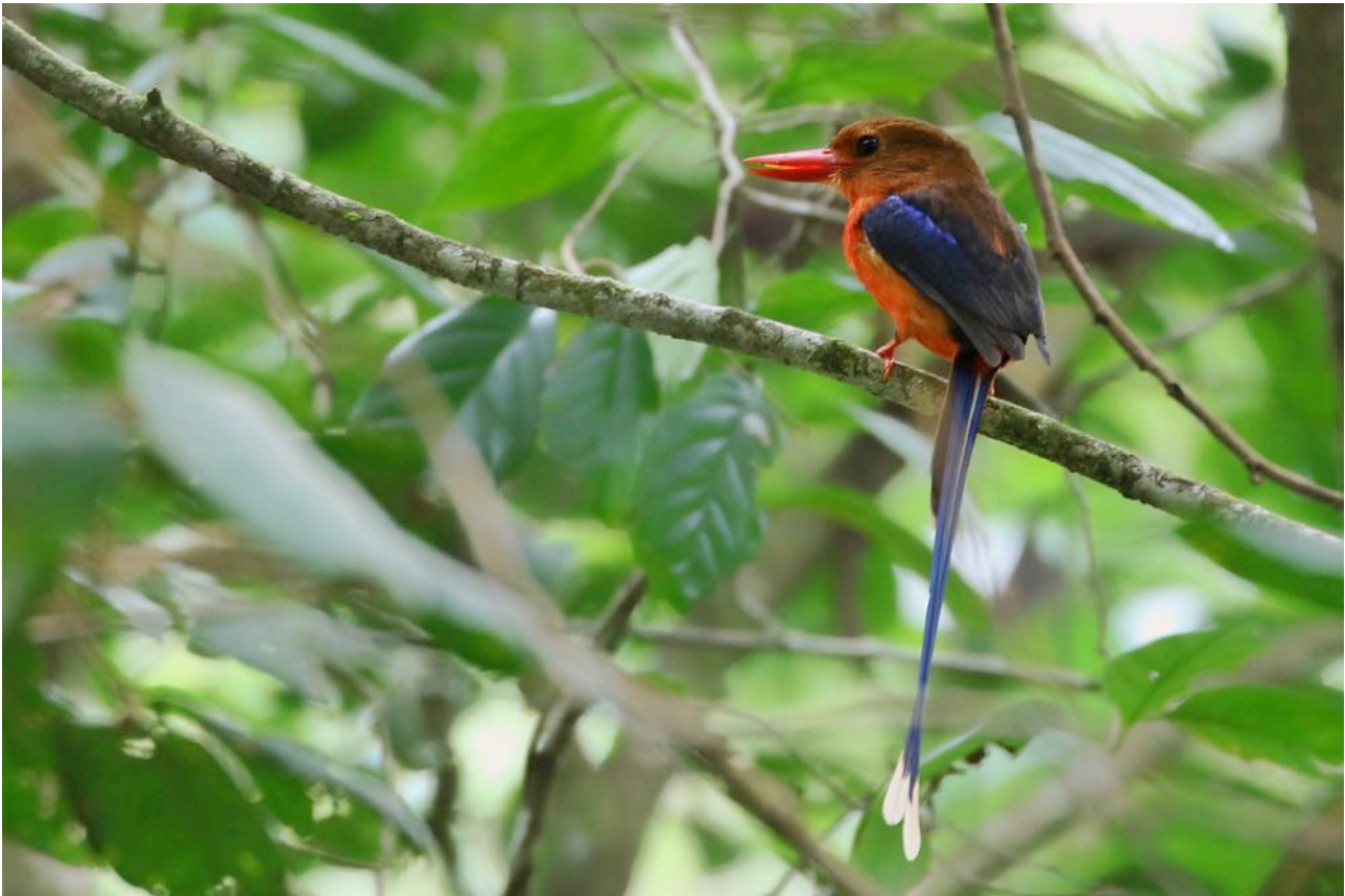
Brown-headed Paradise Kingfisher was perhaps the most impressive of our 19 kingfisher species!

Mountain Swiftlet ◇ Aerodramus hirundinaceus Noted around Kumul. White-rumped Swiftlet ◇ Aerodramus spodiopygius Some near the Kilu River on New Britain. Uniform Swiftlet Aerodramus vanikorensis Common throughout the lowlands. Papuan Spine-tailed Swift ◇ (P Spinetail, P Needle-tail) Mearnsia novaeguineae Common along the Fly River. Oriental Dollarbird Eurystomus orientalis Common along the Fly River.