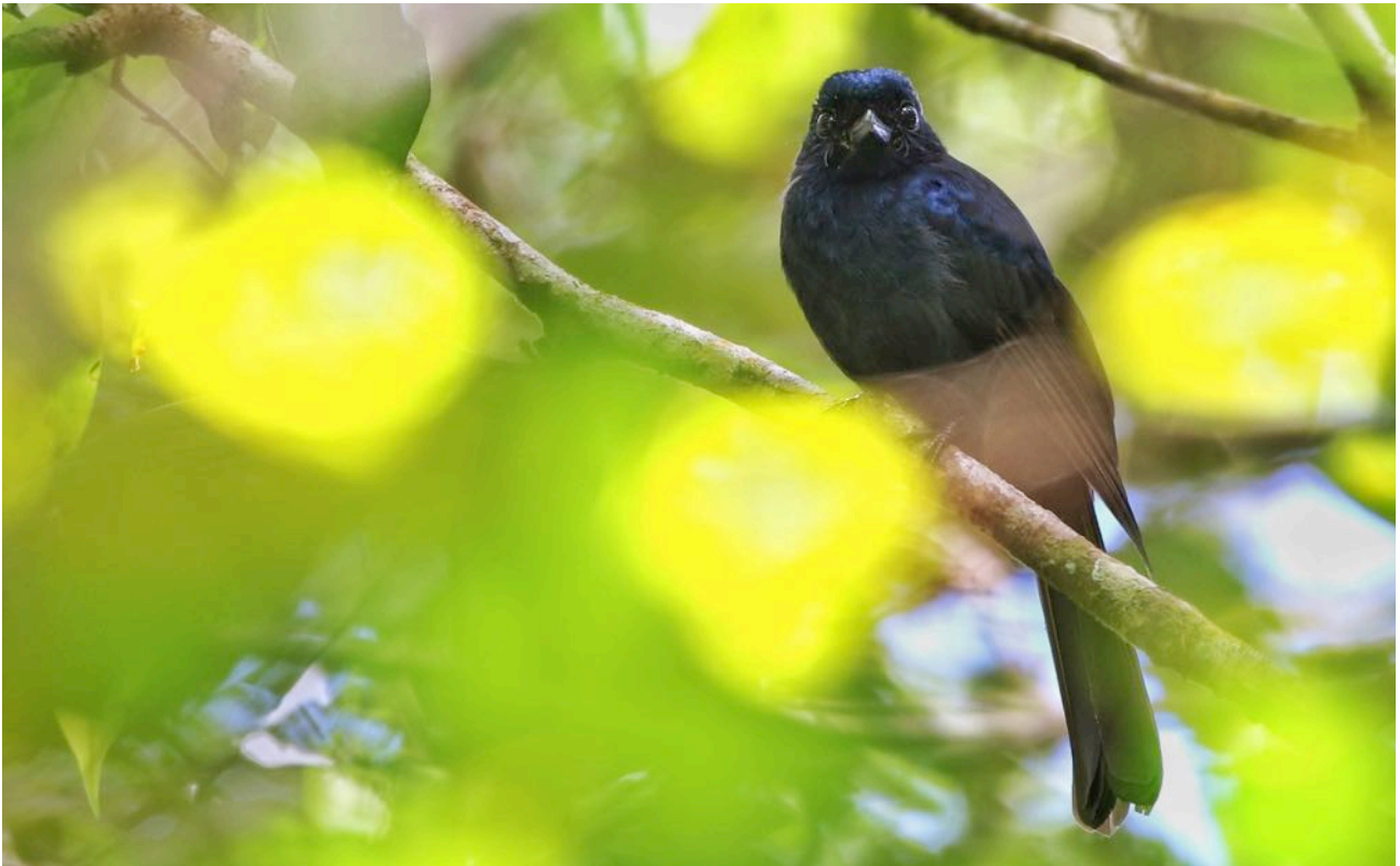
Currently known as the Drongo Fantail, this curious species may in fact be more closely related to the Silktails of Fiji!

Myzomela and, unusually for this site, a Dusky Myzomela! Quite the tree! During the afternoon a pair of Stout-billed Cuckooshrike dropped by, and Varirata proved it still had things left to give by finally allowing us fair views of Piping Bellbird after half a dozen previous attempts on the tour, plus as the icing on the cake we tempted a superb “Grey-naped” Pheasant Pigeon to slowly walk onto the trail ahead of us before it paused and spotted us, subsequently bolting in the opposite direction! Wonderful stuff!