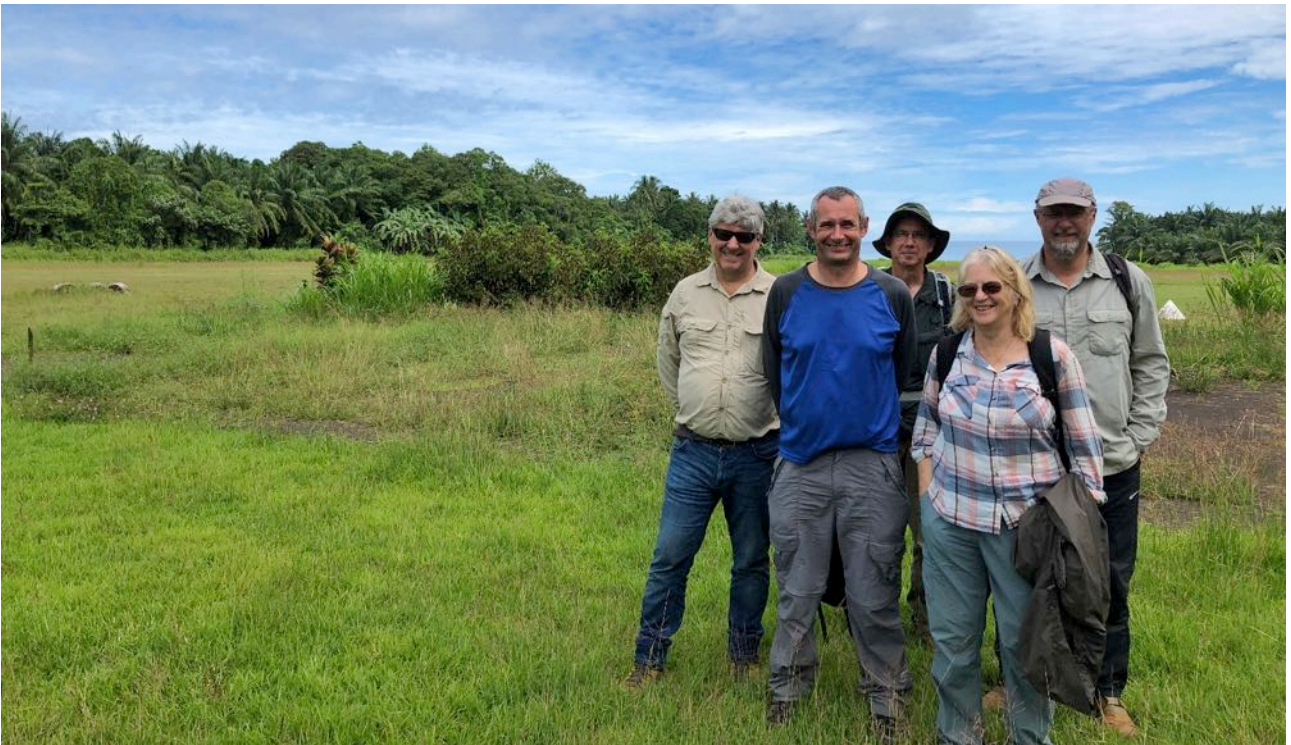
The group waiting at our backup airstrip on New Britain, hoping the volcano wasn't about to erupt again before the backup plane landed!