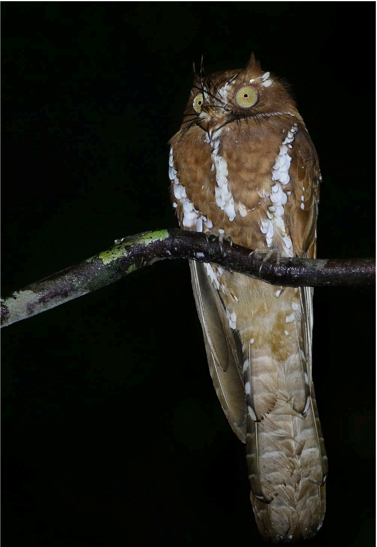
The almost entirely unknown Starry Owlet-nightjar was a Birdquest lifer, but this one sat above us wagging its tail unconcernedly!