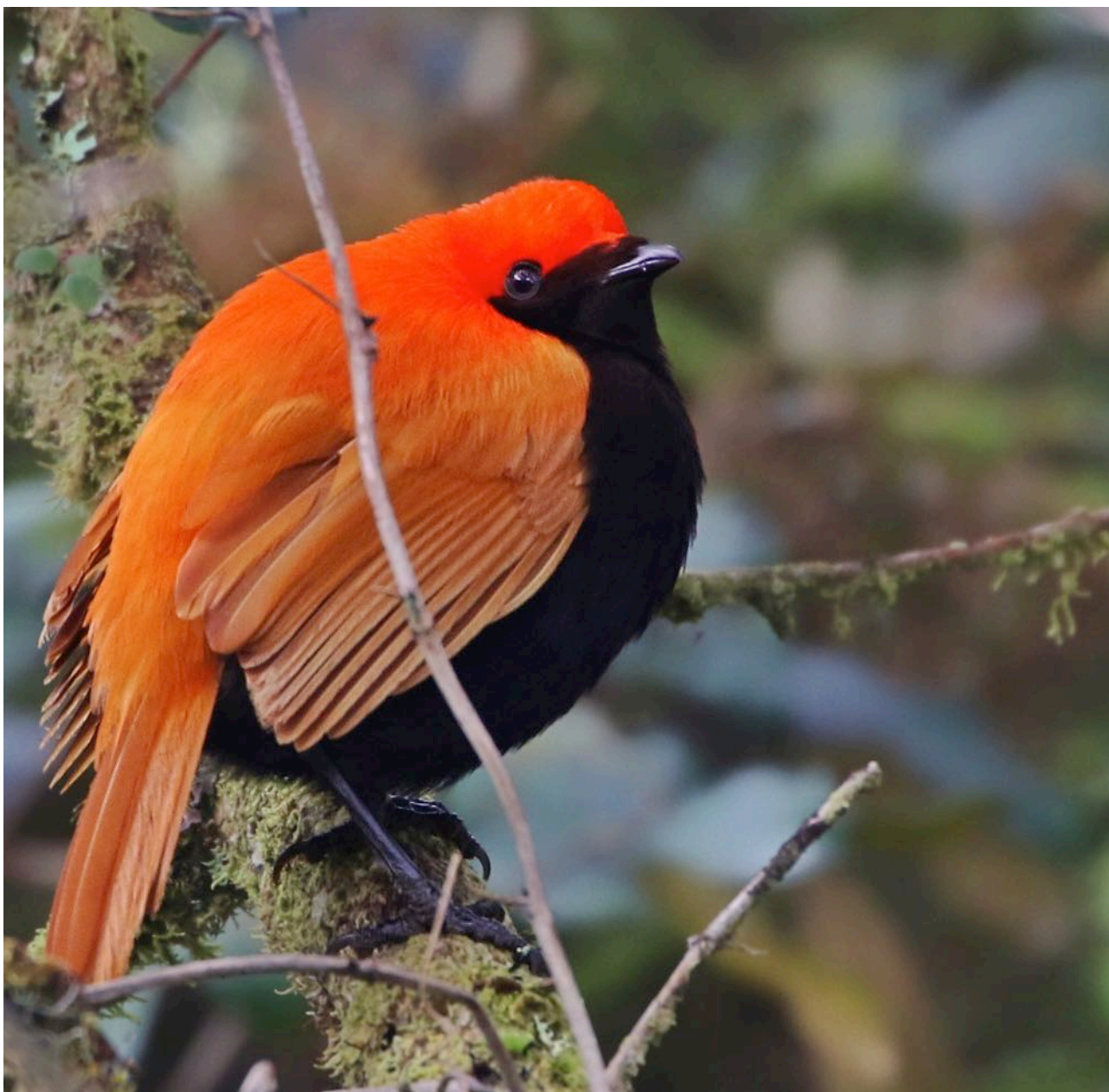
The impossibly vibrant male Crested Satinbird is a star bird at Kumul Lodge - he is often very confiding once he has been located!

Our afternoon session was extremely quiet on the trails, but as soon as we arrived back at the lodge we were overjoyed to spot a male Crested Satinbird feeding unobtrusively in a small tree by our rooms! Only half the group was present, but luckily he stuck for ten minutes and everybody was able to rush over and enjoy his vivid colours! Satisfied, a feeder stakeout until dusk yielded another Bronze Ground Dove and two adult male Ribbon-tailed Astrapia proving that they really do look the best in low light!