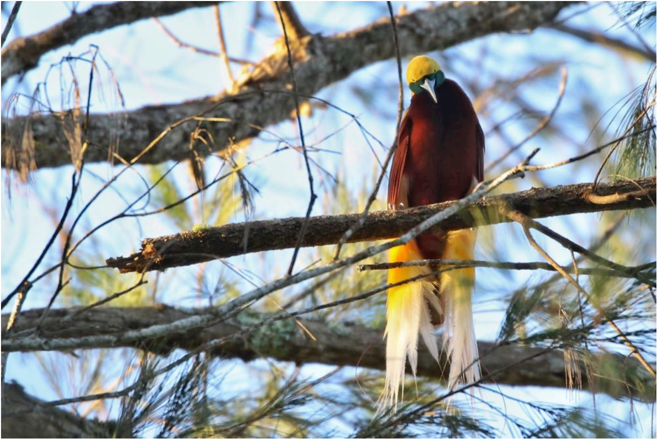
This male Lesser Bird-of-paradise showed very nicely in the Lai River Valley!