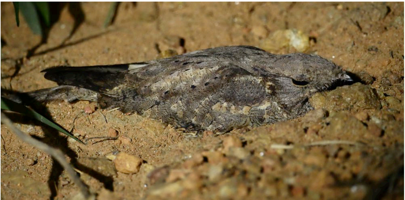
Yellow-winged Bat in Mole NP (top left), Larabanga Mosque (top right) and Plain Nightjar at Kakum (bottom). (Nik Borrow)