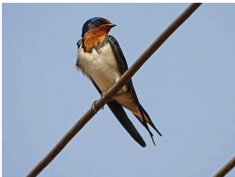
Yellow-bearded Greenbul was seen at Ankasa (left). Red-chested Swallow associated with villages in the north (right). (Nik Borrow)