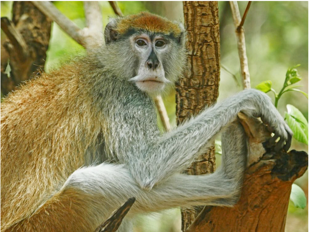
Patas Monkey in Mole NP