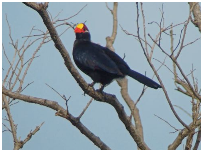
Blue-headed Wood Dove on the track at Ankasa (left). Violet Turacos (right) showed particularly well in Mole NP. (Nik Borrow)

Western Plantain-eater Crinifer piscator Commonly encountered with widespread sightings during this tour. Black-throated Coucal ♦ Centropus leucogaster As is often the case, heard in the forests but views for some. Senegal Coucal Centropus senegalensis Widespread sightings. Blue-headed Coucal Centropus monachus (H) Heard in the Kakum area. Blue Malkoha (Yellowbill) Ceuthmochares aereus A number of good sightings in the forests. Levaillant's Cuckoo Clamator levaillantii Sightings of this spiky-crested cuckoo in Kakum and Mole NPs. Diederik Cuckoo (Didric C) Chrysococcyx caprius 2 sightings in the Kakum area. Klaas's Cuckoo Chrysococcyx klaas Widespread encounters but more often heard than seen. African Emerald Cuckoo Chrysococcyx cupreus At least 2 seen in Kakum NP and heard elsewhere. Dusky Long-tailed Cuckoo ♦ Cercococcyx mechowi (H) A vocal bird would not respond at Ankasa.