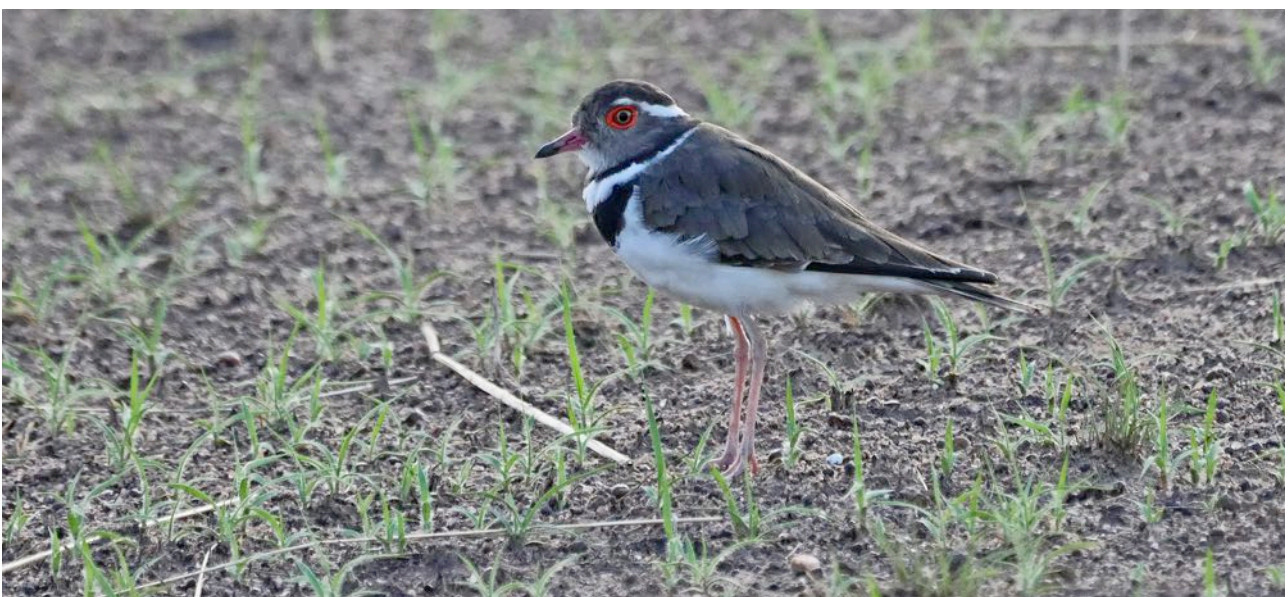
The highly desirable Forbes's Plover was seen well in Mole National Park with up to five individuals seen on the dry plains. (Nik Borrow)