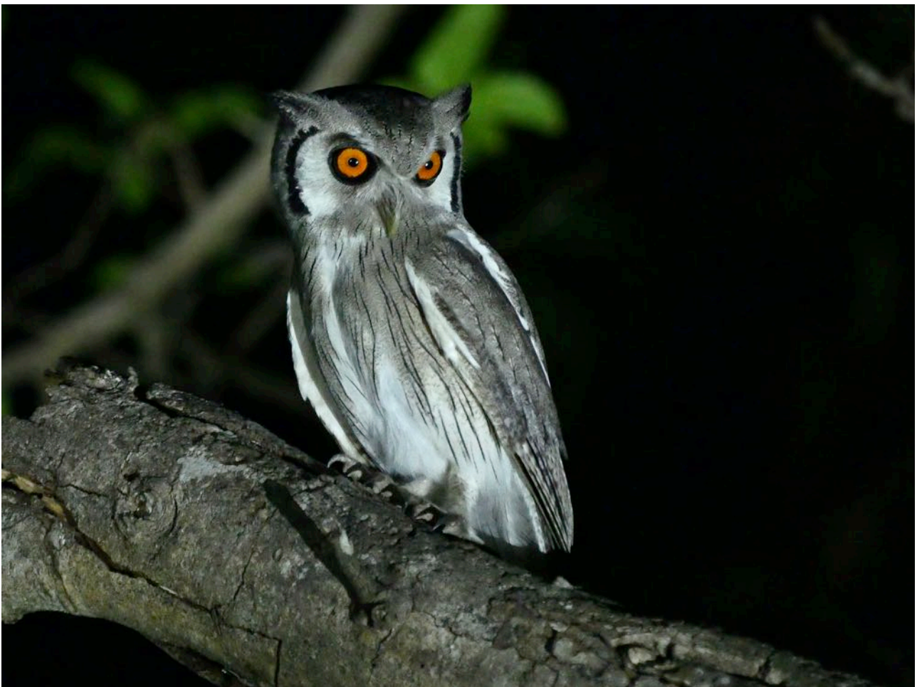
We enjoyed some fabulous views of the striking Northern White-faced Owl during our stay at Mole National Park. (Nik Borrow)

As dusk fell the purring bleeps of African Scops Owls sounded out, Greyish Eagle-Owl could be found around the motel itself and at night we hunted out the stunning Northern White-faced Owl and spectacular Standard-winged Nightjar.