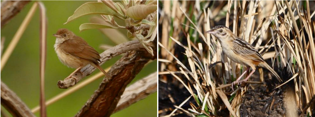
Rufous Cisticola in Mole NP (left) and Black-backed Cisticola in non-breeding dress at Nasia (right). (Nik Borrow)

Whistling Cisticola Cisticola lateralis Seen well in the Kakum farmbrush. Rock-loving Cisticola Cisticola emini Seen well in the Tongo Hills. Winding Cisticola Cisticola marginatus Seen at Nasia Swamp. Croaking Cisticola Cisticola natalensis Easily seen at Shai Hills. Short-winged Cisticola (Siffling F) Cisticola brachypterus Easily seen in the farmbrush and savannahs. Rufous Cisticola ◊ Cisticola rufus 5 seen in Mole NP. Zitting Cisticola Cisticola juncidis 1 seen at Shai Hills. Black-backed Cisticola ◊ Cisticola eximius Great views of several at Nasia Swamp.