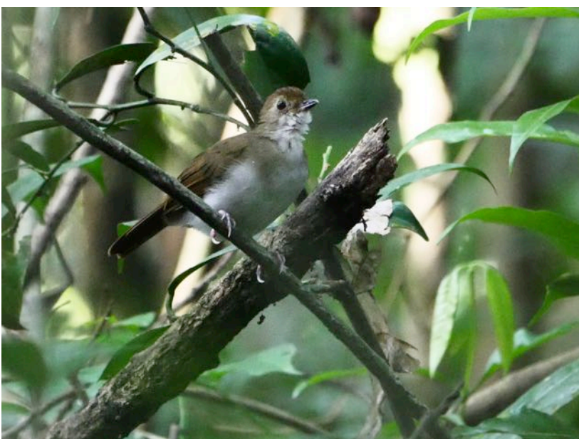
Ankasa birds: The pretty White-bellied Kingfisher (left) on a forest pool and the rare Rufous-winged Illadopsis (right).