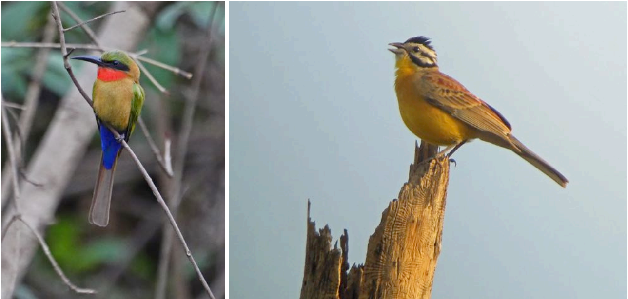
Numerous Red-throated Bee-eaters (left) are a feature of Mole National Park and the pretty Brown-rumped Bunting (right) is another one of the specialties. (Nik Borrow)

Weaver during the short time available. Travelling north along the main road was good for spotting raptors; a perched Beaudouin's Snake Eagle was much appreciated and there were also sightings of Long-crested Eagle, Dark Chanting Goshawk and good numbers of Grasshopper Buzzard. We reached Mole National Park just before dark.