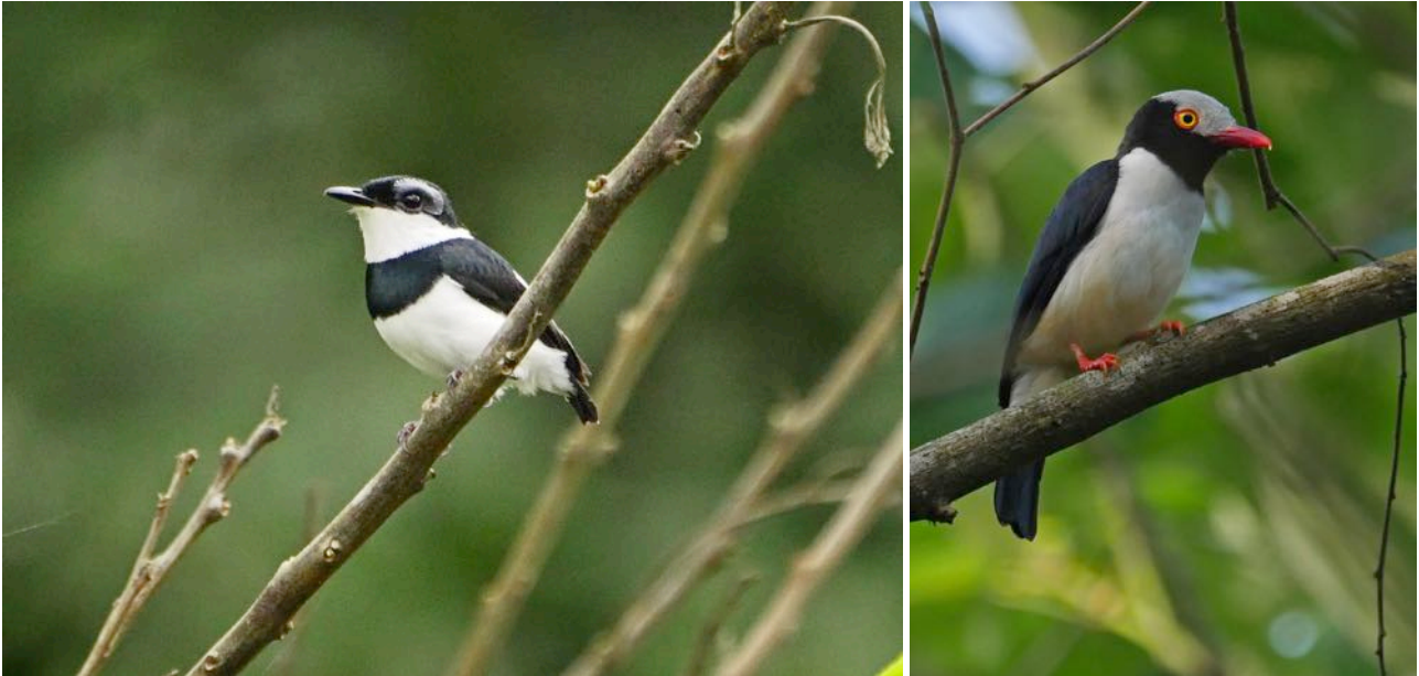
A male West African Wattle-eye in Kakum NP (left). Red-billed Helmetshrike was seen well in Anaksa NP (right). (Nik Borrow)

Rufous-sided Broadbill Smithornis rufolateralis 1 displaying male seen well in the Kakum area. Black-and-white Shrike-flycatcher (Vanga F) Bias musicus 1 female seen at Kakum and a pair in Opro Forest. Senegal Batis ◊ Batis senegalensis Seen well at Shai Hills and in Mole NP. West African Wattle-eye ◊ Platysteira hormophora Great views in Kakum NP. Brown-throated Wattle-eye (Common W) Platysteira cyanea Scattered sightings. Red-cheeked Wattle-eye ◊ Platysteira blissetti It took us a long time to get good views of a pair at Kakum. White-crested Helmetshrike (W H-s) Prionops plumatus Busy flocks in Mole NP. Red-billed Helmet-shrike ◊ Prionops caniceps Great views of these characterful birds at Anaksa.