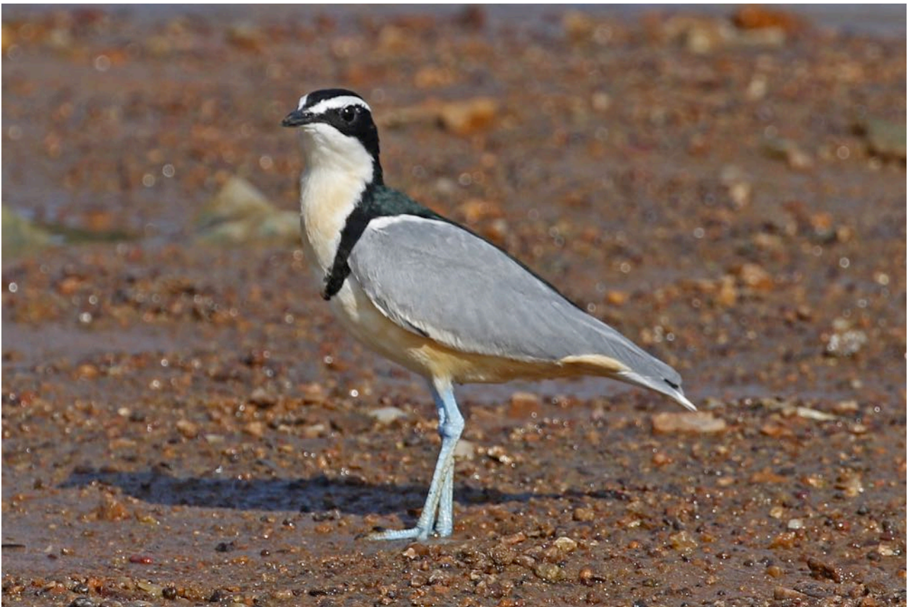
As usual we enjoyed amazing views of the wonderful Egyptian Plover in the far north.

Starting early the next morning we headed northeast almost to the border with neighbouring Burkina Faso where we paid a visit to the White Volta for one very special bird in particular. This was the sublime Egyptian Plover and we were treated to some really superb views of this unique shorebird in an attractive setting. We watched at least six adults for as long as we wished as they fed on the open sandbanks and engaged in territorial squabbles. Some members of the group travelled across to the sandbank by pirogue to get even closer views.