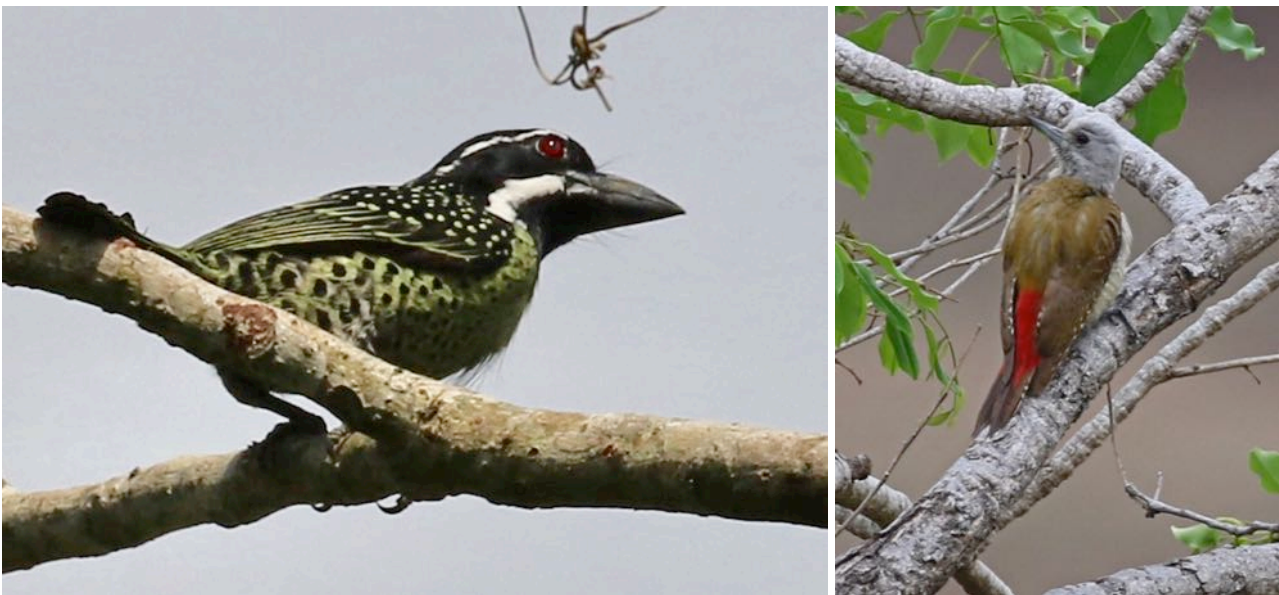
A Hairy-breasted Barbet at Opro Forest (left) and a female African Grey Woodpecker in Mole NP (right) (David Turner)

Brown-backed Woodpecker Dendropicos obsoletus A male seen in Mole NP. Common Kestrel Falco tinnunculus Mostly noted in towns during journeys. Fox Kestrel ◊ Falco alopex Great views of a pair in the Tongo Hills. Grey Kestrel Falco ardosiaceus 4 widespread sightings in open areas. Red-necked Falcon Falco [chicquera] ruficollis Terrific views of a pair at Sapeliga. African Hobby Falco cuvierii Excellent views of 1 on the Winneba Plains. Lanner Falcon Falco biarmicus 1 at Shai Hills. Red-fronted Parrot Poicephalus gulielmi Heard at Bonkro and 1 seen flying over Bobiri Forest. Brown-necked Parrot ◊ Poicephalus fuscicollis 1 seen in Mole NP. Senegal Parrot Poicephalus senegalus Good numbers at Shai Hills with more in the north. Rose-ringed Parakeet Psittacula krameri 3 in Mole NP and 1 at Sapeliga.