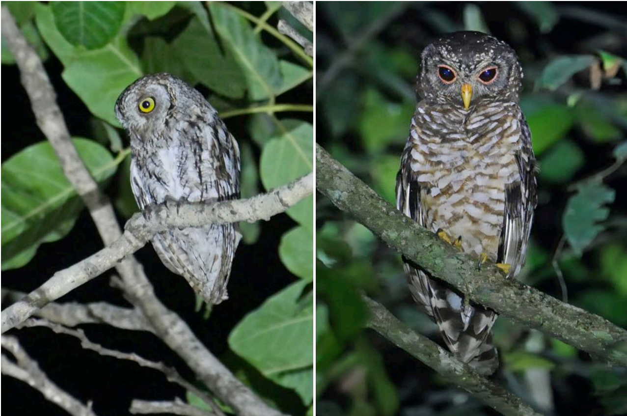
African Scops Owl in Mole NP (left) and an African Wood Owl that frequented our Ankasa camp in the dead of night (right).

Olive Long-tailed Cuckoo Cercococcyx olivinus (H) None of those heard in the forests would respond. Red-chested Cuckoo Cuculus solitarius 1 in Kakum NP. African Cuckoo Cuculus gularis 1 on the Winneba Plains and excellent views in Mole NP. African Scops Owl Otus senegalensis It took a while but finally seen well in Mole NP. Northern White-faced Owl Ptilopsis leucotis Wonderful views at Mole. Greyish Eagle-Owl Bubo cinerascens 1 frequented our hotel in Mole NP after dark. Fraser's Eagle-Owl ◊ Bubo poensis Fantastic views of 1 at Ankasa. Akun Eagle-Owl ◊ Bubo leucostictus Thanks to Paul's hard work 1 was seen at Ankasa. African Wood Owl Strix woodfordii (LO) Nik was the only one to struggle out of bed at Ankasa NP.