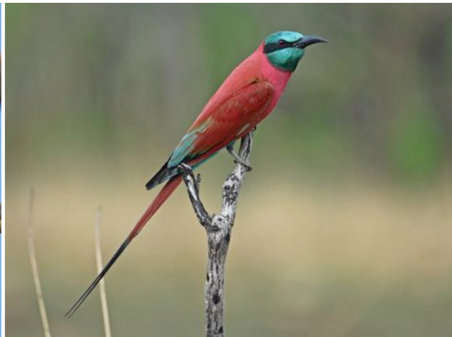
Green Bee-eater at Tono Dam (left) and Northern Carmine Bee-eater in Mole NP (right). (Nik Borrow)

Green Wood Hoopoe Phoeniculus purpureus Small numbers in the south and Mole NP. Black Scimitarbill Rhinopomastus aterrimus Singletons in Mole NP and at Tono Dam. Northern Red-billed Hornbill Tockus erythrorhynchus Easily seen in the far north. (West) African Pied Hornbill ◊ Lophoceros [fasciatus] semifasciatus Common and easy to see on this tour. African Grey Hornbill Lophoceros nasutus Easily seen in the savannah zone. Red-billed Dwarf Hornbill Lophoceros camurus 3 were seen in Bobiri Forest. Piping Hornbill ◊ (Western P H) Bycanistes fistulator Seen well at Ankasa. Brown-cheeked Hornbill ◊ Bycanistes cylindricus 5 were seen in flight in the Kakum area. Yellow-casqued Hornbill ◊ (Y-c Wattled) Ceratogymna elata Glimpses through the canopy at Ankasa. Black Dwarf Hornbill ◊ (Western Little H) Horizocerus hartlaubii Great views of a male in Bobiri Forest. White-crested Hornbill ◊ (Western Long-tailed H) Horizocerus albocristatus 2 sightings in the forests. Naked-faced Barbet Gymnobucco calvus Good looks at this 'punkish' barbet in Kakum NP.