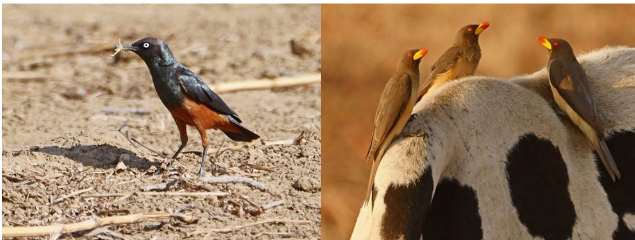
A Chestnut-bellied Starling (left) in the far north on the border with Burkina Faso and some Yellow-billed Oxpeckers (right) feasting on some tick laden cattle. (Nik Borrow)

Our time in the north had come to a close and now the long journey back to Kumasi lay ahead of us. We spent most of the day travelling but a productive stop at the swamp allowed us to photograph and document satisfactorily the Lesser Jacana. We also obtained excellent looks at some showy Black-backed Cisticola and everyone got wonderful views of flocks of pretty little Orange-breasted Waxbills.