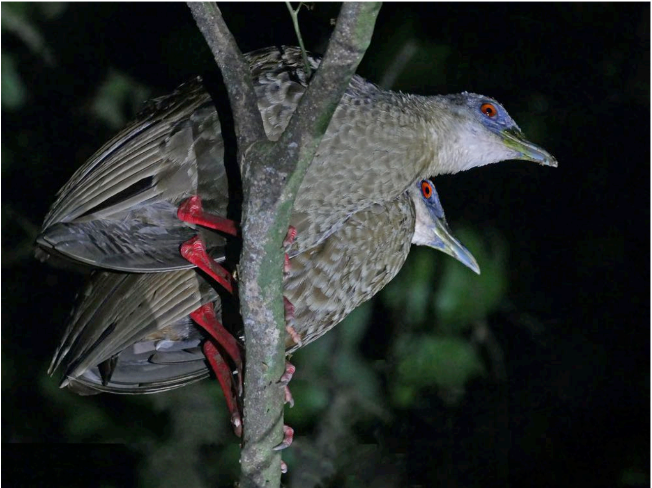
A pair of Nkulengu Rails on their roost in Ankasa Conservation Area was the big prize of our stay there.