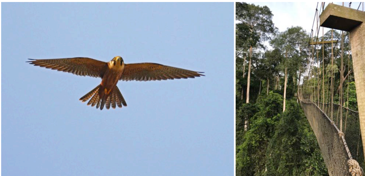
An African Hobby (left) put on a wonderful show over the Winneba Plains. A visit to the famous canopy walkway in Kakum National Park is always a highlight of the tour (right). (Nik Borrow)

Hobby was on show as we set foot in the grasslands and a pair of gorgeous Yellow-crowned Gonolek was seen but apart from Western Marsh Harrier, African Cuckoo, Singing Cisticola and Tree Pipit there was little else added to our lists. A Black-bellied Bustard was heard calling but we could not see it but a pair of Senegal Lapwing spotted just as we were leaving certainly made the stop worthwhile. A Slender-billed Weaver was seen at a colony just as it was getting dark and we then drove the remaining distance to the comfortable 'Rainforest Lodge' near Kakum National Park for a three nights stay.