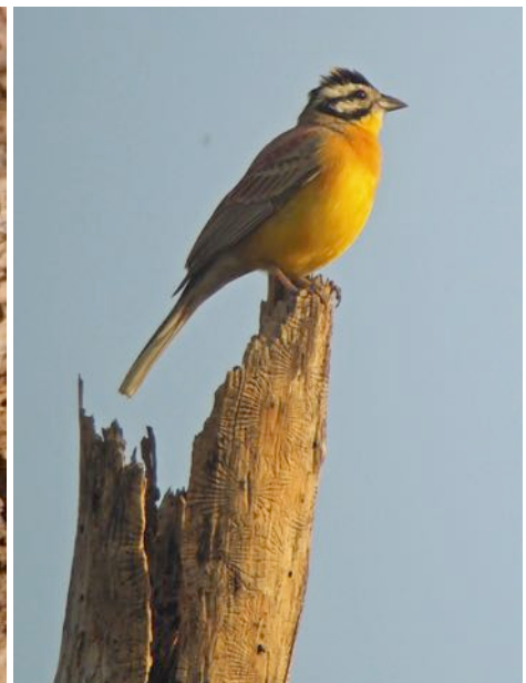
A female Black-faced Firefinch at Nasia Swamp (left) A male Brown-rumped Bunting in Mole NP (right). (Nik Borrow)