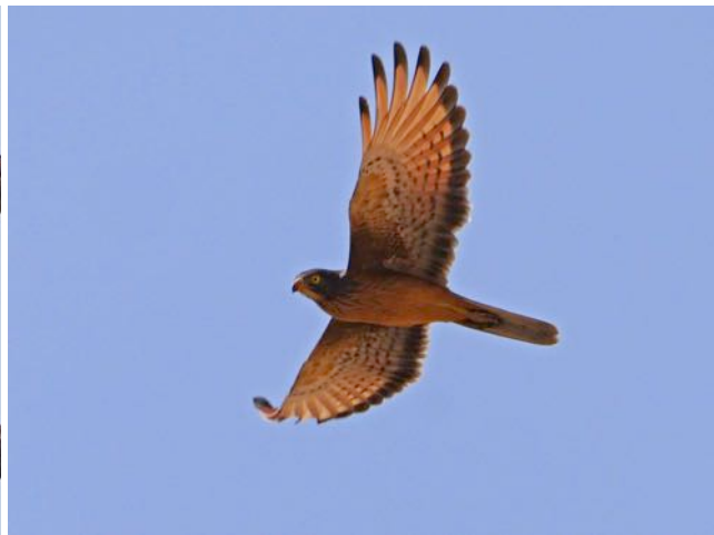
The journey north gave us Double-toothed Barbet (left) and our first Grasshopper Buzzards (right). (Nik Borrow)

From Kumasi we spent most of the day travelling as our long journey took us northwards to Mole National Park. While it was still relatively cool we made a stop on the edge of Opro Forest and although it did not look very promising the walk was certainly worthwhile. The big prize was the sighting of a small party of Capuchin Babblers, a notoriously difficult species to see and we were quite happy with our views of them as they crossed the track ahead of us only to melt into the bush as if they were never there! A Least Honeyguide was another good discovery and we enjoyed some scope views of this uncommon bird. Palearctic migrant Melodious Warbler and European Pied Flycatcher were seen, we just caught the tail-end of a fast disappearing Red-fronted Parrot and we also spotted Lizard Buzzard, Ashy Flycatcher and Black-necked