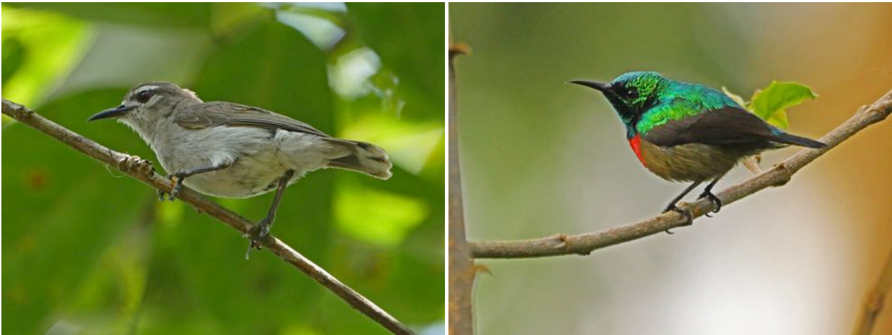
Mangrove (or Brown) Sunbird at the Ebi River (left) and a male Tiny Sunbird in Kakum NP (right).

Olive Sunbird Cyanomitra olivacea Common and widespread in the various forests. Buff-throated Sunbird ◊ Chalcomitra adelberti A beautiful sunbird, seen well at Kakum. Scarlet-chested Sunbird Chalcomitra senegalensis Common in the north. Olive-bellied Sunbird Cinnyris chloropygius Small numbers in the Kakum forests. Tiny Sunbird ◊ Cinnyris minullus A pair seen from the canopy walkway in Kakum NP.