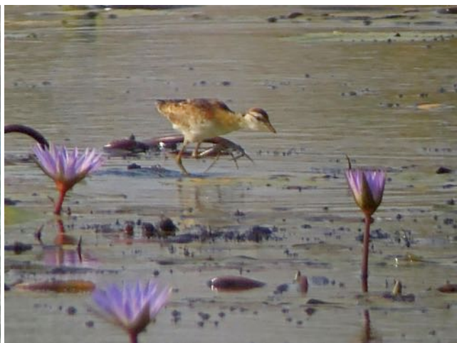
Denham's Bustard in Mole NP (left) and this Lesser Jacana (right) at Nasia Swamp was the first record for Ghana!