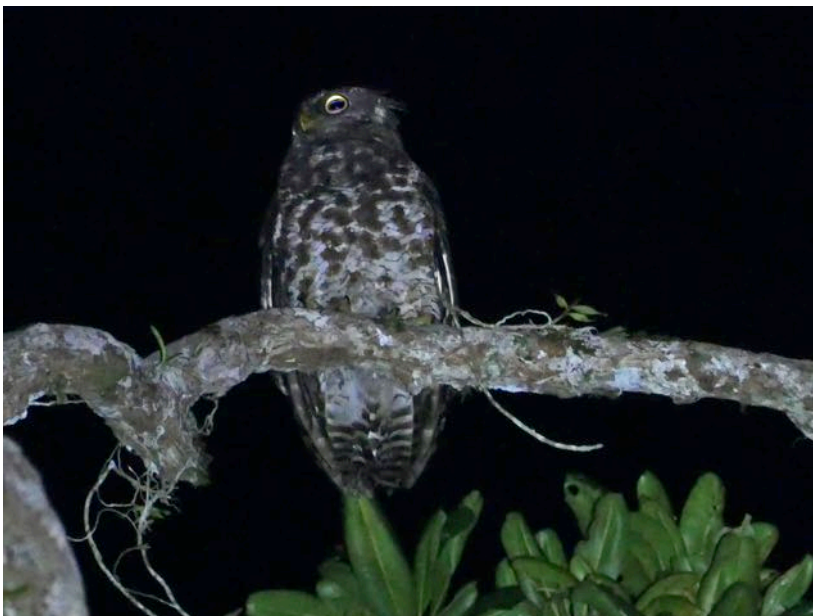
The stunning male Red-fronted Antpecker (left). A superb Akun Eagle-Owl at the top of a tall forest tree (right). (Nik Borrow)

A Red-chested Goshawk was calling and displaying at dawn over the forest before once again we slipped in between the enormous trees in search of the rare Upper Guinea endemic Rufous-winged Illadopsis. We reached a known territory and fortunately the bird was vocal. Even so it was not initially easy to see but with perseverance everyone managed some good views. In the same area was Yellow-bearded Greenbul, another scarce regional endemic. Red-tailed Bristlebill was also seen and along the river we found a male African Finfoot as well as a super Shining-blue Kingfisher and pairs of Cassin's Flycatchers.