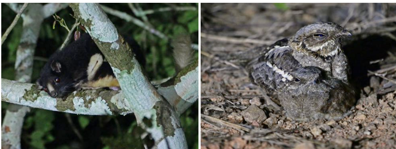
At night we managed some superb views of the bizarre Pel's Anomalure (left) and a Long-tailed Nightjar with its chick (right) was enough to melt the hardest heart.

As the morning wore on so the sweat bees increased as the humidity rose and the first groups of screaming visitors arrived to play on the walkway. We therefore deemed it best to make a hasty retreat and sought the shade of the forest interior. In the dim, tangled mesh of vegetation a pair of seldom seen Olivaceous Flycatcher performed and we enjoyed great views of a skulking Blackcap Illadopsis and the pretty little 'Ghana' Forest Robin. This is the recently described form inexpectatus that has even been proposed to be a separate species!