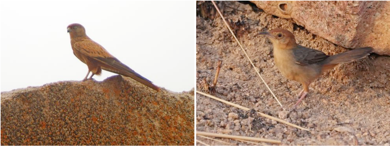
We saw the two main targets in the Tongo Hills quite easily: Fox Kestrel (left) and Rock-loving Cisticola (right).

Soon after we harvested our next target, the aptly named Rock-loving Cisticola running over the rocks. A string of new birds kept coming with a super male Black-faced Firefinch, Familiar Chat and plenty of Gosling's Buntings. From the hills it was only a relatively short distance to our destination of Bolgatanga for a two nights stay.