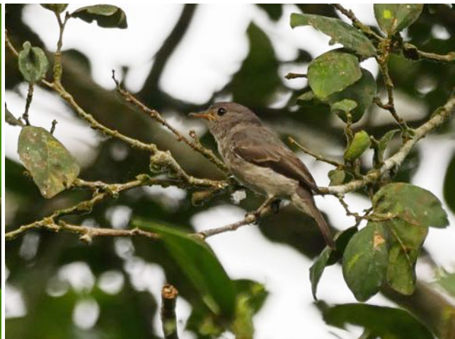
Two tricky flycatchers from Kakum NP; Olivaceous Flycatcher (left) and Little Grey Flycatcher (right). (Nik Borrow)