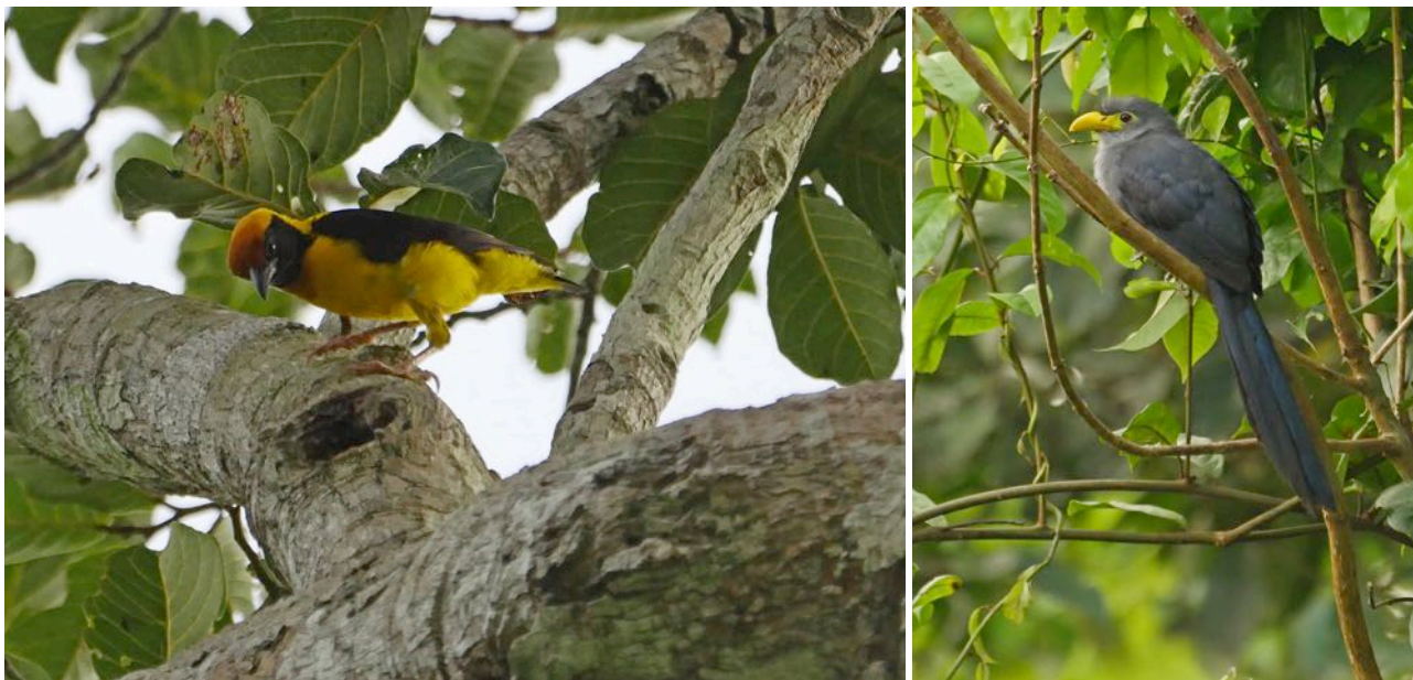
A male Preuss's Weaver (left) was seen well as it crept along the boughs of the huge tree we were under. The canopy walkway is a great place to see Blue Malkoha (right). (Nik Borrow)

Higher in the trees a male Preuss's Weaver and Red-headed Malimbos crept along the bare branches and White-breasted, Chestnut-breasted and Grey-headed Nigritas were seen whilst the spreading canopies allowed good foraging opportunities for a spiky-crested Levillant's Cuckoo, Red-chested Cuckoo, Naked-faced Barbet, Sabine's Puffback, Blue and Purple-throated Cuckooshrikes, Wood Warbler, Rufous-crowned Eremomela, Little Grey Flycatcher, Maxwell's Black and Yellow-mantled Weaver.