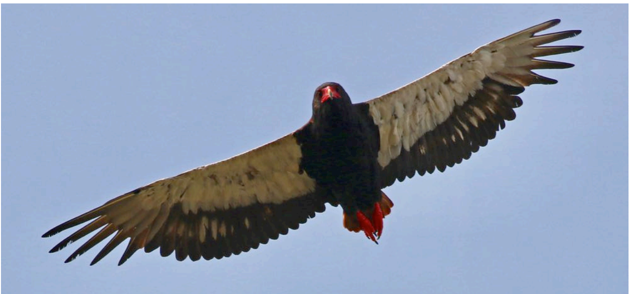
We saw good numbers of the 'Near-Threatened' Bateleur in Mole National Park. (David Turner)