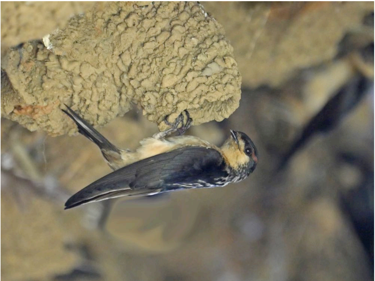
Breeding activity at the colony of Preuss's Cliff Swallows north of Kakum was getting well underway.

Ethiopian Swallow Hirundo aethiopica Commonly noted during the tour on journeys in the south. Wire-tailed Swallow Hirundo smithii Easily seen in Mole NP. White-bibbed Swallow (White-throated Blue S) Hirundo nigrita A pair on the Pra River. Lesser Striped Swallow Cecropis abyssinica Widespread sightings during this tour. Red-breasted Swallow (Rufous-chested S) Cecropis semirufa 1 on the edge of Kakum. West African Swallow ◊ Cecropis domicella 1 at Sapeliga. Preuss's Cliff Swallow ◊ Petrochelidon preussi Seen well at their nesting site north of Kakum.