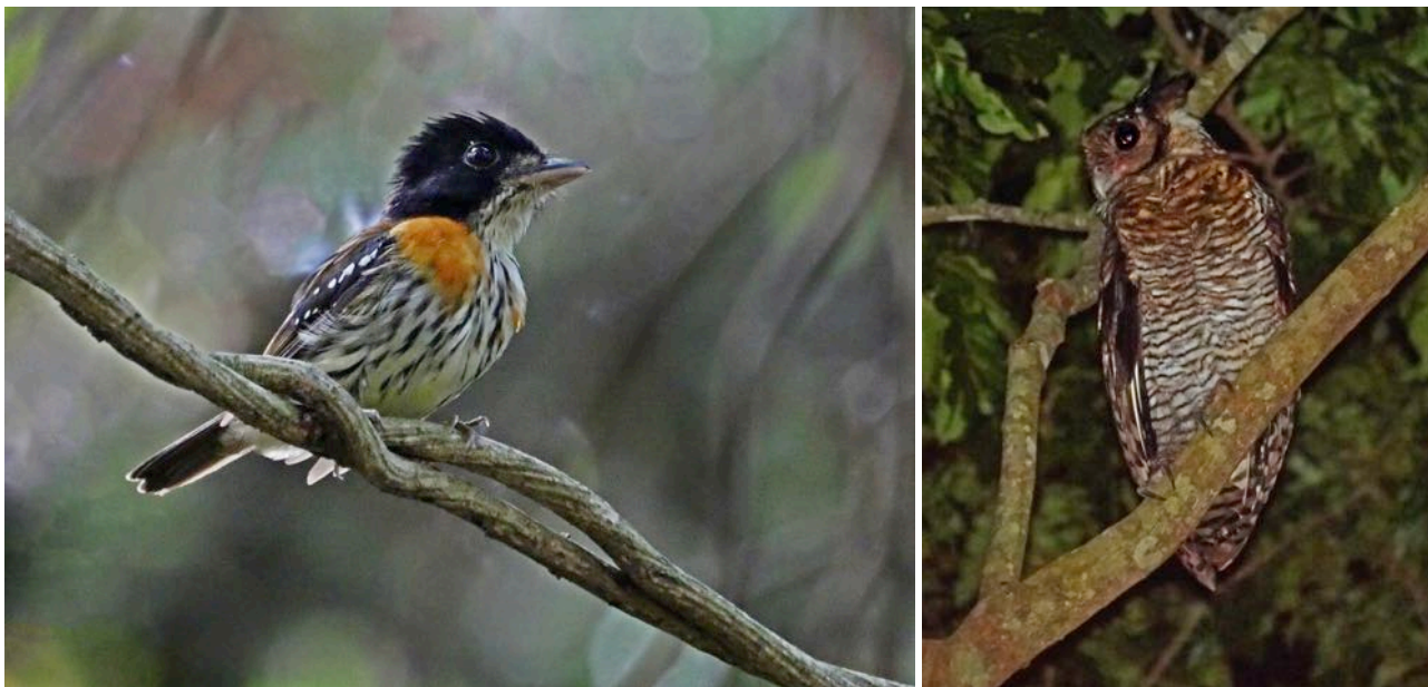
A male Rufous-sided Broadbill (left) allowed prolonged views in the Kakum area. On our first evening at Ankasa we found a superb Fraser's Eagle Owl (right).

White-eye, Green-headed Sunbird, Red-headed Quelea and Black-and-white Mannikin to the list before moving into the forest itself which although rather quiet produced the regional endemic Western Bearded Greenbul and Grey-headed Bristlebill, some rather good views of the sometimes tricky White-throated Greenbul as well as Shining Drongo, Little Grey Greenbul, a flock of Spotted Greenbuls, Violet-backed Starling, Fraser's Sunbird and Western Bluebill.