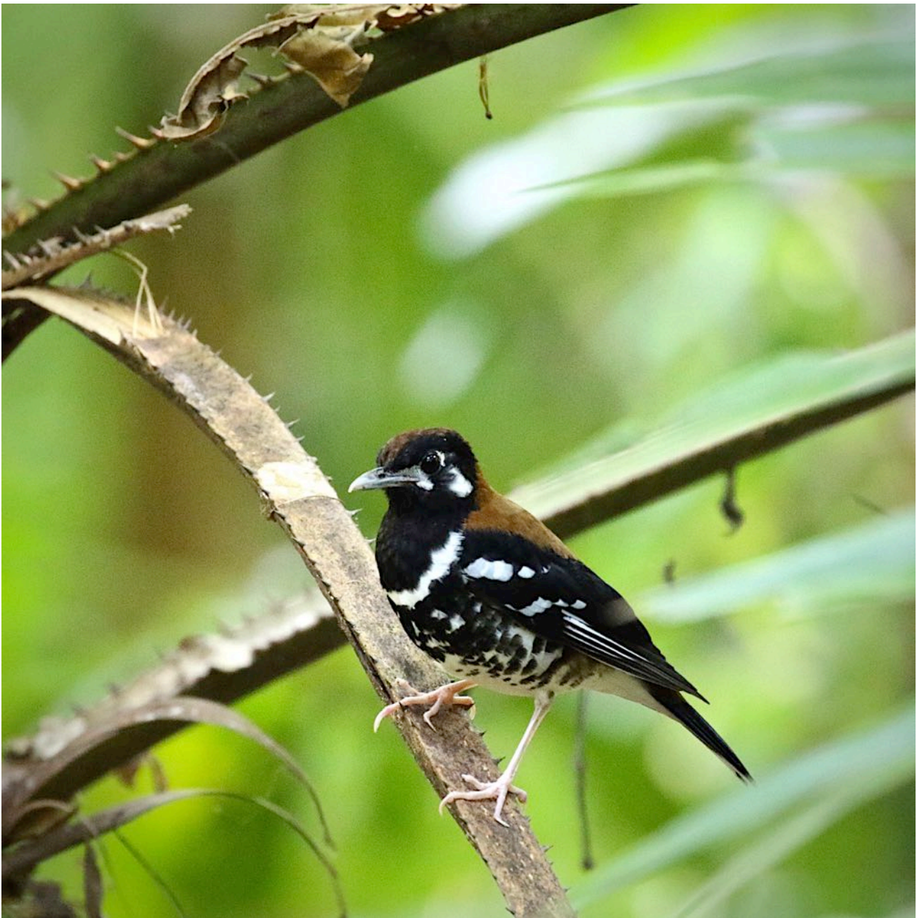
Red-backed Thrush at Tangkoko (Craig Robson)

The marshes and pools accessible from the main roads also brought Wandering Whistling Duck, Sunda Teal, Dusky Moorhen, White-browed Crake, Pacific Golden Plover, and Swinhoe's Snipe.