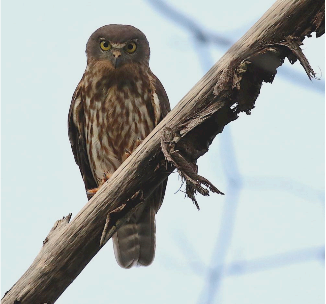
Barking Owl

Rather reluctantly, leaving Morotai behind, we took a large ferry south to Tobelo, on the north-east coast of the north-west arm of Halmahera. Seabirds were highlighted by Great Frigatebird and Brown Booby, and there were good numbers of Spinner Dolphins.