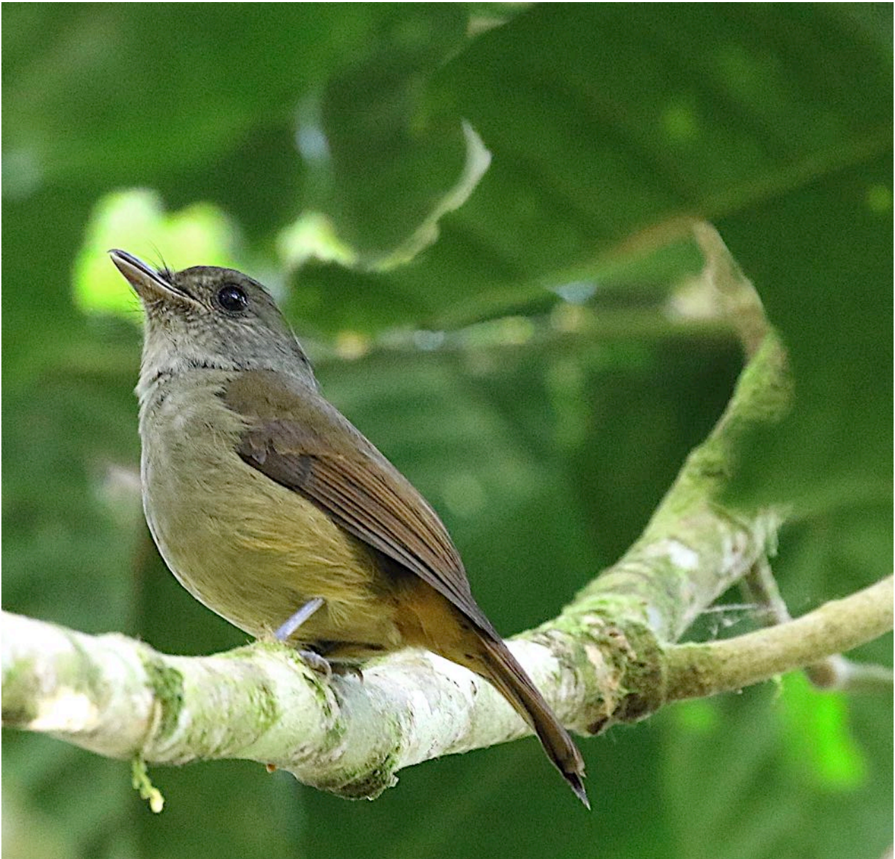
Matinan Flycatcher (Craig Robson)

Cream-throated White-eye (Bacan W-e) Zosterops atriceps One seen very well. Another new bird for Birdquest. Cream-throated White-eye (Obi W-e) Z. [atriceps] sp./ssp. nov. A singing bird seen very well in the uplands. Black-crowned White-eye (B-fronted W-e) Zosterops atrifrons Common in Sulawesi; NC ( surdus ) & N (nominate). Metallic Starling Aplonis metallica The commonest starling on Morotai, Halmahera, Bacan and Obi (nominate). Moluccan Starling Aplonis mysolensis Quite a few at Foli and the Buli Road; few Bacan and Obi. Monotypic. Short-tailed Starling Aplonis minor Lore Lindu and the Sedoa River area (nominate). Sulawesi Myna (S Crested M, Short-crested M) Basilornis celebensis 2 Malino, 1 Toraut, 2 Molibagu Rd. White-necked Myna (Northern W-n M) Streptocitta [albicollis] torquata Four at Tambun and three at Toraut. White-necked Myna (Southern W-n M) Streptocitta [albicollis] albicollis Four at Karaenta. Fiery-browed Starling (Flame-b Myna) Enodes erythropris Lore Lindu NP ( centralis ) & G. Ambang ( erythropris ). Grosbeak Starling (Finch-billed Myna) Scissirostrum dubium Large flocks at scattered locations N Sulawesi. Javan Myna (introduced) Acridotheres javanicus