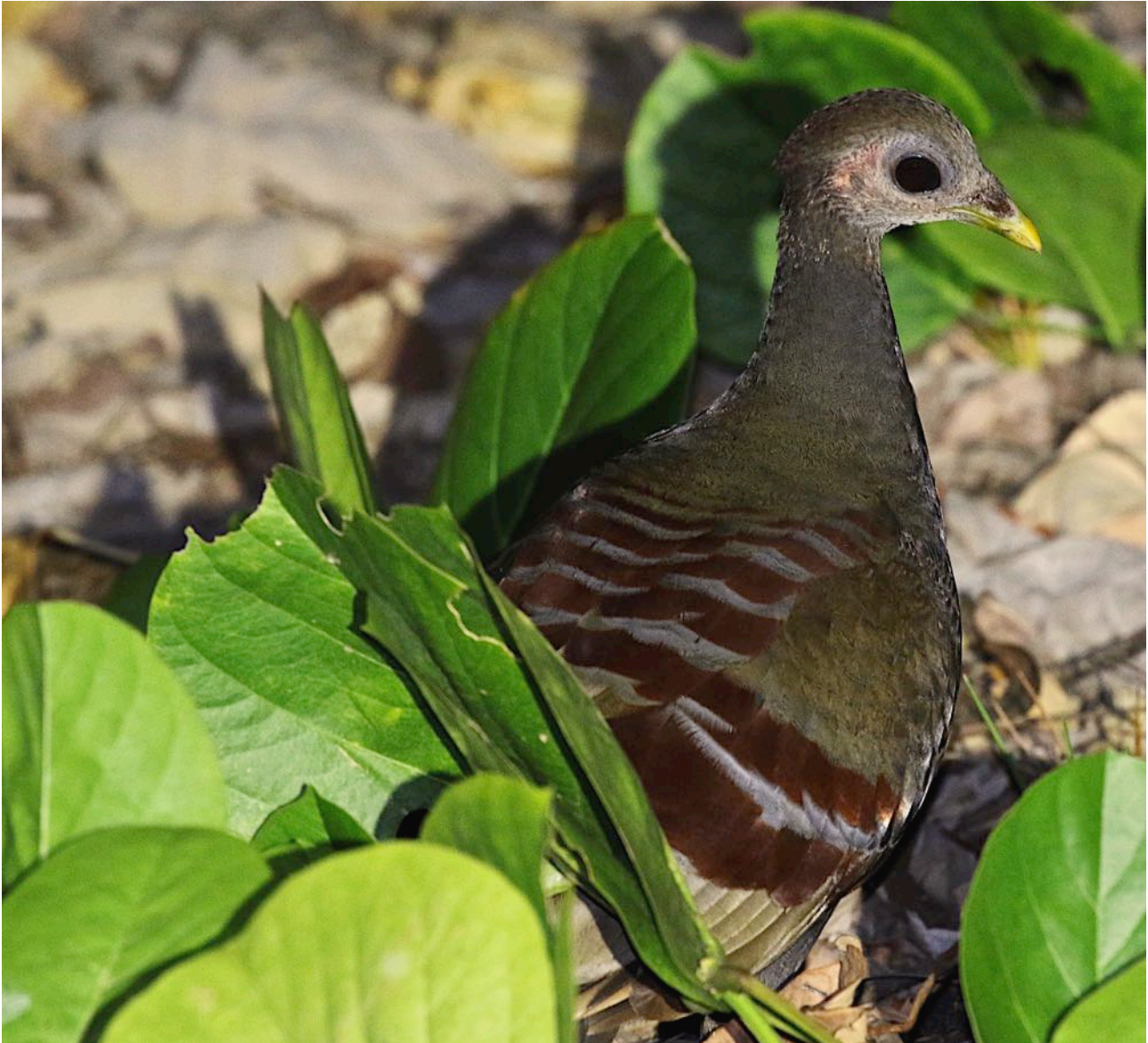
Moluccan Megapode

The next morning, we didn't start too early, and made the long drive around to Foli on the west coast of the north-east arm of Halmahera. Arriving at the homestay by mid-afternoon, we still had time to begin our exploration of the area. Along the old logging road above the village, we found more North Moluccan specialities in the form of Spectacled Imperial Pigeon, Goliath Coucal, Halmahera Spangled Drongo, and Halmahera (or Cream-throated) White-eye. After nightfall we tracked down a superb Moluccan Owlet-Nightjar, that posed motionless for a long time, and a co-operative pair of Halmahera Boobooks.