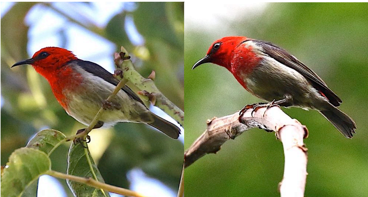
Sulawesi Myzomela on Sulawesi (left) and 'Obi' Myzomela

Dusky Friarbird (Morotai F) Philemon fuscicapillus Common on Morotai (18 logged). A new species for Birdquest. White-streaked Friarbird (Halmahera F) Melitograis gilolensis Four seen on Halmahera, and some good views. Dark-eared Myza (Lesser M) Myza celebensis 4 Lompobattang ( meridionalis ), 8 Lore Lindu, 2 Ambang (nominate). White-eared Myza (Greater M, Greater Sulawesi Honeyeater) M. sarasinorum 12+ at higher levels, Anaso Track. Golden-bellied Gerygone (Sulawesi G, Flyeater) Gerygone [sulphurea] flaveola Common Sulawesi. White-breasted Woodswallow Artamus leucorhynchus Widespread: albiventer Sulawesi, leucopygialis Moluccas. Ivory-backed Woodswallow Artamus monachus 4 in central, and 11 in north Sulawesi. Monotypic endemic. Moluccan Cuckooshrike Coracina atriceps Seven seen well on Halmahera ( magnirostris ). Caerulean Cuckooshrike Coracina temminckii Four seen well in the Lore Lindu area.