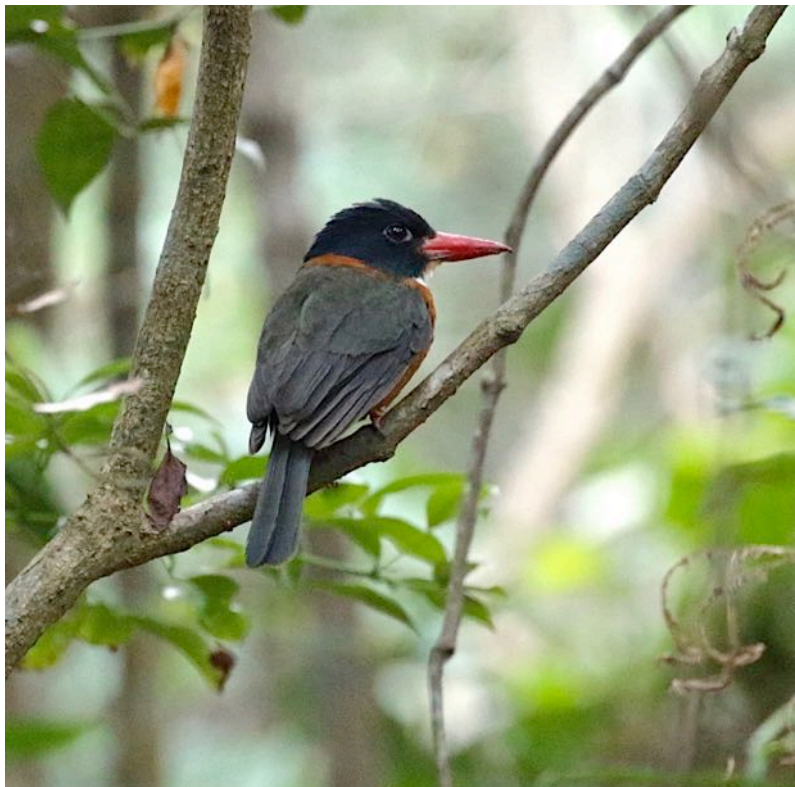
Black-headed Kingfisher at Karaenta (Craig Robson)

As usual, the tour began at Makassar Airport in south-west Sulawesi. For the second year running we began proceedings by driving down to the Malino Highlands on the north-western edge of the isolated Lompobattang Range. During our single morning at this well-known centre of endemism, we explored two trails at markedly different elevations. Starting pre-dawn at around 1000-1100m, we were soon listening to the jumbled songs of numerous Black-ringed White-eyes, a local endemic. Our first Sulawesi Masked Owl unexpectedly flew past right in front of us, and then two cracking Sulawesi Mynas popped up onto a dead tree to take-in the early morning sun. Winding our way up a narrow and rather overgrown trail, we soon heard the subdued song of our main target-bird, the little-known Lompobattang Flycatcher. After a little coaxing it perched in clear view for all of us. With an early success, and time on our hands, we decided to visit a completely different trail that took us from c.1800 to 2000m. The main highlight here was Lompobattang Leaf Warbler (split from Sulawesi), as well as isolated local forms of Dark-eared Myza, Rusty-bellied Fantail and Mountain Tailorbird. Chestnut-backed Bush Warbler and Streak-headed White-eye also showed well.