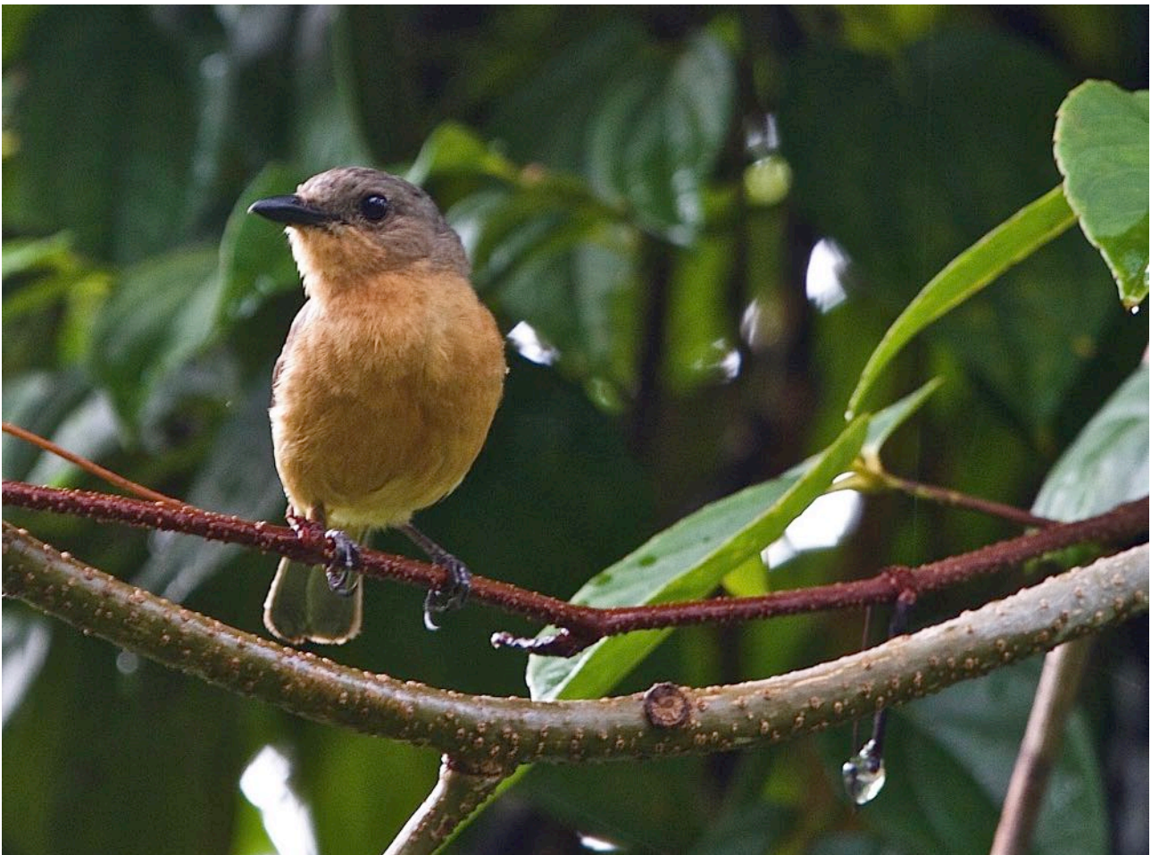
Cinnamon-breasted Whistler (Craig Robson)

Soon we were back underway, with large groups of Red-necked Phalaropes alongside. As we crossed the open see between Bacan and Bisa, we spotted Wilson's Storm and Bulwer's Petrels, and Greater Crested, Bridled, and longipennis Common Terns. After docking at Bisa, we followed the north-east shore of this island. Large numbers of Spinner and Indo-Pacific Bottle-nosed Dolphins and Short-finned Pilot Whales were on view, and the mud- and mangrove-fringed shoreline produced Great-billed Heron, Little Pied Cormorant, White-bellied Sea Eagle, and two brief and very distant Beach Stone-curlews.