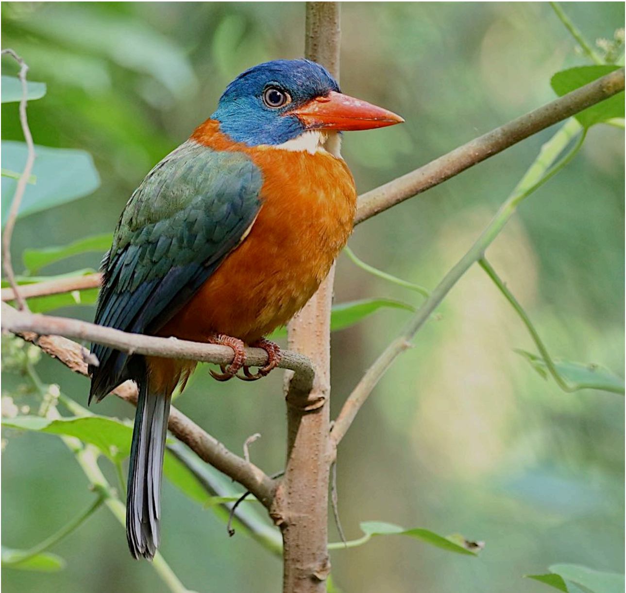
Green-backed Kingfisher

Leaving the Kotamobagu region behind, we made the fairly long drive to World famous Tangkoko National Park, our final destination on Sulawesi. On arrival, we spent some time at a viewpoint, with the obligatory coffee and biscuits. There was a nice selection of birds, including Knobbed and Sulawesi Hornbills, Yellow-breasted Racket-tail, Blue-backed Parrot, Green and Silver-tipped Imperial Pigeons, and White-faced Cuckoo-Dove. Probably the best find however, was a juvenile Pygmy Hanging Parrot that initially provoked an identification challenge! We moved on to a good site for the endemic Sulawesi Nightjar. Even before it was dark, a male started calling and before long it was lured in for some very close views. Another Tawny Grassbird made a brief appearance. We drove on down to the village, and checked-in to our comfortable guest house. A post-dinner sortie in search of Minahassa Masked Owl, resulted in probably our best views of Sulawesi Masked Owl! Not quite what we had in mind. Another Sulawesi Scops Owl was extremely obliging.