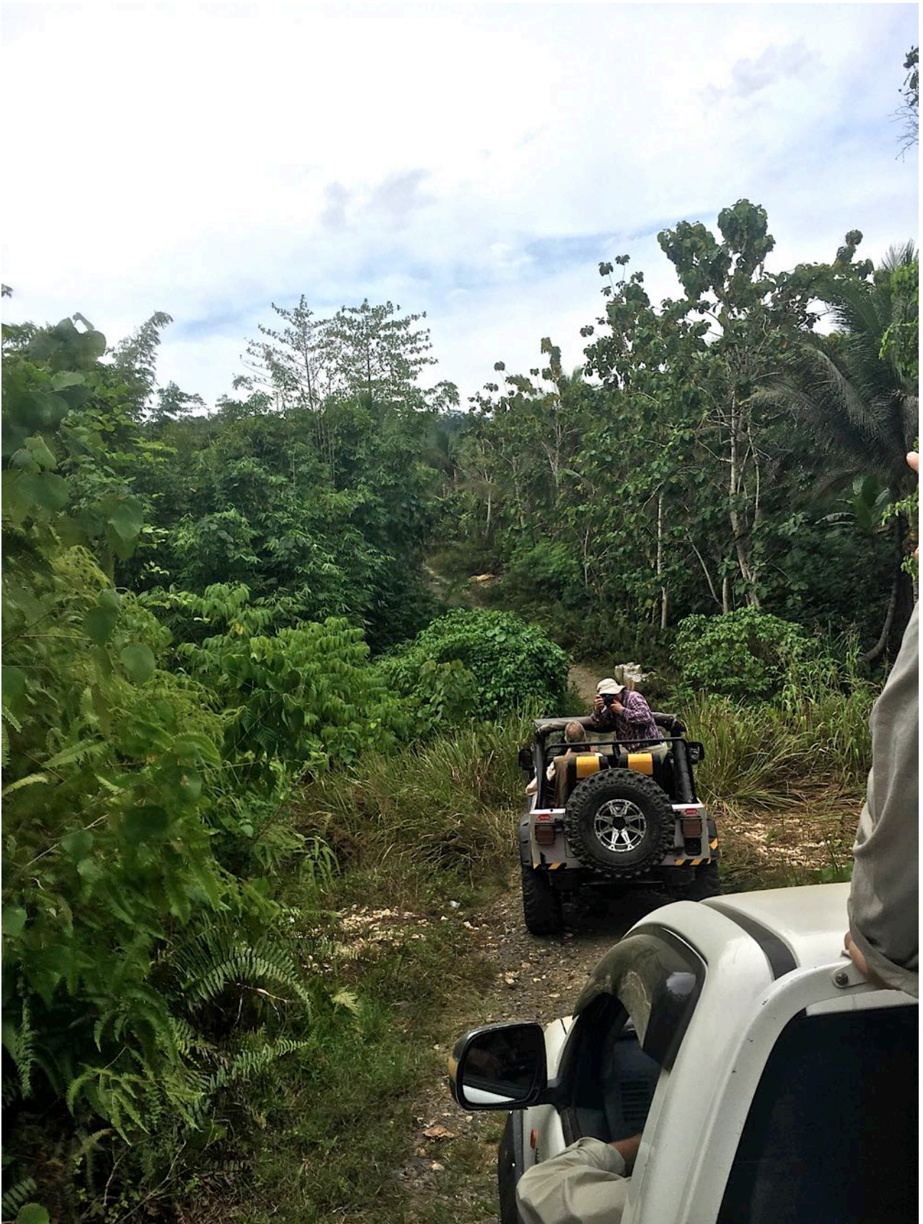
Exploring Morotai (Craig Robson)