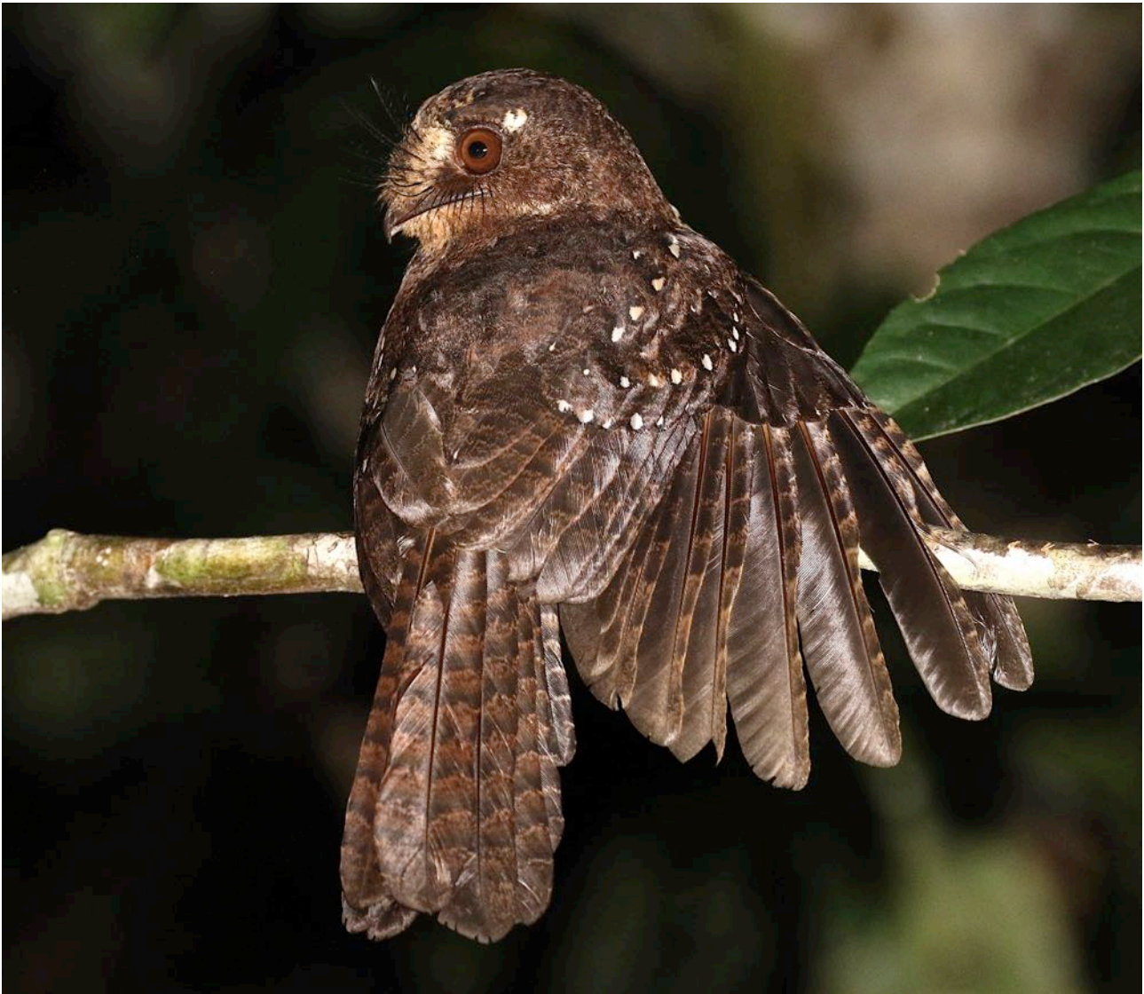
Moluccan Owlet-Nightjar at Foli (Craig Robson)

Early the next morning we spent a little more time along the logging road, bagging Pacific Baza, Little Bronze and Brush Cuckoos, Black-chinned Whistler, and Wallace's Cicadabird (the local form of Common), before changing location with a fairly short drive to the Buli Road. We spent the best part of two full days here, based at a very nice small hotel. Reaching 500m elevation, we were to find a whole new set of birds: the rare Pygmy and impressive Gurney's Eagles, displaying Great Cuckoo-Dove, Scarlet-breasted Fruit Dove, Moluccan Cuckoo (difficult to find in this part of its range), another distant Azure Dollarbird, Oriental Hobby, fantastic Moluccan King Parrots, large numbers of White Cockatoos, a nice North Moluccan Pitta (split from Red-bellied), White-streaked Friarbird, Dusky-brown Oriole, another very showy Standardwing, away from its' lek, the soon to be split Halmahera Leaf Warbler, and Gray's Grasshopper Warbler.