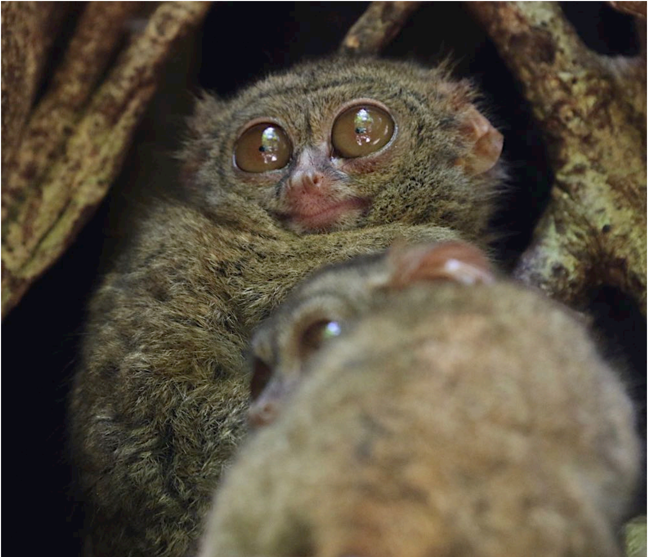
Spectral Tarsiers (Craig Robson)

Moluccan Masked Flying Fox Pteropus personatus Small numbers on Obi.