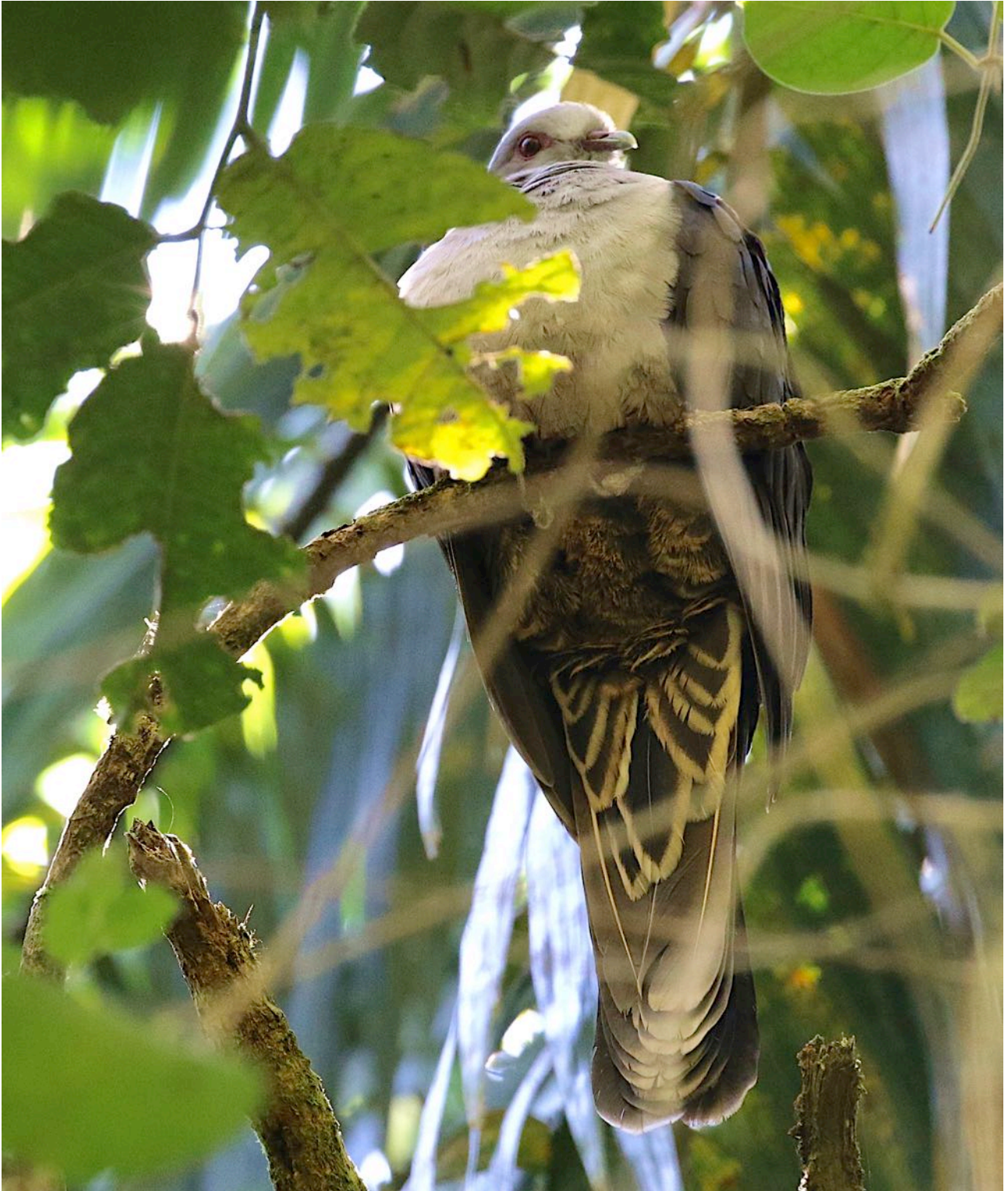
Sombre Pigeon