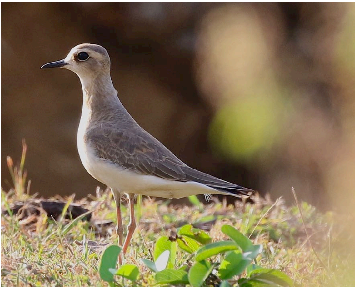
Pygmy Eagle on Halmahera and Oriental Plover on Obi (Craig Robson)