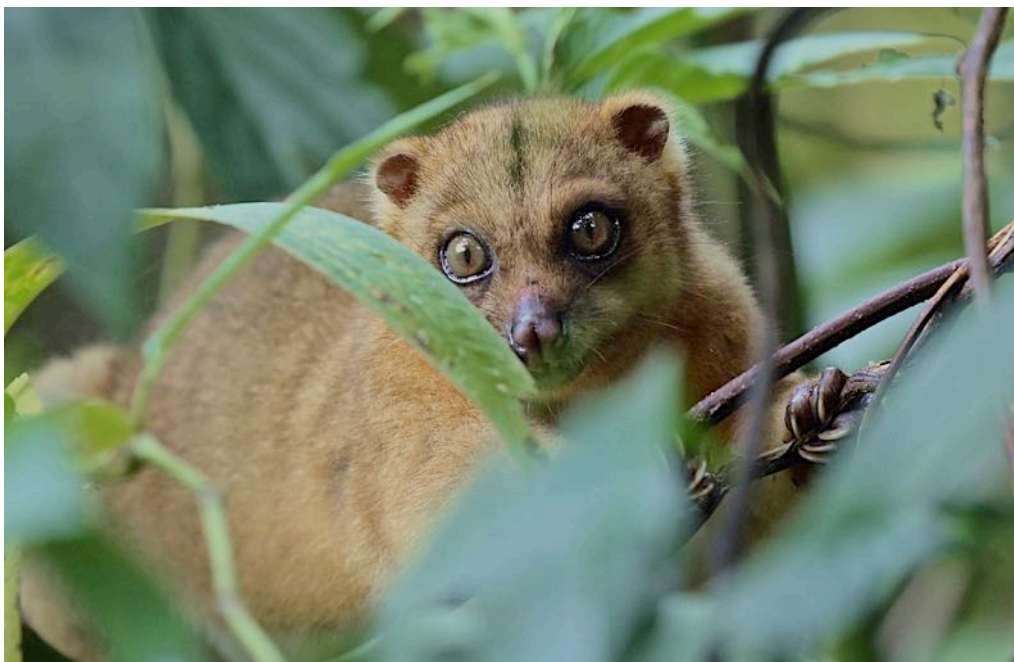
Obi Cuscus (Craig Robson)

It was a fitting end to a great adventure, and we settled into our cabins for a good night's rest on the way back to Ternate.