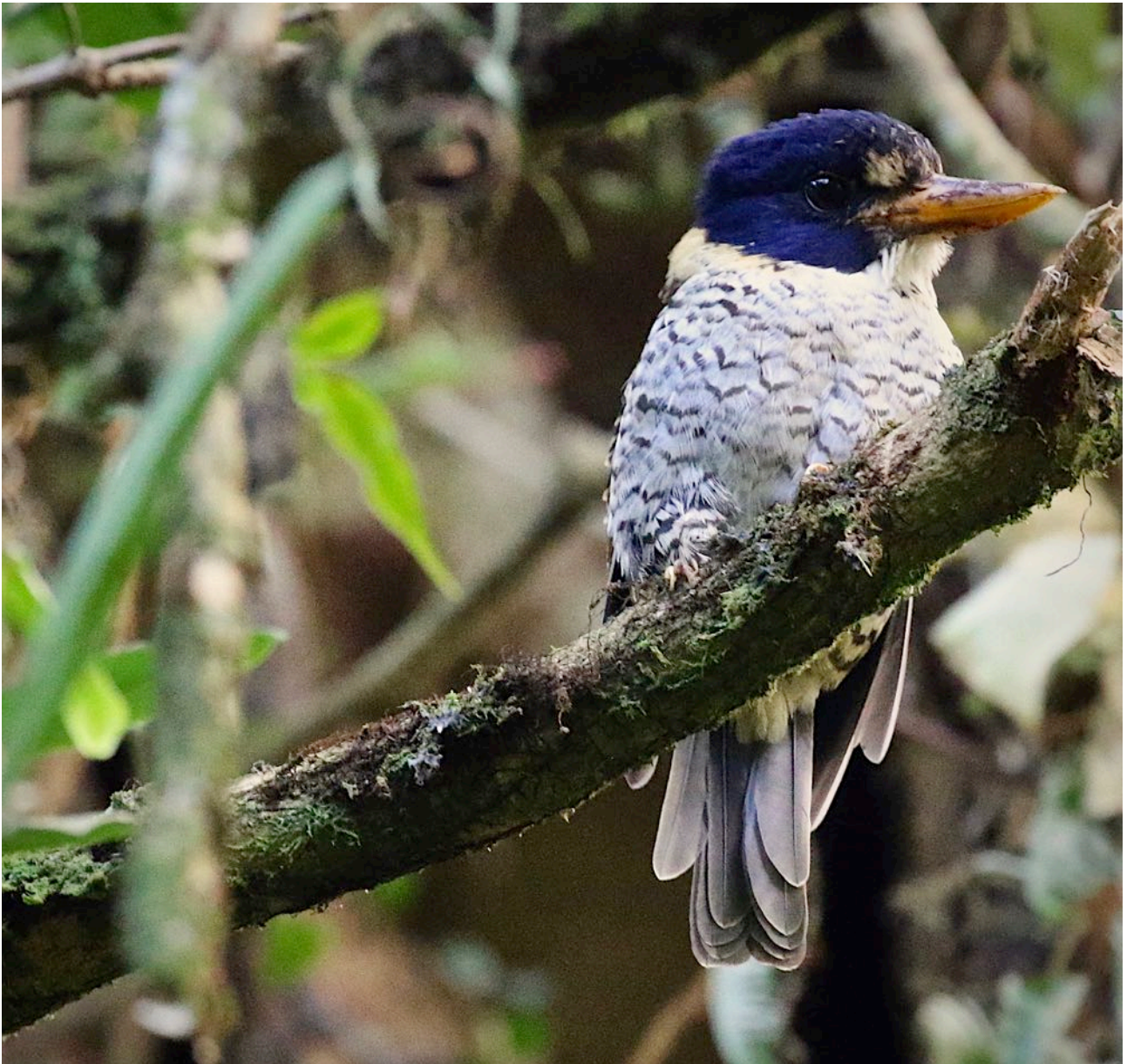
Scaly-breasted (or Regal) Kingfisher