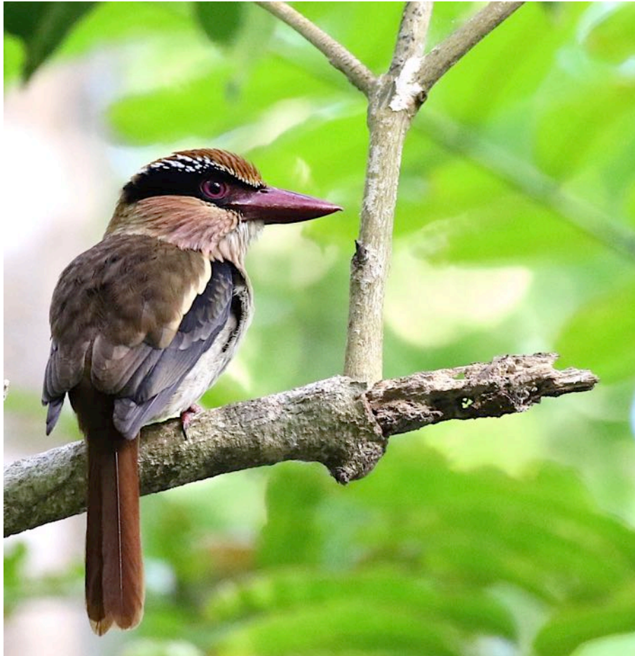
Lilac Kingfisher (Craig Robson)

Scaly-breasted Kingfisher (Lore Lindu K) A. [princeps] erythrorhamphus Lengthy views of 1 along Anaso Track. Scaly-breasted Kingfisher (Regal K) Actenoides [princeps] regalis A superb tame bird at Gunung Mahawu. Common Paradise Kingfisher Tanyiptera galatea Seen Morotai ( doris ), Halmahera ( browningi ) and Obi ( obiensis ). Lilac Kingfisher (Sulawesi L K, L-cheeked K) Cittura cyanotis One at Molibagu Road, and four at Tangkoko NP.