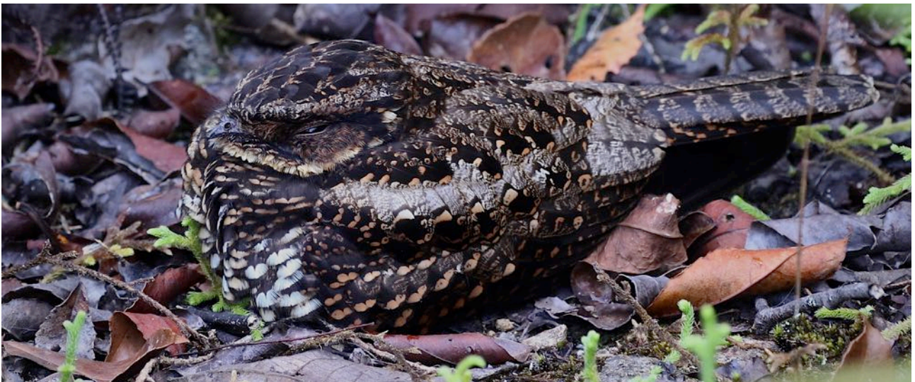
Satanic Nightjar

It was then time to take a domestic flight to Palu in north-central Sulawesi, where the local crew met us on arrival with their vehicles, and transported us to our accommodation at Wuasa, close to Lore Lindu National Park. We arrived in the early evening, to a large helping of good local food.