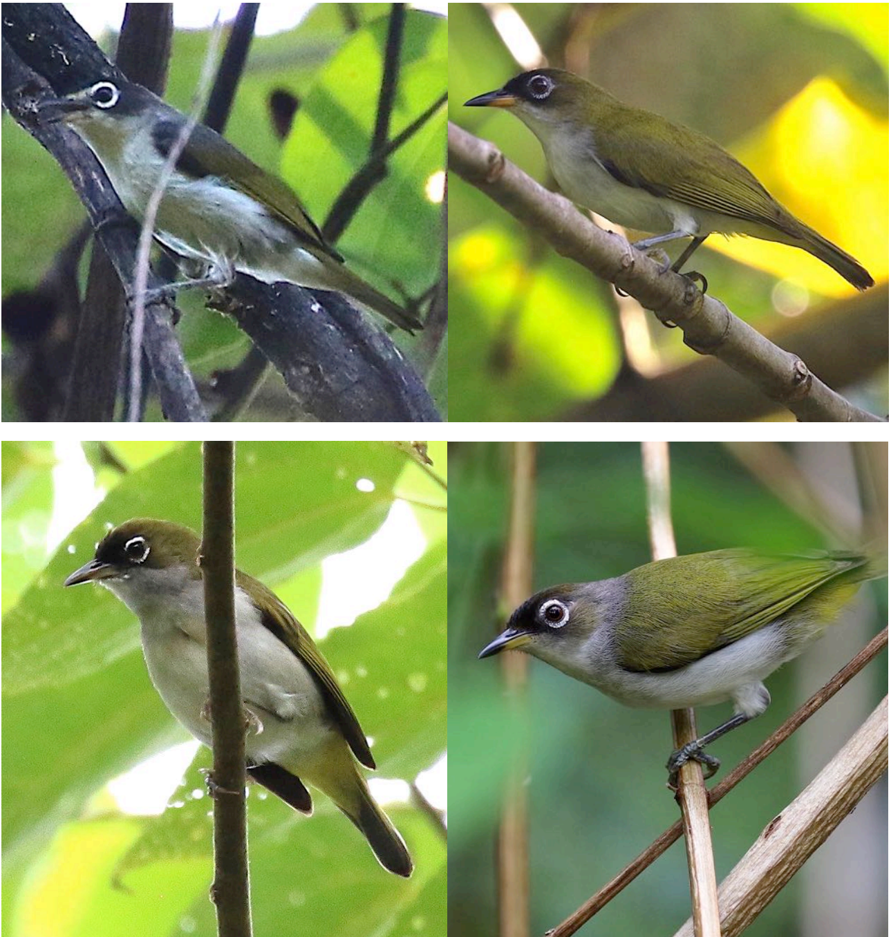
Cream-throated White-eye splits (clockwise from top left): Morotai, Halmahera, Bacan and Obi