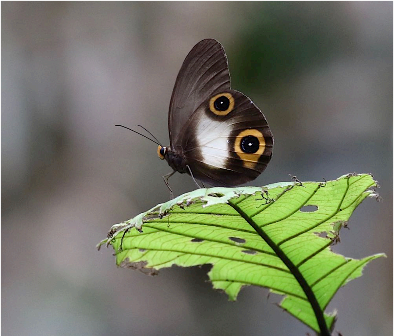
Silky Owl on Morotai (Craig Robson)

Sulawesi Commander Moduza lymire Toraut. Sargeant sp. Athyma libnites Buli Road. Clipper Parthenos sylvia saltantia Molibagu Road etc. Common Jester Sembrenthia hippoclus clausus North Sulawesi. Godart's Map Cyrestis acilia Halmahera Orange-banded Plane Lexias aeropa Buli Road. Blanchard's Wood Nymph Ideopsis vitrea Sulawesi ( genopsis ), Morotai & Halmahera ( chloris ), Obi. Westwood's King Crow Euploea westwoodii Sedoa River Valley. Not Magpie Crow as suggested by Craig. Common Tiger (Striped T) Danaus genutia Widespread. Sulawesi ( leucoglene ), Morotai & Halmahera. Ismare Tiger Danaus ismare ismareolo Sulawesi ( fulvus ), Morotai & Halmahera ( ismareolo ). Silky Owl Taenaris diana leto Morotai & Halmahera. Silky Owl Taenaris macrops macrops Halmahera. 'Moluccan' Coster Miyana moluccana dohertyi Palu. Blanchard's Tree Nymph (B Ghost) Idea blanchardi Sulawesi and Halmahera.