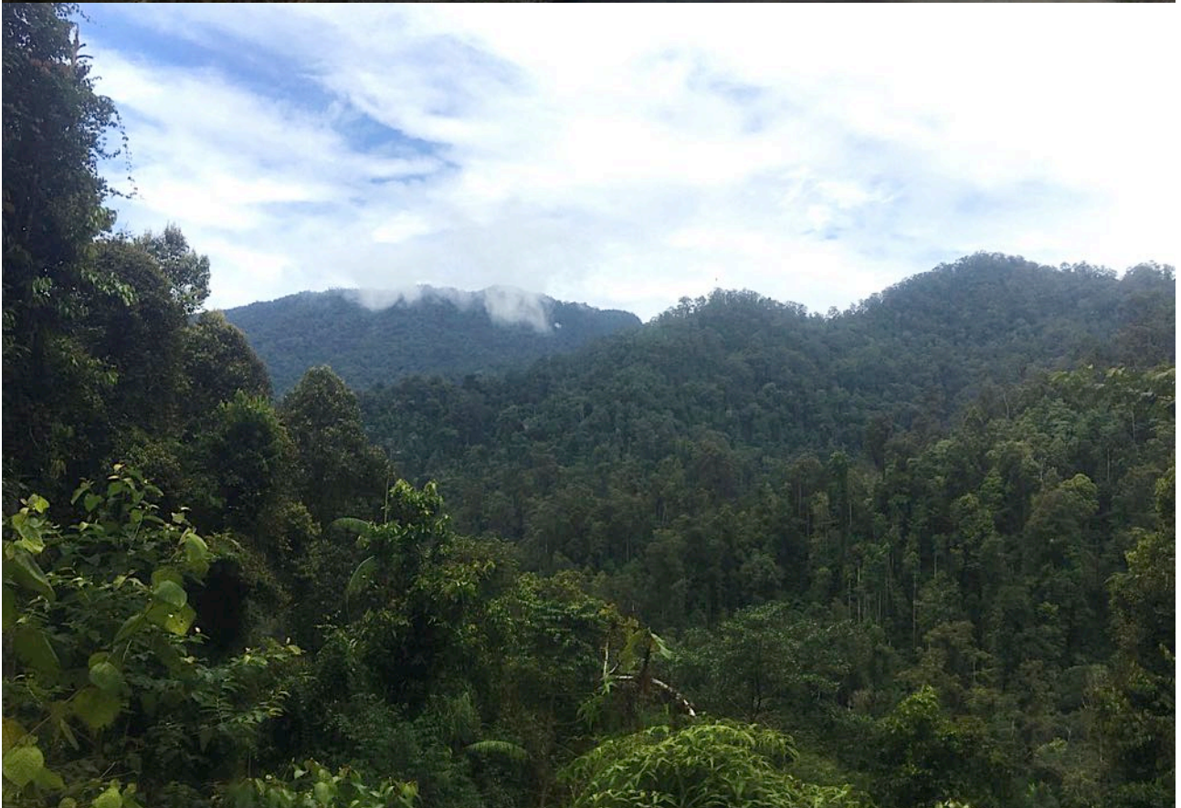
Buli Road, Halmahera (top), and the view from a logging road on Obi (Craig Robson)