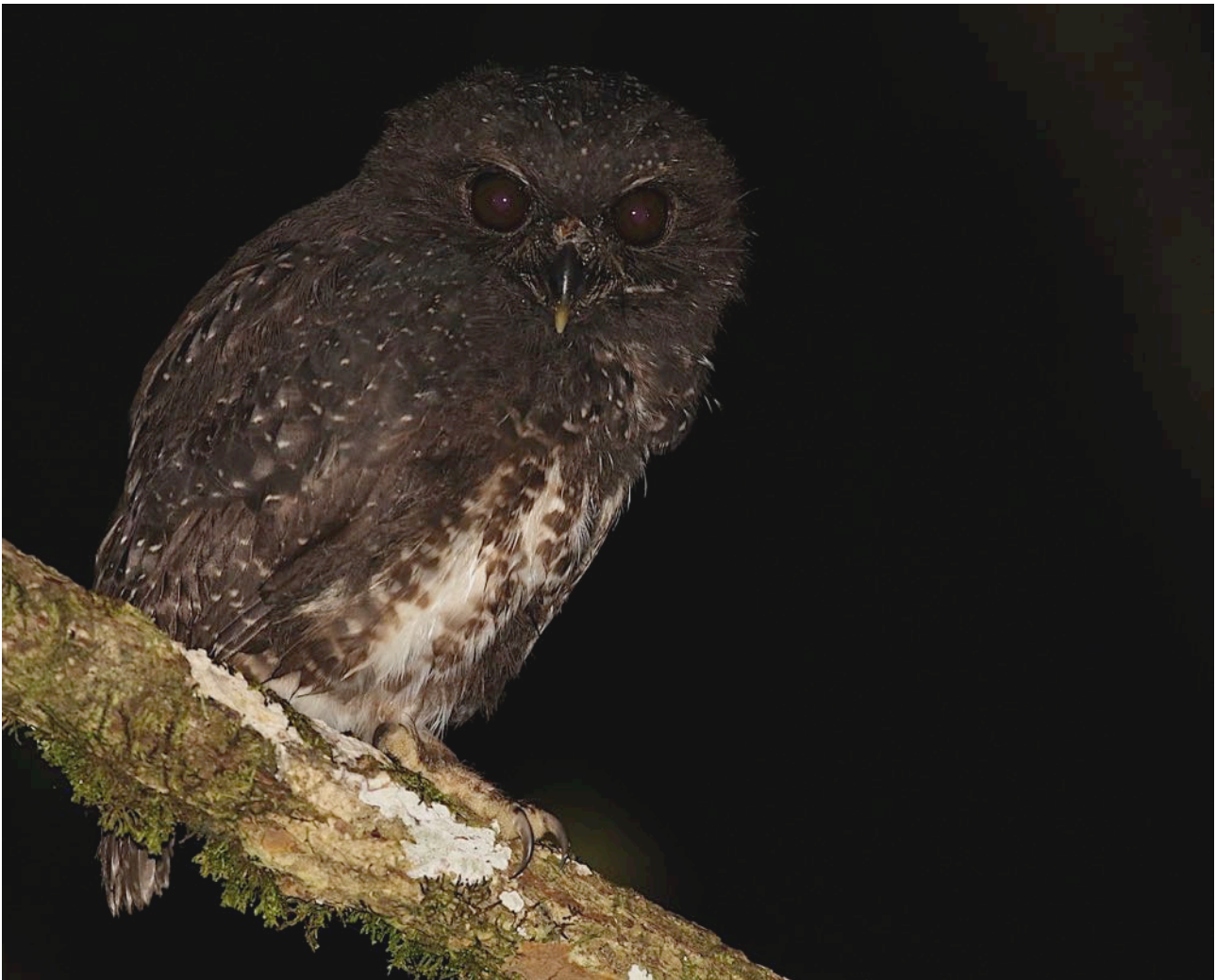
Speckled Boobook

Our crepuscular and nocturnal forays were very productive also, with excellent views of Sulawesi Scops Owl, a tame Speckled Boobook, and also Cinnabar Boobook; the latter being really hard work this year. Minahassa Masked Owl was an unfortunate heard-only, while Great Eared Nightjars also performed well. A late afternoon/early evening excursion to the fields at Wanga produced two tour rarities in the form of Rufous-winged Buzzard and a hunting Eastern Grass Owl. Tawny Grassbird also made a brief appearance here, and there was Spotted Harrier and Glossy Ibis.