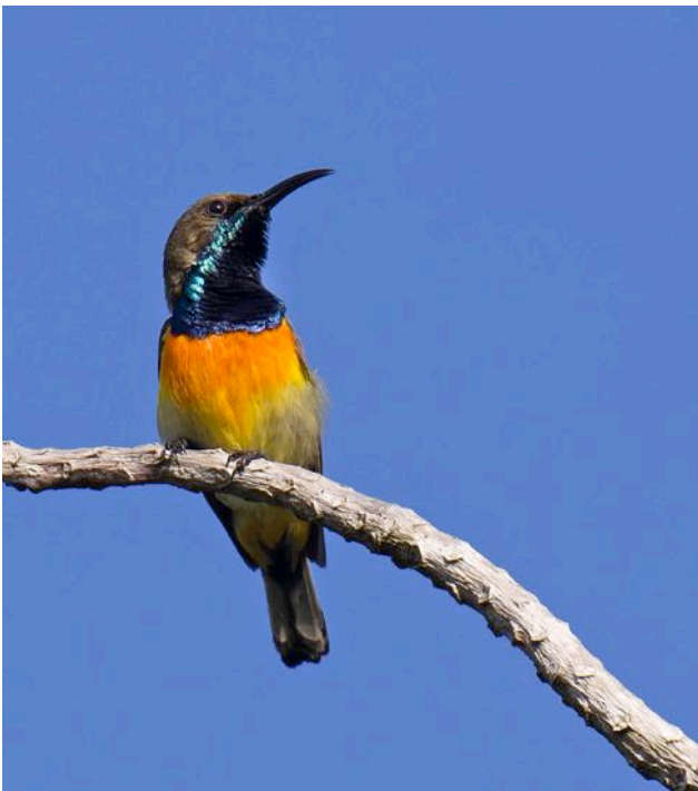
Olive-backed Sunbird of the form aurora.

We saw three forms during the tour. On Luzon, we saw the nominate form at Subic Bay and obscurior in the Sierra Madre Mountains. On Palawan, we saw the form aurora which is distinctive as it shows an orange breast.