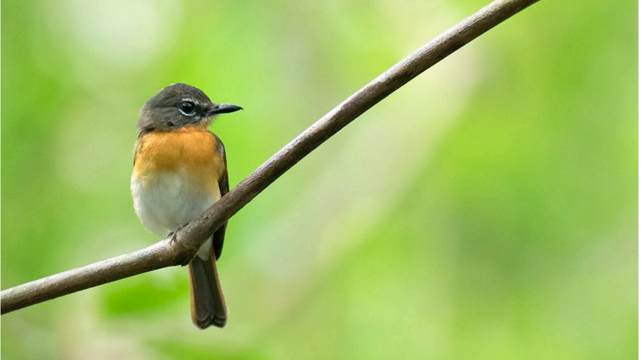
Falcatid Wren-Babbler and Palawan Blue Flycatcher. (DLV)

Mountain White-eye ◊ Zosterops montanus Seen on Mt Polis and Mt Kitanglad. See Note.