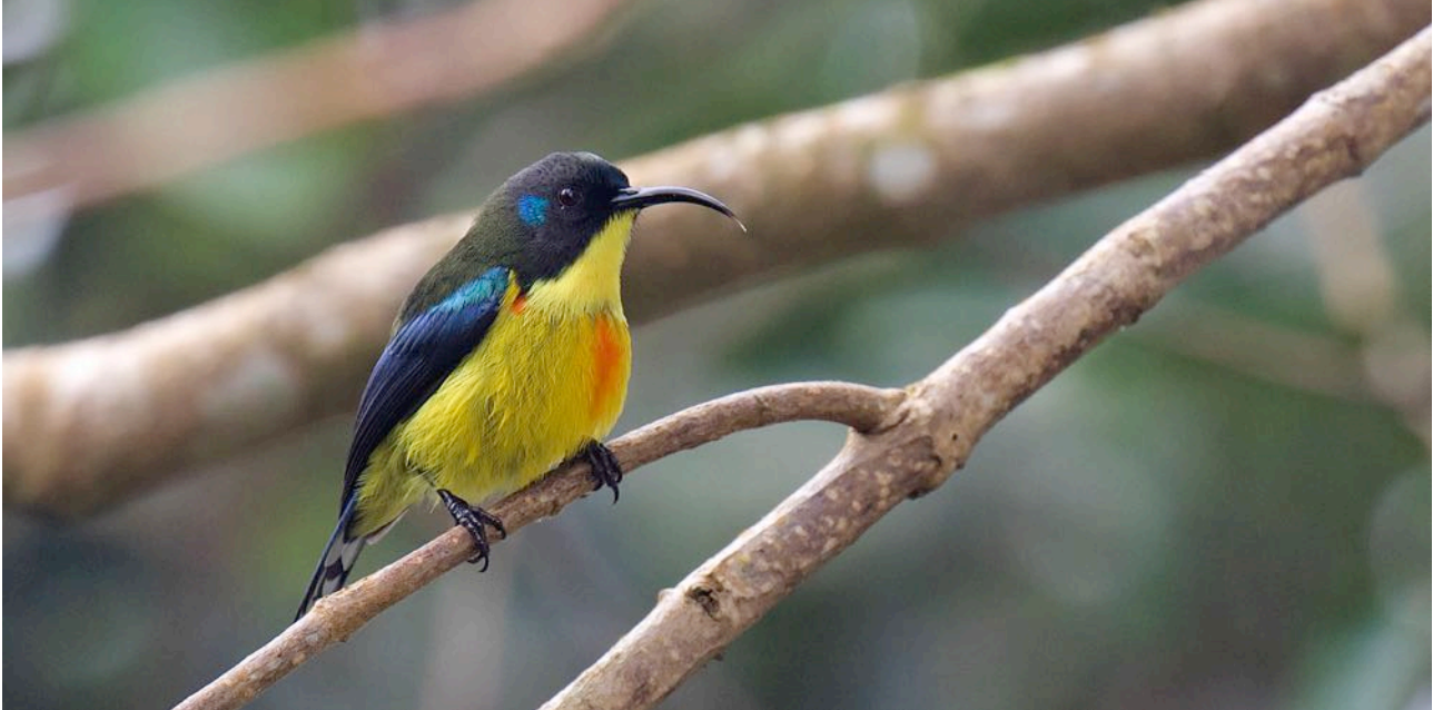
The seldom-seen Lina's Sunbird gave amazing views at Compostela Valley. (DLV)

front of us, and we enjoyed point-blank views of these rare birds. Also in the area we recorded some McGregor's Cuckooshrikes, sounding very different to the ones in Kitangland, and heard a couple of Long-tailed Bush Warblers, which also call quite differently here and might well be split off in the near future. Other birds of note here included several Mindanao White-eyes and Olive-capped Flowerpeckers of the endemic subspecies. We then thanked Pete for all his help after such a successful morning, and continued towards Bislig, our base for the next four nights.