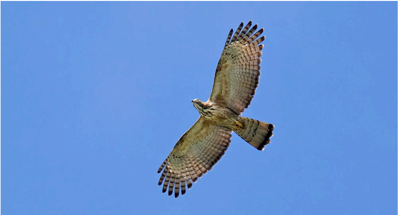
A Philippine Honey Buzzard soaring over the Twin Lakes, Negros.