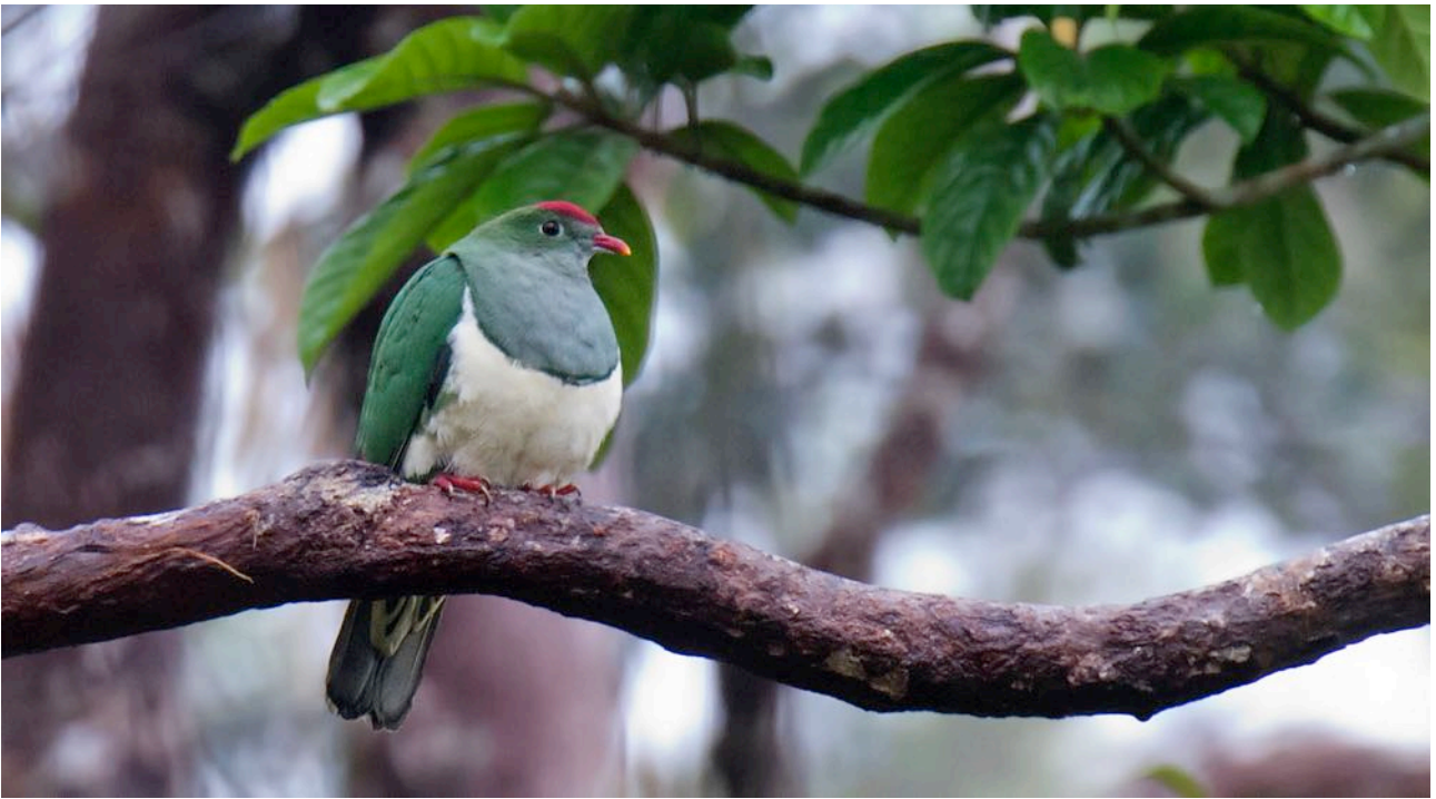
Cream-bellied Fruit Dove sheltering from the rain in Sawa. (DLV)

All that remained was our flight back to Manila before we split up and headed for our separate flights home. It had been a very successful trip from a birding perspective, with many great birds. It is surprising that, even though the habitat continues to get more and more degraded each year, we still manage to see as many species as in the past, including a number of previously “ungettable” birds. However, it’s also true that the numbers of certain species are clearly decreasing rapidly, and some of them are getting tougher and tougher to find each year. The habitat destruction is becoming such a problem that the number of species we’ll be able to find in the future will soon start to diminish. So, the sad message is, if you’ve not yet been, go as soon as you can, as many of the birds will not be around too much longer, at least not in areas where we can get to them.