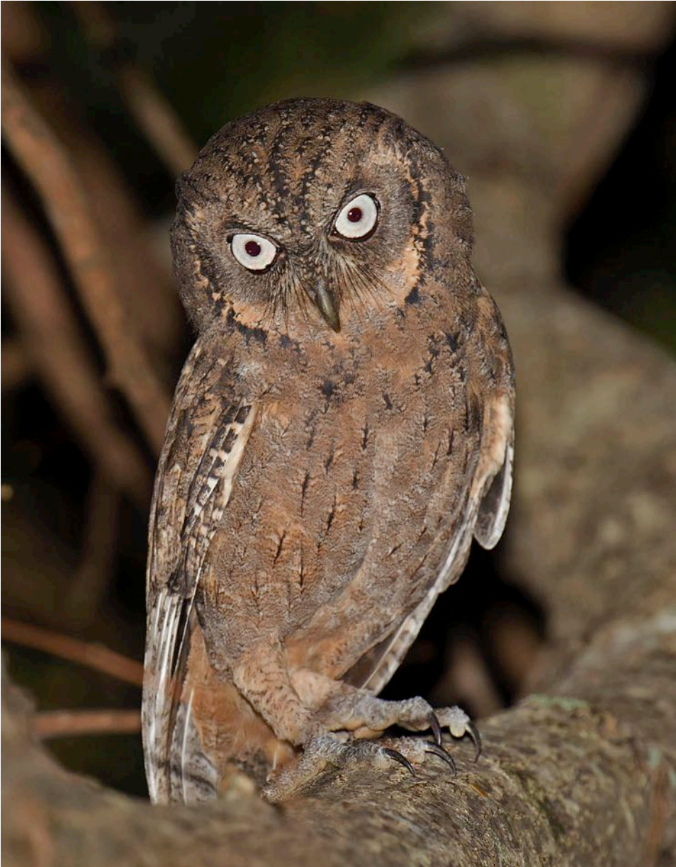
Mantanani Scops Owl.