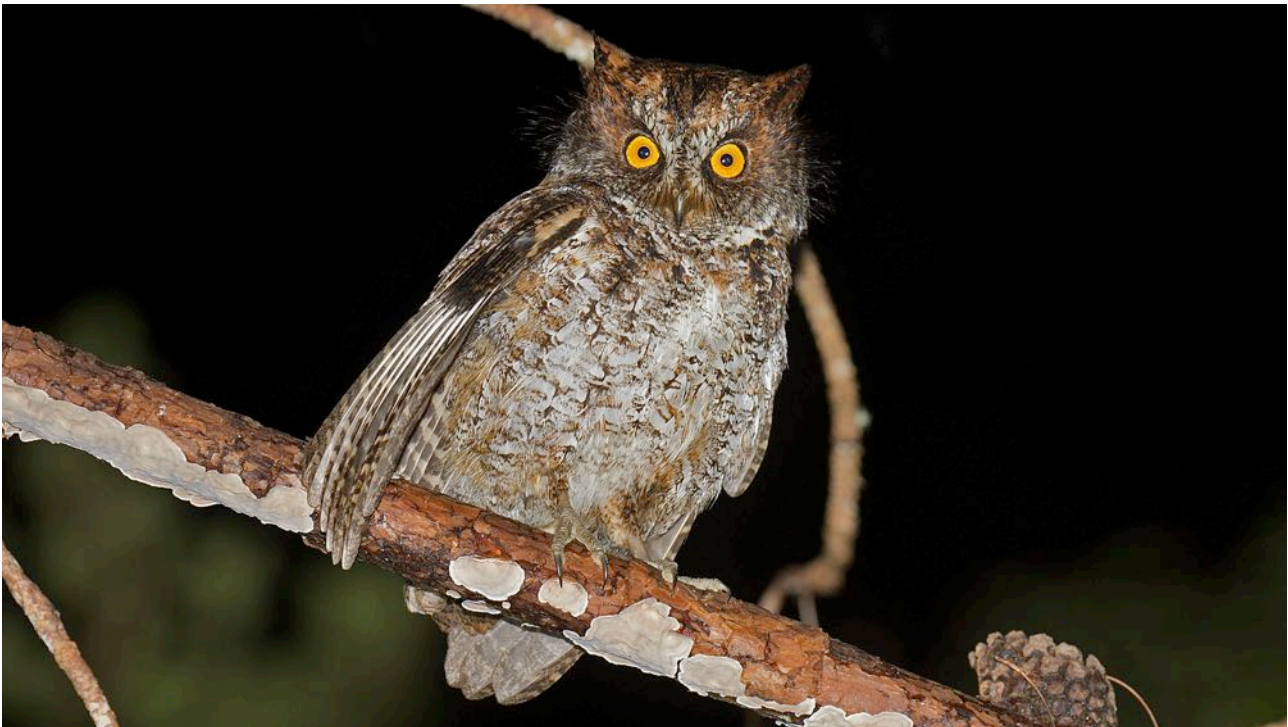
This Luzon Scops Owl gave, in the end, walk-away views at Mount Polis. (DLV)

Our success rate with the endemics– the ones you come to the Philippines for– was overall very good, and highlights included no less than 14 species of owl recorded, including superb views of Luzon Scops Owl, 12 species of beautiful kingfishers, including Hombron’s (Blue-capped Wood) and Spotted Wood, 5 endemic racket-tails and 9 species of woodpeckers, including all 5 flamebacks. The once almost impossible Philippine Eagle-Owl showed brilliantly near Manila, odd looking Philippine and Palawan Frogmouths gave the best possible views, impressive Rufous and Writhed Hornbills (amongst 8 species of endemic hornbills) delighted us, and both Scale-feathered and Rough-crested (Red-c) Malkohas proved easy to see. A pair of Ashy Thrushes gave amazing views, and Celestial Monarch, getting very rare these days, was seen nicely as well. 14 species of flowerpeckers, including the rare Whiskered, a Birdquest lifer, were seen, as well as no less than 16 species of sunbirds, including the seldom seen Lina’s Sunbird, together with the 3 world’s rhabdornis (formerly placed in their own family and now considered to be “just” starlings), including the rare Grand Rhabdornis.