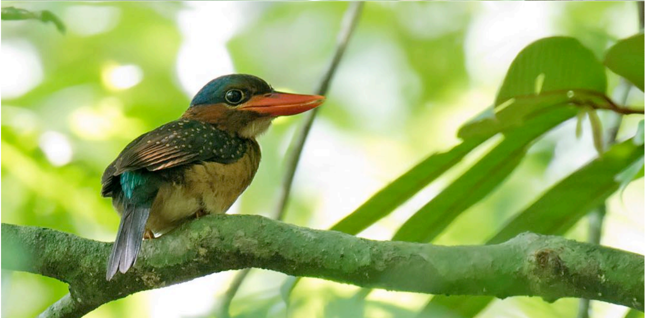
Both Azure-breasted (Steere's) Pitta and Hombron's (Blue-capped Wood) Kingfishers obliged at PICOP. (DLV)

After such an exciting morning, we had our picnic lunch, which was interrupted by a Hombron's Kingfisher responding to Nicky's tape. In no time we had this cracker perched in a branch in the open, allowing for unbeatable views. Excellent stuff! A short afternoon walk in the forest was, predictably, rather quiet, with a heard-only Philippine Leafbird and a calling Short-crested Monarch high up in the canopy as the only things of note. Once we got back to the road, we heard the loud calls of Writhed Hornbills, and after struggling for a while, we finally managed to attract them closer for some excellent views. Also in the same area we had Mindanao Hornbill, so a three-hornbill day can't be a bad day at all! On the walk back to the jeepney a fast-moving mixed flock held another male Celestial Monarch, which was seen by some of us.