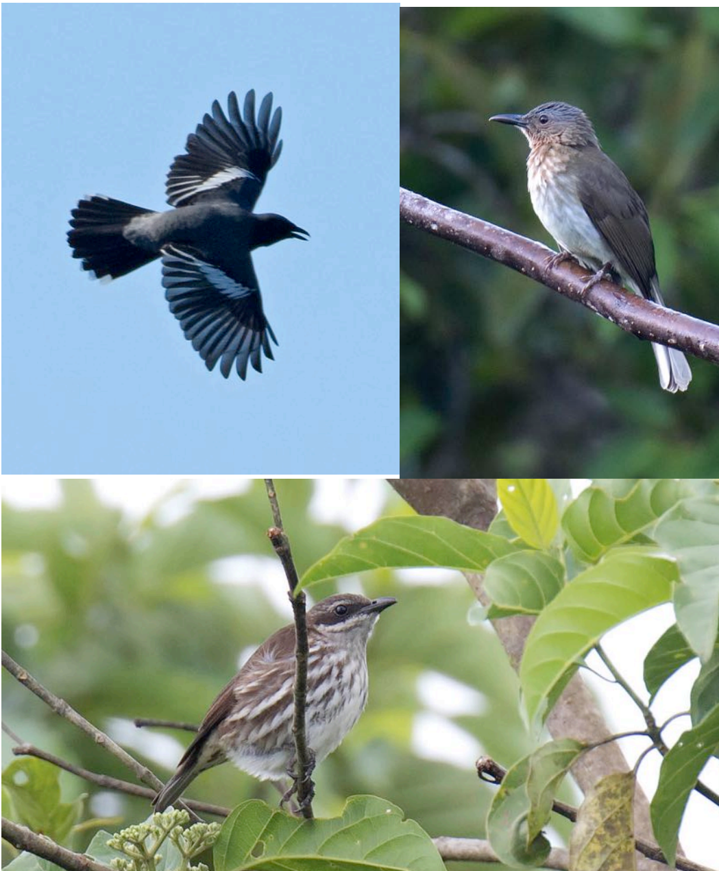
White-winged Cuckooshrike, Visayan Bulbul and Stripe-breasted Rhabdornis.