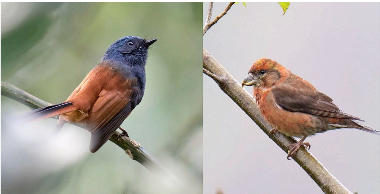
Blue-headed Fantail and the endemic subspecies of Red Crossbill. (DLV)