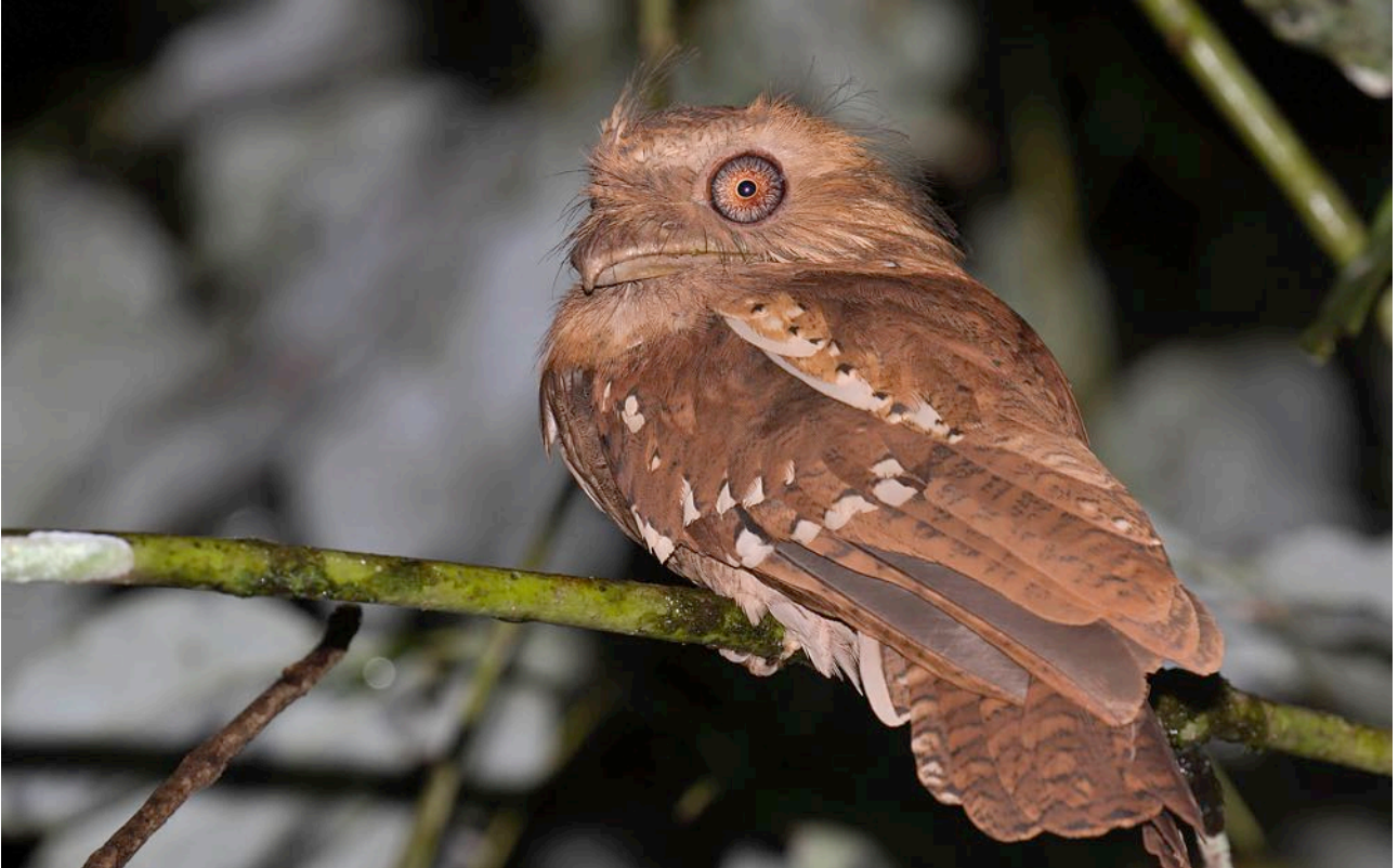
The bizarre-looking Philippine Frogmouth. Check those eyes!.