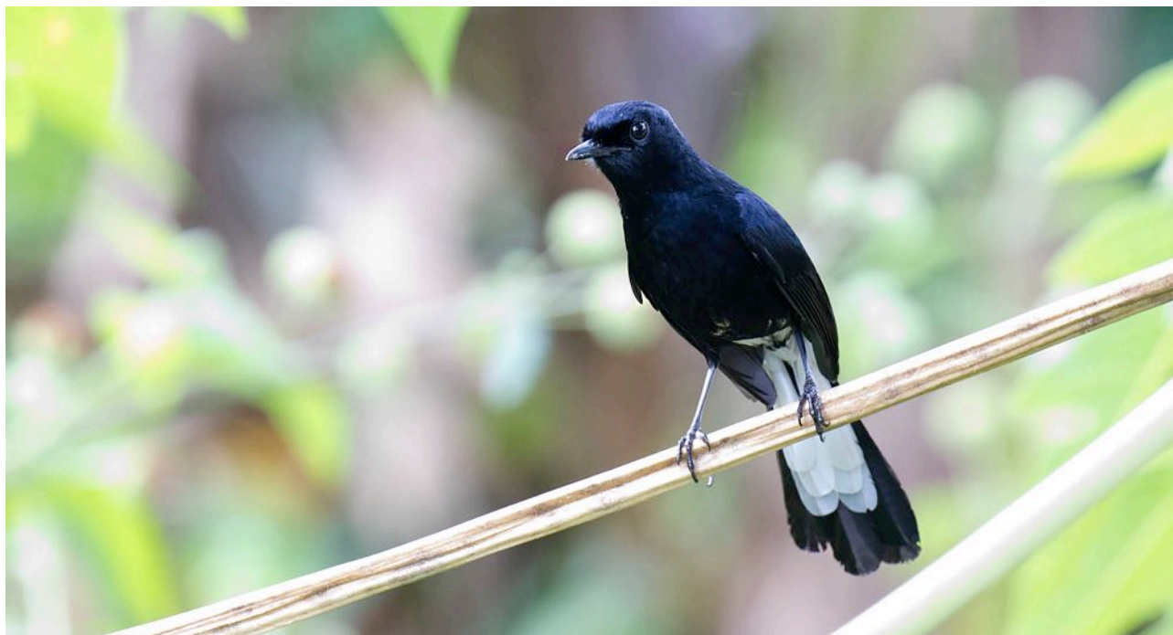
White-vented Shama in Palawan. (DLV)

Green Racket-tail ◊ Prioniturus luconensis (VU) Great views at Subic Bay. Blue-crowned Racket-tail ◊ Prioniturus discurus Seen very well at PICOP and Negros. Blue-naped Parrot ◊ Tanygnathus lucionensis Common at Subic Bay (nominate); salvadorii in Palawan.