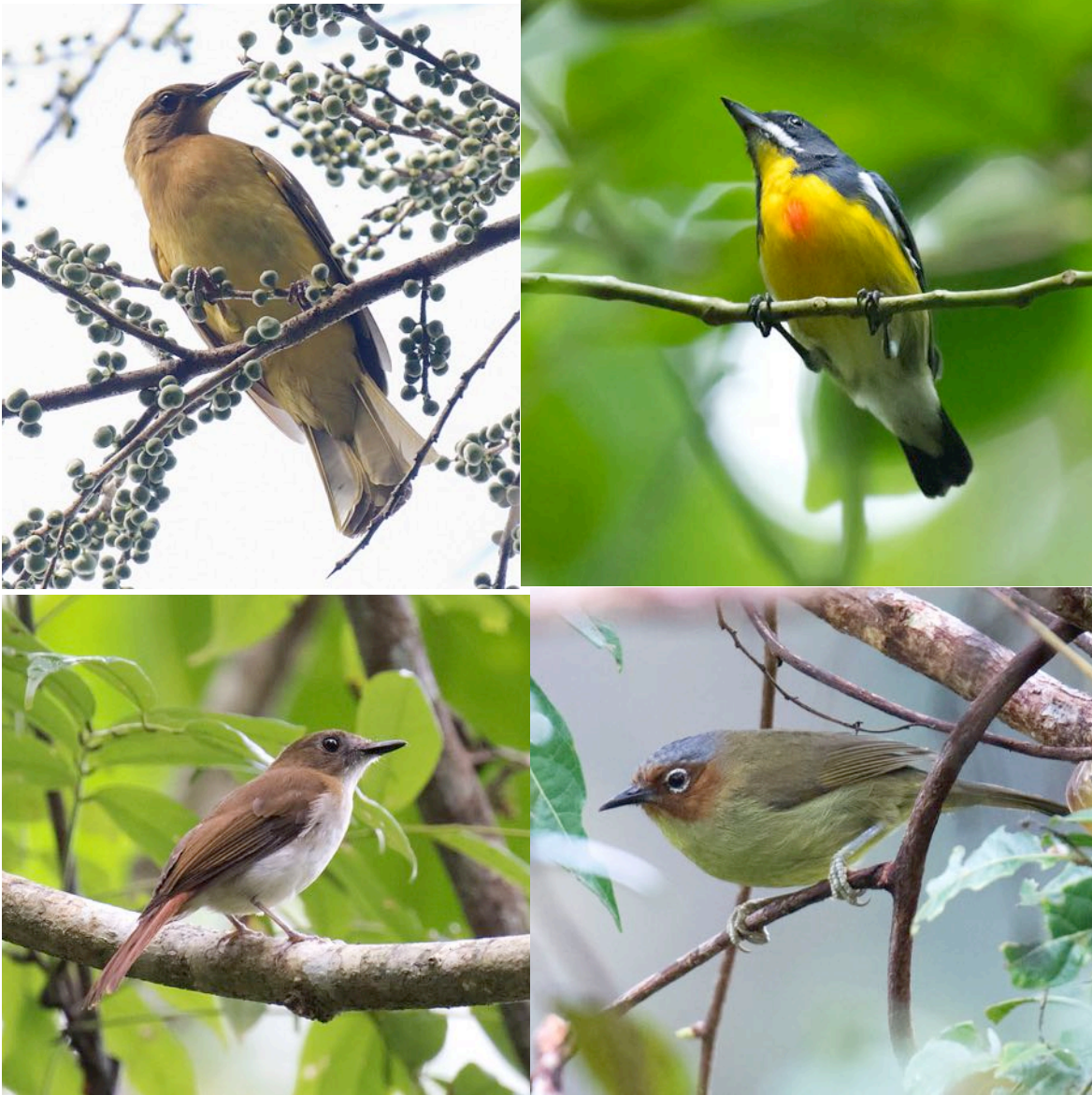
Yellowish Bulbul, Palawan Floerpecker, Chestnut-faced Babbler and Rufous-tailed Jungle Flycatcher. (DLV)