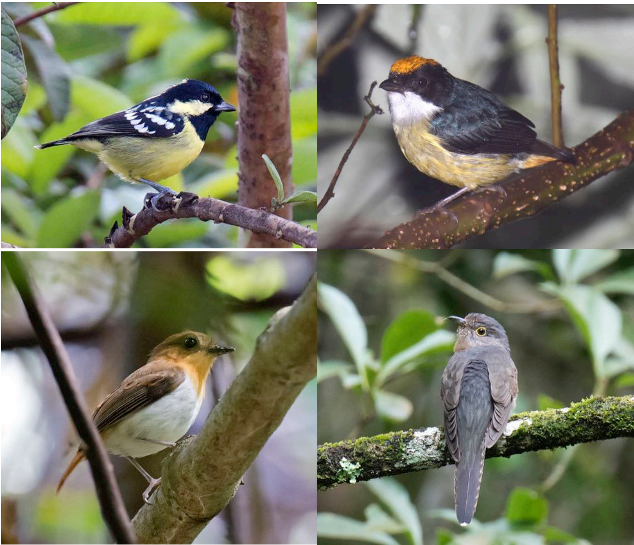
Elegant Tit, Flame-crowned Flowerpecker, Rusty-breasted Cuckoo and Palawan Flycatcher. (DLV)