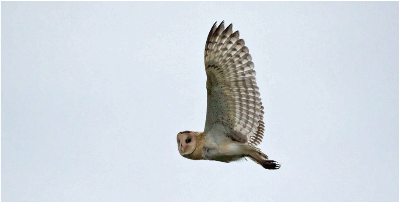
This Australasian Grass Owl put on a fantastic show hunting over Bislig airfield. (Louis Bevier)

into the forest gave us our first Amethyst Brown Dove of the trip, and further views of what must have been the same Southern Sooty Woodpeckers seen the day before, together with a brief Black-faced Coucal found by Andy. Then, back to the clearing, where we found a male Grey-throated Sunbird. And not long after, the heavens opened. Thankfully, we saw it coming, and were already at the jeepney when the downpour started. And it basically lasted for the whole day, making birding nearly impossible. While sheltering from the rain in the vehicle, an entertaining mystery song –but no, not bird song!- took place to kill some time. After lunch, and given it was still raining hard, we went back to Bislig, stopping to admire the faithful and always brilliant Southern Silvery Kingfisher on its pool. After a short break at the hotel, we returned to Bislig airfield, hoping for the uncommon Australasian Grass Owl to show up. And oh boy did it show... At 5:30 the bird started to haunt, still in broad daylight, and put on a fantastic show.