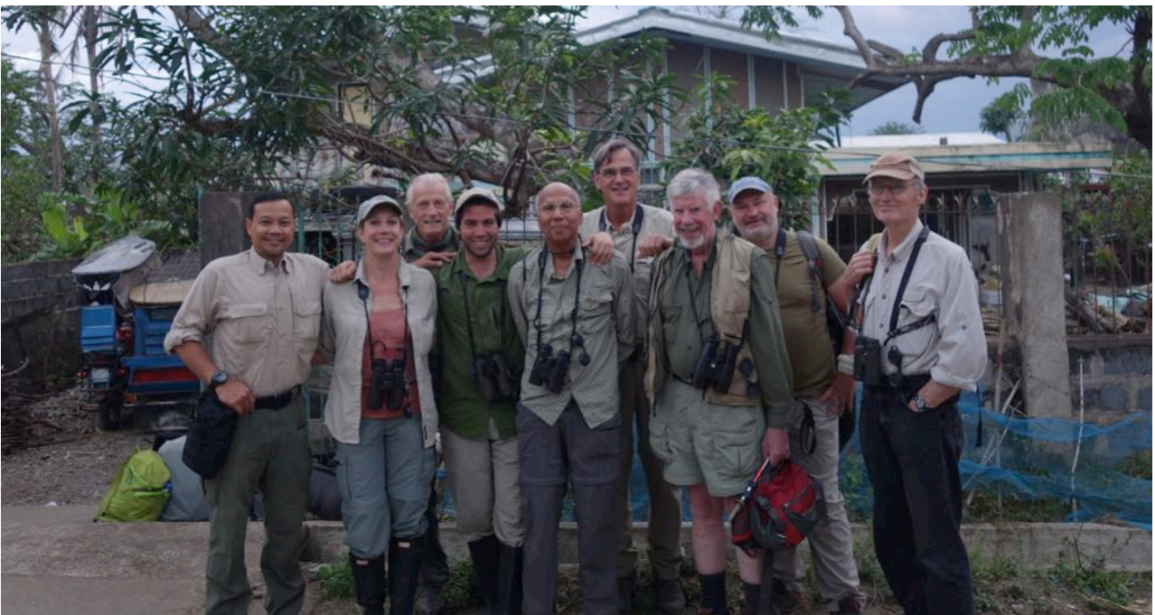
Birdquesters about to start the hike to Sawa.

All that remained was our flight back to Manila before we split up and headed for our separate flights home. It had been a very successful trip from a birding perspective, with many great birds. It is surprising that, even though the habitat continues to get more and more degraded each year, we still manage to see as many species as in the past, including a number of previously “ungettable” birds. However, it’s also true that the numbers of certain species are clearly decreasing rapidly, and some of them are getting tougher and tougher to find each year. The habitat destruction is becoming such a problem that the number of species we’ll be able to find in the future will soon start to diminish. So, the sad message is, if you’ve not yet been, go as soon as you can, as many of the birds will not be around too much longer, at least not in areas where we can get to them.