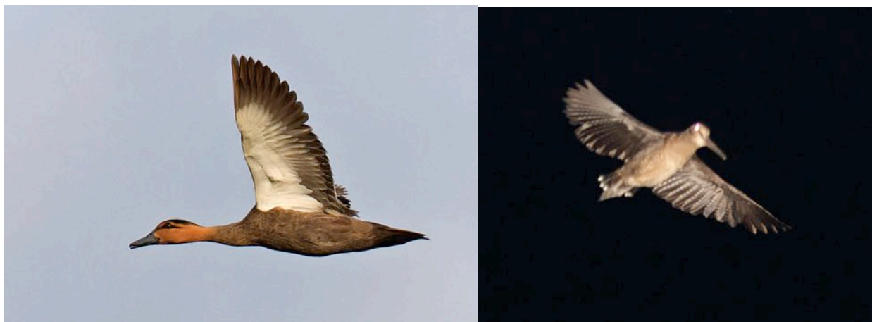
Philippine Duck and Bukidnon Woodcock. (DLV)

Yellow Bittern Ixobrychus sinensis A few seen.