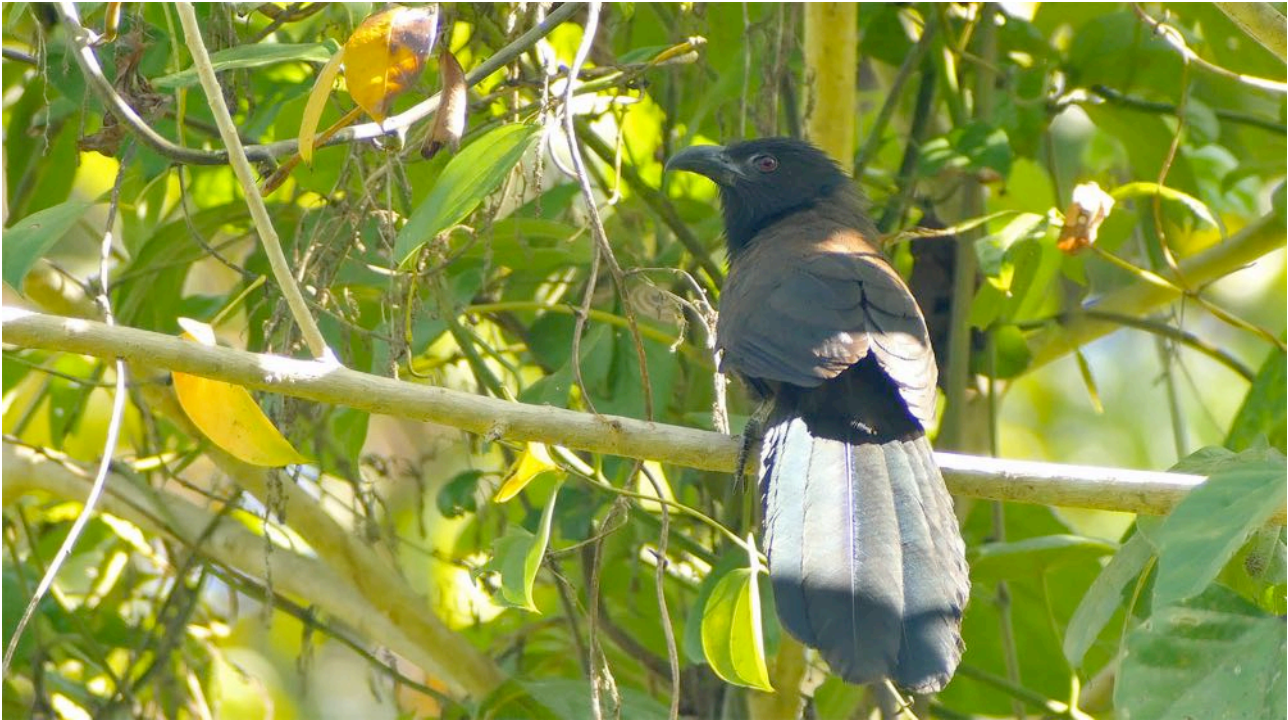
Black-hooded Coucal, a skulking Mindoro endemic that was seen exceedingly well this year.