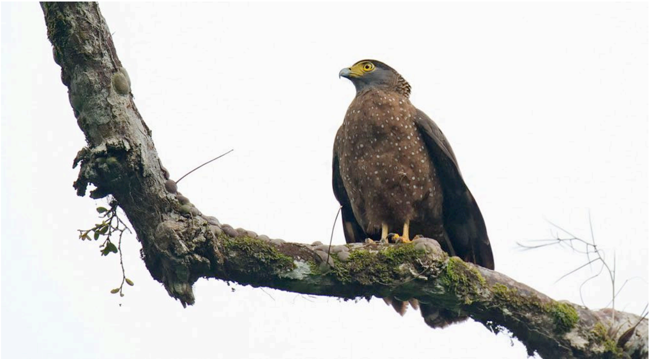
Philippine Serpent Eagle. (DLV)

Philippine Honey Buzzard ◊ (Steere's H B) Pernis steerei Seen at PICOP and Negros. Black-winged Kite Elanus caeruleus Seen in Mindanao ( hypoleucus ). Brahminy Kite Haliastur indus Widespread ( intermedius ). White-bellied Sea Eagle Haliaeetus leucogaster Seen at Palawan. Crested Serpent Eagle Spilornis cheela Seen very well in Palawan ( palawanensis ).