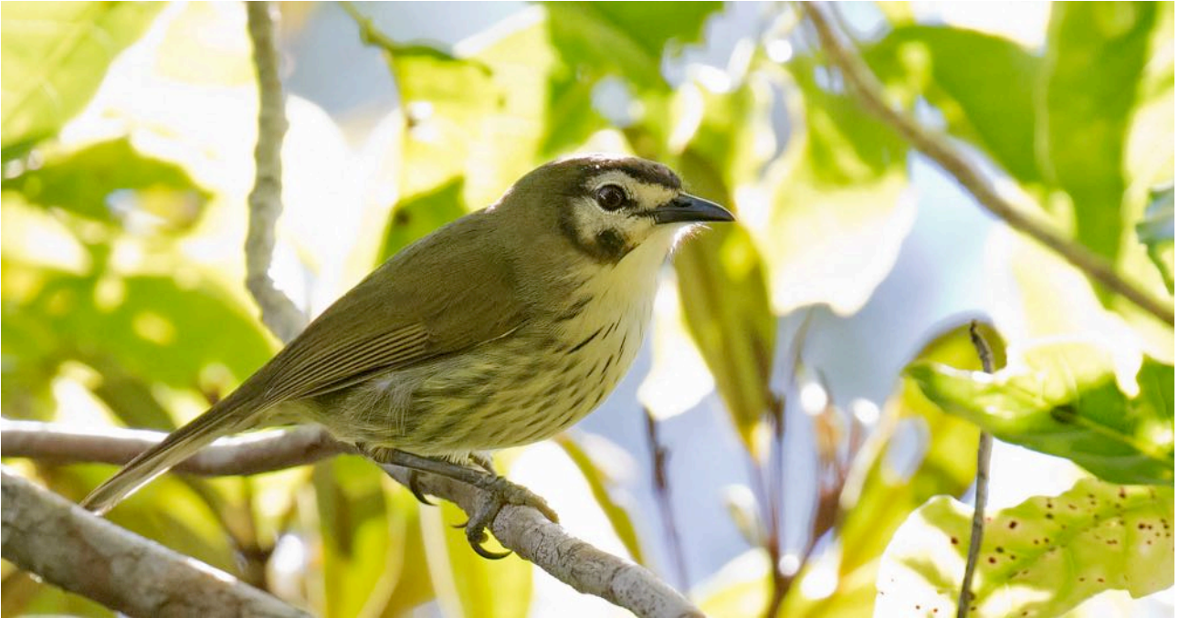
Negros Striped Babbler and a pair of Mangrove Blue Flycatchers. (DLV)