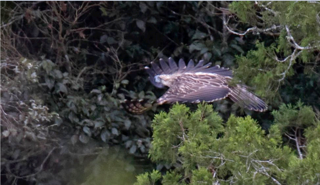
Crested Honey Buzzard of the endemic philippensis subspecies, and a record shot of THE eagle: Philippine Eagle. (DLV)