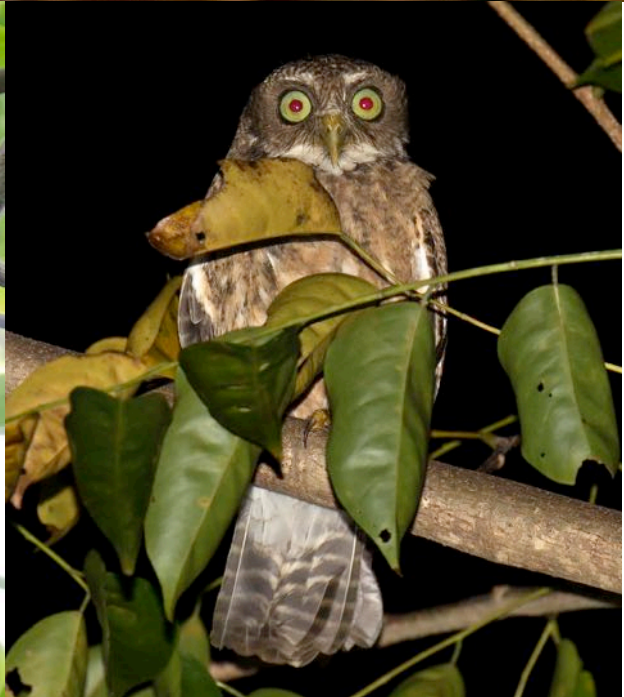
Mindoro Hawk-Owl, Cebu Hawk-Owl and Spotted Wood Owl. (DLV)