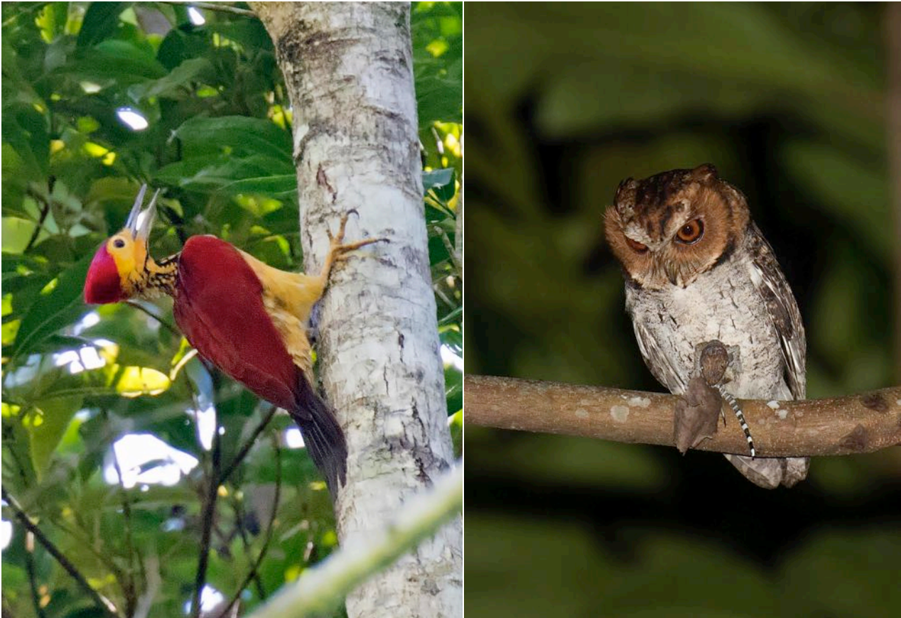
The stonking Yellow-faced Flameback and a cute Negros Scops Owl.

and we decided to make the most of it, going on a very enjoyable boat trip around the lake, to look for the rare Yellow-faced Flameback. This turned out to be a great success, as we enjoyed terrific views of this truly spectacular woodpecker, which must rank amongst the best in the world. This was only the second time this endemic woodpecker was seen in a Birdquest tour, so we were all (especially the leader!) very excited with the sighting. Other good birds seen during the boat ride included a displaying Philippine Honey-Buzzard, which put on a fantastic show, as well as Western Osprey, Philippine Spine-tailed Swift and Striated Herons. We then returned to dry land, and spent some time in a viewing deck, overlooking the two lakes. After lunch, we still had some work to do. After a bit of walking in the forest we eventually found a mixed flock, which held our target Visayan Fantail, as well as a White-vented Whistler, amongst others. And, to round off the day, a visit to a clearing not far from the roadside produced excellent looks at a pair of Black-belted Flowerpeckers.