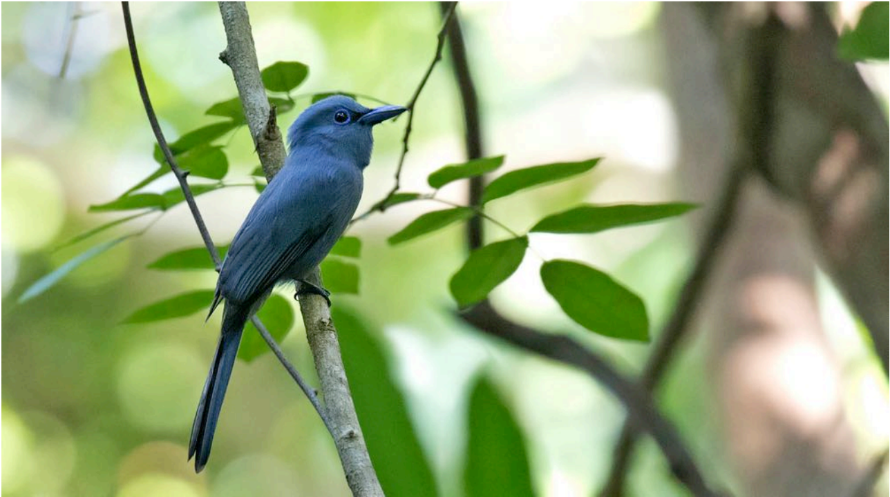
Blue Paradise Flycatcher. (DLV)

Black-naped Oriole Oriolus chinensis Fairly common and widespread (nominate). Ashy Drongo Dicrurus leucophaeus A few seen in Palawan (nominate). Balicassiao ◊ Dicrurus balicassius Several at Subic and Mt Makiling. Visayan Drongo ◊ Dicrurus mirabilis Great views in Negros. Palawan Drongo ◊ Dicrurus [hottentottus] palawanensis A few seen in Palawan. Not yet split by the IOC. Mindanao Drongo ◊ Dicrurus [hottentottus] striatus Nominate ssp seen on Mindanao.