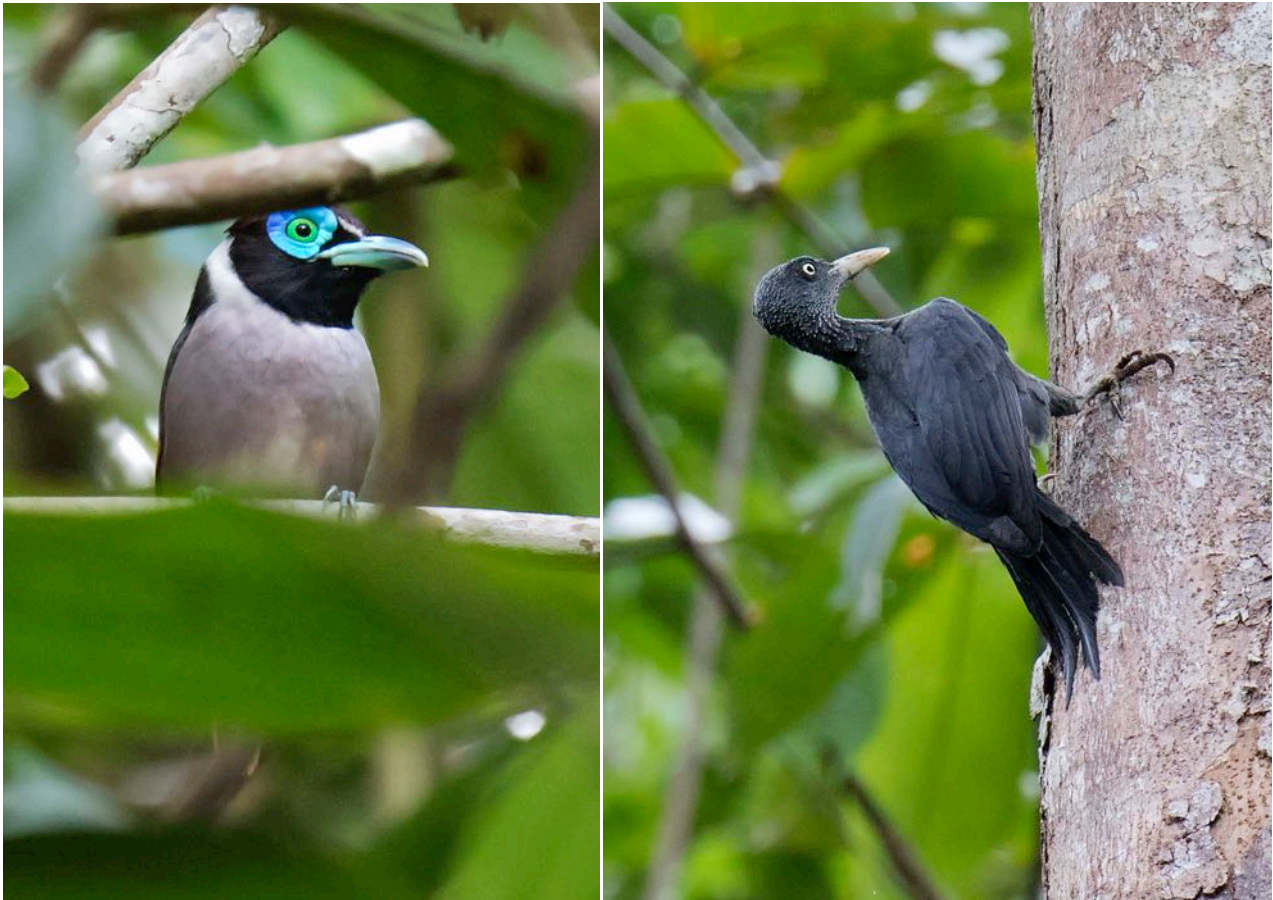
Two of the rarest birds seen during our stay in PICOP. The cracking (Mindanao) Wattle-billed Woodpecker and the impressive Southern Sooty Woodpecker. (DLV)

Rail, a brief Clamorous Reed Warbler, some skulking Middendorff's Grasshopper Warblers –very common by voice here, but always difficult to see!-, Eastern Yellow Wagtail, Paddyfield Pipit and a pair of Golden-headed Cisticolas. It had been a long but very productive day, so we wend bak to our hotel for dinner and some sleep.