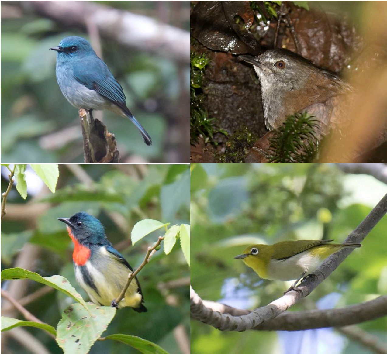
Turquoise Flycatcher, Long-tailed Bush Warbler, Lowland White-eye and Fire-breasted Flowerpecker. (DLV)