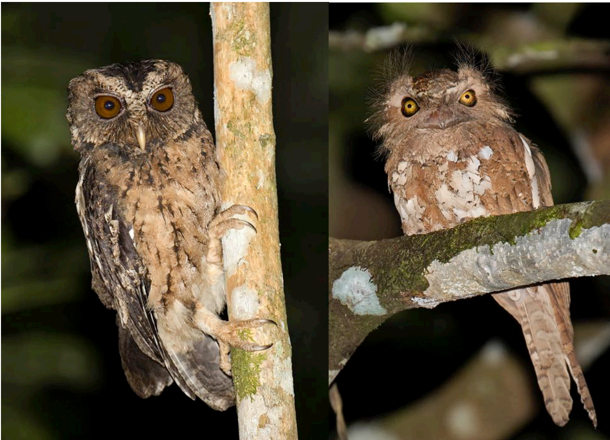
The two endemic nightbirds of Palawan. Palawan Scops Owl and Palawan Frogmouth. (DLV)