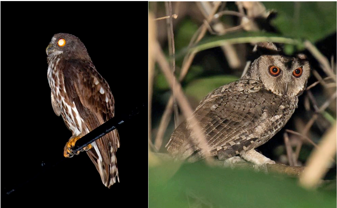
Two owls from Subic. Chocolate Boobook and Philippine Scops Owl. (DLV)

Before leaving Subic the next day we had time for some early morning birding. First, yet some more owling, which resulted in terrific views of Philippine Scops Owl. Afterwards we visited a particular spot in a nearby hill in search of the uncommon White-lore Oriole, and after a bit of searching we finally found a pair, which gave decent views. We then went to the usual White-fronted Tit spot, but in spite of two hours looking for it, we drew a blank. It was then time to sit back for the long drive north to Banaue, where we arrived in time for dinner.