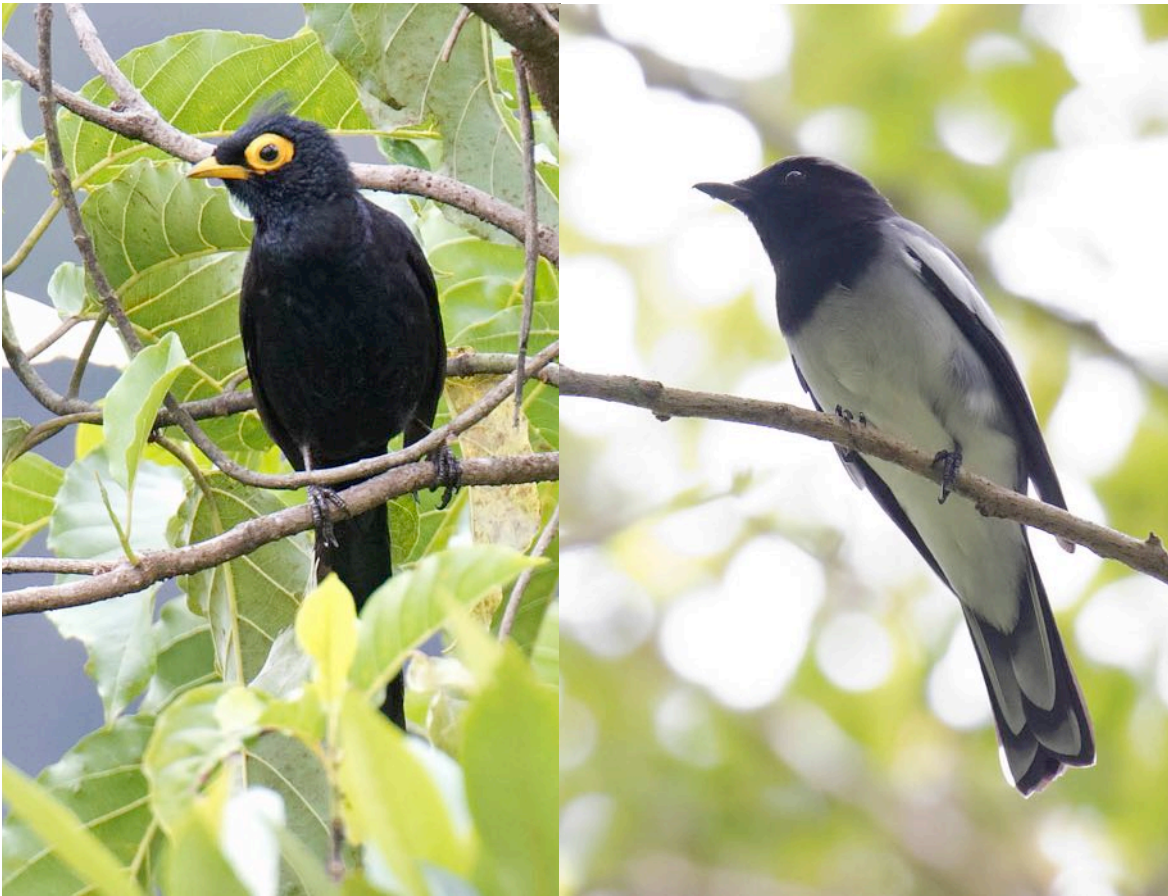
Apo Myna and McGregor's Cuckooshrike are two of Kitangland's specialities. (DLV)

Tim Fisher in 1993 - and the birds put on a great show, displaying over the clearing and giving excellent looks. A pair of Philippine Nightjars were seen flying around in the same area too. And just before dinner, we finished off the day with a Philippine Frogmouth at touching distance. What a bizarre-looking beast!