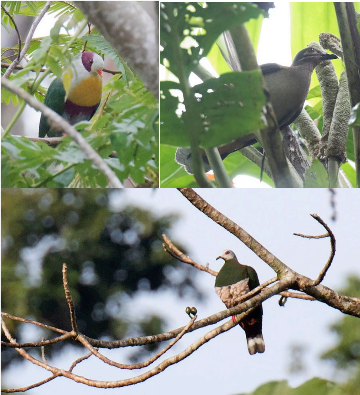
Yellow-breasted Fruit Dove, Amethyst Brown Dove and Pink-bellied Imperial Pigeon. (DLV)