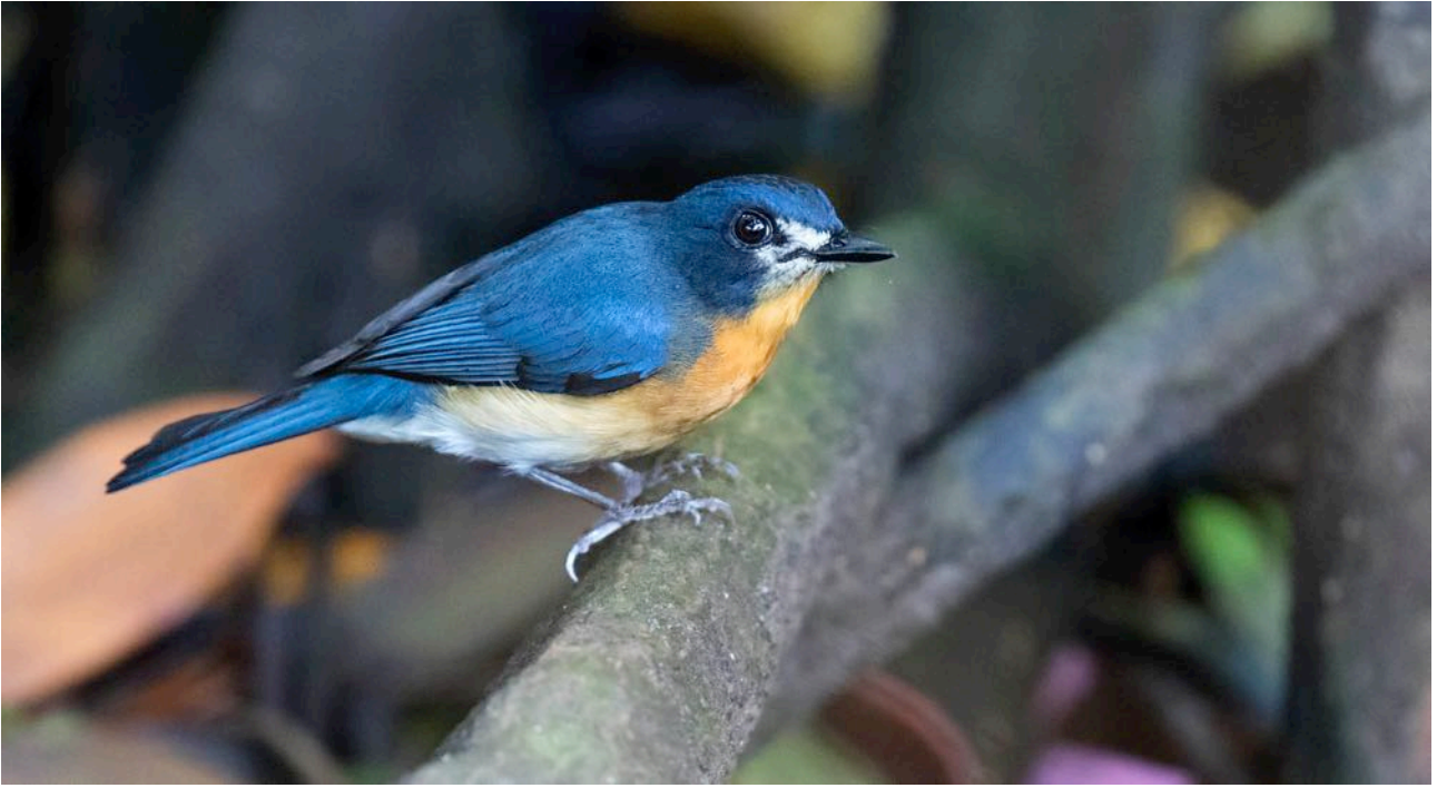
Mangrove Blue Flycatcher and Rufous-tailed Tailorbird. (DLV)