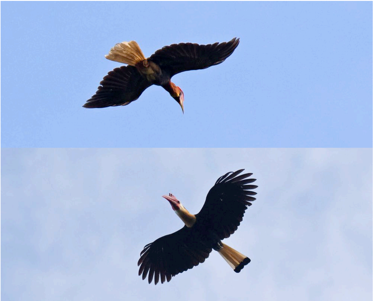
Rufous Hornbill, above, and Writhed Hornbill, below, at PICOP. (DLV)

Purple Needletail ◊ Hirundapus celebensis Seen in Mindor