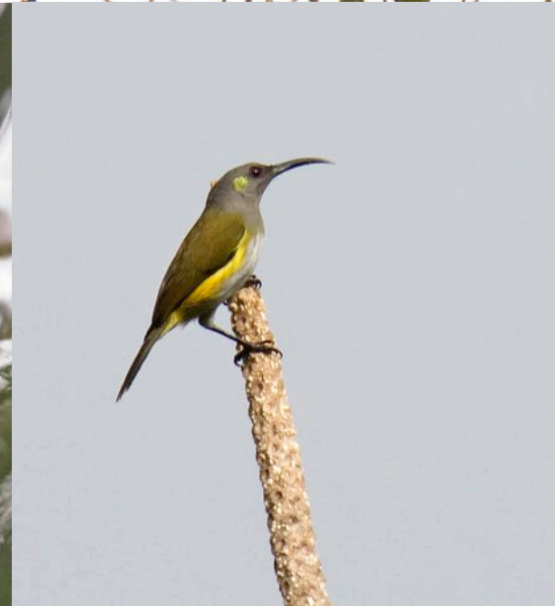
Two Birdquest lifers above: Cryptic Flycatcher and a poor record shot of Whiskered Flowerpecker . Grey-hooded Sunbird and Striated Wren-Babbler below. (DLV)

Red-keeled Flowerpecker ◊ Dicaeum australe Many seen, but particularly common at PICOP.