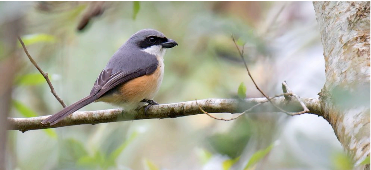
Mountain Shrike, endemic to the Philippines.