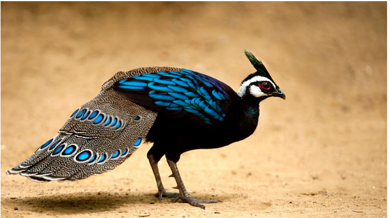
Palawan Peacock-Pheasant and Mountail Tailorbird.