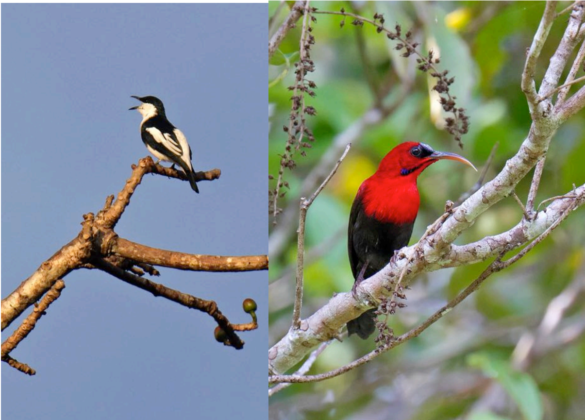
Black-and-white Triller and Magnificent Sunbird. (DLV)