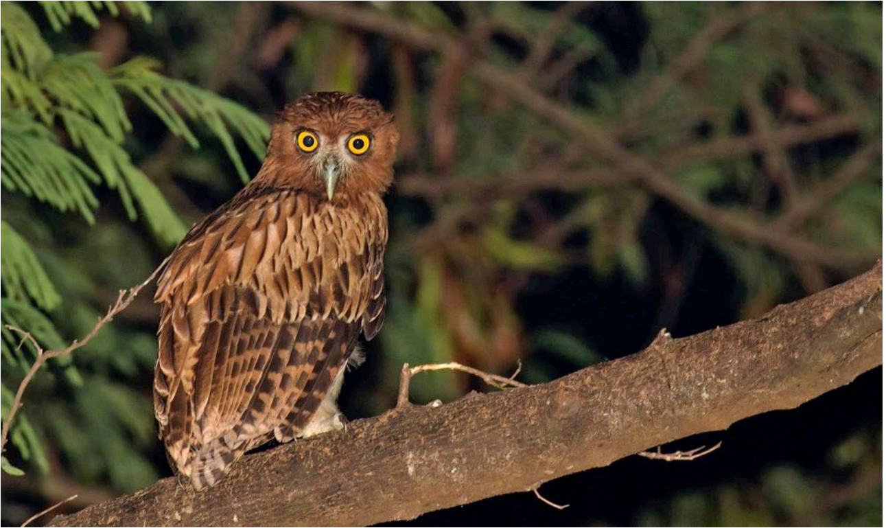
Philippine Eagle-Owl and Ashy Thrush. (DLV)