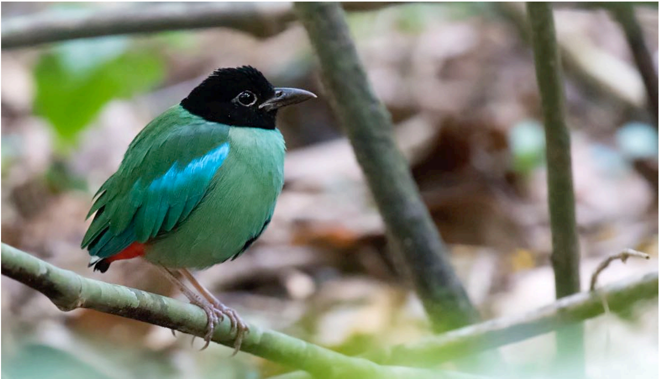
A rather confiding Hooded Pitta at St Pauls, Palawan.

vantage point, together with endemic Palawan Hornbill and Palawan Tits, while Common Iora, Dark-throated Oriole, Black-headed Bulbul, Plaintive Cuckoo and Square-tailed Drongo Cuckoo were also seen. In the evening we went for some owling, and it didn't disappoint. Within half an hour we had Palawan Scops Owl and Palawan Frogmouth fixed in the torch beam, just a few feet from us, and giving wonderful views. It was then time to go back to our excellent resort by the beach in Sabang.