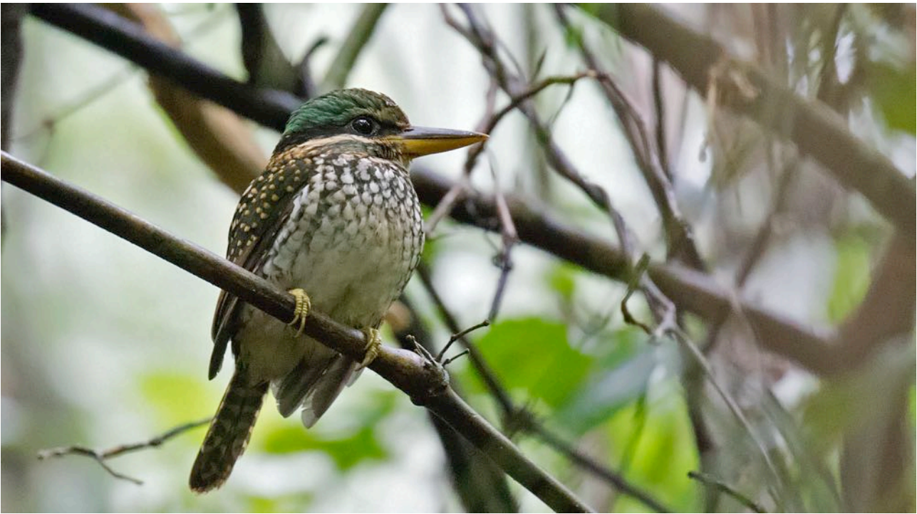
A female Spotted Wood Kingfisher. There was no shortage of kingfishers on this tour! (DLV)

Next morning we visited La Mesa Ecopark, in search of the endemic Ashy Thrush. The place was full of students, but after some time we found a quiet patch of forest, where a pair of these beautiful thrushes performed at length. What a bird! Just a few years ago this was one of the trickiest endemics to see, and within a few years, thanks to these birds in La Mesa the species has become available to everyone. Other goodies in the area included some Lowland White-eyes, a Grey-backed Tailorbird, a Grey-throated Sunbird and a female Spotted Wood Kingfisher. All that remained now was our drive back to Manila before we split up. Some would fly home, while the rest, plus two new participants, would now fly to Negros for the first extension of the tour. After saying goodbye to those leaving, we checked in for the flight to Dumagete and the Visayas Extension, arriving in good time at our seaside hotel in Negros. We left our bags, and went straight to our owling site. Here, it didn't take long to find our target, the cute Negros Scops Owl. After a sumptuous dinner –the norm on this tour!- we went to bed.