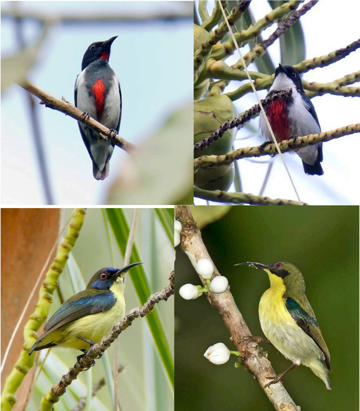
Scarlet-collared and Black-belted Flowerpeckers, above, and Bohol and Metallic-winged Sunbirds, below.

Scaly-breasted Munia Lonchura punctulata Seen in Palawan ( cabanisi ).