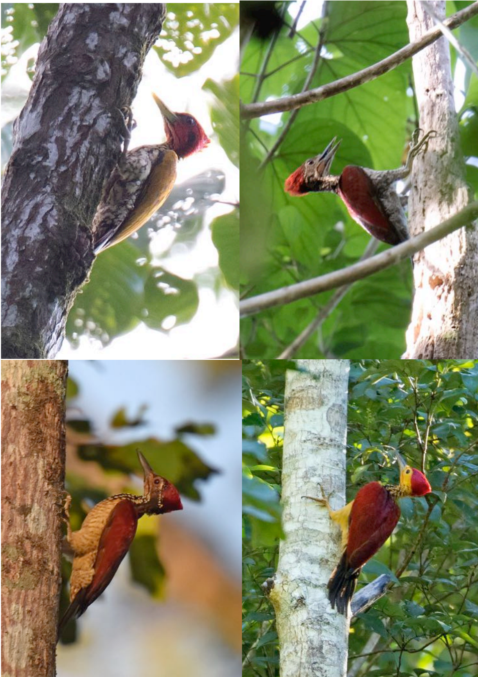
The splitting of Greater Flameback produced 4 endemic flamebacks in the Philippines. We saw them all! Red-headed, Buff-spotted, Yellow-faced and Luzon. (DLV)