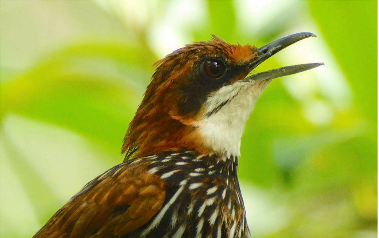
Close-up of the retiring Falcatid Wren-Babbler and Ashy Thrush. (Nicky Icarangal and DLV)