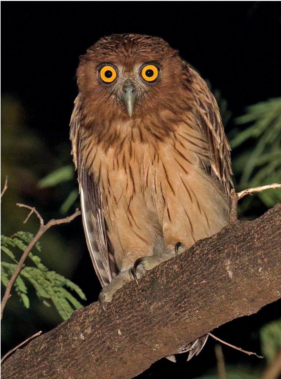
Philippine Eagle-Owl. WOW!