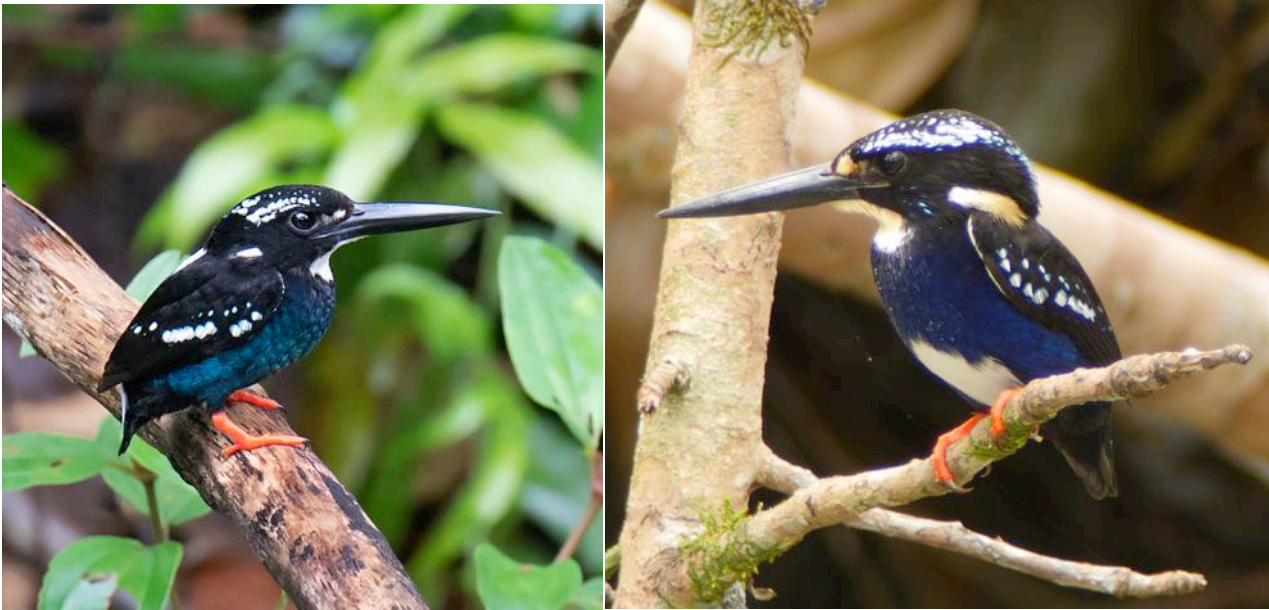
Southern, left, and Northern, right, Silvery Kingfishers. Two of the best ones in the world, for sure. (DLV)

well. A few good birds were also seen, including Luzon Striped Babbler, Furtive Flycatcher and Sierra Madre Crow. We eventually waded across a river and made our way up to the camp, arriving by mid afternoon. Luckily, our crew had done an amazing job, everything was in place when we arrived, with plenty of beer and cold drinks already on the table!