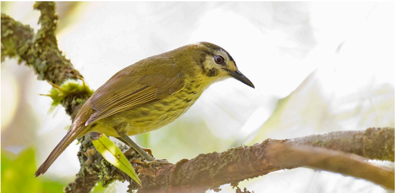
The endangered Negros Striped Babbler. (DLV)