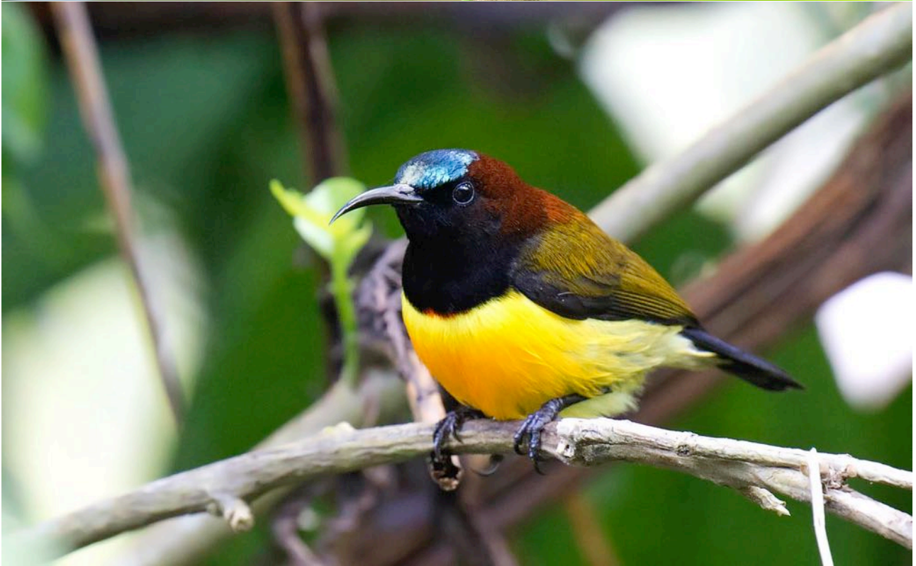
Lovely and Maroon-naped Sunbirds.