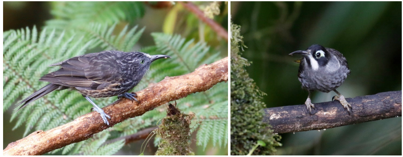
Grey-streaked Honeyeater and Belford's Melidectes (Chris Kehoe)

Double-eyed Fig Parrot ◊ (Red-faced F P) Cyclopsitta diophthalma Numerous near Kiunga. Archbold's Bowerbird ◊ Archboldia papuensis One at Kumul. Flame Bowerbird ◊ Sericulus ardens Four females near Kiunga. Yellow-breasted Bowerbird ◊ (Lauterbach's B) Chlamydera lauterbachi A couple in the Minamba Valley. Fawn-breasted Bowerbird ◊ Chlamydera cerviniventris Several at PAU. White-shouldered Fairywren ◊ Malurus alboscapulatus Noted at Rondon and near Kumul. Papuan Black Myzomela ◊ (Black M) Myzomela nigrita Two at Varirata.