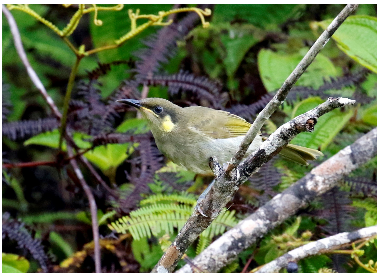
Mimic Honeyeater

Grey-streaked Honeyeater ◊ (Black-backed H) Ptiloprora perstriata Several at Kumul. Plain Honeyeater ◊ Pycnopygius ixoides A handful at Varirata. Streak-headed Honeyeater ◊ Pycnopygius stictocephalus One seen and a couple heard at Varirata. Tawny-breasted Honeyeater ◊ Xanthotis flaviventer Several at Varirata. New Guinea Friarbird ◊ Philemon novaeguineae Widespread encounters in the lowlands. White-throated Honeyeater ◊ Melithreptus albogularis A couple near Varirata. Long-billed Honeyeater ◊ Melithreptus albogularis A couple near Varirata. Long-billed Honeyeater ◊ Melitests megarhynchus One near Kiunga. Common Smoky Honeyeater ◊ Melipotes fumigatus Numerous in the highlands. Rufous-banded Honeyeater ◊ Conopophila albogularis Several at PAU. Obscure Honeyeater ◊ Caligavis obscura (H) Heard near Kiunga. Yellow-browed Melidectes ◊ Melidectes rufocrissalis Several at Rondon. Belford's Melidectes ◊ Melidectes belfordi Numerous at Kumul. Ornate Melidectes ◊ (Cinnamon-breasted M) Melidectes torquatus Small numbers in the highlands. Mountain Honeyeater ◊ (M Meliphaga, Hill Forest H) Meliphaga orientalis A couple in the Minamba Valley.