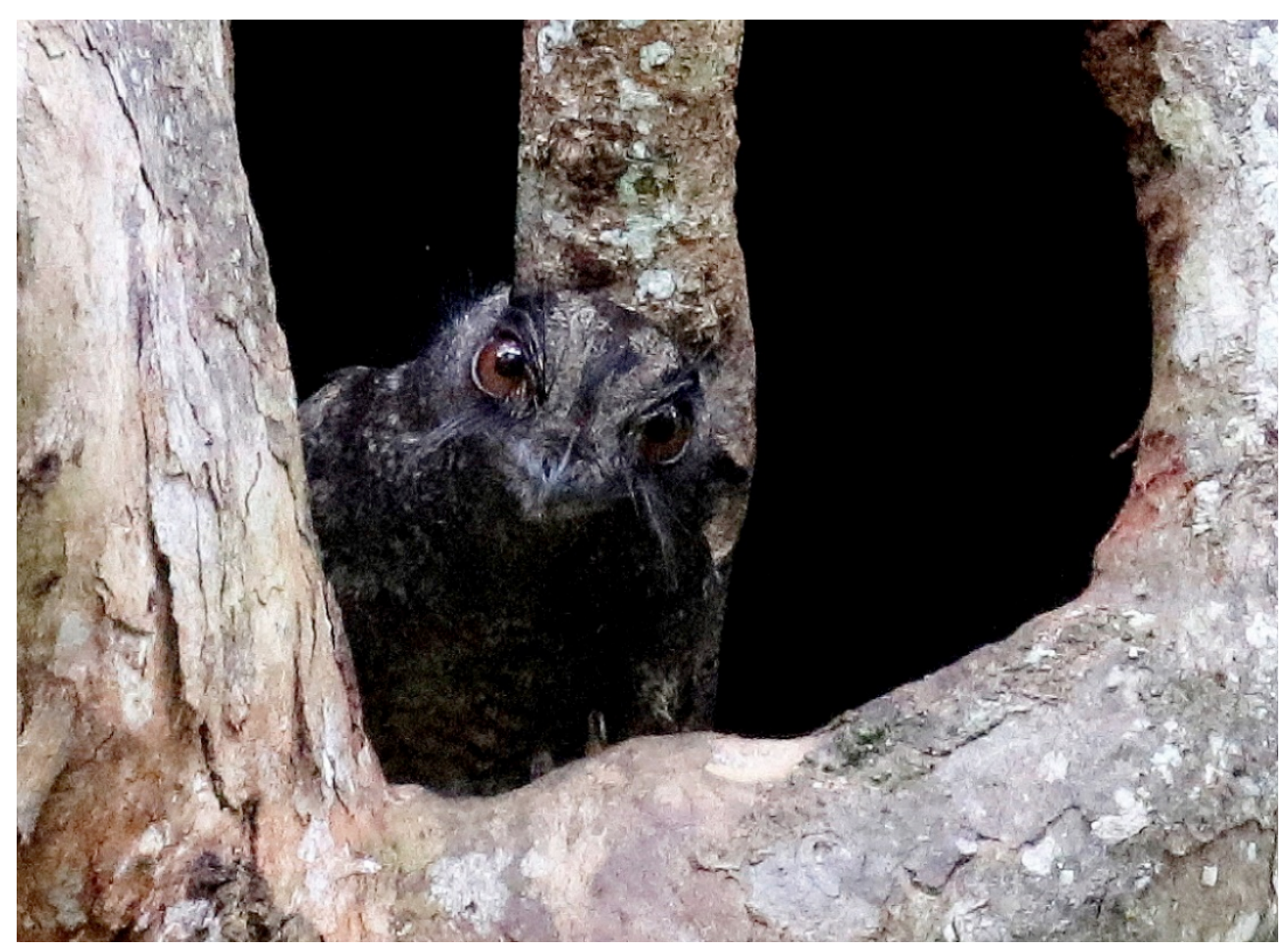
Barred Owlet-nightjar (Chris Kehoe)

Our tour began with a visit to Varirata NP from our base in Port Moresby. Fruiting trees and dead snags in the picnic area at Varirata proved productive with a good selection of Fruit Doves including Orange-bellied, Dwarf and Beautiful along with several Red-cheeked Parrots, Boyer's and Barred Cuckooshrikes and Hooded Pitohuis. Our first Raggiana Birds-of-paradise were much appreciated while smaller birds included Tawny-breasted, Plain and Mimic Honeyeaters, Black Berrypeckers and Red-capped Flowerpeckers and a Pacific Baza flew over. Along the adjacent Treehouse Trail we enjoyed fine views of a dazzling Brown-headed Paradise Kingfisher and a Pygmy Eagle was overhead during our box lunch break. A walk along the Viewpoint Trail gave us a fabulous Barred Owlet-nightjar peeping out of its roost hole. Also seen along the trails were several Black Cicadabirds, a Frilled Monarch and Crinkle-collared Manucodes. On our return to Port Moresby we diverted to the Pacific Adventist University (PAU) grounds where open parkland with lakes attract many wetland birds. Plumed and Wandering Whistling Ducks, Grey Teals and Comb-crested Jacanas were at the lakes where Pied Herons and Nankeen Night Herons showed well along with many other species. In the trees we found a skittish Orange-fronted Fruit Dove and a fabulous Papuan Frogmouth, along with Fawn-breasted Bowerbirds and a Black-backed Butcherbird to round of our first day in fine style.