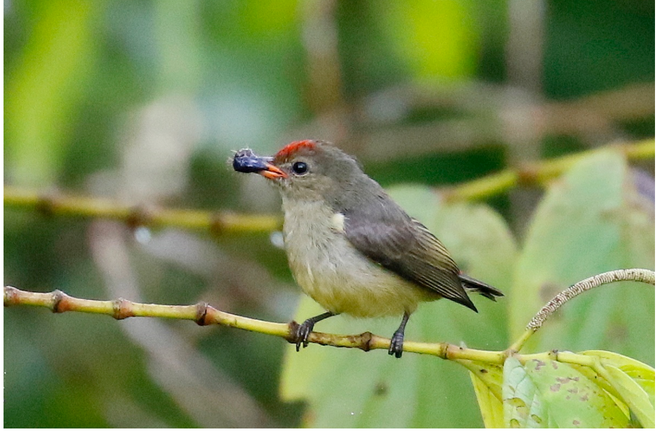
Red-capped Flowerpecker

Growling Riflebird (Eastern R) Ptiloris intercedens One seen and others heard at Varirata.