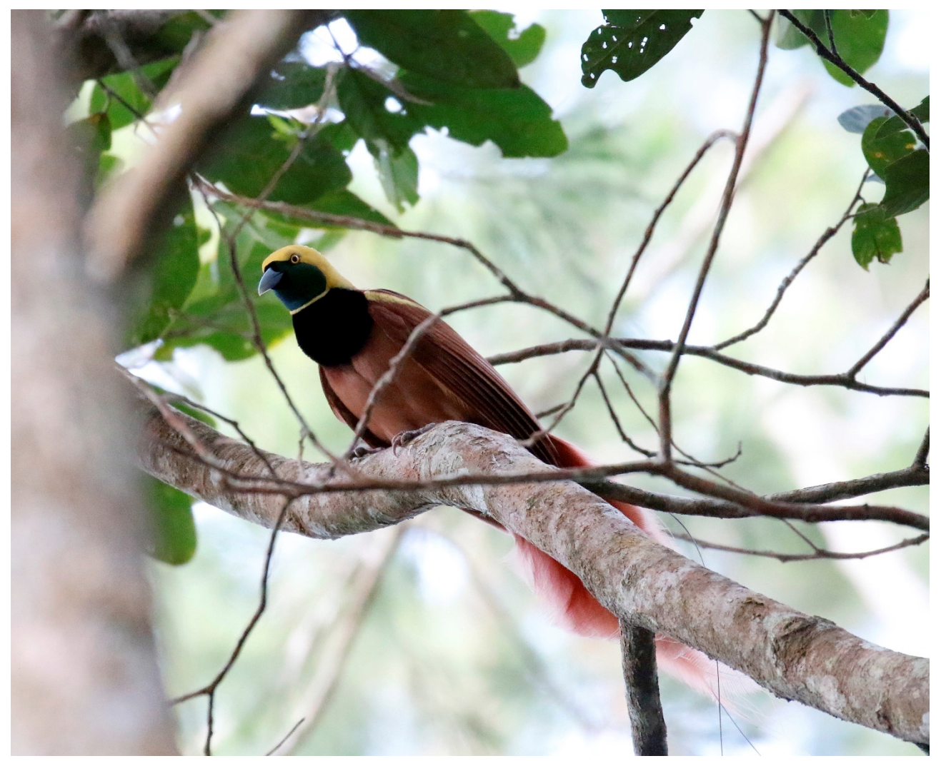
Raggiana Bird-of-paradise (Chris Kehoe)

An early flight the next morning delivered us to Mount Hagen, capital of the Central Highlands Province, where we boarded a bus and drove up to Rondon Ridge for a two-night stay. Either side of lunch we birded in the lodge grounds and along some of the trails until heavy and persistent rain set in, seeing, amongst others, Mountain Swiftlets, Bar-tailed Cuckoo-Doves, Mountain and Red-collared Myzomelas, Ornate and Yellow-browed Melidectes, Common Smoky Honeyeaters, Fan-tailed Berrypeckers, Papuan White-eyes, Black and Friendly Fantails and Island Leaf Warblers, though the highlight was probably our first Princess Stephanie's Astrapia.