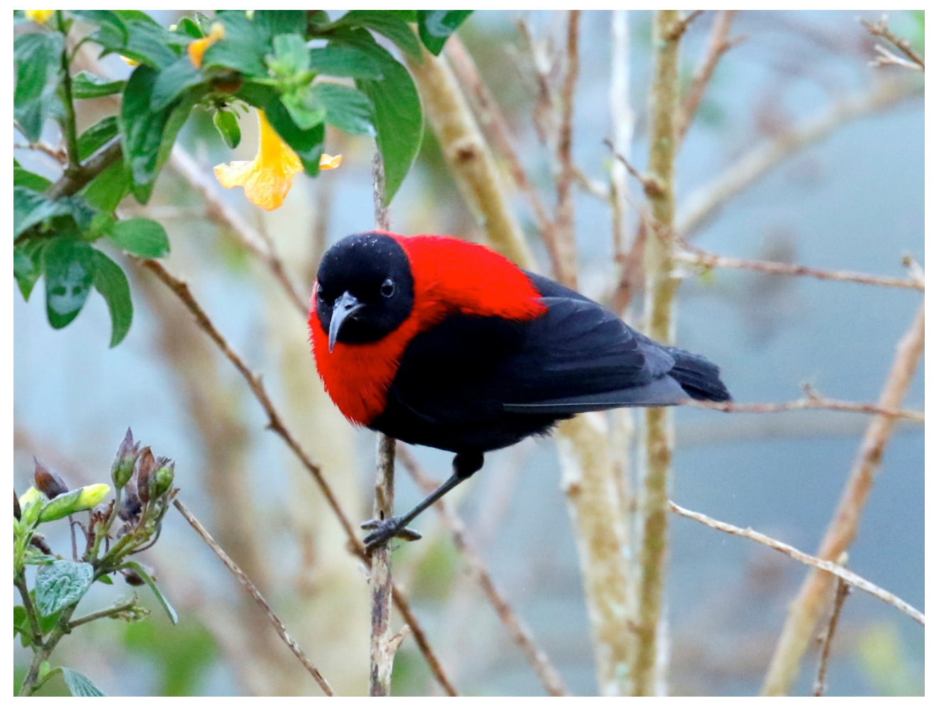
Red-collared Myzomela

A final few hours at Rondon the next morning gave us repeat views of several choice species including the female Blue Bird-of-paradise while the journey via Mt. Hagen to Kumul Lodge was enlivened by a Papuan Harrier for some. Once at Kumul we wasted no time making our way to the veranda overlooking the lodge's wonderful and rightly famous birdtable. New birds came thick and fast with particular highlights being Ribbon-tailed Astrapias, including an outrageously long-tailed male, Brown Sicklebills, Brehm's Tiger Parrots and Belford's Melidectes, all of which were to be regular sights in the coming days. After lunch we continued birding in the lodge grounds where many more fabulous birds were found including Grey-streaked Honeyeaters, Island Thrushes, Large Scrubwren, White-winged Robins, two Crested Satinbirds (including an astonishing vivid male), fabulous Crested Berrypeckers, a couple of Rufous-naped Bellbirds and smart Mountain Firetails.