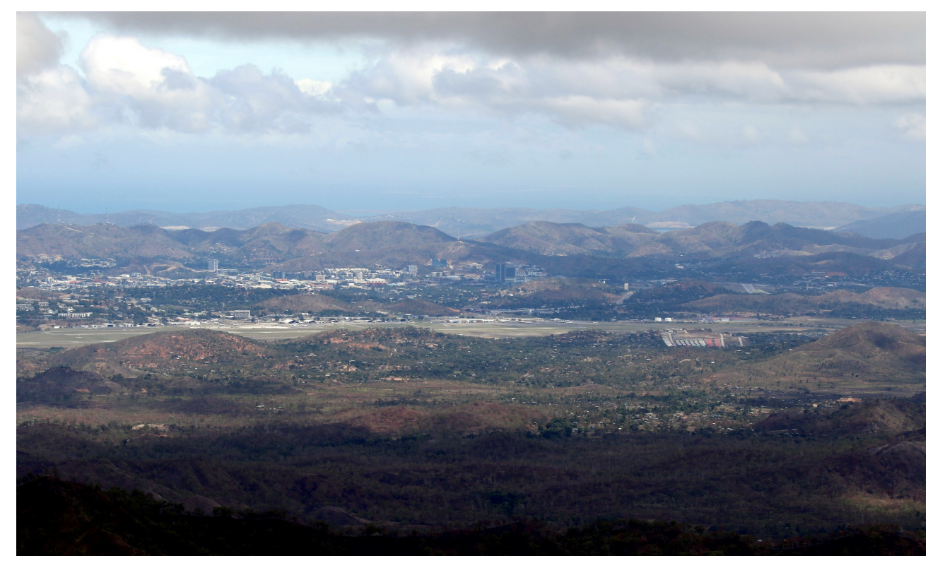
Port Moresby from Varirata