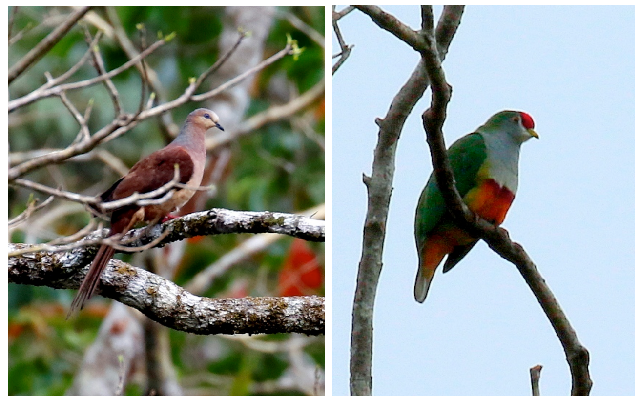
Amboyna Cuckoo Dove and Beautiful Fruit Dove (Chris Kehoe)

Bar-shouldered Dove Geopelia humeralis A couple at PAU. Bronze Ground Dove ◊ Alopecoenas beccarii One at Kumul. Pheasant Pigeon ◊ Otidiphaps nobilis (NL) One at PAU. Sclater's Crowned Pigeon ◊ Goura sclateri About eight near Kwatu camp, some great views. Wompoo Fruit Dove ◊ (Magnificent F D) Ptilinopus magnificus Two at Varirata.