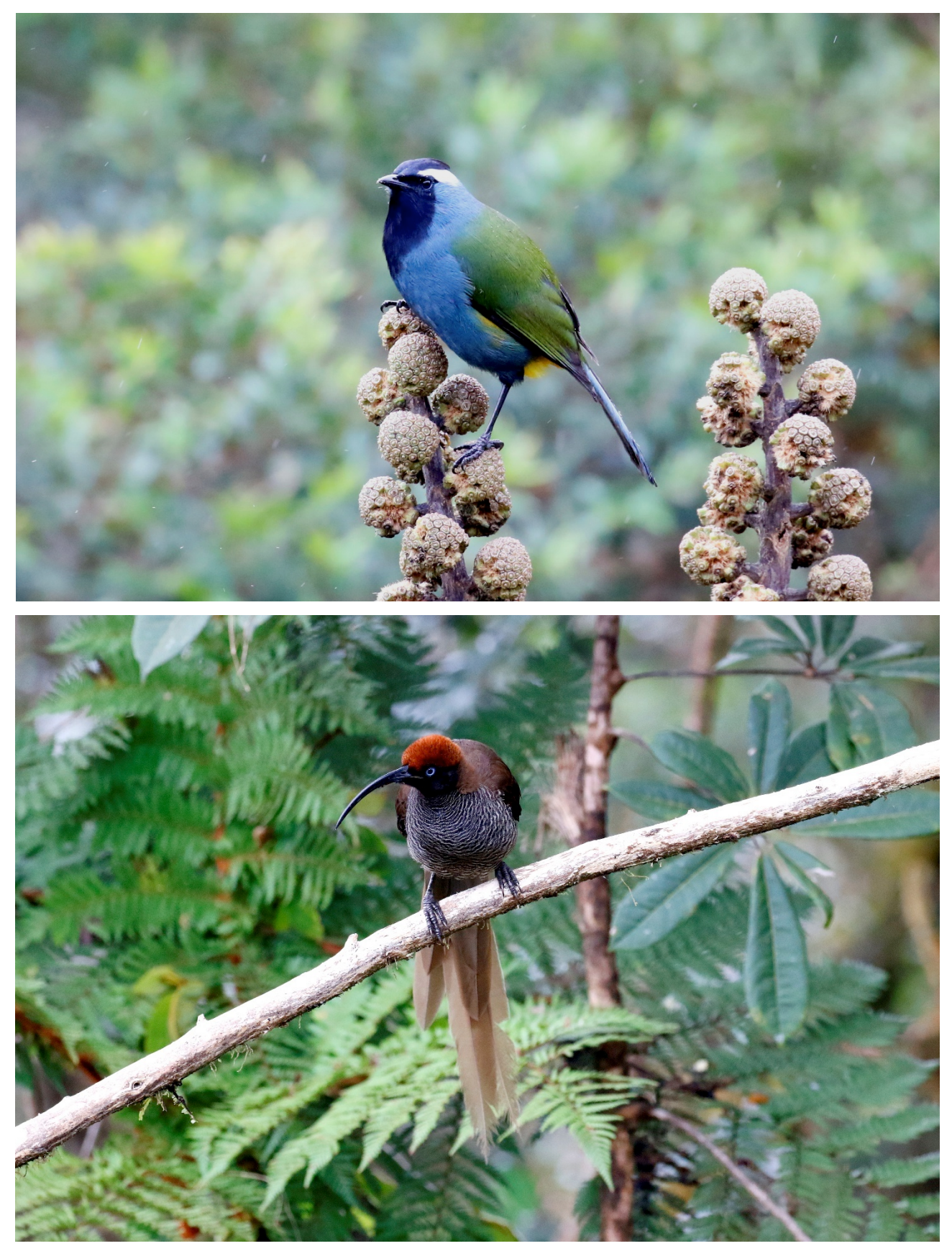
'Eastern' Crested Berrypecker and Brown Sicklebill (Chris Kehoe)

The next morning we drove a short distance down the Minamba Valley to a point where we could watch a group of fruiting trees on a hillside. These trees had been attractive to Birds-of-paradise recently and sure enough we soon had the first of several Superb Birds-of-paradise in the scope. Our main target though was