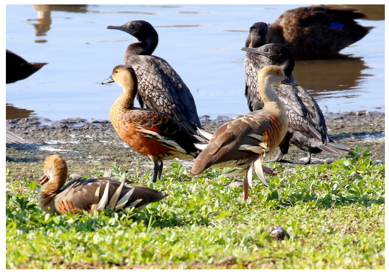
Plumed and Wandering Whistling Ducks, Little Black Cormorants and Pacific Black Duck (Chris Kehoe)

Little Black Cormorant Phalacrocorax sulcirostris Numerous at PAU. Pacific Baza (Crested Hawk) Aviceda subcristata Noted on four dates at Varirata and near Kiunga. Long-tailed Honey Buzzard (L-t Buzzard) Henicopernis longicauda Singles at Rondon and near Kwatu. Pygmy Eagle Hieraaetus weiskei Singles at Varirata and in the Minamba Valley.