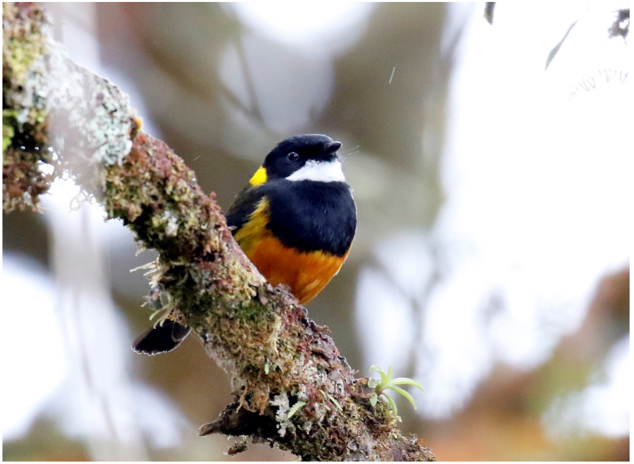
Regent Whistler (Chris Kehoe)

Another pre-dawn start saw us driving further down the Minamba Valley to a forest fragment where Lesser Bird-of-paradise occurs. After taking up our positions at a viewing area we quickly located a calling male Lesser but low cloud soon obscured it from view. Eventually though, the mist cleared and we went on to enjoy a series of good views of this striking bird. A Brush Cuckoo and a couple of Mountain Honeyeaters and Hooded Mannikins were also seen here along with other bits and pieces. Stops on our return journey towards Kumul gave us a Pygmy Eagle, several Torrent Flyrobins and a Black-headed Whistler at a river crossing while Yellow-breasted Bowerbirds were the highlight at a second stop. Apart from a fleeting Bronze Ground Dove for some, nothing new was seen either side of lunch at Kumul though many favourites showed well again before we returned to Mumur in pursuit of something new. Our plan came to fruition when we coaxed a calling Wattled Ploughbill into view to complete the list of endemic bird families while further highlights included a skittish Lesser Melampitta, a pair of Blue-capped Ifrits and a small party of Blue-faced Parrotfinches.