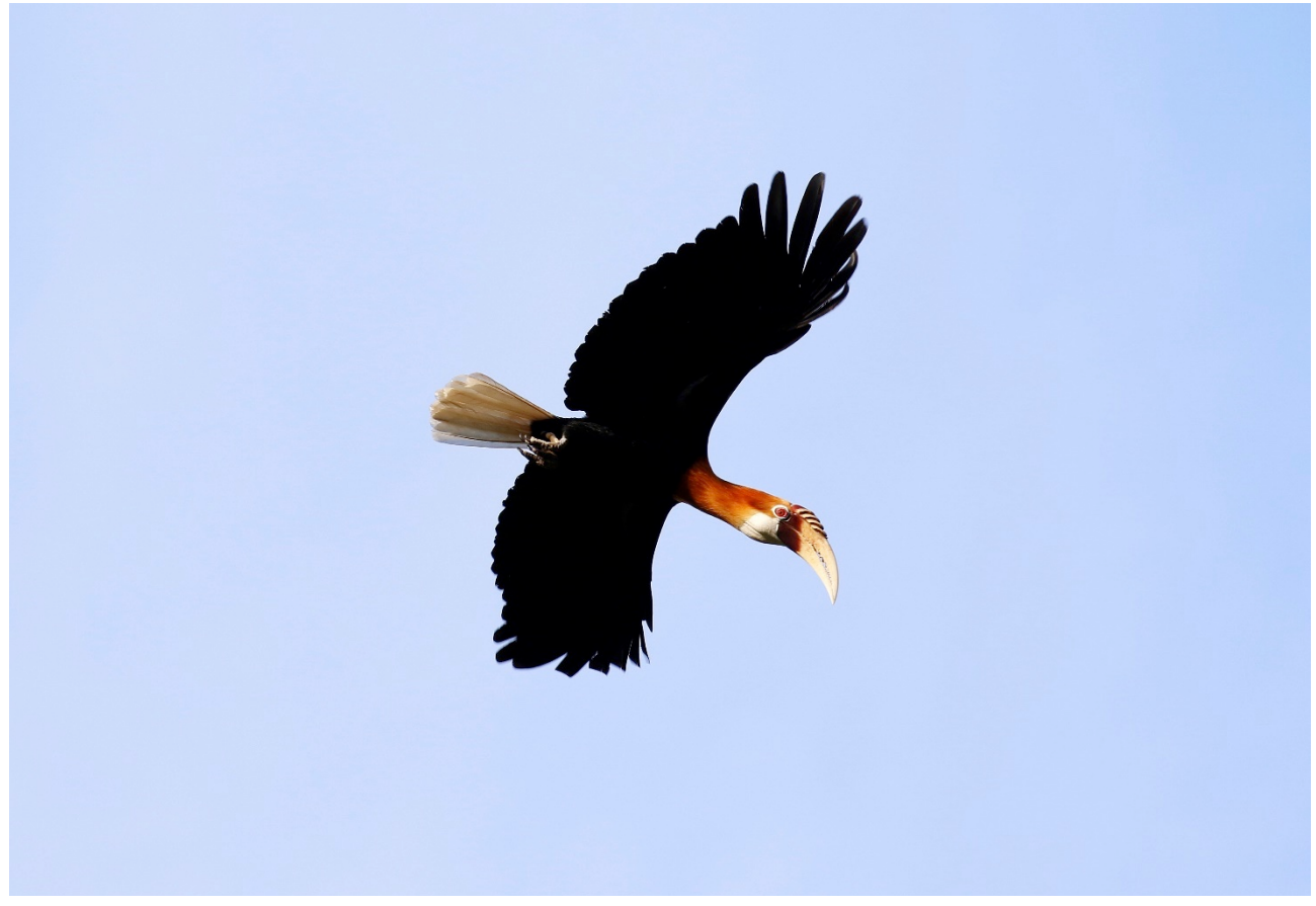
Blyth's Hornbill (Chris Kehoe)

The rain finally eased off just before dawn and our breakfast was interrupted by the appearance of a male Twelve-wired Bird of Paradise on its dancing pole opposite the camp. It wasn't particularly close but as the light improved we had fine scope views and could clearly see its strange wires. Happy with this we boarded the boat and set off to Watama Camp, seeing a couple more Sclater's Crowned Pigeons along the way. In the clearing around the camp we found many birds that were attracted to the fruiting trees including Great Cuckoo-Dove, four species of Fruit Doves and various Lorikeets, Fig Parrots, Cuckooshrikes and others. Further highlights in the general area included a Long-billed Cuckoo, spectacular Golden Monarchs, Yellow-billed Kingfisher and Rufous-bellied Kookaburra before we eventually ventured along the trail behind the camp where a busy flock of Papuan Babblers moved through the canopy while Black Berrypeckers, Spot-winged and Frilled Monarchs were also seen. After lunch back at Kwatu we commenced the return journey to Kiunga. In the heat of the afternoon birdlife was inevitably more subdued than on the outward journey but we saw a Pacific Baza and several other previously seen species before reaching town and our cosy guesthouse where hot showers and laundry for our muddy clothes were much appreciated.