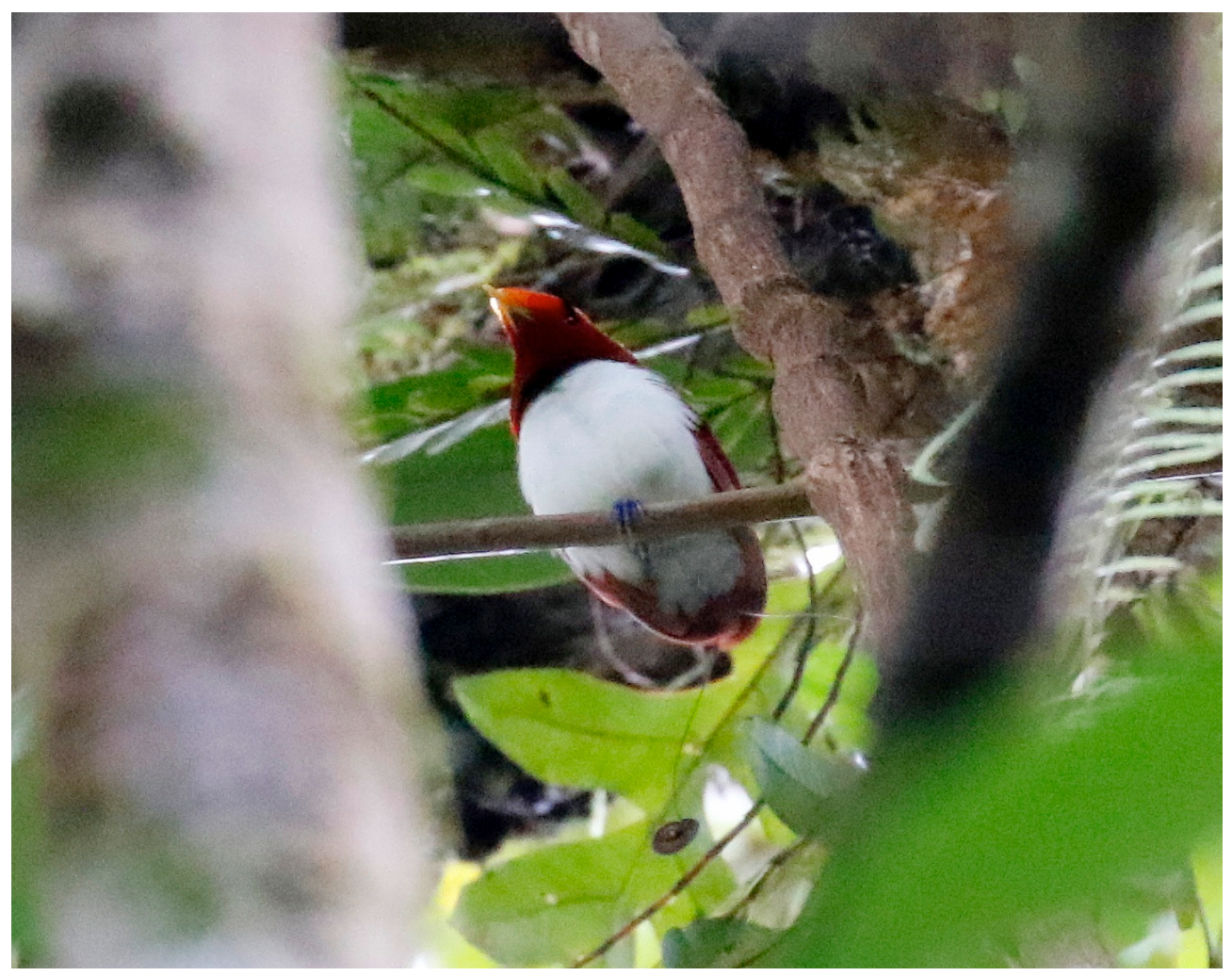
King Bird of Paradise (Chris Kehoe)

a gap in the canopy. After a little while the first of several males showed up and we went on to witness a truly spectacular and memorable display as up to six males vied for the attention of several females.