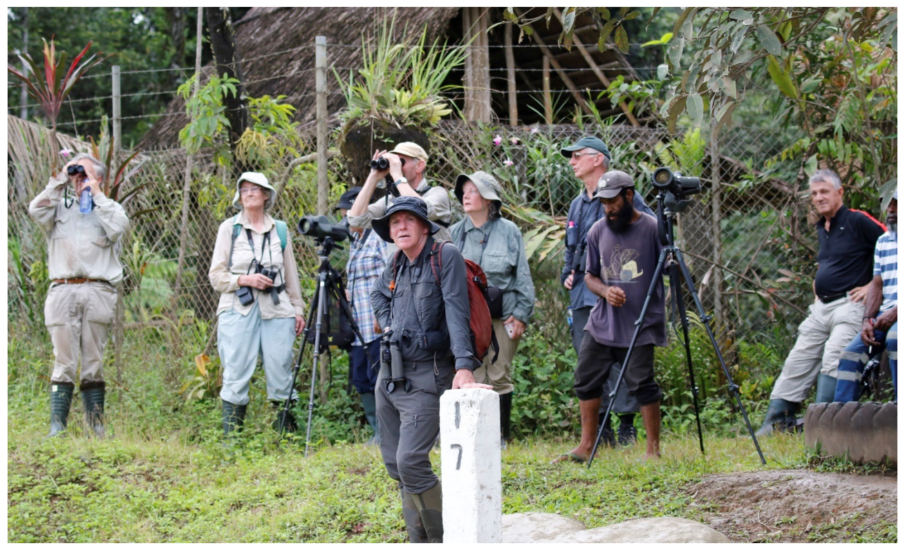
At Km.17

Number of species recorded on the tour: 2 Speckled Dasyure (Long-clawed Marsupial Mouse) Neophascogale Iorentzii One at Kumul. Agile Wallaby Macropus agilis Three at Varirata.