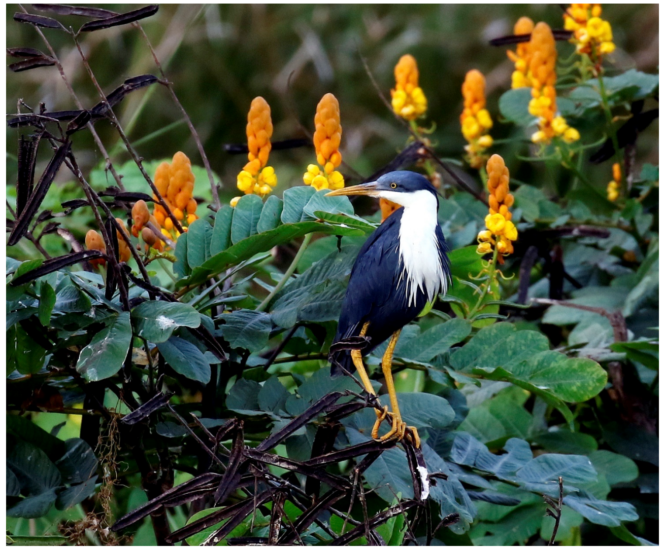
Pied Heron (Chris Kehoe)

With very inclement weather further inland we opted to return to PAU for a couple of hours before the tour ended later in the morning. Final views of Papuan Frogmouths were savoured and we added Green Pygmy Goose, Singing Starling, Bar-shouldered Dove, Whistling Kite and Buff-banded Rail to our list. In an area of newly constructed ricefields near PAU we were surprised to see Common Greenshank and Wood Sandpiper along with several Masked Lapwings and Raja Shelducks before returning to our lodge for some final packing and departure to the airport.