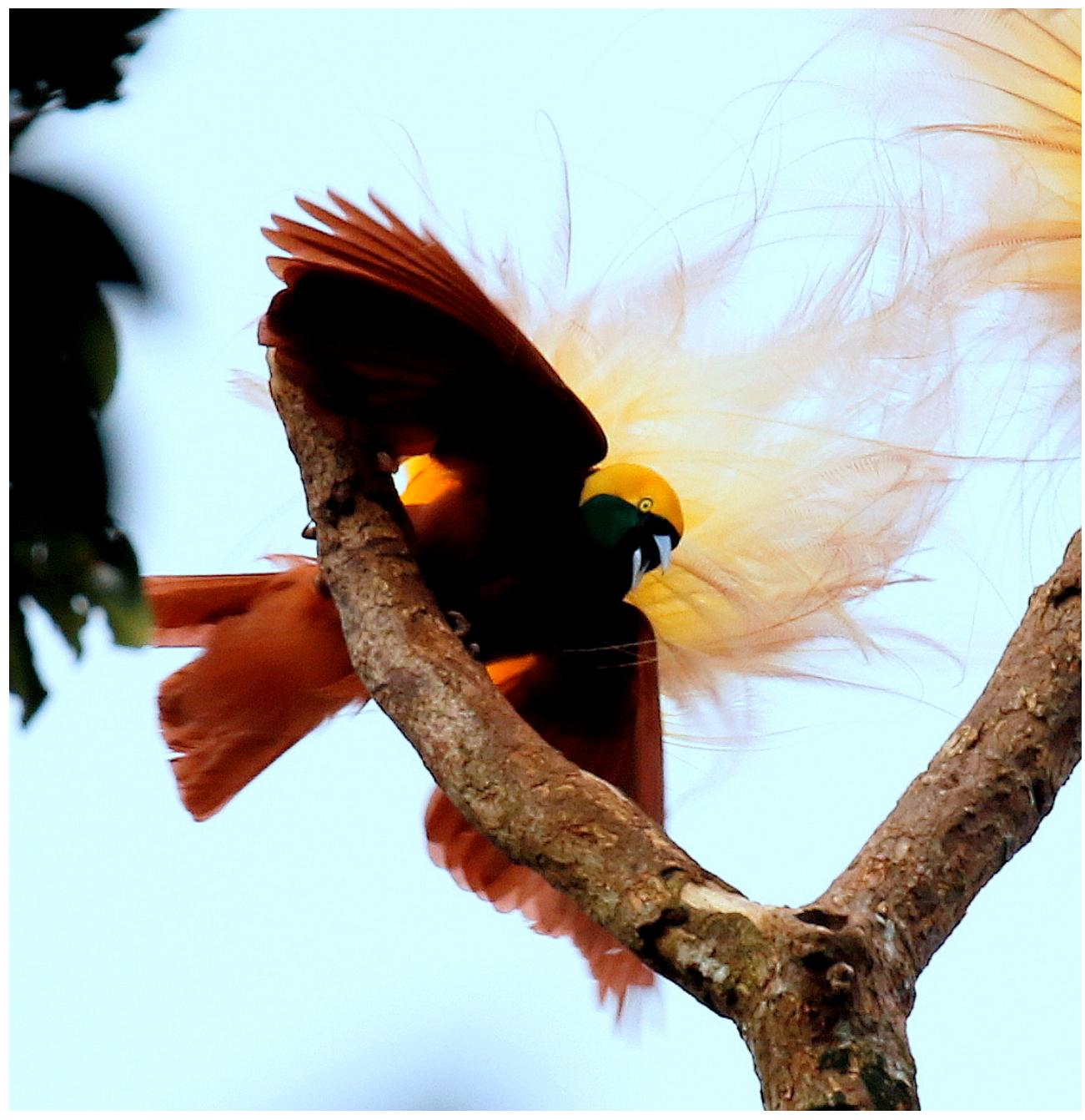
Greater Bird-of-paradise

Sclater's Whistler \diamond Pachycephala soror Two at Rondon. Regent Whistler \diamond Pachycephala schlegelii A handful in the highlands. Black-headed Whistler \diamond Pachycephala monacha One in the Minamba Valley. White-bellied Whistler \diamond Pachycephala leucogastra One near Varirata. White-bellied Pitohui \diamond Pseudorectes incertus (H) Heard near Kwatu camp. Little Shrikethrush (Rufous S) Colluricincla megarhyncha One near Kumul. Long-tailed Shrike Lanius schach One near Kumul.