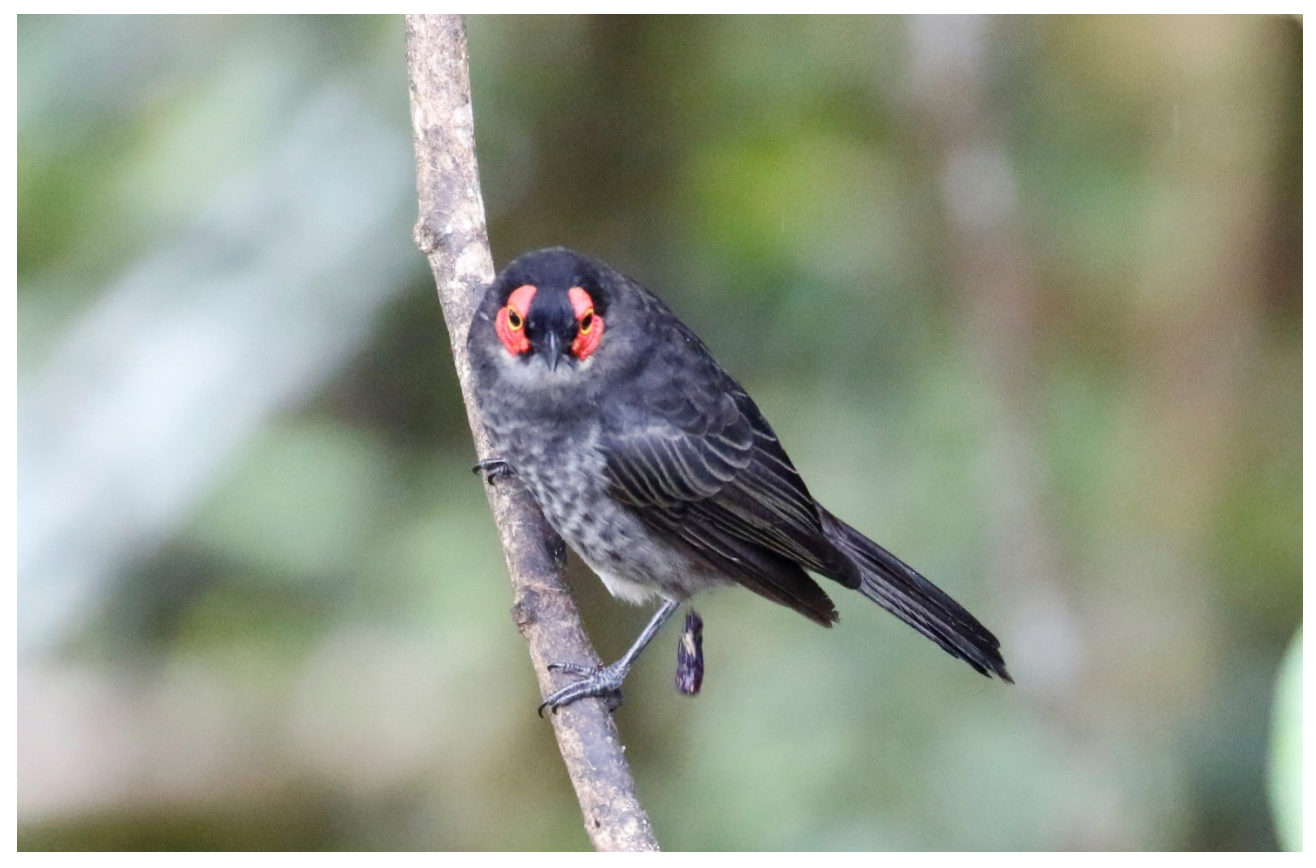
Common Smoky Honeyeater

Mountain Myzomela \diamond (Elfin M, M Red-headed M) Myzomela adolphinae Several in the highlands. Red-collared Myzomela \diamond Myzomela rosenbergii Several in the highlands. Green-backed Honeyeater \diamond Glycichaera fallax Two at Varirata. Rufous-backed Honeyeater \diamond Ptiloprora guisei A few near Kumul.