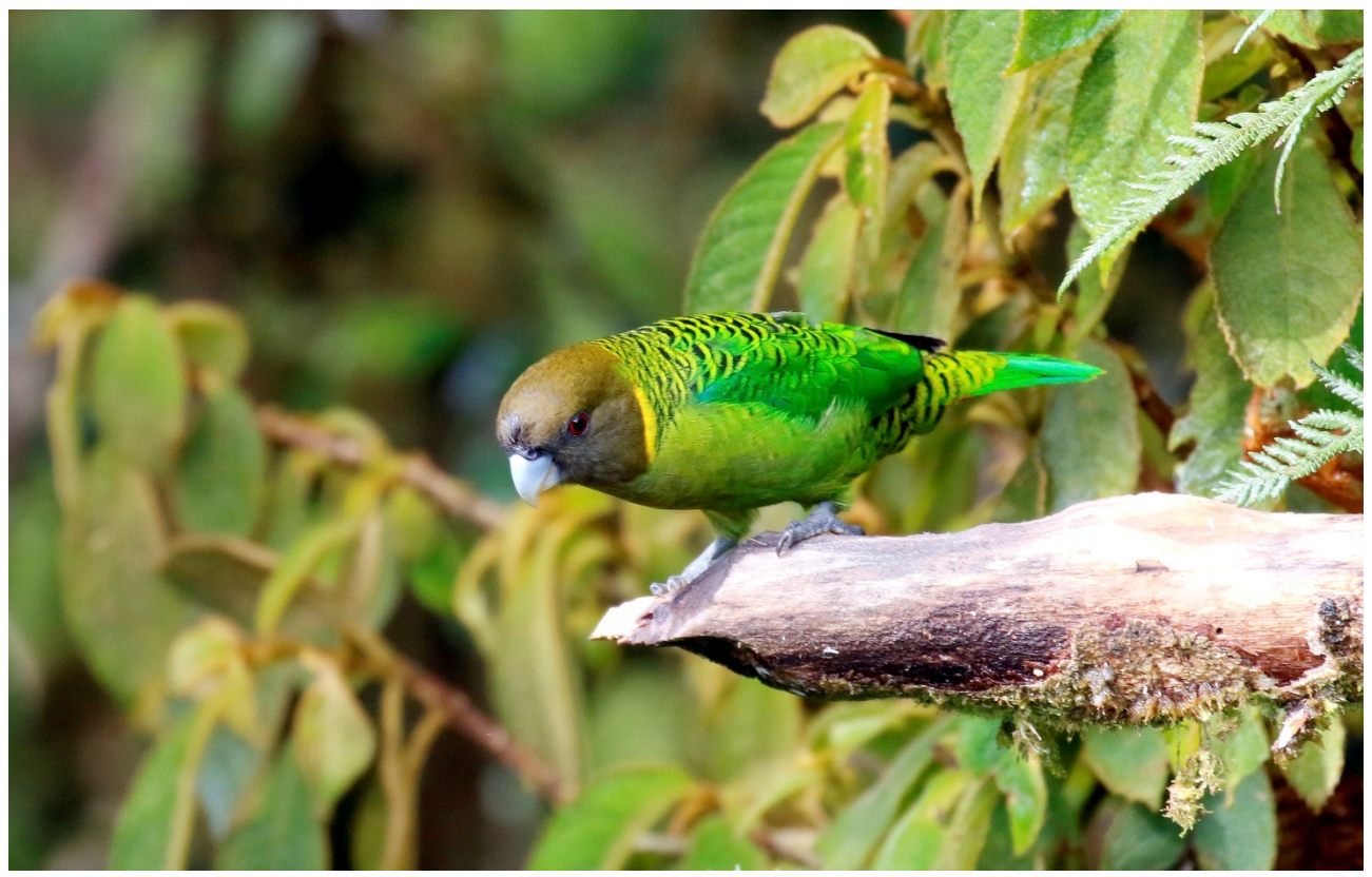
Brehm's Tiger Parrot

Glossy Swiftlet Collocalia esculenta Widespread. Mountain Swiftlet & Aerodramus hirundinaceus Numerous in the highlands. Uniform Swiftlet Aerodramus vanikorensis Numerous in the lowlands. Papuan Spine-tailed Swift & (P Spinetail, P Needletail) Mearnsia novaeguineae Several near Kiunga. Oriental Dollarbird Eurystomus orientalis Numerous near Kiunga, a couple elsewhere. Hook-billed Kingfisher & Melidora macrorrhina (H) Heard near Kiunga. Brown-headed Paradise Kingfisher & Tanysiptera danae One at Varirata. Rufous-bellied Kookaburra & Dacelo gaudichaud Good views of three near Kiunga. Forest Kingfisher Todiramphus macleayii A couple near Varirata. Sacred Kingfisher Todiramphus sanctus A couple in the lowlands. Yellow-billed Kingfisher & (Lesser Y-b K) Syma torotoro Good views at Varirata and near Kiunga.