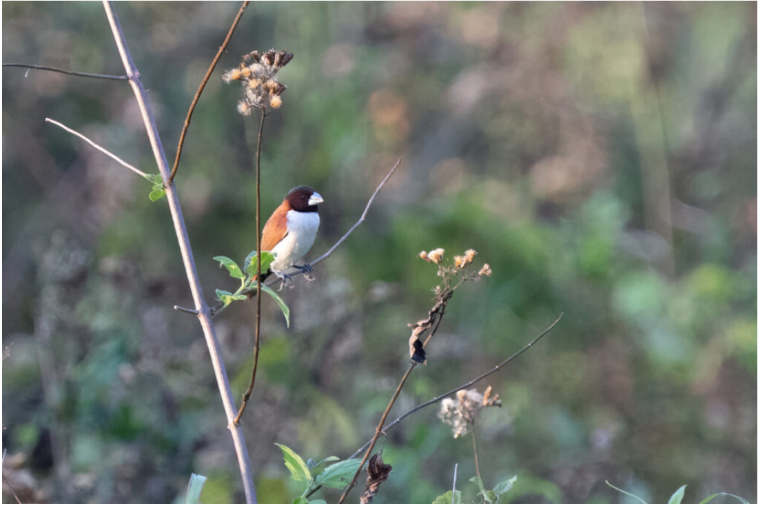
Five-coloured Munia