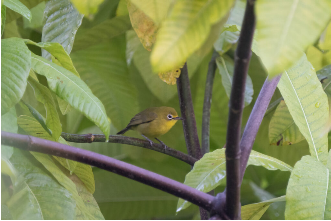
Lemon-bellied White-eye