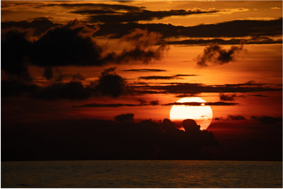
Yet another Banda Sea sunset