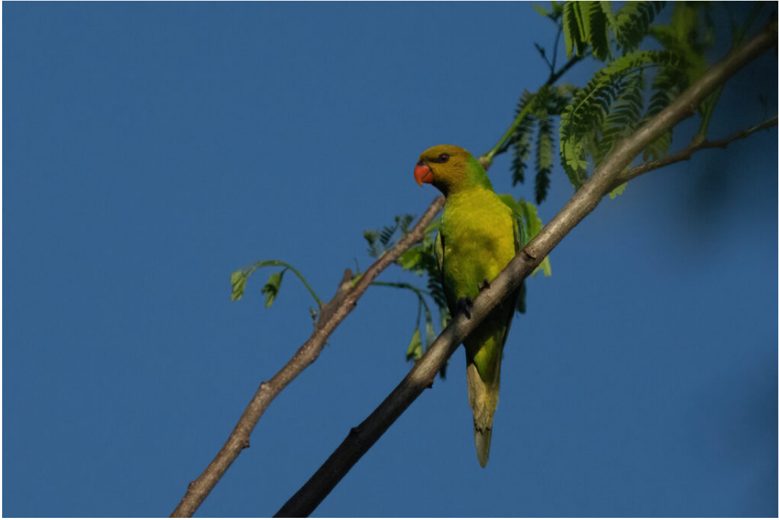
Olive-headed Lorikeet