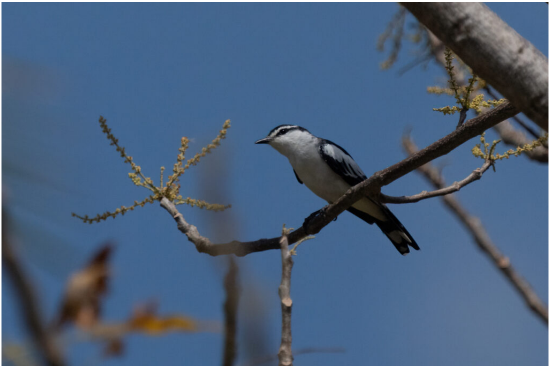
White-shouldered (or Lesueur's) Triller