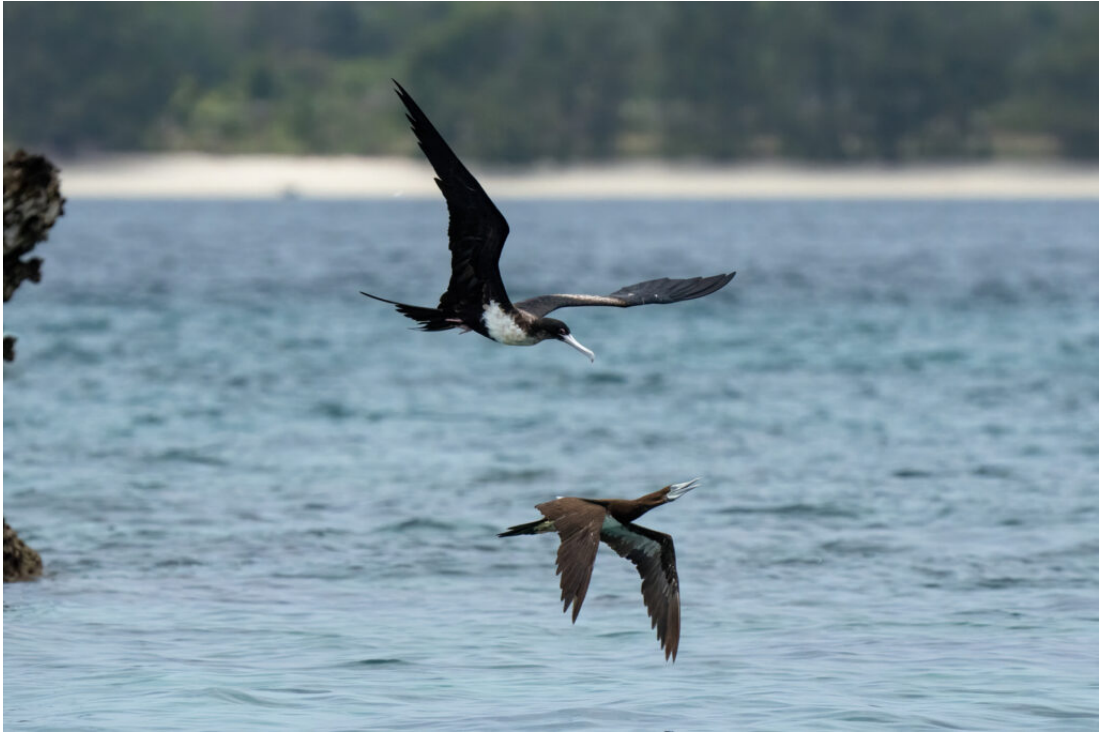
A Great Frigatebird pursues a hapless Brown Booby