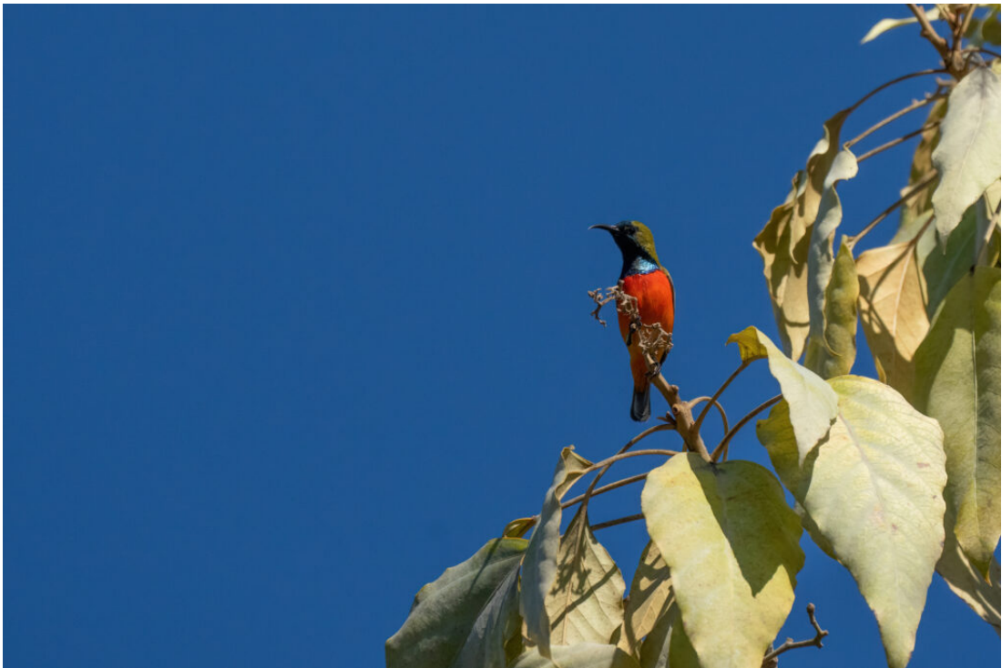
The lovely Flame-breasted Sunbird