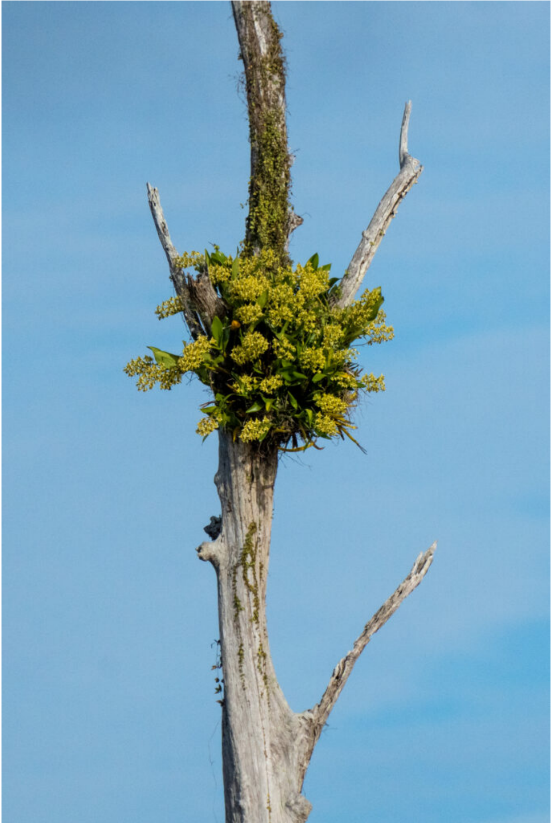
A beautiful tree orchid, Dendrobium speciosum