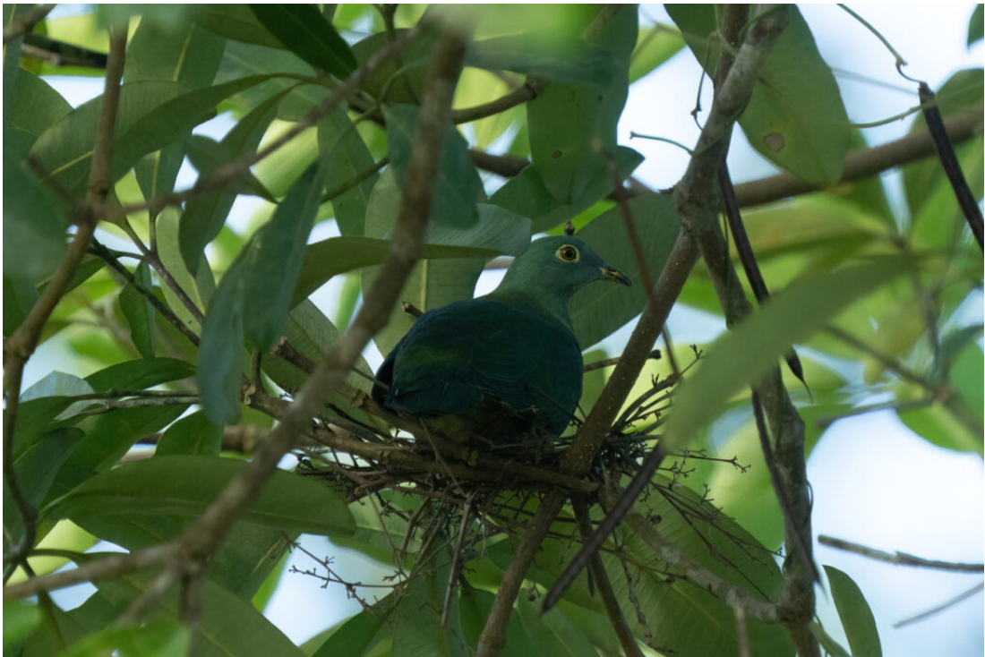
A female Black-naped Fruit Dove on its flimsy nest