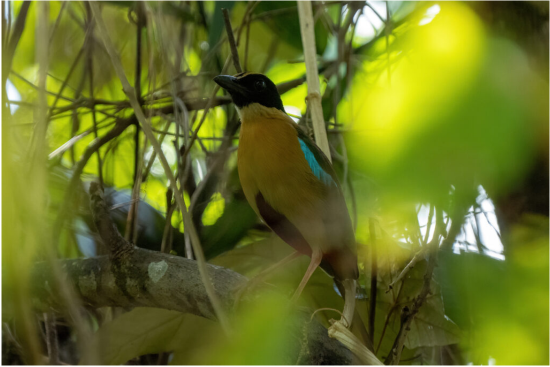
The endemic virginalis form of the (Wallace's) Elegant Pitta