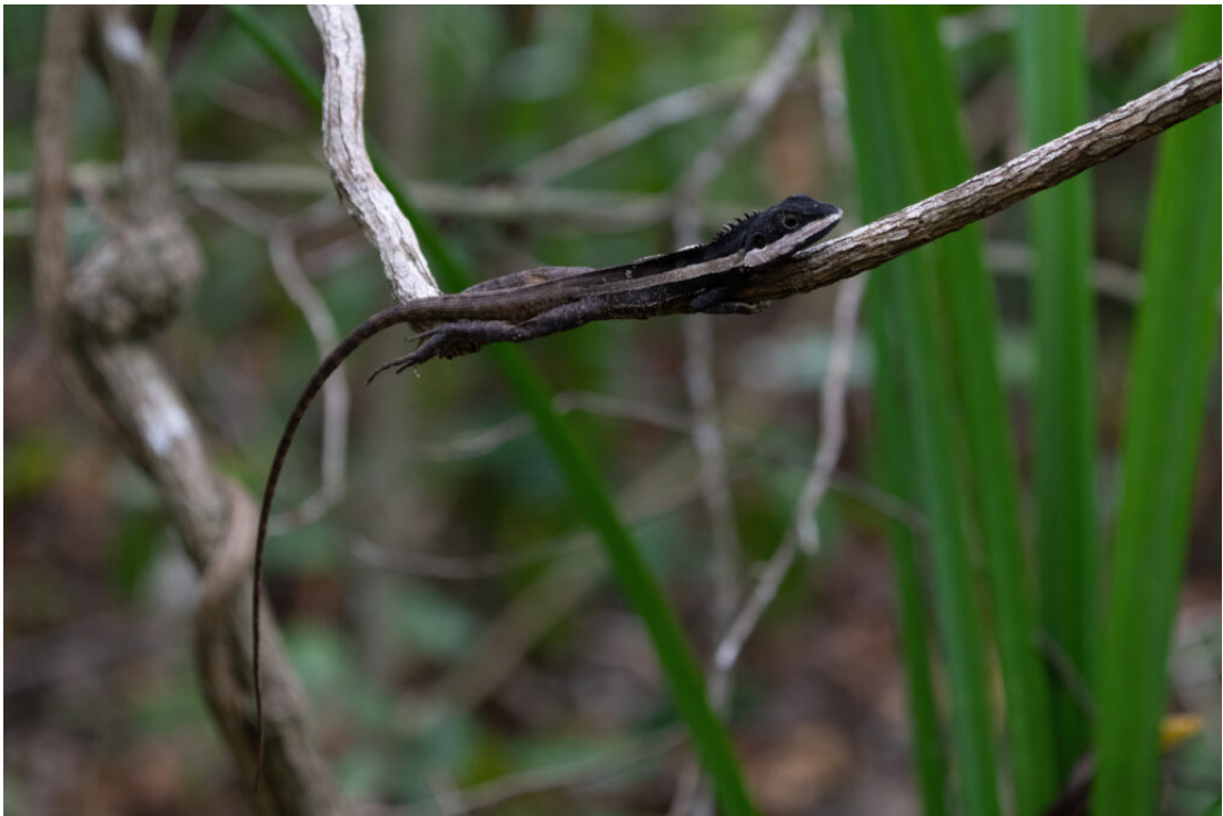
Northern Water Dragon