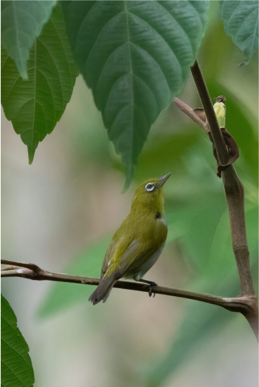
Ashy-bellied White-eye