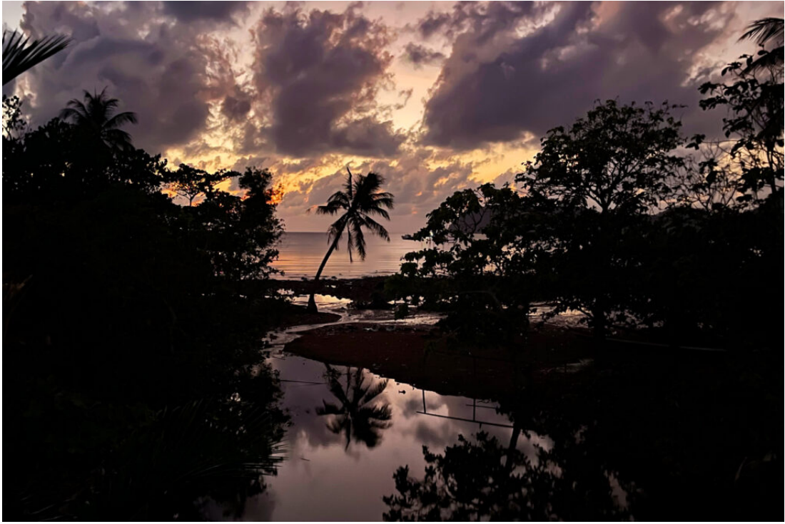
Damar at sunrise