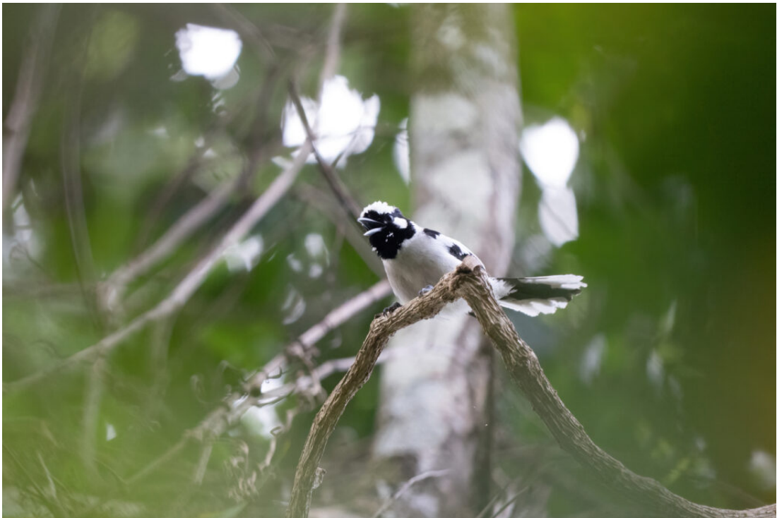
The perky endemic Tanimbar Monarch