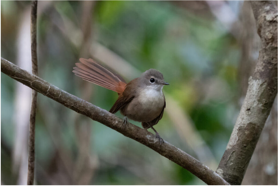
The endemic Long-tailed (or Charming) Fantail in Tanimbar