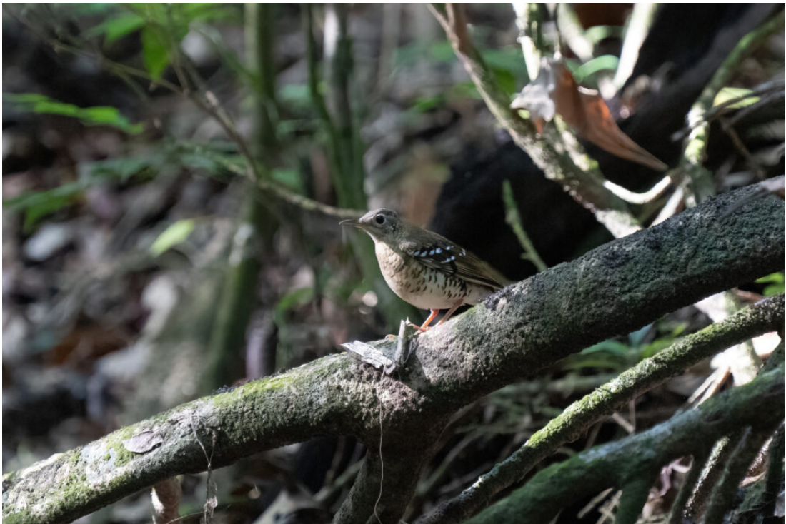
The shy endemic Fawn-breasted Thrush in Tanimbar