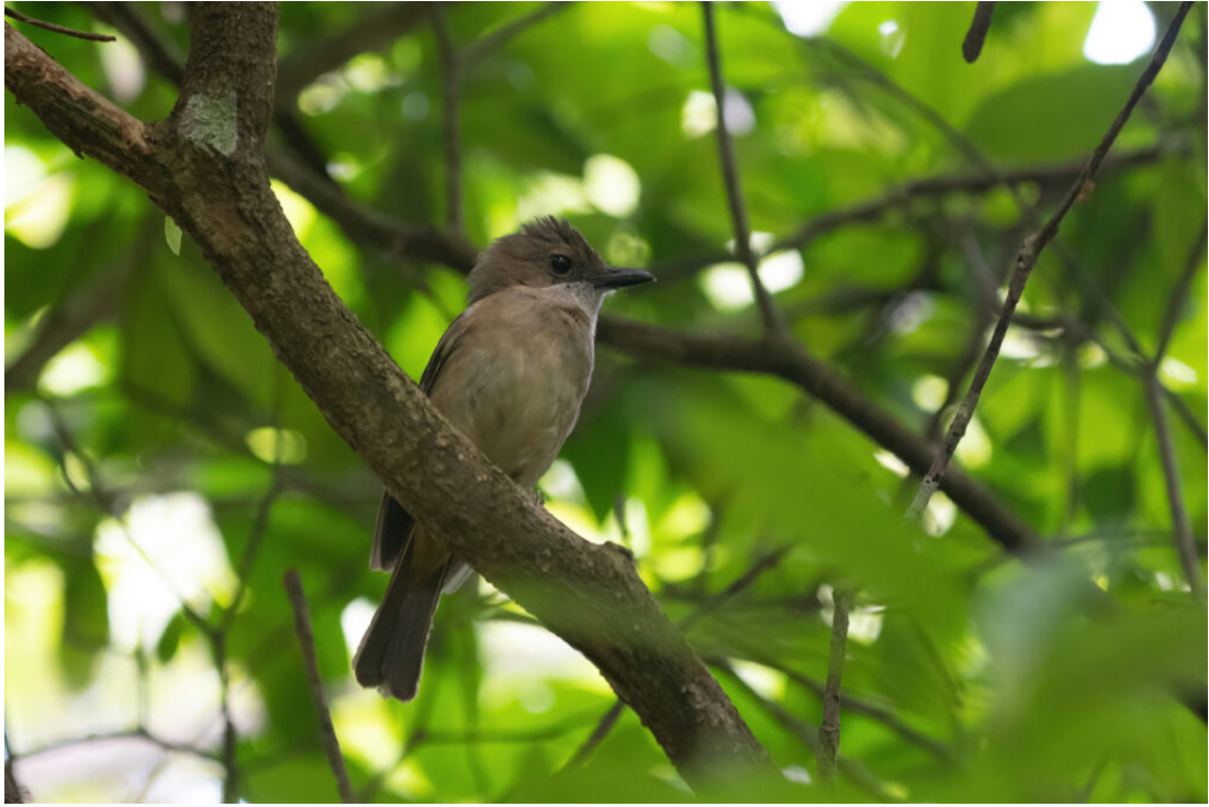
A female 'Damar Whistler'