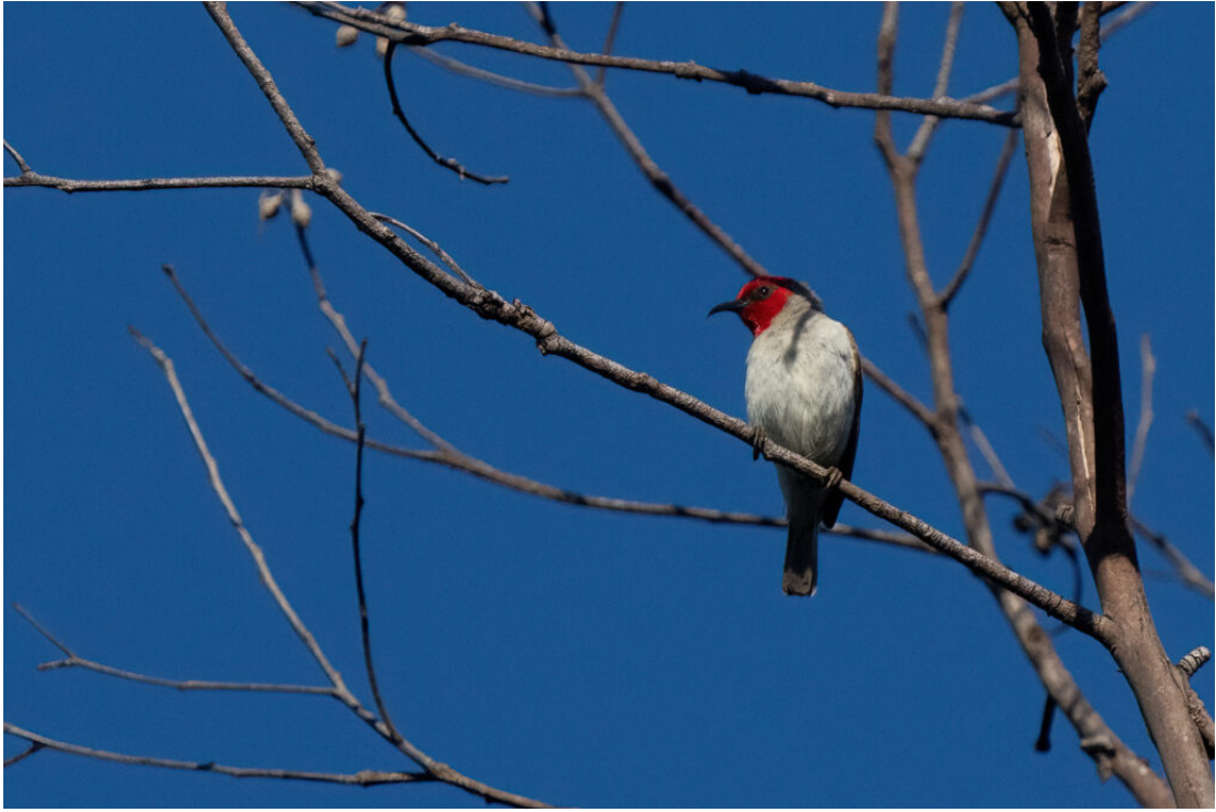
The recently-discovered endemic Alor Myzomela