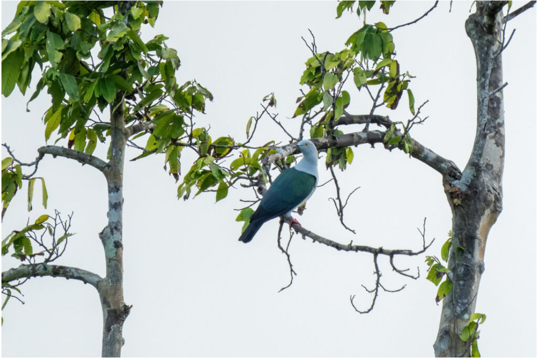
Elegant Imperial Pigeon