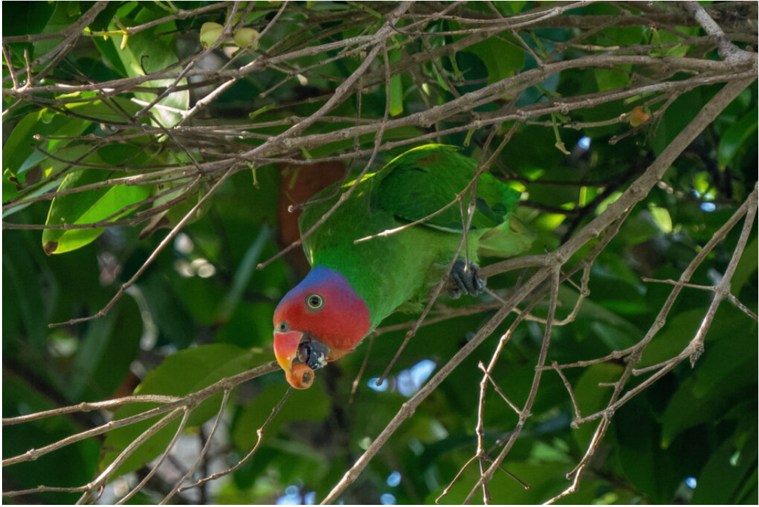
Red-cheeked Parrot of the form timorlaoensis in Tanimbar