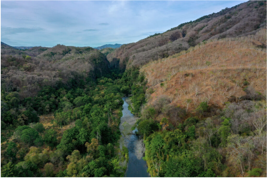
A remote canyon on the island of Wetar