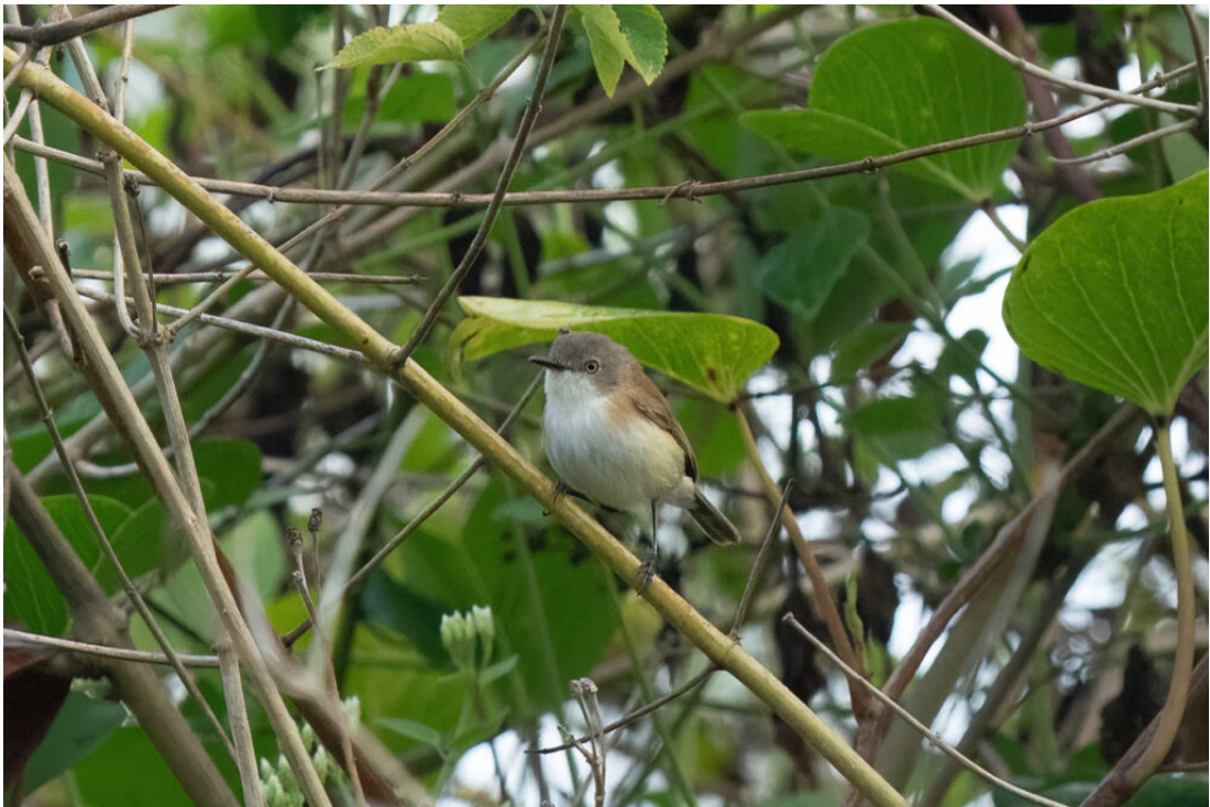
The senex form of the Rufous-sided (or Banda Sea) Gerygone on remote Kalaotoa