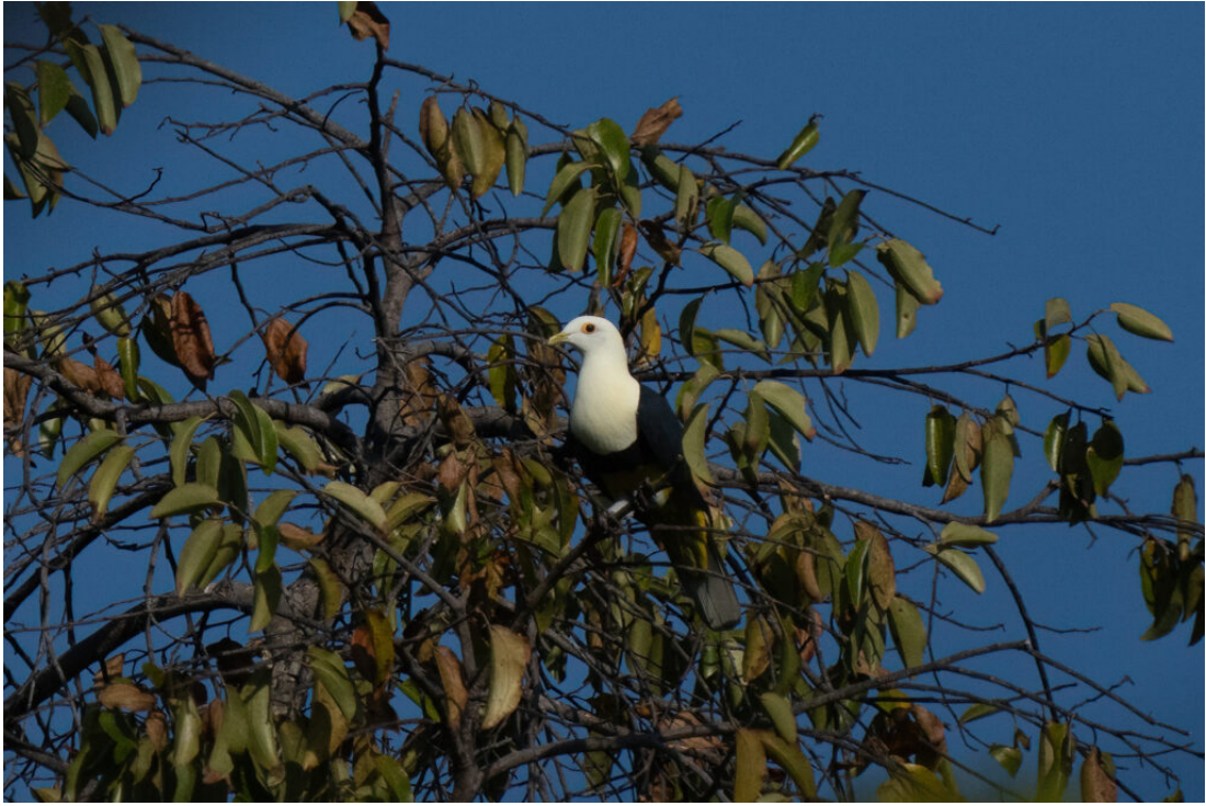
The beautiful Banded (or Black-banded) Fruit Dove of the rarely-seen form lettiensis on Leti