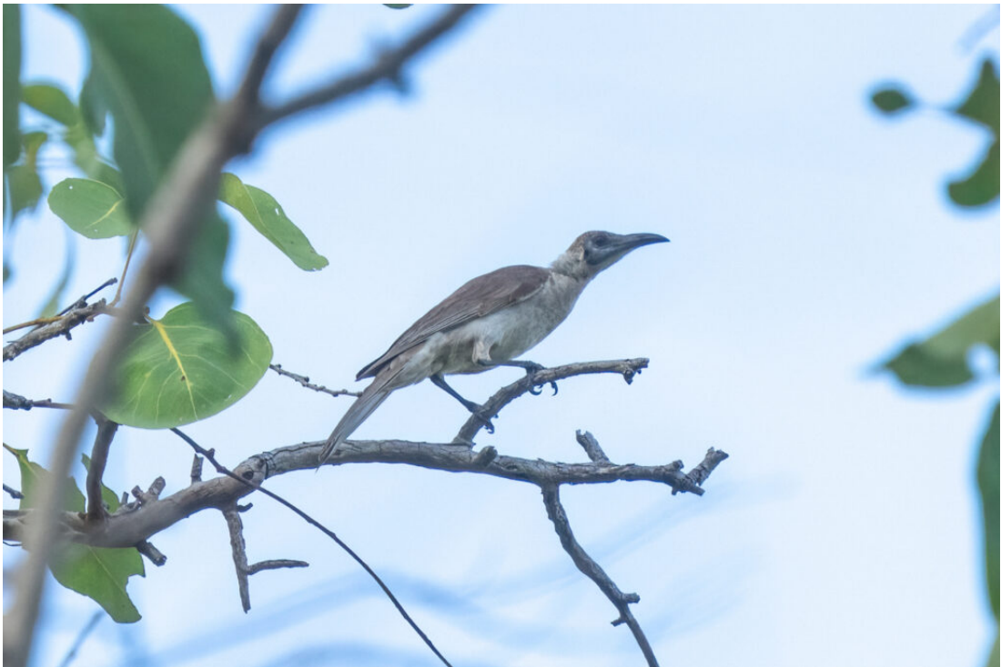
The endemic Grey (or Kisar) Friarbird