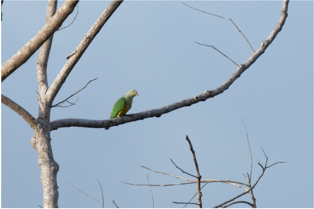
Rose-crowned Fruit Dove of the form xanthogaster, which lacks a rosy crown