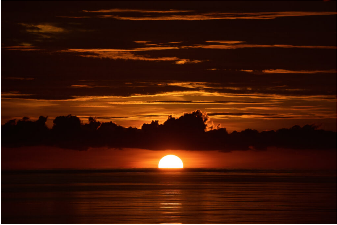
Banda Sea sunset