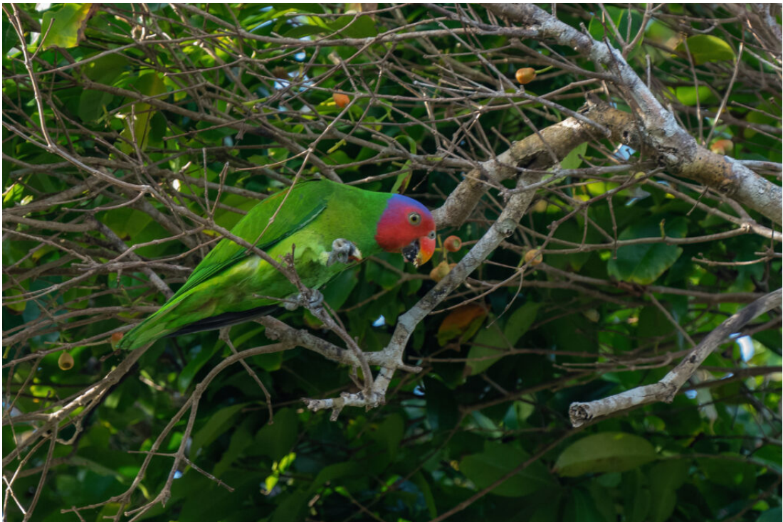
Red-cheeked Parrot of the form timorlaoensis in Tanimbar