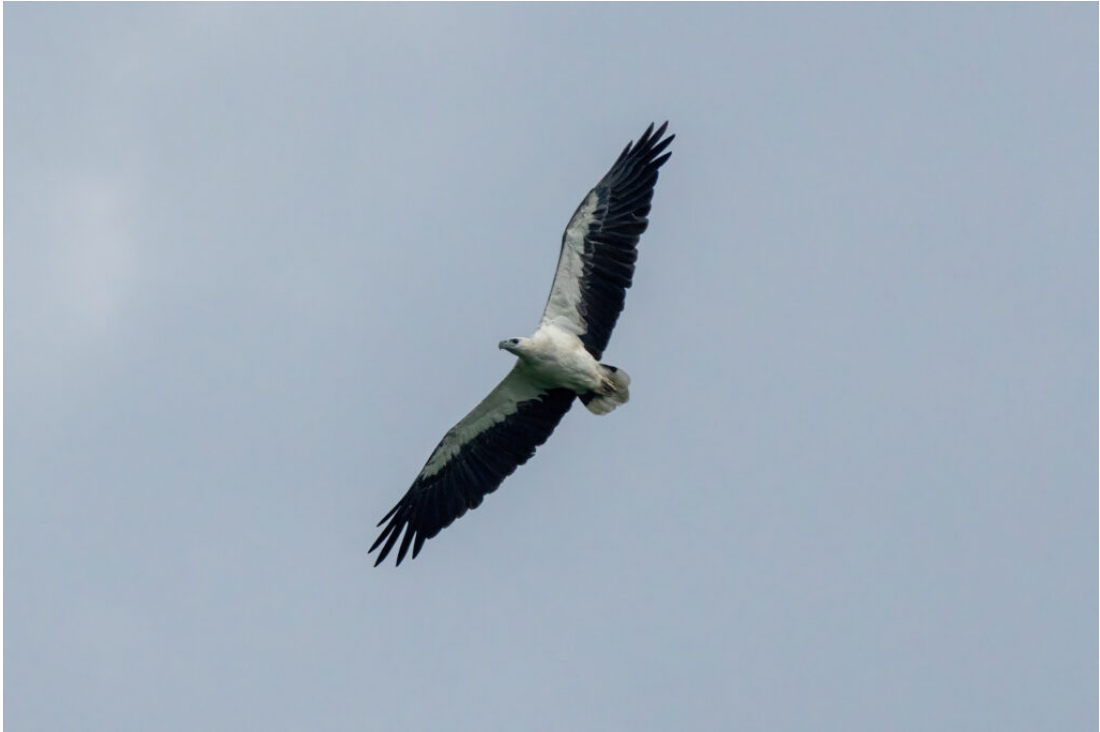
White-bellied Sea Eagle