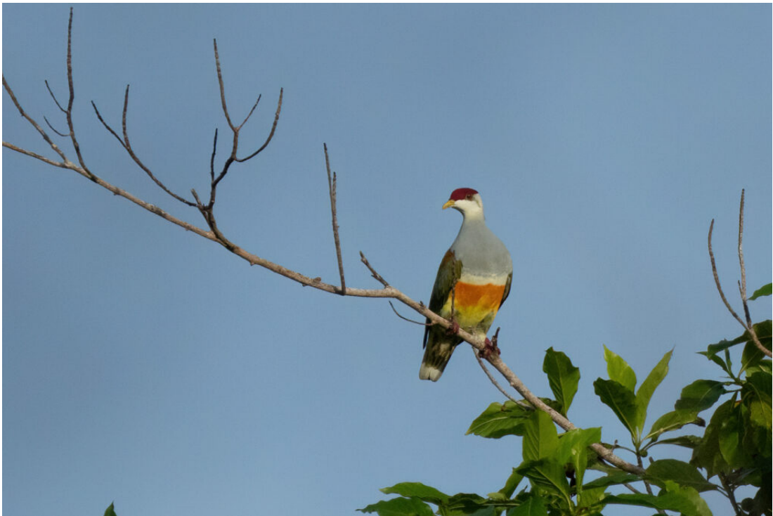
The beautiful Wallace's Fruit Dove in Tanimbar