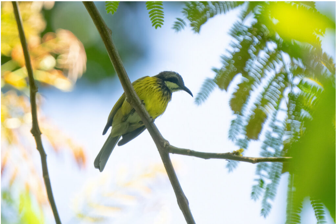
The endemic Black-necked Honeyeater