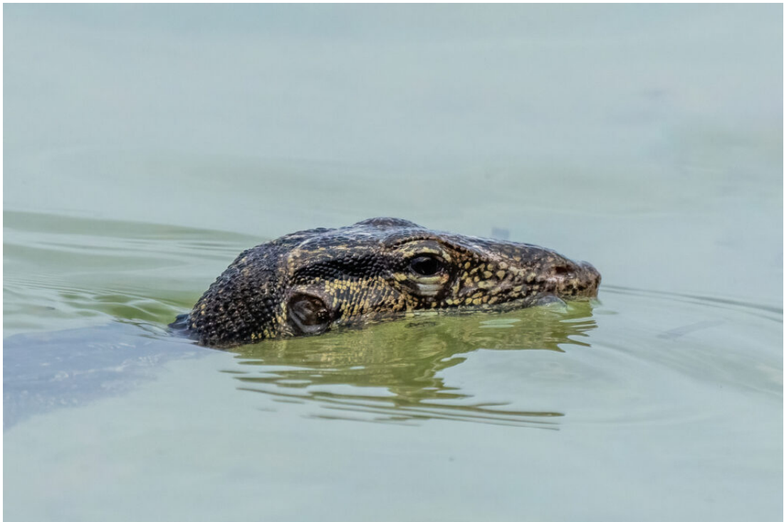
Asian Water Monitor