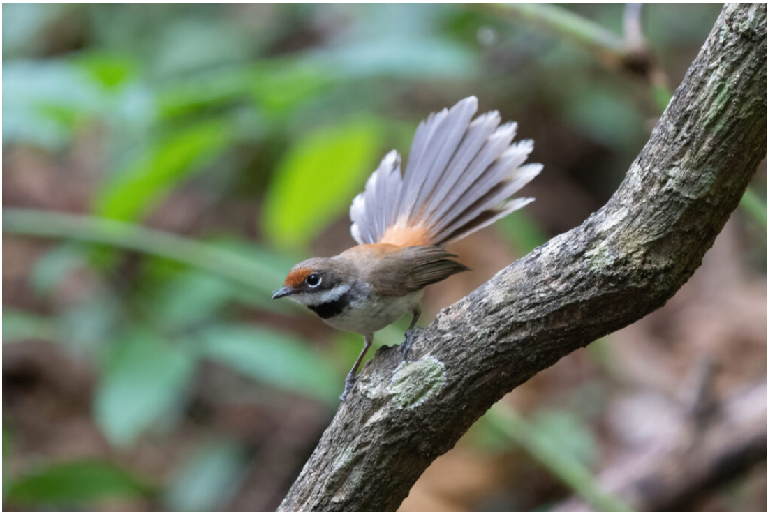
Arafura (or Supertramp) Fantail of the form semicollaris on Wetar