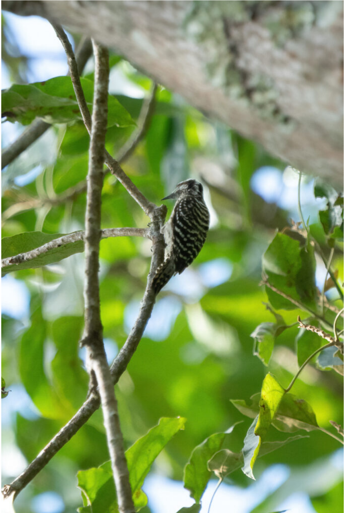
Sunda Pygmy Woodpecker