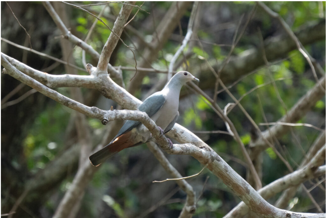
Pink-headed Imperial Pigeon