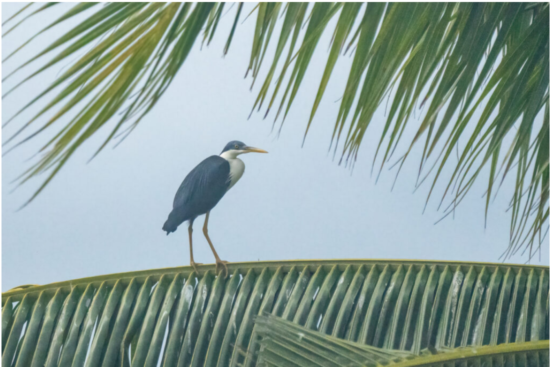
Pied Heron