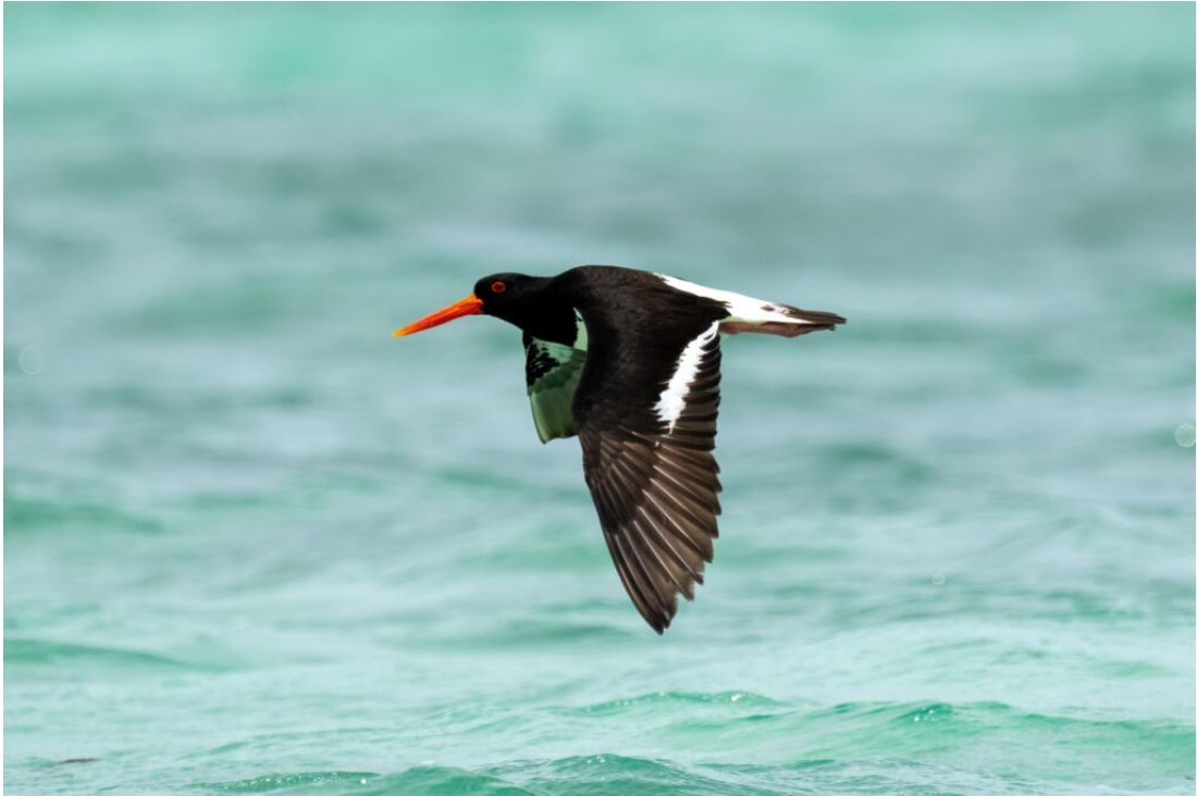
Pied Oystercatcher in Tanimbar is a surprise addition to most people's Asian list!