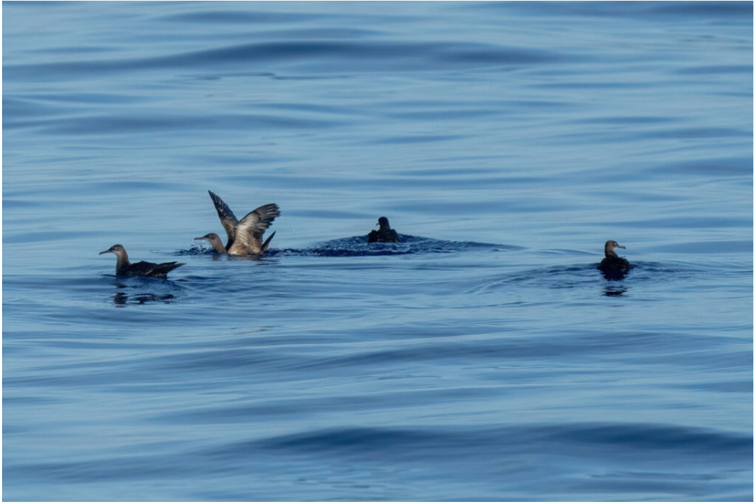
Four Heinroth's Shearwaters together in the Banda Sea