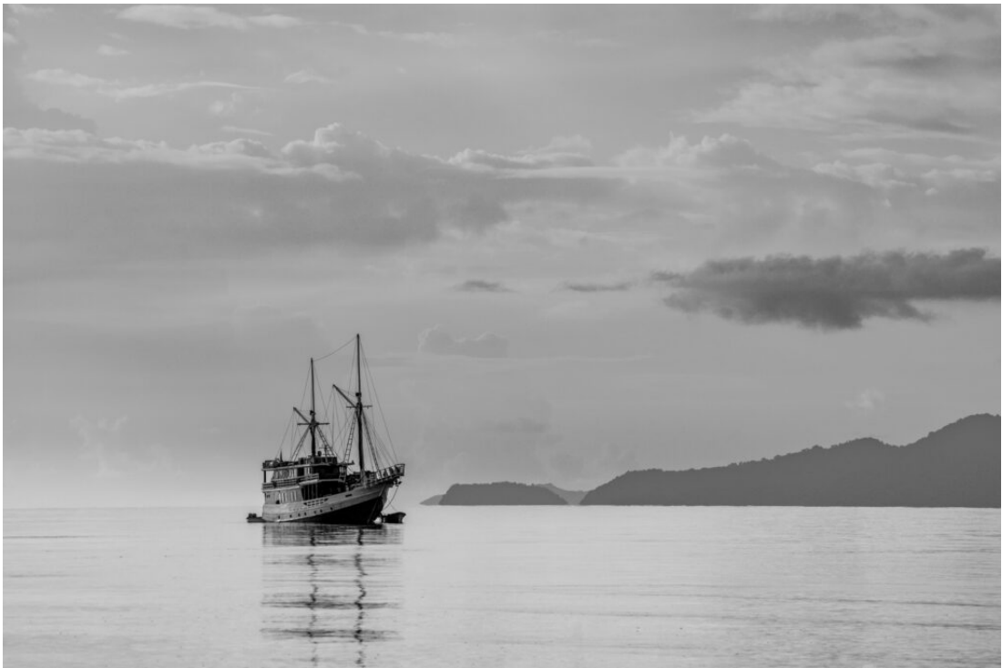
Lady Denok, our wonderful home from home