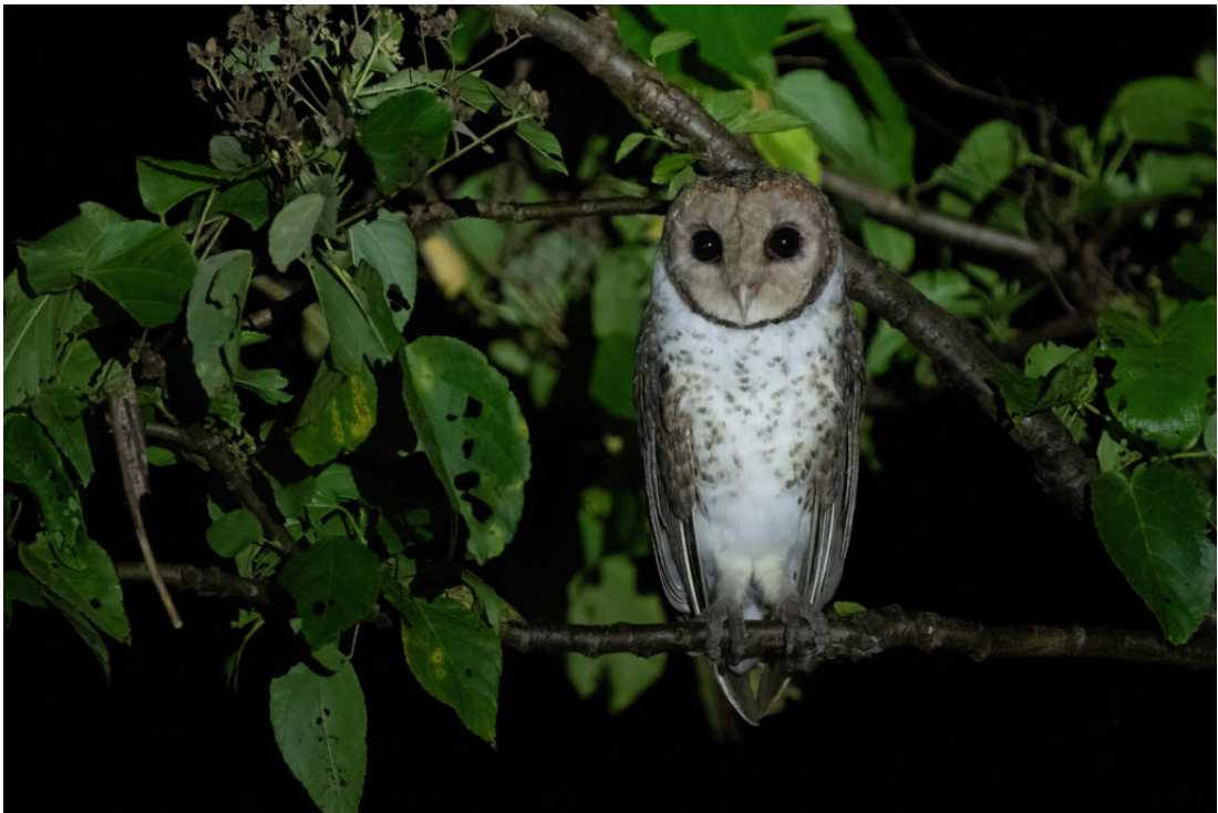
Moluccan Masked Owl is a difficult and sought-after species in Tanimbar