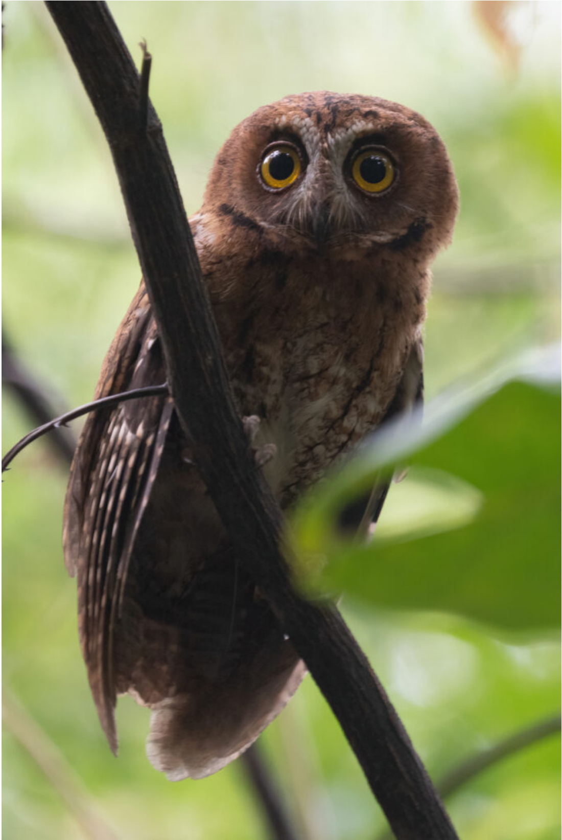
The endemic Wetar Scops Owl, a real star!