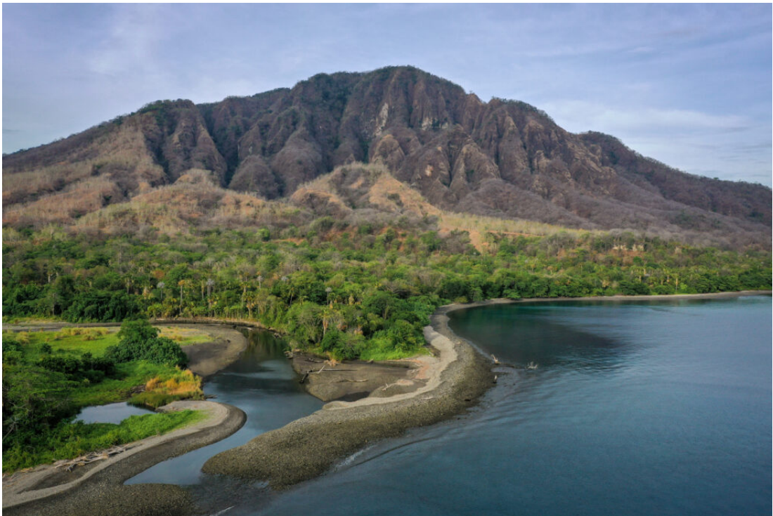
The spectacular scenery of sparsely-inhabited Wetar