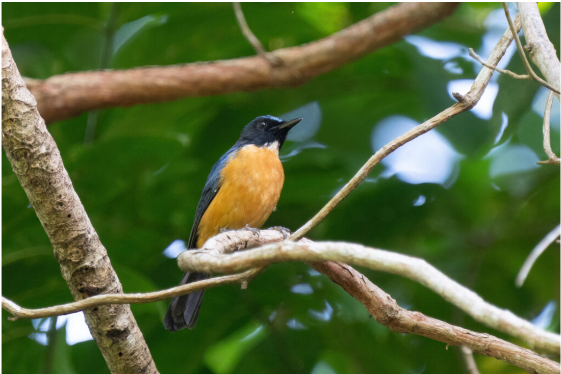
The endemic Tanahjampea Blue Flycatcher (or Tanahjampea Jungle Flycatcher)