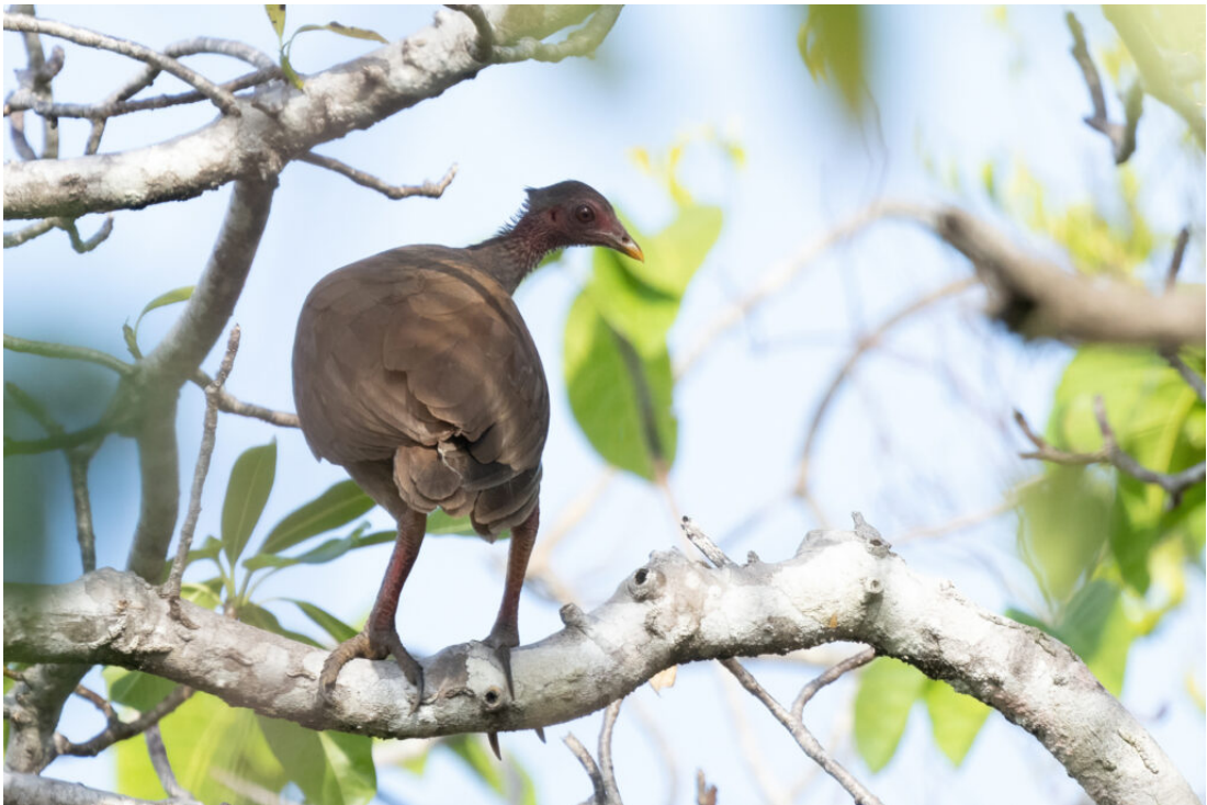
Tanimbar Megapode (or Tanimbar Scrubfowl) is the most difficult of Tanimbar's endemics