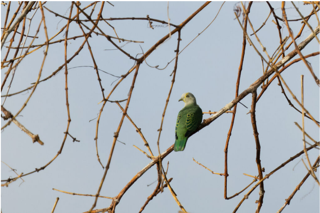
Some of the Banda Sea forms of Rose-crowned Fruit Dove, like xanthogaster, lack a rosy crown!