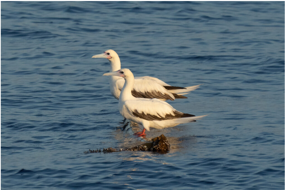
Red-footed Boobies taking a rest on some flotsam