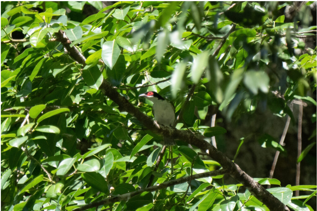
The endemic Wetar Figbird