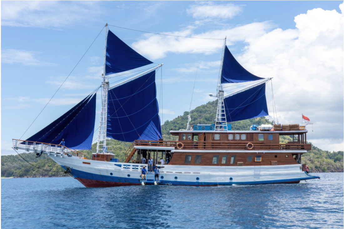
The crew awaiting us with help at the gangway, cool towels and welcome drinks as we return from birding! This is the life!