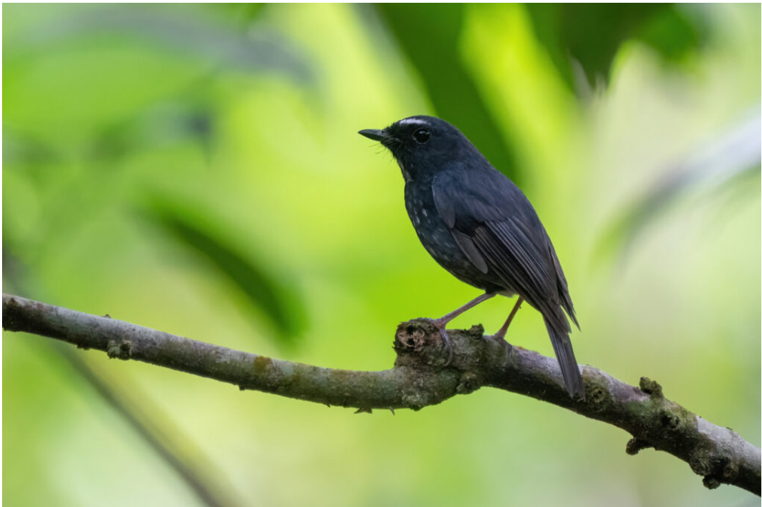
The delightful little endemic Damar Flycatcher, lost to science for a century