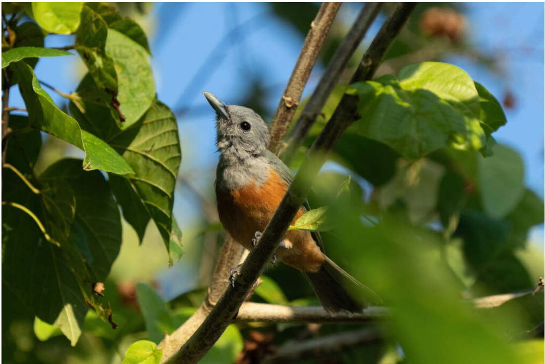
Island Monarch