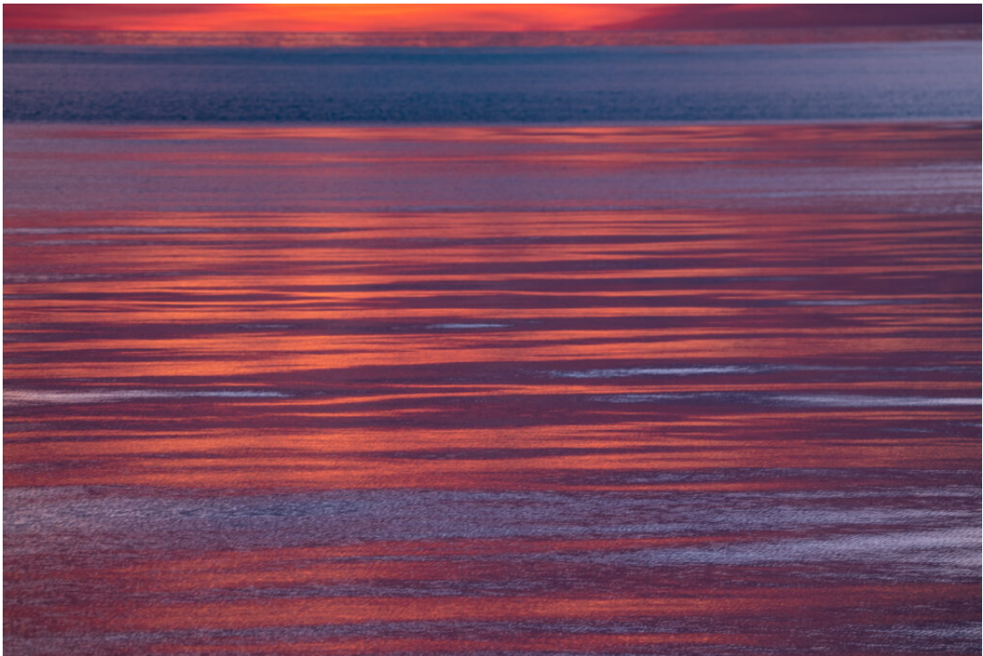
The glassy waters of the Banda Sea reflect the post-sunset colours