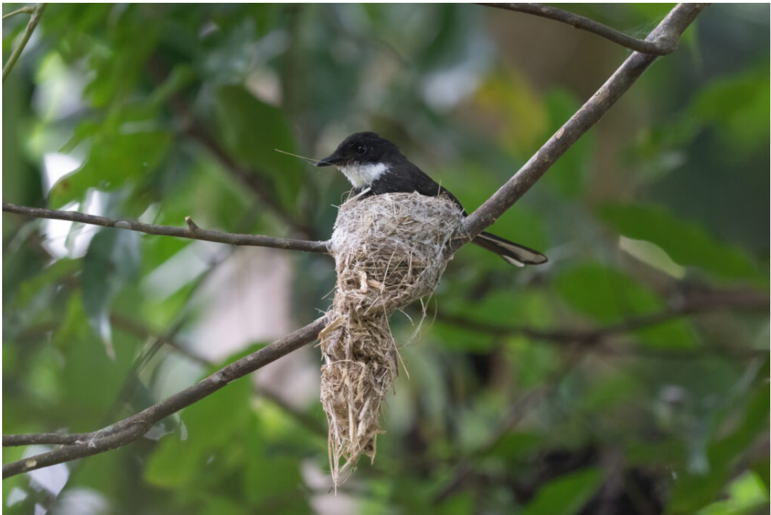
The endemic Banda Sea Fantail