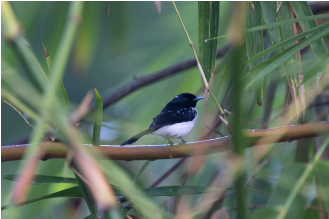
The endemic Tanahjampea Monarch