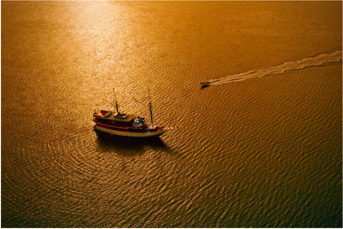
Lady Denok at sunset