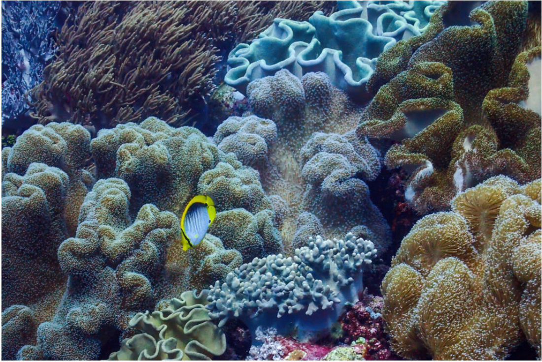
A Spot-tailed Butterflyfish amidst the corals