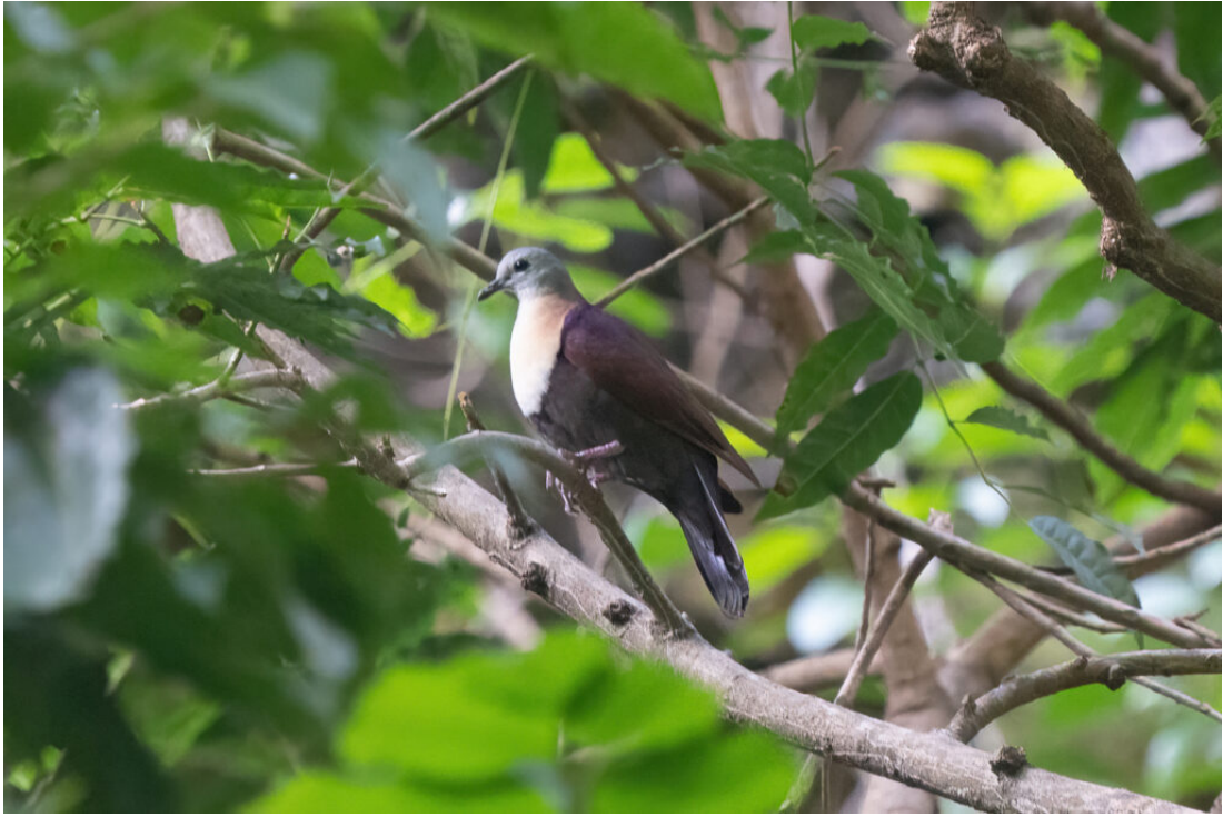
The retiring, near-endemic Wetar Ground Dove, one of the most sought-after specialities