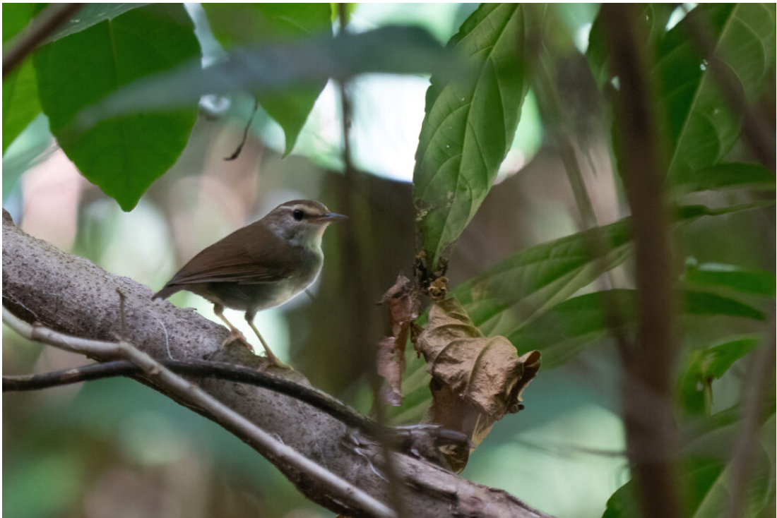
The shy Timor Stubtail