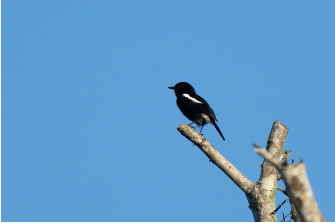
Pied Bush Chat of the form cognatus on Babar