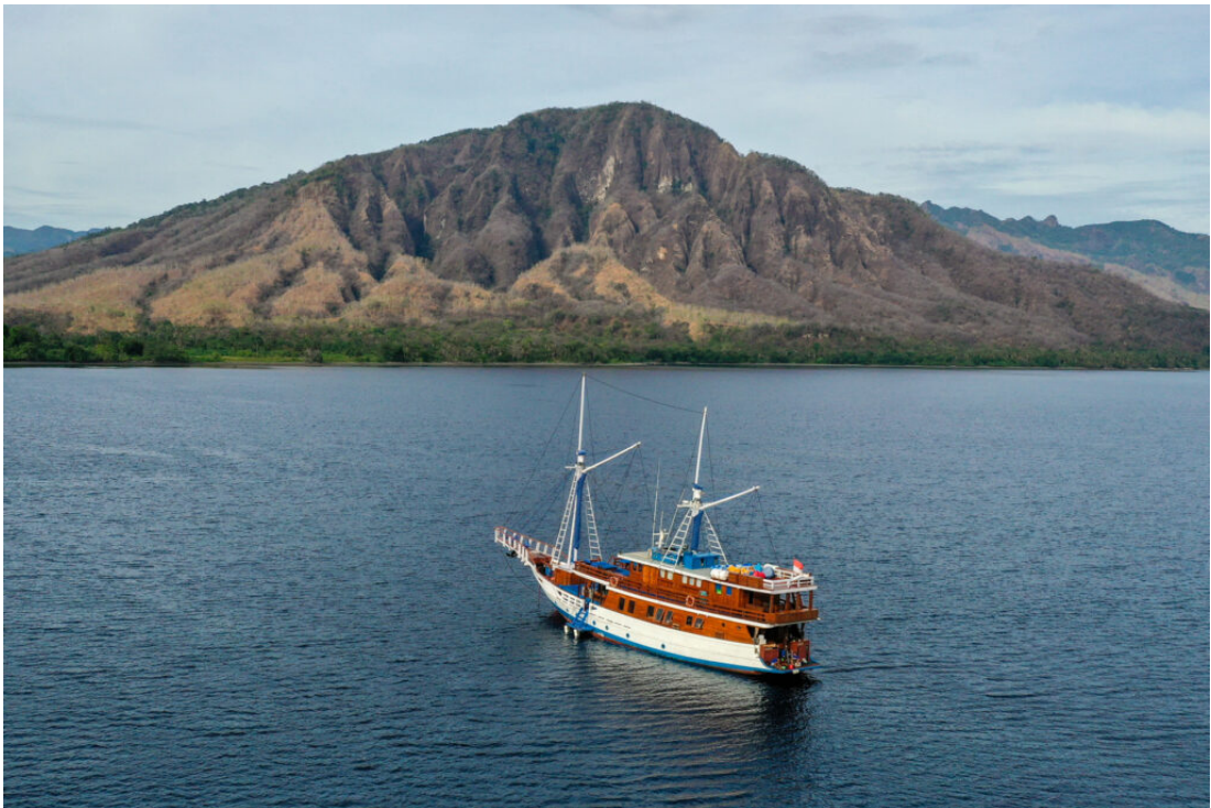
Lady Denok off Wetar in the Banda Sea