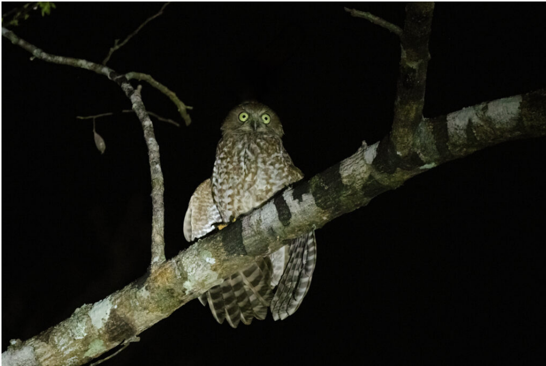
The endemic Alor Boobook