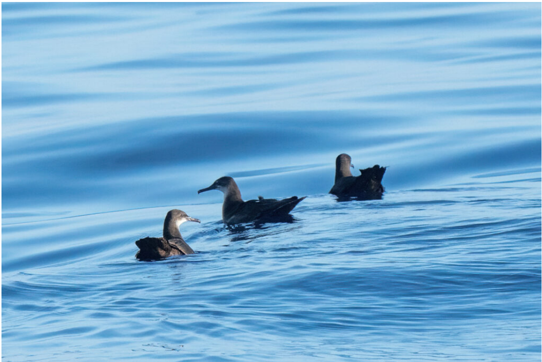
The rare and little-known Heinroth's Shearwater