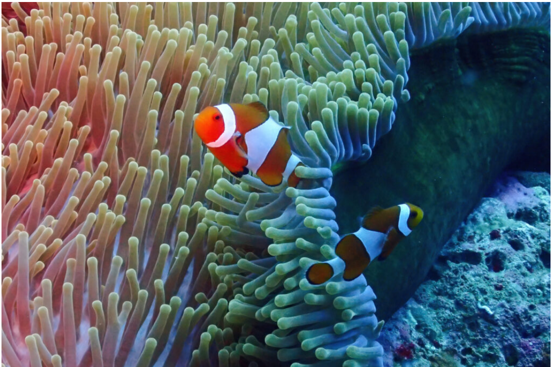
Orange Clownfish in their anemone home