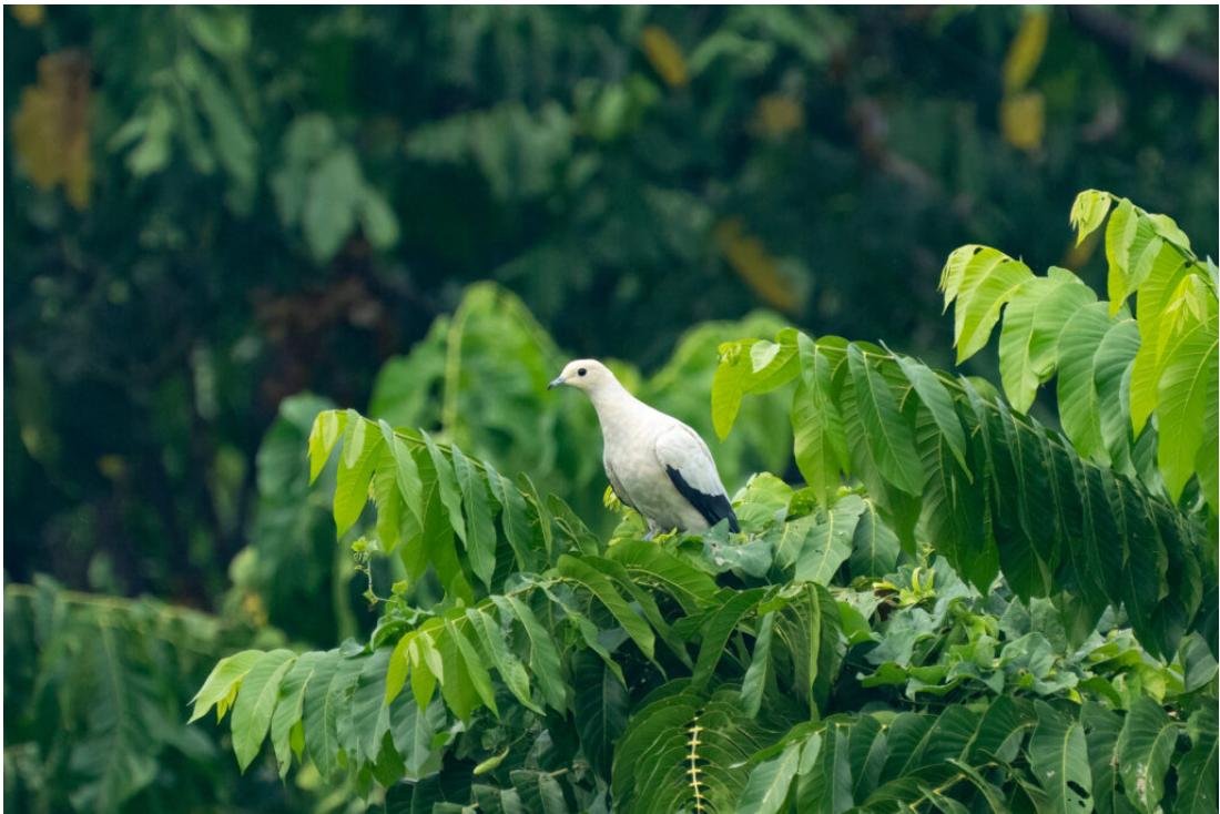
Pied Imperial Pigeon