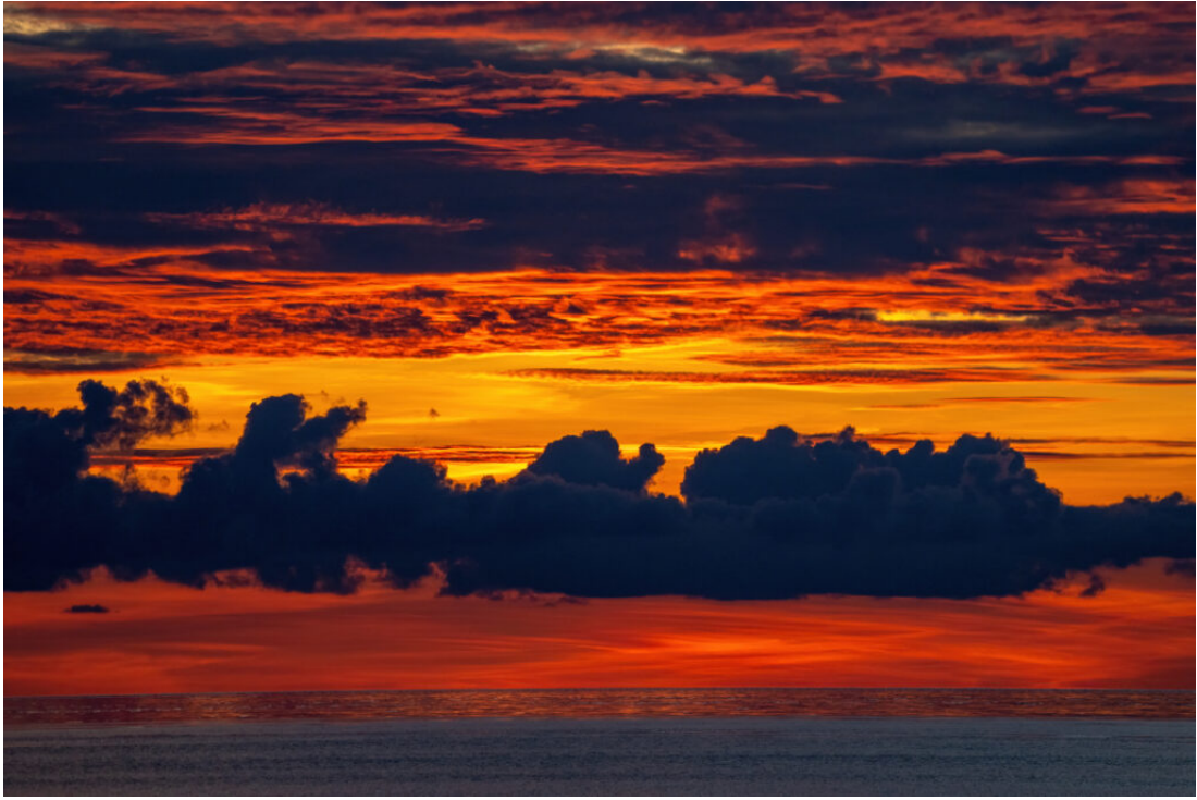
Sunset over the Banda Sea