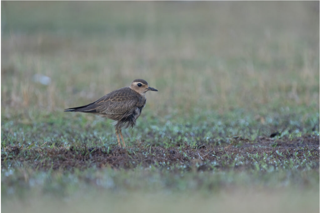
An Oriental Plover pauses on migration to Australia (image by Inger Vandyke)