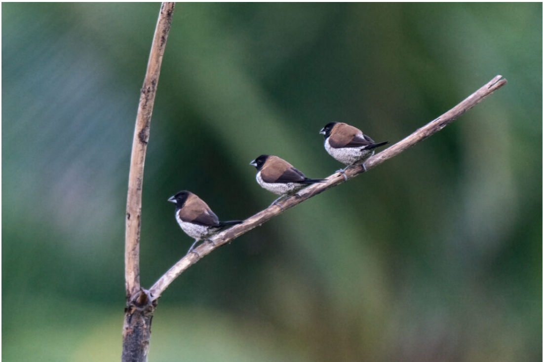
Black-faced Munias