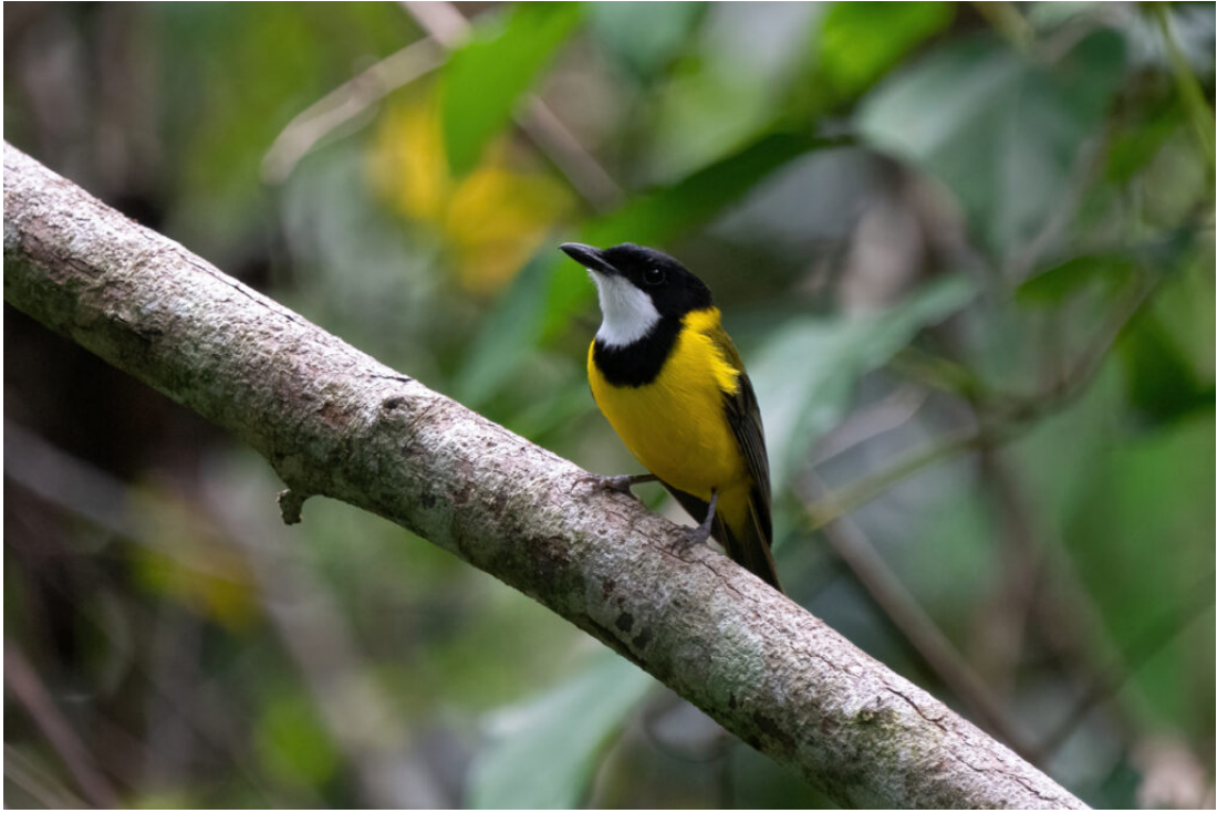
The endemic 'Damar Whistler' a likely split from Golden Whistler