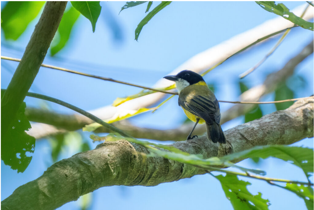
The endemic Babar Whistler