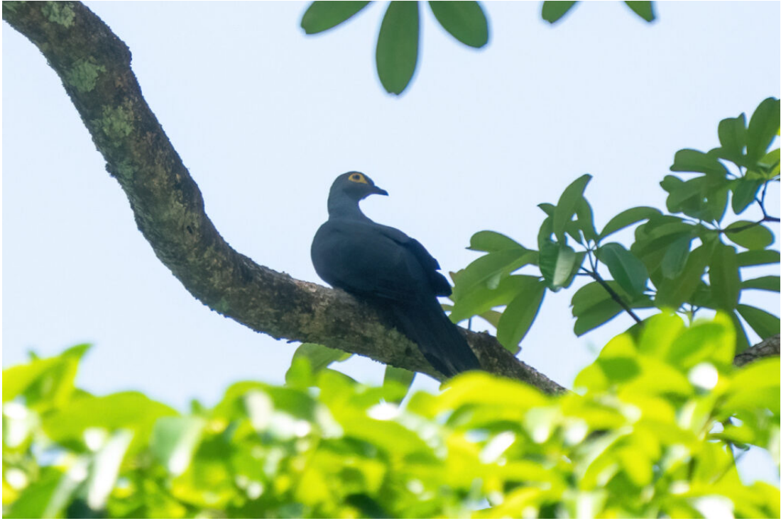
Black Cuckoo-Dove is a common bird on Wetar