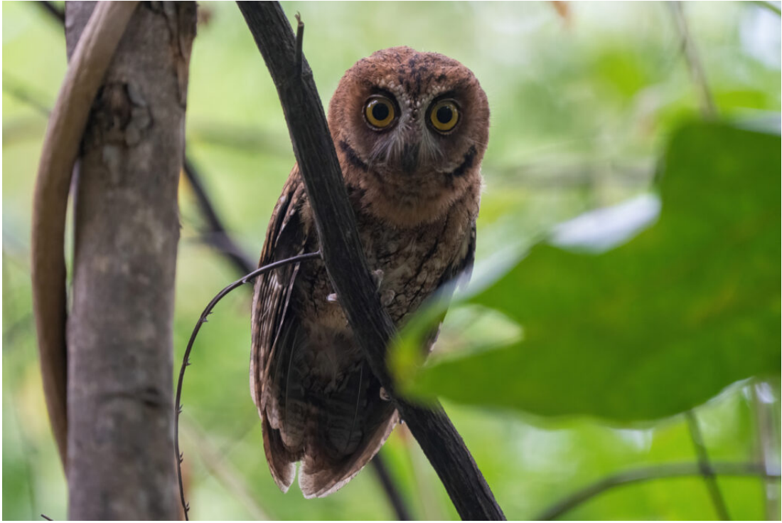
The endemic Wetar Scops Owl comes out to play long before dusk