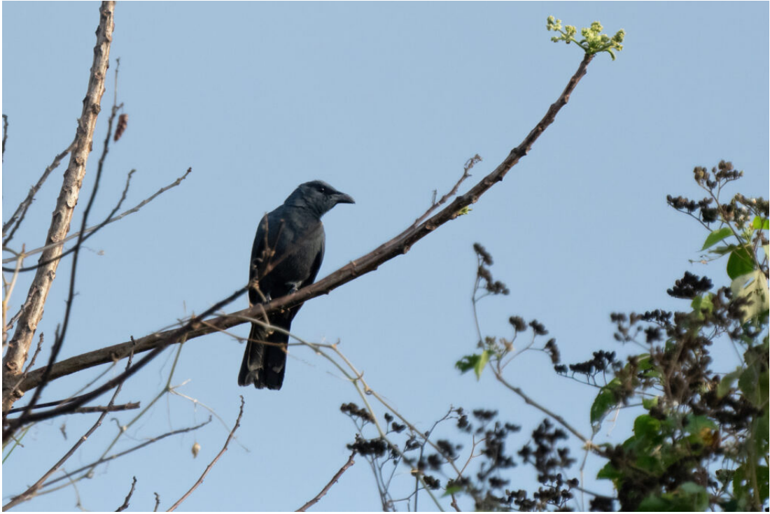
Wallacean Cuckooshrike of the form unimoda in Tanimbar