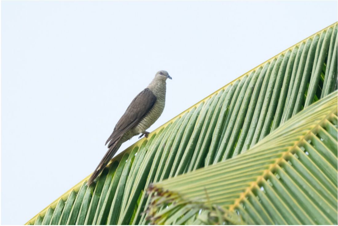
The endemic Flores Sea Cuckoo-Dove