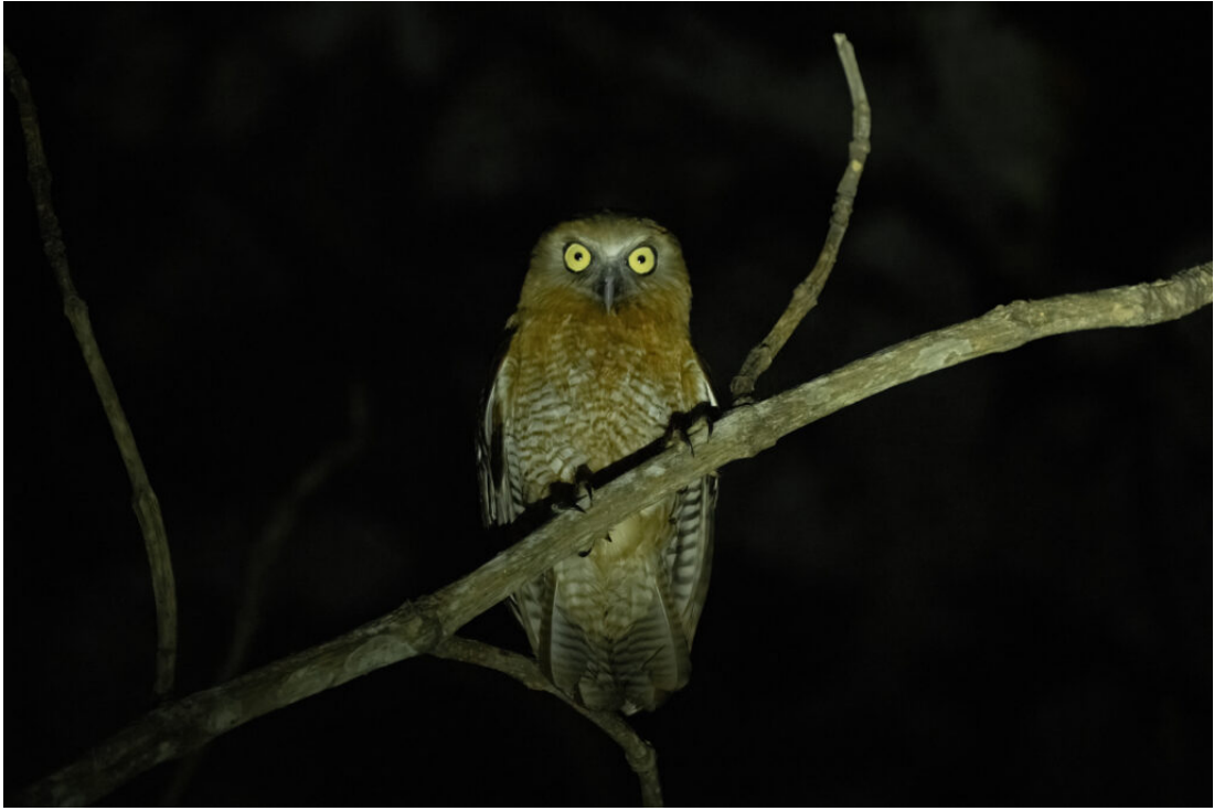
The endemic Tanimbar Boobook