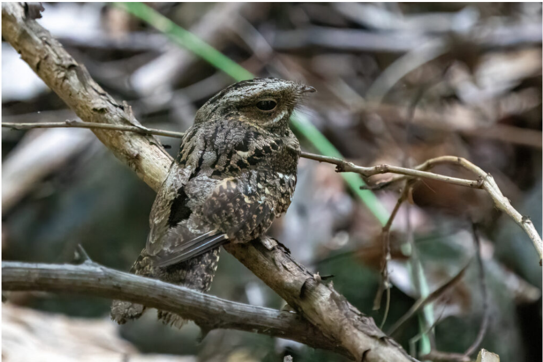
Timor Nightjar on Wetar