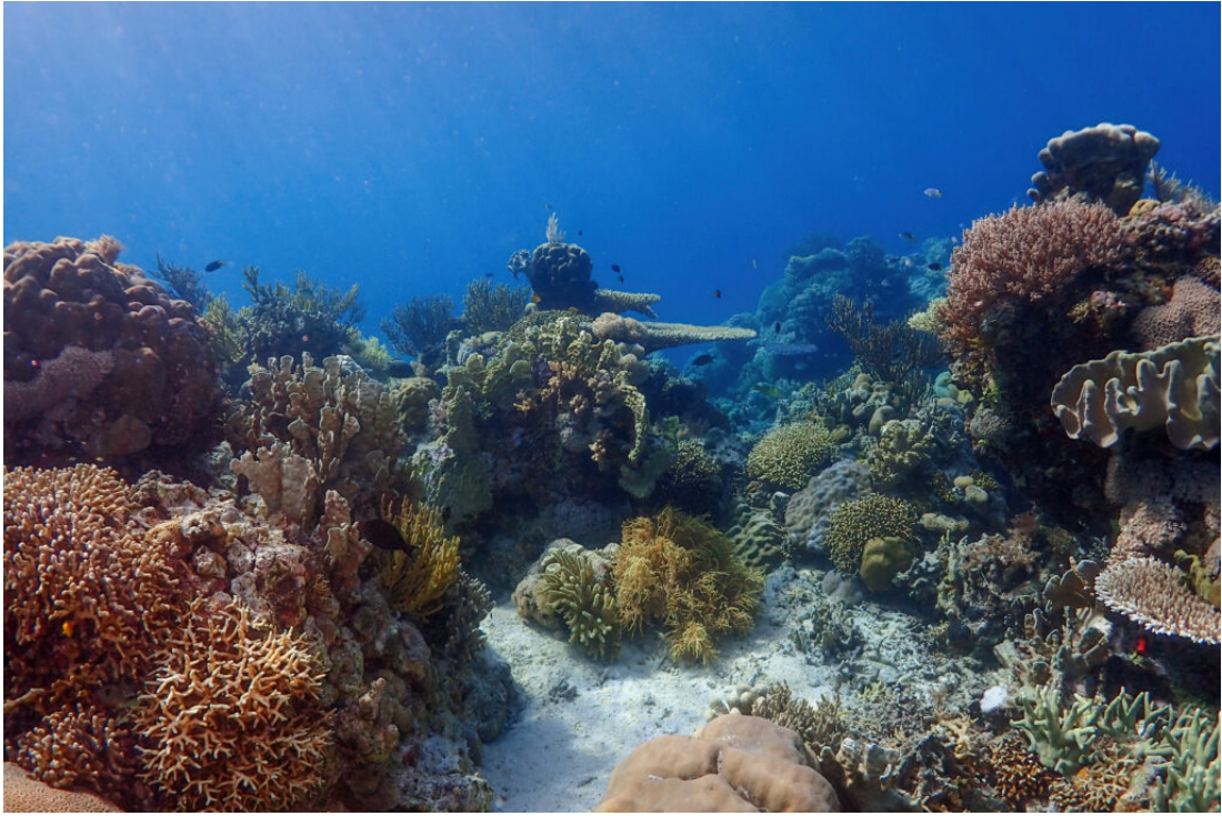
The coral reefs of the Banda Sea are legendary!