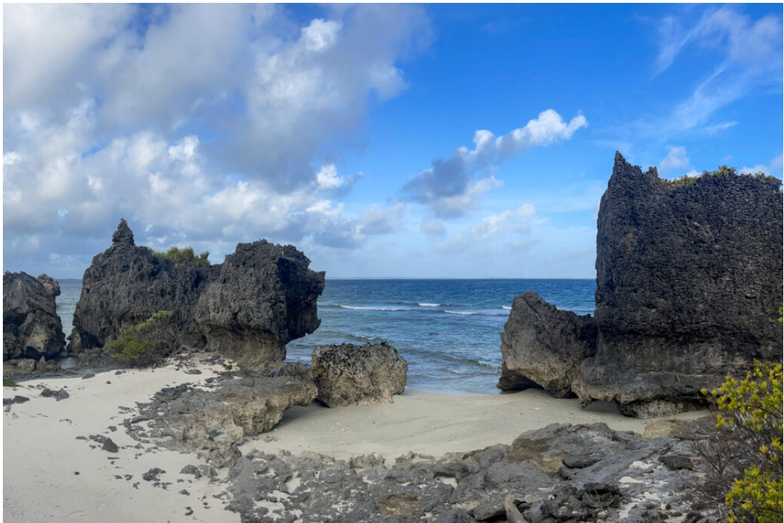
The wild and remote islands of the Banda Sea are often uplifted and eroded ancient reefs