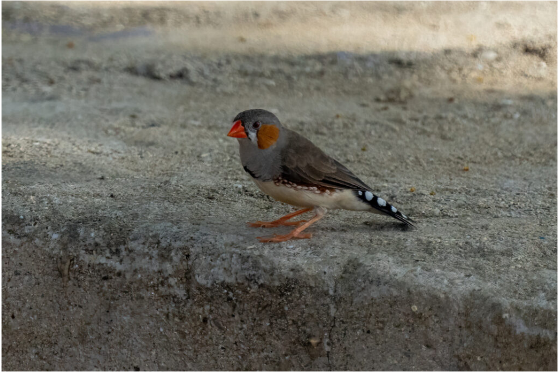
Sunda Zebra Finch