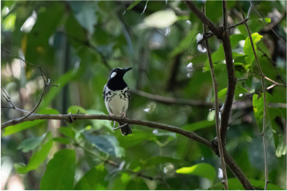
The endemic Slaty-backed Thrush in Tanimbar