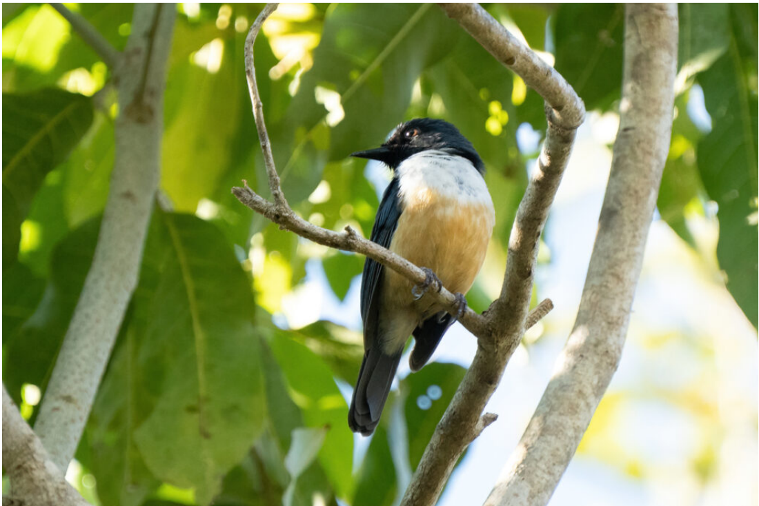
The endemic Kalao Blue Flycatcher (or Kalao Jungle Flycatcher)