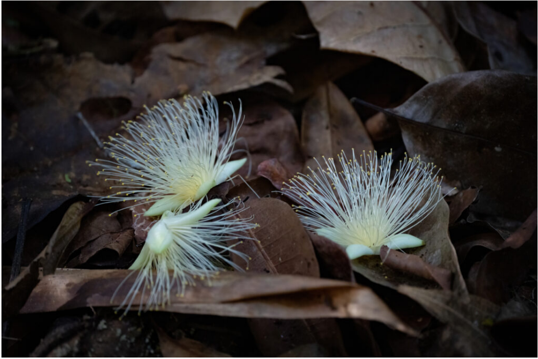
Malabar Plum flowers, beloved of myzomelas and honeyeaters