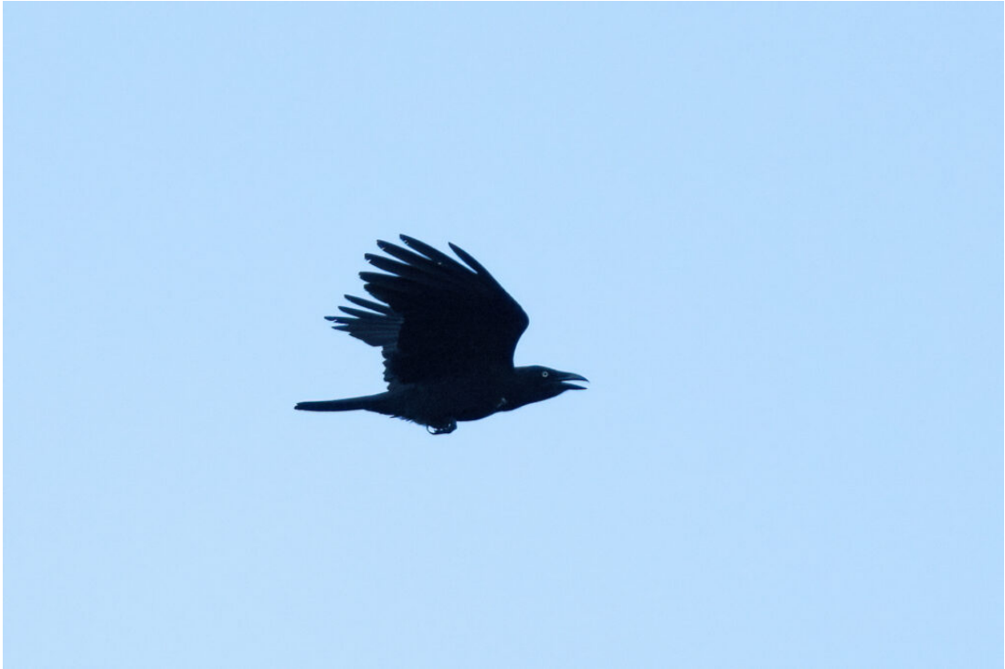
Torresian Crow is a surprisingly scarce bird in Tanimbar