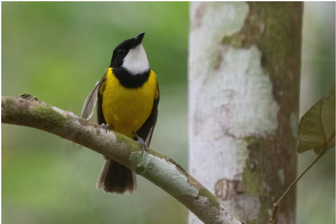
A male 'Damar Whistler'