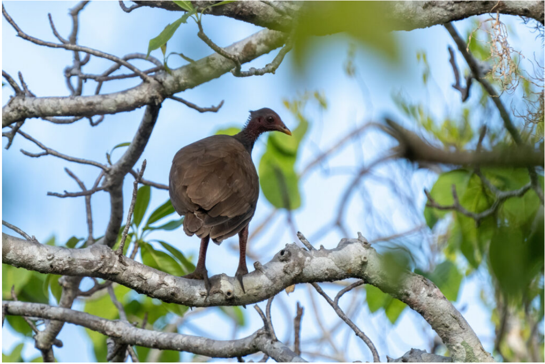
Tanimbar Megapode (or Tanimbar Scrubfowl) is the most difficult of Tanimbar's endemics