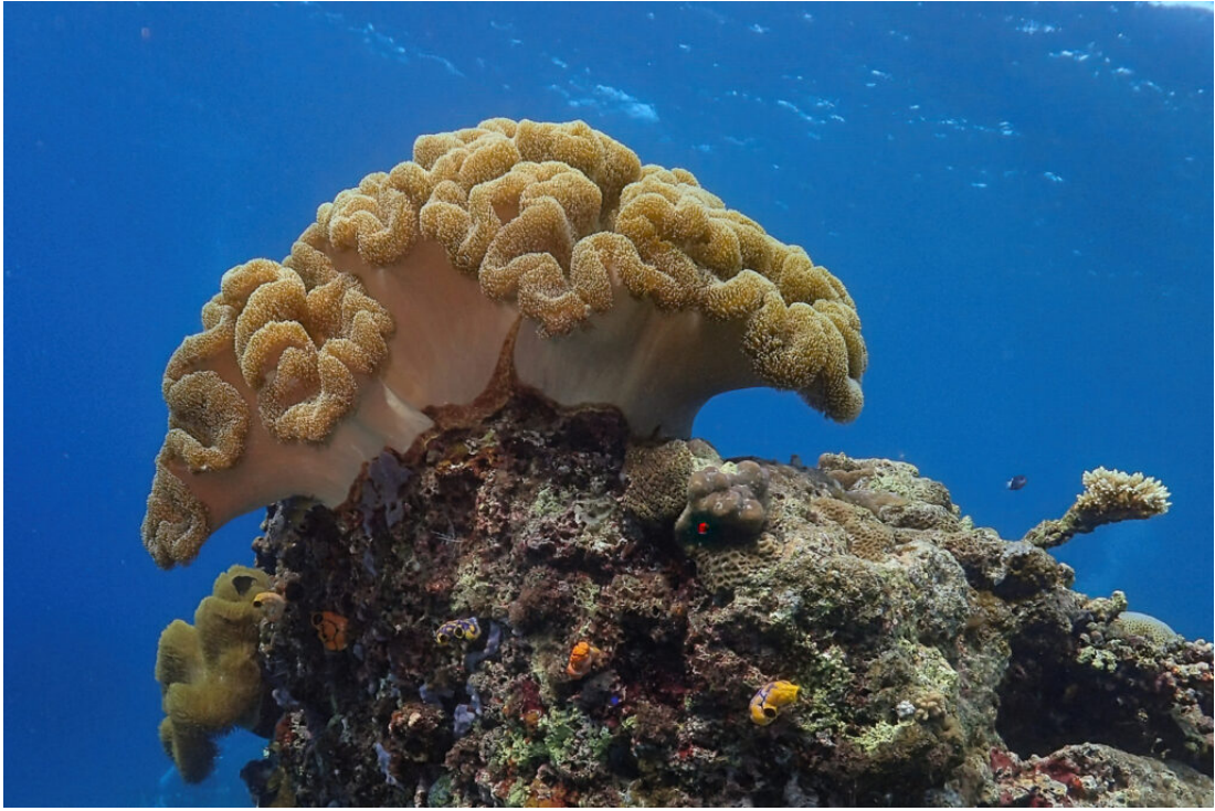
Soft corals are a glory of the Banda Sea