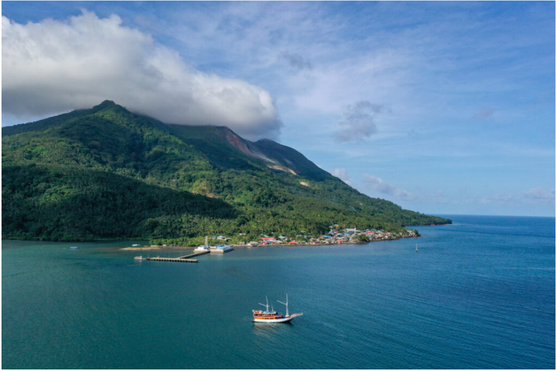
Lady Denok below the volcano on Damar