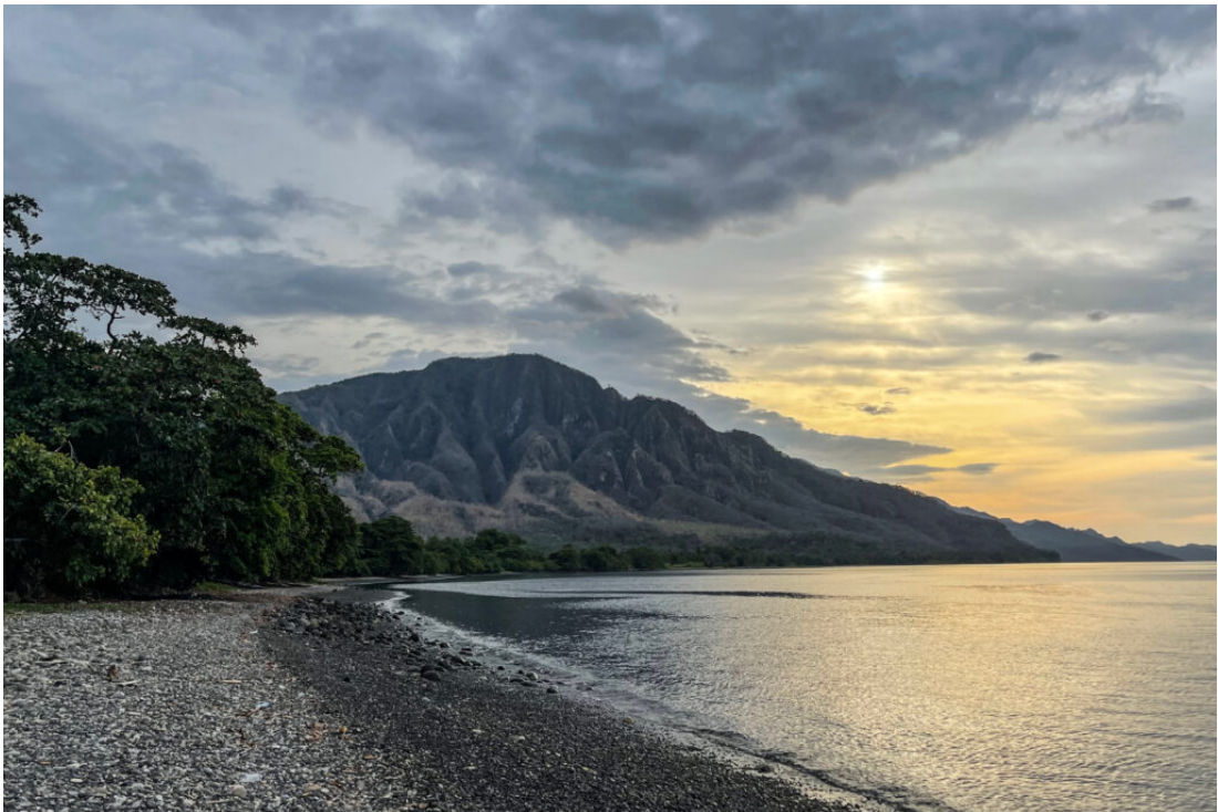
Wetar coastline