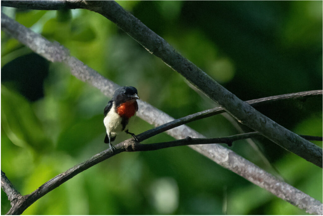
Blue-cheeked (or Red-chested) Flowerpecker of the nominate form