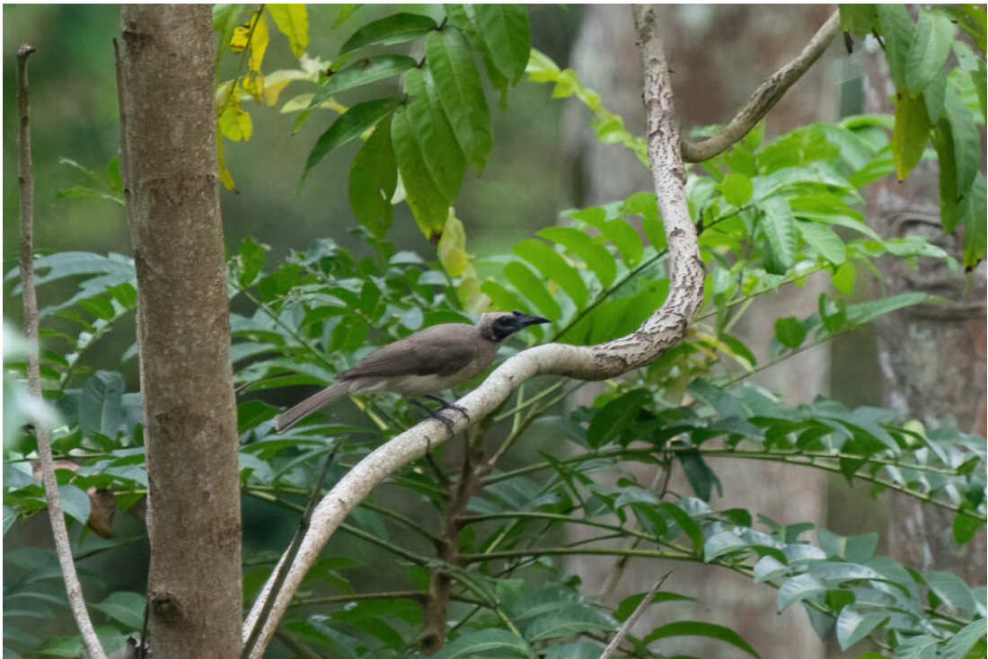
Tenggara Friarbird on Alor