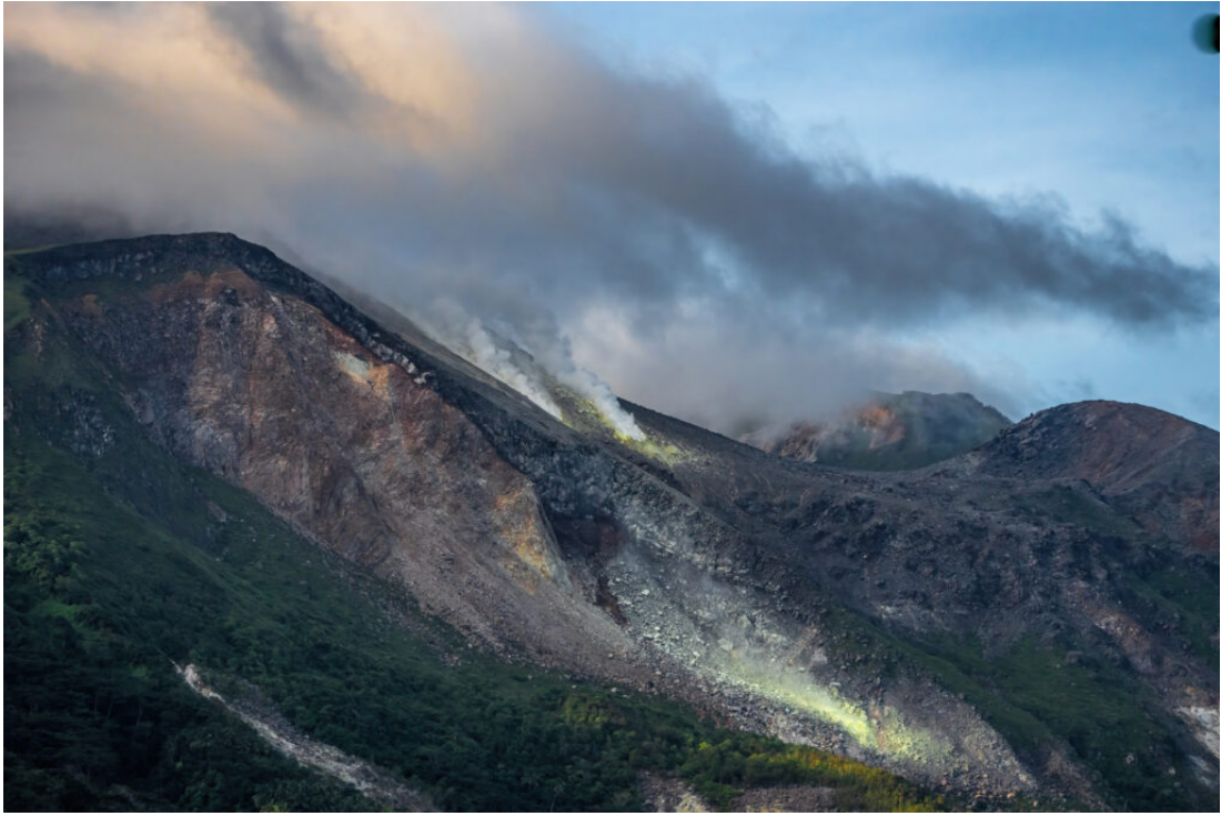
The active volcano on remote Damar in the Banda Sea