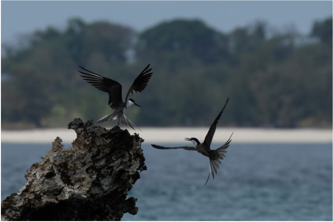
Bridled Terns