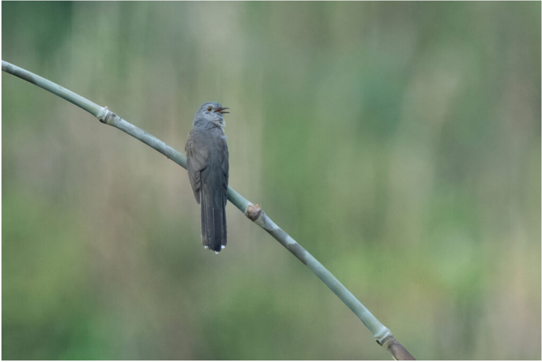
Rusty-breasted Cuckoo