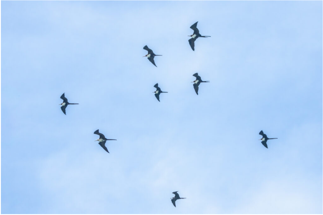
Great Frigatebirds lie in wait