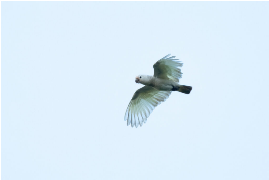
The endemic Tanimbar Corella (or Tanimbar Cockatoo)