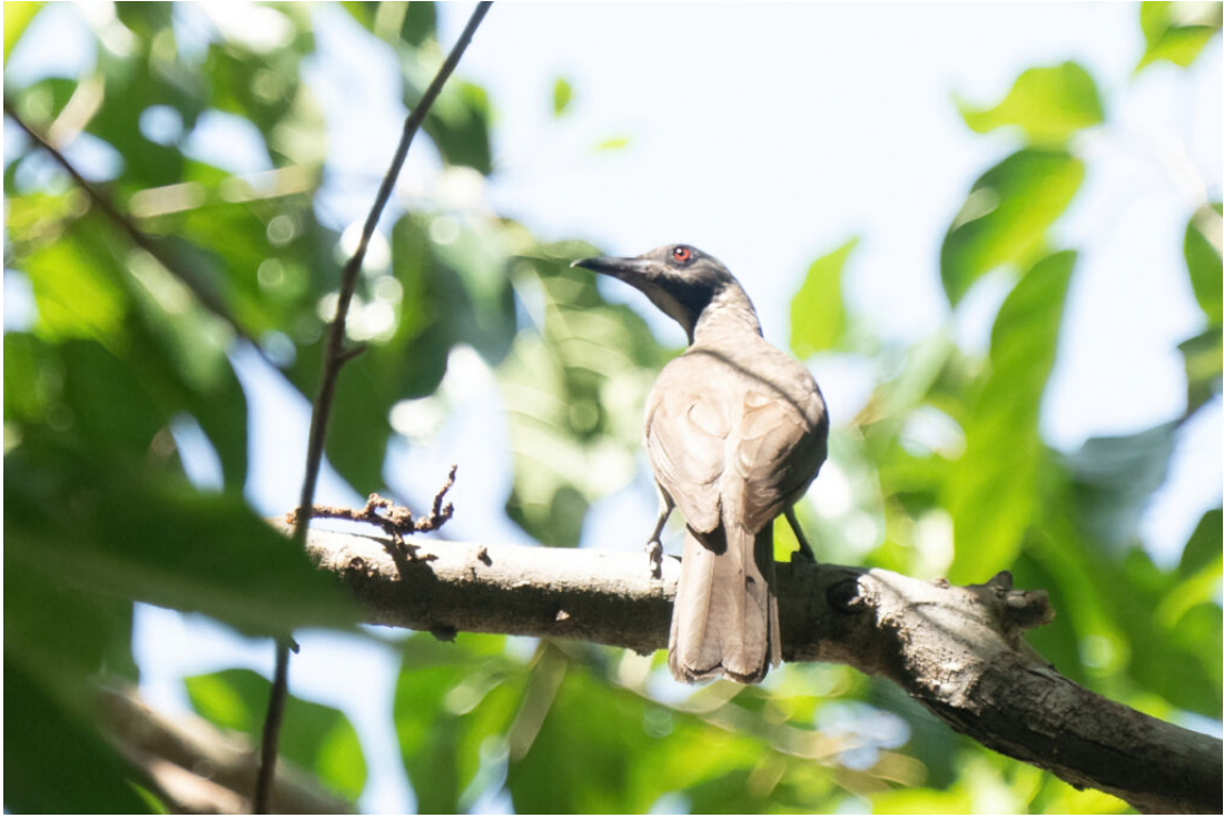
The endemic Wetar Oriole