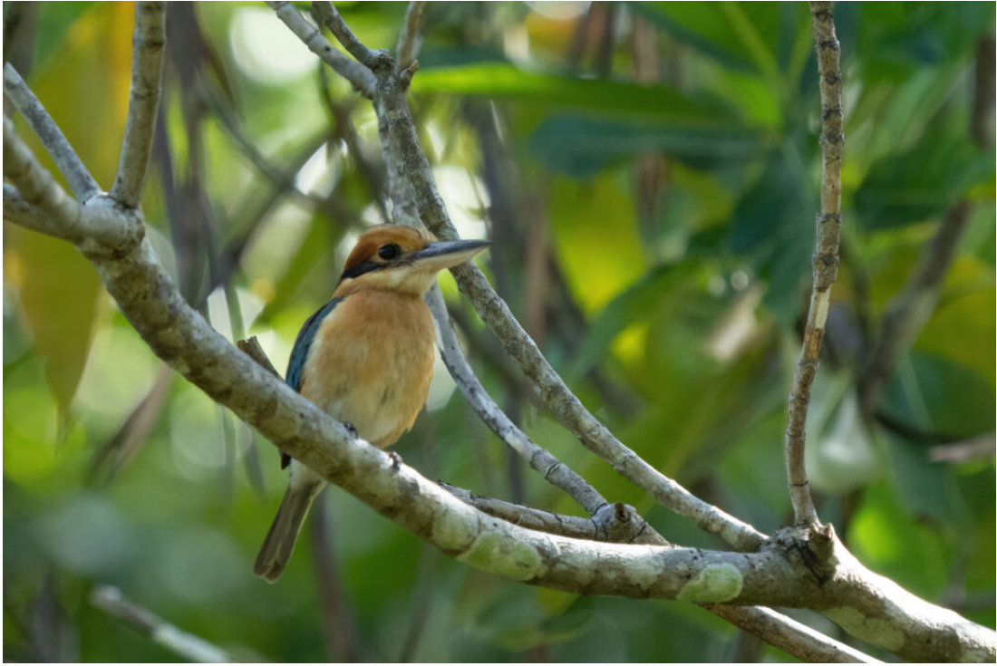
Cinnamon-banded Kingfisher of the form dammerianus