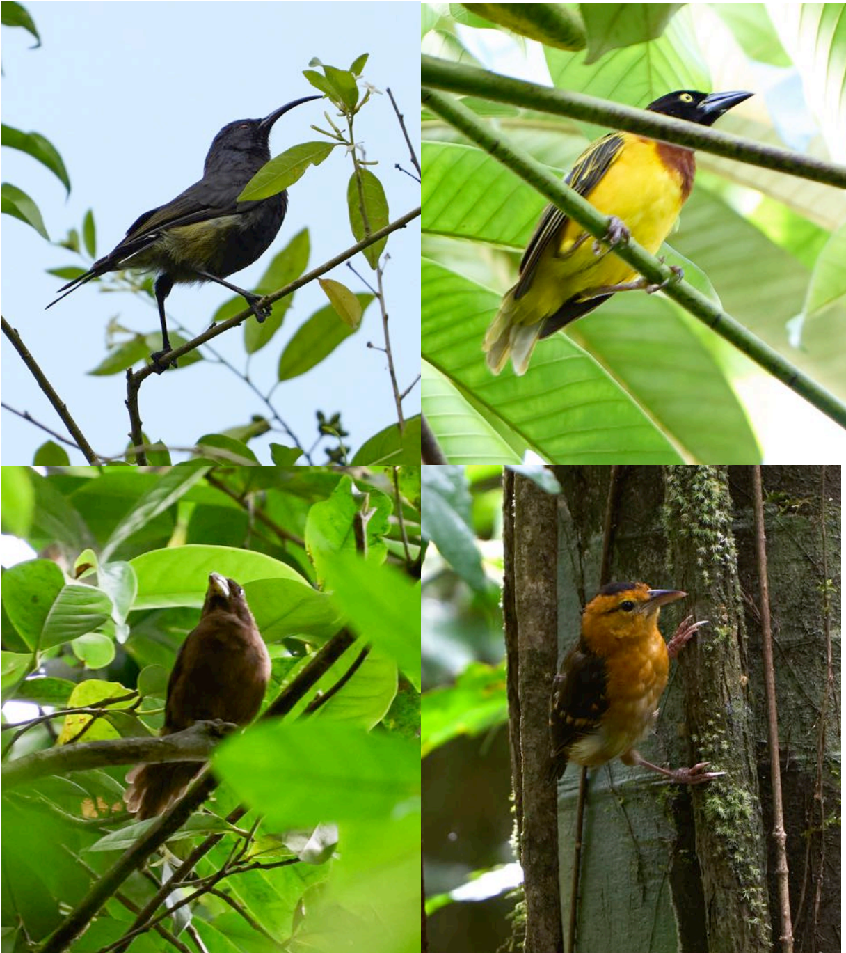
Giant Sunbird, Giant Weaver, Sao Tome Weaver and Sao Tome Grosbeak.

Bronze Mannikin Lonchura cucullata Just a few were seen.