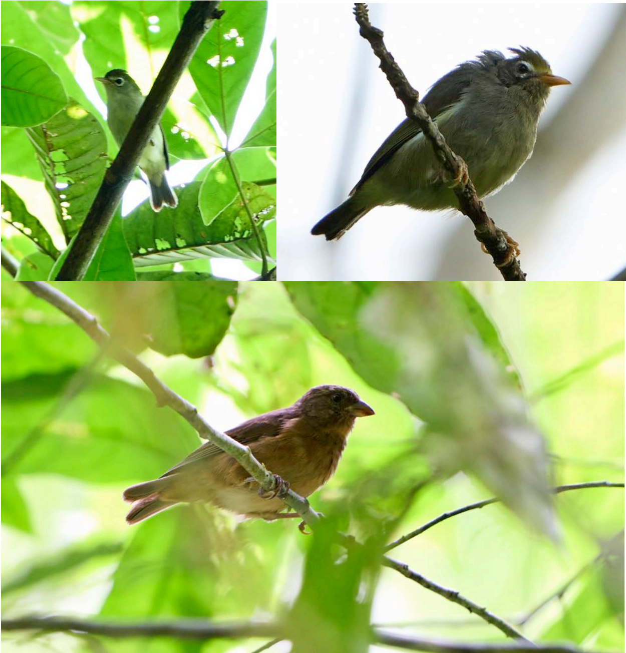
Principe White-eye, Sao Tome White-eye and Principe Seed eater.

Sao Tome Cobra Naja peroescobari An impressive encounter with one in southern São Tomé. Sao Tome Skink Trachylepis thomensis Several were living in the gardens of our São Tomé hotel.