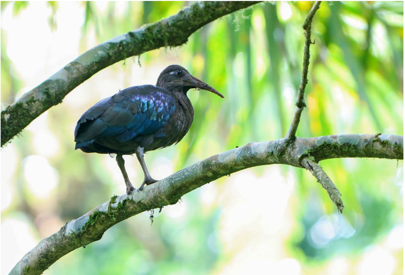
Sao Tome Ibis.

back to the campsite. After a bit of an argument with the porters regarding the lack of water, which we were promised would be up next morning, we enjoyed our spaghetti dinner and then went to our tents. Throughout the night we were being serenaded by several Sao Tome Scops Owls and we also heard a Sao Tome Barn Owl, but no sign of any Band-rumped Storm Petrels.