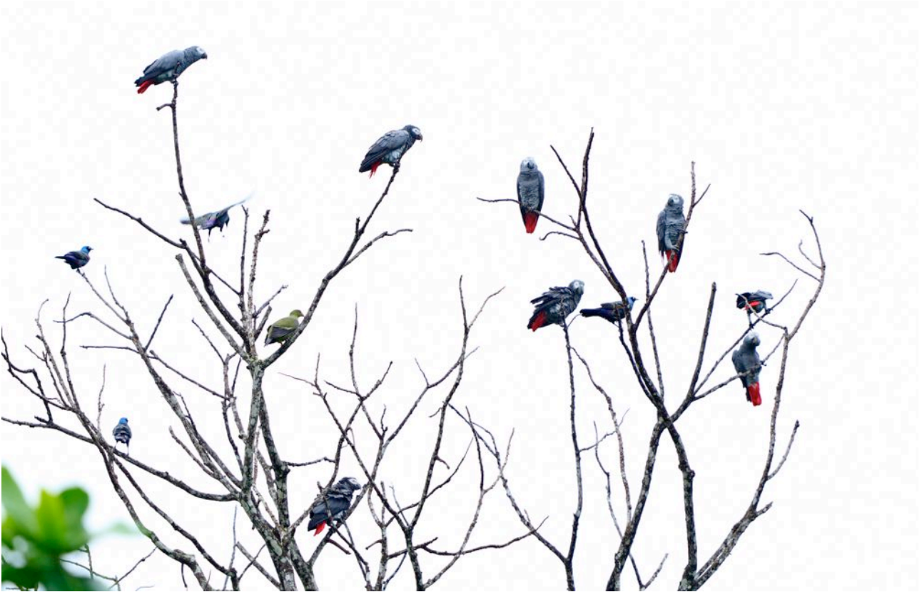
Grey Parrots, Principe Starlings and African Green Pigeon. White-winged Widowbird.