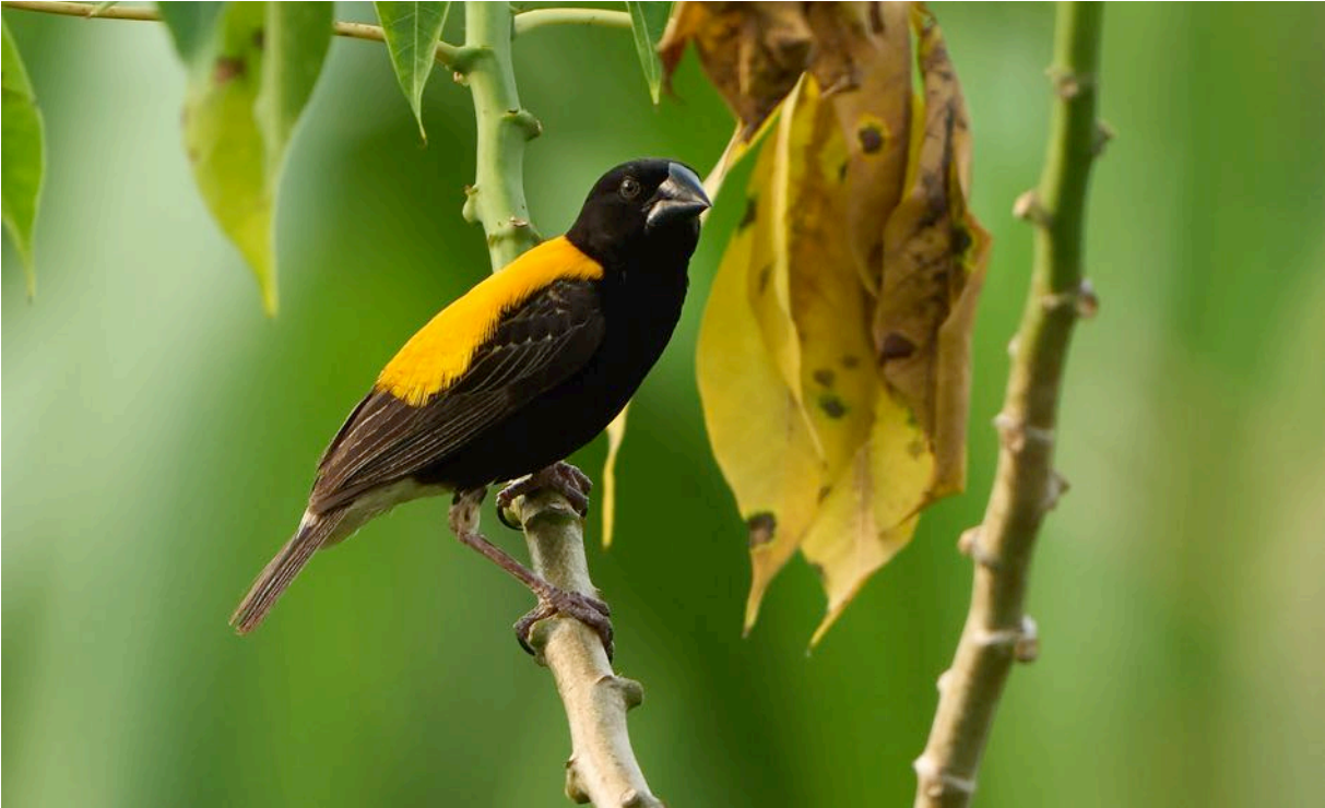
Golden-backed Bishop and Sao Tome White-toothed Shrew