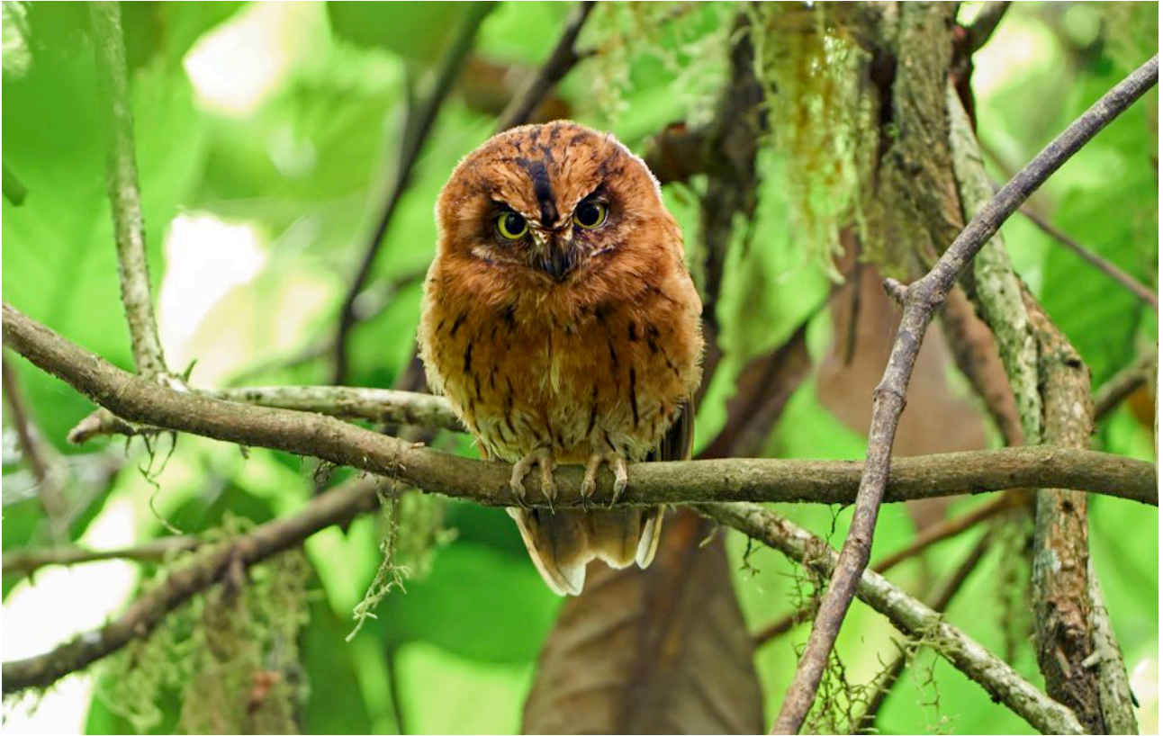
A cute Sao Tome Scops Owl.