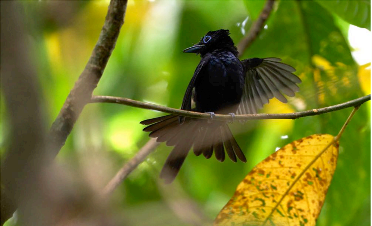
Sao Tome Paradise Flycatcher.