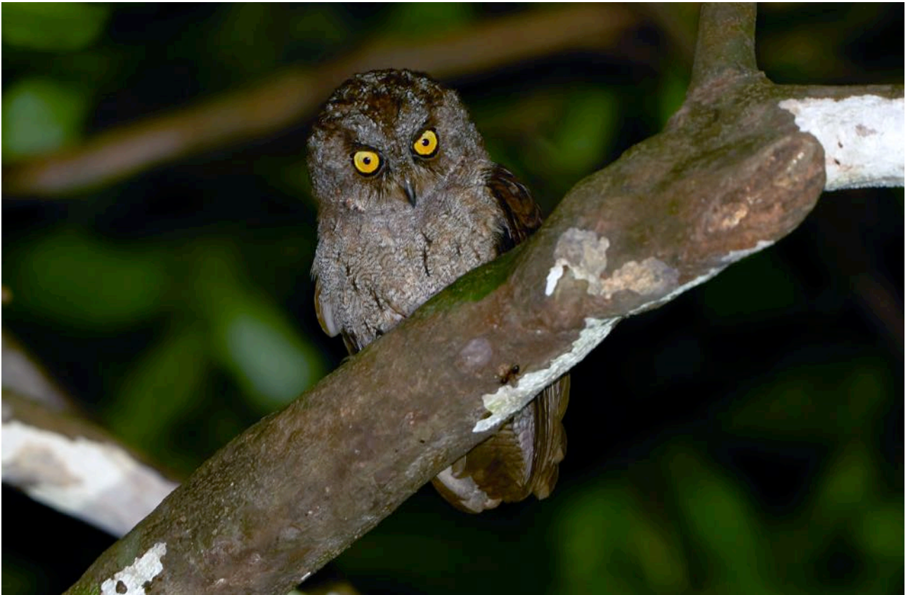
“Principe” Scops Owl.

subspecies of Principe Seed eater that is confined to this tiny rock. A number of elegant White-tailed Tropicbirds were seen, together with some Brown Boobies and Atlantic Spotted Dolphins. We arrived back to the hotel in the late afternoon, had a drink and went back to the scops owl site. This time things went according to plan, and after some tense moments we finally enjoyed brilliant views of “Principe” Scops Owl. Wow, what an action-packed and highly successful day it had been!