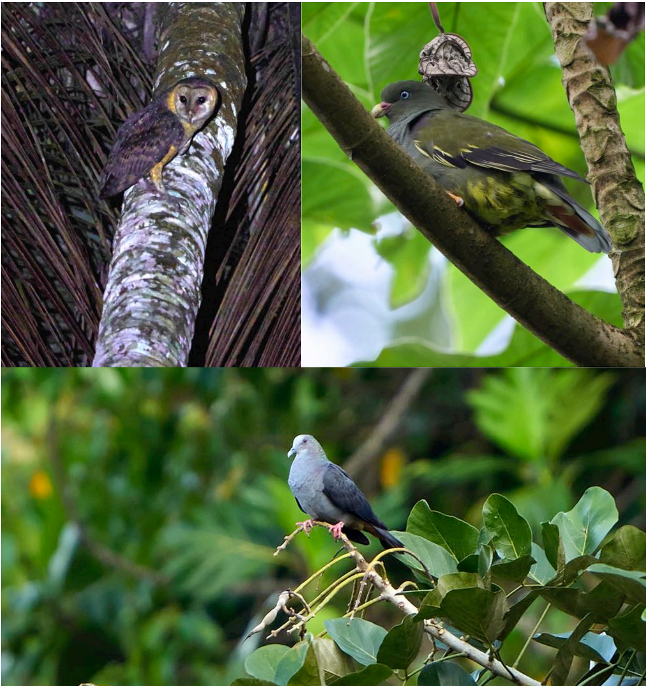
Sao Tome Barn Owl, Sao Tome Green Pigeon and Island Bronze-naped Pigeon.