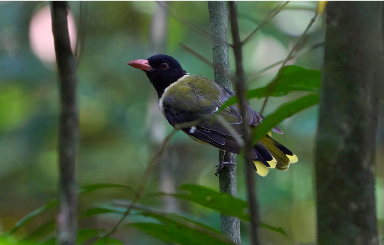
Sao Tome Oriole.