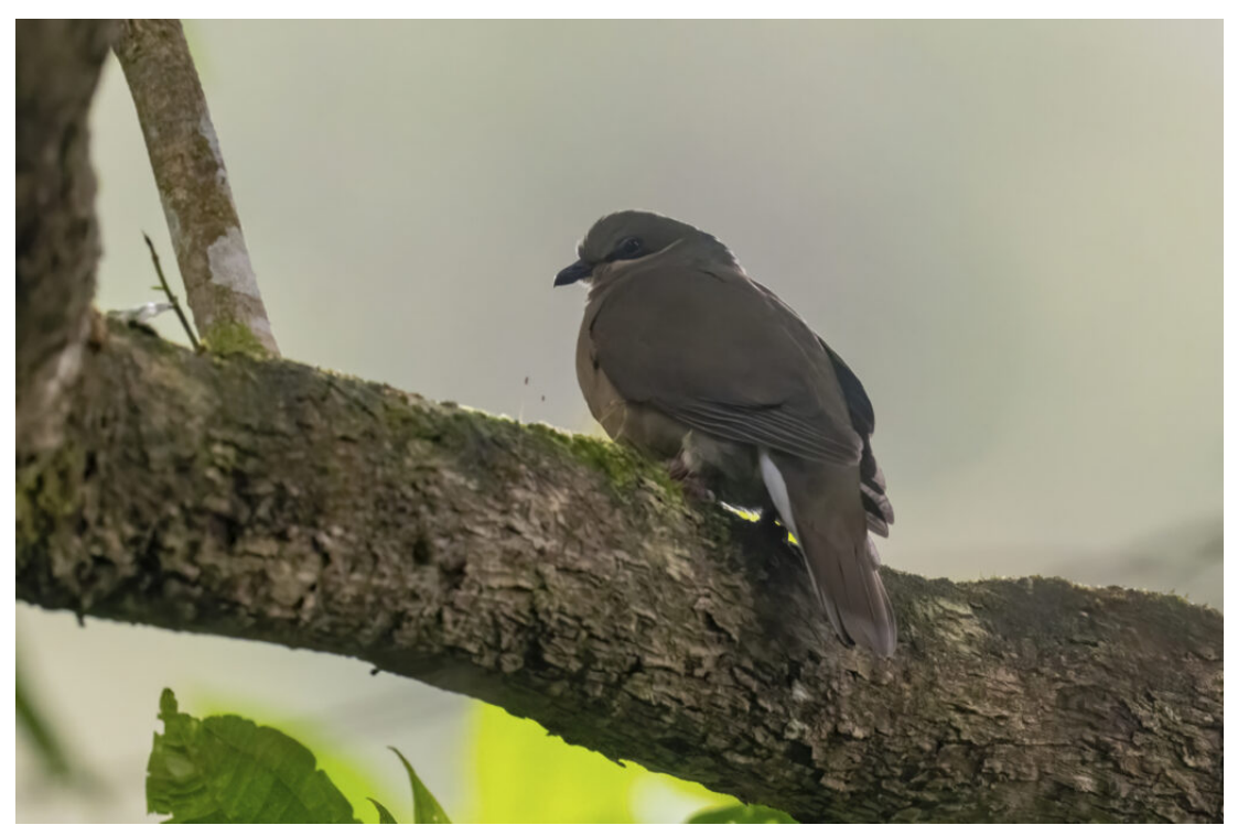
Buff-eared Brown Dove