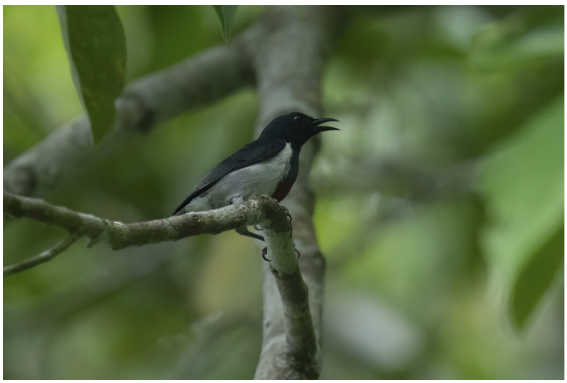
Scarlet-collared Flowerpecker