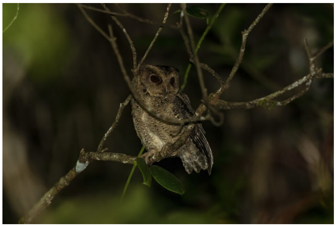
Philippine Scops Owl