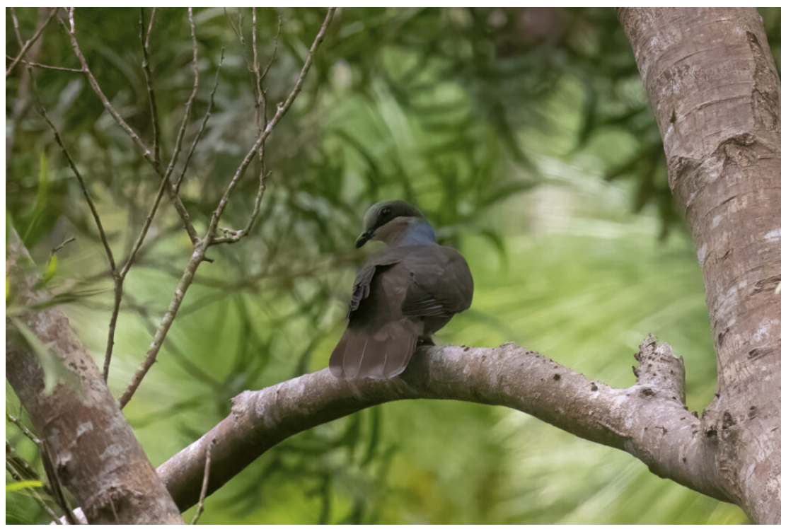
Buff-eared Brown Dove