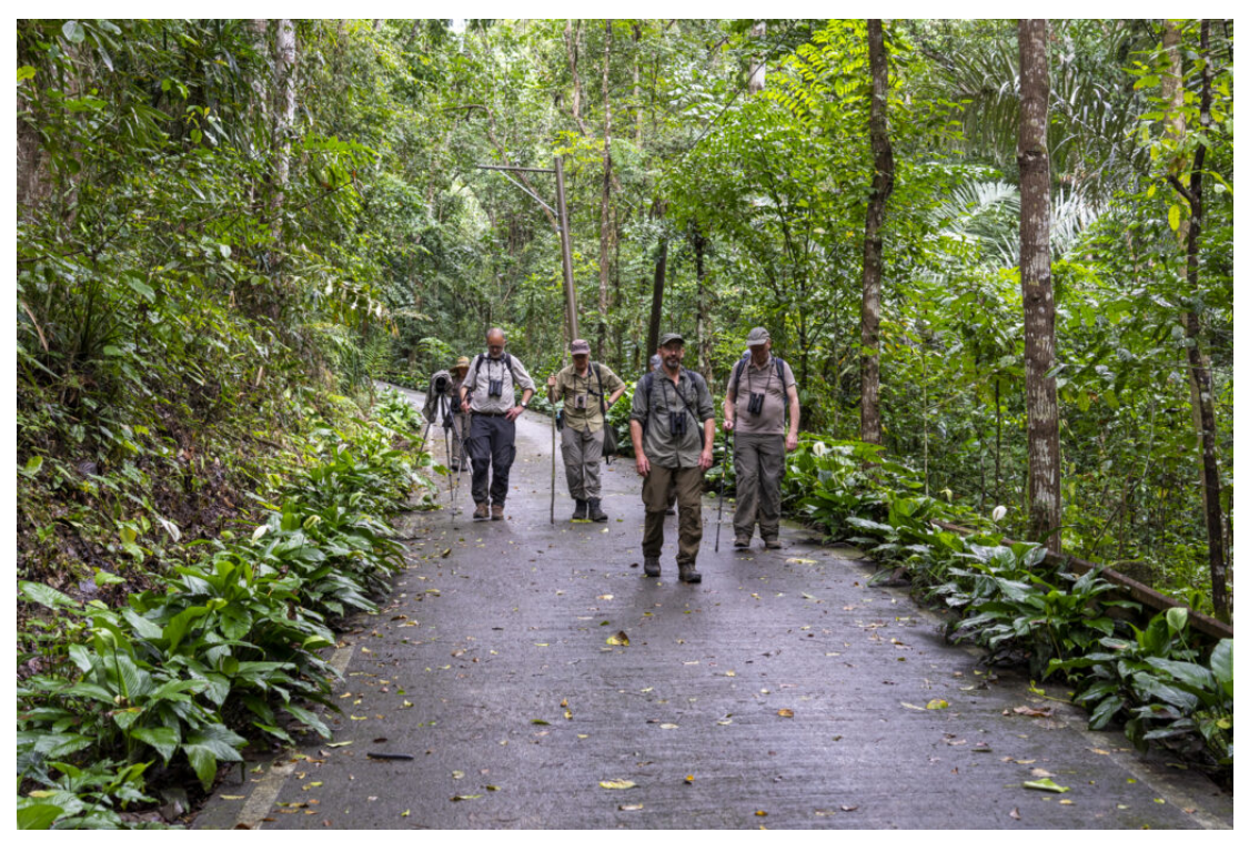
Bohol birding