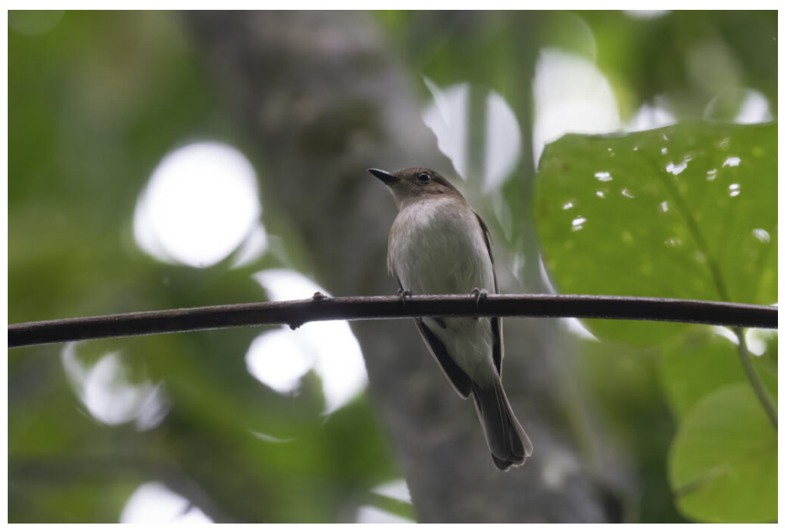
White-vented Whistler