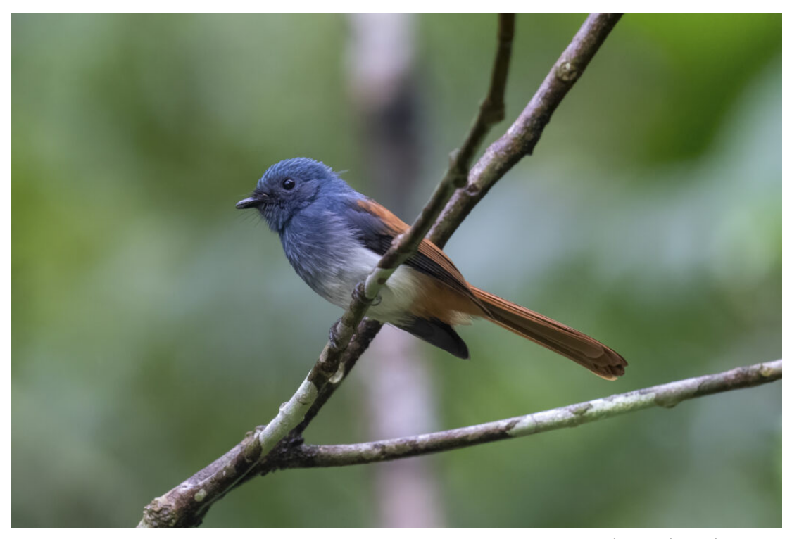
Visayan Fantail