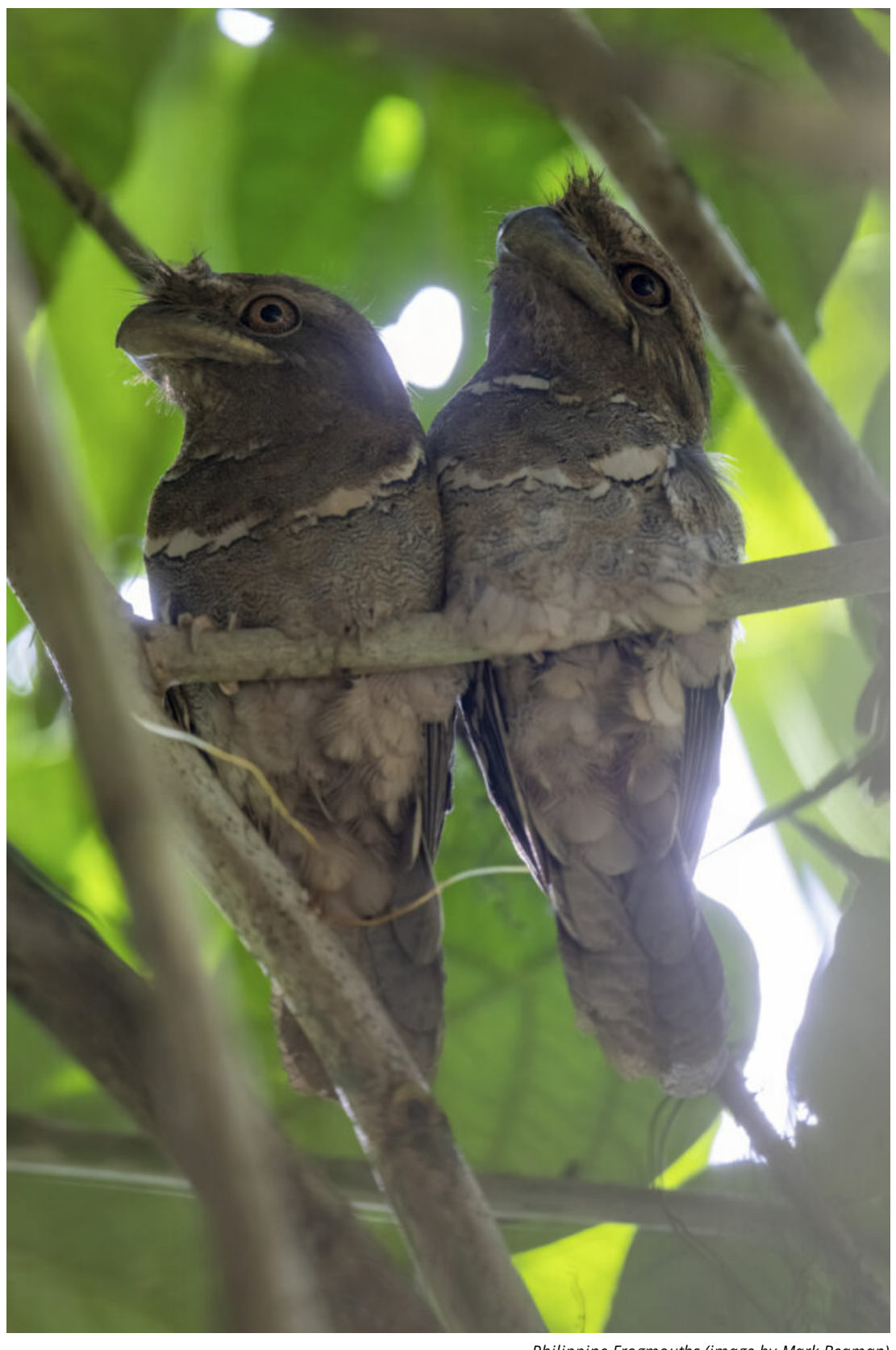
Philippine Frogmouths