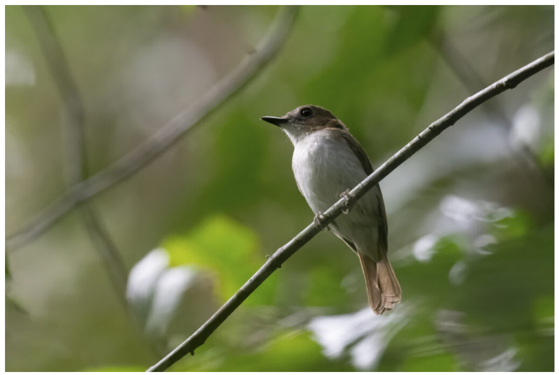
Philippine Jungle Flycatcher