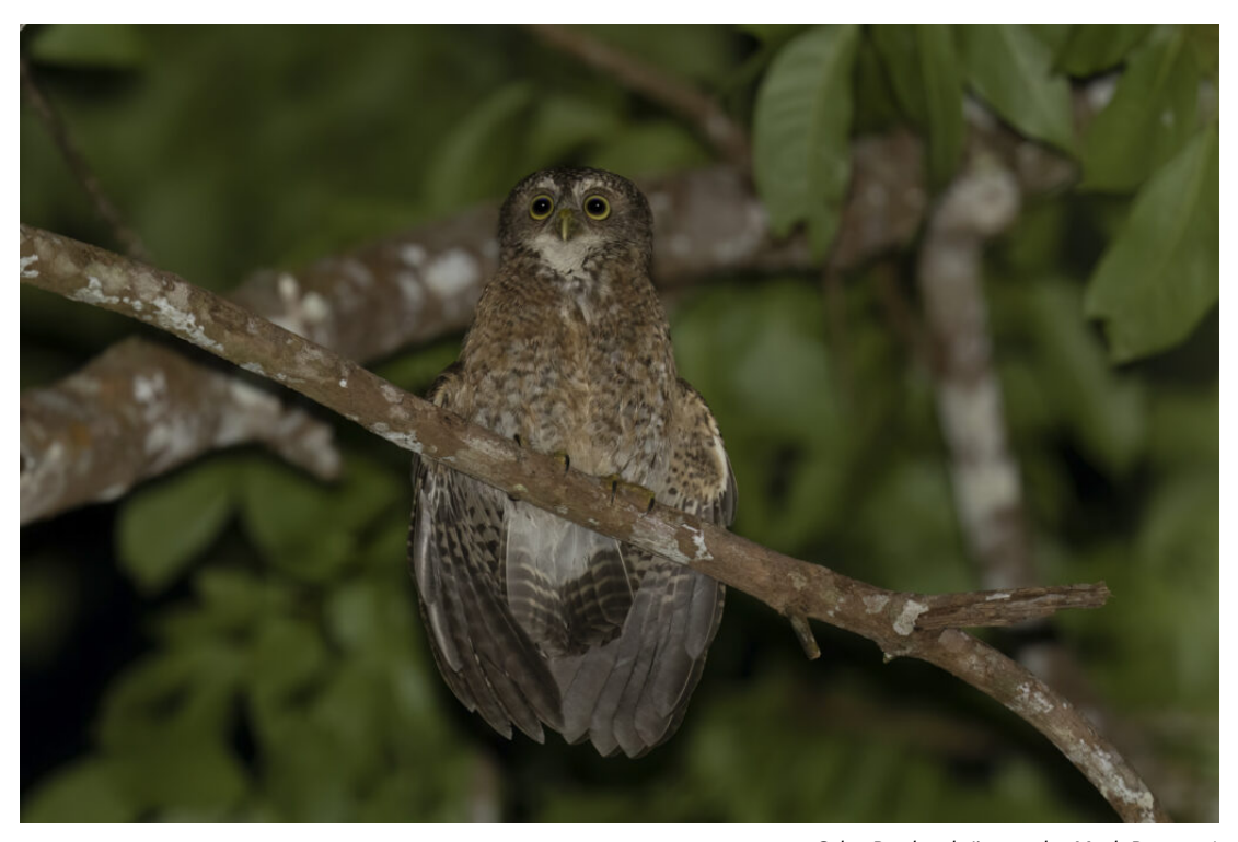
Cebu Boobook