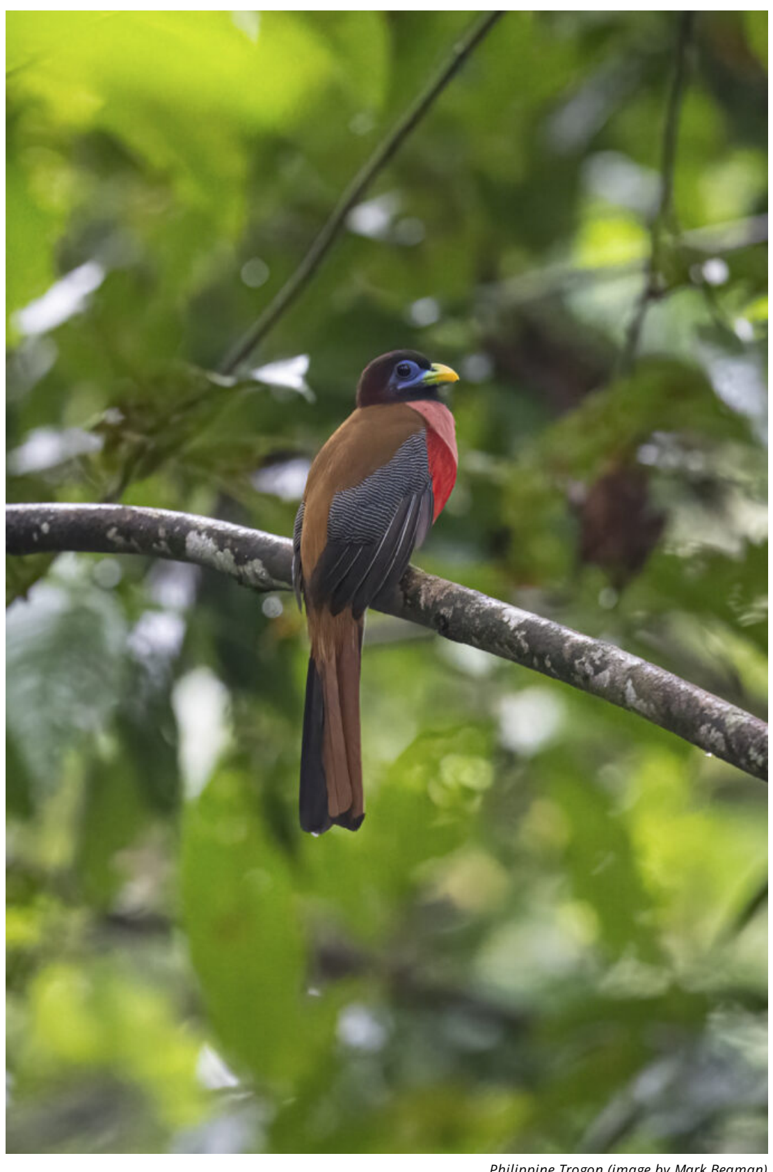
Philippine Trogon