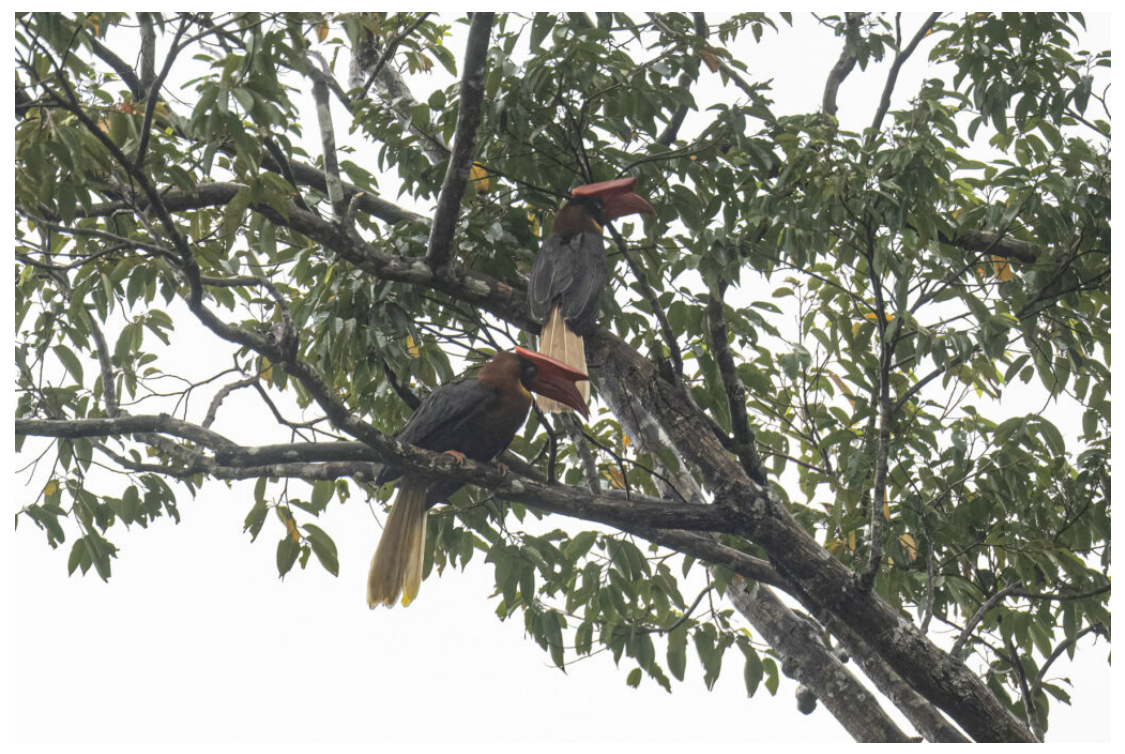
Northern Rufous Hornbills