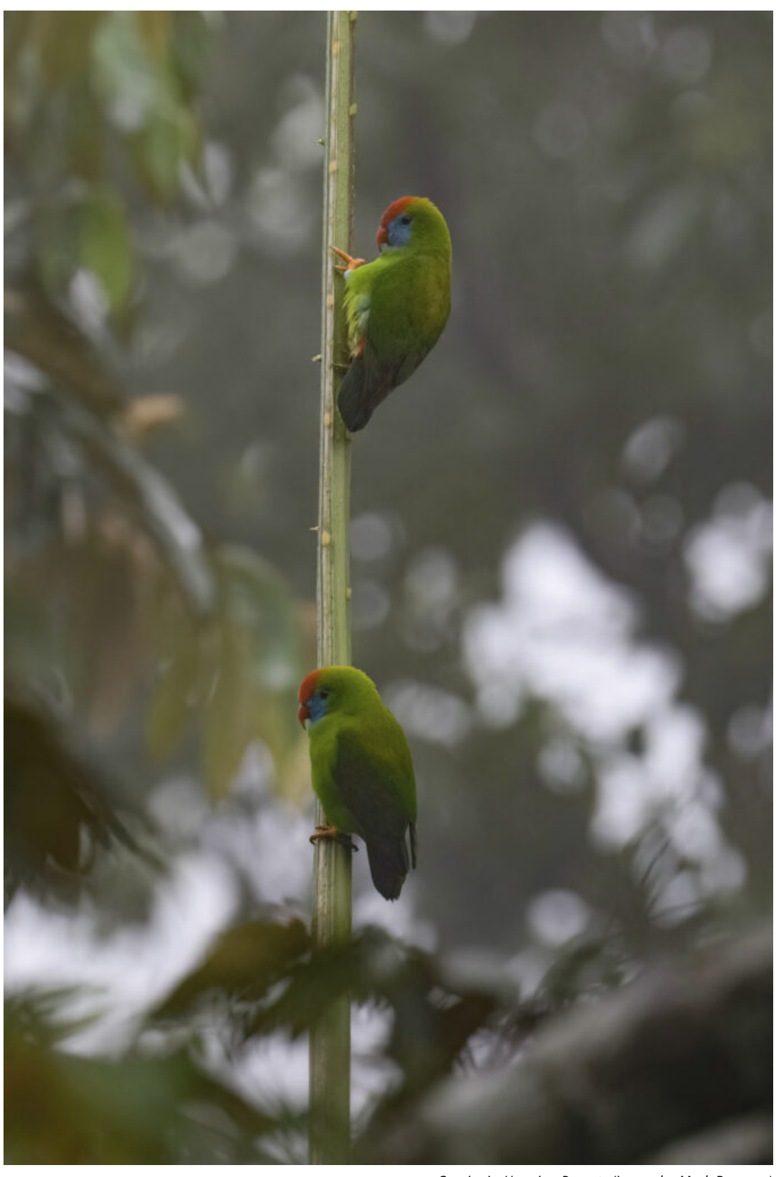
Camiguin Hanging Parrots