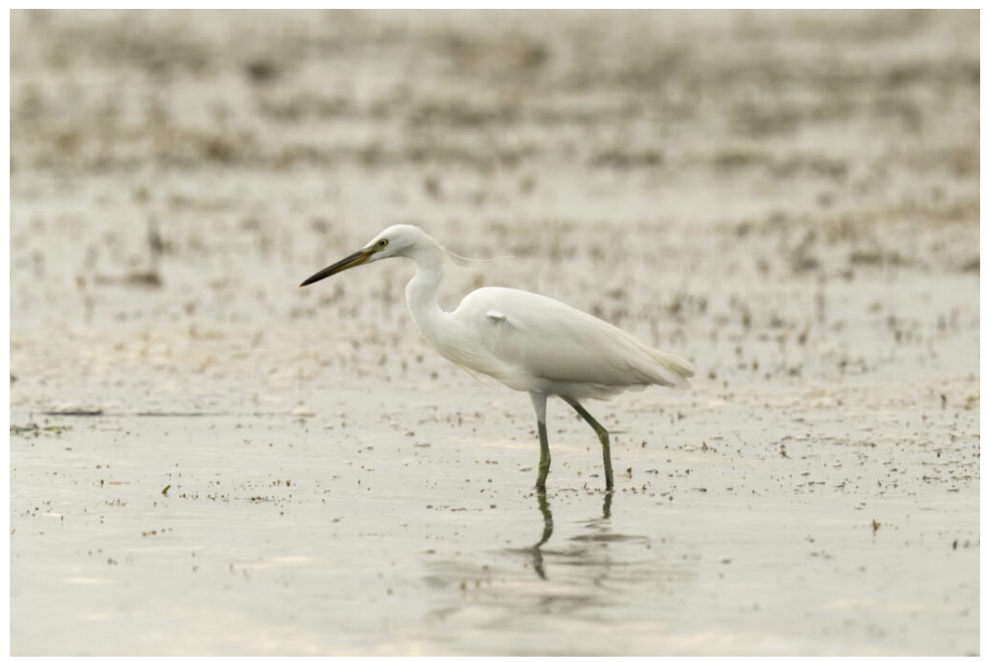
Chinese Egret (image by Mark Beaman)