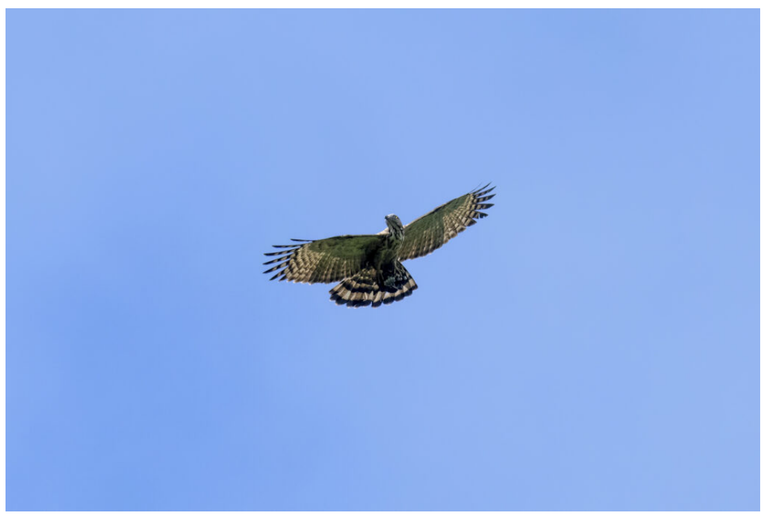
Philippine Honey Buzzard