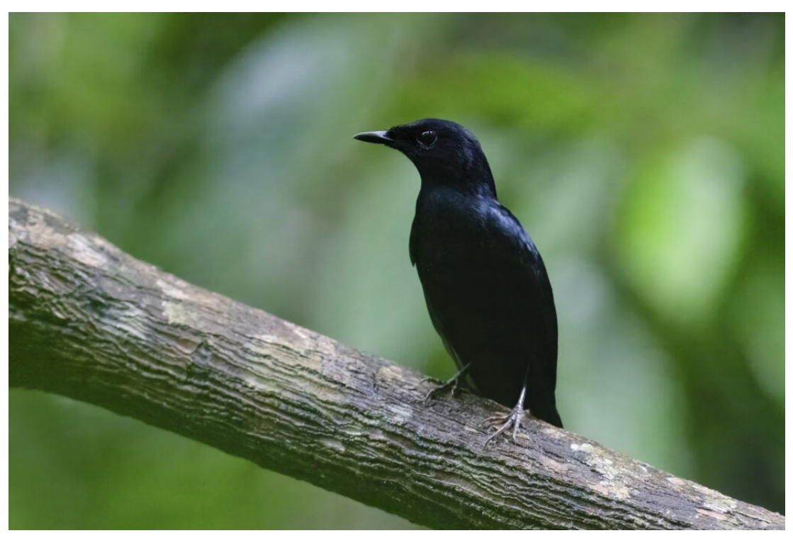
Black Shama