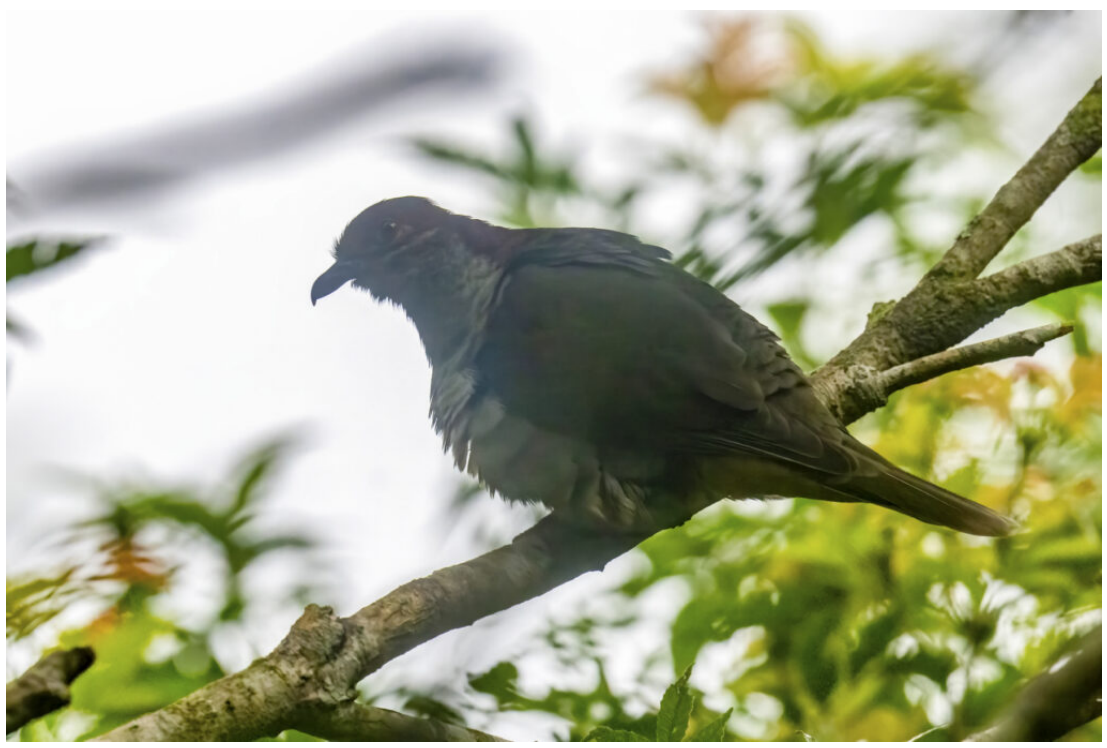
Grey-breasted Brown Dove