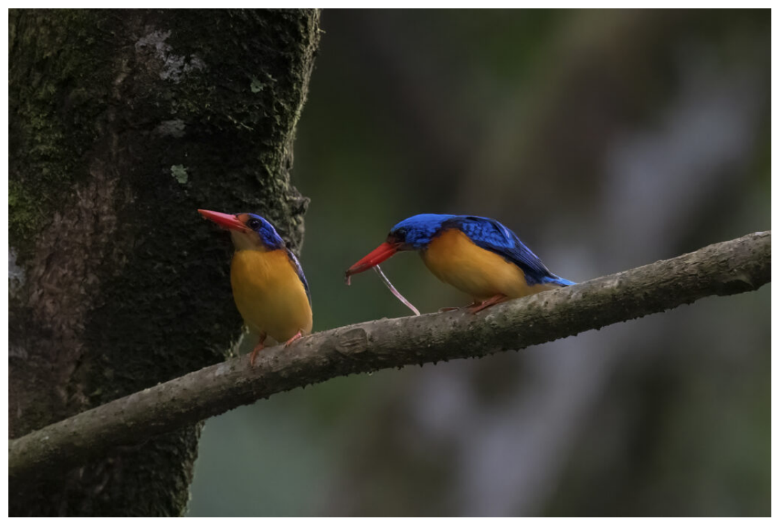
Dimorphic Dwarf Kingfishers courting