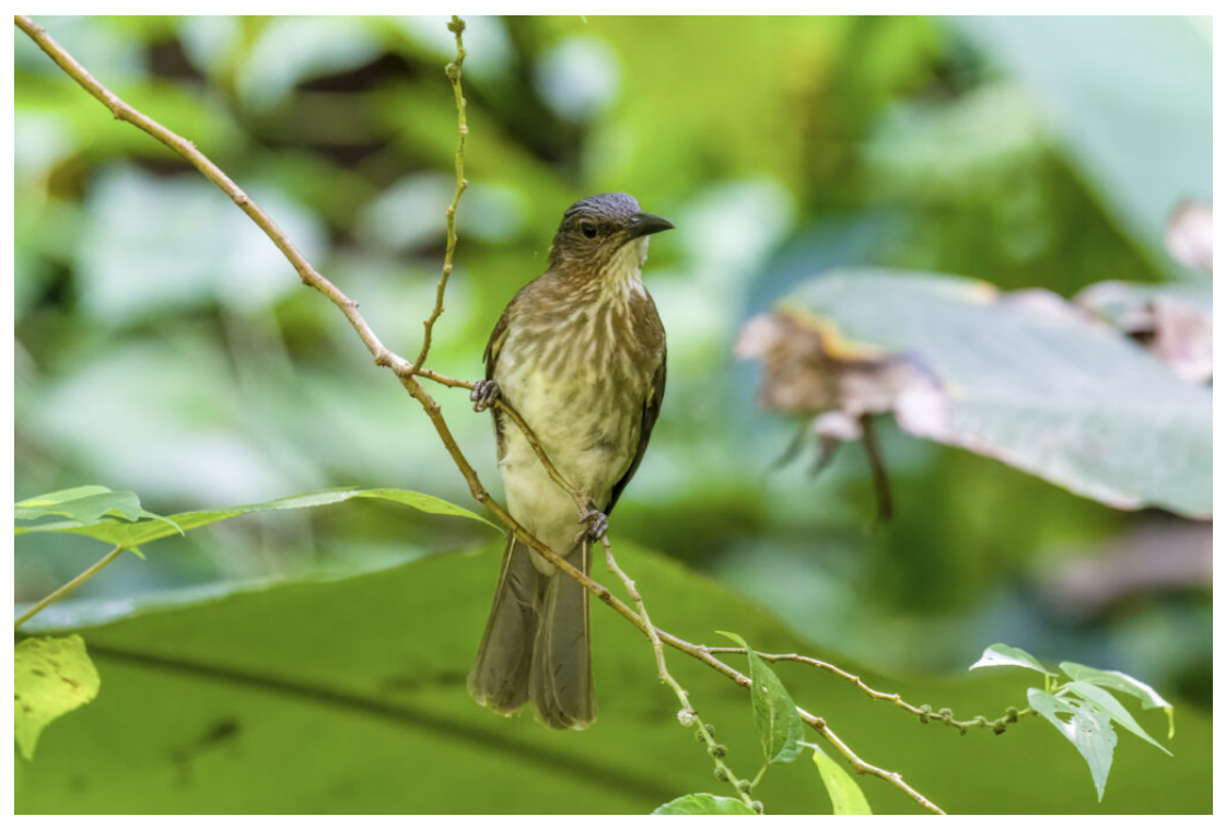
Streak-breasted Bulbul of the Tablas form