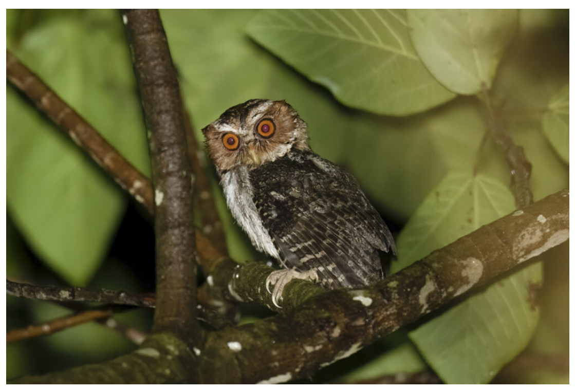
Negros Scops Owl