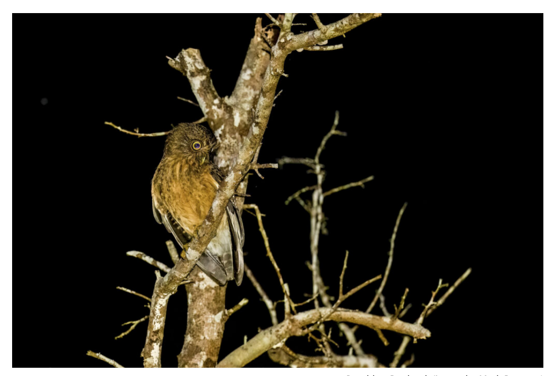
Romblon Boobook