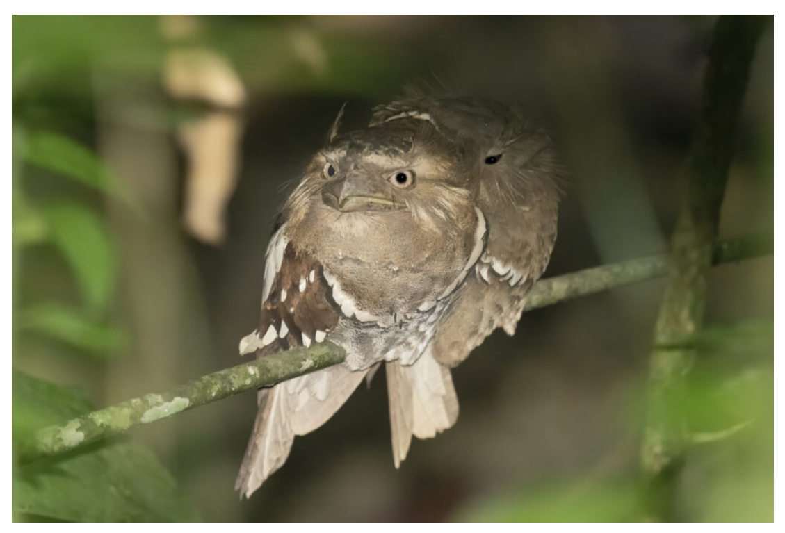
Philippine Frogmouths