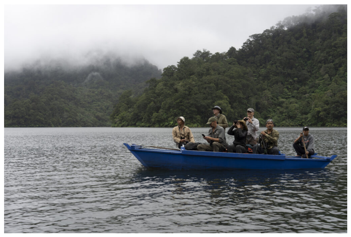
Boat birding at the Twin Lakes, Negros