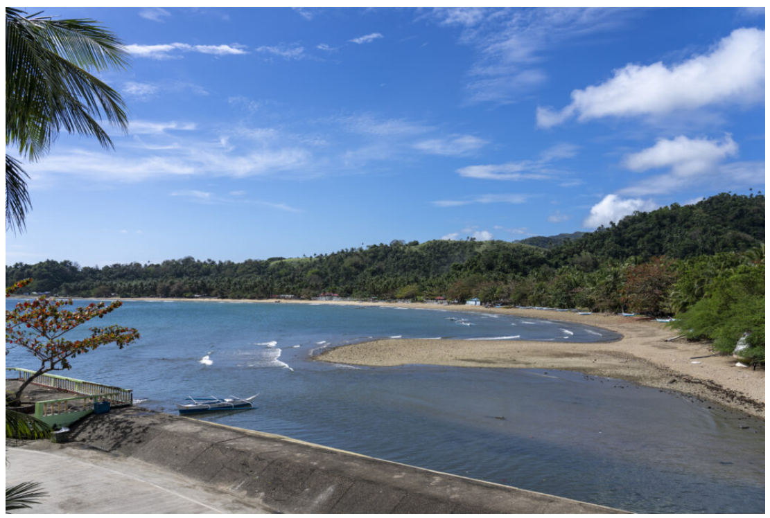
The attractive coastline of Tablas Island