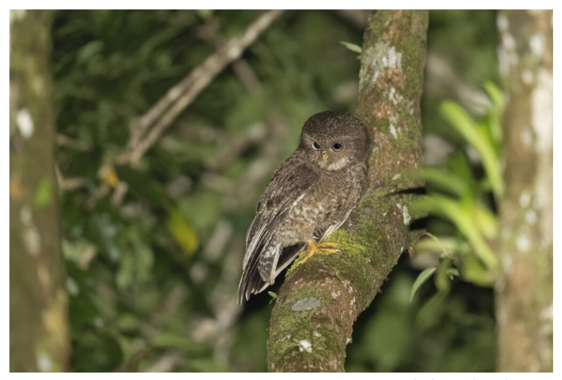
Camiguin Boobook