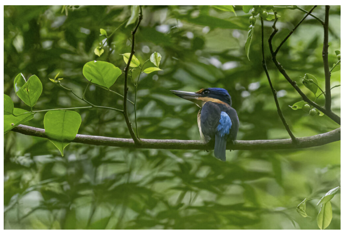
Winchell's Kingfisher