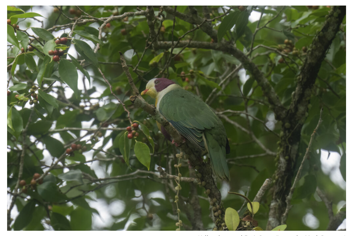
Yellow-breasted Fruit Dove