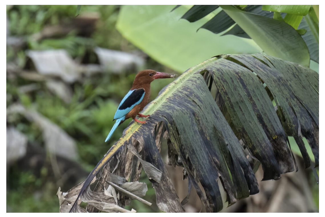
White-throated Kingfisher