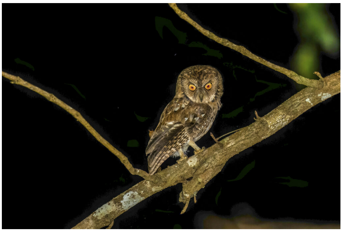
Mantanani Scops Owl