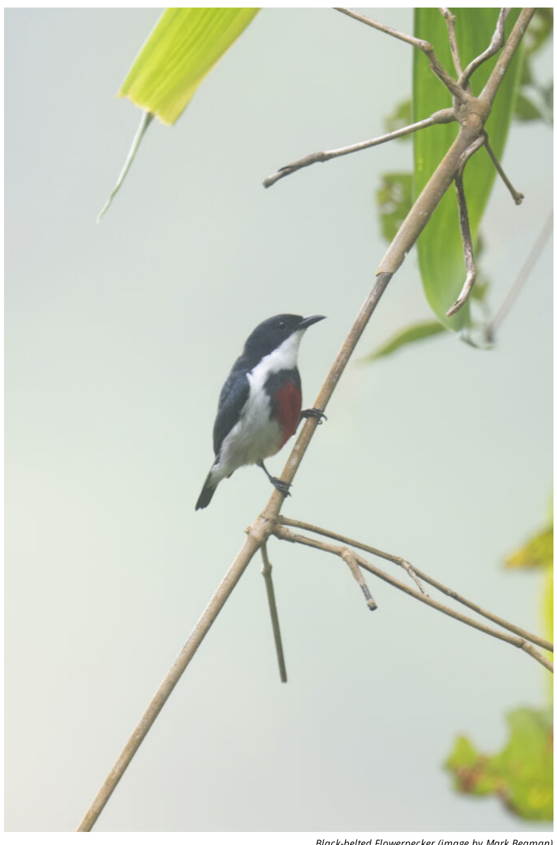
Black-belted Flowerpecker