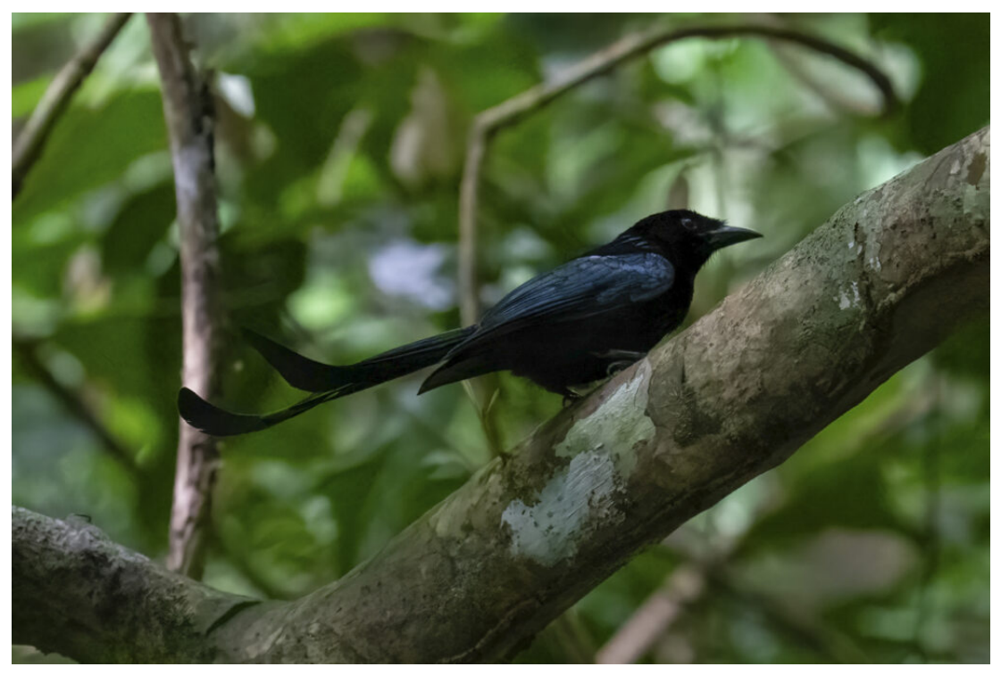
Tablas Drongo