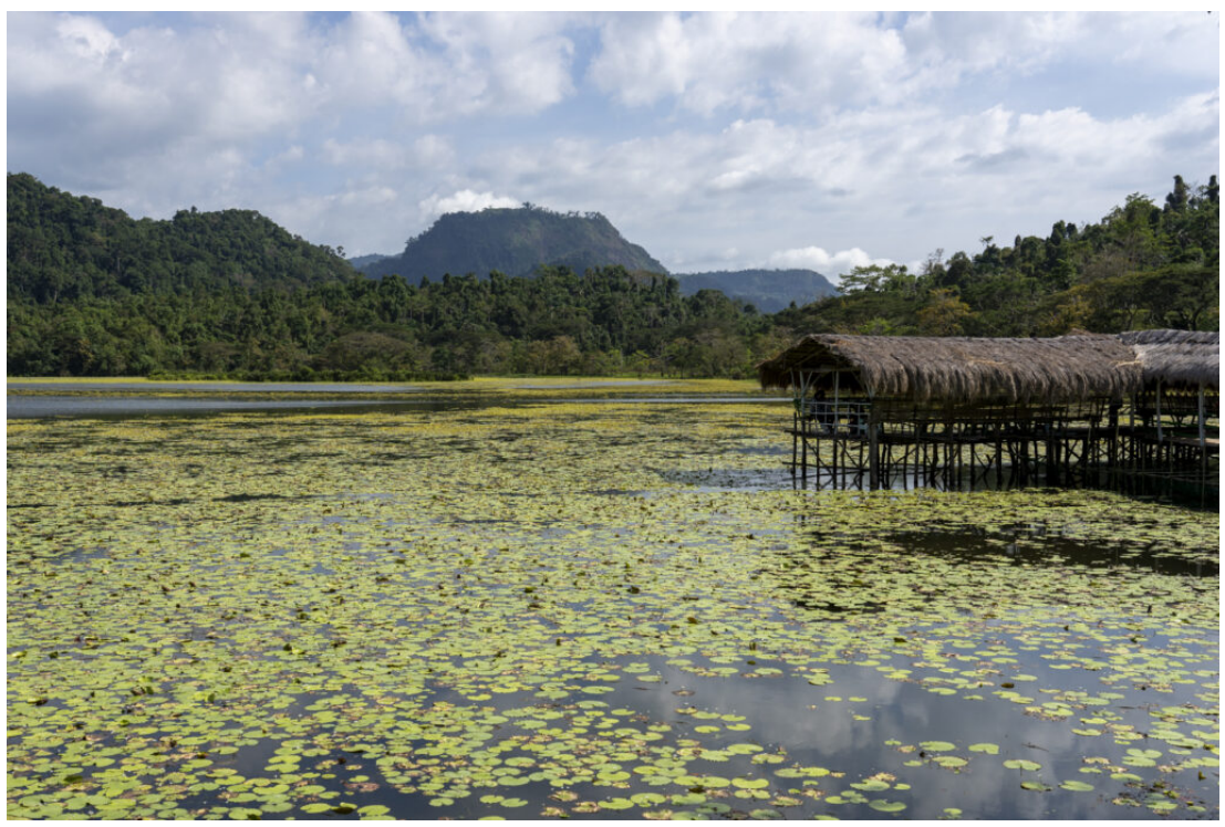
Mindoro is a beautiful island