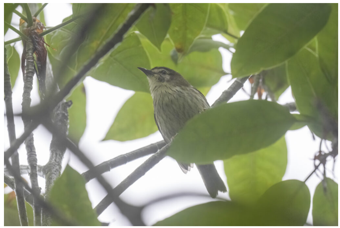
Negros Striped Babbler