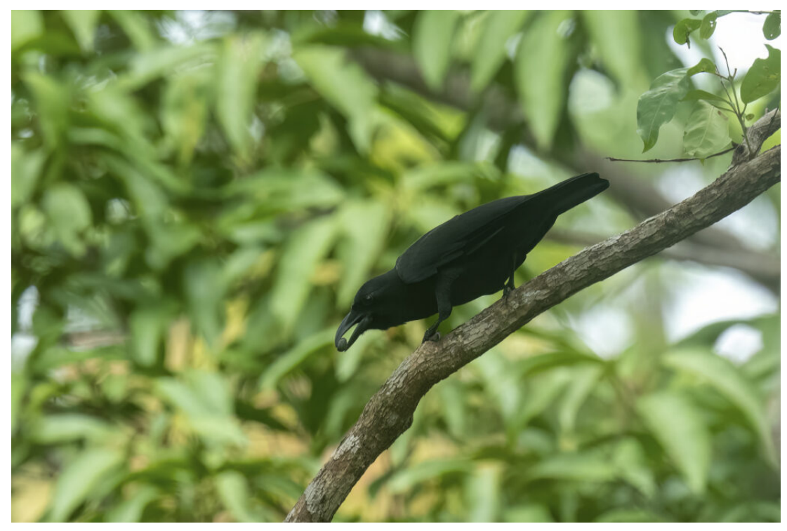
Palawan Crow