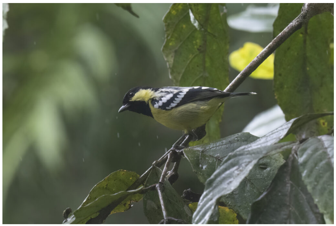
Elegant Tit