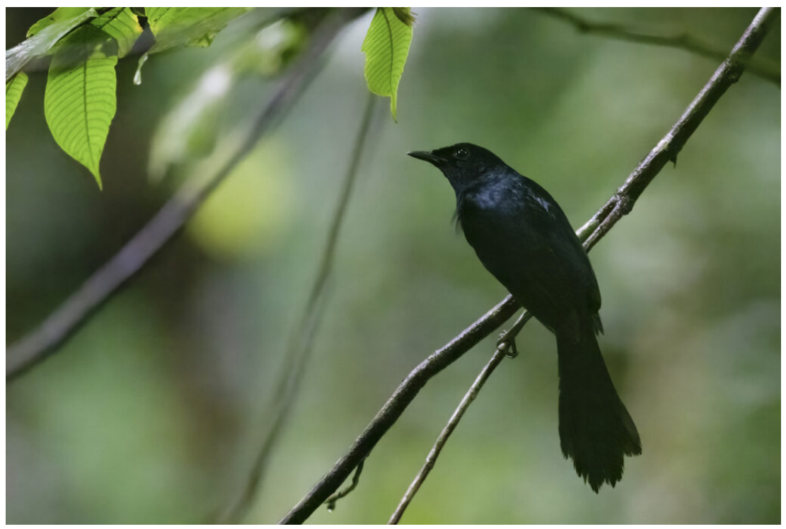
Black Shama