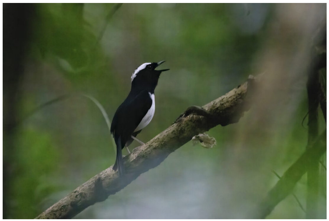
Visayan Shama