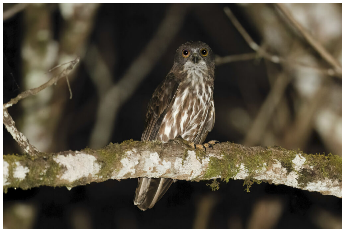
Chocolate Boobook