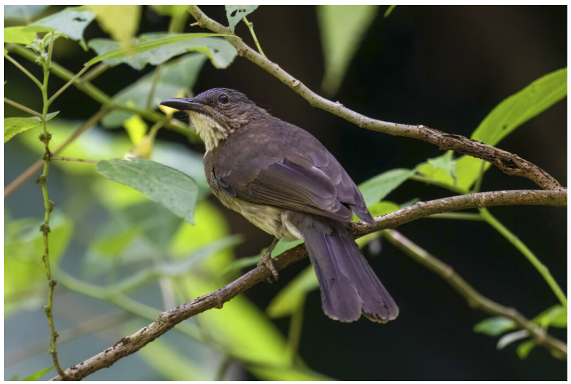
Streak-breasted Bulbul of the Tablas form