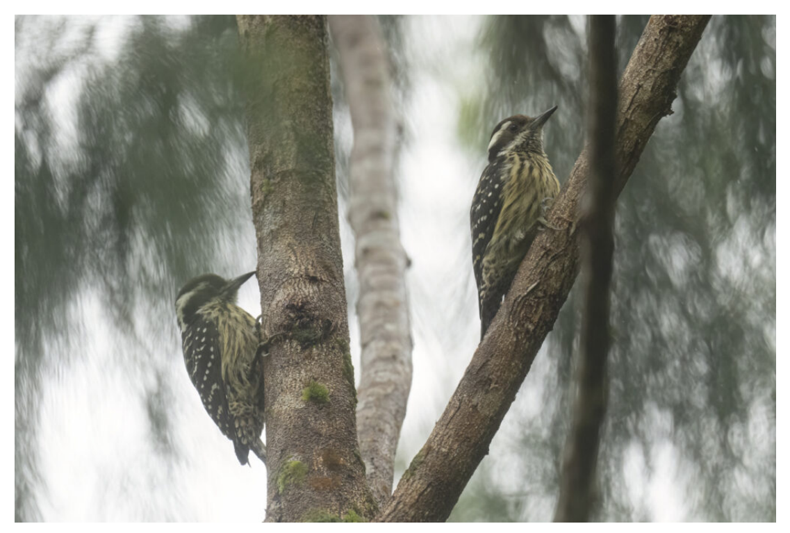
Philippine Pygmy Woodpeckers