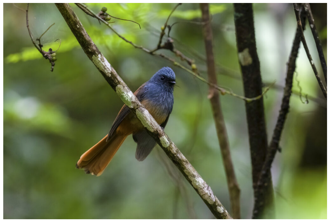
Tablas Fantail