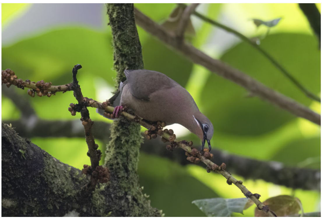
White-eared Brown Dove