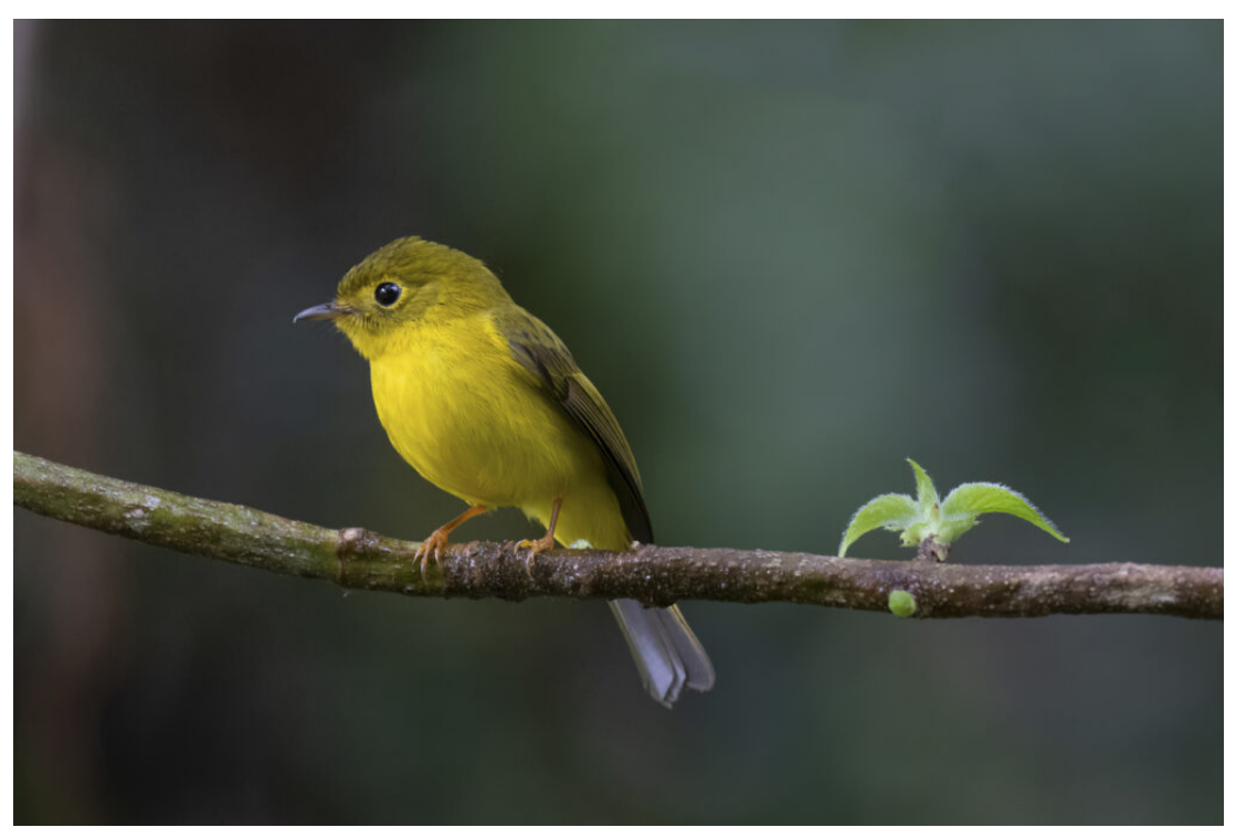
Citrine Canary-flycatcher