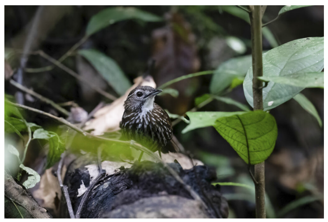
Striated Wren-Babbler