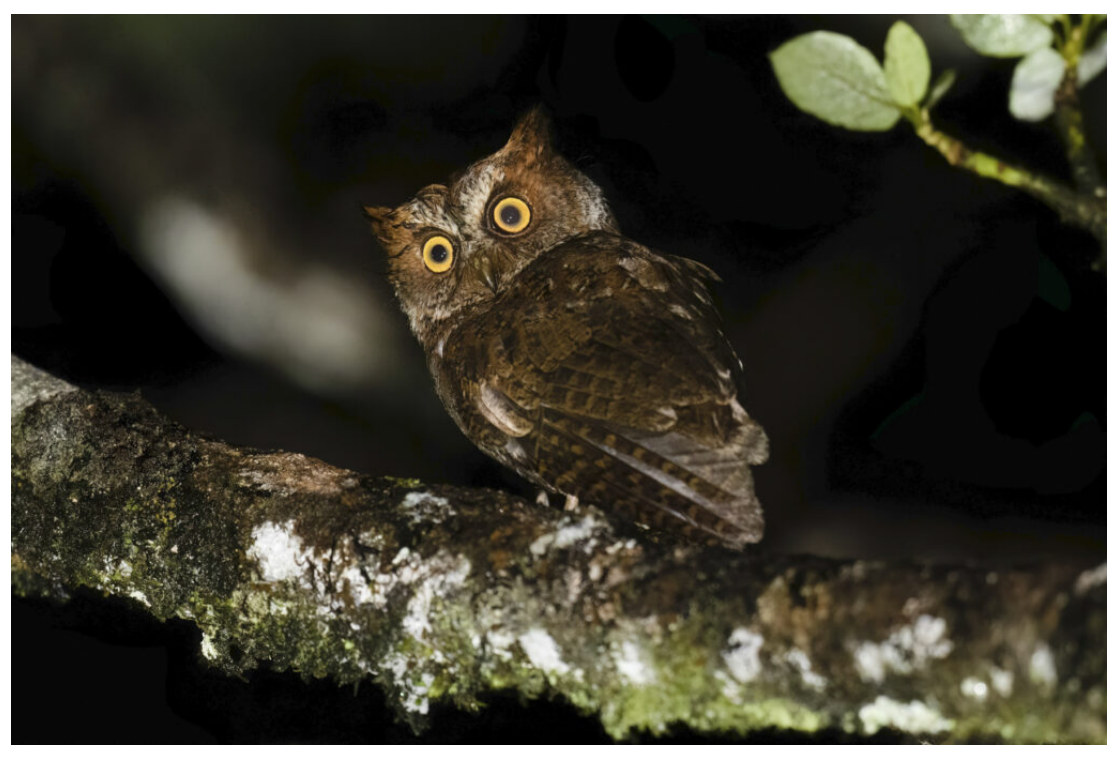
Luzon Scops Owl