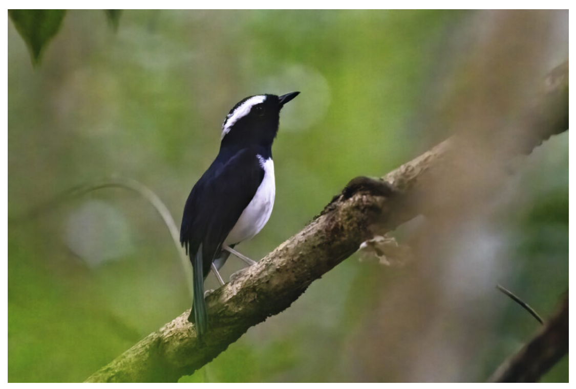
Visayan Shama