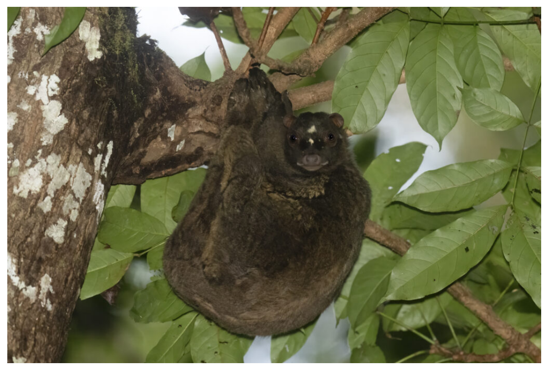
Philippine Flying Lemur or Colugo