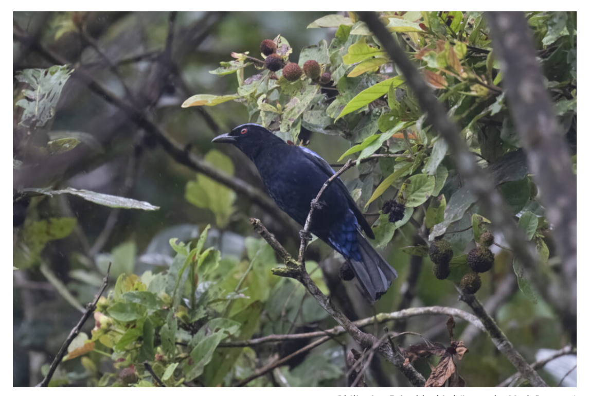
Philippine Fairy-bluebird