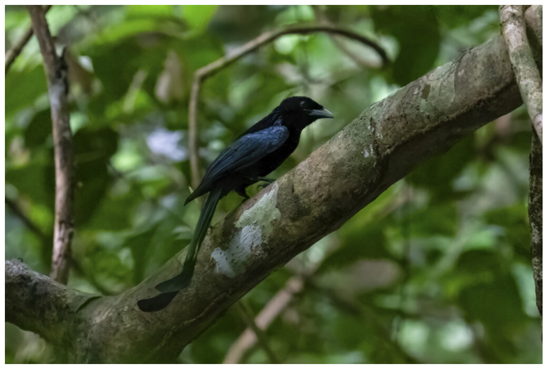
Tablas Drongo