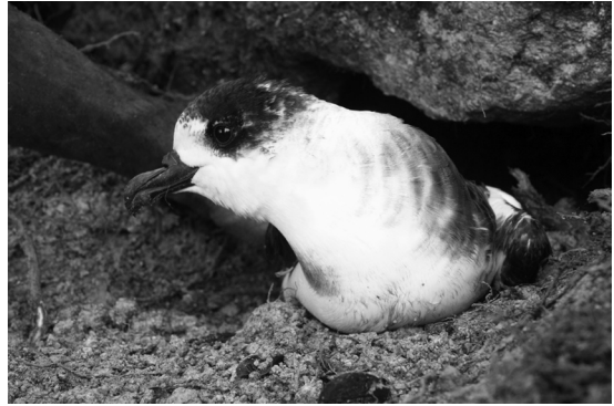
Fig. 4. Vanuatu petrel outside its burrow on Vanua Lava. (Photo: S. Totterman).

Aural surveys were conducted along the foot of the eastern mountain slopes. My aim was to listen for any other colonies and to locate their position from intersecting bearings. There were 3 listening stations: Qwelrakrak (0 m), 180 m north and 240 m north. These stations were located with a handheld Global Positioning System (GPS) receiver and areas of repeated calling activity were noted with compass bearing, estimated distance and elevation (low, medium, high). Three sub-colonies were