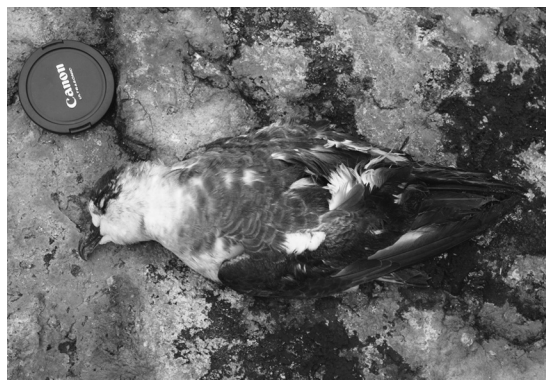
Fig. 3. Dorsal view of Vanuatu petrel from Vanua Lava. Lens cap diameter is 77 mm.

there in Sep 2005 from a friend on the neighbouring island of Mota Lava. Two trips were made to investigate this report, in 2007 and in 2009.