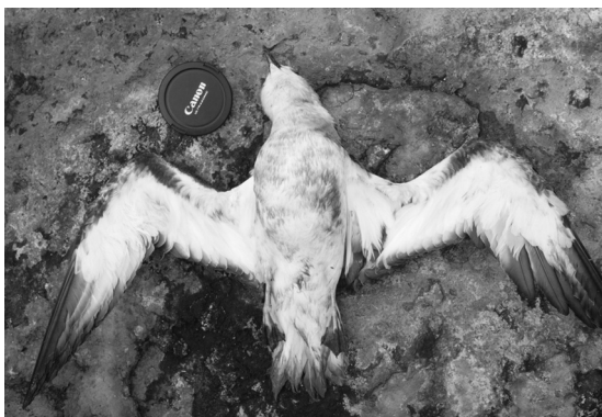
Fig. 2. Ventral view and underwing of Vanuatu petrel from Vanua Lava; the dark grey underside of the primaries is clear. The breast and belly are soiled. Lens cap diameter is 77 mm (Photo: S. Totterman).