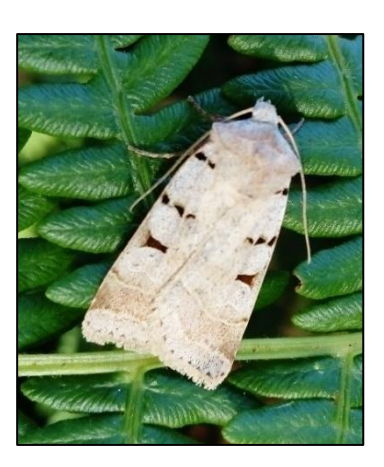
Fig. 4 Autumnal Rustic

Autumnal Rustic Eugnorisma glareosa – Uncommon and thinly distributed resident, larvae feed on herbaceous plants and heathers. Singles on 4 occasions in 2017, 2018 and 2019. (4,4)