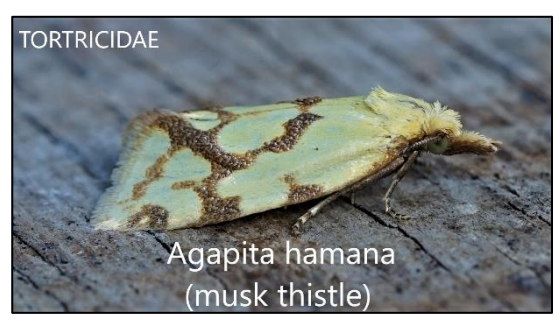
Fig. 2 Agapeta hamana

Agapeta hamana – A common and widespread resident, the larvae feed on Thistle. 9 recorded on 4 occasions in July and August 2018. (4,9)