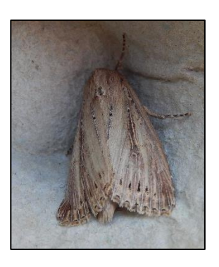
Fig. 6 Bulrush Wainscot