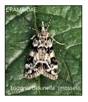
Fig. 11 Eudonia delunella