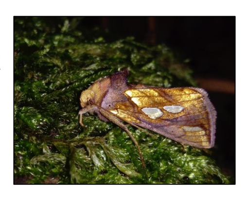
Fig. 13 Gold Spot

Gold Spot Plusia festucae – Uncommon and local resident, the larvae feed on Sedges, Yellow Iris, Bur-reed, Water Plantain. 19 recorded on 8 occasions in 2017, 2018 and 2019. Maximum 8 from the Flourish Garden on 22<sup>nd</sup> July 2018. (8,19)