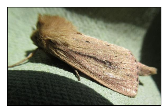
Fig. 19 Webb's Wainscot

Webb's Wainscot Archanara sparganii (Nationally Scarce B) – Scarce and restricted resident the larvae feed on Reedmace, Lesser Reedmace, Yellow Iris, Branched Bur-reed. Singles on 8<sup>th</sup> July 2018 and 12<sup>th</sup> September 2019. Elsewhere recorded by the MoPH project only at Arne Moors. (2,2)