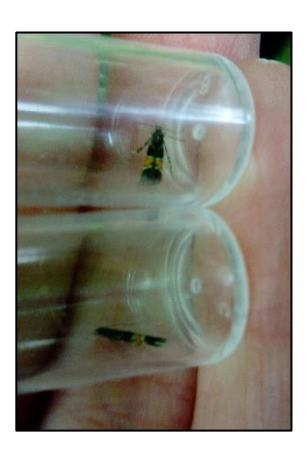
Fig. 8 Cosmopterix scribaiella