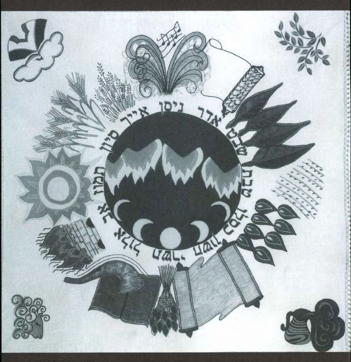
Rosh Chodesh table cloth