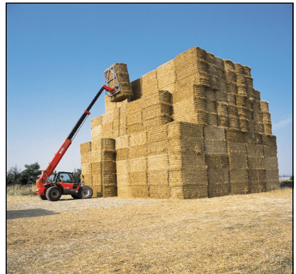
Fig. 3 The agricultural industry is one of MANITOU's core markets. Today, the noise generated by machinery used outdoors is controlled by legislation

Noise legislation is also implemented by many other countries throughout the world, for example, Japan and Australia.