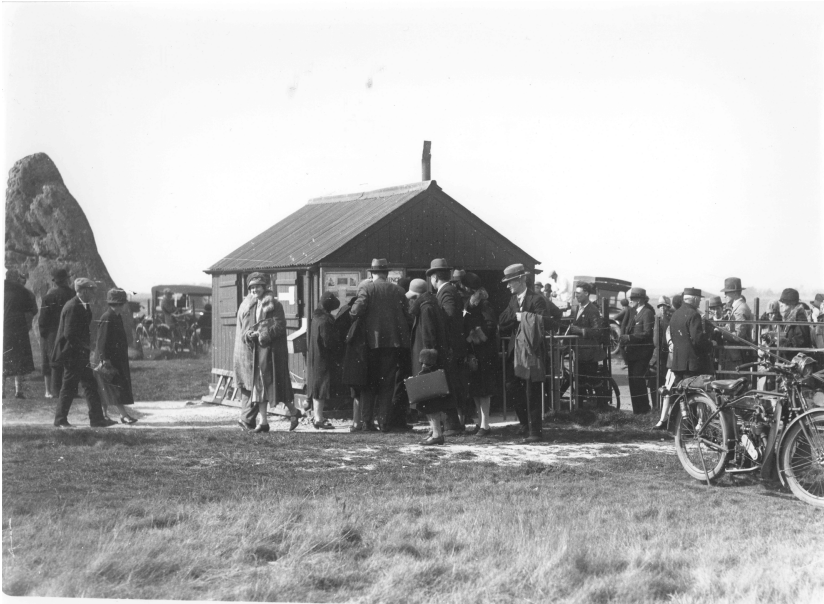
15 The controversial Stonehenge turnstile, seen here in the 1920s. ( Wiltshire Local Studies Library ).

with the man on the turnstile, and called out ‘“Come on People”. The crowd then rushed the Big Gate, and burst it open, and also tore down the wire above the Sunstone.’ About a thousand people got in without paying. 30