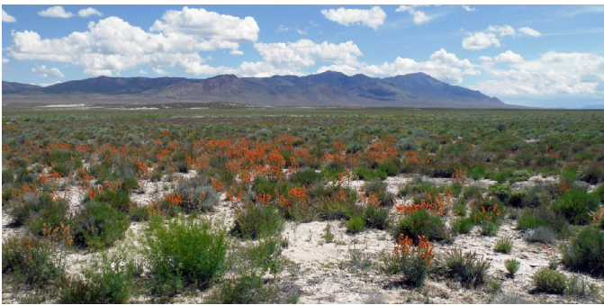
Figure 5. Gooseberry globemallow flower boom on the Colorado Plateau.

Repeat photo monitoring suggests that the timing and amount of spring precipitation may be important for episodic explosions of flowering and reproduction. Photo monitoring was conducted over a 40-year time frame in a shadscale shrubland in the Raft River Valley of south-central Idaho. The largest gooseberryleaf globemallow floral display occurred in 1964 when spring precipitation was 3 times the average. However, plants were also present and flowered, albeit much less in years when spring precipitation was below average (Sharp et al. 1990).