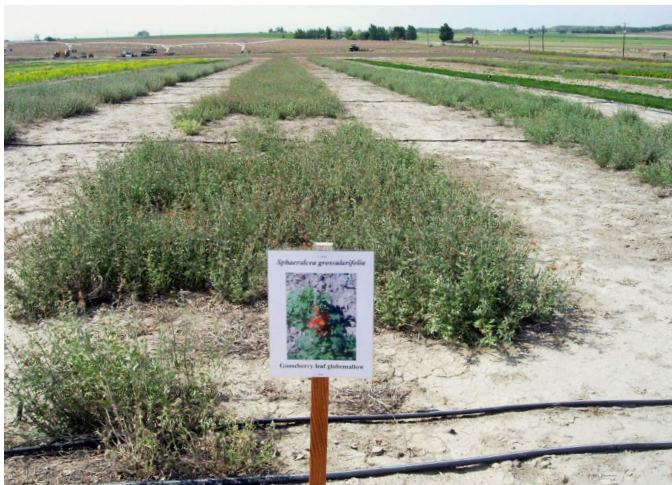
Figure 8. Gooseberryleaf globemallow seed production at Oregon State University’s Malheur Experiment Station in Ontario, OR.

In cultivated stands (Fig. 8), plants produce seed within a year of fall planting (Shock et al. 2015), but seed production in the first year may be less than in following years (Stevens et al. 1996). Seed crops can be harvested for 4 to 6 years. Seed is harvested by hand stripping, beating seed into a container, or using a combine harvester (Jorgensen and Stevens 2004). Mowing established plants in the fall concentrates the timing of seed production and provides good yields with a single combine harvest (Shock et al. 2015).