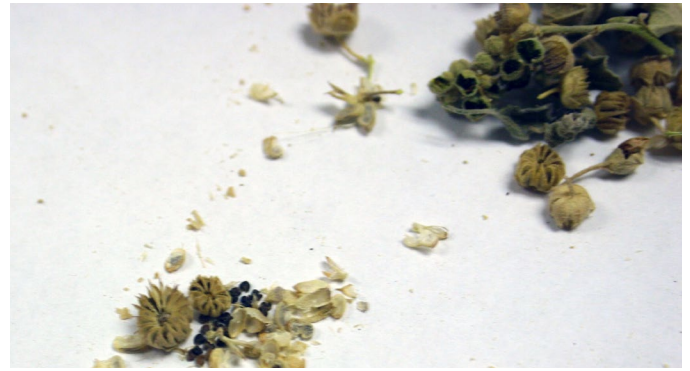
Figure 3. Gooseberryleaf globemallow schizocarps (whole fruits), mericarps (segments of the schizocarps), and individual seeds (black).

The mericarp is the structure that is dispersed at reproductive maturity. This structure naturally dehisces but unevenly over time. For the remainder of this chapter, the term seed will refer to both the mericarp and its one or two seeds.