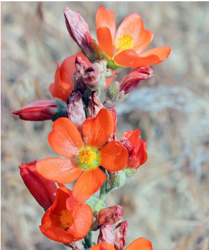
Figure 2. Gooseberryleaf globemallow flowers.

interrupted thyrsoid panicle (Fig. 2) (Mee et al. 2003). Flowers are 8 to 20 mm wide with 5 red to red-orange or red-pink petals. Stamens are numerous and coalescent, forming a tube (staminal column). Anthers are yellow (Wasser 1982; Welsh et al. 1987; Atwood and Welsh 2002; Holmgren et al. 2005; Pavek et al. 2012; La Duke 2016). Fruits are densely pubescent schizocarps, each consisting of 10 to 12 one or two-seeded mericarps (carpels) arranged in a ring (Kearney 1935; Wasser 1982; Belcher 1985; La Duke 2016). Schizocarps measure 2.5 to 3.5 mm long and are slightly less wide (2-2.5 mm) (Figs. 3 and 4). Mericarps dehisce along the upper one-third to one half, which is papery and veiny, exposing the seeds. The lower portion is indehiscent (Holmgren et al. 2005; La Duke 2016). Seeds are gray to black, kidney shaped, hairless or covered with short, soft hairs, and contain little or no endosperm. Seeds often have the lacy fruit coat attached when the mericarps dehisce naturally (Fig. 4) (Belcher 1985).