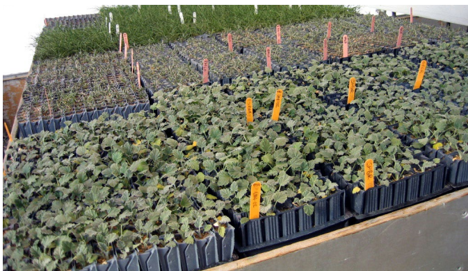
Figure 9. Gooseberryleaf globemallow container stock grown by USFS in Provo, UT.

While well suited and desirable in wildland restoration, several studies reported poor establishment following seeding. This may be a result of poor establishment conditions that failed to break seed dormancy (see Germination section) or use of seed not adapted to the restoration site.