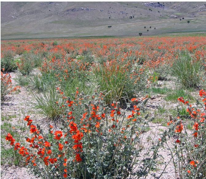
Figure 1. Gooseberryleaf globemallow growing on Milford Flat, Milford County, UT.

Habitat and Plant Associations. Gooseberryleaf globemallow is common and widespread in salt, warm, and cool desert shrublands (Fig. 1). It also occurs in the openings of mountain brush communities, pinyon-juniper ( Pinus-Juniperus spp.) woodlands, and ponderosa pine ( P. ponderosa ) forests (Blaisdell and Holmgren 1984; Welsh et al. 1987; Atwood and Welsh 2002; Stevens and Monsen 2004a). Common vegetation associates are shadscale ( Atriplex confertifolia ), big sagebrush ( Artemisia tridentata ), blackbrush ( Coleogyne ramosissima ), and rabbitbrush ( Chrysothamnus or Ericameria spp.) (Flowers 1934; Fautin 1946; Plummer et al. 1968; Horton 1989; Donart 1994; Alzerreca-Angelo et al. 1998; Stevens and Monsen 2004a).