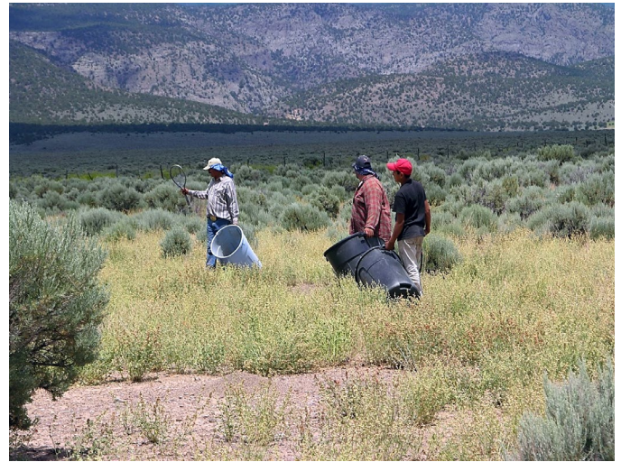
Figure 7. Collecting gooseberryleaf globemallow seed in Sevier County, UT.

Several collection guidelines and methods should be followed to maximize the genetic diversity of wildland collections: collect seed from a minimum of 50 randomly selected plants; collect from widely separated individuals throughout a population without favoring the most robust or avoiding small stature plants; collect from all microsites including habitat edges (Basey et al. 2015). General collecting recommendations and guidelines are also presented in available manuals (e.g., USDI BLM SOS 2016; ENSCONET 2018).