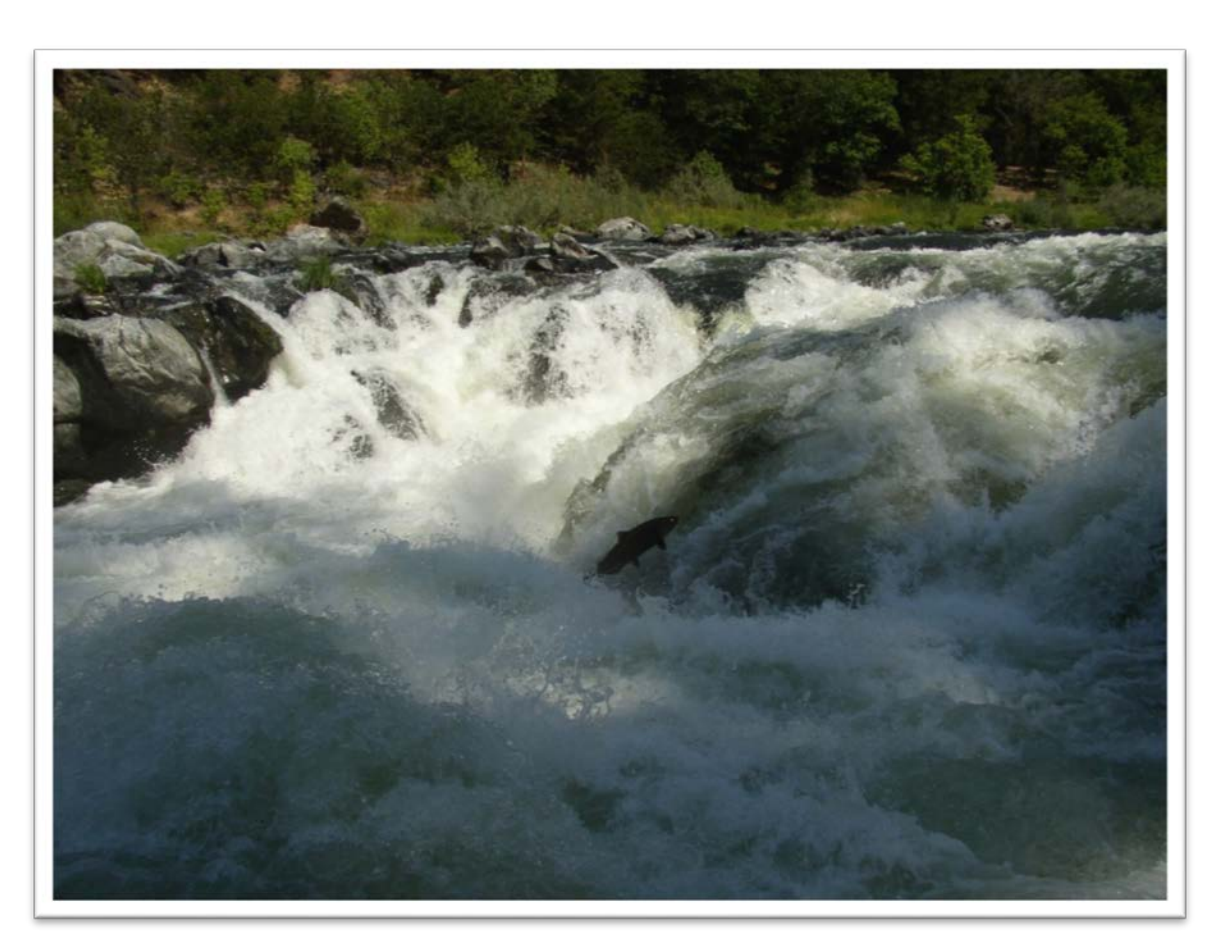
Chinook Salmon at Rainie Falls, Rogue River