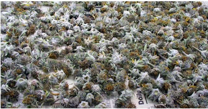
Figure 9. Collection of arrowleaf balsamroot seed heads.

and 10; Stevens and Monsen 2004; Camp and Sanderson 2007). When nearly pure stands of arrowleaf balsamroot occur on level terrain, combines or other reel-harvesters may be used for wildland harvests (Shaw and Monsen 1983). Seed vendors have developed modified reel-harvesters for use on all-terrain vehicles (S. Monsen, USFS retired, personal communication, March 2018). Van Epps and Stevens (2004) suggested that removing or flagging rocks and other vegetation in a wildland setting may allow for use of head stripper or beater equipment to efficiently harvest large amounts of wildland seed. However, recommendations are for wildland seed collections to remove less than 5% of the seed within a population (Bowen et al. 2006).