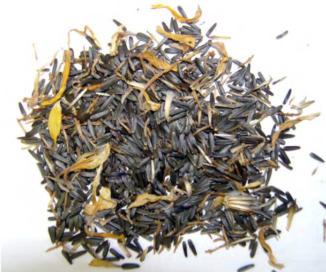
Figure 10. Collection of arrowleaf balsamroot seeds. Note appearance of petals at collection time.

Collection rates. Monsen (USFS retired, personal communication, March 2018) estimated 150 lbs (68 kg) of seed could be hand collected by 2 or 3 people over 2 or 3 days.