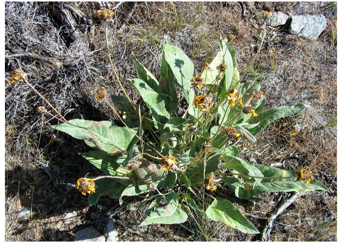
Figure 8. Appearance of arrowleaf balsamroot plants near wildland seed harvest time.

Wildland seed certification. Wildland seed collected for direct sale or for establishment of agricultural seed production fields should be Source Identified through the certification process that verifies and tracks seed origin (Young et al. 2003; UCIA 2015). For seed that will be sold directly, collectors must apply for certification prior to making collections. Applications and site inspections are handled by the state where collections will be made. For seed that will be used for agricultural seed fields, nursery propagation, or research, the same procedure must be followed. Seed collected by some public and private agencies following established protocols may enter the certification process directly, if the protocol includes collection of all data required for Source Identified certification (see Agricultural Seed Field Certification section). Wildland seed collectors should become acquainted with state certification agency procedures, regulations, and deadlines in the states where they collect. Permits or permission from public or private land owners is required for all collections.