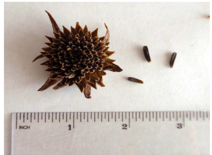
Figure 5. Arrowleaf balsamroot seed head and seeds.

Seed ripening depends on elevation and moisture and occurs later on more moist and/or higher elevation sites (USDA FS 1937). In western Montana, seed maturation at a 3,609-foot (1,100 m) site was 3 weeks earlier than at a 5,988-foot (1,825 m) site (Amsberry and Maron 2006). In a drought year when winter precipitation was 1.5 inches (3.8 cm) below average, plants began growing on March 25, about 1 month before usual, in sagebrush-bunchgrass communities at USSES. Plants were dry by May 1 and produced little seed (Pechanec et al. 1937).