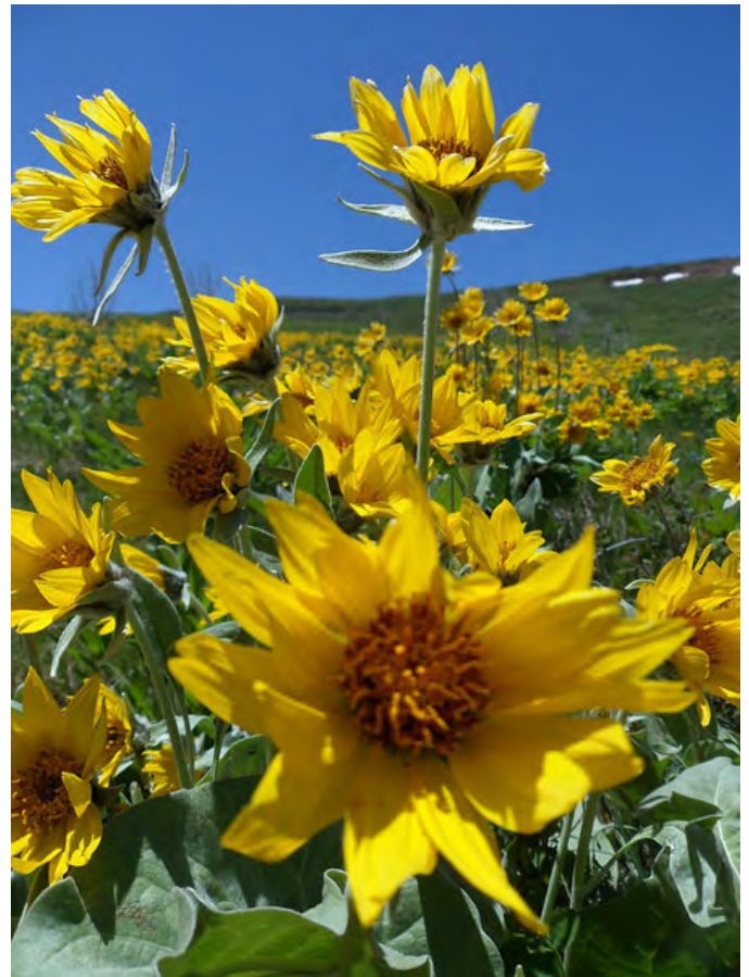
Figure 4. Arrowleaf balsamroot flowering is nearly uniform.

Flower heads are terminal on the stems and generally solitary, but can number as many as three (Fig. 4). They are 2.5 to 4 inches (6.3-10 cm) wide and are comprised of outer, yellow, female ray flowers and inner, yellow, perfect disk flowers (USDA FS 1937; Hitchcock and Cronquist 1973; Welsh et al. 1987; Taylor 1992; Weber 2006; LBJWC 2017). The number of ray flowers ranges from 8 to 25 but is most commonly between 13 and 21 (Stubbendieck et al. 1986; Cronquist et al. 1994). Both ray and disk flowers are fertile and produce seed, although the greatest percentage of seed is produced by disk flowers (Monsen, USFS [retired], personal communication, March 2018). Fruits are smooth, 3- to 4-angled cypselas up to 0.75 inch (2 cm) long and 2 mm wide (Wasser 1982; Belcher 1985; Welsh et al. 1987; Hickman 1993). Cypselas are brown to black when mature and lack a pappus or bristles (USDA FS 1937; Belcher 1985). Arrowleaf balsamroot cypselas, although not truly achenes, are widely referred to as such. Throughout this review, seed refers to the fruit or cypselas and the seed it contains. This is because the seed remains with the fruit during cleaning and it is the fruit that is planted.