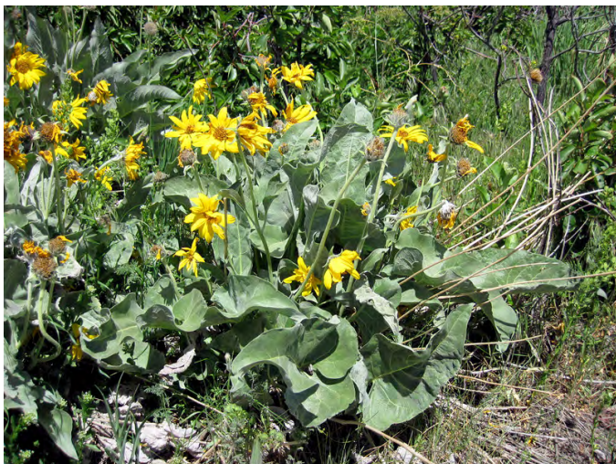
Figure 3. Arrowleaf balsamroot growing in Wyoming.

Above Ground. Plants are strongly tufted, densely leafy from the base, and large (up to 2.5 feet [75 cm] tall when flowering) (Fig 3; Blaisdell 1958; Welsh et al. 1987). Weaver (1915) counted up to 39 individual shoots arising from a single crown measuring 9 inches (23 cm) in diameter. Stems are almost leafless and end in large, yellow, typically solitary, sun-flower like inflorescences (Weber 2006; Pavek et al. 2012; LBJWC 2017). Stems and basal leaves are covered in dense soft hairs giving them a gray-green color (Hitchcock and Cronquist 1973; Weber 2006). Young leaves are silver with fine, felt-like hairs, especially on the undersides, but leaves become less hairy and greener with age (Hitchcock and Cronquist 1973). Basal leaves are arrowhead to heart-shaped and up to 18 inches (46 cm) long and 6 inches (15 cm) wide with long petioles. Stem leaves, if present, are few and reduced, almost bract-like (Welsh et al. 1987; Taylor 1992; Cronquist et al. 1994).