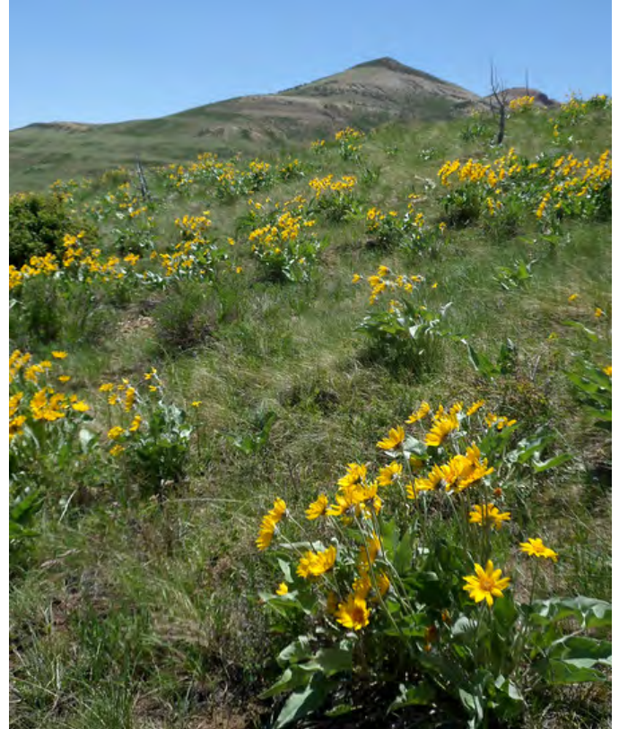
Figure 1. Arrowleaf balsamroot growing in Wyoming grassland.

Idaho fescue-bluebunch wheatgrass-arrowleaf balsamroot vegetation type is common on warm, moist sites, and the bluebunch wheatgrass-Sandberg bluegrass ( Poa secunda )-arrowleaf balsamroot vegetation type is common on hot, dry sites (Powell et al. 2007).