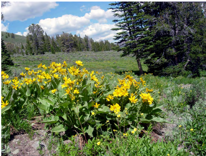
Figure 2. Arrowleaf balsamroot growing in mixed-conifer forest openings in central Idaho.

Woodlands. In open, low- to mid-elevation conifer (Fig. 2) and quaking aspen woodlands, arrowleaf balsamroot can be abundant. It is a characteristic species of western juniper ( J. occidentalis )/big sagebrush/bluebunch wheatgrass rangeland types (Shiflet 1994). In the Steens Mountains of southeastern Oregon, it was positively associated with increasing soil moisture in western juniper encroached vegetation on south-facing slopes when stands across a heterogeneous landscape were evaluated (Peterson and Stringham 2009).