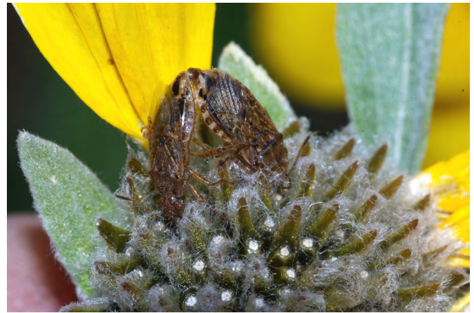
Figure 6. Lygaeid bug (Lygaeidae) feeding on arrowleaf balsamroot seeds.

Predation. Seed production is commonly limited by predation by insects and mammals (Fig. 6). In western Montana, lepidopteran larvae (Tortricidae) and tephritid (Tephritidae) and cecidomyiid (Cecidomyiidae) fly larvae fed on arrowleaf balsamroot flowers (Amsberry and Maron 2006). Lepidopteran larvae were the most abundant and damaging flower herbivores. Of 902 seed heads sampled, 68% were damaged by lepidopteran larvae. Plants also lost an average of 5.9 flower heads or 43% of total good seed heads produced to small mammal and ungulate herbivores, often as seed was maturing (Amsberry and Maron 2006). Deer mice ( Peromyscus maniculatus ) preyed heavily on arrowleaf balsamroot seed in grasslands of western Montana. In the summer and fall of a single year, deer mice removed all seed provided in experiments, and seedlings were almost entirely restricted to areas protected from deer mice (Pearson and Callaway 2008). For more on plant and seed predation, see Grazing Response and Wildlife and Livestock Use sections.