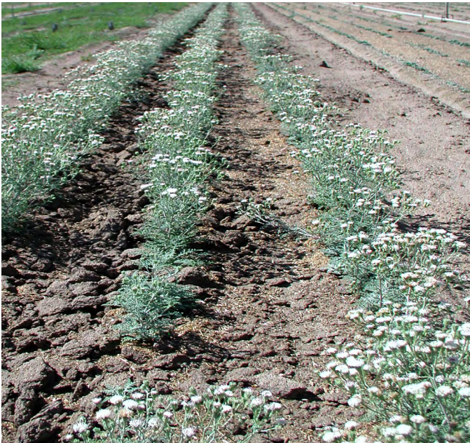
Figure 6. Douglas' dustymaiden seed production plot at the USFS Lucky Peak Nursey.

Program for native field certification for native plants, which tracks geographic origin, genetic purity, and isolation from field production through seed cleaning, testing, and labeling for commercial sales (Young et al. 2003; UCIA 2015). Growers should use certified seed (see Wildland Seed Certification section) and apply for certification of their production fields prior to planting. The systematic and sequential tracking through the certification process requires pre-planning, understanding state regulations and deadlines, and is most smoothly navigated by working closely with state regulators.