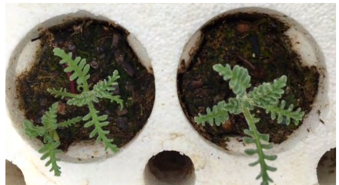
Figure 7. Container-grown Douglas' dustymaiden seedlings.

Container plants were produced in Boise, Idaho, by placing sown containers outside in December (DeBolt and Barrash 2013). Emergence began after 2 months and was complete after 4 months. Seedlings were transferred to 5.5-inch containers when secondary leaves developed. Seedlings were grown outside for 6 months, and when observed, flower stalks were removed to promote vegetative growth. Seedlings were outplanted in October.