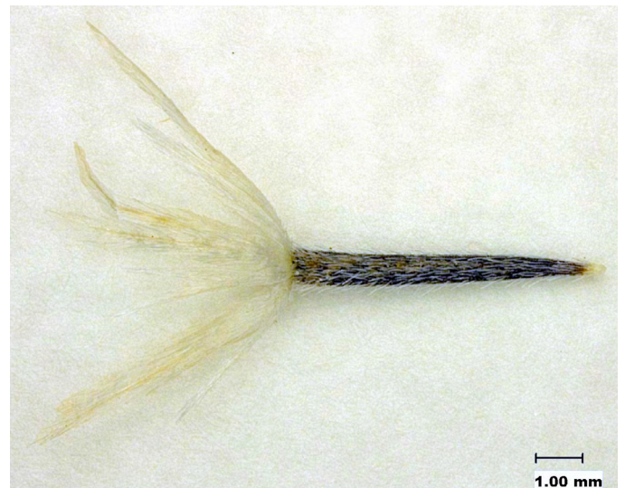
Figure 3. Douglas' dustymaiden achene with pappus.