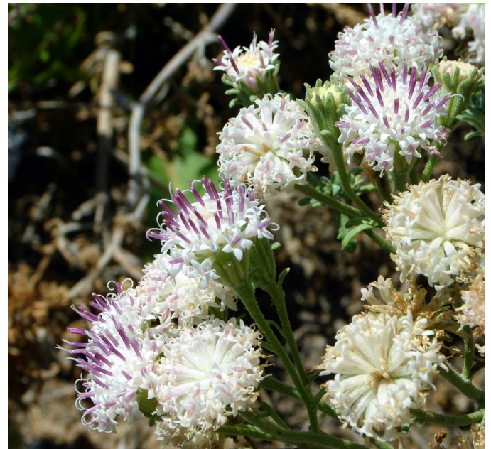
Figure 2. Douglas' dustymaiden flowers.

Flowering is indeterminate and occurs in the first year (Shock et al. 2014c). Flowers can be found anytime from April to September in the Intermountain West (Anderson and Holmgren 1976; Cronquist 1994; Parkinson and DeBolt 2005). Flowers in June and July are most typical (LBJWC 2017).