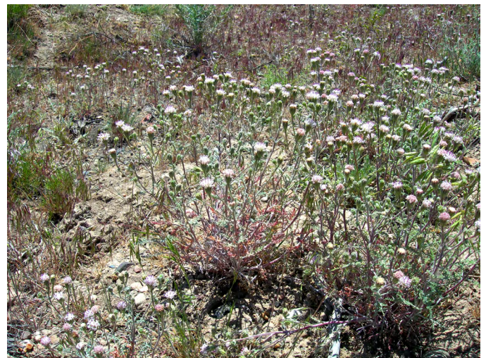
Figure 1. Douglas' dustymaiden in natural rangeland habitat.

Douglas' dustymaiden was common on silver mine dumps near Park City, Utah, visited about 45 years after the end of surface mining operations (Alvarez et al. 1974). It occurred on sites where average mid-July soil temperature averaged 62.2° F (16.8 °C) at 15 inches (38 cm) deep, phosphorous levels averaged 784 µg/300 cc of soil, and calcium levels averaged 376 mg/300 cc of soil. Density of the species increased significantly ( P = 0.01 ) with increasing soil phosphorus (Alvarez et al. 1974). On sulfide-bearing waste areas left from copper pit mining operations at the Bingham Canyon Mine in Utah, Douglas' dustymaiden occurred on both saline (0.06-0.5 dS/m) and low to neutral pH (4.2-7.9) soils (Borden and Black 2005).