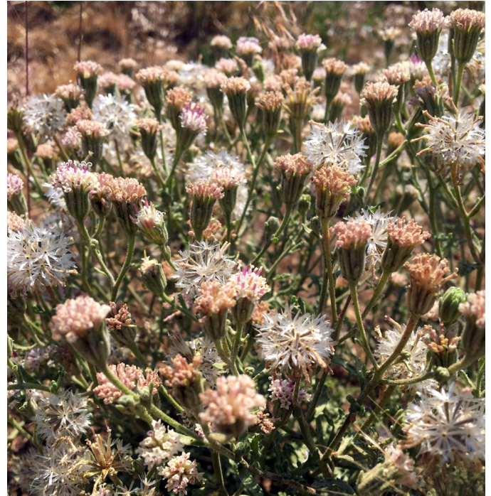
Figure 5. Uneven seed ripening is typical for Douglas' dustymaiden.

Estimates of seed maturation and fill to determine adequacy of sites for collection and collection timing can be made using a cut test or X-ray test. The 'pop test' described by Tilley et al. (2011) may be a useful predictor of seed fill (See Seed Testing section).