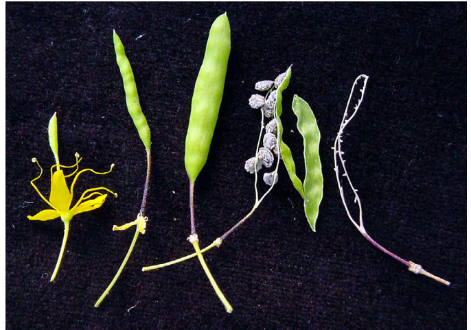
Figure 5. Yellow bee-plant flowers, fruits, and seeds. From left to right: perfect flower, immature and mature fruits (pods), fruit with the valves removed leaving the loop-like placenta (replum) and seeds, and placenta with the seeds removed.

the upper leaf axils (Welsh et al. 2016). Flowering begins at the base of the inflorescence and continues upward as the inflorescence elongates (Fig. 4). Thus, older perfect flowers are pollinated, lose their petals, develop pods, and disperse seed while new flowers continue to open near the apex of the elongating inflorescence. Dehiscence of mature fruits occurs when the two halves (valves) of the pod separate from the loop-shaped placenta (replum), which remains on the plant and dehisces separately (Iltis 1958). Seeds then begin dispersing from the placenta (Fig. 5).