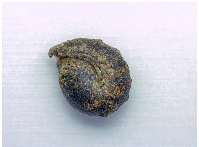
Figure 6. Mature, dark, yellow bee-plant seed.

Breeding system. Cane (2008) found that yellow bee-plant flowers of open-pollinated plants produced two to three times as much fruit as caged plants that received one of three artificial pollination treatments. Caged plants were manually fertilized to compare same flower fertilization (autogamy), fertilization with pollen from a different flower on the same plant (geitonogamy), and cross-pollination (xenogamy). Similar proportions of flowers set fruits in each of the three treatments, indicating that perfect flowers were fully self-fertile. Average counts of viable (dark-colored) seeds (Fig. 6) per silique were comparable across all four treatments (Cane 2008).