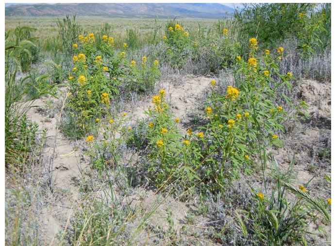
Figure 7. Early successional yellow bee-plant growing with few other species.

Yellow bee-plant is an early successional colonizer that often grows with few other species on fine- to medium-textured, well-drained soils of disturbed sites in western shrublands (Fig. 7). It spreads readily from seed, grows rapidly, and produces flowers that are both self-fertile and outcrossing. Yellow bee-plant flowers over a long period and hosts a wide array of pollinators, thus supporting pollinator populations for other species (Baker and Stebbins 1965). Flowering, seed production, and population size appear to fluctuate annually, depending upon local precipitation (Cane 2008; S. Jackman, OWPR, personal communication, February 2019). Seedlings may be frost sensitive (PFAF 2019), and plants are apparently not tolerant of competition (Pellett 1940).