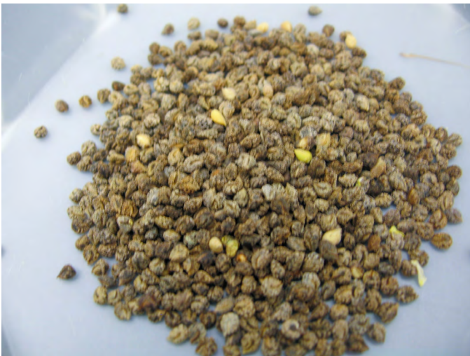
Figure 9. Clean, primarily dark colored yellow bee-plant seed.

Nursery, seed lots are first run over a scalper with top screen no. 8 and bottom screen no. 1/16. Screen sizes may require some adjustment for individual seed lots. Fine cleaning is accomplished using a Missoula dewinger (USFS Missoula Technology and Development Center, Missoula, MT) with feeder speed 4, drum speed 6, angle 8, and the air closed to remove fine chaff and non-viable seed (usually light colored) (USFS LPN 2017). At the USFS Bend Seed Extractory, large stems are removed by hand. Seed is then sieved from the seed lot using soil sieve screens, usually numbers 4, 5, or 6 to remove the pod valves and other coarse material. A Westrup LA-P de-awner (Westrup A/S, Slagelse, Denmark) is then used to break up remaining pod material and release any seed that remains in the pods. The seed lot is then sieved again to remove free seeds. If any seed remains in the pod material at that point, another cycle of de-awning and sieving is conducted. After each step, freed seeds are removed to reduce the risk of mechanical damage by repeated abrasion as well as the quantity of material yet to be cleaned (K. Herriman, USFS Bend Seed Extractory, personal communication, March 2019).