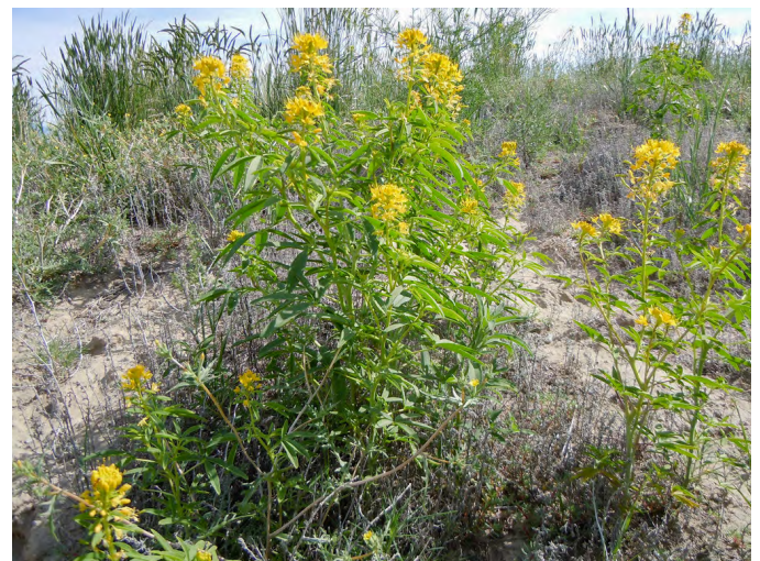
Figure 2. Yellow bee-plant growth habit showing the widely separated leaves and brush-like inflorescence.

The showy inflorescences are terminal racemes that produce densely crowded yellow flowers (Iltis 1958; Holmgren and Cronquist 2005). Bracts on the racemes are simple and much smaller than the stem leaves. Flowering is highly indeterminate, beginning at the base of the raceme and proceeding upward as the raceme elongates to about 16 inches (40 cm) in fruit (Cane 2008; Vanderpool and Iltis 2010).