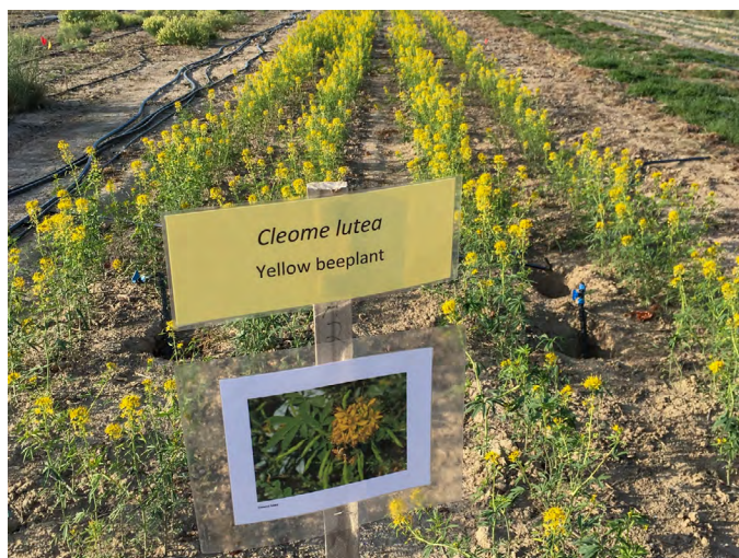
Figure 10. Yellow bee-plant irrigation trial at the Oregon State University Malheur Experiment Station, Ontario, Oregon.

2 Irrigation season from floral bud to seed set.