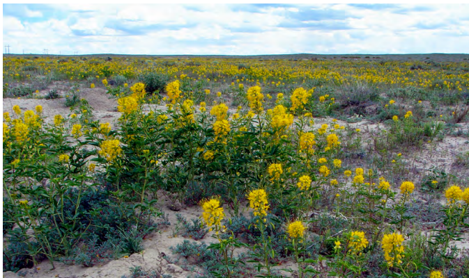
Figure 1. A large population of yellow bee-plant growing in open, disturbed habitat typical for the species.

Populations of yellow bee-plant occur in shadscale ( Atriplex confertifolia ), sagebrush ( Artemisia spp.), horsebrush ( Tetradymia spp.), greasewood ( Sarcobatus vermiculatus ), creosote bush ( Larrea tridentata ), riparian, pinyon-juniper ( Pinus-Juniperus spp.), and ponderosa pine ( P. ponderosa ) communities (Munz and Keck 1959; Vanderpool and Iltis 2010; Ogle et al. 2012; Tilley et al. 2012; Calflora 2018; Granite Seed 2019). The species spreads quickly from seed and may develop large populations on recent disturbances (Taylor 1992; Cane 2008; Ogle et al. 2012; Granite Seed 2019; LBJWC 2019).