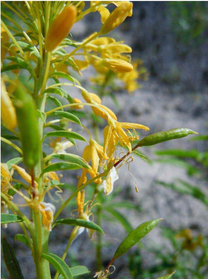
Figure 4. An indeterminate yellow bee-plant inflorescence with immature fruits near the base and progressively less mature flowers toward the apex.

Racemes alternate between production of perfect and staminate flowers as has also been noted for C. spinosa (spiny spiderflower) (Murneek 1927; Cane 2008). Staminate flower production increases when racemes are producing large numbers of fruits that require high resource input. Thus, flowering continues throughout the season, alternating between the two flower types, and fruit production occurs over a prolonged period (Cane 2008).