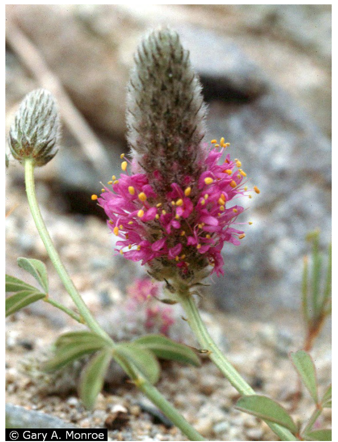
Figure 3. Blue Mountain prairie clover beginning to flower.