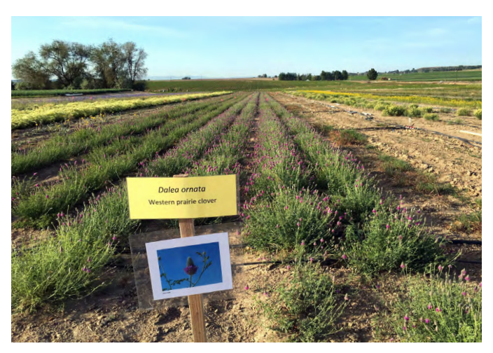
Figure 10. Blue Mountain prairie clover seed production plots growing at Oregon State University's Malheur Experiment Station near Ontario, OR.

produced in the second year and stands can be harvested for 6 years or more (Shock et al. 2017, 2018). Pollination by bees greatly improves seed yields when seed-feeding beetle populations are kept in check (Cane et al. 2012, 2013).