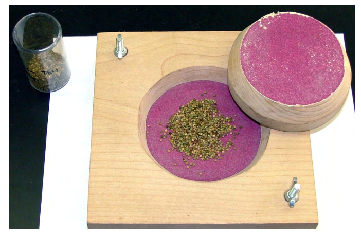
Figure 9. Apparatus used to mechanically scarify prairie clover seed with sand paper.

Germination. Blue Mountain prairie clover produces hard seeds that are physically dormant due to water impermeable seed coats. Low levels of germination (11-22%) can be expected without mechanical (Fig. 9) or acid scarification (Scheinost et al. 2009b; Bushman et al. 2015; Jones et al. 2016).