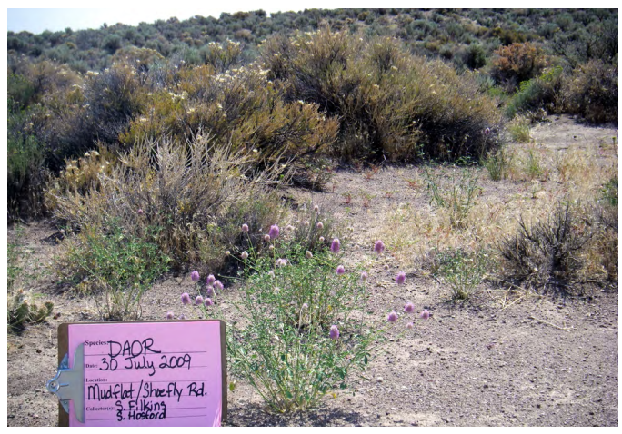
Figure 1. Blue Mountain prairie clover growing in sagebrush habitat in Idaho.

Soils. Soft clay and sandy soils from weathered basalt and volcanic ash are typical of Blue Mountain prairie clover habitats (Barneby 1977). Plants often occur on ash outcrops in Idaho and Oregon (DeBolt and Barrash 2013).