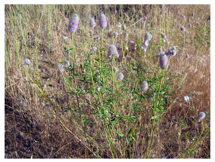
Figure 7. Blue Mountain prairie clover setting seed in Oregon.

is often immature or insect infested. Handstripped seed is typically easy to clean (M. Fisk, USGS, personal communication, 2018).