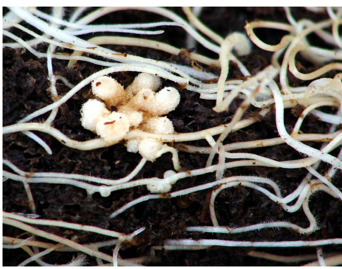
Figure 4. Root nodules on Dalea roots.

Below-Ground Relationships/Interactions. As is common with legumes, Blue Mountain prairie clover fixes nitrogen in association with rhizobial symbionts (Fig. 4) (Bushman et al. 2015).