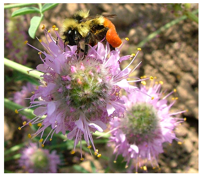
Figure 5. Hunt's bumblebee ( Bombus huntii ) visiting Blue Mountain prairie clover flowers in a common garden in Hyde Park, Utah.