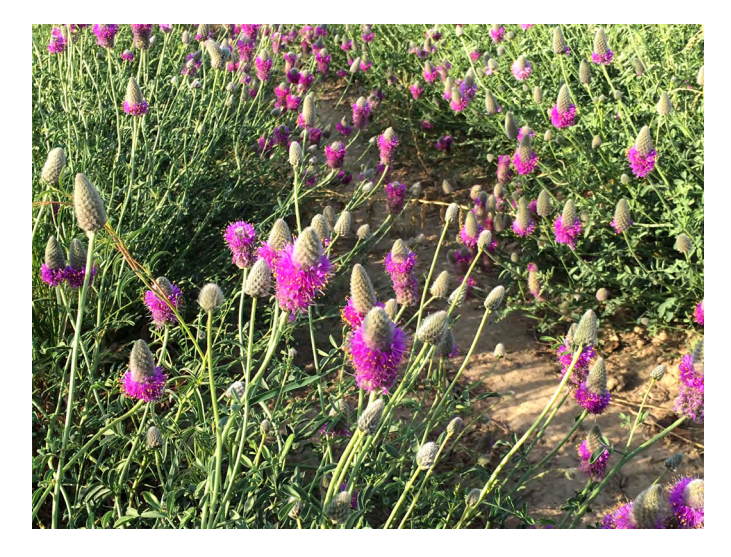
Figure 11. Blue Mountain prairie clover flowering in seed production plots growing at Oregon State University's Malheur Experiment Station near Ontario, OR.

Strong positive correlations have been reported between dry matter yield (DMY) and weight, and the number of inflorescences per plant, suggesting that selecting for high DMY would lead to greater seed yields (Bhattarai et al. 2010). For more on this common garden study, see Seed Sourcing section.