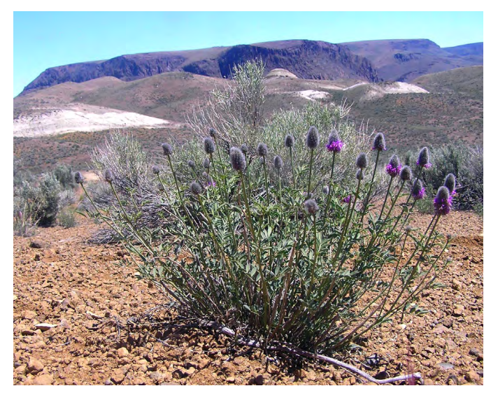
Figure 2. Blue Mountain prairie clover growing in the Succor Creek area of Oregon.

al. 2009a) with the terminal leaflet being the largest (Barneby 1977).