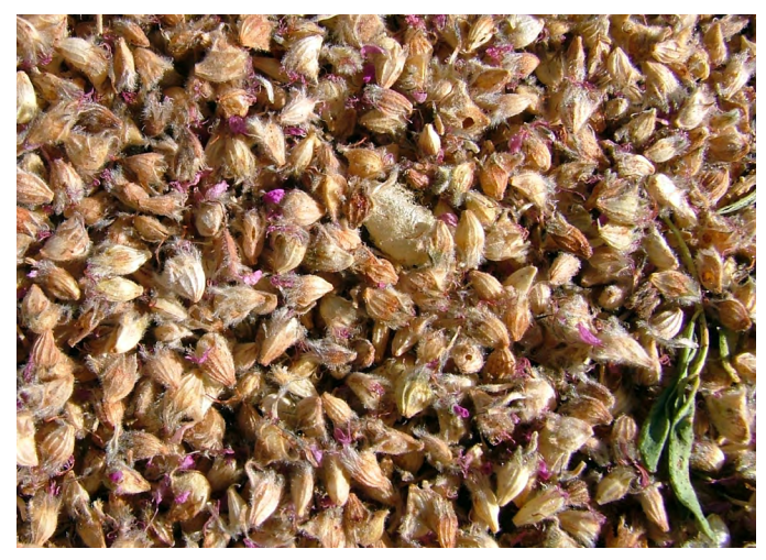
Figure 8. Bulk seed collection of prairie clover seed.

Post-collection management. Blue Mountain prairie clover is host to several seed-feeding insects. Measures to protect seed lots (Fig. 8) from insect damage are generally initiated immediately following harvest. Insecticidal strips are often placed in collection bags to reduce insect damage (Bhattarai et al. 2010). The SOS collection crews placed insecticide strips in each seed collection bag for 2 to 3 days while seed dried in open bags at room temperature (DeBolt and Barrash 2013). Seed-feeding beetles have been found in wildland and agricultural seed collections. Infestations can be detected by digital X-radiography of seed samples. There are several methods to treat insects without harming live seed. These include mechanical cleaning, fumigation, and abrupt freezing. For small wildland-collected seed lots (average size 22,800 seeds) beetles were killed with a conventional insecticide fumigant treatment of dichlorovos, which did not harm the seed (Cane et al. 2013).