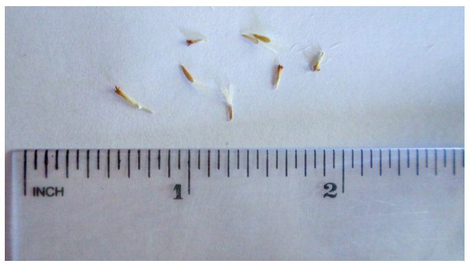
Figure 7. Dwarf yellow fleabane seed collected from native stands in Oregon.

Post-collection management. Although not specifically discussed in the literature, postcollection management of dwarf yellow fleabane seed likely requires attention similar to that of most wildland seed. Seed should be dried thoroughly before storing and if insects are suspected, insect strips can be used or seed can be stored at low temperatures to prevent substantial loss to insect damage.