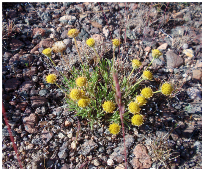
Figure 5. Dwarf yellow fleabane plant just beginning to produce seed.

Seed Cleaning. Seed cleaning procedures used by the Bend Seed Extractory for lots less than 5 lb (2,270 g) were as follows (K. Harriman, U.S. Forest Service, personal communication, April 2019). Desert yellow fleabane seed (Fig. 7) is first sieved to remove non-seed plant material. For very small seed lots, the pappus can be removed by hand-rubbing, while larger seed lots are put through a Missoula de-winger to remove the pappus. The seed lot is then sieved again to remove any material smaller than the seeds followed by processing through a continuous seed blower. If inert material remains that differs in shape or size of the seed, the lot would then be passed through a clipper seed cleaner and sieved again, if necessary (K. Harriman, U.S. Forest Service, personal communication, April 2019).