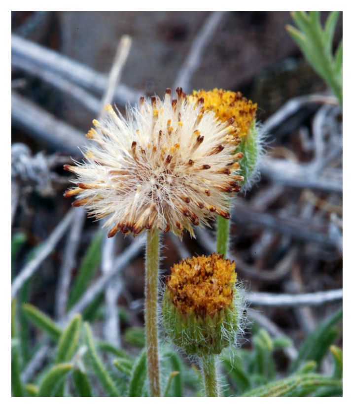
Figure 6. Erigeron chrysopsidis var. austiniae seed head.