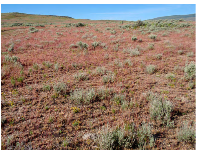
Figure 2. Dwarf yellow fleabane growing in sagebrush habitat in Oregon.

Elevation. The species ranges from elevations of 2,600 to 8,500 feet (800-2,600 m) (Cronquist et al. 1994; Nesom 2006). Variety austiniae occurs at elevations of 3,900 to 6,600 feet (1,200-2,000 m). The elevation range of variety brevifolius is 5,900 to 10,500 feet (1,800-2,300 m) and variety chrysopsidis from 2,600 to 8,500 feet (800-2,600 m) (Nesom 1992a, 2006).