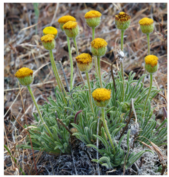
Figure 3 . Erigeron chrysopsidis var. austiniae .

Distinguishing Varieties. Dwarf yellow fleabane varieties are morphologically distinguished by their pubescence and flowers. Varieties can also often be distinguished by their distributions, which have little overlap in area and elevation. See earlier Distribution and Elevation sections.