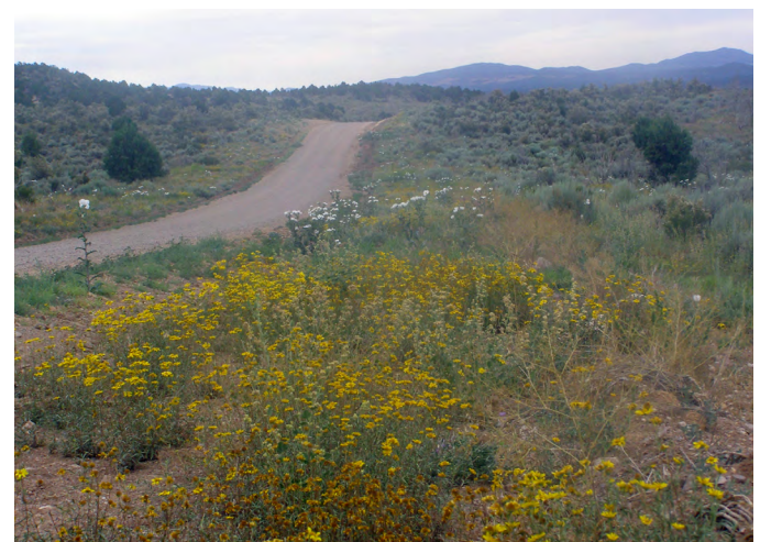
Figure 2. Variety nevadensis growing in sagebrush along a roadside in Nevada.

Variety associations. Variety nevadensis is generally found in drier and lower elevation habitats than varieties multiflora and brevifolia , although there is overlap (Welsh et al. 1987; Cronquist 1994; Stevens and Monsen 2004a). Variety multiflora often occurs in sagebrush, pinyon-juniper and other woodland types, forests, and riparian sites. Variety nevadensis is also found in sagebrush and pinyon-juniper vegetation but is sometimes found in saltbush and blackbrush communities (Welsh et al. 1987; Cronquist 1994). In montane habitats, variety brevifolia is often found in shaded areas of canyons and woodlands, variety multiflora along roadsides, on rocky valley slopes, and in open woodlands, and variety nevadensis along roadsides and on dry, rocky slopes (Schilling 2006).