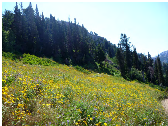
Figure 1. Showy goldeneye growing in a forest opening along a roadside in Utah.

Habitat and Plant Associations. Showy goldeneye is considered common over its range and locally abundant across a broad altitudinal range from valley grasslands to spruce ( Picea spp.) forests (USDA FS 1937). It is common along roadsides and on open, dry to moderately moist slopes receiving annual precipitation of 18 to 26 inches (450 to 650 mm) (Shaw 1958; Andersen and Holmgren 1976; Cronquist 1994; Tilley 2012). Showy goldeneye is common in basin big sagebrush ( Artemisia tridentata subsp. tridentata ), mountain big sagebrush ( A. t. subsp. vaseyana ), pinyon-juniper ( Pinus-Juniperus spp.), mountain brush, and quaking aspen ( Populus tremuloides ) communities (Shaw and Monsen 1983). It is also a common species in the tall forb rangeland type generally found at 6,300 to 9,000 feet (1,900-2,700 m) along streams, near springs, in forest openings, and in shrubland, woodland, and forest understories from the southern Wasatch range in Utah north to southern Montana (Shiflet 1994).