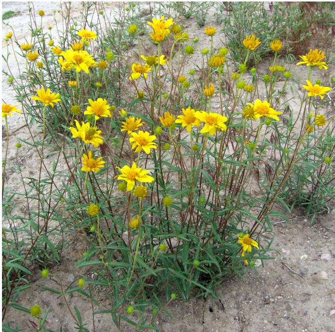
Figure 4. Heliomeris multiflora var. nevadensis growing in Utah.

to 1 inch (2.5 cm) long and the petal is notched at the tip. The central, disk-flower portion of the flower head becomes cone shaped with age (Shaw 1995; Schilling 2006). Showy goldeneye produces cypselas or false achenes, which are often referred to as achenes in the literature. The cypselas is smooth, black or gray striate, 1.2 to 3 mm long, and compressed longitudinally making 4 angles. Cypselas do not have scales or pappi (USDA FS 1937; Welsh et al. 1987; Schilling 2006).