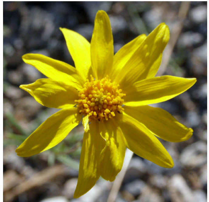
Figure 5. Flower of variety nevadensis growing in Nevada.

Reproduction. Showy goldeneye reproduces sexually from seed, which is produced by the perfect disk flowers (USDA FS 1937; Schilling 2006).