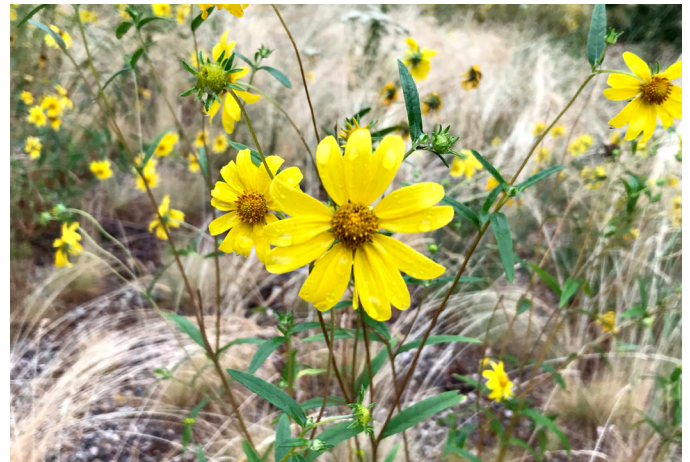
Figure 6. Showy goldeneye flowers on plants growing near Loman, ID.

Horticulture. Showy goldeneye has considerable potential for use as a horticulture specimen (Hickman 1993). It produces abundant flowers, is easily managed in landscape settings, and works well in mixed borders and meadow gardens. It is recommended for use in USDA Plants hardiness zones 4b to 10a (Tilley 2012).