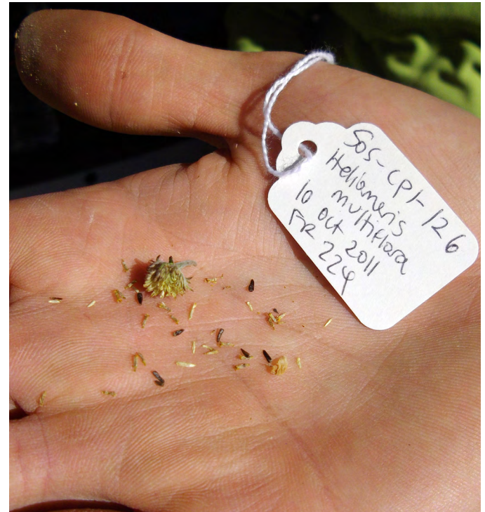
Figure 8. Showy goldeneye seed collected by BLM SOS on the Colorado Plateau.

Visual assessments of stands are useful to determine when seed is ripe. Harvests should occur when the majority of flowers have dry yellow petals that have started to fall. At this time there will be a small number of fresh flowers but most seed will be mature (Stevens et al. 1996).