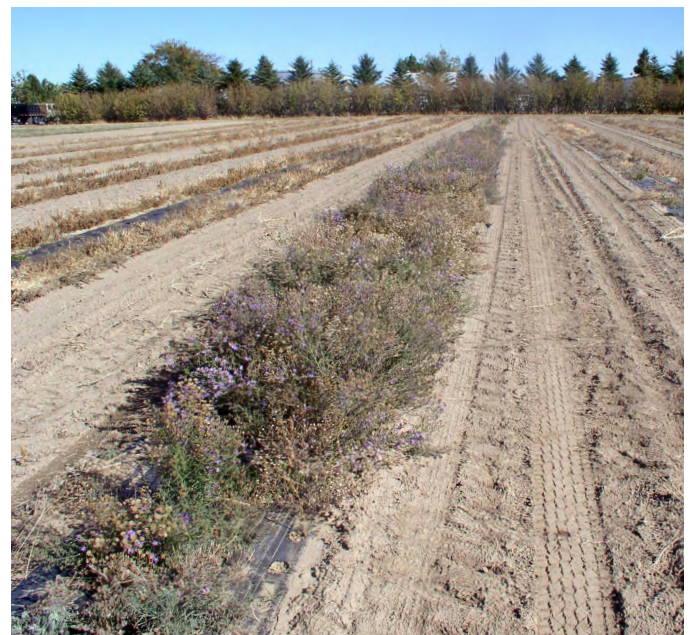
Figure 9. Hoary tansyaster seed production at the USDA NRCS Aberdeen Plant Materials Center in southern Idaho.

Agricultural Seed Certification. It is essential to maintain and track the genetic identity and purity of native seed produced in seed fields. Tracking is done through seed certification processes and procedures. State seed certification offices administer the Pre-Variety Germplasm (PVG) Program for native field certification for native plants, which tracks geographic origin, genetic purity, and isolation from field production through seed cleaning, testing, and labeling for commercial sales (Young et al. 2003; UCIA 2015). Growers should use certified seed (see Wildland Seed Certification section) and apply for certification of their production fields prior to planting. The systematic and sequential tracking through the certification process requires pre-planning, understanding state regulations and deadlines, and is most smoothly navigated by working closely with state regulators.