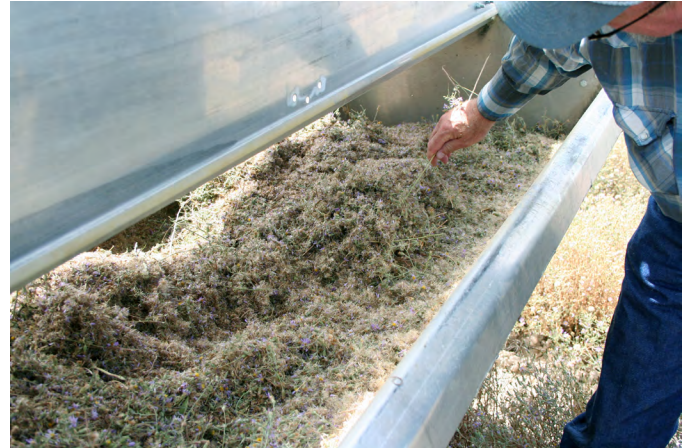
Figure 10. Hoary tansyaster harvested using a standard Flail-Vac and containing significant amounts of vegetative material.

Seed matures 4 to 5 weeks after flowering and is typically harvested in late summer or fall (DeBolt and Parkinson 2005; Tilley et al. 2014; Shock et al. 2017b) depending on variety and location. In seed fields at IPMC, plants began flowering in late summer and continued flowering for several weeks into the fall. Only hand harvesting and vacuum harvesters allowed for multiple non-destructive harvests (Tilley et al. 2014). In seed production fields at OSU MES, the earliest flowering date was August 13 and latest flowering date was October 10 in 4 years of observations (Shock et al. 2017b).