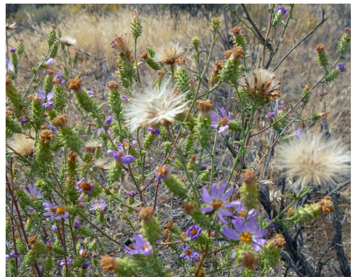
Figure 7. Indeterminate flowering of hoary tansyaster in Oregon.

Wildland seed certification. Wildland seed collected for direct sale or for establishment of agricultural seed production fields should be Source Identified through the Association of Official Seed Certifying Agencies (AOSCA) Pre-Variety Germplasm program that verifies and tracks seed origin (Young et al. 2003; UCIA 2015). For seed that will be sold directly, collectors must apply for certification prior to making collections. Applications and site inspections are handled by the state where collections will be made. For seed that will be used for agricultural seed fields, nursery propagation or research, the same procedure must be followed. Seed collected by some public and private agencies following established protocols may enter the certification process directly, if the protocol includes collection of all data required for Source Identified certification (see Agricultural Seed Certification section). Wildland seed collectors should become acquainted with state certification agency procedures, regulations, and deadlines in the states where they collect. Permits or permission from public or private land owners is required for all collections.