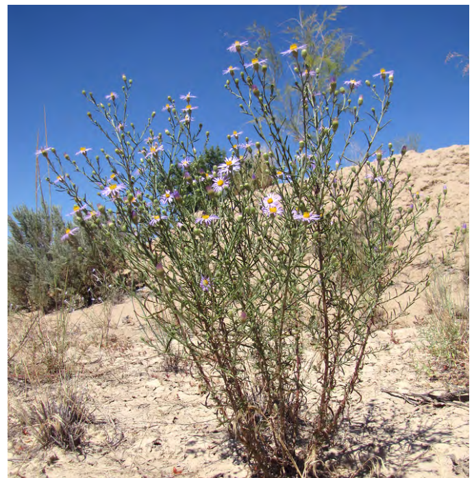
Figure 1. Hoary tansyaster growing in New Mexico.

Plants growing along roadsides in central New Mexico produced an average of 121 flower heads per plant (range: 29-260). Heads averaged 32 ray flowers (range: 26-38) and 66 disk flowers (range: 54-80) (Parker and Root 1981).