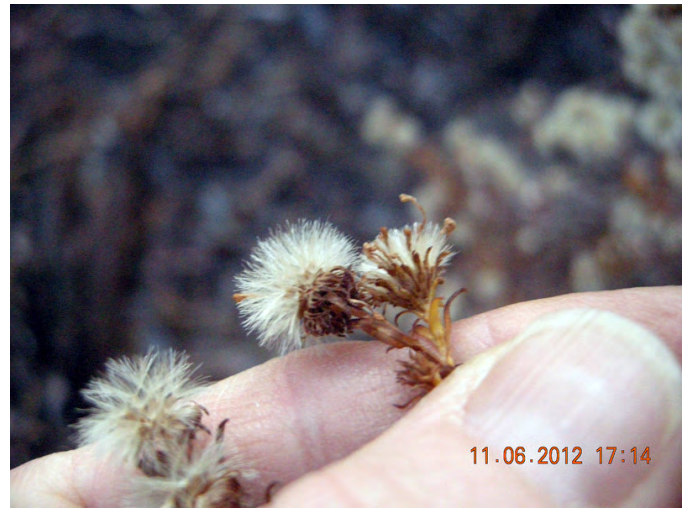
Figure 8. Collected hoary tansyaster seed heads.

Several collection guidelines and methods should be followed to maximize the genetic diversity of wildland collections: collect seed from a minimum of 50 randomly selected plants; collect from widely separated individuals throughout a population without favoring the most robust or avoiding small stature plants; and collect from all microsites including habitat edges (Basey et al. 2015). General collecting recommendations and guidelines are also presented in available manuals (e.g., USDI BLM SOS 2016; ENSCONET 2018).