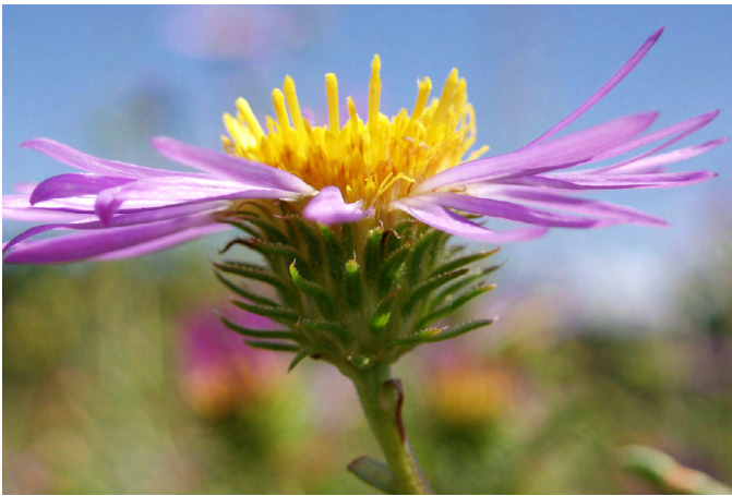
Figure 2. Lower heads on hoary tansyaster plants contain 8 to 25 purple-blue to white ray flowers and 10 or more yellow disk flowers.