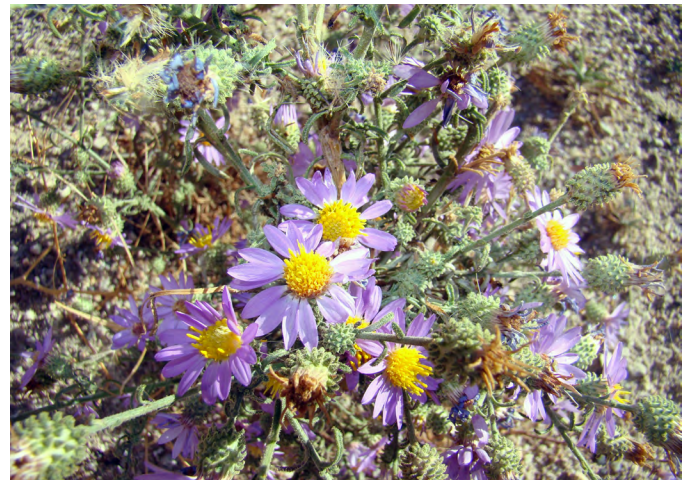
Figure 4. Hoary tansyaster displaying indeterminate flowering in Idaho.

Seeds mature within 4 or 5 weeks of flowering (DeBolt and Parkinson 2005). The very small fruits (cypselas or false achenes) have a hair-like pappus (Welsh et al. 1987; Cronquist et al. 1994; Tilley 2015a) and are easily wind-dispersed (Drezner and Fall 2002).