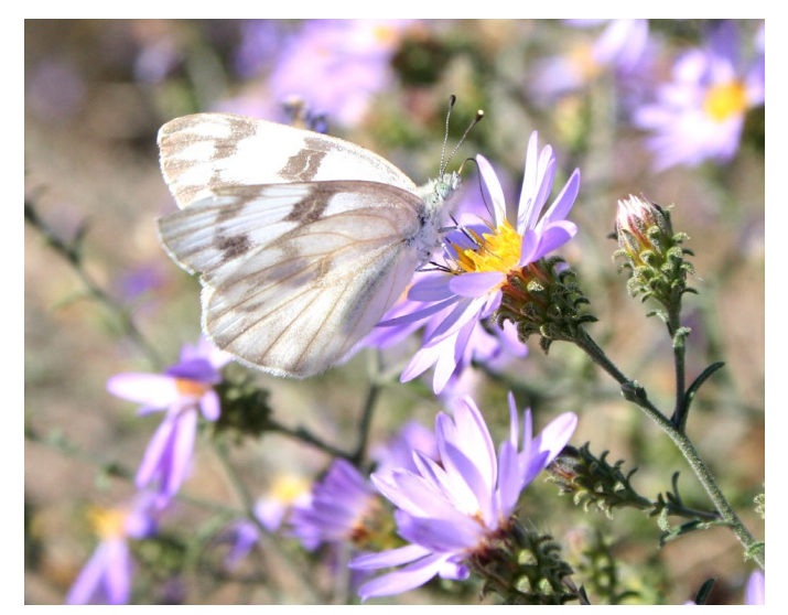
Figure 5. Cabbage white butterfly ( Pieris rapae ) on hoary tansyaster flowers at the USDA NRCS Aberdeen Plant Materials Center in southern Idaho.

Pollination. Flowers attract a variety of pollinators and are considered a valuable late summer and early fall pollinator food source (Fig. 5) (Tilley et al. 2014). In some years, some flowers are still present in mid-November, depending on plant variety and weather conditions (Tilley 2015b). In seed production fields growing at the USDA NRCS Aberdeen Plant Materials Center in southern Idaho (IPMC), hoary tansyaster flowers were visited by various bees ( Halictus spp., Agapostemon spp., and Apis mellifera ), bee flies (Diptera: Bombyliidae), western white butterflies ( Pontia occidentalis ), and garden white butterflies ( Pieris spp.) (Tilley et al. 2014, 2015b).