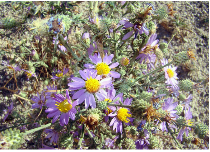
Figure 4. Hoary tansyaster displaying indeterminate flowering in Idaho.