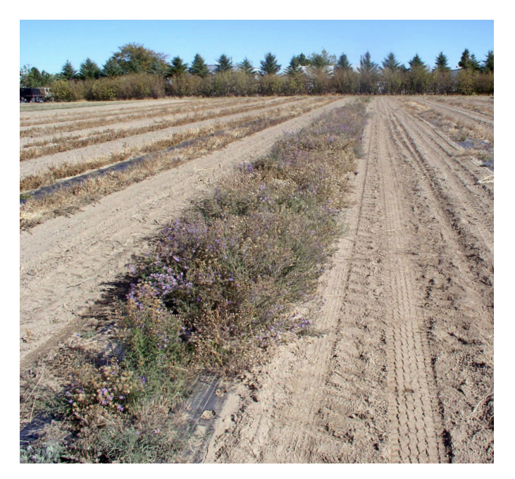
Figure 9. Hoary tansyaster seed production at the USDA NRCS Aberdeen Plant Materials Center in southern Idaho.

Agricultural Seed Certification. It is essential to maintain and track the genetic identity and purity of native seed produced in seed fields. Tracking is done through seed certification processes and procedures. State seed certification offices administer the Pre-Variety Germplasm (PVG) Program for native field certification for native plants, which tracks geographic origin, genetic purity, and isolation from field production through seed cleaning, testing, and labeling for commercial sales (Young et al. 2003; UCIA 2015). Growers should use certified seed (see Wildland Seed Certification section) and apply for certification of their production fields prior to planting. The systematic and sequential tracking through the certification process requires pre-planning, understanding state regulations and deadlines, and is most smoothly navigated by working closely with state regulators.