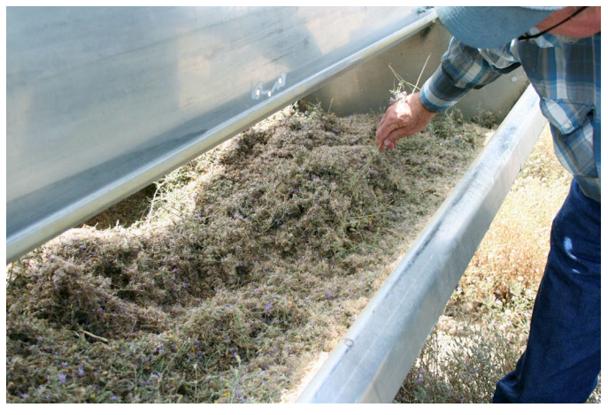
Figure 10. Hoary tansyaster harvested using a standard Flail-Vac and containing significant amounts of vegetative material.

Seed matures 4 to 5 weeks after flowering and is typically harvested in late summer or fall (DeBolt and Parkinson 2005; Tilley et al. 2014; Shock et al. 2017b) depending on variety and location. In seed fields at IPMC, plants began flowering in late summer and continued flowering for several weeks into the fall. Only hand harvesting and vacuum harvesters allowed for multiple non-destructive harvests (Tilley et al. 2014). In seed production fields at OSU MES, the earliest flowering date was August 13 and latest flowering date was October 10 in 4 years of observations (Shock et al. 2017b).