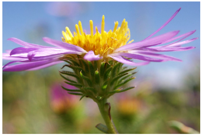
Figure 2. Lower heads on hoary tansyaster plants contain 8 to 25 purple-blue to white ray flowers and 10 or more yellow disk flowers.