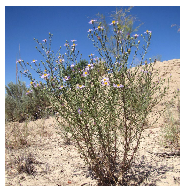
Figure 1. Hoary tansyaster growing in New Mexico.

Plants growing along roadsides in central New Mexico produced an average of 121 flower heads per plant (range: 29-260). Heads averaged 32 ray flowers (range: 26-38) and 66 disk flowers (range: 54-80) (Parker and Root 1981).