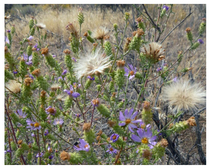
Figure 7. Indeterminate flowering of hoary tansyaster in Oregon.

Wildland seed certification. Wildland seed collected for direct sale or for establishment of agricultural seed production fields should be Source Identified through the Association of Official Seed Certifying Agencies (AOSCA) Pre-Variety Germplasm program that verifies and tracks seed origin (Young et al. 2003; UCIA 2015). For seed that will be sold directly, collectors must apply for certification prior to making collections. Applications and site inspections are handled by the state where collections will be made. For seed that will be used for agricultural seed fields, nursery propagation or research, the same procedure must be followed. Seed collected by some public and private agencies following established protocols may enter the certification process directly, if the protocol includes collection of all data required for Source Identified certification (see Agricultural Seed Certification section). Wildland seed collectors should become acquainted with state certification agency procedures, regulations, and deadlines in the states where they collect. Permits or permission from public or private land owners is required for all collections.