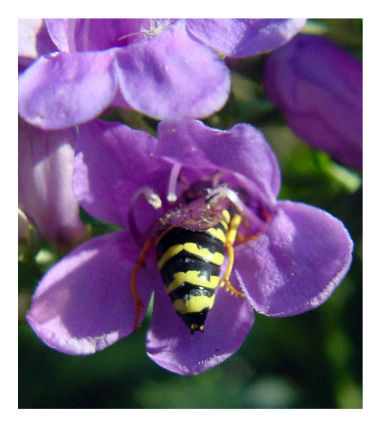
Figure 5. Royal penstemon visited by a solitary pollen wasp.

Pollination. Cane and Love (2016) inventoried pollinator abundance and diversity at native forbs used in restoration to estimate their "pollinator friendliness." Surveys were conducted at four Nevada sites in sagebrush steppe and its ecotones with pinyon-juniper woodlands. Solitary native bees of the genus Osmia (Mason bees) comprised half of the observed pollinators at royal penstemon (Cane and Love 2016), while the solitary pollen wasp (Pseudomasaris vespoides), which may sleep in the flowers at night (Nold 1999), accounted for 19.8% of the observed pollinators (Fig. 5). The remaining pollinators included the bee genera Anthophora (digger bees, 2.7%), Bombus (bumblebees, 8.1%), Ceratina (small carpenter bees, 0.9%), Halictus (sweat bees, 11.7%), Hoplitis (Mason bees, 1.8%) and Lasioglossum (sweat bees, 3.6%). Two Mason bees (Osmia brevis and O. penstemonis) and the solitary pollen wasp were pollen specialists