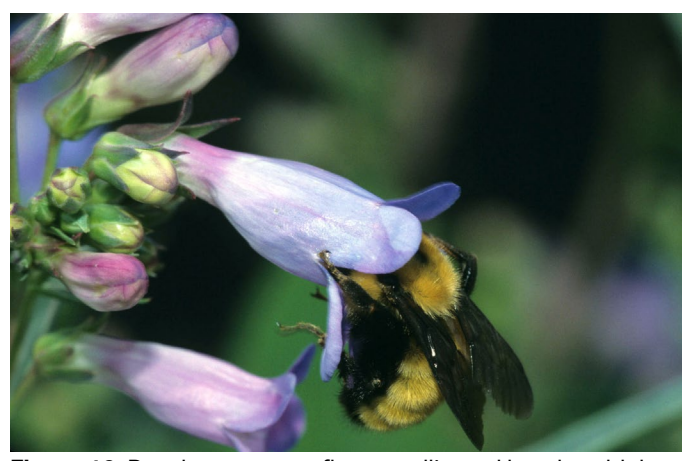
Figure 10. Royal penstemon flower pollinated by a bumblebee ( Bombus spp.).

Irrigation. Subsurface drip Irrigation requirements for royal penstemon were examined at OSU MES using subsurface drip irrigation (Shock et al. 2015b). This system provides precise application of water directly to the root system and away from crown tissues. This minimizes water use and reduces water availability to weed seeds. Drip lines were placed 12 inches (30 cm) deep between alternate rows (30-inch [76-cm] row spacing). Zero, 4, or 8 inches (0, 100, 200 mm) of supplemental water was added in four equal applications at 2-week intervals beginning with flowering. From 2006 to 2015, irrigation began between April 19 and May 20 (x̄ = May 5) and ended between June 3 and June 5 (x̄ = June 18). Seed yield of royal penstemon demonstrated a quadratic response to irrigation with the maximum response with 5 inches (130 mm) of irrigation. Irrigation of 4 to 8 inches (100-200 mm) supplemental water was recommended for warm, dry years, and none for cool, wet years (Shock et al. 2016).