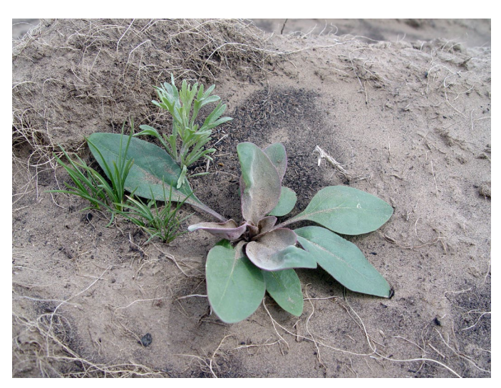
Figure 12. Royal penstemon seedling emerging from a post-fire seeding in southern Idaho.

be planted in spots prepared to limit competition. Initial watering may be required for planted seedlings if the soil is dry.