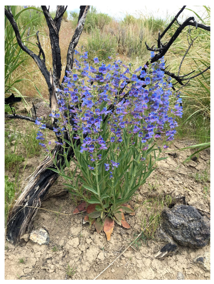
Figure 6. Royal penstemon one year after wildfire.

experienced under a snow pack followed by 4 weeks of incubation at 50 to 68 °F (10-20 °C) in light increased germination to 70%. Germination increased to 90% with 24 weeks of prechilling (Meyer and Kitchen 1994).