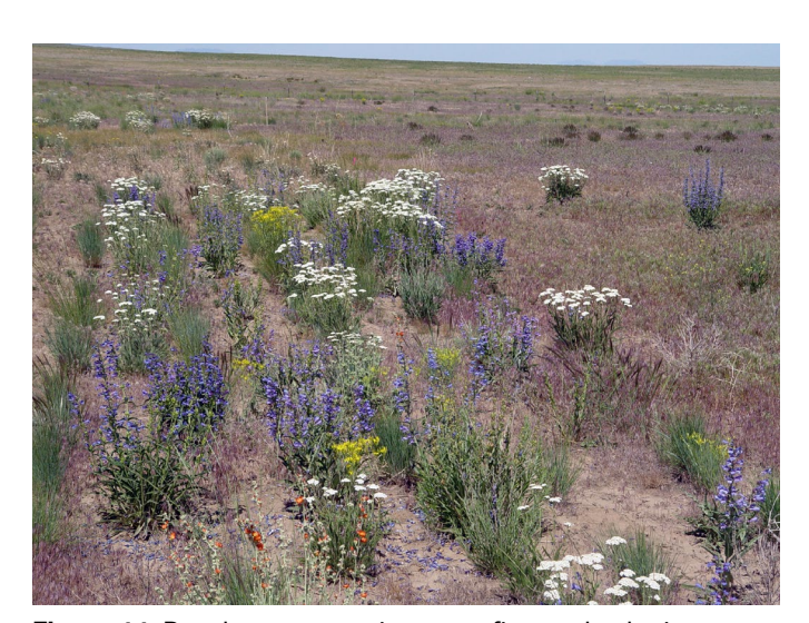
Figure 11. Royal penstemon in a post-fire study plot in southern Idaho.

Because of the low competitive ability of royal penstemon with cheatgrass (Parkinson 2008, Parkinson et al. 2013), it should be seeded in areas where cheatgrass seed density has been reduced by wildfire or other treatments and is not expected to recover rapidly (Ott et al. 2016b). To avoid competition with more rapidly growing seeded grasses and forbs having similar root morphologies, royal penstemon should be seeded in separate rows or areas, either alone or with other slow growing species with different rooting habits (Fig. 11; Parkinson 2008). This would reduce spatial overlap and interspecific competition for resources while increasing the diversity of species and life forms. Cane et al. (2007) suggested that royal penstemon pollinators Osmia brevis and O. penstemonis may have shallow underground nests, in which case they and the surface nesting Pseudomasaris vespoides would be susceptible to soil heating by wildfires (Cane and Neff 2011) or soil disturbance resulting from mechanical site preparation practices. Loss of specialist pollinators would restrict seeding of royal penstemon to areas near native vegetation that are likely to harbor the pollinators (Cane and Love 2016).