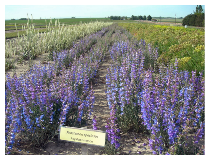
Figure 8. Royal penstemon irrigation test plots at OSU MES, Ontario, Oregon.

In 2013 establishment was improved ( P < 0.05) relative to the control (0.1% stand) only by combinations that included row cover and seed treatment. The addition of sawdust or sawdust and sand did not result in further significant increases. The range for these treatments was 27 to 33.1% (Shock et al. 2014). In April 2014, only the combination of row cover, seed treatment, sawdust and sand (12.2% stand) improved stand compared to the control (0.7% stand) ( P < 0.05) for plots planted in fall 2013 (Shock et al. 2015a).