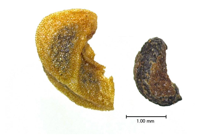
Figure 3. Royal penstemon seeds.