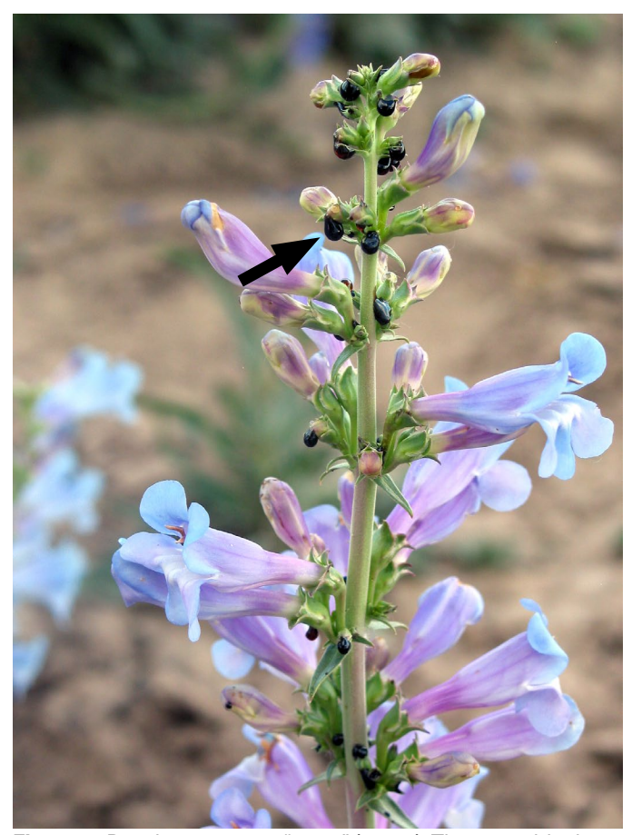
Figure 9. Royal penstemon "tears" (arrow). These are black tar-like drops produced near flower buds following lygus bug predation.

peak flowering for royal penstemon. Prolonged infestation and low seed set resulted from an early hatch in 2007 that was not adequately controlled by the insecticide treatment (Aza-Direct® [ai.: azadirachtin] at 0.0062 lb ai./ha, applied in May). Capture at 0.1 lb/acre and Orthene at 8 oz/acre (a contact and residual systemic) were applied during flowering or pre-flowering in subsequent years to control lygus bugs (Shock et al. 2016).