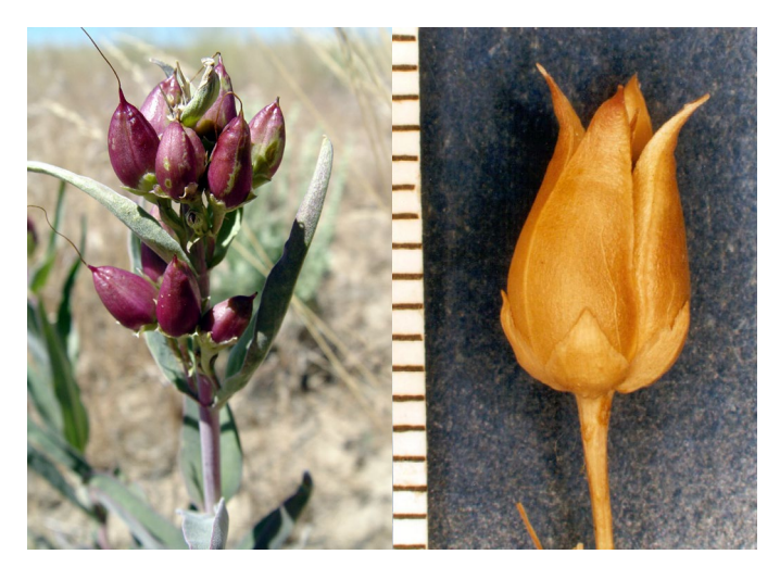
Figure 2. Royal penstemon with immature capsules (left) and mature capsule (right; scale in mm).

The fruit is a capsule, 0.2 to 0.6 inch (0.6-1.5 cm) long that opens apically. It becomes dry and parchment colored at maturity (Fig. 2). Seeds are brown, 2 to 2.5 (3.5) mm long, somewhat elongate and three-angled (Fig. 3; Cronquist et al. 1984; Hickman 1993; Hurd n.d). The embryo is slightly curved and embedded in living endosperm (Fig. 4; Hurd n.d.). Seeds are gravity dispersed.