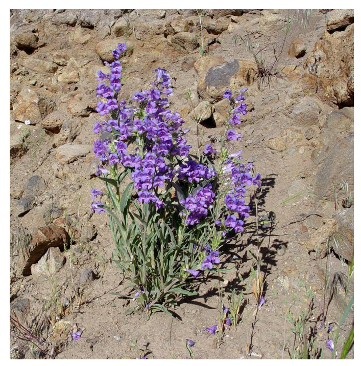
Figure 1. Royal penstemon plant in southeastern Oregon.

leaves are reduced upward, linear to lanceolate, subcordate, clasping, and folded lengthwise or flat (Cronquist et al. 1984; Hickman 1993). Leaves and stems may be purplish tinted. The inflorescence is an elongate, one-sided thyrse, an inflorescence with an indeterminate main axis and determinate subaxes (Fig. 1). There are sometimes thyrsoid branches from the lower nodes (Cronquist et al. 1984; Hickman 1993). Flowers are produced in 4 to 12 closely-spaced verticillasters (false whorls) along the inflorescence (Strickler 1997).