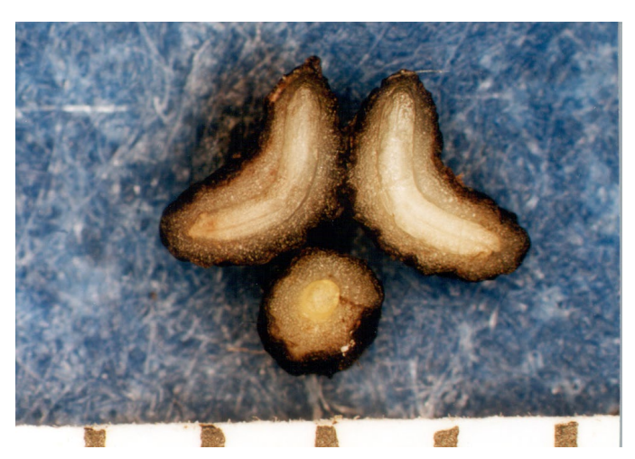
Figure 4. Royal penstemon seed: cross section and longitudinal sections. The embryo is surrounded by endosperm and the seed coat. Scale in mm.

Reproduction. Royal penstemon reproduces entirely from seed.