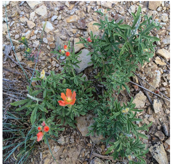
Figure 2. Scarlet globemallow growing in gravelly soil in Wyoming.

yellow stamens, which are joined at the base around the style (Spellenberg 2001; La Duke 2016). The staminal column is 3 to 5 mm long (Holmgren et al. 2005). Fruits are segmented schizocarps (4.8-6.7 mm in diameter) (Fig. 3), which split into 8 to 14 mericarp sections (Welsh et al. 1987; Holmgren et al. 2005; La Duke 2016). The schizocarps and their mericarps have stellate pubescence, similar to that of the stems and leaves (Craighead et al. 1963). Mericarps are prominently veiny and contain one kidney shaped, brown to black seed (Stubbendieck et al. 1986; Holmgren et al. 2005; La Duke 2016).