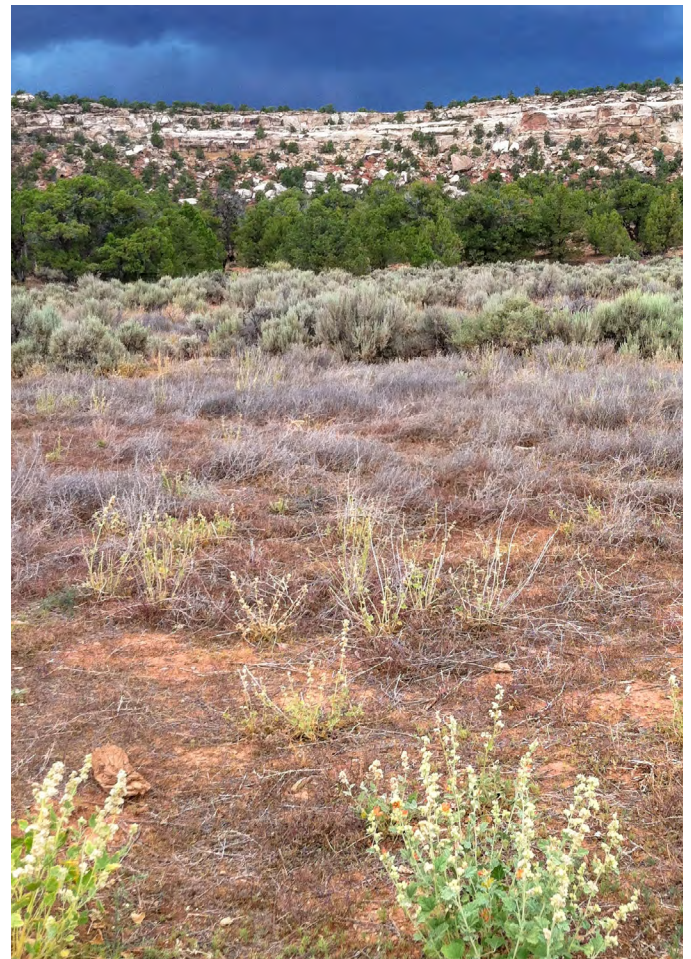
Figure 6. Scarlet globemallow with ripe schizocarps.

Wildland Seed Collection. Scarlet globemallow is one of the earliest flowering globemallows (La Duke 2016). Indeterminate flowering and seed production mean collections may be made at a single site for weeks (Hewitt 1980) and across sites for months (USDI BLM SOS 2017). Seed is released once schizocarps are fully mature, so careful monitoring once plants begin to flower is needed to maximize wildland seed collections (Fig. 6) (Shock et al. 2015). In 1997, between 50 and 1,000 lbs (20-450 kg) pure live seed (PLS) of wild-collected scarlet globemallow seed was available (McArthur and Young 1999).