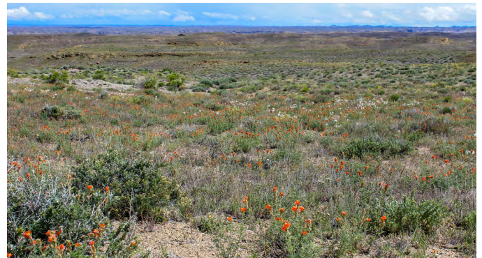
Figure 1. Scarlet globemallow growing in typical shrubland/grassland habitat in Utah.

woodlands. In the Intermountain West, scarlet globemallow occurs with greasewood ( Sarcobatus spp.), saltbush ( Atriplex spp.), sagebrush ( Artemisia spp.), pinyon-juniper ( Pinus-Juniperus spp.), and Gambel oak ( Quercus gambelii ) (Holmgren et al. 2005). In western Montana, it is common with bluebunch wheatgrass, western wheatgrass, and skunkbush sumac ( Rhus trilobata ) and often increases in abundance with grazing (Mueggler and Stewart 1980). It is also a noted forb in ponderosa pine ( Pinus ponderosa )/bluebunch wheatgrass woodlands in the Little Belt Mountain foothills in Meagher County, Montana (Daubenmire 1952). In a survey of grasslands and shrublands in Wyoming and Colorado, it was important in abandoned agricultural lands, blue grama short-grass prairies, dry meadows occupying alkaline swales near streambanks, mixed grass-sedge, big sagebrush ( Artemisia tridentata ), pinyon-juniper, and browse shrubland types dominated by Gambel oak and alderleaf mountain mahogany ( Cercocarpus montanus ) (Costello 1944b). In Utah, blackbrush ( Coleogyne ramosissima ), salt desert brush, mixed desert shrub, pinyon-juniper, and ponderosa pine vegetation types are common scarlet globemallow habitat (Welsh et al. 1987).