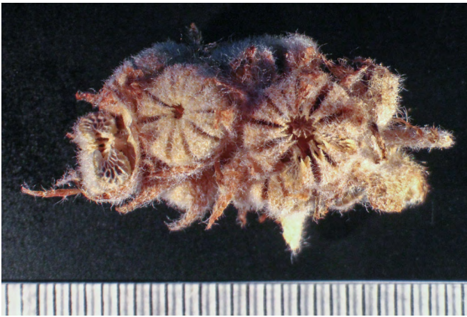
Figure 3. Scarlet globemallow schizocarps. Scale in mm.

Belowground. Scarlet globemallow produces slender, deep taproots with limited branching and lateral development. Water is likely absorbed along the entire length of the taproot because it is fleshy and shrinks rapidly with exposure to air (Weaver 1958). When eight plants were excavated from three prairies in southwestern Saskatchewan, roots were 2 to 5 mm in diameter at the soil surface and tapered to 1 mm at 35 to 47-inch (90-120 cm) depths. The maximum rooting depth was 5.9 feet (1.8 m) (Coupland and Johnson 1965). In short-grass prairie in west-central Kansas, scarlet globemallow roots were slender and unbranched until about 3 feet (1 m) deep where they divided into laterals spanning about 1-foot (0.3 m). Taproots reached 7.5 feet (2.3 m) deep (Albertson 1937).