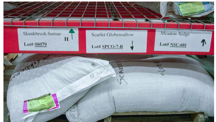
Figure 9. Scarlet globemallow seed being stored at the Utah Division of Wildlife Resources' Great Basin Research Center until use in wildland restoration.

Seeding and planting methods have been used to revegetate or restore wildland sites with scarlet globemallow.