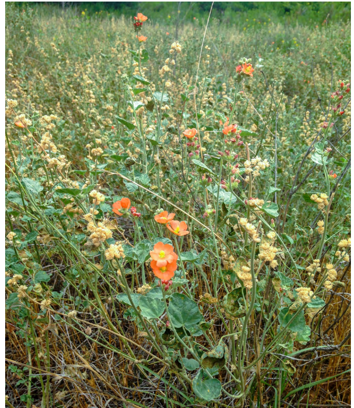
Figure 7. Scarlet globemallow with open schizocarps shedding or having already shed seed.

Of 37 total seed harvests made by BLM SOS crews, 22 (or about 60%) were made in July (Fig. 7). Collections spanned 12 years and elevations of 4,000 to 7,700 feet (1,200-2,300 m) in Colorado, Wyoming, and Utah. The earliest collection was made on June 5, 2016 from 4,867 feet (1,483 m) in Mesa County, Colorado. The latest collection date was August 18, 2009 from 4,722 feet (1,439 m) in Big Horn County, Wyoming (USDI BLM SOS 2017). Seed maturity is also common in August throughout the range of the species (Belcher 1985). For scarlet globemallow plants growing in exclosures in sagebrush-short grass vegetation in northern Colorado, fruit development and seed shatter occurred in August during 2 years of observations (Menke and Trlica 1981).