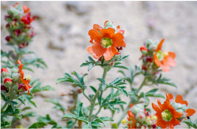
Figure 4. Scarlet globemallow inflorescences and flowers.

Diadasia species, are important pollinators (Pendery and Rumbaugh 1993). In greenhouse experiments, scarlet globemallow produced few schizocarps and little seed when self-pollinated. When outcrossed, flowers produced 8 to 10 times as many schizocarps and 5 to 9 times as much seed as protected flowers. Indeterminate flowering and a broad elevational and geographical range suggest that scarlet globemallow supports a diversity of pollinators. In wild populations, a diversity of bees visit scarlet globemallow flowers. Two sunflower bee ( Diadasia spp.) specialists occurred in every globemallow patch visited in Nevada, eastern Oregon, southern Idaho, and northwestern Utah (Cane 2009). Scarlet globemallow flower nectar is also a food source for mature small-checked skipper butterflies ( Pyrgus scriptura ) (LBJWC 2018).