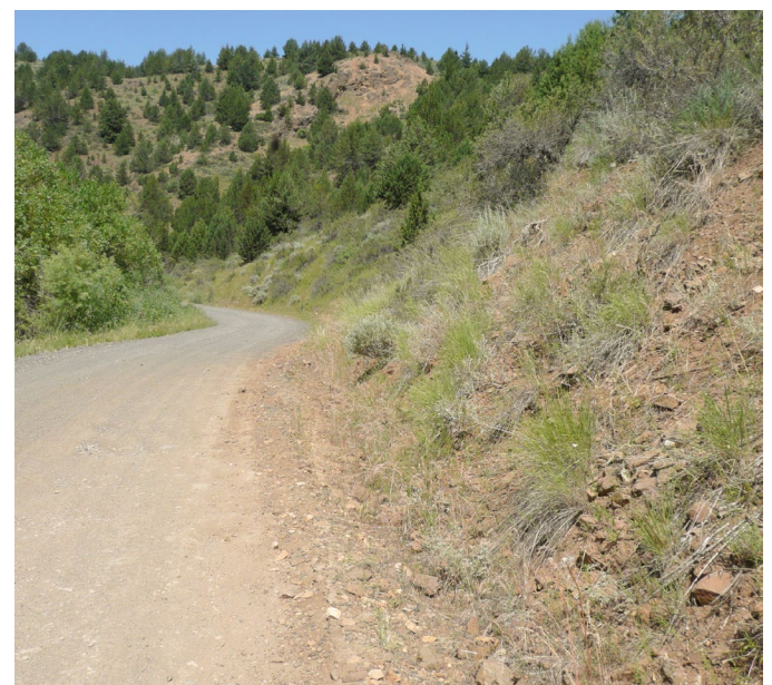
Figure 2. Annual agoseris seed collection site along a roadside in Idaho.

Annual agoseris grows in several shrubland communities in Oregon. It is a representative species in chaparral vegetation in the southwestern part of the state. In the Rogue Valley it grows with buckbrush ( Ceanothus cuneatus ) at sites with low annual and summer rainfall and mild winter temperatures (Detling 1961). In central and south-central Oregon, it occurs in little sagebrush ( A. arbuscula )/Idaho fescue communities (Franklin and Dyrness 1973). In the pumice region of central Oregon, Agoseris species are considered diagnostic of ponderosa pine ( Pinus ponderosa )/antelope bitterbrush ( Purshia tridentata )/Idaho fescue communities. These communities occupy sandy loam soils and gentle slopes at elevations below 2,500 feet (760 m) (Dyrness and Youngberg 1966).