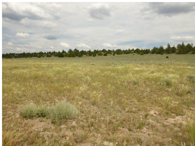
Figure 1. Grassland habitat supporting annual agoseris in the seed collecting stage in Oregon. Photo: USDI, BLM SOS OR931.

Habitat and Plant Associations. Annual agoseris grows in dry to wet grassland (Fig. 1), chaparral, desert shrub, shrub steppe (Fig. 2), oak ( Quercus spp.) woodland, and conifer forest communities (Baird 2006). In California, it grows in open grassy sites in a variety of plant communities (Munz and Keck 1973). In the Great Basin, it grows in dry prairies, grasslands, and foothill woodlands (Lambert 2005). In Utah, it is considered rare but occurs in dry, open lowland and foothill sites in sagebrush ( Artemisia spp.)/grass and mountain brush communities up to 2,300-foot (700 m) elevation (Jensen 2007; Welsh et al. 2016).