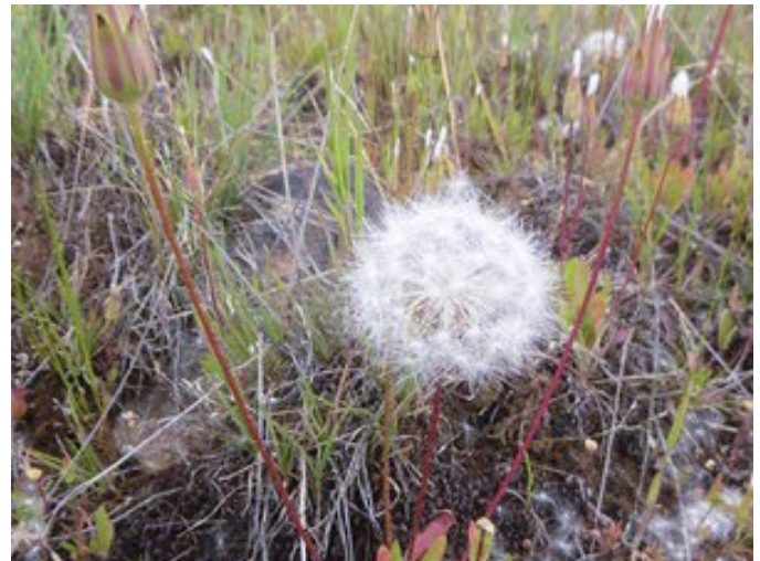
Figure 6. Annual agoseris plants with open and closed seed heads.

Phenology. Annual agoseris flowers appear from March to September depending on the location, weather, and variety. Variety quentinii flowers are generally present from March to June (Baird 2006). In annual grasslands in central California, annual agoseris flowered from early March to late May during 3 years of monitoring (1983-85) (Mooney et al. 1986). In a big sagebrush ( Artemisia tridentata )/bluebunch wheatgrass community in southern British Columbia, annual agoseris development was much more rapid in the drier of two years of monitoring (Pitt and Wikeem 1990). In 1978, total precipitation was 12.8 inches (326 mm) and in 1979, it was 10.9 inches (278 mm). April precipitation levels in April 1978 were six times those of 1979. In the dry year (1979), annual agoseris initiated growth and flowered in April, and set and shattered seed in May. In the wetter year (1978), plants initiated growth in April, flowered in May, and set and shattered seed in July (Pitt and Wikeem 1990).