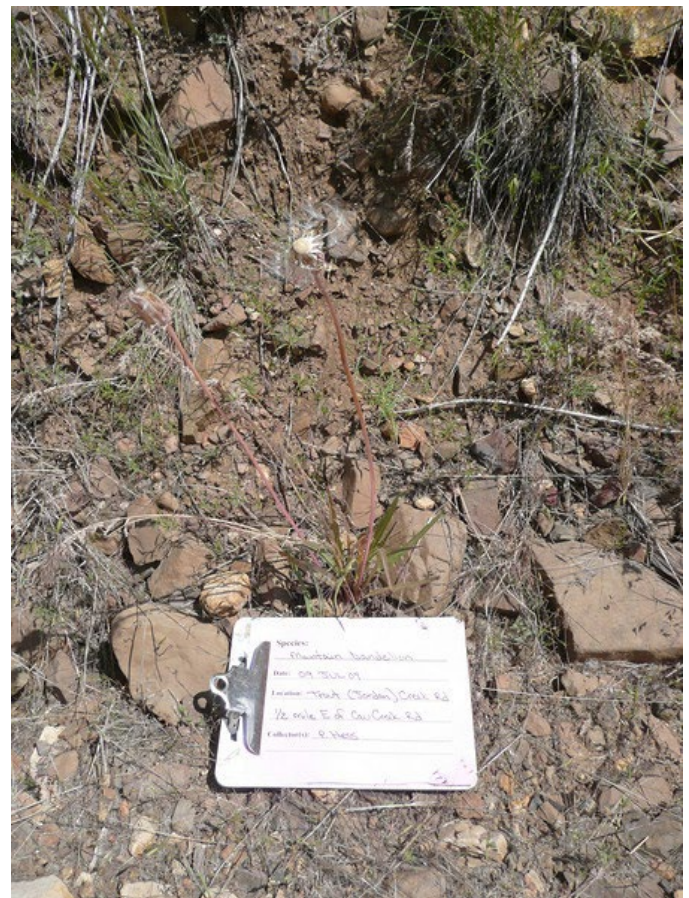
Figure 3. Rocky soil site in Idaho where annual agoseris seed was collected.

In central California, annual agoseris was often reported in serpentine soils containing heavy metals (chromium, nickel, cobalt, and manganese) but with low levels of nitrogen, phosphorus, potassium, calcium, and sodium (Gram et al. 2004; DeGroot et al. 2005; Hobbs et al. 2007). Serpentine soils often have a mottled green-gray color and waxy feel (St. John and Tilley 2012). On the Jasper Ridge Experimental Area, Stanford, California, annual agoseris occurred on serpentine but not sandstone soils. The magnesium content was six times greater in serpentine than sandstone soils (McNaughton 1968). In a study on Jasper Ridge, annual agoseris was present in all study plots on serpentine outcrops in all 20 years of monitoring. Serpentine outcrops characteristically have shallow soils (16 in [ <40 cm]) overlying ultramafic serpentine (Hobbs et al. 2007).