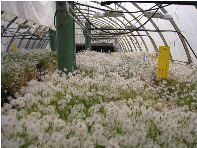
Figure 11. Annual agoseris growing in the USFS Shrub Laboratory in Provo, Utah. Greenhouse growth yielded 9 lbs. pure live seed in 2008.

Growers should apply for certification of their production fields prior to planting and plant only certified stock seed of an allowed generation. The systematic and sequential tracking through the certification process requires preplanning, knowing state regulations and deadlines, and is most smoothly navigated by working closely with state certification agency personnel. See the Wildland Seed Certification section for more on stock seed sourcing.