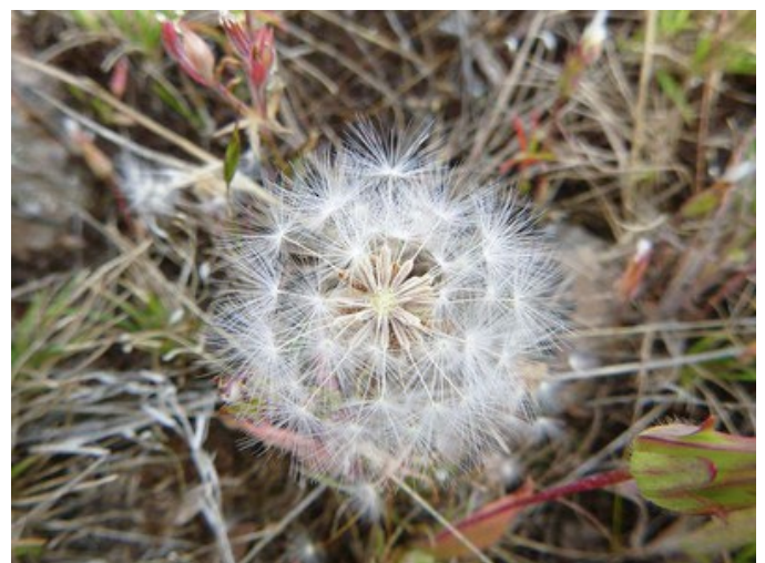
Figure 8. Open annual agoseris seed head with off-white colored mature seeds.

If wildland seed collected by a grower is to be used as stock seed for planting cultivated seed fields or for nursery propagation (See Agricultural Seed Field Certification section), detailed information regarding collection site and collecting procedures, including photos and herbarium specimens must be provided when applying for agricultural seed field certification. Germplasm accessions acquired within established protocols of recognized public agencies, however, are normally eligible to enter the certification process as stock seed without routine certification agency site inspections. For contract grow-outs, this information must be provided to the grower to enable certification. Stock seed purchased by growers should be certified.