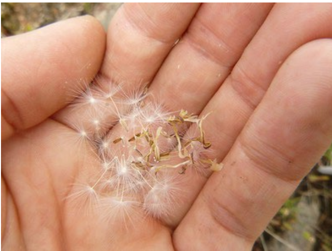
Figure 9. Hand-stripped annual agoseris seeds. Note the tan to brown seed bodies and compare with Fig. 8.

The Bureau of Land Management's Seeds of Success collection crews made 8 collections in 5 years (2002-2015) in Washington, Oregon, Nevada, and Idaho (Fig. 9). The earliest collection was made on May 29, 2015 in Harney County, Oregon at an elevation of 5,412 feet (1,650 m). The latest collection was made on July 20, 2010 in Douglas County, Washington at an elevation of 3,440 feet (1,049 m) (USDI BLM SOS 2017). In Washington, Camp and Sanderson (2007) collected annual agoseris seed from late May to mid-June at an elevation of 1,830 feet (560 m) in Burton Draw, Douglas County and at 2,260 feet (690 m) from Monument Hill in Grant County. Seed began maturing and was harvested in June near Pullman, Washington (Skinner 2006). Jensen (2007) collected seed from mid-June to July 1 at 5,430 feet (1,655 m) elevation in the foothills of the Santa Rosa Mountains in Humboldt County, Nevada.