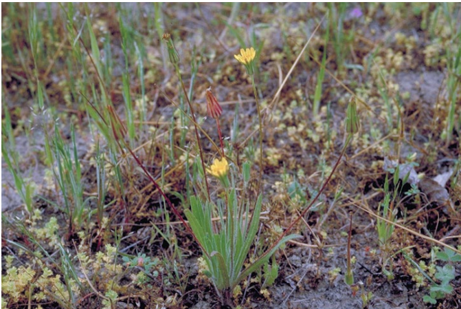
Figure 4. Annual agoseris plant growing in California.

Annual agoseris is an upright, slender, taprooted annual with several flowering scapes typically 16 inches (40 cm) or shorter but ranging from 1 to 24 inches (2.5–60 cm) tall (Fig. 4) (Munz and Keck 1973; Hitchcock and Cronquist 2018; Luna et al. 2018). Herbage is subglabrate to densely hairy and exudes a milky juice when damaged (Baird 2006; St. John and Tilley 2012). Leaves are petiolate and mostly erect from a basal cluster. Leaf blades are oblong to spatulate or linear and up to 10 inches (25 cm) long. Leaf margins are entire or lobed with two or three pairs (Munz and Keck 1973; Baird 2006).