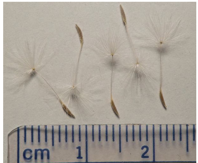
Figure 10. Annual agoseris seeds (< 5 mm long) and pappi (about 8 mm long and 1 cm wide).

Several collection guidelines and methods should be followed to maximize the genetic diversity of wildland collections: collect seed from a minimum of 50 randomly selected plants; collect from widely separated individuals throughout a population without favoring the most robust or avoiding small stature plants; and collect from all microsites including habitat edges (Basey et al. 2015). General collecting recommendations and guidelines are provided in online manuals (e.g. ENSCONET 2009; USDI BLM SOS 2016). As is the case with wildland collection of many forbs, care must be taken to avoid inadvertent collection of weedy species, particularly those that produce seeds similar in shape and size to those of annual agoseris, like dandelion ( Taraxacum spp.) and hawksbeard ( Crepis spp.) (Fig. 10) (St. John and Tilley 2012).