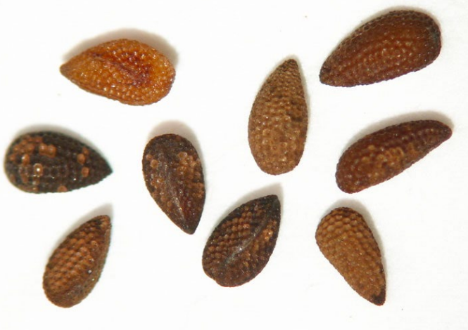
Figure 13. Clean silverleaf phacelia seed.

Seed Cleaning. Small seed size, easily detached flower capsules, and fair seed flow, makes silverleaf phacelia moderately easy to clean (Winslow 2002). Seed is typically cleaned (Fig. 13) by processing it through a hammermill and then a fanning mill (Link 1993; Luna et al. 2008), but more detailed procedures are provided below.