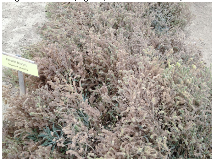
Figure 15. Silverleaf phacelia nearly ready for harvest at Oregon State University’s Malheur Experiment Station in Ontario, OR.

Seed Harvesting. Seed can be hand harvested or directly combined if maturity across the field is uniform. Seed was often harvested in late June or July at OSU MES (Table 6) and in late July or early August at the Bridger PMC (LeFebvre et al. 2017b). Irrigation and fertilization improved seed production and increased seed head height for improved combine harvests at the Bridger PMC (LeFebvre et al. 2017b). At OSU MES, seed was harvested with a small-plot combine in 2014 and 2015 and manually in 2016 and 2017 when plant heights were low (Fig. 15; Shock et al. 2020).