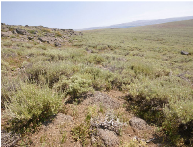
Figure 2. Silverleaf phacelia in a sagebrush community in Oregon.

and support greater vegetation cover (Day and Wright 1985). In the White Mountains of California, silverleaf phacelia occurs in alpine vegetation on south- and east-facing slopes below 13,000 feet (4,000 m) (Mitchell et al. 1966). Dominant shrubs and subshrubs are wax current ( Ribes cereum ), granite prickly phlox ( Linanthus pungens ), Nuttall's linanthus ( Leptosiphon nuttallii ), little sagebrush ( A. arbuscula ), and timberline sagebrush ( A. rothrockii ). Climate in the White Mountains is cold and semi-arid with an average annual precipitation of 15.5 inches (394 mm) and temperature of 28 °F (-2 °C) (Mitchell et al. 1966). In Clark and Nye counties of Nevada, silverleaf phacelia is associated with sagebrush/pinyon-juniper, big sagebrush-curl-leaf mountain mahogany ( Cercocarpus ledifolius ), and ponderosa pine ( Pinus ponderosa ) communities occurring at elevations of 6,000 to 8,500 feet (1,800-2,600 m) (Beatley 1976).