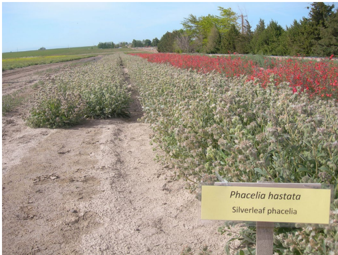
Figure 14. Silverleaf phacelia seed production plots growing at Oregon State University’s Malheur Experiment Station in Ontario, OR.

averages ranged from 34.3 to 153 lbs/acre (38.4-171 kg/ha) and increased with irrigation in most years (Shock et al. 2018).