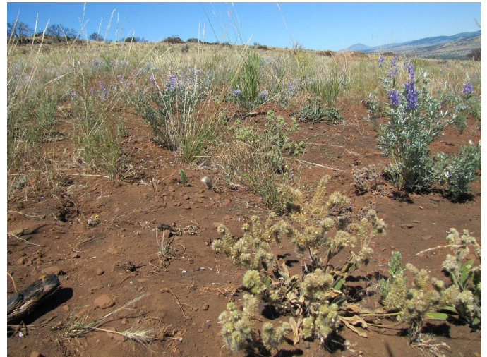
Figure 1. Silverleaf phacelia in a California grassland.

exposures where silverleaf phacelia is much less common (Blinn 1966). In montane grasslands on the east side of Rocky Mountain National Park, Colorado, silverleaf phacelia only occurred in plots not invaded by sweetclover ( Melilotus officinalis ). Montane grasslands occupy well-drained soils and are dominated by mountain muhly ( Muhlenbergia montana ), blue grama ( Bouteloua gracilis ), and needle and thread ( Hesperostipa comata subsp. comata ) (Wolf et al. 2004). Silverleaf phacelia is abundant in talus and scree communities above tree line (10,249 feet [3,124 m]) on Mt. Washburn in northcentral Yellowstone National Park. Spreading wheatgrass ( Elymus scribneri ) dominates talus and scree communities, where the frost-free season averages 93 days, and precipitation is less than 32 inches (800 mm)/year (Aho and Bala 2012).