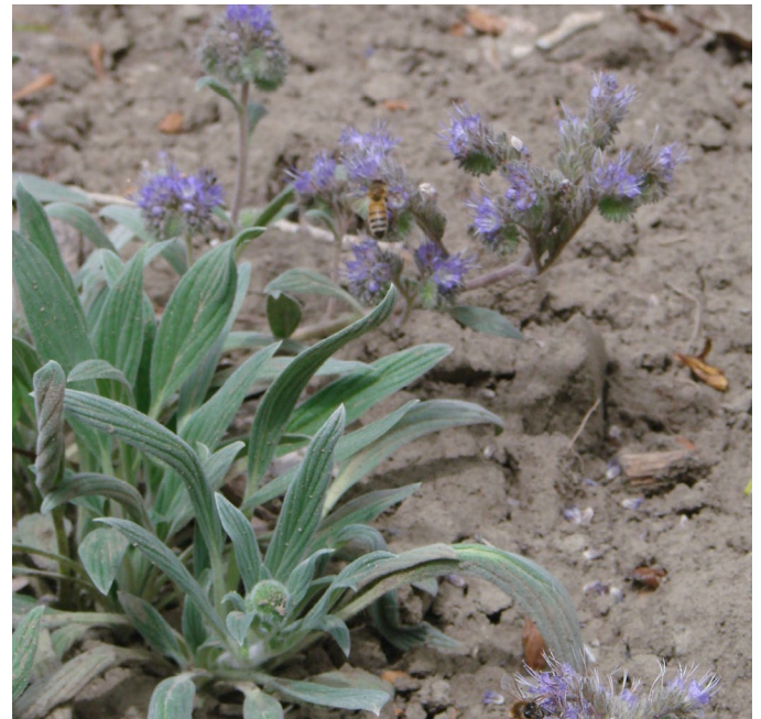
Figure 7. Bee pollinators visiting silverleaf phacelia flowers at the Plant Materials Center in Bridger, MT (2010).

Reproduction. Researchers calculated a fruit/flower percentage average of 65% for 161 silverleaf phacelia plants growing in the Wasatch Mountains near Brighton, Utah (Wiens et al. 1987). Seed/ovule percentages averaged 27% for 21 plants when the preemergent reproductive success (PERS) or the number of viable seeds that enter the ambient environment was evaluated. Average PERS (product of fruit/flower and seed/ovule) for silverleaf phacelia was 18% compared to 22% among all outcrossing species evaluated (Fig. 7) (Wiens et al. 1987).