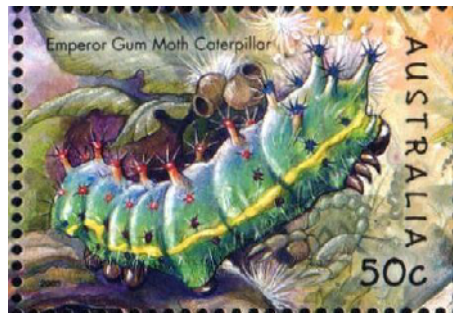
Australia Post, 2002

On returning home we discovered they were the larvae of the Emperor Gum Moth or Antheraea eucalypti , which leave the food plant to pupate elsewhere. The moths are large, furry and oh so beautiful.