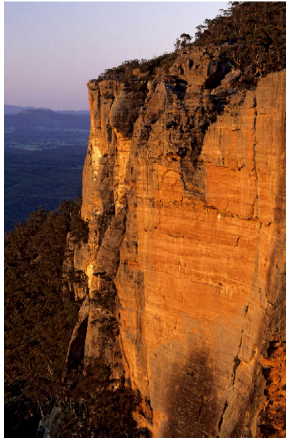
The tall sheer cliffs of Point Hatteras.

It has taken decades to get to this point. This is a wonderland of biodiversity and geodiversity, so it is simply fantastic it has finally been gazetted! The decision reflects a lot of hard work by the Western escarpment (Objective 3) subcommittee of the Society, the Colong Foundation and the Lithgow Environment Group.