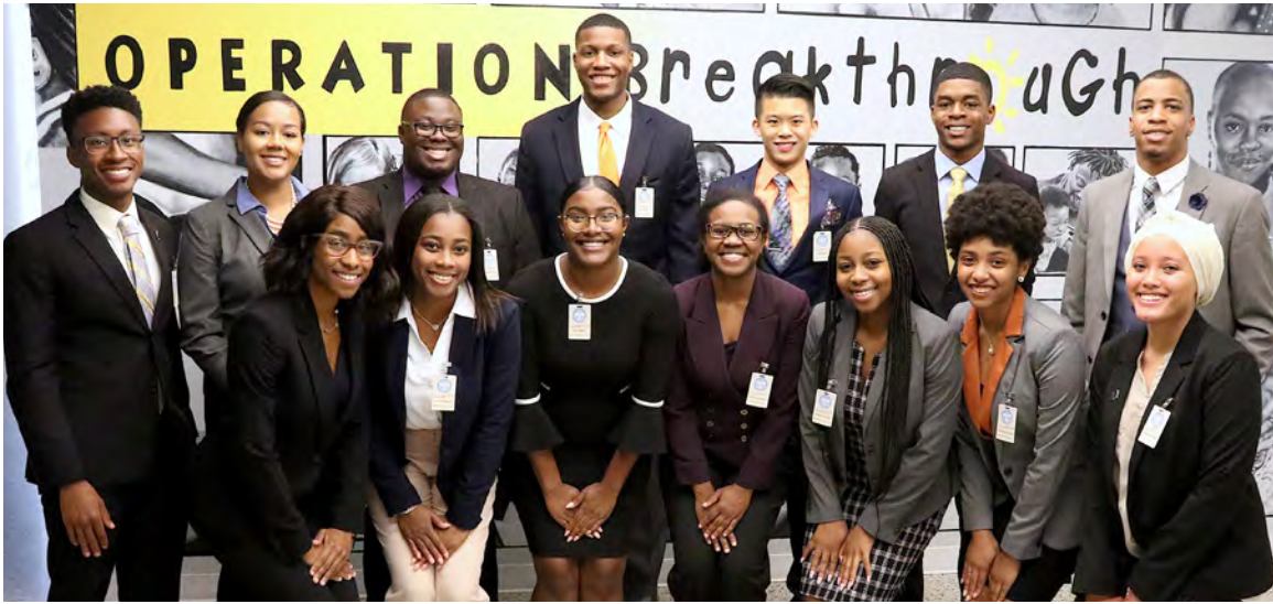
Scholars tour Operation Breakthrough prior to The City You Never See Bus Tour.