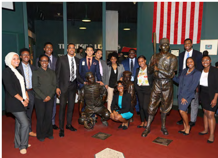
Scholars at the Negro Leagues Baseball Museum