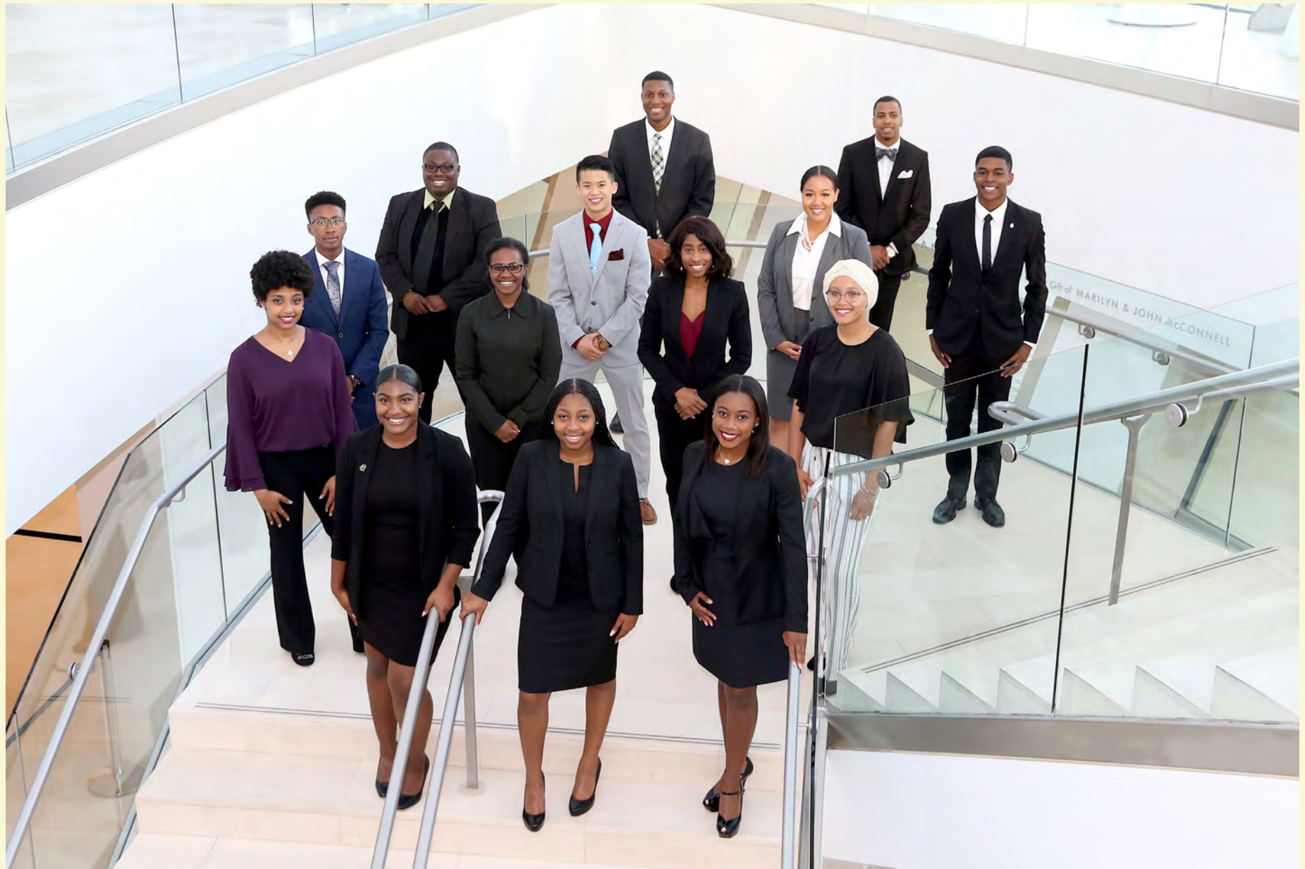
The 2019 Cohort of BHLI Scholars at the Kauffman Center for Performing Arts for an evening with the Kansas City Symphony