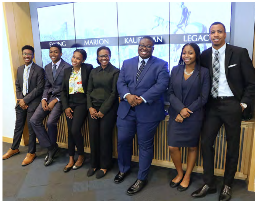
Scholars enjoying their time at the Kauffman Foundation Conference Center