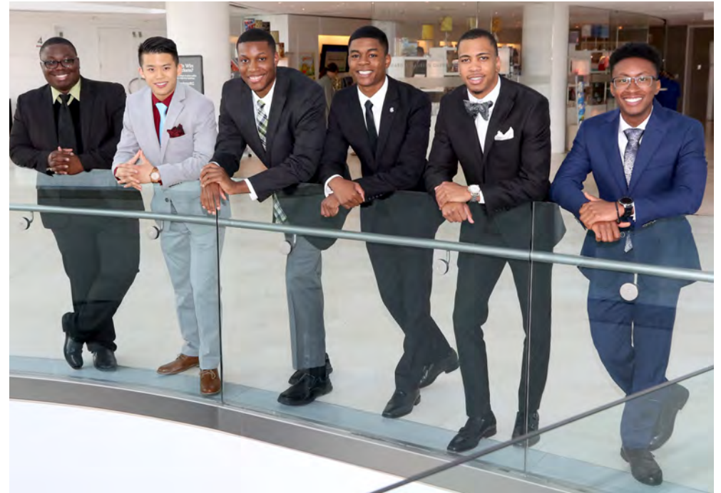
Scholars at the Kauffman Center for Performing Arts for an evening with the symphony