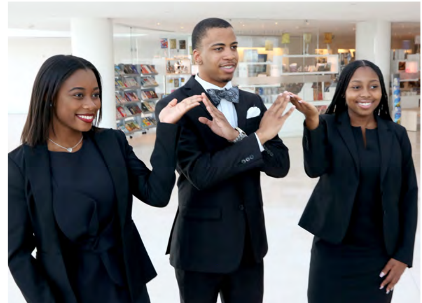
Spelman and Morehouse scholars showing their school support