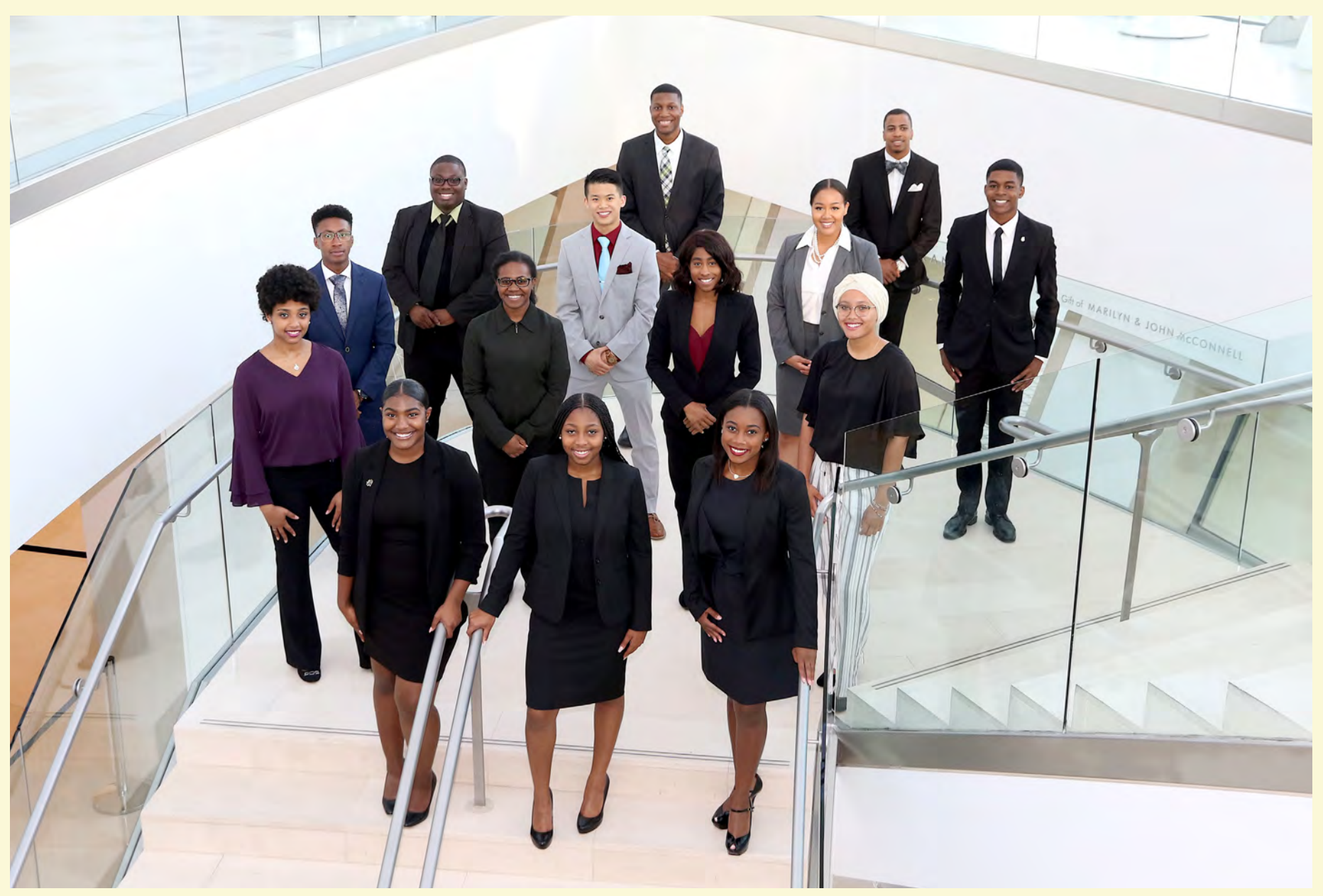
The 2019 Cohort of BHLI Scholars at the Kauffman Center for Performing Arts for an evening with the Kansas City Symphony