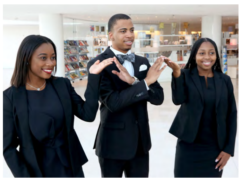
Spelman and Morehouse scholars showing their school support