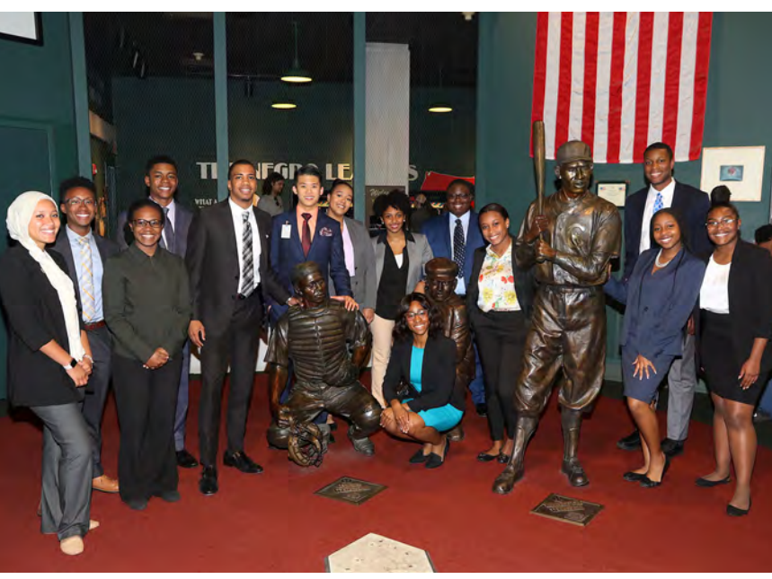
Scholars at the Negro Leagues Baseball Museum