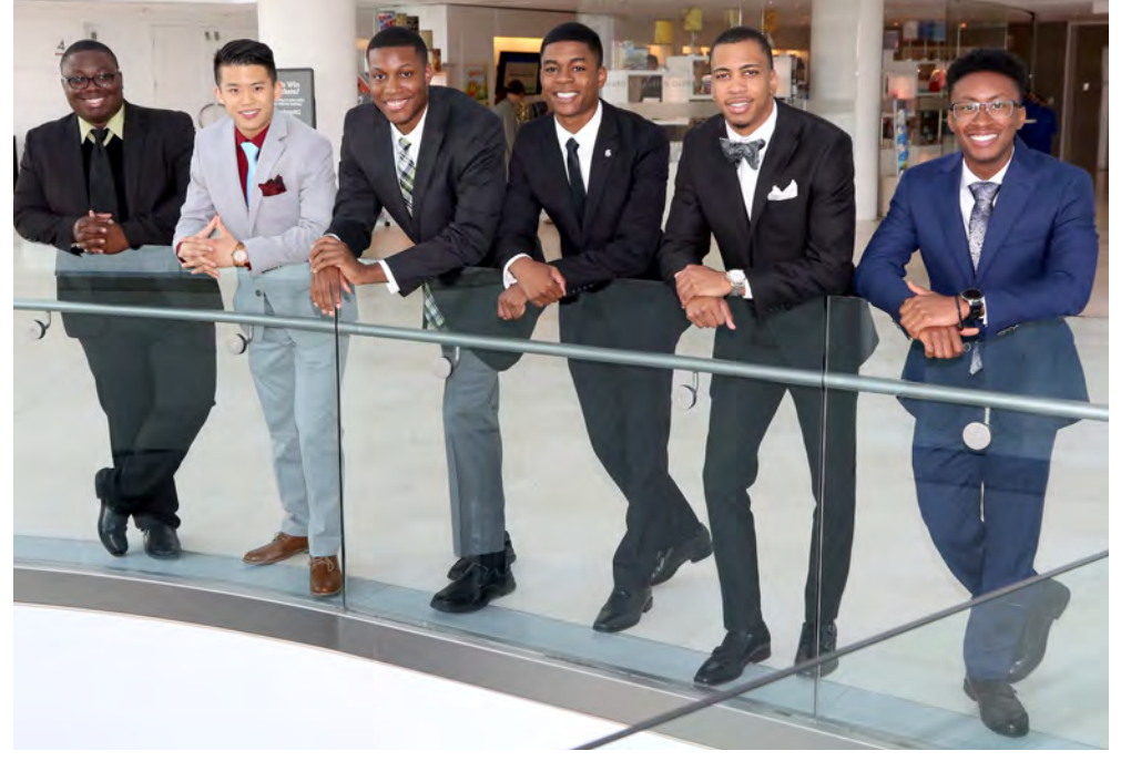
Scholars at the Kauffman Center for Performing Arts for an evening with the symphony