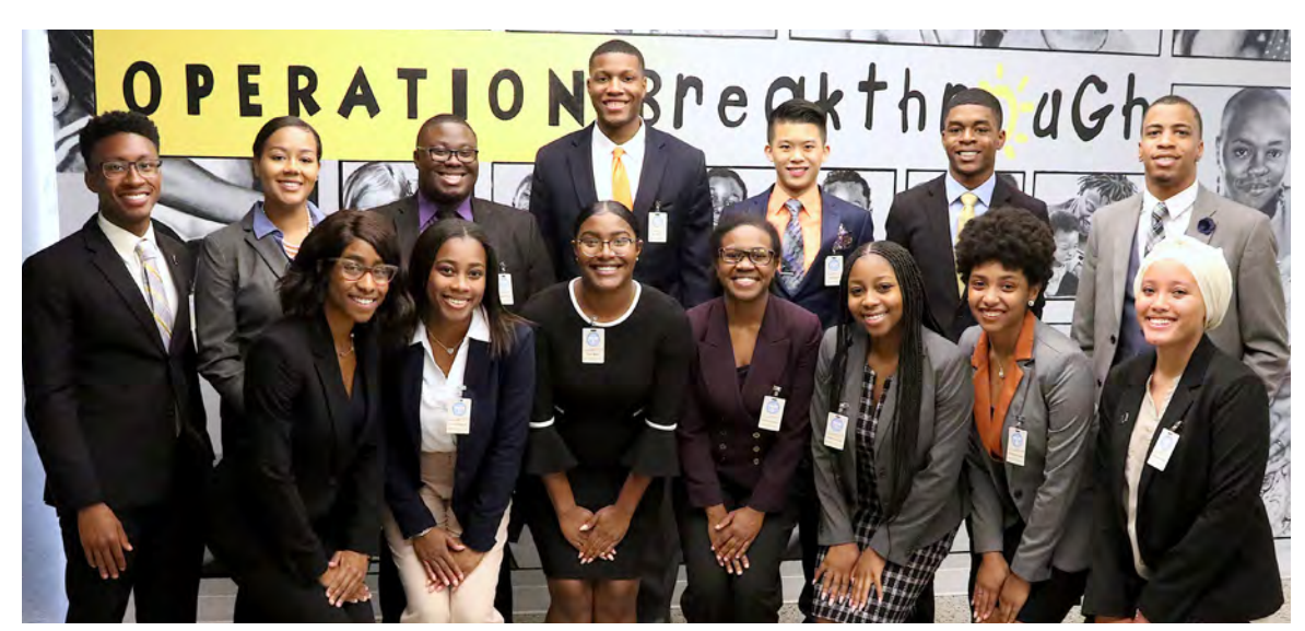
Scholars tour Operation Breakthrough prior to The City You Never See Bus Tour.