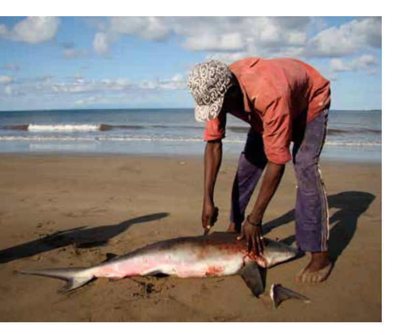
Shark finning, Comoros.

While the industry generally appears amenable to the ultimate implementation of these devices, the actual level of implementation of BRDs has been variable with encouraging levels of implementation in several fisheries, such as in Kenya and Tanzania. Improved legislation and heightened awareness are prerequisites.