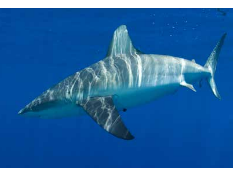
Galapagos shark, Carcharhinus galapagensis . A globally distributed pelagic species associated with oceanic islands.

One of the most useful sources of information on the species composition of contemporary stocks is restricted to an interview-based stakeholder survey (Nevill 2005). This study highlights the fact that shark diversity in Seychelles coastal waters had decreased significantly (Nevill 2005). Diving with sharks represents a significant component of the tourism industry.