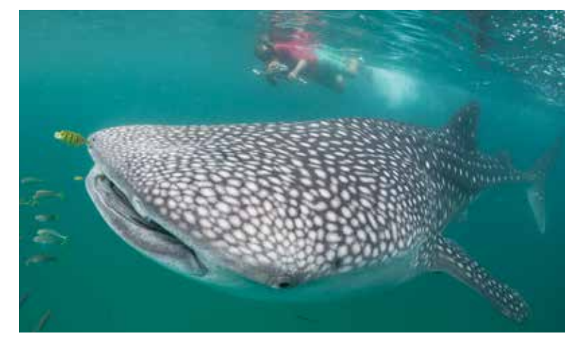
Whale shark research in Mozambique.

Using a combination of photo-identification and marker tags, from 2001 to 2007, a total of 552 individuals was identified (Rowat et al. 2009). Around Mahé, abundance estimates