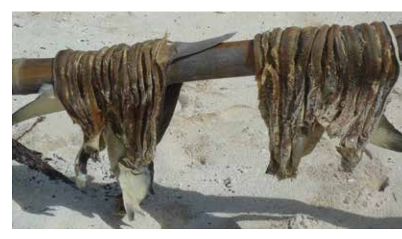
Figure 2: Dried shark meat in an illegal fishing camp, Glorieuses islands, April 2011 (C. amblyrhynchos).

In some cases shrimp fishers have shifted their activity into pelagic fisheries by changing their vessels to small-scale longliners. In the period from 2008 to 2010, there were five such converted longliners; four fishing the west and one the east coast of Madagascar. Shark fisheries are showing signs of decline, possibly as a result of the decline of other established fisheries (Rahombanjanahary, 2011).