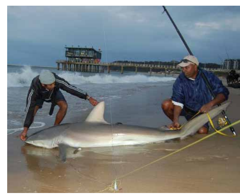
Sport fishers measure dusky shark before tagging and release.

The highest elasmobranch diversity in the SWIO region has been recorded from Mozambique waters, with 108 species (73 sharks and 35 rays; reviewed by Kiszka et al. 2009a). Fishery-dependant data provide the basis for preliminary information on the relative abundance of sharks in this country. From 2006 to 2010, fishery observer data from the longline fishing boats were collected, and sharks amounted for 11% of the catches by number. Four species were mostly represented: Carcharhinus sorrah, G. cuvier, Squalus megalops and S. lewini (Palha de Sousa 2011). No dedicated research on sharks and rays has been undertaken in Mozambique, except on the largest and emblematic species, especially the reef manta ray (e.g. Marshall et al. 2009, 2011) and the whale shark (Brunnschweiler et al. 2009). In the 1980s, a number of surveys were carried out by both Soviet and German trawlers primarily to estimate the potential nominal catch of fish, crustaceans and molluscs. During these surveys, sharks were recorded and the most commonly caught species were Carcharhinus falciformis, C. obscurus, Mustelus manazo and S. zygaena (Sousa et al. 1997).