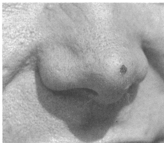
FIG 3—Abrasion to tip of the nose caused by ringer's thumbnail while trying to grasp flapping rope

Most injuries to experienced ringers seem to occur in moments of inattention; these are “one off,” rather