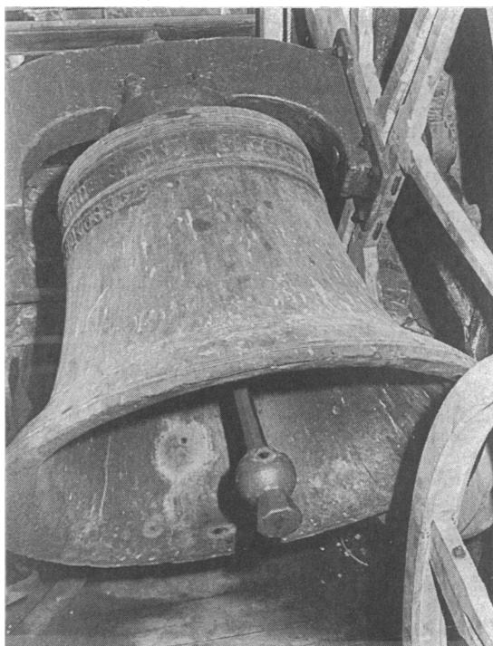
FIG 4—Swinging bell with clapper bolt protruding from top of headstock. This bell weighs 579 kg (fifth bell, Sutton Bonnington)

Ringers also suffer from the wear and tear of repetitive movements—tenosynovitis and degenerative arthritis, particularly of the hands, wrists, and thumbs. It is difficult to say whether this is primarily due to ringing or if the activity aggravates a pre-existing condition. At least one medical ringer had to abandon ringing because of an exacerbation of rheumatoid arthritis. As may be expected, inflammatory disease of the elbows and shoulders is also common.