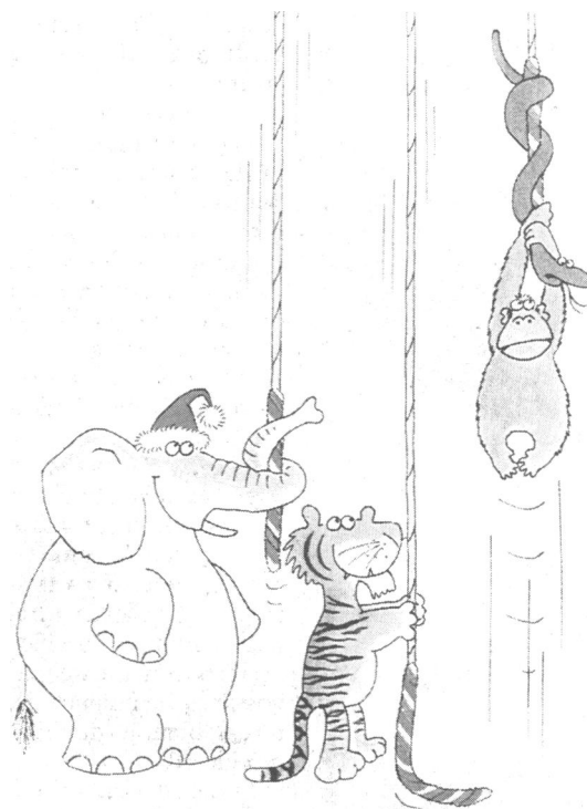
FIG 1—Popular conception of a common hazard of bell ringing—the high speed lift

The advertisement in Ringing World and a search of the previous six years' issues produced a total of 79 injuries (table I). Seventeen replies were received from the 20 towers that had been sent questionnaires and showed that a total of 221 regular ringers (representing 442 ringing years) had had or seen eight injuries directly attributable to bell ringing (an annual incidence of 1.8%). These injuries are detailed in table II. Several associated injuries such as falls from ladders and various pre-existing conditions such as sore wrists and