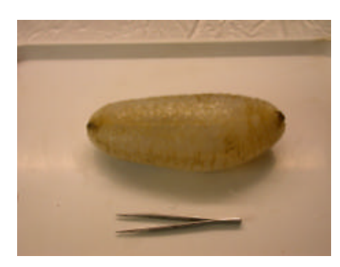
Figure 16.2 Left: Paroriza pallens and Right: Laetmogone violacea

retained for further I.D to species level. The last trawl of the this cruise was shot at a depth of 1100m (St:14325#1) Contained a catch of one species, Bathyplotes natans only.