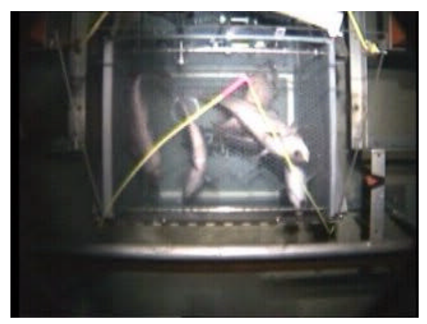
Figure 10.1. Five Coryphaenoides armatus captured during FRESP station 14316.

Cruise D260 was the fourth to utilise the FRESP lander, following successful deployments during D255. Due to the adverse weather conditions the lander was only deployed twice (Stations 14306 and 14316). At both these 4000m stations Coryphaenoides armatus were captured in the chamber (see Fig 10.1 below), with a single individual at Station 14306 and five animals at Station 14316.