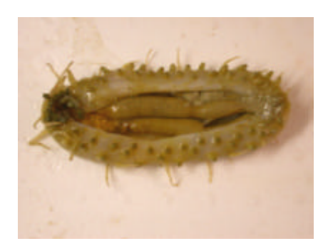
Figure 16.3 Sample Images of Holothuroidea and Gut/Internal Morphologies

(left: Oneirophanta mutabilis internal morphology (4100m). Right: Benthogone rosea ventral view (2100m))