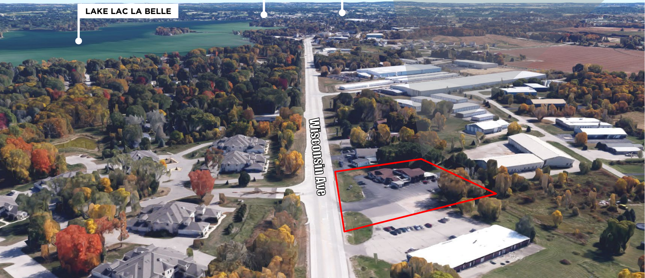
LAKE LAC LA BELLE