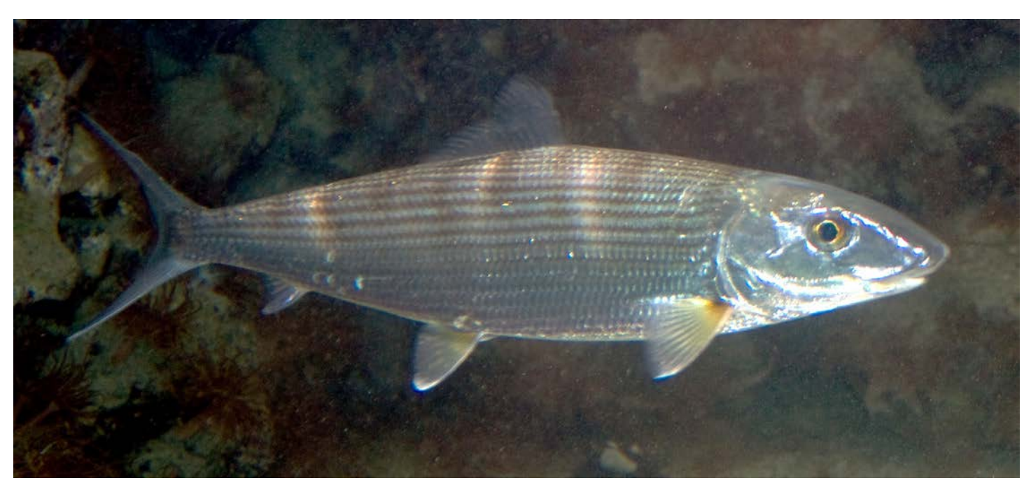
The most popular bonefish species in Florida and around the Caribbean is Albula vulpes, known as "the white fox."

Globally, scientists have identified twelve species of bonefish. Though subtle physical differences can distinguish the species, genetic information provides evidence of different species, as well as indications of kinship between sub-populations of the same species.