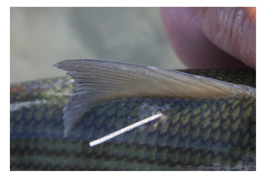
Spaghetti tags are used for catch-and-release studies, where fishermen who catch the fish again will call the number listed on the tag and report information about where the fish was caught and how big is it. You can see where the name comes from!

The first type of tag that researchers and fishermen used for this study was a spaghetti tag. Spaghetti tags are attached just under the skin of the fish next to the dorsal fin. These tags have unique numbers, and contact information of the researcher printed on them so that if/when the fish is recaptured, scientists can learn where it was caught.