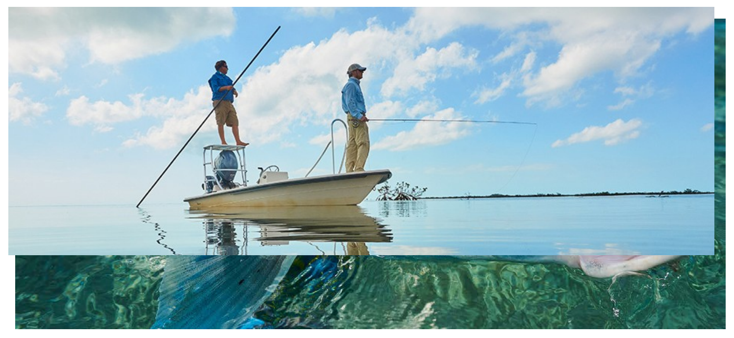
Adult bonefish have silvery scales that help them mirror their environment, making it easier to blend in.

First, the large number of participating males and females encourages genetic diversity. Second, ocean currents may carry the offspring to multiple settling areas – typically shallow mud- or sand- bottomed habitats within lagoons and bays that offer shelter and food. Larval bonefish spend 42 to 72 days floating on ocean currents. One spawning aggregation of bonefish may be responsible for repopulating the fisheries in multiple places at various