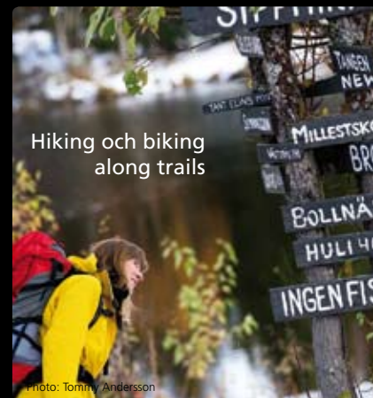
Hiking och biking along trails