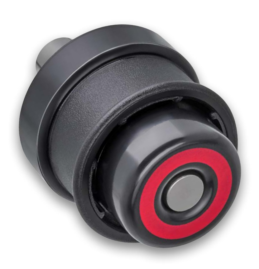
Large, Flat, Color-Coded Finger Perch

Provides comfort and easy valve identification