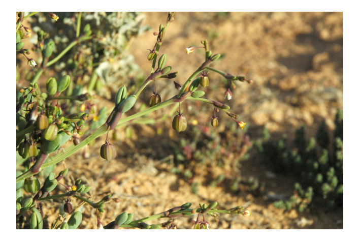
Fig. 3. Close-up of flowers and fruit of Zygophyllum compressum from Nanya Station in August 2010. Photograph Ian Sluiter 23/08/2010.