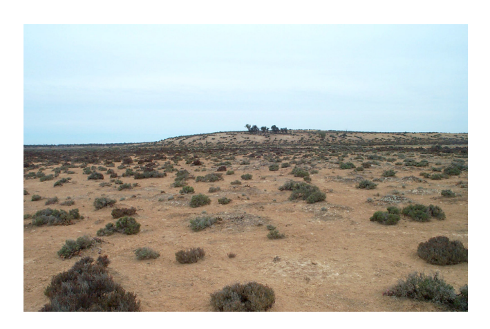
Fig. 4. Zygophyllum compressum and Elachanthus glaber habitat at Nulla Nulla Station. The species grows on low gypseous rises 20–30 cm above the surrounding plain. Here the gypseous rises appear as the darker patches between the surrounding halophytic shrubs including Halosarcia pergranulata and Frankenia foliosa . Photograph Ian Sluiter 13/12/2001.

species was growing on low, gypseous plains often with small rises up to 30 cm above the surrounding landscape. It was found in very open low shrubland (see Fig. 4) dominated by Halosarcia pergranulata ), in association with Frankenia foliosa . Other species found at some, but not all Nulla Nulla localities, include Lawrencia glomerata , Eragrostis falcata , Maireana appressa and Elachanthus glaber . Salt crystals deriving from the underlying saline groundwater were often present as efflorescence on very low raised ridges and cracks of the ground surface. Sluiter (2001) estimated that up to 1,000 Zygophyllum compressum plants may be present at the Nulla Nulla Boinka, with not all potentially suitable habitat searched.