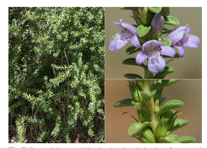
Fig. 7. Eremophila crassifolia showing the whole plant, flowers and leaves.