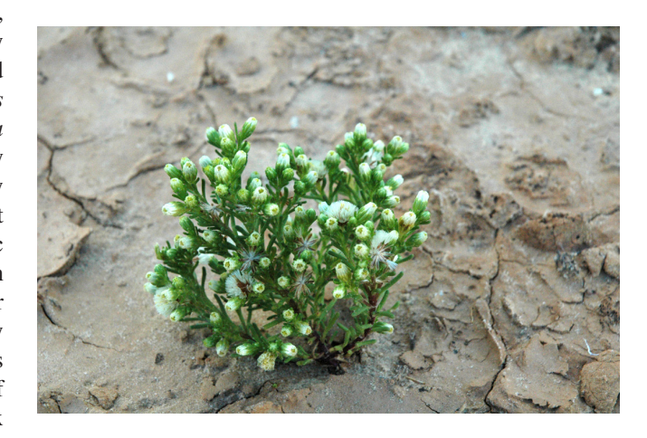
Fig. 6. Elachanthus glaber growing on a copi or gypseous rise at Nanya Station 135 km north-north-west of Wentworth, in southwest New South Wales in August 2010. 23/08/2010.

Based on satisfying IUCN criteria A, A2, A4, B1, B2, B1a, B2a, B1ci, B1cii, B1civ, B2ci, B2cii, B2civ, C, C2ai, C2aii and D, Eremophila crassifolia is critically endangered in New South Wales and eligible for listing under the NSW Threatened Species Conservation Act .