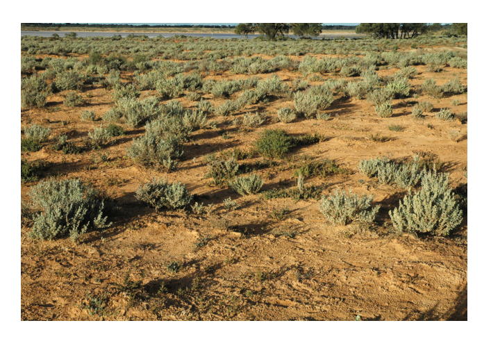
Fig 5. Elachanthus glaber growing on a copi or gypseous rise at Nanya Station 135 km north-north-west of Wentworth, in southwest New South Wales. Photograph Ian Sluiter 23/08/2010.

At the Scotia boinka at Nanya (in August 2010) approximately 100 individuals of Zygophyllum compressum occurred over a 1 ha area on a gypseous rise elevated approximately 2.5 m above a surrounding saline playa lake. The vegetation at the Nanya site was dominated by Atriplex vesicaria in association with Frankenia foliosa, Lawrencia glomerata and Elachanthus glaber. (see Fig. 5). Time constraints prevented further targeted search effort in potentially suitable habitat at the Scotia boinka. It is considered likely that further searches would reveal more plants at the Scotia sub-population because the area is known to contain substantially more suitable habitat than was searched in August 2010.