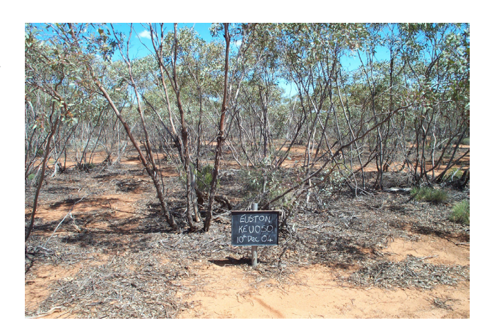
Fig. 8. Habitat of Eremophila crassifolia northeast of Trentham Cliffs at the author's site KEU050 (internal database code). Photograph Ian Sluiter 10/12/2004