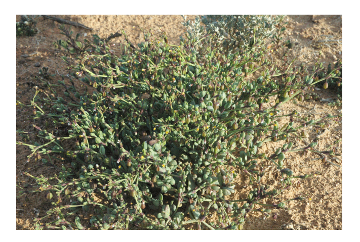
Fig. 2. Zygophyllum compressum plant growing on a gypseous rise at Nanya Station, 135 km north-north-west of Wentworth in far southwest New South Wales. Photograph Ian Sluiter 23/08/2010.

At the Nulla Nulla boinka (in December 2001) Zygophyllum compressum occurred in three main areas covering approximately 20 ha in total with only 50 individuals present (Sluiter 2001). Winter 2001 in southwest New South Wales was a particularly dry time, and may have been a reason for the low numbers of plants found over a relatively large search area of suitable habitat. At all three locations, the