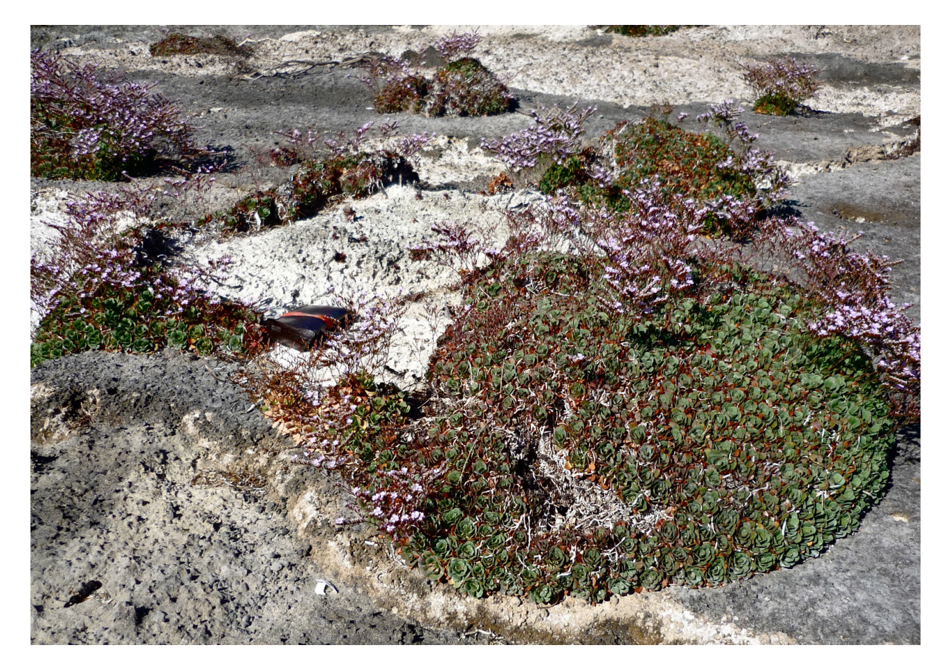
Fig. 4. Degenerating cushion of Limonium hyblaeum 40cm wide. Mounds of light grey to white fibrous peat can be seen in left part of cushion and sitting on grey calcarenite in background. Coffin Bay, South Australia.

I have not been able to find a reference to any control actions at all in other states.