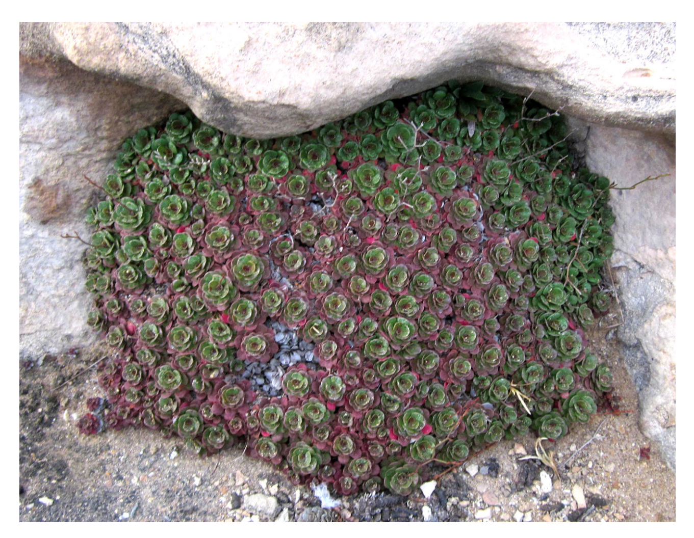
Fig. 1. Cushion of Limonium hyblaeum 20cm wide showing dense canopy and numerous small rosettes. On calcarenite, Robe, South Australia.

Limonium hyblaeum has small seeds 2 mm long (Walsh 1996). The fruit is a dry, membranous, one-seeded achene (Kubitzki 1993). In the genus and in Limonium hyblaeum itself, it is assumed that single seeds and the fruits are light enough to be readily dispersed both by wind and by animals (including birds, humans and rabbits), as well as by vehicles (Kubitzki 1993, Adair 2012, Rodrigo et al. 2012). On the south coast of England, it is assumed to be dispersed by gulls (OABIF 2013).