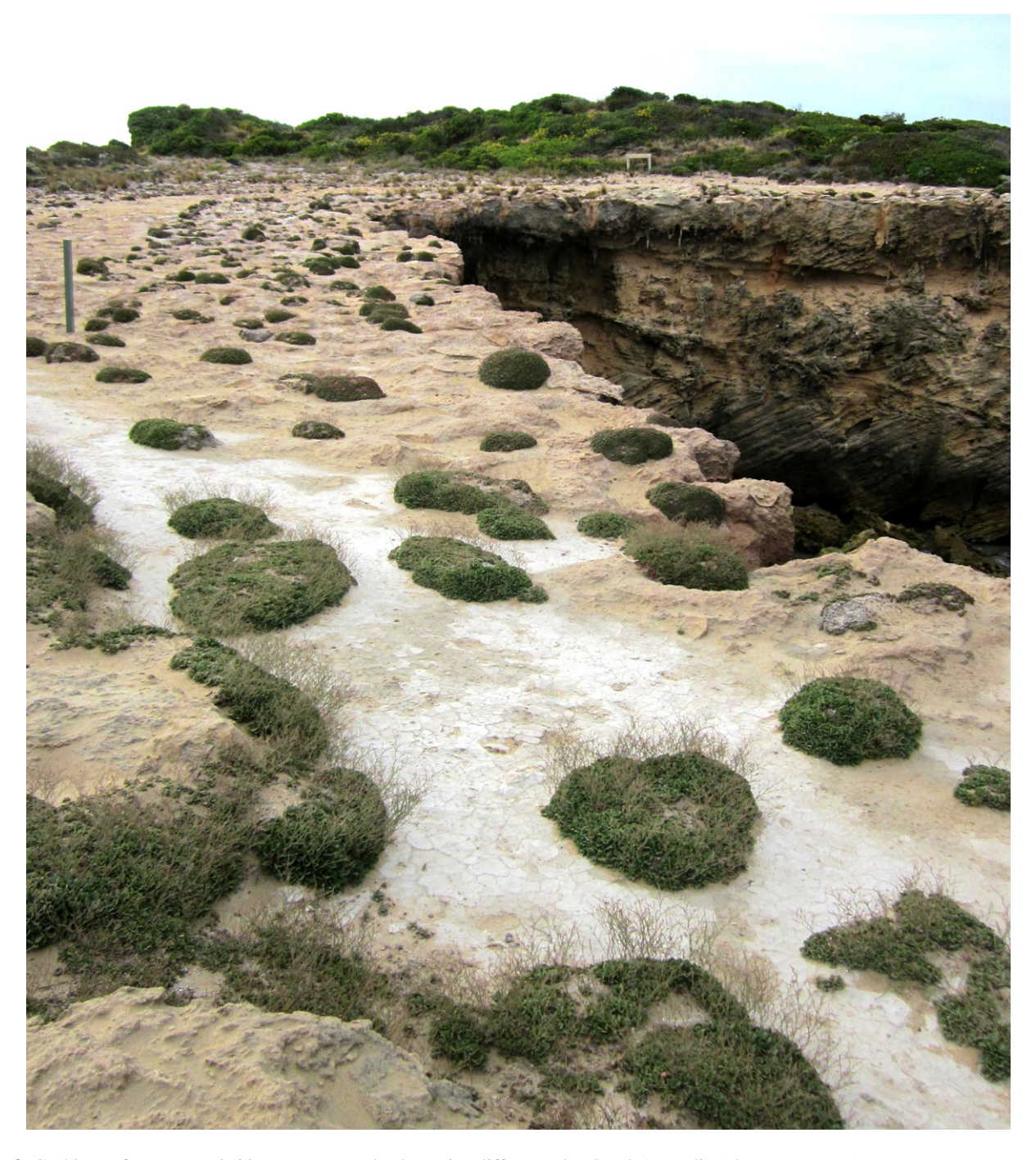
Fig. 2. Cushions of Limonium hyblaeum on coastal calcarenite clifftop, Robe, South Australia.

Of the rocky coastal sites, many in South Australia are on limestone (Fig. 1), as are all those in England (specimen labels at AD, OABIF 2013), while many in Victoria are