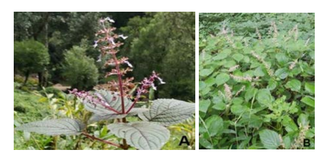
Fig 1: (A) The plant Coleus malabaricus Benth. (B). Morphotype of Coleus malabaricus Benth. selected for the study

Yong stems are more puberulous and greenish instead of the pink stem of the original plant. Leaves simple, opposite, hairy, petiolate and crowded at the branches. Both abaxial and adaxial surfaces of leaves are greenish. Lamina broadly ovate, serrate, acute with semicordate /truncate base. Petiole up to 6-16cm long and 3mm diameter, fleshy, adaxial and abaxial sides greenish. Lamina broadly ovate 13.5X9.5 cm size, base truncate or subcordate, margin serrate/crenate with numerous teeth on each side of margin, apex acute, unicostate reticulate venation with veins prominent on the lower surface.5-6 pairs of veins present. veins more raised at the lower surface. Inflorescence is basally branched thyrse of 30 cm long. Peduncle greenish and slightly puberulous. Floral nodes 1.5-2 mm apart. Flower Hermaphrodite, and zygomorphic. Calyx green, campanulate with scattered hairs, Upper lip broadly ovate lower lip 3 lobed typical bilabiate arrangement. Corrola bilabiate, posterior (upper) lip blue coloured and anterior lip single and white. Stamens exserted, filaments glabrous and style is filiform (Fig 1 B).