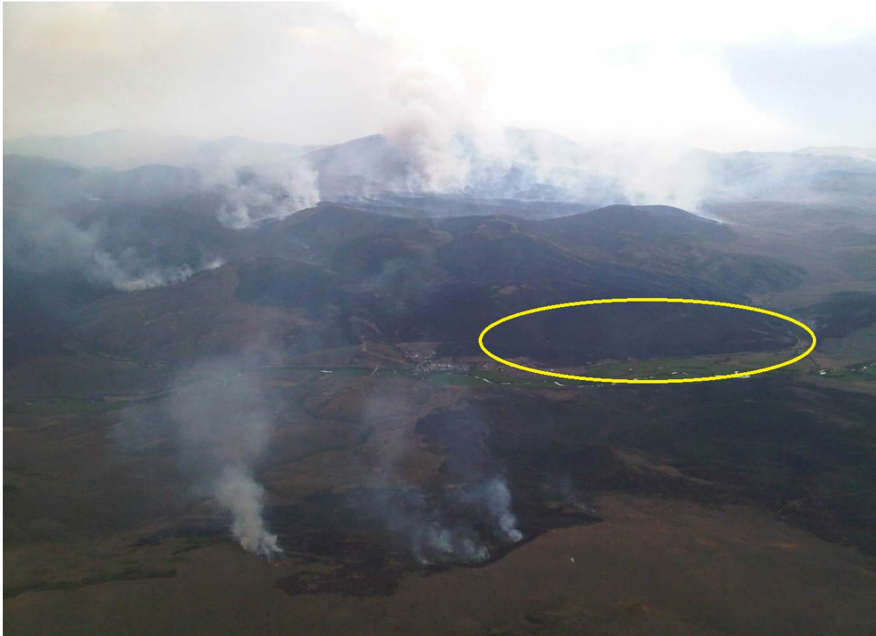
Figure 3 Aerial view of treatment area (within yellow outline), looking east

The proposed treatment consists of ground-based and aerial application of Plateau, an EPA-registered herbicide known to be effective on cheatgrass (see Appendix B), in combination with MB-906, a bacterial soil inoculant. Plateau would be applied at a rate of 6 ounces per acre (up to a maximum of 0.19 pounds of active ingredient per acre per year) in combination with MB-906 at a rate of 163 ounces per acre (up to a maximum of 1 gallon of active ingredient per acre). Herbicide would be applied utilizing water as a carrier, with no less than an average of 5 gallons per acre of tank mix applied for Plateau and no less than 30 gallons per acre of MB-906. The treatment would be applied in the spring and fall of 2019 and repeated twice annually (spring and fall) in the two subsequent years for a total of three years (six applications total), if necessary, to achieve cheatgrass control objectives.