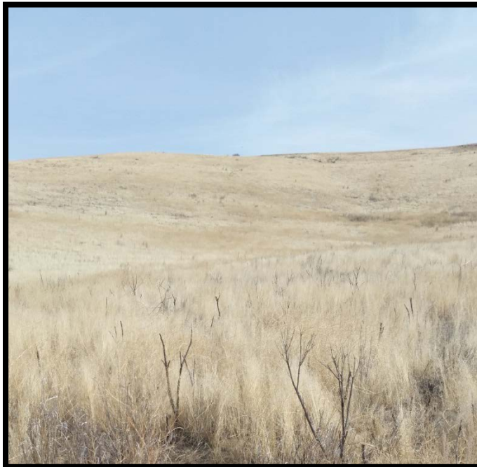
Figure 6 Plant community dominated by cheatgrass near Parcel 1

Cheatgrass turns brown and dies by early summer leaving behind thick, continuous dry fuels creating extreme wildfire hazards. Its highly-flammable, and densely-growing populations provide abundant fine-textured fuels that increase fire intensity and shorten fire-return intervals 6 . A typical cheatgrass fire on flat terrain with wind speeds of 20 miles per hour may generate up to eight-foot flame lengths and travel more than four miles per hour. Cheatgrass fires are dangerous because