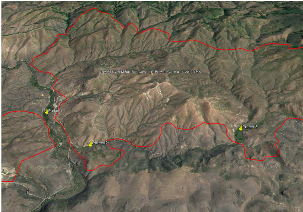
Figure 2 Brown's Gulch fire perimeter (red) and Wilson/101 Ranch parcel locations