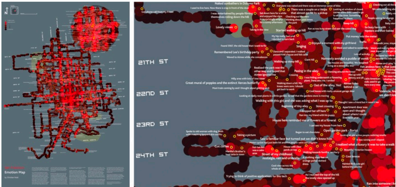
Figure 2: Christian Nold, San Francisco Emotion Map and detail, 2007. Source: (Christian Nold)