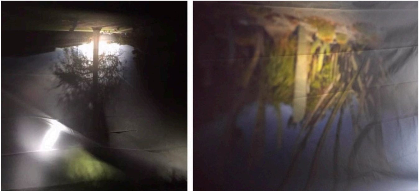
Figure 7: Student, photographs from inside the camera obscura, 2016. As students sit in darkness, an image of the external environment is projected through an aperture upside-down and backwards on a screen inside the space.

Based on the outcomes of this methodology, one critique is that a dérive as it was originally defined by Debord is conducted without an agenda. Here, the students are primed for their dérive by being informed that the data will be used to identify a site for a camera obscura. However, Debord's dérive was really a starting point for this method; as a tool for site analysis, priming (identifying qualities or characteristics to look for) is paramount.