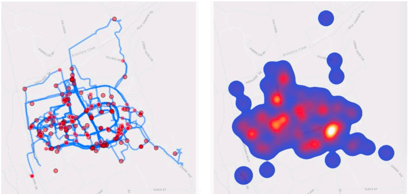
Figure 5: Class, aggregated digital dérive map with routes and placemarks, 2016.

The digital dérive method utilizes free geotracking applications in which students record their dérive route and add placemarks when they identify a place (Fig. 4). A discussion about place versus space, and the definition of place as the intersection of physical attributes, activities, and conceptions, preceded the dérive (Canter 1977). Students also take analytical photographs that are geotagged to their route map, cataloguing both physical and experiential characteristics of each place. After completing the dérive , students are asked to edit their placemarks to a maximum of four, after reflecting on the value of each place and its suitability for a camera obscura. The digital dérive maps with placemarks are then aggregated and made public through the ArcGIS website. This web interface allows the user to toggle between the 37 route maps, to see a single map with all 37 routes and placemarks, and to view the density of placemarks as a heat map (Figs. 5 and 6). Through this process of data collection, aggregation, and filtering, we are able to identify the most commonly marked places , and determine an ideal site for our camera obscura.