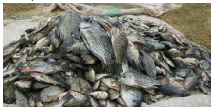
A commercial catch from Nyumba-ya-Mungu reservoir, dominated by tilapia.