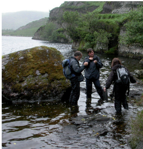
△ Top. Harpalejeunea molleri at Lough Nambrackderg on 1 July. Niklas Lönnell