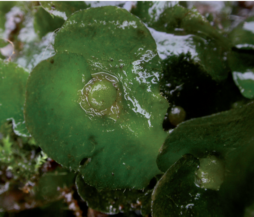
△ Dumortiera hirsuta at Loch an Duin on 10 July. Niklas Lönnell

which water was trickling. Similar sites supported Hymenophyllum tunbrigense (Tunbridge filmy-fern) and Sibthorpia europaea (Cornish moneywort). The 50 liverworts recorded at the site included Adelanthus decipiens , Lepidozia cupressina , Marchesinia mackaii , Plagiochila exigua and Radula voluta . The group, although getting wetter and wetter as the day progressed, remained remarkably cheerful and Niklas rounded the meeting off in fine style by discovering Dumortiera hirsuta under a boulder in a small gully near the waterfall on the south side of the lake.