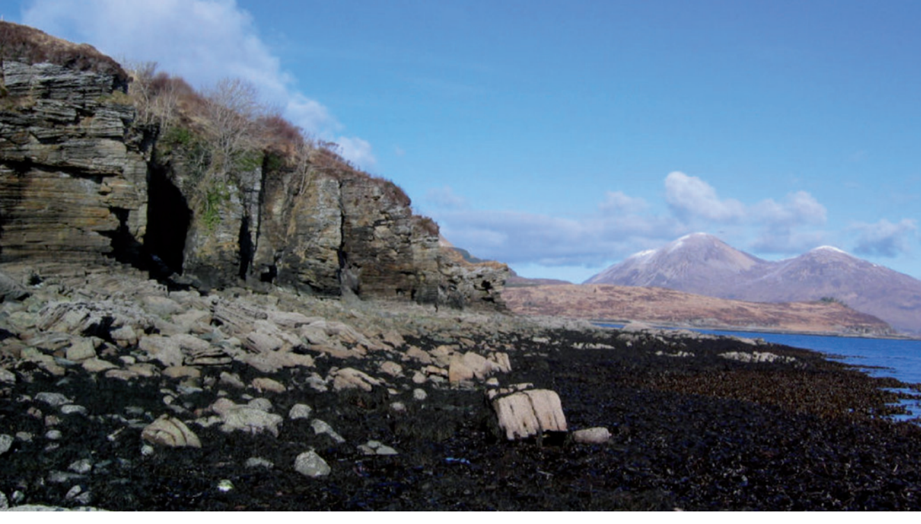
▲ Fig. 4. Drinan coast with view north to the Red Cuillins. O. Moore

of M. mackaii was examined, and every small-leaved patch of L. patens was studied carefully. A small amount of material was collected for checking with a microscope.