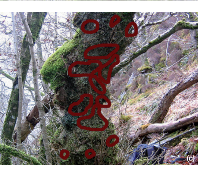
◄ Fig. 5. Distribution of L. mandonii on some of the ash trees observed in this study. (a) North-facing side (Tokavaig, lower trunk); (b) north-east face (Allt a' Mhuillin); (c) north-face (Allt Ailein, lower trunk). O. Moore

the trees gave the total estimated areas as shown in Tables 1 and 2. Table 2 also includes the areas estimated by Rothero (2002). Despite a great deal of effort, L. mandonii was not found along the Drinan coast or in potential locations further south. No new populations were discovered in Allt Ailein, Allt a' Mhuillin or Limekiln Burn.