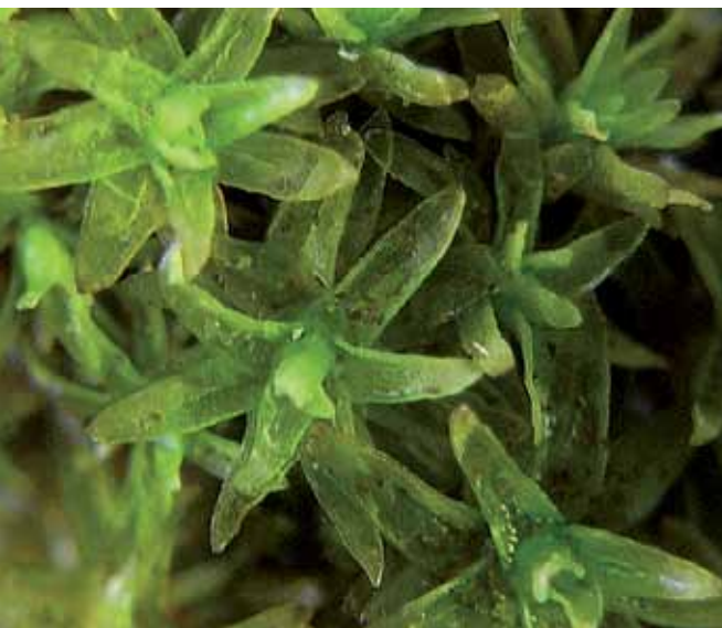
▽ Orthotrichum obtusifolium . Andy Amphlett

how to find what were very scattered, if well established, colonies of O. obtusifolium . Ash was the most popular host tree ( Atlas ), and SO 2 pollution probably rendered England unsuitable for O. obtusifolium by the 1900s. British plants of O. obtusifolium are often extremely small, and might be confused with a Zygodon when dry, but the acute leaf apex of all Zygodon except for Z. conoideus var. lingulatus provides a quick distinction.