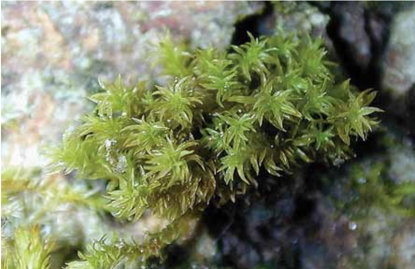
△ Zygodon dentatus