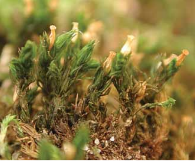
△ Orthotrichum patens . Michael Lüth

checked have proved to be O. affine . It is increasing in The Netherlands (van der Pluijm, 2004), with 37 records since 1990, and is widespread in Europe and common in parts of Germany (e.g. Nebel & Philippi, 2001). This species shares the dark calyptra tip and hairy vaginula of O. stramineum with the slightly hairy calyptra and loosely tufted appearance of O. affine , so plants that appear somewhat intermediate between these two common species should be checked carefully, with a focus on the width of the bands of thick-walled cells on the capsule.