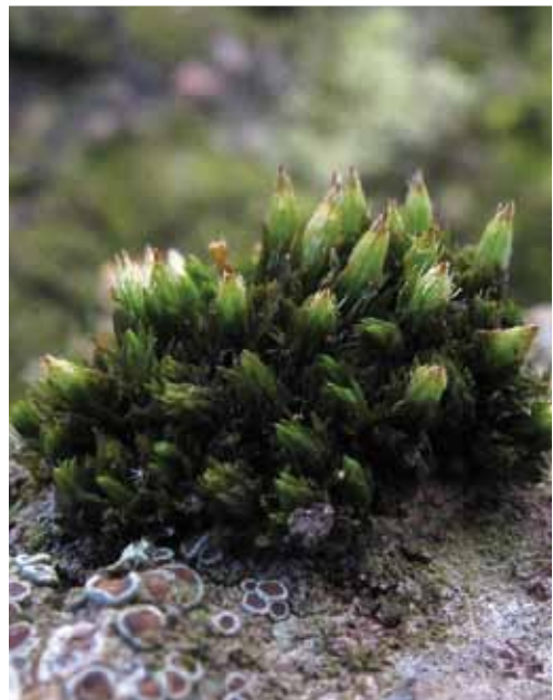
△ Orthotrichum rogeri (top) and O. philibertii (bottom).