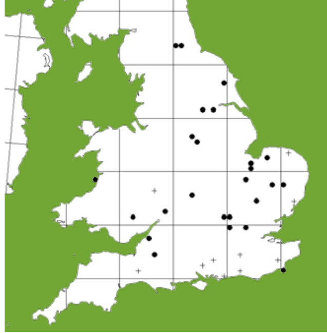
△ Map showing known records of vagrant Orthotrichum species in England and Wales. ●, post-2000 record of at least one 'vagrant' Orthotrichum or Ulotia coarctata ; +, pre-2000 records of these species.

▷ Pterigynandrum filiforme has occurred recently as a vagrant to Wordwell, West Suffolk (v.-c. 25) and an orchard at Elm, Cambridgeshire (v.-c. 29), and was also reported south-east of its upland British range at Ashford, Derbyshire (v.-c. 57) in 1840 and on a tree in a hedge near Sennybridge, Breconshire (v.-c. 42) in 1907, although the Derbyshire specimen is in the private Chatsworth House herbarium and may