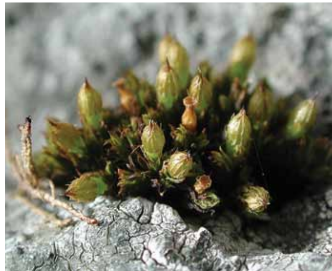
△ Orthotrichum alpestre . Michael Lüth

▷ Orthotrichum alpestre has been found at a single Dutch site on a sycamore bole in young, planted woodland at sea level. It is frequent on rocks in the Scandinavian mountains, as well as further south in Europe, and also occurs occa-