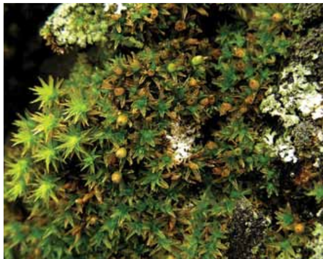
△ From top to bottom: Orthotrichum hispanicum, O. ibericum and O. macrocephalum.